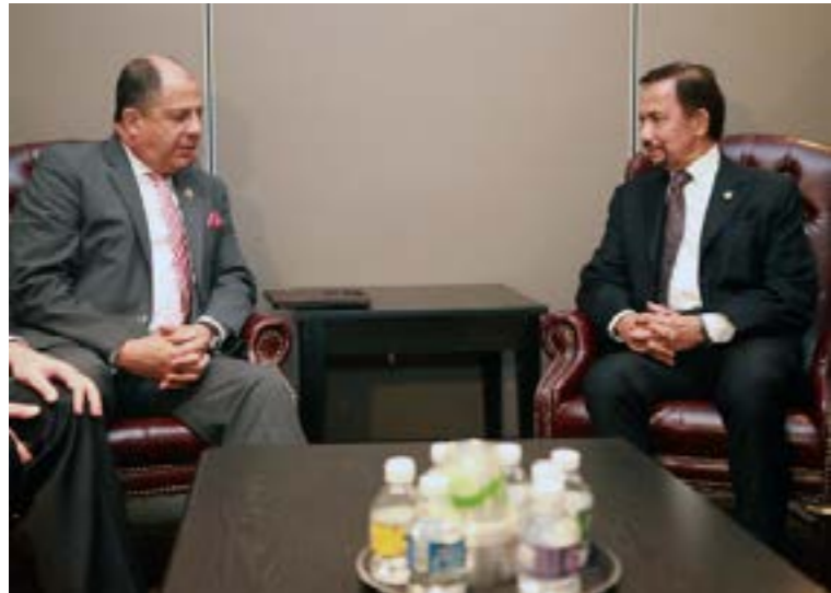
His Majesty with the President of Costa Rica.

Prime Minister's Office, The Honourable Pehin Orang Kaya Laila Setia Dato Seri Setia Awang Haji Abdul Rahman bin Haji Ibrahim and the Minister of Foreign Affairs and Trade II, The Honourable Pehin Orang Kaya Pekerma Dewa Dato Seri Setia Lim Jock Seng were also present at the meeting.