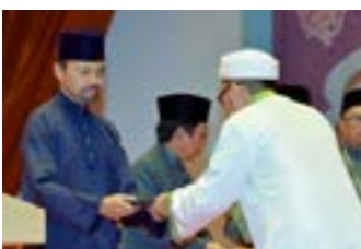
16 ITQSHB graduates urged to continue studying Al-Qur'an and related knowledge