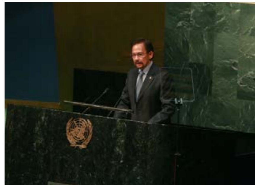
His Majesty delivering a speech at the Plenary Session of the UN Summit for the Adoption of the Post-2015 Agenda.

NEW YORK, September 26 - His Majesty Sultan Haji Hassanal Bolkiah Mu'izzaddin Waddaulah ibni Al-Marhum Sultan Haji Omar 'Ali Saifuddien Sa'adul Khairi Waddien, The Sultan and Yang Di-Pertuan Negara Brunei Darussalam attended the Plenary Session of the United Nations (UN) Summit for the Adoption of the Post-2015 Agenda.