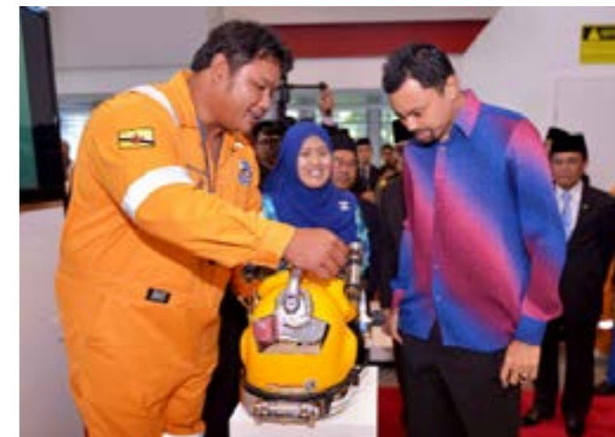
His Royal Highness being briefed at an exhibition at the UBD Convocation Festival 2015 at the Pengiran Anak Puteri Rashidah Sa'adatul Bolkiah Institute of Health Sciences.

At the exhibition, the Pengiran Anak Puteri Rashidah Sa'adatul Bolkiah Institute of Health Science portrayed the 'Health Coach', a mobile phone application called 'Heal-C' that contains information