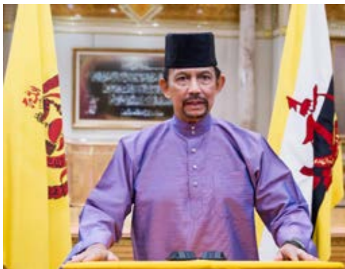
His Majesty delivering a titah (royal speech) in conjunction with Hari Raya Aidil Adha at Istana Nurul Iman.

BANDAR SERI BEGAWAN, September 24 - On the occasion of the Aidil Adha or the Feast of Sacrifice celebration, His Majesty Sultan Haji Hassanal Bolkiah Mu'izzaddin Waddaulah ibni Al-Marhum Sultan Haji Omar 'Ali Saifuddin Sa'adul Khairi Waddien, The Sultan and Yang Di-Pertuan Negara Brunei Darussalam highlighted the importance of 'sacrifice' in a titah (royal speech) delivered at Istana Nurul Iman.