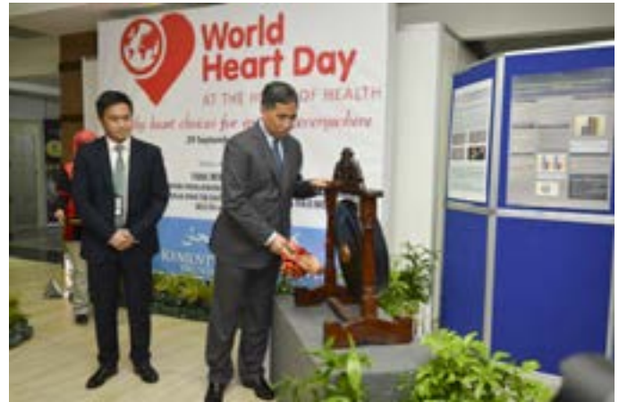
The Minister of Health launching the World Heart Day 2015 at the Cardiology Centre of Raja Isteri Pengiran Anak Saleha (RIPAS).

The public could also interact with doctors, nurses, health technicians, dietitians and allied health professionals and attend health talks.