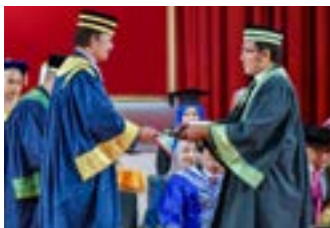
10 His Majesty awards certificates to 1,125 UBD graduates