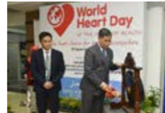
20 Cardiovascular disease second leading cause of death in Brunei Darussalam