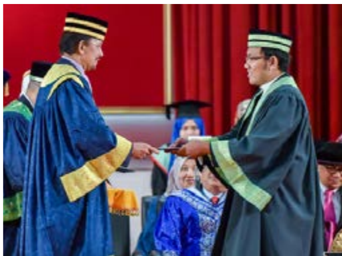
His Majesty awards a certificate to one of the graduates at the 27 th convocation ceremony.

Addressing the current employment issue, His Majesty