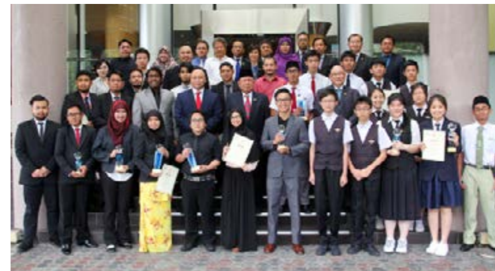
Winners of Brunei Info-Communication Technology Awards (BICTA) 2015 at the Ministry of Communications.

BERAKAS, September 16 – The winners of Brunei Info-Communication Technology Awards (BICTA) 2015 received their prizes at a ceremony held at the Amar Pahlawan Hall, the Ministry of Communications.