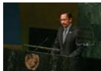
5 Post-2015 Development agenda