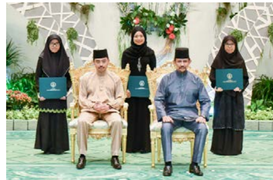
His Majesty The Sultan and Yang Di-Pertuan of Brunei Darussalam and His Royal Highness Prince 'Abdul Malik with the Sultan's Scholar of Sultan Haji Hassanal Bolkiah Foundation scholarship recipients.

Afterward, His Majesty awarded the scholarship to the three receivers and