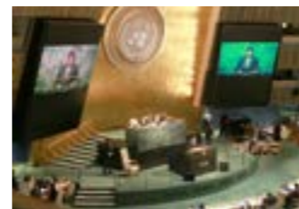
7 Brunei Darussalam supports International community's efforts to eliminate terrorism