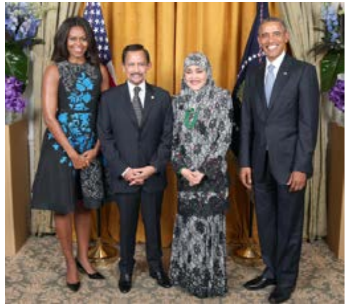
His Majesty Sultan Haji Hassanal Bolkiah Mu'izzaddin Waddaulah, The Sultan and Yang Di-Pertuan of Brunei Darussalam and Her Majesty Duli Raja Isteri Pengiran Anak Hajah Saleha with the President and First Lady of the United States of America.