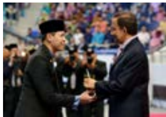
1 His Majesty graces 10 th National Youth Day celebration