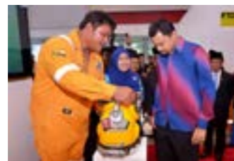
17 His Royal Highness launches UBD 'Inspired Youth' convocation festival