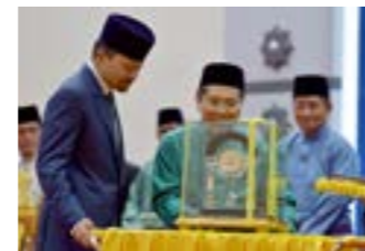
15 KAIB VIII meeting platform for Muslim experts