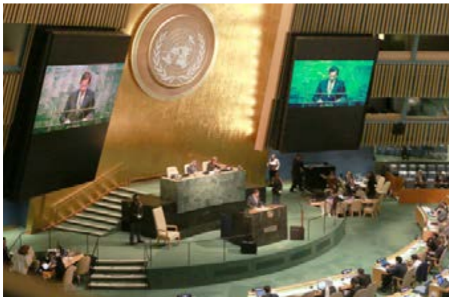
His Majesty delivering a speech at the 70th session of the UN General Assembly General Debate Session.

Palestinians have been struggling to achieve independence for more than 60