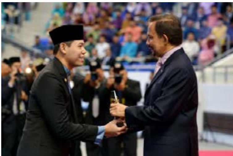
His Majesty presenting an award to one of the recipients at the 10 th National Youth Day celebration at the Indoor Stadium of the Hassanal Bolkiah National Sports Complex in Berakas.

BANDAR SERI BEGAWAN, September 1 - His Majesty Sultan Haji Hassanal Bolkiah Mu'izzaddin Waddaulah ibni Al-Marhum Sultan Haji Omar 'Ali Saifuddien Sa'adul Khairi Waddien, The Sultan and Yang Di-Pertuan of Brunei Darussalam graced the 10 th National Youth Day celebration held at the Indoor Stadium of the Hassanal Bolkiah National Sports Complex in Berakas.