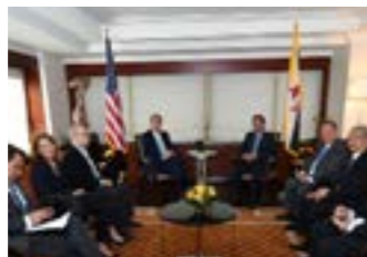
4 His Majesty holds bilateral meeting