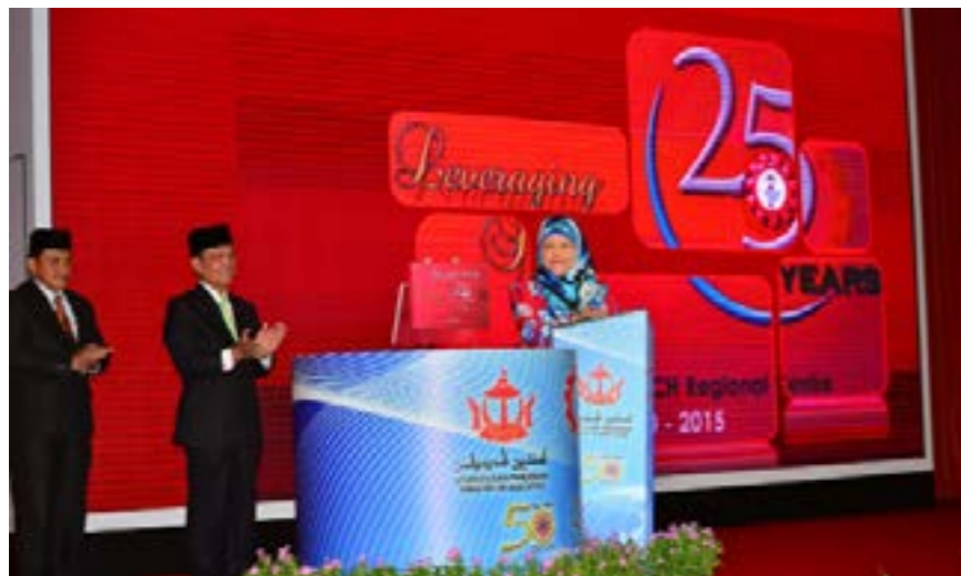
Her Royal Highness Princess Hajah Masna launches 50 th SEAMEO and 25 th SEAMEO VOCTECH's anniversary celebration at the International Convention Centre in Berakas.

BERAKAS, September 1 – Her Royal Highness Princess Hajah Masna binti Al-Marhum Sultan Haji Omar 'Ali Saifuddin Sa'adul Khairi Waddien, the Ambassador-at-Large at the Ministry of Foreign Affairs and Trade, attended the 50 th anniversary of the establishment of the Southeast Asian Ministers of Education Organisation (SEAMEO) and the 25 th anniversary of the SEAMEO Regional Centre for Vocational and Technical Education (VOCTECH).