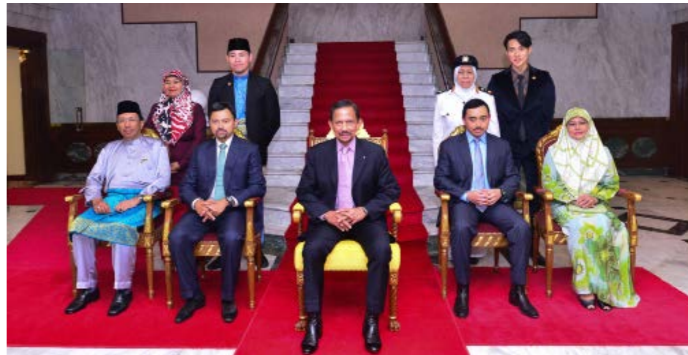
His Majesty The Sultan and Yang Di-Pertuan of Brunei Darussalam, His Royal Highness The Crown Prince and His Royal Highness Prince 'Abdul Malik with the award recipients at the 10th National Youth Day celebration.

(His Majesty graces 10th National Youth Day celebration)