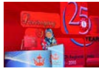
18 SEAMEO and SEAMEO VOTTECH celebrates 50 th and 25 th anniversary