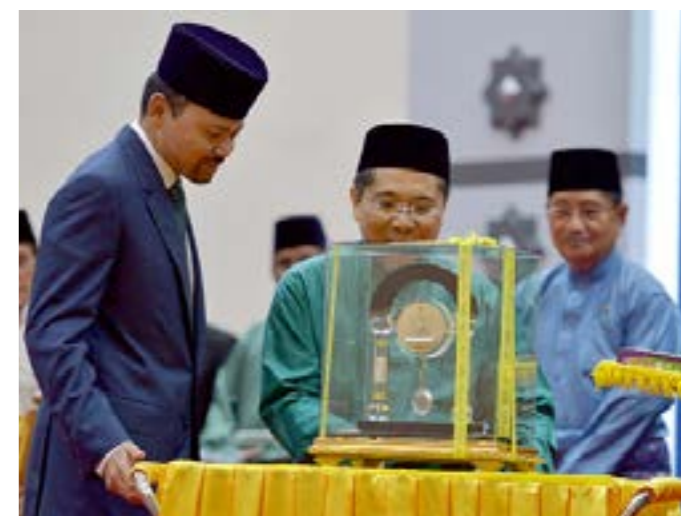
His Royal Highness The Crown Prince receives a pesambah (gift).

Earlier, His Royal Highness was greeted upon arrival by the Minister of Education, The Honourable Pehin Orang Kaya seri Kerna Dato Seri Setia (Dr.) Awang Abu Bakar bin Haji Apang; the Minister of Religious Affairs The Honourable Pengiran Dato Seri Setia Dr. Haji Mohammad bin Pengiran Haji Abdul Rahman; and members of the 8 th Borneo Islamic International Conference