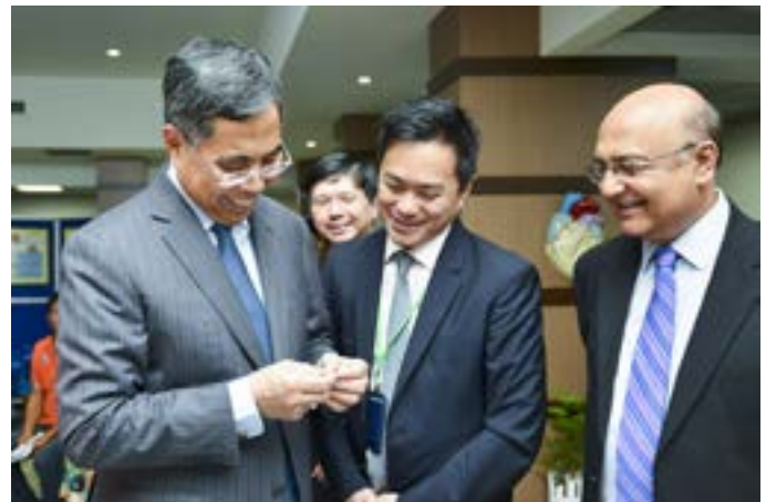
The minister observes World Heart Day 2015 at RIPAS Hospital.