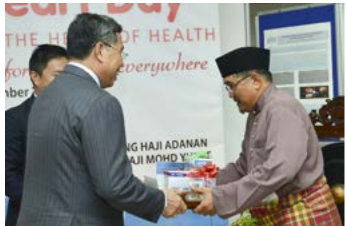
The minister receives medical equipment for patients from Fiziq Enterprise Brunei.