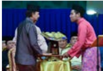
11 Royalties attend 7 th Southeast Asian Youth Al-Qur'an Reading Competition