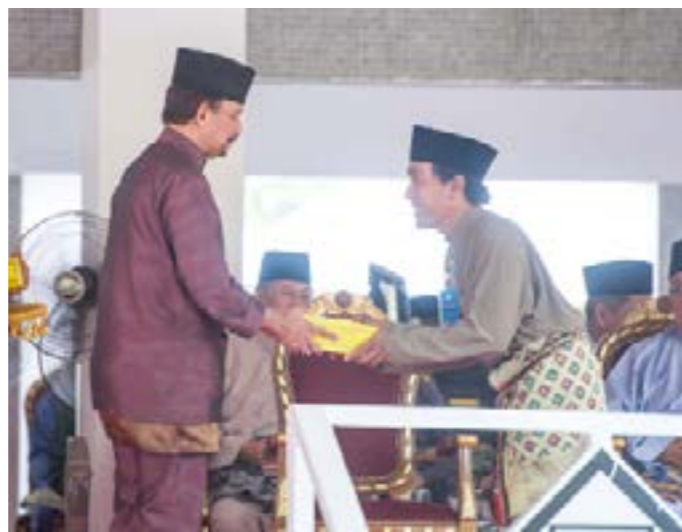
His Majesty presenting a portion of the sacrificial meat to a recipient.

Concluding the titah , His Majesty wished a 'Selamat Hari Raya Aidil Adha' to all Muslims and expressed hope that every one of them would be given happiness and protection by Allah.