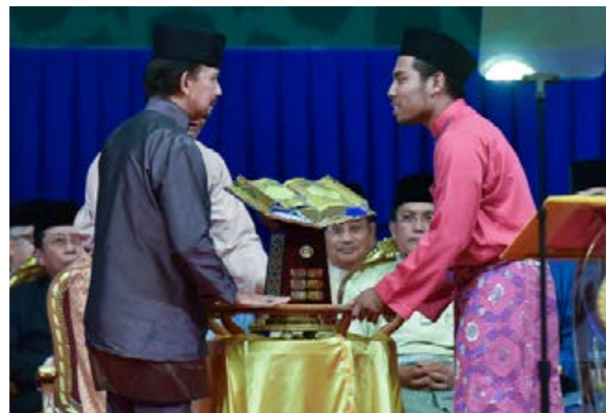
His Majesty presents an award to one of the winners of the 7 th Southeast Asian Youth Al-Qur'an Reading Competition 1436 Hijrah / 2015 at the International Convention Centre in Berakas.

BANDAR SERI BEGAWAN, September 17 - His Majesty Sultan Haji Hassanal Bolkiah Mu'izzaddin Waddaulah ibni Al-Marhum Sultan Haji Omar 'Ali Saifuddin Sa'adul Khairi Waddien, The Sultan and Yang Di-Pertuan of Brunei Darussalam graced the closing ceremony of the 7 th Southeast Asian Youth Al-Qur'an Reading Competition 1436 Hijrah / 2015 at the International Convention Centre in Berakas.