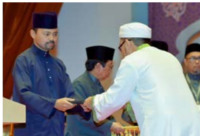
His Royal Highness The Crown Prince presenting a diploma to one of the graduates at the International Convention Centre in Berakas.

Therefore, do not pass judgment easily based on very limited