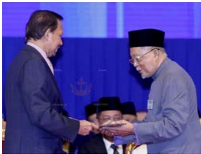
His Majesty bestows an award upon one of the recipients at the 25 th Teachers' Day celebration.

The Sultan Haji Omar Ali Saifuddien Award was given to The Honorable Pehin Siraja Khatib Dato Paduka Seri Setia Doctor