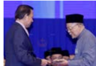
12 His Majesty emphasises teacher training at recruitment stage