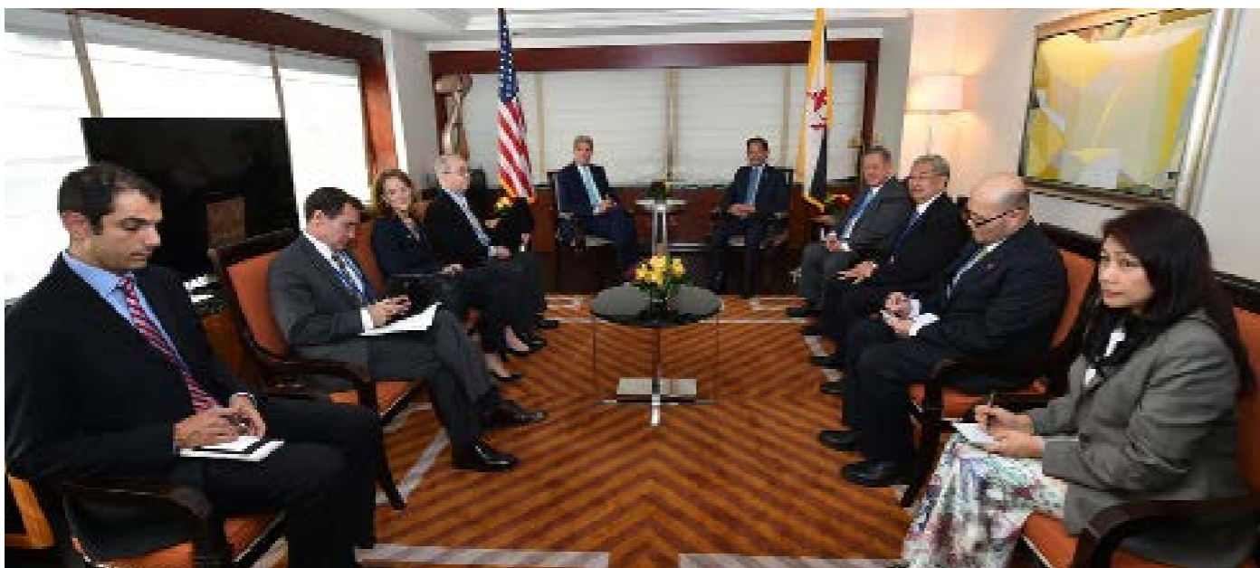
His Majesty with the Secretary of State of the United States of America.

NEW YORK, September 26 - His Majesty Sultan Haji Hassanal Bolkiah Mu'izzaddin Waddaulah ibni Al-Marhum Sultan Haji Omar 'Ali Saifuddien Sa'adul Khairi Waddien, The Sultan and Yang Di-Pertuan of Brunei Darussalam held a bilateral meeting with the Secretary of State of the United States of America His