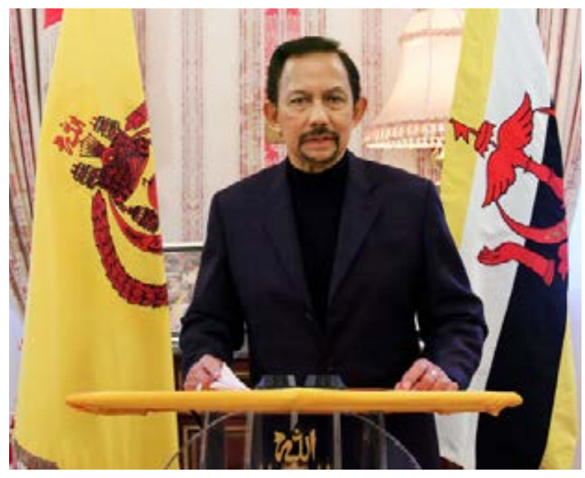
His Majesty The Sultan and Yang Di-Pertuan of Brunei Darussalam delivers a titah (royal speech) on the eve of the New Year 2015.