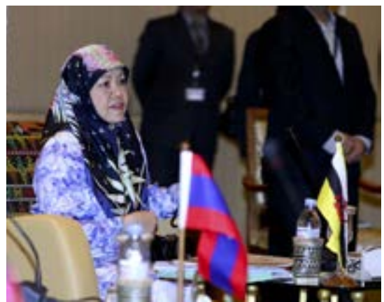
Her Royal Highness during the AMM Retreat discussion.