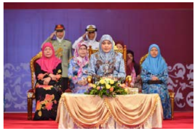
Her Maiesty at the Women's Special Assembly held in conjunction with the Maulidur Rasul 1436 Hijrah celebration.

His Royal Highness also consented to sign a target board from the competition, and before leaving the shooting range, His Royal Highness consented to receive a pesambah and sign a Royal Parchment.