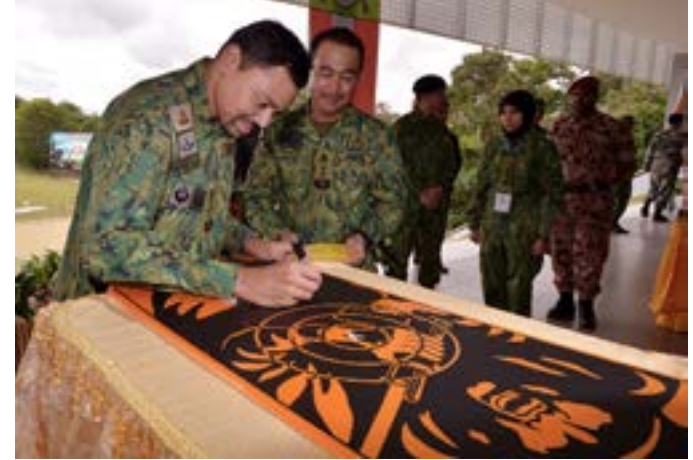
His Royal Highness The Crown Prince signing a target board from the

He also highlighted the importance of maintaining high standards of discipline,