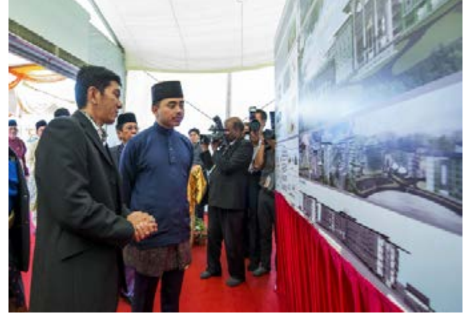
His Royal Highness Prince 'Abdul Malik touring an exhibition.

The school is able to accommodate 2,000 male students, and is equipped with staff rooms, classrooms, science, computer and language labs, mini studios, main hall, cafeterias, sport facilities, library, hostel and other facilities.