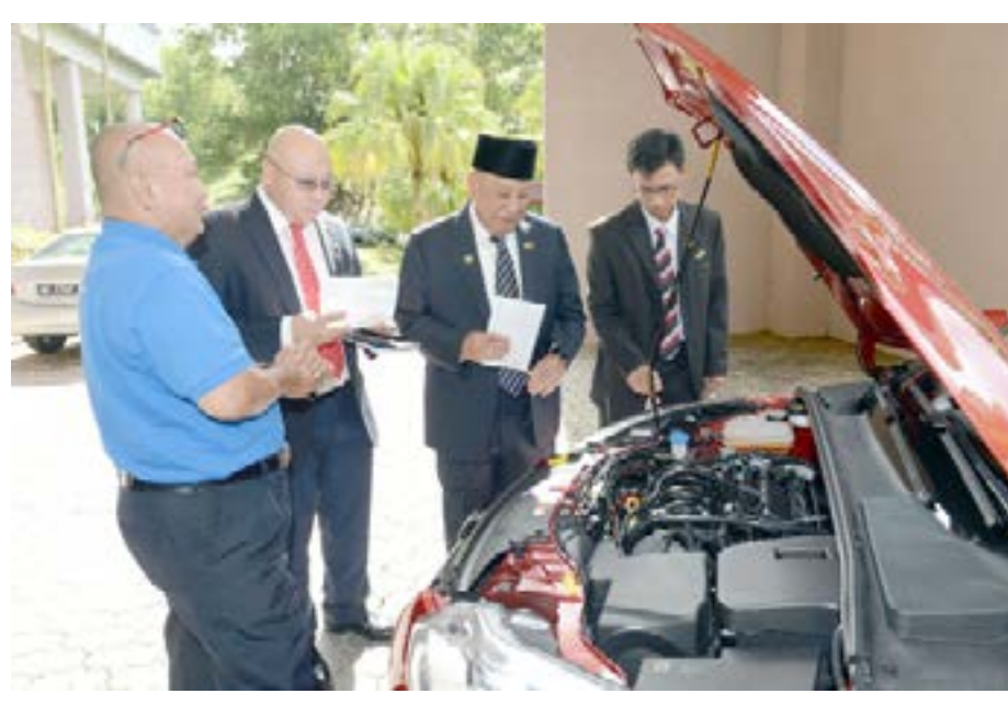
The minister receives a briefing during a tour.