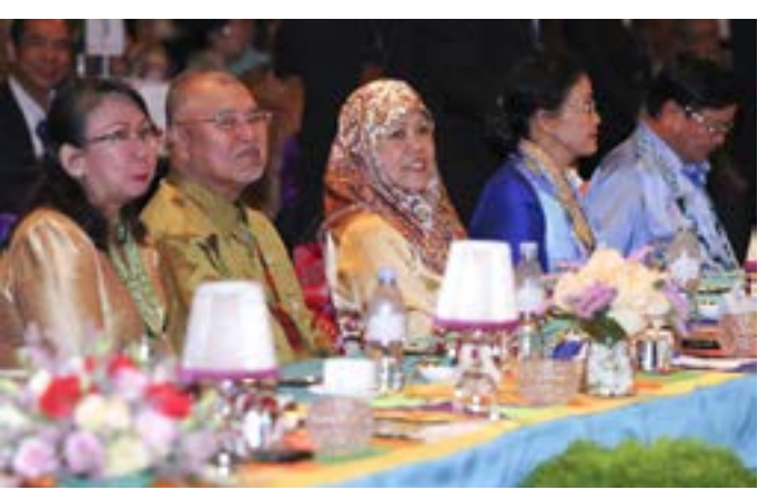
Her Royal Highness consents to attend a welcome dinner at the Magellan Sutera Harbour Resort.