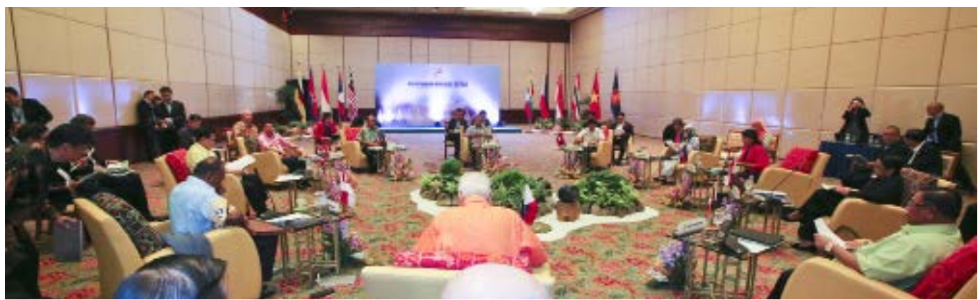
The AMM Retreat held on January 27 and 28 at the Magellan Sutera Harbour Resort.