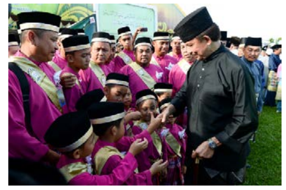
His Majesty receives greetings from the participants in the Maulidur Rasul celebration.

Prior to the procession, the event commenced with the open recitation