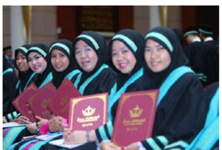
The graduates after receiving their certificates from the minister.