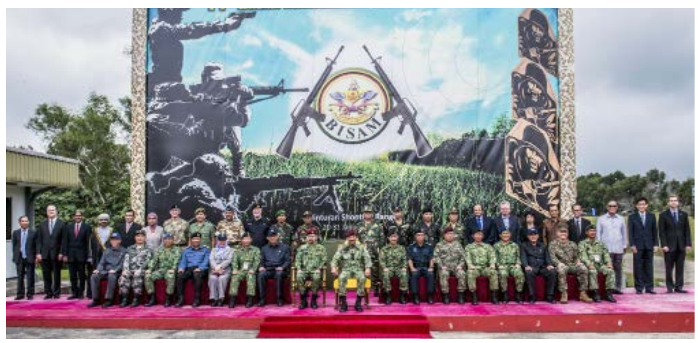
His Majesty The Sultan and Yang Di-Pertuan of Brunei Darussalam, the Minister of Defence and Supreme Commander of the Royal Brunei Armed Forces, and His Royal Highness Prince General Haji Al-Muhtadee Billah, the Crown Prince and Senior Minister at the Prime Minister's Office and General of the RBAF, in a group photo with officials and participants.