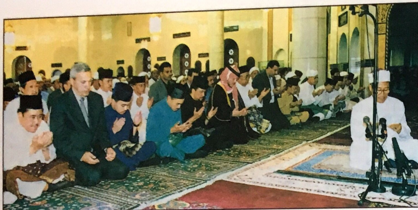
His Majesty King Abdullah II of Jordan and His Majesty Paduka Seri Baginda Sultan Haji Hassanal Bolkiah Mu'izzaddin Waddaulah, Sultan and Yang Di-Pertuan of Brunei Darussalam performing the Friday's congregational prayer at the Jame' Asr Hassanil Bolkiah in Kiulap. Joining Their Majesties were His Royal Highness Crown Prince Haji Al-Muhtadee Billah, His Royal Highness Major Prince Ali and His Royal Highness Prince 'Abdul Malik.