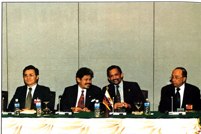
His Majesty Paduka Seri Baginda Sultan Haji Hassanal Bolkiah Mu'izzaddin Waddaulah, Sultan and Yang Di-Pertuan of Brunei Darussalam and His Royal Highness Prince Mohamed Bolkiah, Minister of Foreign Affairs, attending the ASEAN-Japan Summit in Bangkok.

His Majesty Paduka Seri Baginda Sultan Haji Hassanal Bolkiah Mu'izzaddin Waddaulah, Sultan and Yang Di-Pertuan of Brunei Darussalam had attended the Tenth Session of the United Nations Conference on Trade and Development (UNCTAD) held in Bangkok from 12 to 19 February.