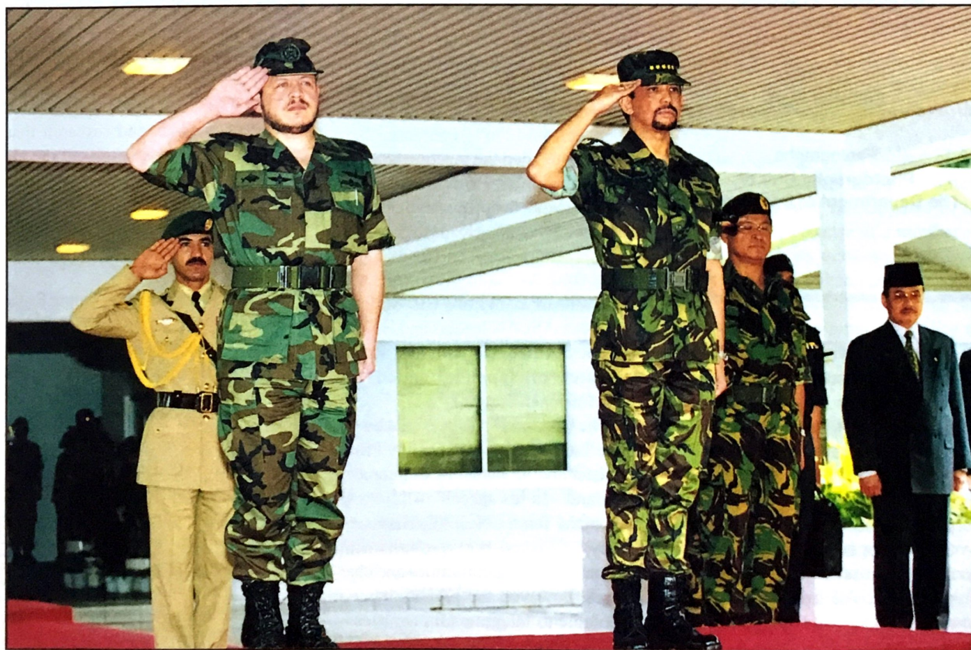
His Majesty Paduka Seri Baginda Sultan Haji Hassanal Bolkiah Mu'izzaddin Waddaulah, Sultan and Yang Di-Pertuan of Brunei Darussalam and His Majesty King Abdullah II of Jordan, taking the salute from an honour guard mounted by personnel of the First Battalion of the Royal Brunei Armed Forces, soon after Their Majesties' arrival at the Bolkiah Garrison.