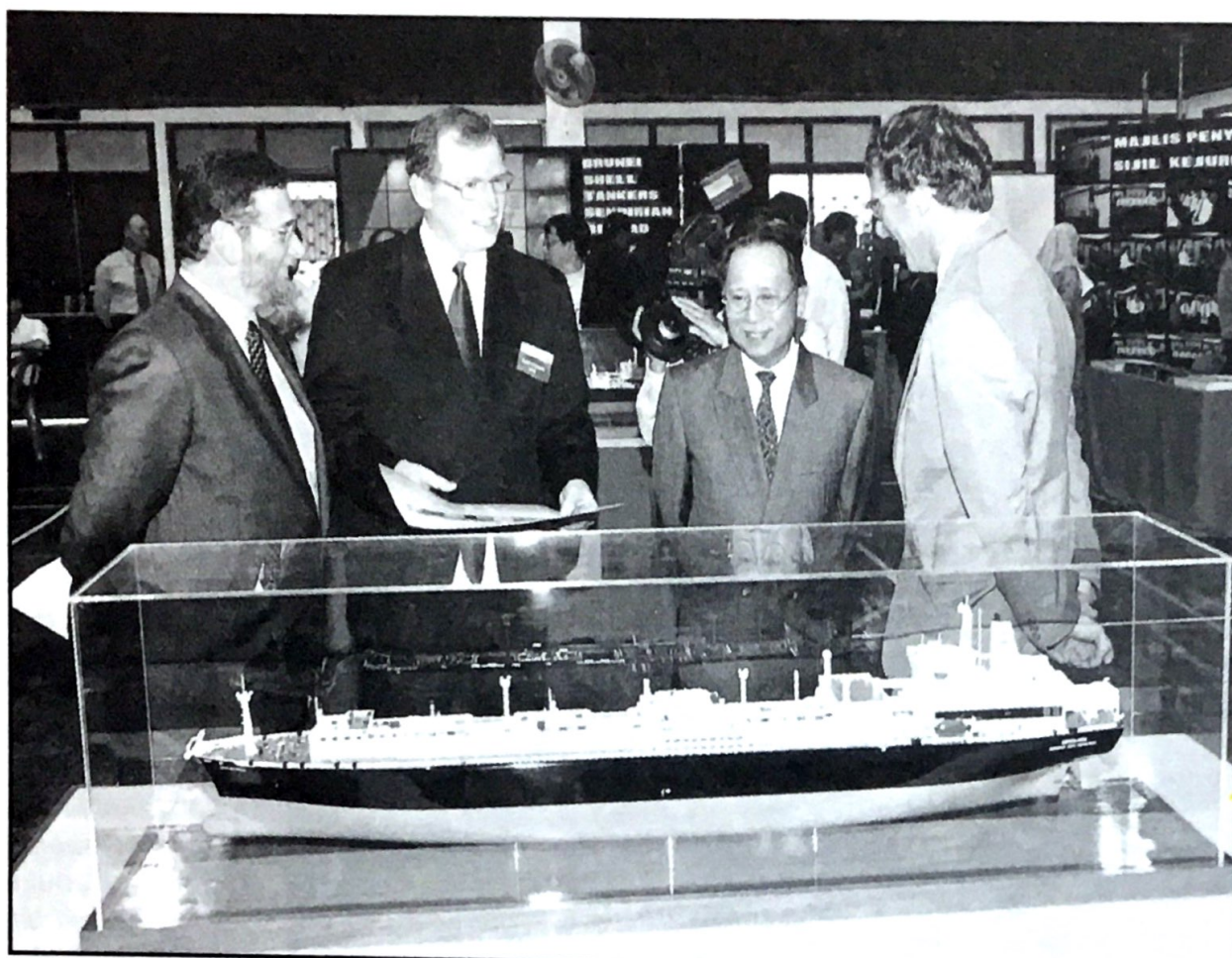
The Communications Minister, Yang Berhormat Pehin Orang Kaya Amar Pahlawan Dato Seri Setia Haji Awang Zakaria, looking on a model of vessel owned by the Brunei Shell Tankers shortly after he launched the Marine Cadet Career Campaign.

The Communications Ministry is now making effort to discuss with other relevant ministries and agencies to speed up the formation of maritime training institution at the international level in the country in the future, said the Minister of Communications.