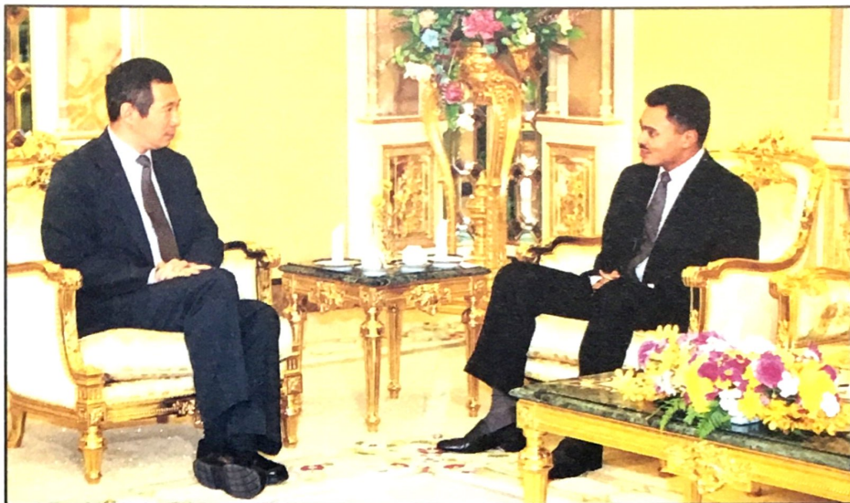
His Excellency Brigadier General Lee Hsien Loong being granted an audience by His Royal Highness Crown Prince Haji Al-Muhtadee Billah at Istana Nurul Iman.

While in the country, the Deputy Prime Minister of Singapore and wife was entertained at a luncheon given in honour of His Excellency's visit by the Minister of Foreign Affairs, His Royal Highness Prince Mohamed Bolkiah and Her Royal Highness Pengiran Anak Isteri Pengiran Anak Hajjah Zariah. The ceremony took place at Balai Penghadapan, Bukit Kayangan.