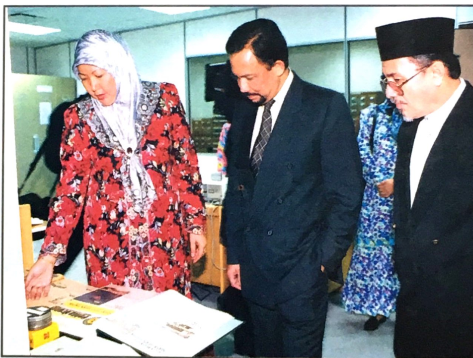
His Majesty, accompanied by UBD's Vice Chancellor, taking a close look on collection of books available at the university's library, above, while picture below shows His Majesty observing one of the students conducting science practical.