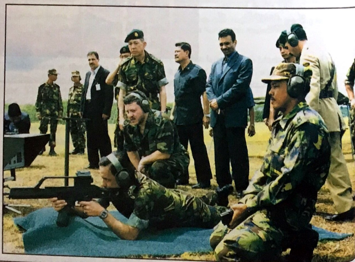
His Majesty The Sultan and Yang Di-Pertuan of Brunei Darussalam and His Majesty King Abdullah II consented to take part in the shooting event at Binturan Shooting Range in the Tutong district, right.