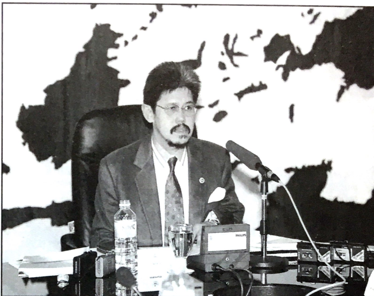
His Royal Highness Prince Mohamed Bolkiah, Minister of Foreign Affairs and Chairman of Brunei Darussalam Economic Council (BDEC) at a press briefing shortly after the 7 th BDEC's Meeting.