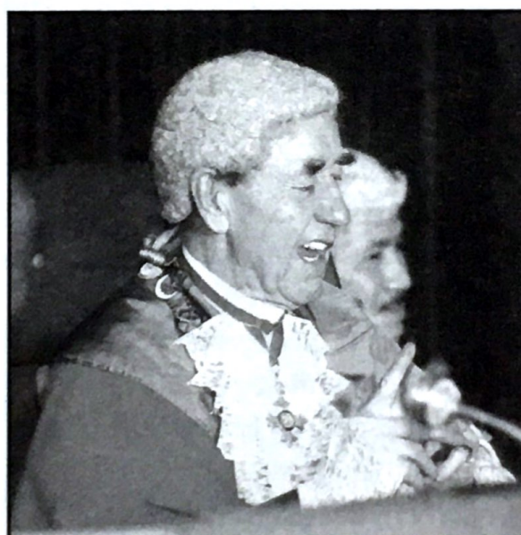
The Chief Justice, Dato Paduka Sir Denys Tudor Emil Roberts, stressing the importance for the public to retain confidence in the diligence and skill of some law enforcement agencies.

sideration to these proposals, which if acted upon can only enhance the image of Brunei Darussalam as a nation with a modern, developed, efficient and above all, independent judiciary.