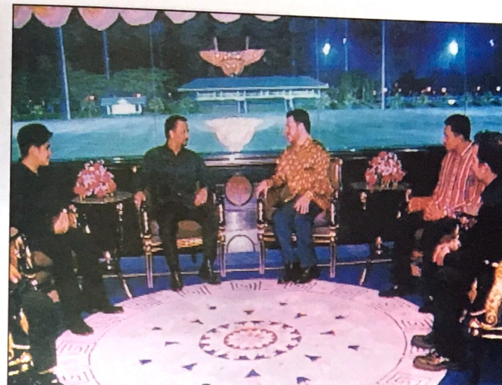
Picture right: His Majesty The Sultan and Yang Di-Pertuan of Brunei Darussalam and His Majesty's sons consented to attend a dinner given by His Majesty King Abdullah II of Jordan at Golf Club in Jerudong Park.