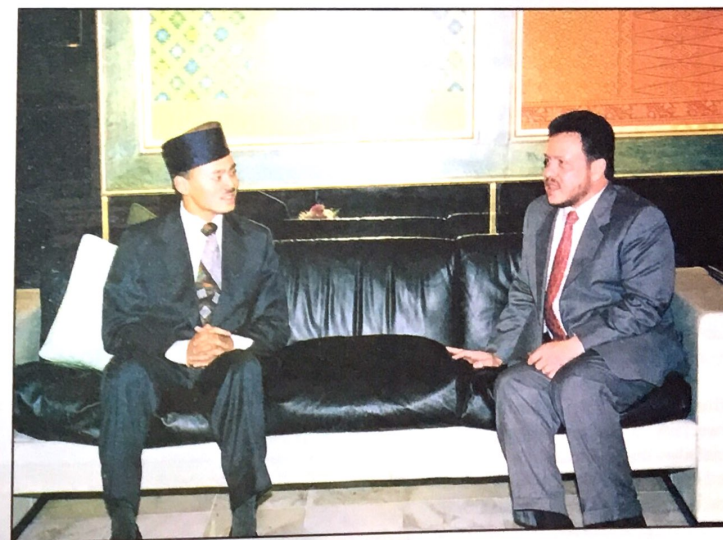
His Royal Highness Crown Prince Haji Al-Muhtadee Billah in conversation with His Majesty King Abdullah II of Jordan at the Brunei International Airport, before His Majesty leaves the country.

During the call, His Majesty The Sultan and Yang Di-Pertuan of Brunei Darussalam