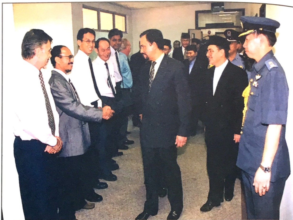
His Majesty Paduka Seri Baginda Sultan Haji Hassanal Bolkiah Mu'izzaddin Waddaulah, Sultan and Yang Di-Pertuan of Brunei Darussalam consented to mingle with UBD's lecturers, during His Majesty's visit to the University.