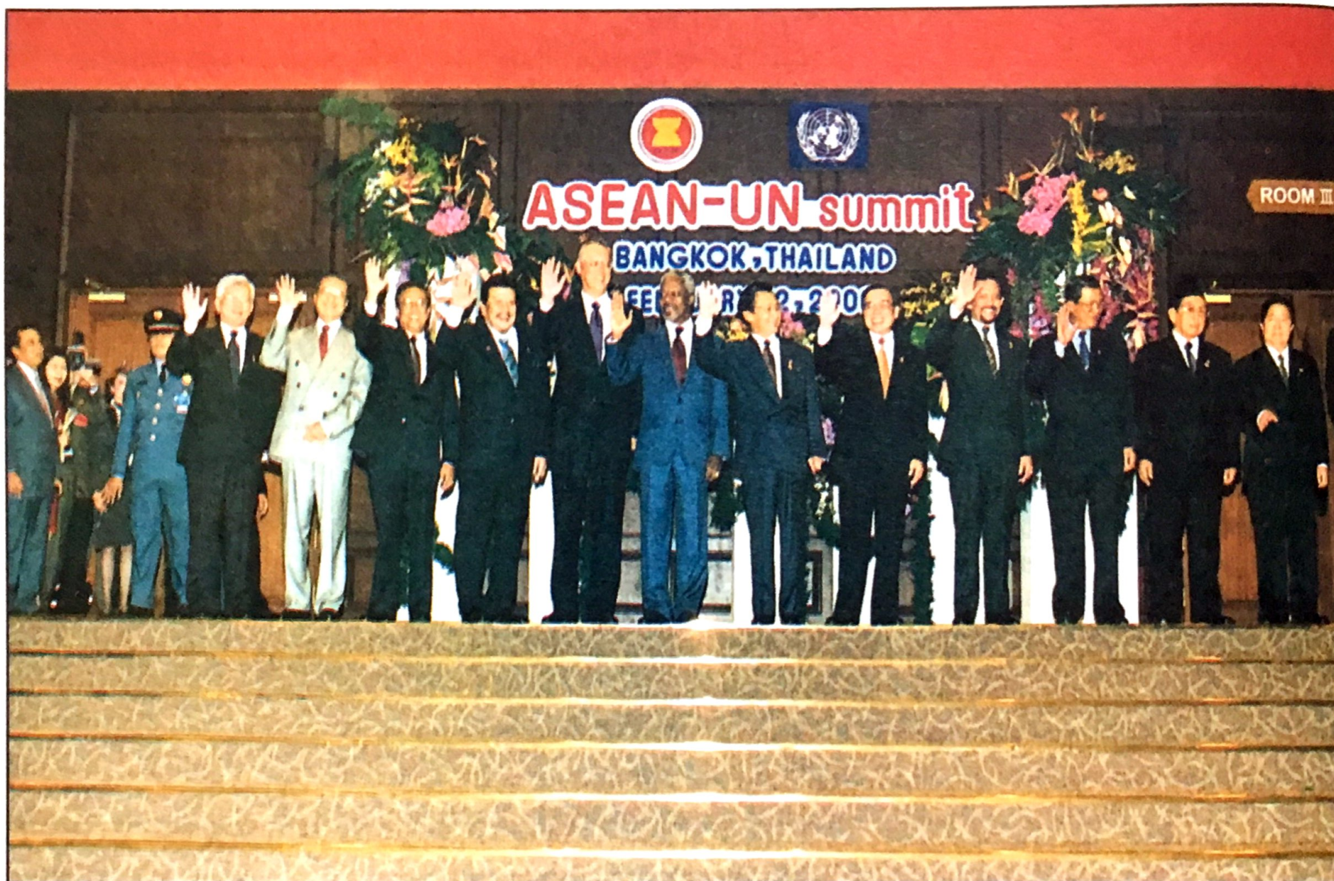
His Majesty Paduka Seri Baginda Sultan Haji Hassanal Bolkiah Mu'izzaddin Waddaulah, Sultan and Yang Di-Pertuan of Brunei Darussalam together with leaders of ASEAN member countries and the Secretary-General of the United Nations, His Excellency Kofi Annan, attending the Tenth Session of the United Nations Conference on Trade and Development (UNCTAD) in Bangkok.