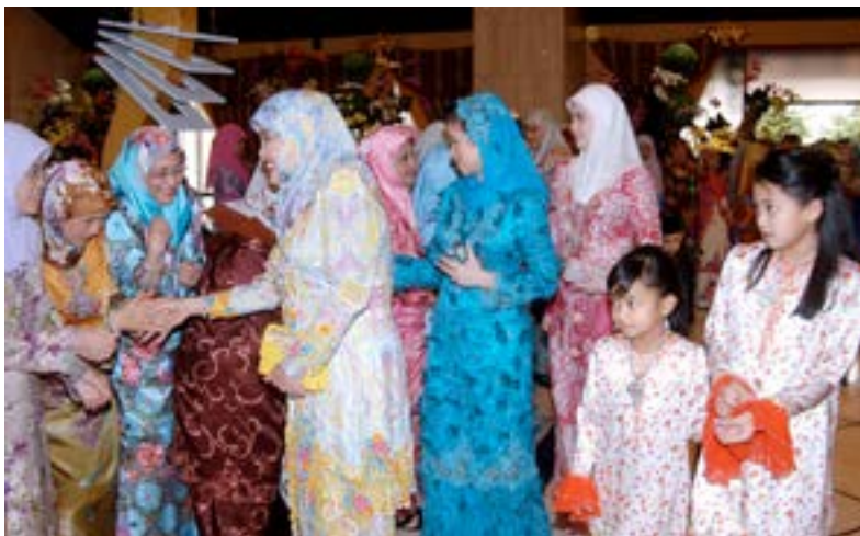
Her Majesty The Raja Isteri, Her Royal Highness Pengiran Isteri and Her Royal Highness Paduka Seri Pengiran Anak Isteri Pengiran Anak Sarah receive female guests.

Present were His Royal Highness Crown Prince Pengiran Muda Haji Al-Muhtadee Billah and Her Royal Highness Paduka Seri Pengiran Anak Isteri Pengiran Anak Sarah, and other members of the royal family.