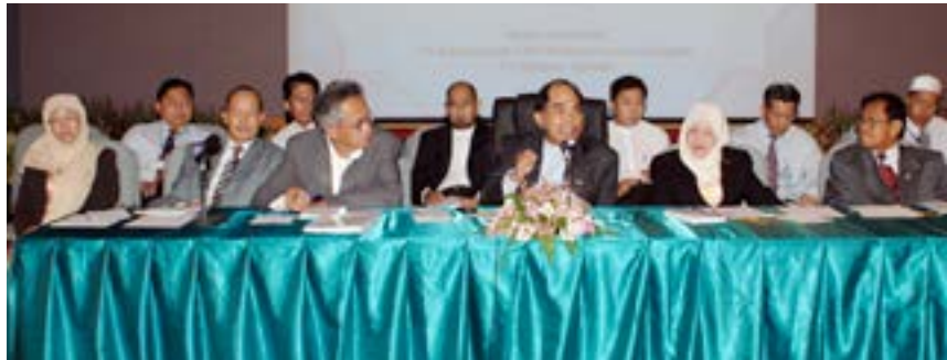
Minister of Industry and Primary Resources, Pehin Dato Dr. Awang Haji Ahmad (front row: fourth from left) and officials from the ministry during the dialogue with aquaculture's entrepreneurs.

Towards meeting this target, the department has implemented international aquaculture technology verification projects which have been developed to be used by local entrepreneurs in producing high quality aquaculture products, which is on