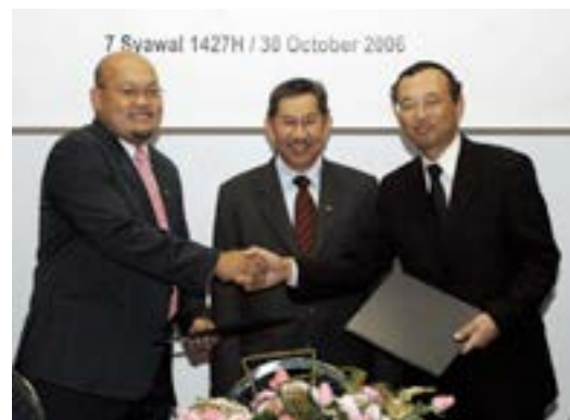
Second Minister of Finance (middle) witness the signing of MoU between PetroleumBRUNEI and JBIC.