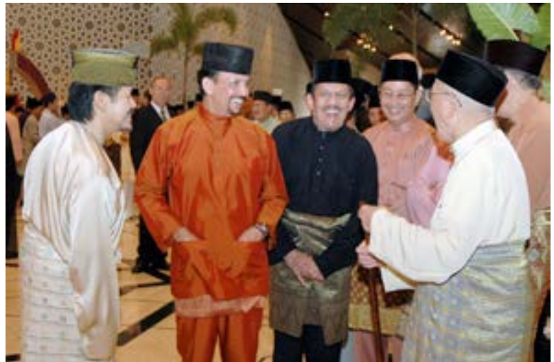
His Majesty, His Royal Highness Prince Mohamed Bolkiah and His Royal Highness Prince Haji Sufri Bolkiah with local dignitaries.