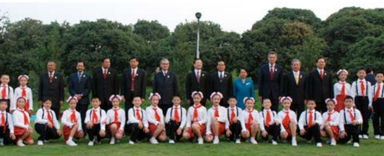
His Majesty with leaders of other ASEAN member countries and Prime Minister of China in a group photo after planting of trees.