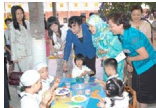
Her Royal Highness at the Guangxi Zhuang Nursery.