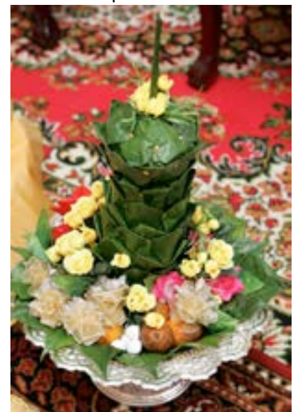
Sirih junjung as part of the Hantaran Berian .