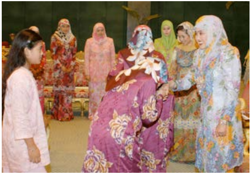
Her Majesty The Raja Isteri and Her Royal Highness Pengiran Isteri and female members of royal family receives greetings from female and children visitors.