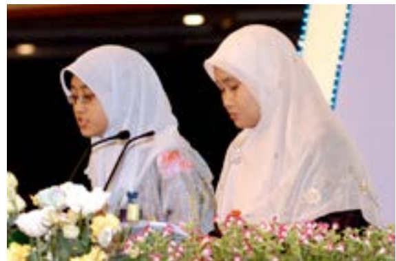
One of the participants reciting parts of Quran verses. (left)

This year's event was jointly organised by the Royal Customs and Excise and the Ministry of Finance. The theme is "Appreciating Islam in Improving the Nation's Competitiveness" or " Menghayati Islam Dalam Mempertingkatkan Daya Saing Bangsa. "