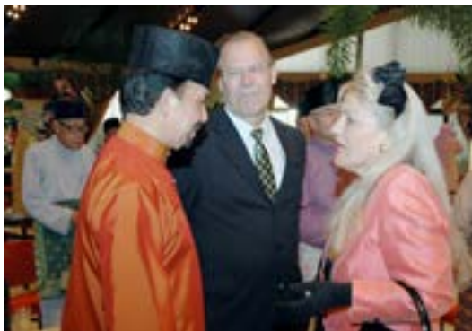
His Majesty in conversation with one of Brunei-based foreign diplomats.