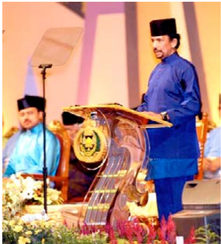
His Majesty The Sultan and Yang Di-Pertuan of Brunei Darussalam delivers a titah .