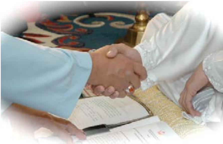
Solemnisation ceremony, the most significant ceremony and carry out using Islamic teachings.

The next stage is Menghantar Berian , whereby the groom's delegation will bring articles to the fiancée's house. The main items included in the articles are the wedding ring, a sum of money which is called as Belanja Hangus (may vary for each person depending on the request by the bride's family), sirih junjung (betel vine leaf and betel-nut decorates together), kain jong sarat (weaved cloth) and Al-Quran. In return, the bride-to-be will in return give articles which may vary from kain sinjang (weaved cloth) to toiletries.