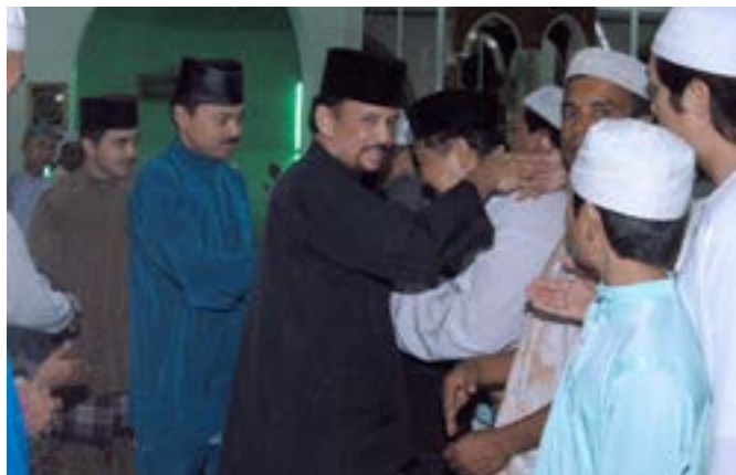
His Majesty, His Royal Highness Crown Prince and His Royal Highness Prince 'Abdul Malik receives greetings from public.

On October 14, His Majesty and Yang Di-Pertuan of Brunei Darussalam went to Mohamed Bolkiah Mosque, Kampong Serusop, Jalan Muara to performed the mass Isya and terawih prayer.