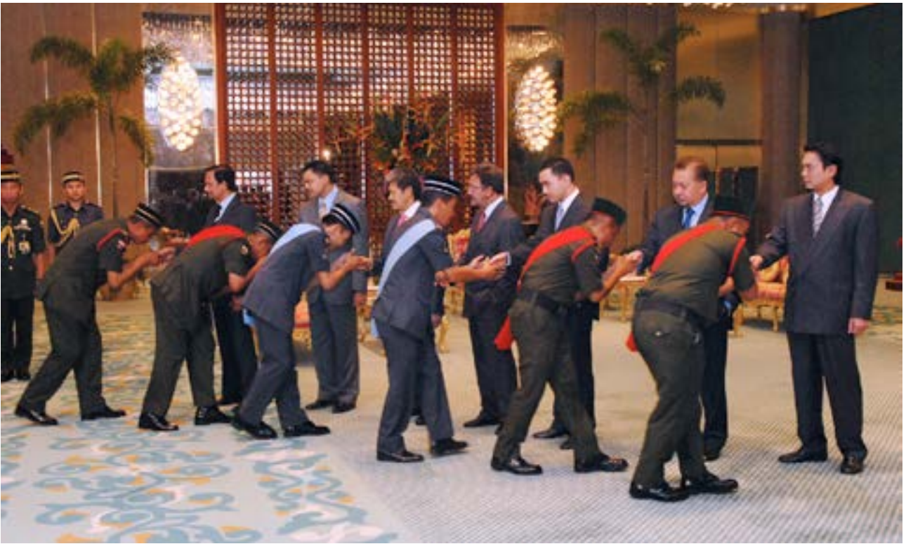
His Majesty and male members of royal family receives greetings from uniform personnels.