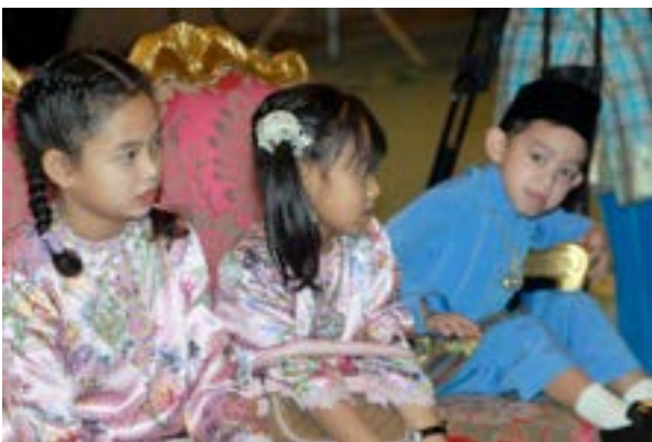
His Majesty's grandchildren also present during the ceremony.