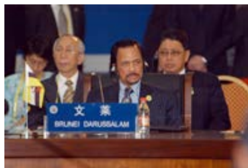
His Majesty at one of the sessions.