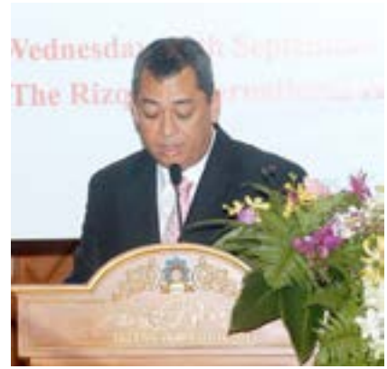
Deputy Minister of Defence, Pehin Colonel (Rtd) Dato Haji Mohammad Yasmin delivers opening remarks.

The minister added in supporting His Majesty's titah on economic diversification, and also in line with the ministry's 'Defence White Paper', the Ministry of Defence is looking for the provision of various products and services using public-private partnership arrangements, those that can be provided by the private sector including maintenance and logistics services, training and e-government.