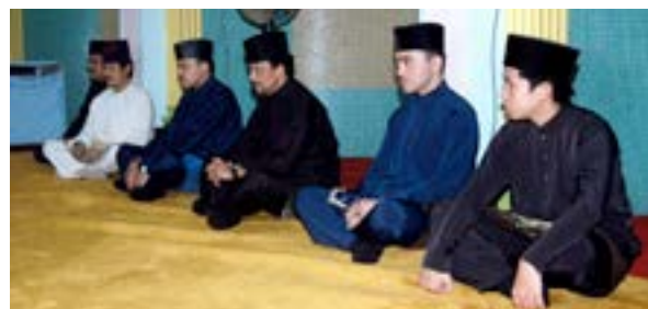
Male members of royal family at the bertahlil ceremony.