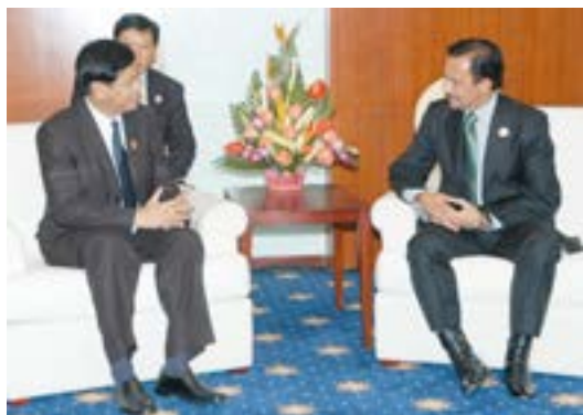
His Majesty receives in audience, Prime Minister of Lao's People Democratic Republic, His Excellency Bouasone Bouphavanh.