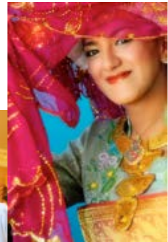
The bride with traditional wedding costume.

Brunei Malay wedding is unique on its own. It has been practiced for decades and the tradition remains strong. A unique