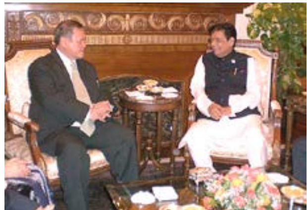
Minister of Foreign Affairs and Trade II (Second) in a meeting with India's Minister of State for External Relations, His Excellency E. Ahmed.

He also held meetings with India's Minister of Defence and Minister of State for Communications and Information Technology. He also had discussions with members of the Federation of Indian Chamber of Commerce and Industries (FICCI). The discussions were aimed at promoting economic cooperation between Brunei Darussalam and the Republic of India.