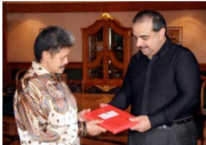
His Highness Shaikh Salman presents a gift to His Royal Highness Prince Mohamed Bolkiah.

His Royal Highness Prince Mohamed Bolkiah, Minister of Foreign Affairs and Trade on October 11, received in audience at the Balai Penghadapan of Bukit Kayangan, from His Highness Shaikh Salman bin Khalifah Al-Khalifa, the Chairman of Bahrain Petroleum Company. His Highness was in Brunei for a four-day visit.