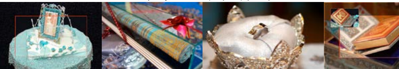
Some of the common items for Majlis Menghantar Berian , Belanja Hangus , kain jong sarat , ring and Al-Quran.

Before the solemnisation ceremony, another mini event known as Berbedak Mandi is performed separately on both the groom and bride. It is only attended by close relatives and neighbours. At the ceremony the bride or groom's will be smeared by the pengangun (beautician) with special made powder call Bedak Lulut or Lulur . Later they would be showered by the pengangun witnessed by