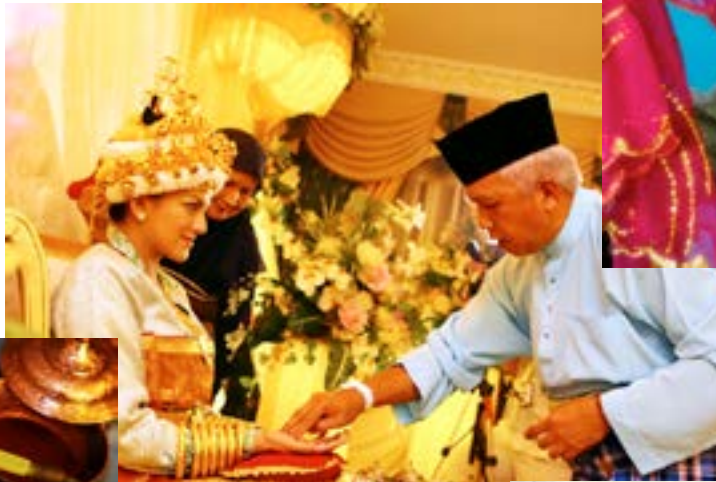
The bride's father applying powder paste during Majlis Berbedak.

For those that comes from the Tutong District, there is an additional ceremony after the Majlis Bersanding which is called