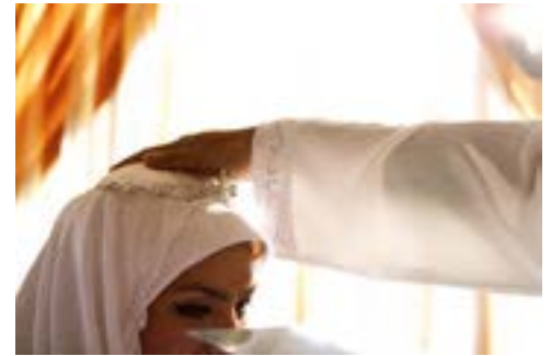
The groom meets the bride after the Majlis Akad Nikah (solemnisation).

The most significant ceremony is the solemnisation ceremony which usually takes place at the bride's home. Some prefer to carry out the ceremony at the mosque. The solemnisation ceremony is carried out using Islamic teachings where it is normally presided by the bride's biological father or his representative who is a kadhi , a religious official from the Syariah Court. However, a brief lecture or briefing on marriage will be given by the kadhi prior to the ceremony for both the groom and bride.