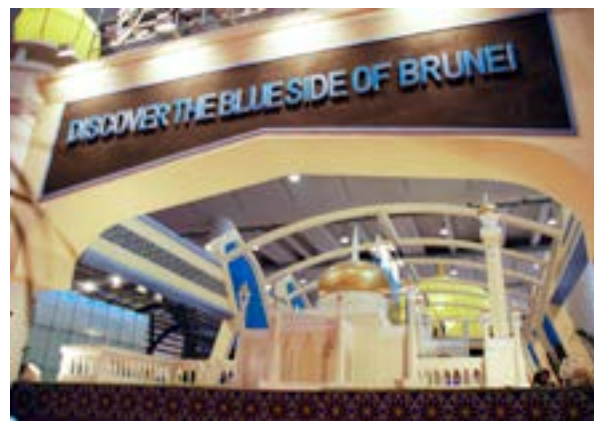
Part of Brunei Pavilion at the Third China-ASEAN Expo (CAExpo).