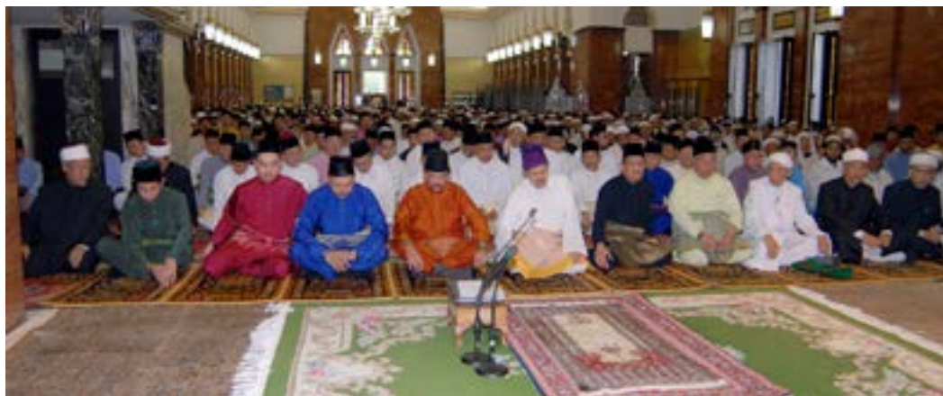
His Majesty and male members of royal family joined scores of Muslims for the Aidil Fitri prayer.