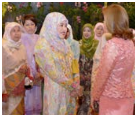
Her Majesty The Raja Isteri (photo right) and Her Royal Highness Pengiran Isteri (photo left) with female guests during the Hari Raya session with state dignitaries and foreign diplomats.