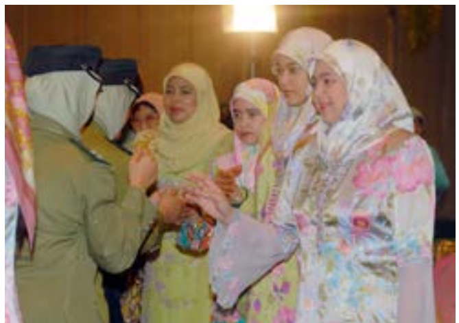
Female members of royal family receive women uniformed personnel.