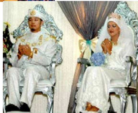
The new wed-couple on the dais.