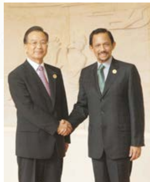
His Majesty with His Excellency Prime Minister of China prior to bilateral meeting