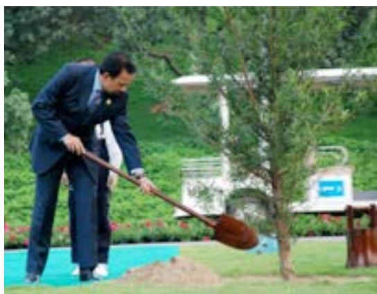
Planting of trees to mark the end of the summit.

NANNING, October 30 – His Majesty The Sultan and Yang Di-Pertuan of Brunei Darussalam expressed his satisfaction with the overall progress and achievements of the ASEAN-China Dialogue Relations and acknowledged that the history ASEAN and China shared over the last 15 years was meaningful.