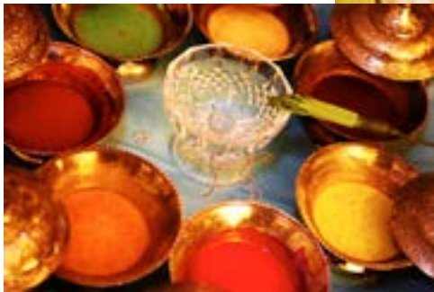
Seven colours powder paste use during Majlis Berbedak.

Another two ceremonies will be held before the highlight of the wedding that is Majlis Berbedak and Majlis Berpacar . Both ceremonies are performed separately on both the groom and bride. At Majlis Berbedak , close relatives will perform the ceremony of applying the powder paste to the hand of the groom and bride. Meanwhile for Majlis Berpacar , it will involve the staining of the hands of the groom and bride with henna leaves paste by close relatives.