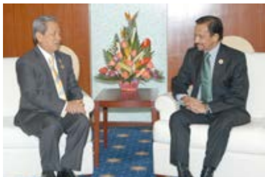
One-to-one meeting, His Majesty and Prime Minister of Thailand, His Excellency General Surayud Chulanont.