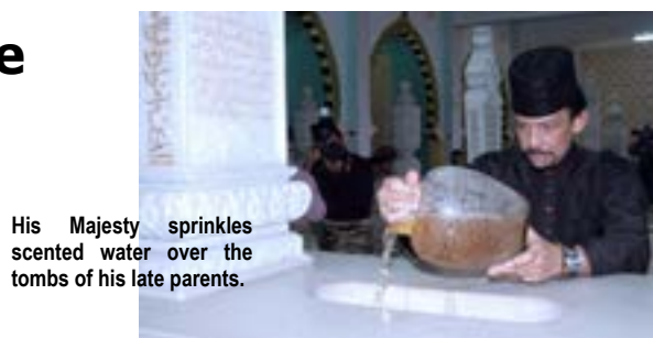
His Majesty sprinkles scented water over the tombs of his late parents.

Also present at the bertahlil ceremony were Pengiran-Pengiran Cheterias, cabinet ministers, deputy ministers and state dignitaries.