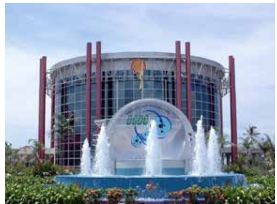
Oil and Gas Discovery Centre

It is located in Pekan Seria, Belait District where it was set up by the Brunei Shell Petroleum with an aim to educate the public on science, technology and the environment.