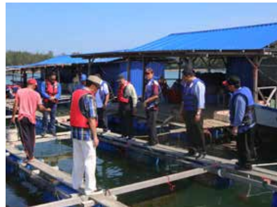
Fish farming activities at Tanjong Pelompong

The Capture Industry in 2017 saw a local production of 13,795.6 metric tonnes; followed by Aquaculture Industry with 1,632.2 metric tonnes; and the Processing Industry with 2,963.5 metric tonnes.