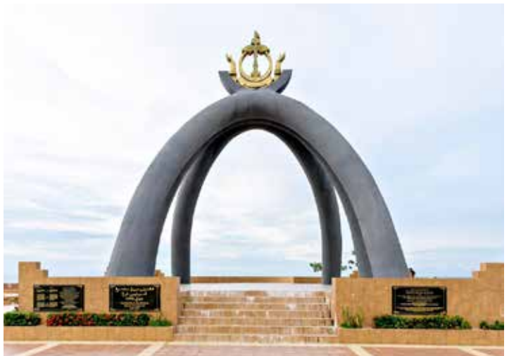
The Billionth Barrel Monument

L ocated about 10 minutes drive from the capital, the centre was officially opened by His Majesty The Sultan and Yang Di-Pertuan of Brunei Darussalam on November 13, 2008. This centre consists of modern exhibits that features health related items. Besides viewing the modern, attractive and innovative exhibitions, interactive activities are also available.