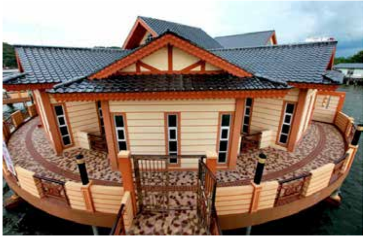
The Kampung Ayer Cultural & Tourism Gallery

G allery (KACTG) located just across from the downtown area of Brunei's capital, Bandar Seri Begawan was officially opened on August 19, 2009. Offering tourists an attractive touch-screen information display, five mini galleries containing background information on the Kampung Ayer, as well as a number of photographs and museum artefacts are showcased. Handicraft displays, live craft-making demonstrations, and a souvenir kiosk will allow visitors to bring back memories and mementos of their Kampung Ayer experience. The KACTG is a new landmark for Bandar Seri Begawan and a point of pride for Kampung Ayer residents.