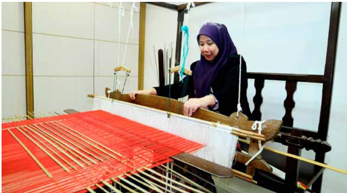
A weaver at the Brunei Arts and Handicrafts Training Centre weaving a beautiful cloth commonly known as 'Kain Tenunan Brunei'

Relics and other various artistic heritage besides the ones mentioned above include Malay weaponry, wood carvings, traditional instruments, 'silat' (the traditional art of self-defence) and decorative items for women. Some of these are kept in the Brunei Museum and the Malay Technology Museum, not only for the world to see but also most importantly for today's generation to admire and be proud of for future generations to emulate and remind them of the ancestor's natural skills, creativity and innovativeness.