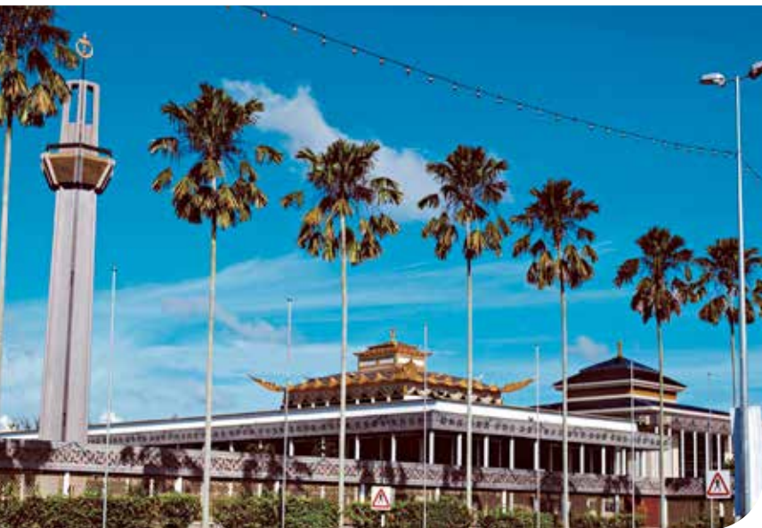
Lapau and Dewan Majlis

The Lapau which contains the Patarana (Throne) and where numerous solemn ceremonies are held is beautifully decorated in exquisite gold motifs. It was here on August 1, 1968 that His Majesty The Sultan and Yang Di-Pertuan of Brunei Darussalam was crowned the 29th ruler of Brunei Darussalam.