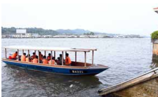
Water taxi is mainly used by the residents of Kampung Ayer

Boats and water taxis are the transportation for most residents of Kampung Ayer. Fares are cheap and charged according to distance. Others prefer footbridges which are available throughout Kampung Ayer.