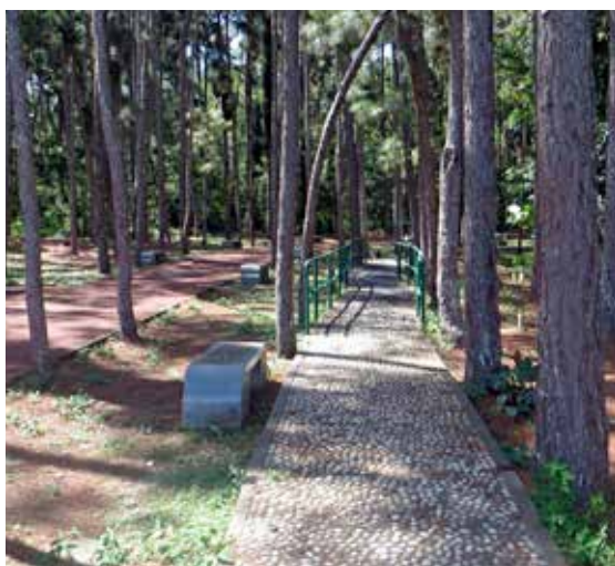
Bukit Shahbandar Forest Recreational Park