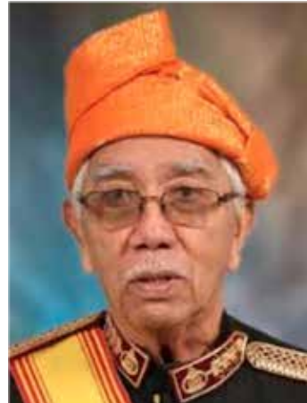
The late Pengiran Haji Mohamed Yusof bin Pengiran Haji Abdul Rahim, the writer of Brunei's National Anthem lyrics

Below are the lyrics of the National Anthem;