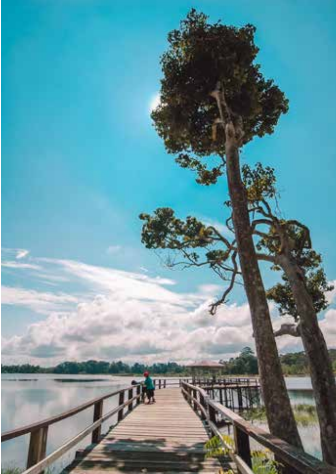
A beautiful view at Tasek Merimbun Heritage Park