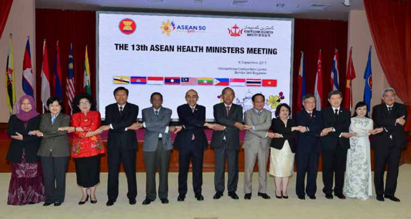
The 13th ASEAN Health Ministers Meeting was held at the International Convention Centre Building, Berakas on September 6, 2017

B runei Darussalam is a member of the Association of South East Asian Nations (ASEAN), Organisation of Islamic Conference (OIC), the United Nations (UN), the Commonwealth, the Non-Alignment Movement (NAM), World Trade Organisation (WTO), Asia-Pacific Economic Cooperation (APEC), and Asia-Europe Meeting (ASEM).