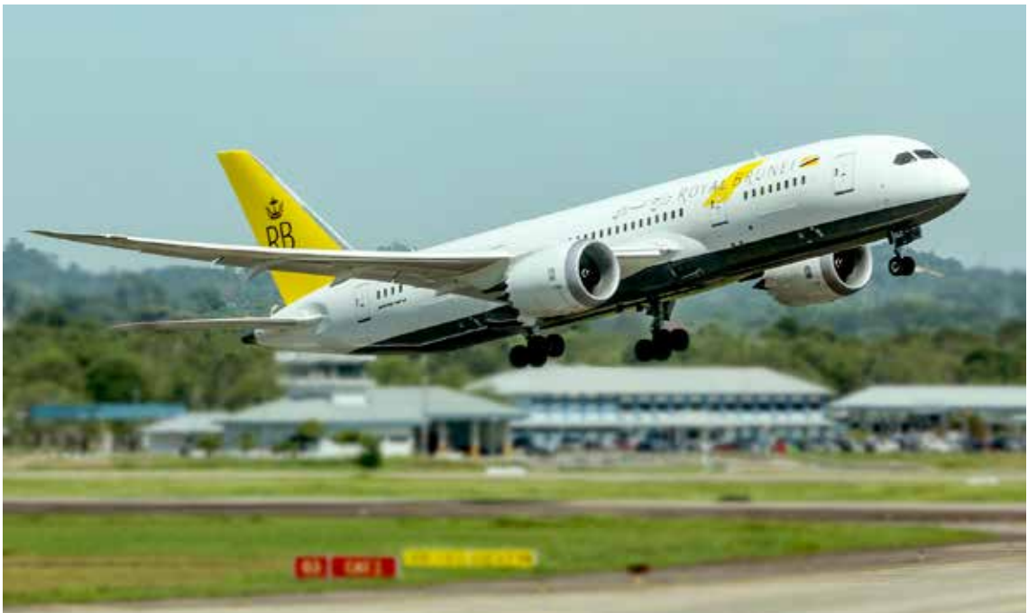
Royal Brunei Airline's Dreamliner Boeing 787 taking off

Royal Brunei Airlines (RB) is the national carrier, an independent corporation wholly owned by the Government of His