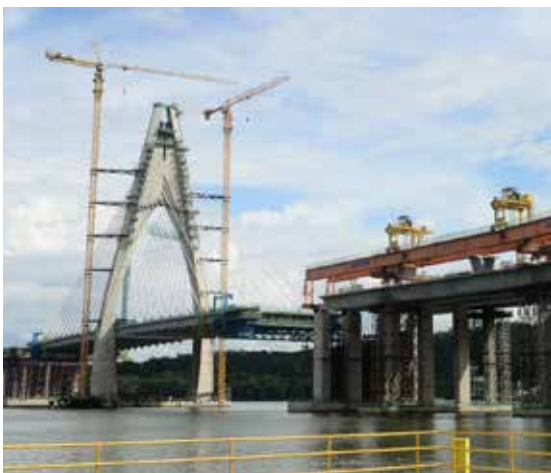
Temburong Bridge project site at Sungai Besar, Mukim Kota Batu

On 16 January 2016, His Majesty Sultan Haji Hassanal Bolkiah Mui'zzaddin Waddaulah ibni Al-Marhum Sultan Haji Omar 'Ali Saifuddien Sa'adul Khairi Waddien, Sultan and Yang Di-Pertuan Negara Brunei Darussalam consented to launch the Temburong Bridge Project Foundation Laying Ceremony which took place at Kampung Sungai Besar project site, Mukim Kota Batu. Temburong Bridge is a bridge linking Brunei and Muara District and Temburong District.