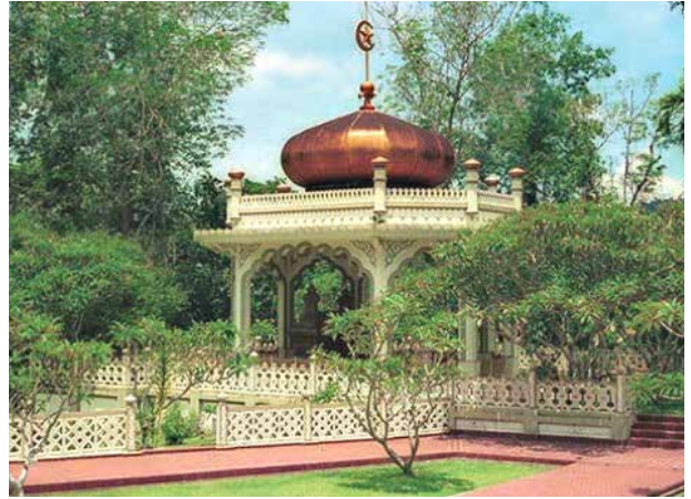
Sultan Bolkiah Mausoleum

The mausoleum is situated at Jalan Kota Batu facing the Brunei River. The tomb of Sultan Bolkiah, the fifth Sultan of Brunei lies within the mausoleum. Sultan Bolkiah was one of the greatest Sultans of Brunei, known as Nakhoda Ragam which means 'The Singing Captain'. During his rule, Brunei's sovereignty extended over the whole of the coastal kingdom of Borneo. The mausoleum, therefore, commemorates the golden age of Brunei.