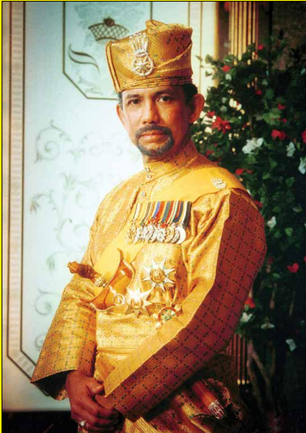
His Majesty Sultan Haji Hassanal Bolkiah Mu'izzaddin Waddaulah ibni Al-Marhum Sultan Haji Omar 'Ali Saifuddien Sa'adul Khairi Waddien, Sultan and Yang Di-Pertuan of Brunei Darussalam