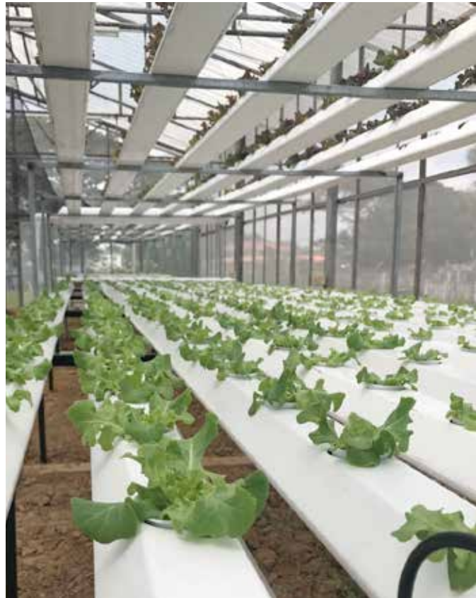
Hydroponic vegetables grown in local green houses are quite popular

Local production of ornamental plants in 2017 amounted to 774,037 plants with a retail value of about $5.95 million. A total of 251,547 plants were imported with an estimated retail value of $0.74 million. The overall total consumption of ornamental plants was 1,025,584 plants with a retail value of $1.65 million. While the local production of cut flowers in 2017 was 140,686 cuts with retail value of $0.07 million. The total import was 1,362,204 cuts valued at $0.99 million.