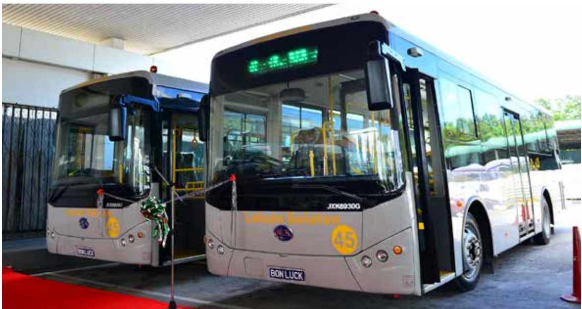
Buses as public transportation

Cars in Brunei Darussalam are right hand drive and every vehicle must be covered with a valid insurance policy.