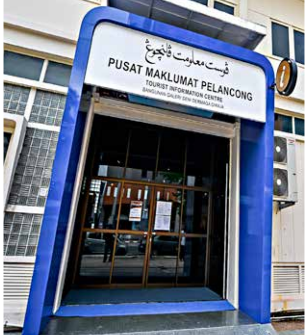
Tourist Information Centre at The Royal Wharf Arts Gallery, Bandar Seri Begawan

A total of 258,955 tourists arrived in the country in 2017 and were comprised from ASEAN (50.7%); European Union (7.02%); and Others (42.3%).