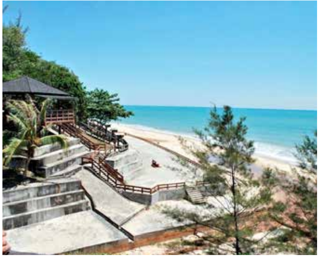
Berakas Forest Reserve Recreational Park

B erakas Forest Reserve Recreational Park is 199 hectares wide situated along the Muara-Tutong Highway which is just 10 kilometres from Bandar Seri Begawan. Here you can witness the sun-dappled pathways meanders past sheltered picnic spots and barbeque facilities towards the soaring observation tower, and the tang of salt air hovers above the lush green keranga and casuarina forests that tumble to the edge of the nearby South China Sea.