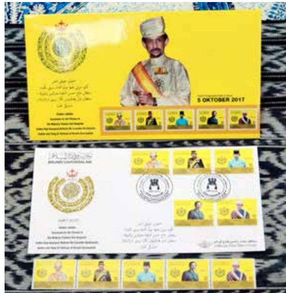
A Commemorative Pack issued by Department of Postal Services in conjunction with the Golden Jubilee Accession to the Throne of His Majesty Sultan Haji Hassanal Bolkiah Mu'izzaddin Waddaulah, the Sultan and Yang Di-Pertuan of Brunei Darussalam.

On 30 September 2017, Department of Postal Services announced the issuance of Commemorative Pack, Stamp Booklet, Special Edition Stamps and First Day Official Envelopes in conjunction with the