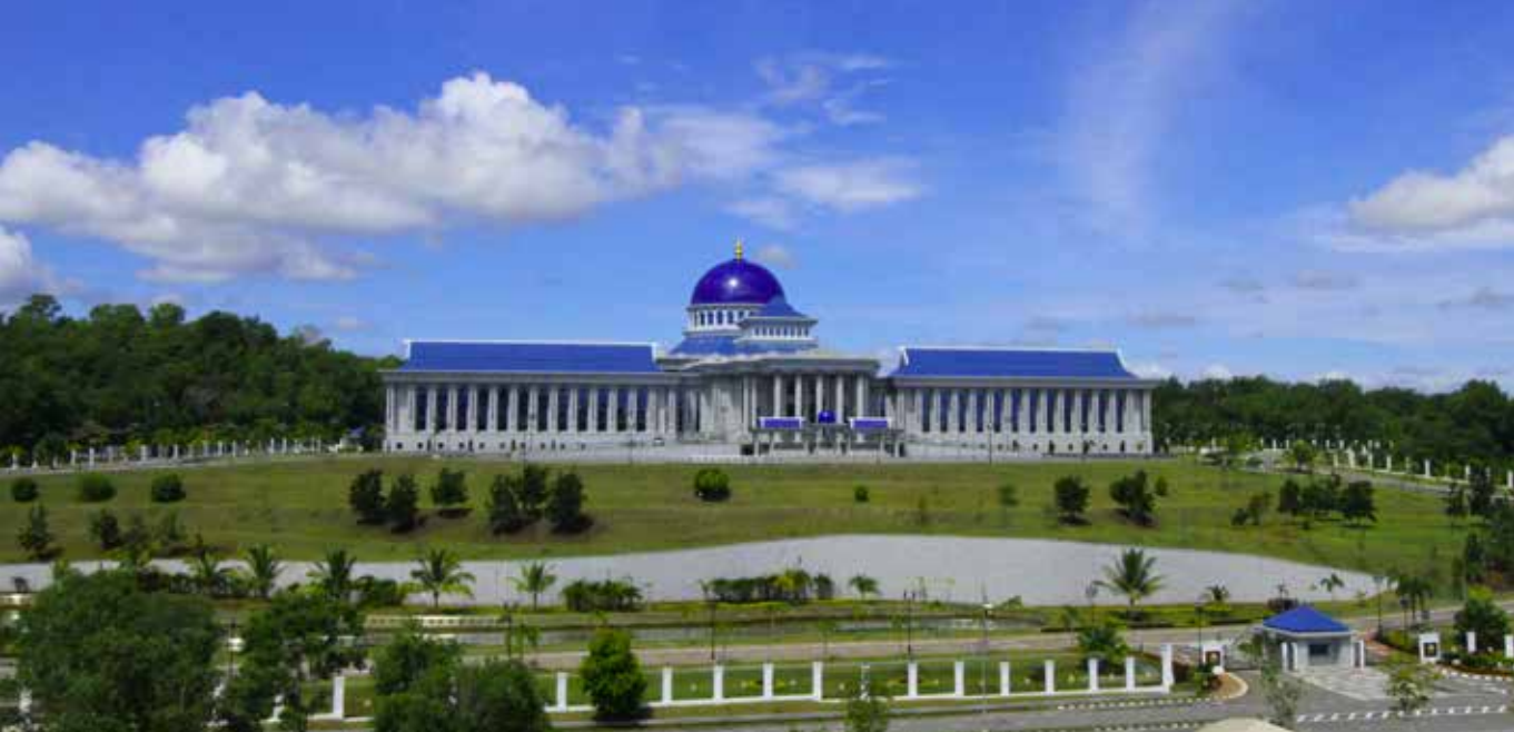
Councils of State Building