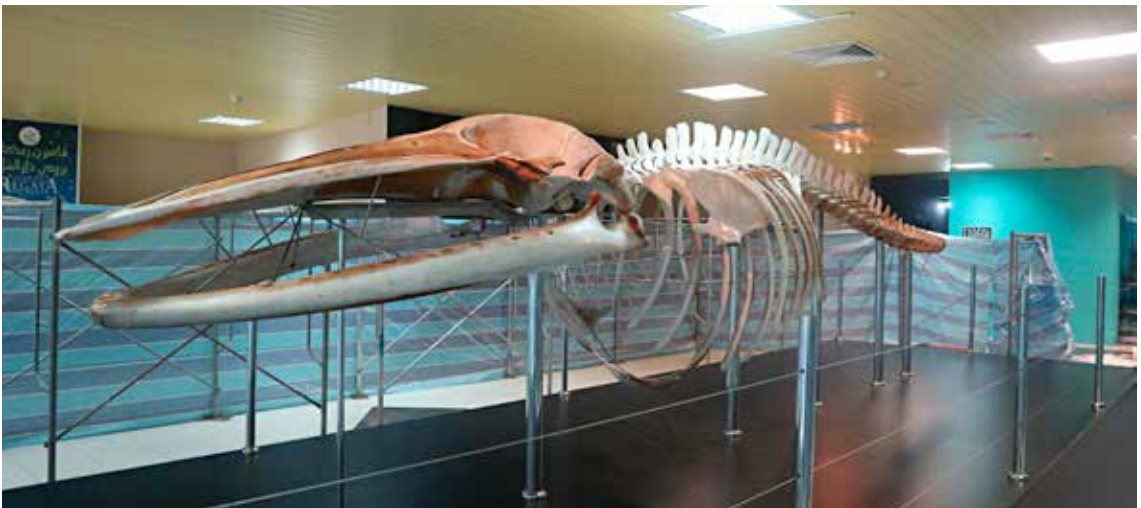
Display of a skeleton of a whale at Brunei Maritime Museum

L ocated about 15 minutes drive from Bandar Seri Begawan in Kota Batu, the Brunei Maritime Museum is for those with a nautical interest. With an architectural design representing a ship, this museum features and exhibits more than 13,000 artefacts discovered in 1997, from a shipwreck which set sail from China, believed to be from either the late 15th century or 16th century. These artefacts were meant to be exchanged with Brunei local products. Porcelains and ceramic potteries from China, Viet Nam and Thailand obtained from the shipwreck are displayed in the galleries of the museum.