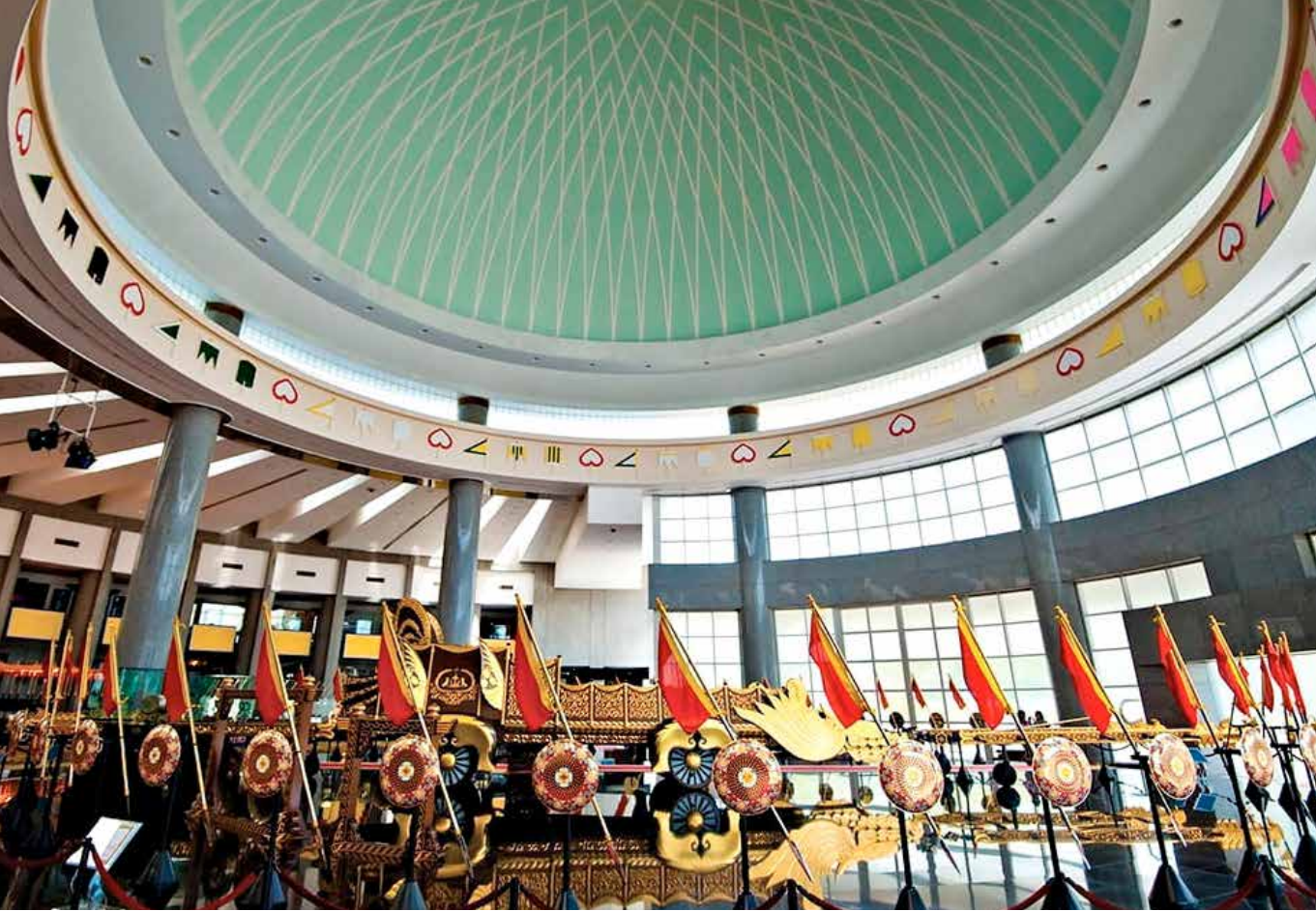
Displays at the Royal Regalia Museum