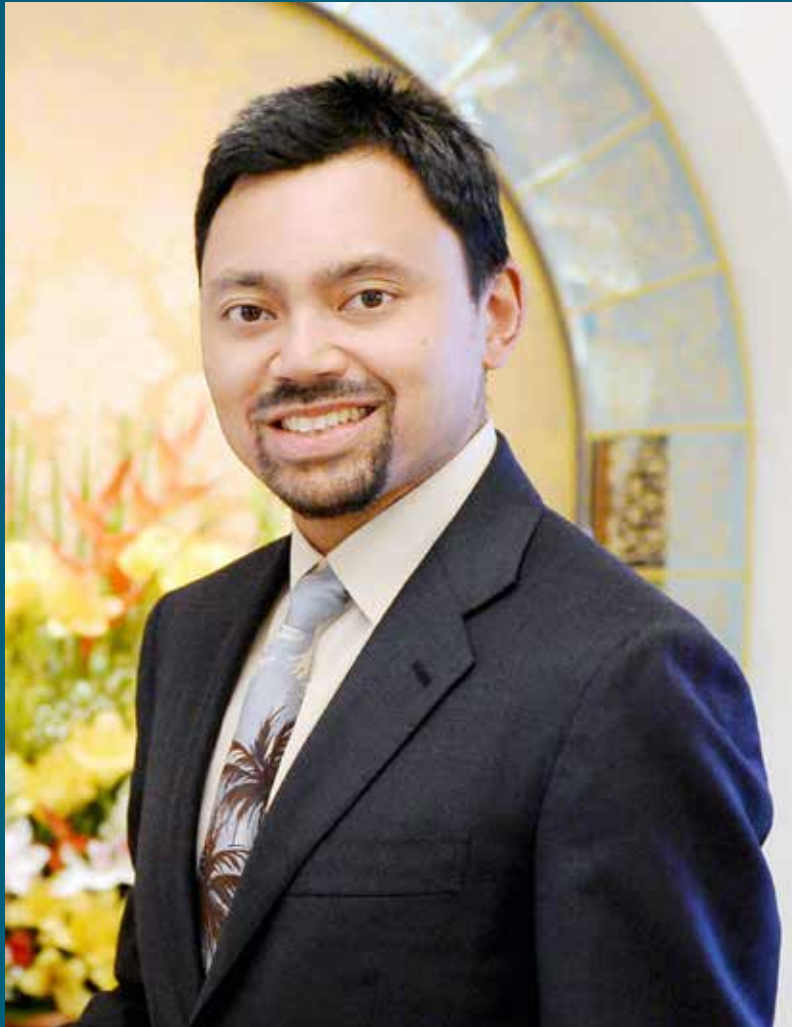
His Royal Highness Prince Haji Al-Muhtadee Billah ibni His Majesty Sultan Haji Hassanal Bolkiah Mu'izzaddin Waddaulah, The Crown Prince and Senior Minister at the Prime Minister's Office