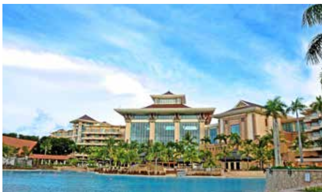
The Empire Hotel and Country Club