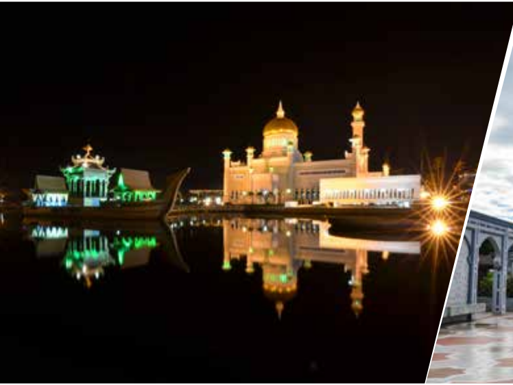
Sultan Omar 'Ali Saifuddien Mosque at night