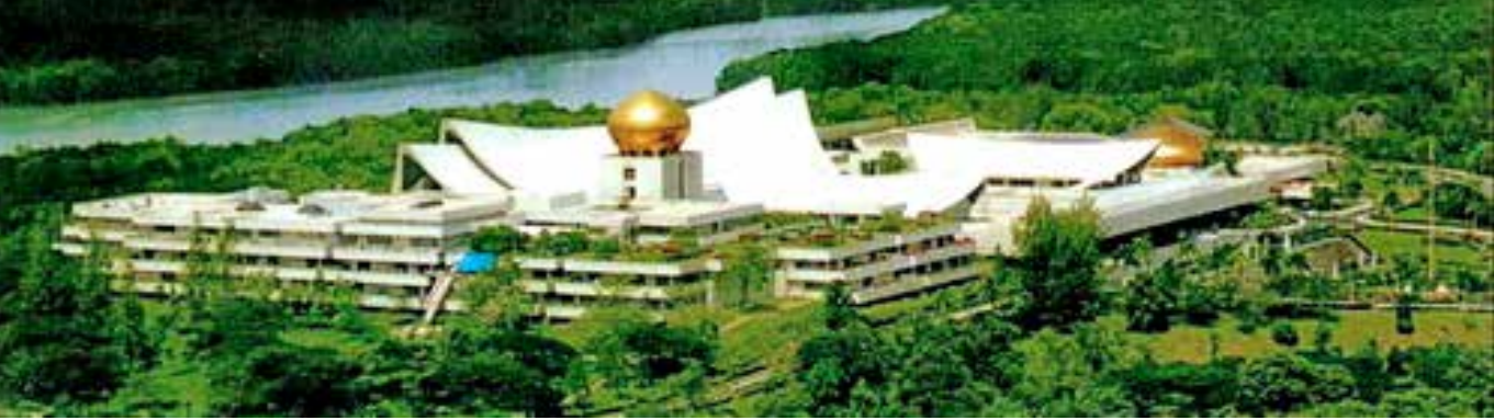
Istana Nurul Iman