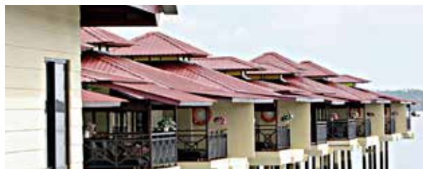
Mangrove Paradise Resort

Unit 1-12, Block C, Lot 6905 Simpang 396, Jalan Jerudong Mukim Sengkurong BG3122 Negara Brunei Darussalam Telephone: (+673) 261 2233/ 261 2213 Fax: (+673) 261 1892 E-mail: frontdesk@jerutonhotel.com Website: www.jerutonhotel.com