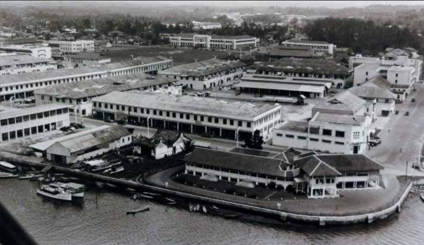
Bandar Seri Begawan in the old days

B efore the advent of Islam, Brunei Darussalam's early history is unclear but archaeological discoveries supported by historical data indicate that Brunei had wide contacts with its neighbours on the Asian continent around 518 A.D. Chinese historians of that period, for example, made references in their writing of 'Puni' or 'Poli', two of the many names which Brunei was known during ancient times.