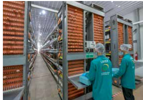
Chickens eggs are assembled and packed in a clean environment

Agriculture production data shows that the production of chicken eggs in the year 2017 was worth at a retail value of about $25.41 million or 150.8 million eggs. Total consumption in the year 2017 was at 151.26 million eggs with a retail value of $25.49 million.