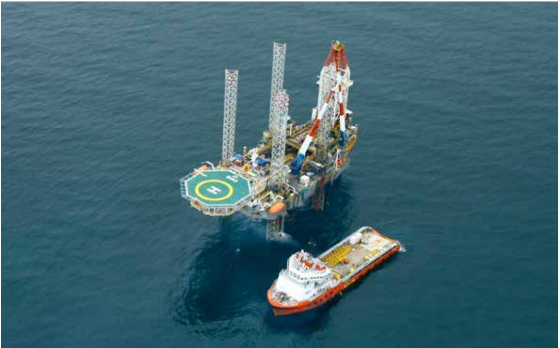
An oil rig on the South China Sea

In the same period, the oil price was at US$55.03 per barrel per day; while liquefied natural gas was at US$ 8.18 per MMBtu (Million British thermal unit).