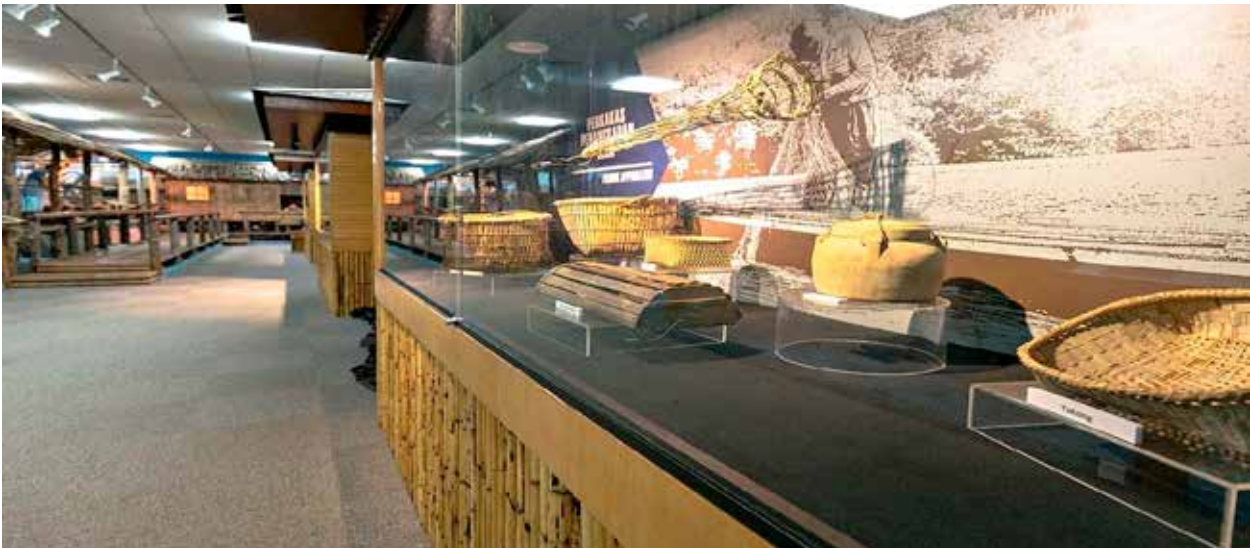
Exhibition displaying the utensils used in the old days