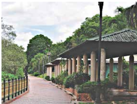
Damuan Recreational Park

It is situated next to the Istana Nurul Iman where visitors can get the best view of the palace. Because of the magnificent view of the palace, this park is one of the popular places of interest in Brunei. Taman Persiaran Damuan offers a scenic park along the riverbank off Jalan Tutong, and it is a popular spot for joggers. Other distinctive decorations are the six outdoor sculptures by ASEAN artists.