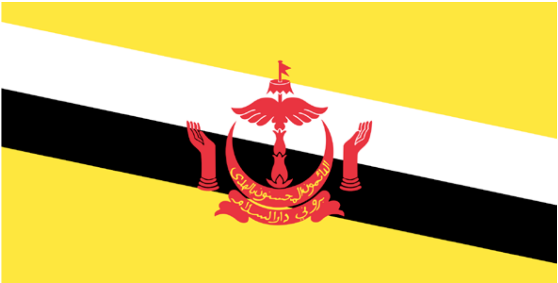
National Flag of Brunei Darussalam

The Brunei Darussalam state flag in its present form, except for the crest, has been in use since 1906 when Brunei became a protected state, following the signing of an agreement between Brunei and Great Britain. The crest was superimposed in 1959 after the promulgation of the Constitution of Brunei on September 29, 1959.