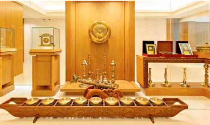
Brassware and Silverware collections displayed at the Brunei Arts & Handicrafts Training Centre