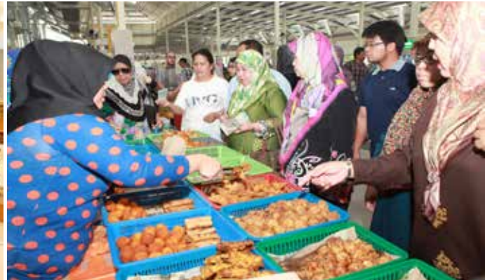
Pasar Pelbagai Barangan Gadong