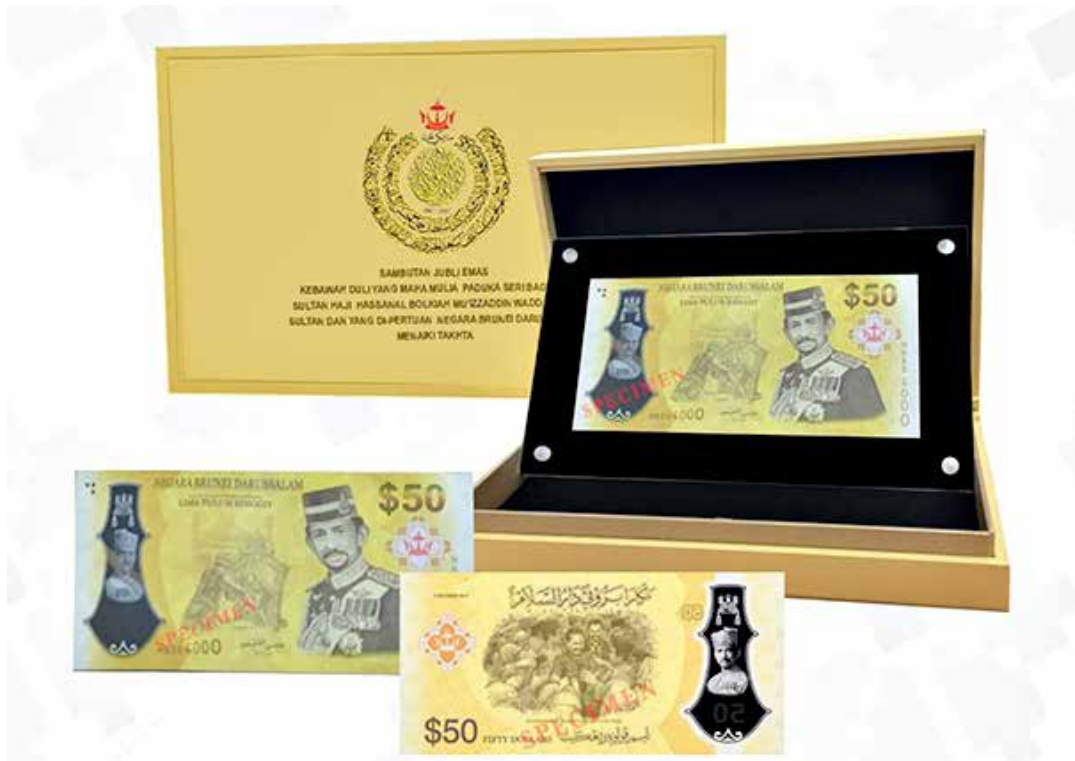
The BND 50 Commemorative Polymer Note, Commemorative Coins And The 5th Series Of Coins In Circulation, In Conjunction With The Golden Jubilee Celebration Of His Majesty The Sultan and Yang Di-Pertuan of Brunei Darussalam's Accession To The Throne

50 cents coins designed with special jawi inscription which reads "Sempena Sambutan Jubli Emas Kebawah Duli Yang Maha Mulia Paduka Seri Baginda Sultan Haji Hassanal Bolkiah Mu'izzaddin Waddaulah Menaiki Takhta" (In Conjunction with the Golden Jubilee Celebration Golden Jubilee Celebration Of His Majesty The Sultan and Yang Di-Pertuan of Brunei Darussalam's Accession To The Throne) in limited quantity of 500,000 pieces for circulation were distributed to students in all pre-schools, primary and secondary schools as well as sixth-form centres in all four districts nationwide.