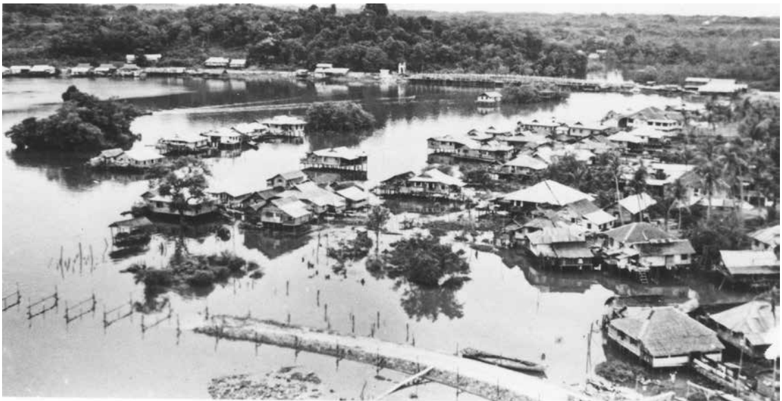
Kampong Ayer during the 19th century

His Majesty's Government through its 10th National Development Plan from 2012 to 2017, has allocated $6.5 billion for the country's continuing development and progress.