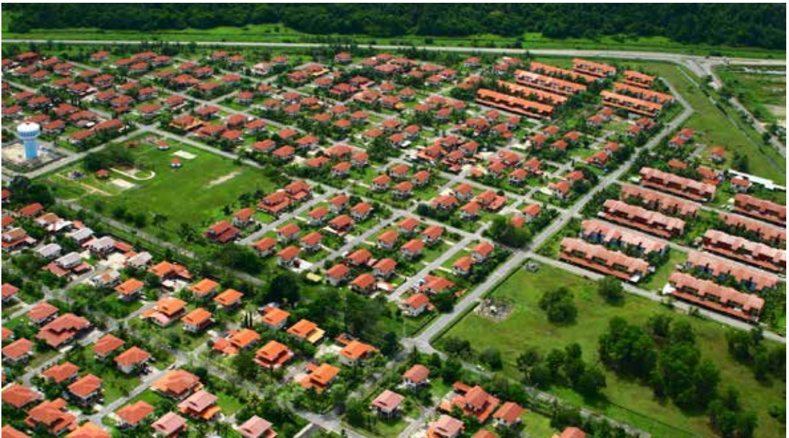
One of the housing schemes introduced in Brunei Darussalam