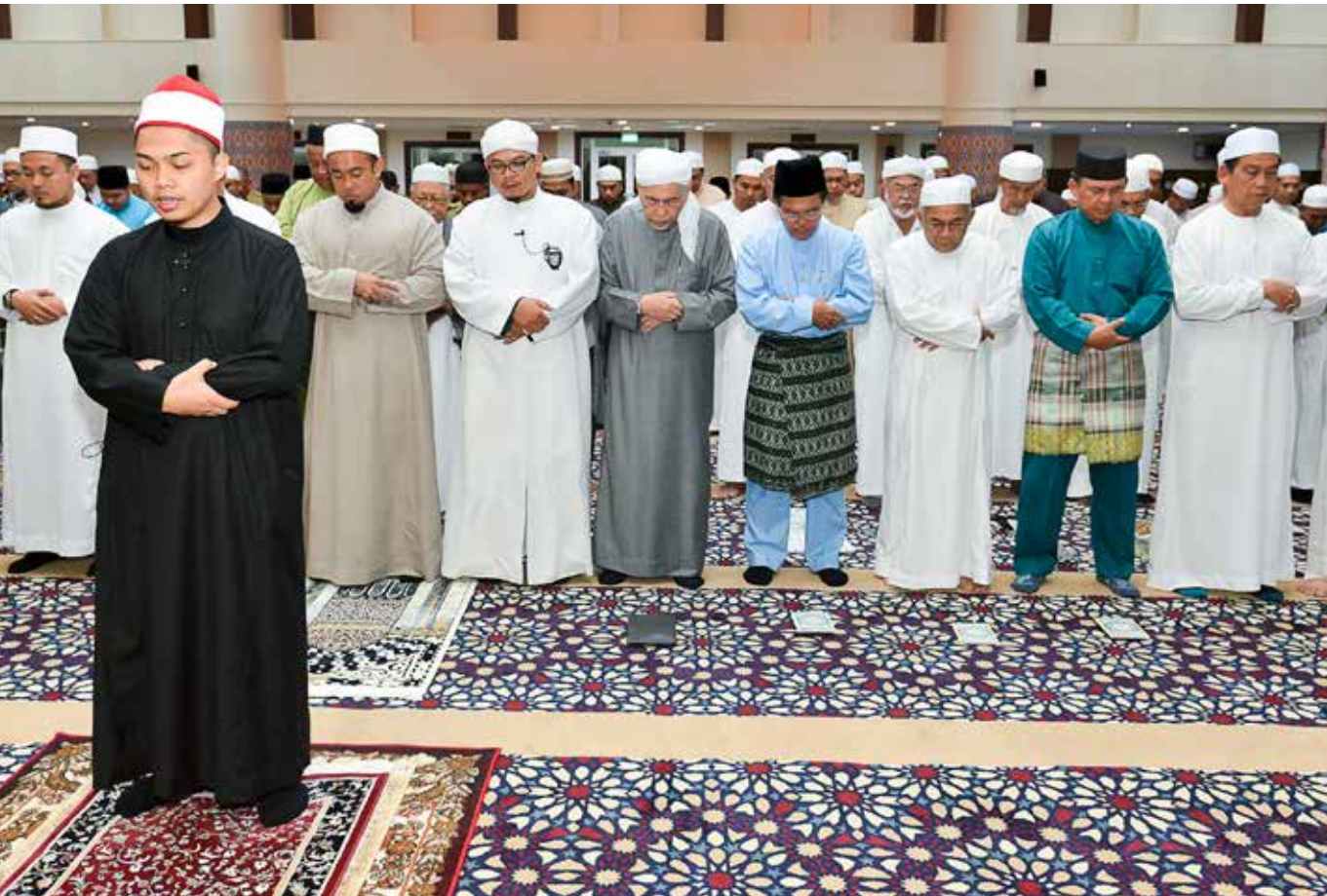
A mass prayer held in one of the mosques in Brunei Darussalam