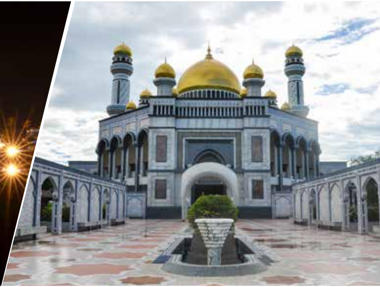
Jame' 'Asr Hassanil Bolkiah Mosque

There are two great mosques in Bandar Seri Begawan. The first is located at the city centre of Bandar Seri Begawan. It is one of the most magnificent mosques in Southeast Asia which symbolises Brunei's perpetual adherence to Islam.