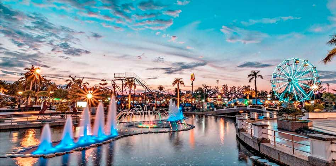
Jerudong Park Playground