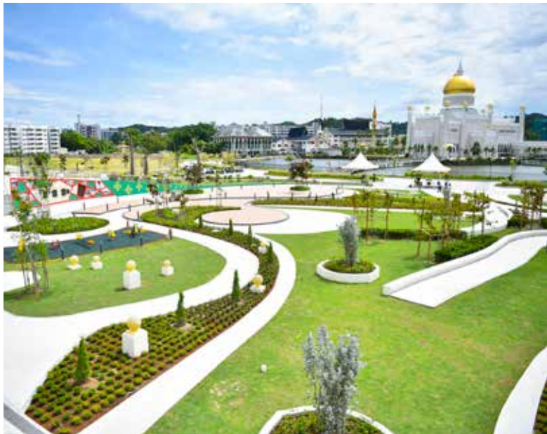
Taman Mahkota Jubli Emas

The crescent moon in the centre of the bridge symbolises Islam and blends with the park atmosphere for the creation of a new city landmark.