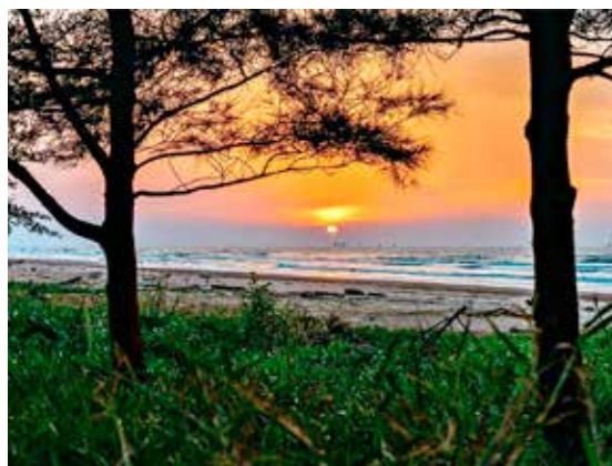
Scenery at Pantai Seri Kenangan at sunset

Located close to Bukit Shahbandar Recreational Park are two beaches, namely Tungku Beach and Jerudong Beach. Besides these two beaches, the other famous beaches are Muara and Serasa beaches. These are popular beaches and are well equipped with picnic grounds, changing rooms, restrooms, yacht activities and food stalls. In addition, one of the iconic beaches in Tutong is Seri Kenangan Beach.