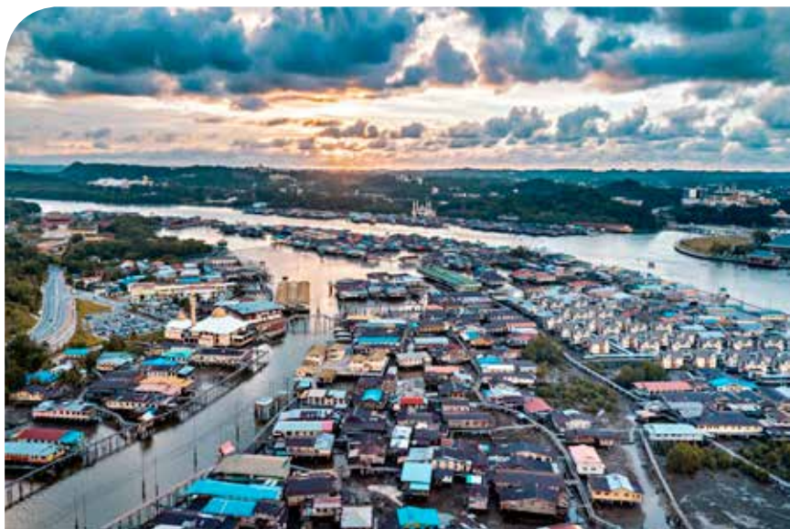
A view of Kampung Ayer at sunrise

Modern facilities such as schools, clinics, police stations and mosque are