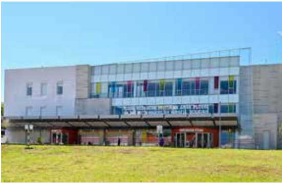
Pengiran Anak Puteri Hajah Muta-Wakillah Hayatul Bolkia Health Centre, Rimba

In 2017, there were four government-run hospitals with one based in each district: Raja Isteri Pengiran Anak Saleha Hospital (Brunei-Muara District); Suri Seri Begawan Hospital (Belait District); Pengiran Muda Mahkota Pengiran Muda Haji Al-Muhtadee Billah Hospital (Tutong District); Pengiran Isteri Hajah Mariam Hospital (Temburong District) as well as one cancer centre: the Brunei Cancer Centre, located in Jerudong (Brunei-Muara District).