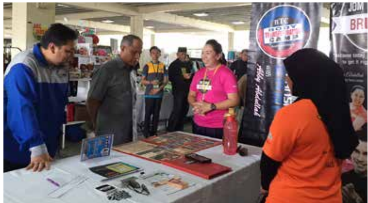
One of the booths managed and run by local youths during the Youth Day Festival 2017.

Located at Beribi, JobCentre Brunei is a One-Stop Career Center where local jobseekers may utilise available services to help improve their employability and marketability in the job market and where private companies may use its facilities for their local recruitment process.