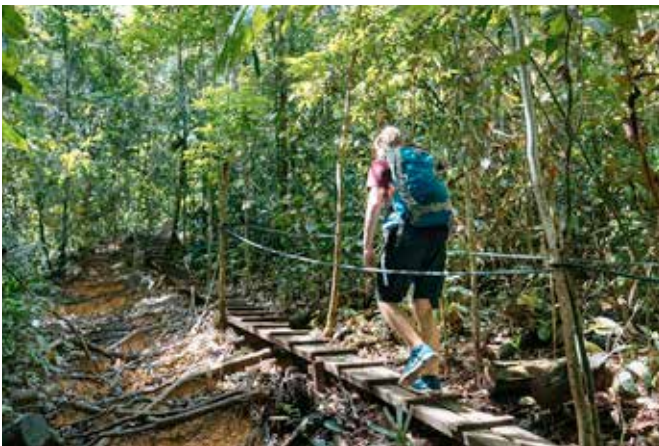
Ulu Temburong National Park

L ocated in Tutong District, about one hour and 15 minutes drive from Bandar Seri Begawan, the park aims to provide a safe haven for protected wildlife to breed, preserve flora and fauna and to provide a base for scientific research and study. For those interested in botany or bird watching, there is a jungle trail to explore. The park was declared as one of the ASEAN National Heritage Sites on November 29, 1984.