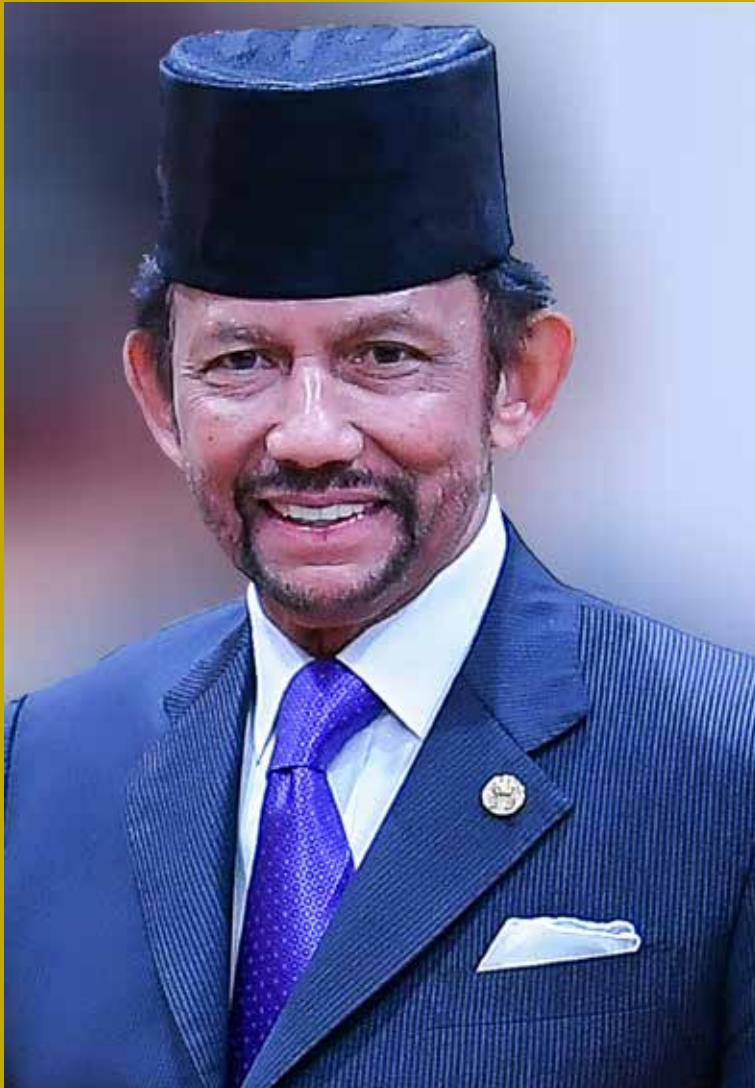
His Majesty Sultan Haji Hassanal Bolkiah Mu'izzaddin Waddaulah ibni Al-Marhum Sultan Haji Omar 'Ali Saifuddien Sa'adul Khairi Waddien, The Sultan and Yang Di-Pertuan of Brunei Darussalam