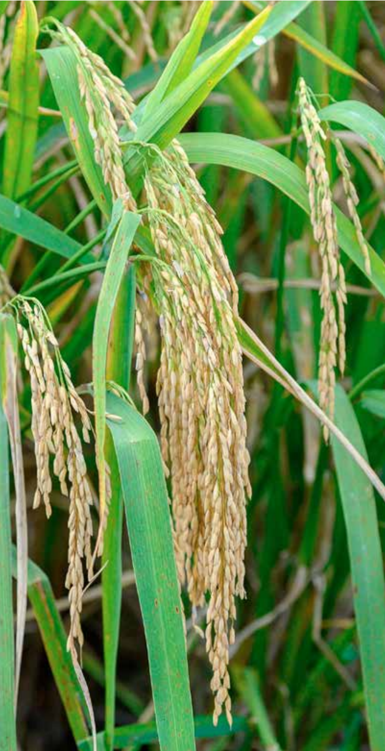
Paddy that are ready to be harvested

A griculture remains an important sector in the country's bid to achieve a progressive and productive economy and at the same time ensuring the security of food supply for the people of Brunei Darussalam.