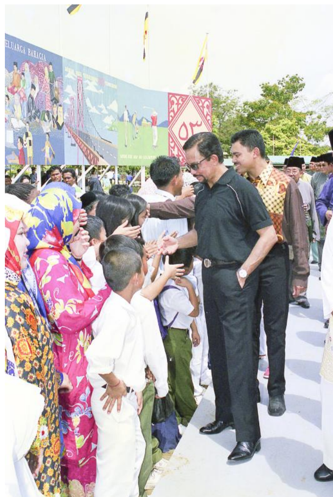
His Majesty the Sultan and Yang Di-Pertuan of Brunei Darussalam receiving junjung ziarah from the citizens and residents in Brunei-Muara District (left) and Temburong District (right).