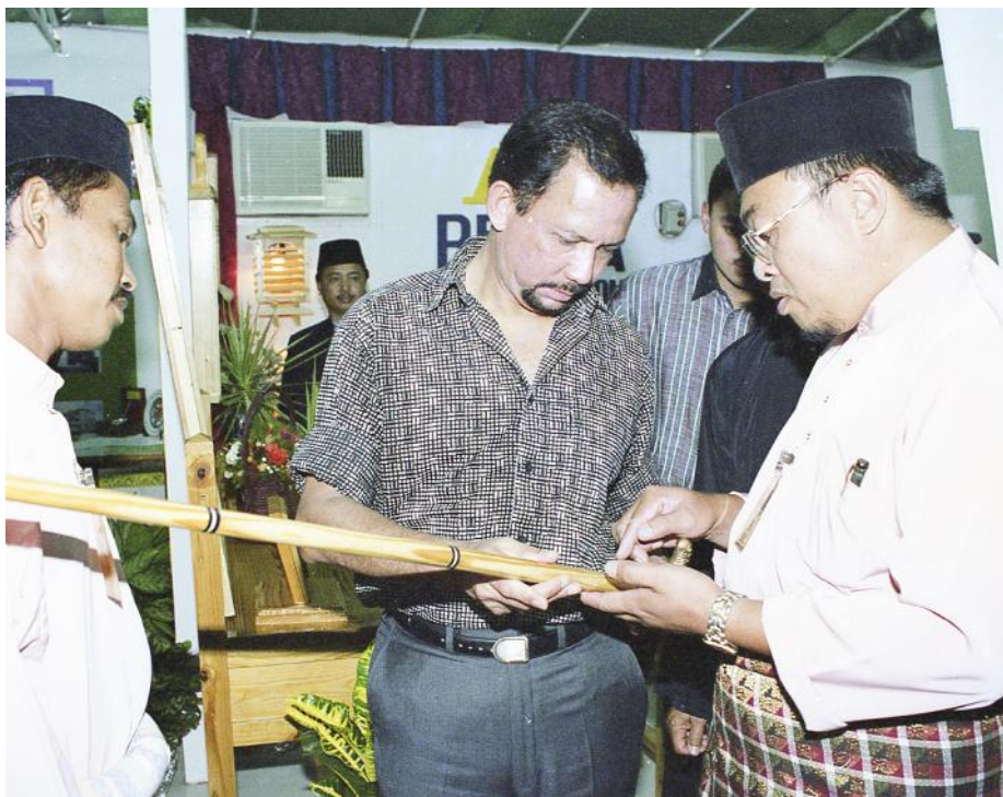
His Majesty Sultan Haji Hassanal Bolkiah Mu'izzaddin Waddaulah ibni Al-Marhum Sultan Haji Omar 'Ali Saifuddien Sa'adul Khairi Waddien, Sultan and Yang Di-Pertuan of Brunei Darussalam tours the exhibition held during the Get-Together and Junjung Ziarah Ceremony with the citizens and residents in Belait District.

Various performances were held during the series of events; reflecting the joy of the people, as well as their gratitude,