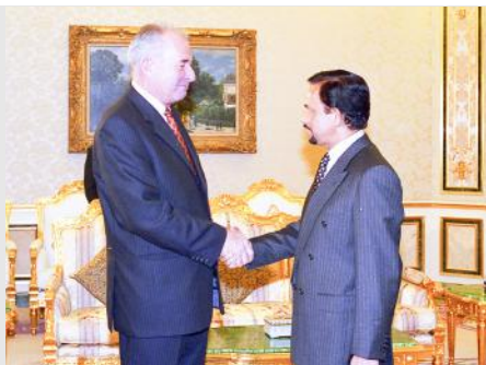
3 His Majesty grants audiences