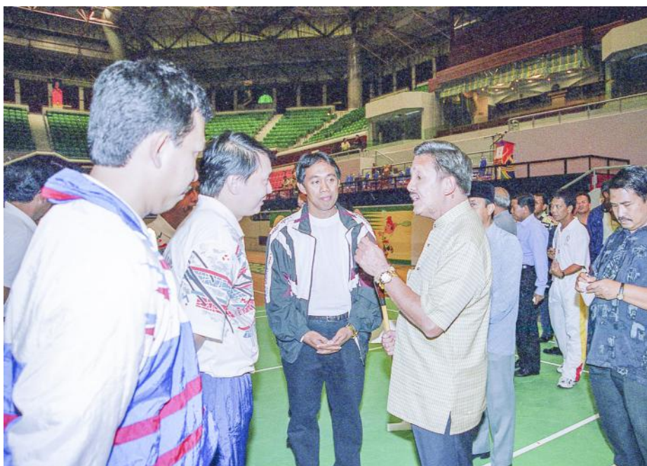
His Royal Highness Prince Haji Sufri Bolkiah ibni Al-Marhum Sultan Haji Omar 'Ali Saifuddien Sa'adul Khairi Waddien, President of the Brunei Darussalam National Olympic Council and Chairman of the 20 th SEA Games during the National Contingent Members' Meeting at the Indoor Stadium, Hassanal Bolkiah National Sports Complex.

With this election, His Royal Highness hopes that the Chief De Mission and his assistant will immediately play their part to ensure the successful management of the 20 th SEA Games contingent.