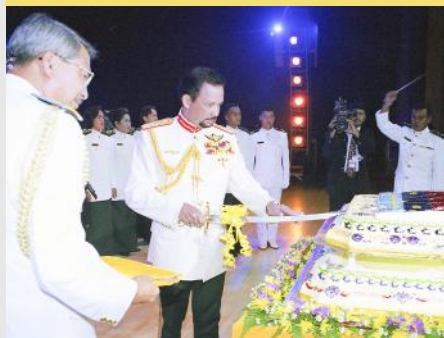
17 RBAF and RBPF celebrate His Majesty's 53 rd birthday