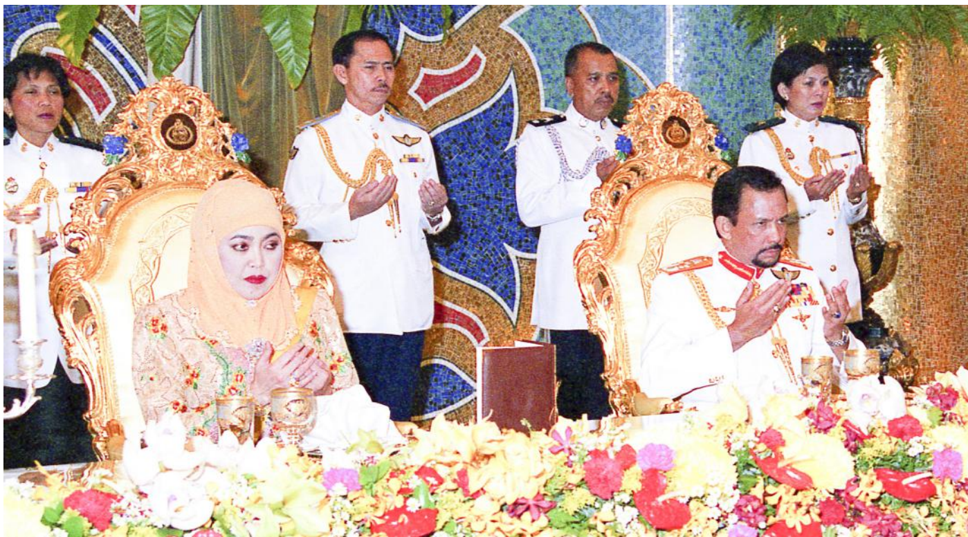
His Majesty Sultan Haji Hassanal Bolkiah Mu'izzaddin Waddaulah ibni Al-Marhum Sultan Haji Omar 'Ali Saifuddien Sa'adul Khairi Waddien, Sultan and Yang Di-Pertuan of Brunei Darussalam; Her Majesty Duli Raja Isteri Pengiran Anak Hajjah Saleha binti Al-Marhum Pengiran Pemancha Pengiran Anak Haji Mohamed Alam and Her Royal Highness Pengiran Isteri Hajjah Mariam binti Haji Abdul Aziz at the Royal Banquet.