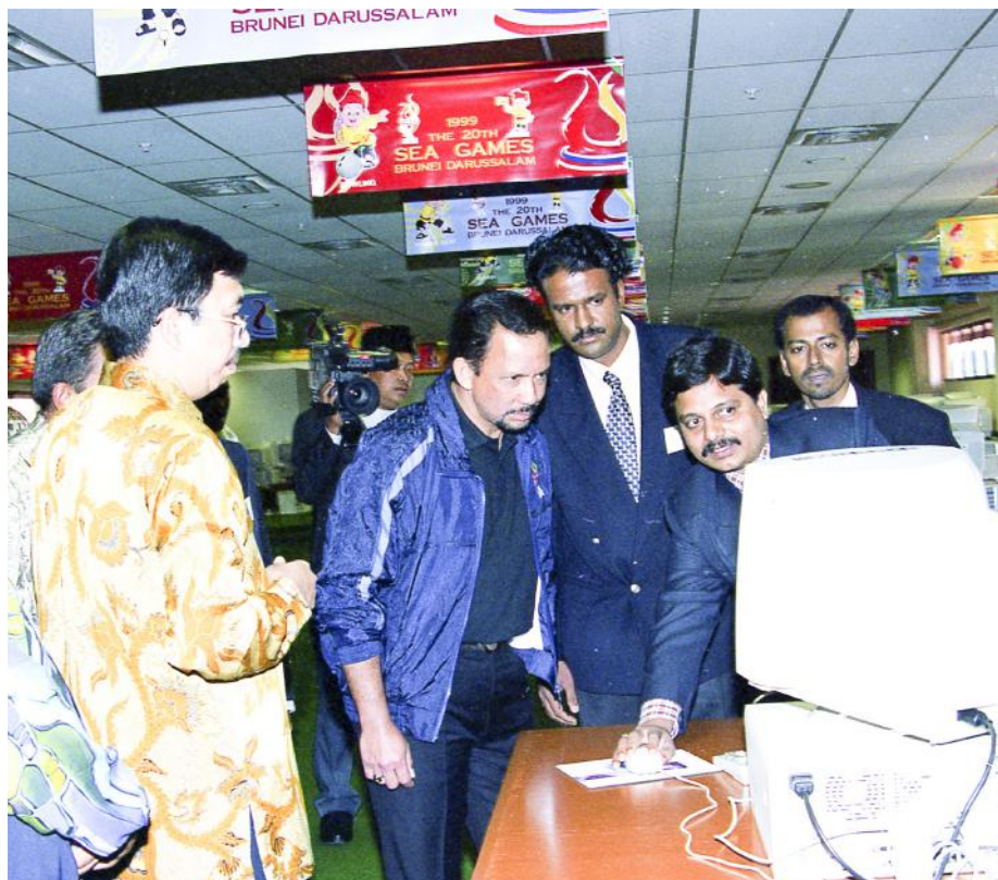
His Majesty Sultan Haji Hassanal Bolkiah Mu'izzaddin Waddaulah ibni Al-Marhum Sultan Haji Omar 'Ali Saifuddien Sa'adul Khairi Waddien, Sultan and Yang Di-Pertuan of Brunei Darussalam during his visit to the Media Press Centre.

His Majesty said that it is not wrong for us to work hard to achieve success; as success, for many, is considered a victory