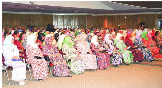
Some of the attendees during the Special Women's Assembly.