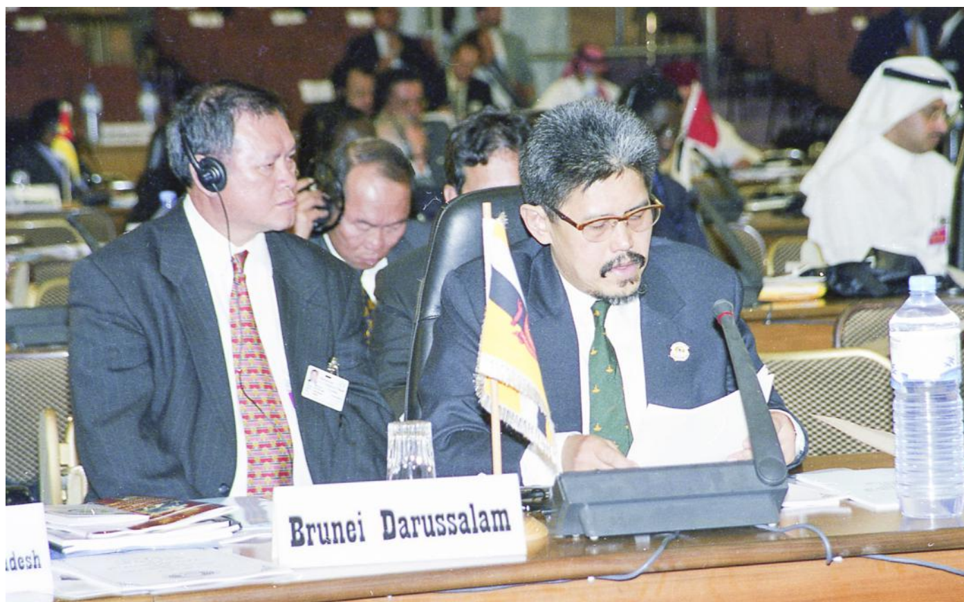
His Royal Highness Prince Mohamed Bolkiah ibni Al-Marhum Sultan Omar 'Ali Saifuddien Sa'adul Khairi Waddien, Minister of Foreign Affairs delivering his sabda (royal speech) during the 26 th Session of the Islamic Conference of Foreign Ministers (OIC).

BURKINA FASO, July 2 - The 26 th Session of the Islamic Conference of Foreign Ministers (OIC), which was held for four days, ended with the approval of the Final Communiqué.