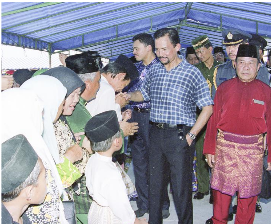
His Majesty Sultan Haji Hassanal Bolkiah Mu'izzaddin Waddaulah ibni Al-Marhum Sultan Haji Omar 'Ali Saifuddien Sa'adul Khairi Waddien, Sultan and Yang Di-Pertuan of Brunei Darussalam during the Get-Together and Junjung Ziarah Ceremony with the citizens and residents in Tutong District.

At the event, His Majesty witnessed a march-past parade led by the Flute and Tambourine Band from the Royal Brunei Armed Forces (RBAF). Over 500 participants took part in the march-past, which consisted of government officials of the Tutong District; residents of eight mukims; the Tutong District Youth Council; and uniformed youth organisations, including the Scouts Association, Girl Guides Association and the Red Crescent Society; as well as members of the Four Wheel Drive Association.