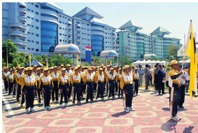
Athletes and officials participating in the 20 th SEA Games marching in at the Sports Village Opening Ceremony and National Flag Handover Ceremony.

His Royal Highness also believes that the local audience will continue to provide moral support, and are always looking forward to see Brunei Darussalam's national flag being raised at the competition venues.