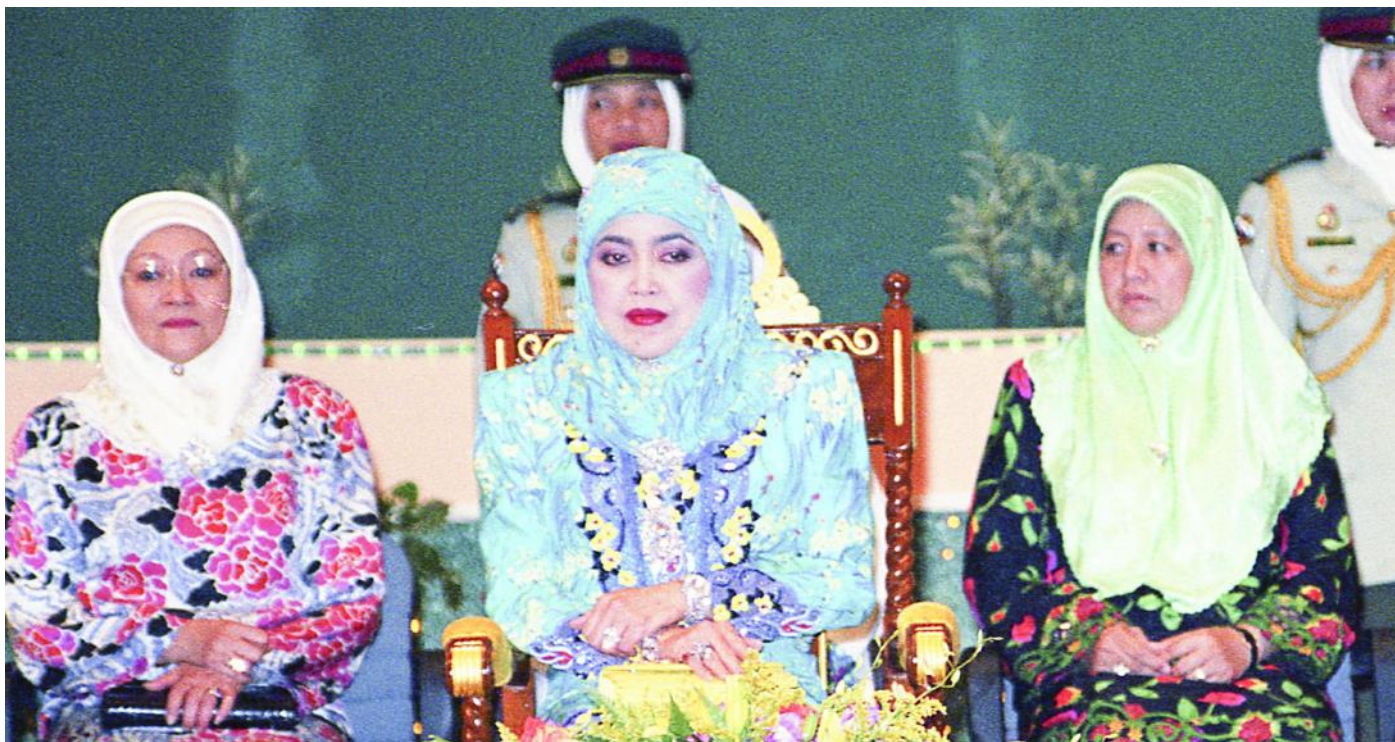
Her Majesty Duli Raja Isteri Pengiran Anak Hajjah Saleha binti Al-Marhum Pengiran Pemancha Pengiran Anak Haji Mohamed Alam during the Women's Special Assembly in conjunction with the Maulidur Rasul Celebration (above).