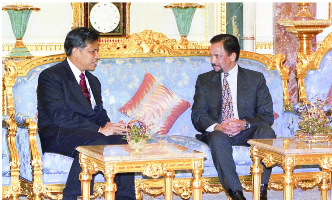
His Majesty Sultan Haji Hassanal Bolkiah Mu'izzaddin Waddaulah ibni Al-Marhum Sultan Haji Omar 'Ali Saifuddien Sa'adul Khairi Waddien, Sultan and Yang Di-Pertuan of Brunei Darussalam with His Excellency Dr. Surin Pitsuwan, Foreign Minister of the Kingdom of Thailand.