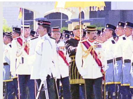
6 Grand Royal Birthday Parade for His Majesty