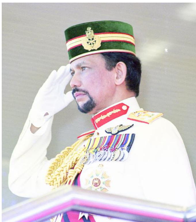
His Majesty Sultan Haji Hassanal Bolkiah Mu'izzaddin Waddaulah ibni Al-Marhum Sultan Haji Omar 'Ali Saifuddien Sa'adul Khairi Waddien, Sultan and Yang Di-Pertuan of Brunei Darussalam receiving the royal salute at the Grand Royal Parade in conjunction with His Majesty's 53 rd birthday celebration.