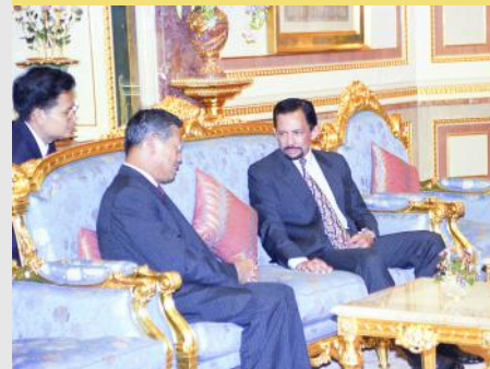
8 Audience Ceremony for special guests