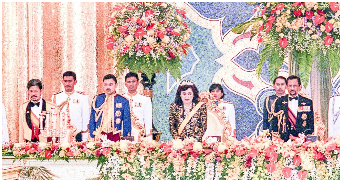
His Majesty Sultan Haji Hassanal Bolkiah Mu'izzaddin Waddaulah ibni Al-Marhum Sultan Haji Omar 'Ali Saifuddien Sa'adul Khairi Waddien, Sultan and Yang Di-Pertuan of Brunei Darussalam and Her Majesty Duli Raja Isteri Pengiran Anak Hajjah Saleha binti Al-Marhum Pengiran Pemancha Pengiran Anak Haji Mohamed Alam, along with Her Royal Highness Pengiran Isteri Hajjah Mariam binti Haji Abdul Aziz during the Royal Banquet. Also present were His Royal Highness Prince Haji Al-Muhtadee Billah, the Crown Prince; His Royal Highness Prince Mohamed Bolkiah.

Before proceeding to the banquet, Their Majesties also received audiences in a separate venue.