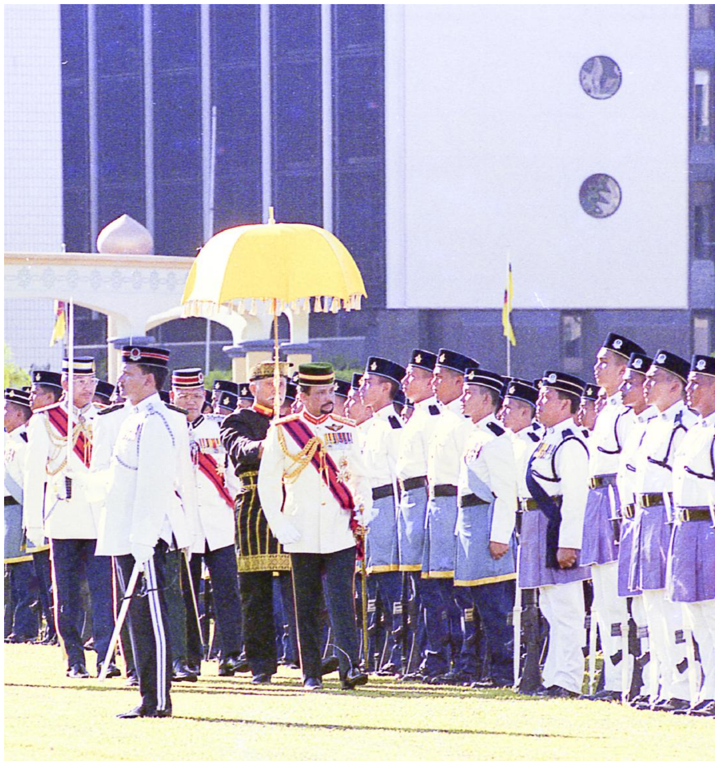
His Majesty Sultan Haji Hassanal Bolkiah Mu'izzaddin Waddaulah ibni Al-Marhum Sultan Haji Omar 'Ali Saifuddien Sa'adul Khairi Waddien, Sultan and Yang Di-Pertuan of Brunei Darussalam inspecting the guard of honour.

Three cheers of 'daulat' for the Monarch was then heard; followed by another singing of the national anthem, while a fly-past performance consisting of airplanes and helicopters from the Royal Brunei Air Force marked the end of the ceremony.