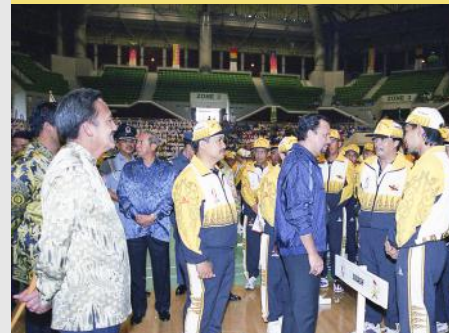
16 Athletes reminded not to neglect their responsibilities