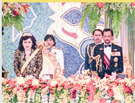
12 Royal Banquet held in conjunction with His Majesty's birthday