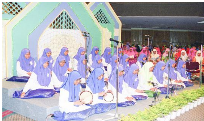
One of the religious performances held during the event.