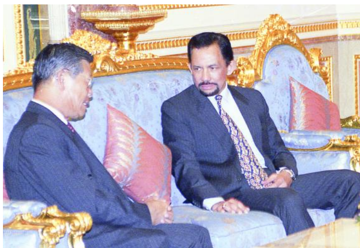
His Majesty the Sultan and Yang Di-Pertuan of Brunei Darussalam with His Excellency Mr. Somsavath Lengsavad, Deputy Prime Minister and Foreign Minister of Lao People's Democratic Republic.