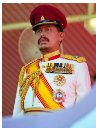
His Royal Highness Prince Mohamed Bolkiah during the ceremony.