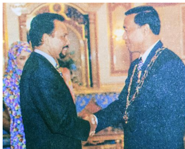
His Majesty with The Honourable General Dato Paduka Seri TNI Wiranto, Minister of Defence and Security and Commander of the Indonesian National Armed Forces.