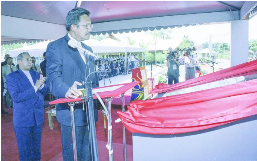
His Royal Highness Prince Haji Sufri Bolkiah ibni Al-Marhum Sultan Haji Omar 'Ali Saifuddien Sa'adul Khairi Waddien, President of the Brunei Darussalam National Olympic Council in his capacity as the Chairman of the Organising Committee of the 20 th SEA Games, delivering a sabda during the Opening Ceremony of the 20 th SEA Games Village at Jalan Ong Sum Ping.

BANDAR SERI BEGAWAN, July 27 - The Government of His Majesty the Sultan and Yang Di-Pertuan of Brunei Darussalam will be granting cash incentives to nation-state medalists for the upcoming 20 th SEA Games.