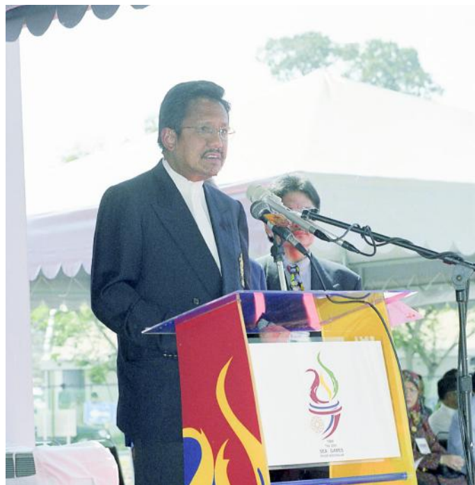
His Royal Highness Prince Haji Sufri Bolkiah delivering a sabda during the National Flag Handover Ceremony for the national contingent of the 20 th SEA Games.

BERAKAS, July 25 - Action will be taken against officials of the contingent, including team managers and coaches, if they are found to have committed acts or made offensive comments on the news or the media that would offend any party; as being the host country requires a clean record on all operational aspects, which also involves our participation.