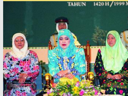
18 Women's Special Assembly commemorates Maulidur Rasul Celebration