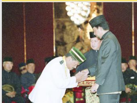
15 159 recipients conferred State Decorations