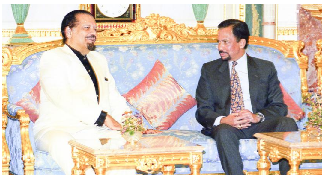
His Majesty the Sultan and Yang Di-Pertuan of Brunei Darussalam with His Excellency Sheikh Ahmed Zaki Yamani from Saudi Arabia.