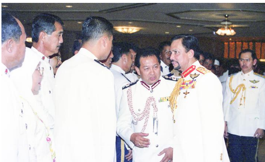
His Majesty Sultan Haji Hassanal Bolkiah Mu'izzaddin Waddaulah ibni Al-Marhum Sultan Haji Omar 'Ali Saifuddien Sa'adul Khairi Waddien, Sultan and Yang Di-Pertuan of Brunei Darussalam receiving junjung ziarah from uniformed officers attending the Royal Banquet.

Also attending the event were State Dignitaries, Cabinet Ministers, Deputy Ministers as well as Permanent Secretaries.