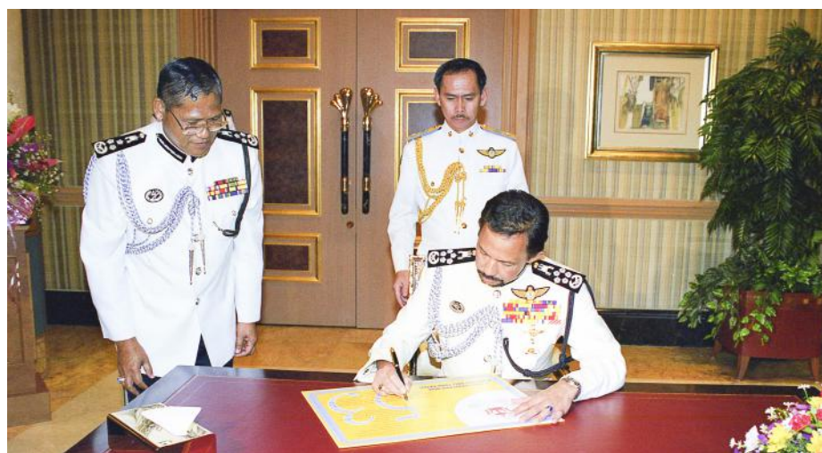
His Majesty the Sultan and Yang Di-Pertuan of Brunei Darussalam signing a commemorative parchment at the banquet hosted by the Royal Brunei Police Force.

GADONG, July 31 - His Majesty Sultan Haji Hassanal Bolkiah Mu'izzaddin Waddaulah ibni Al-Marhum Sultan Haji Omar 'Ali Saifuddien Sa'adul Khairi Waddien, Sultan and Yang Di-Pertuan of Brunei Darussalam; Her Majesty Duli Raja Isteri Pengiran Anak Hajjah Saleha; and Her Royal Highness Pengiran Isteri Hajjah Mariam graced a Banquet in conjunction with His Majesty's 53 rd birthday