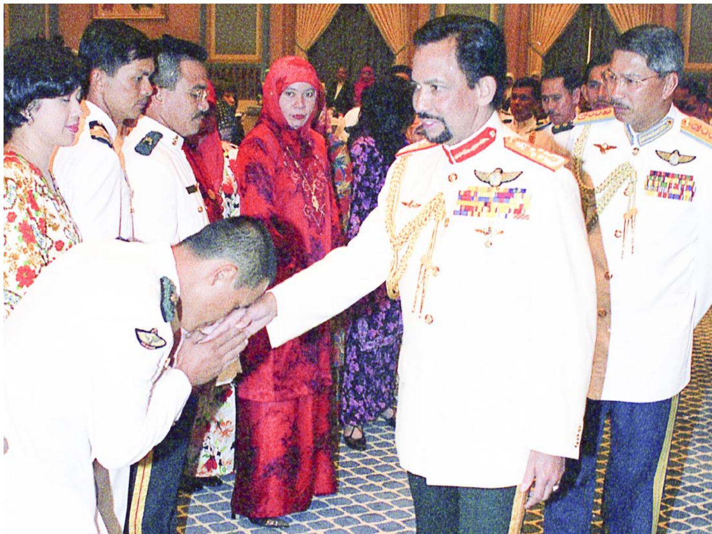
His Majesty Sultan Haji Hassanal Bolkiah Mu'izzaddin Waddaulah ibni Al-Marhum Sultan Haji Omar 'Ali Saifuddien Sa'adul Khairi Waddien, Sultan and Yang Di-Pertuan of Brunei Darussalam receiving junjung ziarah greetings from the officers and staff members of the Royal Brunei Armed Forces at the banquet.