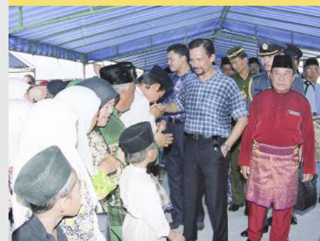
13 Junjung Ziarah ceremonies with His Majesty