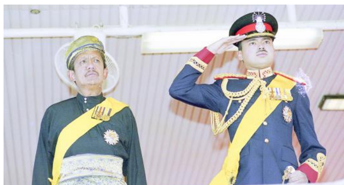
His Royal Highness Prince Haji Al-Muhtadee Billah, the Crown Prince (right) and His Royal Highness Prince Haji Sufri Bolkiah (left) during the ceremony.