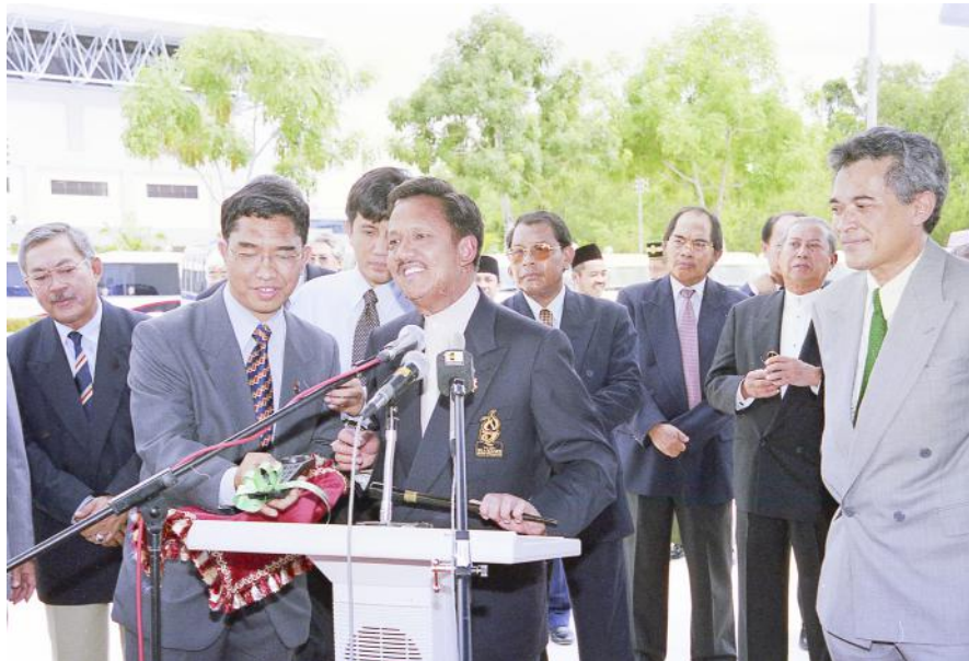
His Royal Highness Prince Haji Sufri Bolkiah ibni Al-Marhum Sultan Haji Omar 'Ali Saifuddien Sa'adul Khairi Waddien launching the Opening of the Prime Celebration Quiz '99 at the Indoor Stadium, Hassanal Bolkiah National Sports Complex.

The competition also gave out prizes for winners up to the ninth place.