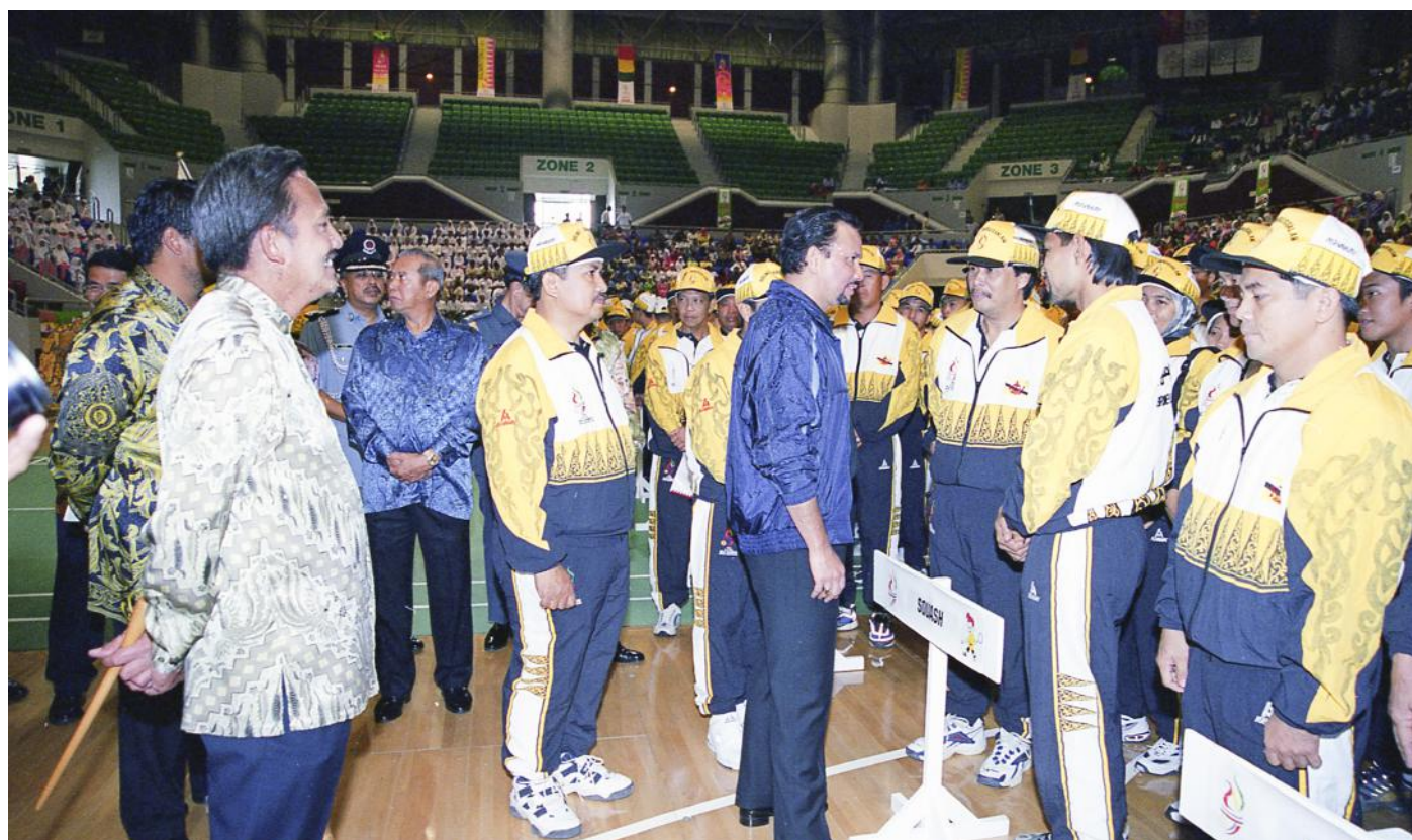
His Majesty the Sultan and Yang Di-Pertuan of Brunei Darussalam during the meet-and-greet session with Brunei Darussalam athletes to the 20 th SEA Games at the Indoor Stadium.

His Majesty's presence at the event demonstrated his support in the hopes of motivating the athletes to perform better in achieving success.