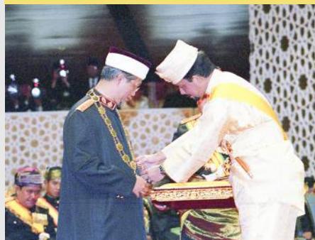
7 His Majesty graces Audience and Investiture Ceremony