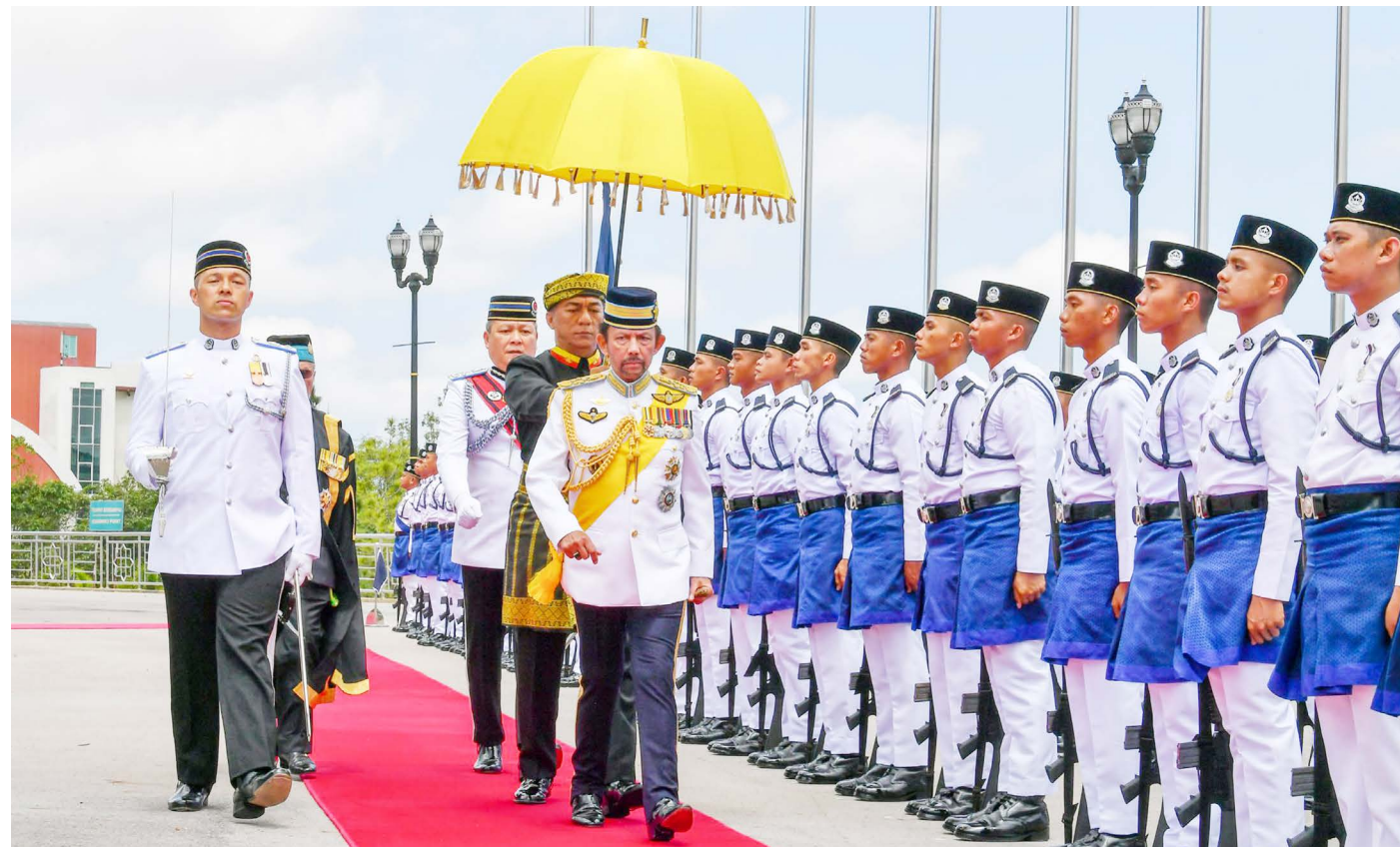
His Majesty the Sultan and Yang Di-Pertuan of Brunei Darussalam inspects a Guard of Honour mounted by 108 personnel of the Royal Brunei Police Force.