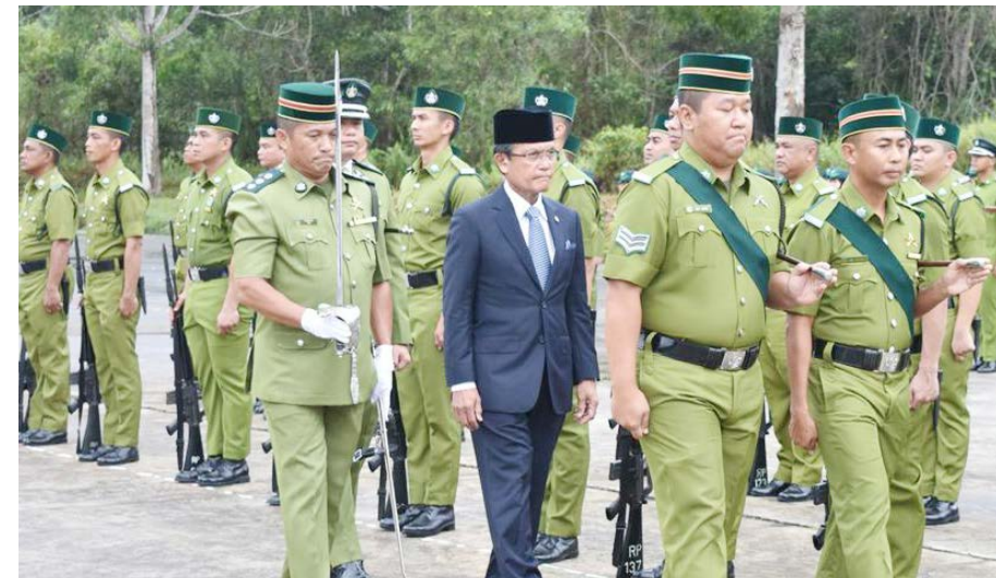
Yang Berhormat Pehin Orang Kaya Seri Kerna Dato Seri Setia (Dr.) Haji Awang Abu Bakar bin Haji Apong, Minister of Home Affairs inspects the Guard of Honour.