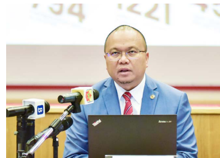
15. MoH appreciate volunteers dedication