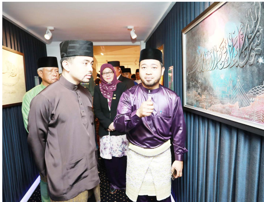
His Royal Highness Prince 'Abdul Malik takes a closer look at the work of Calligraphy Art in the Gallery space.