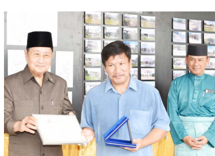
21. 6 receive new house keys