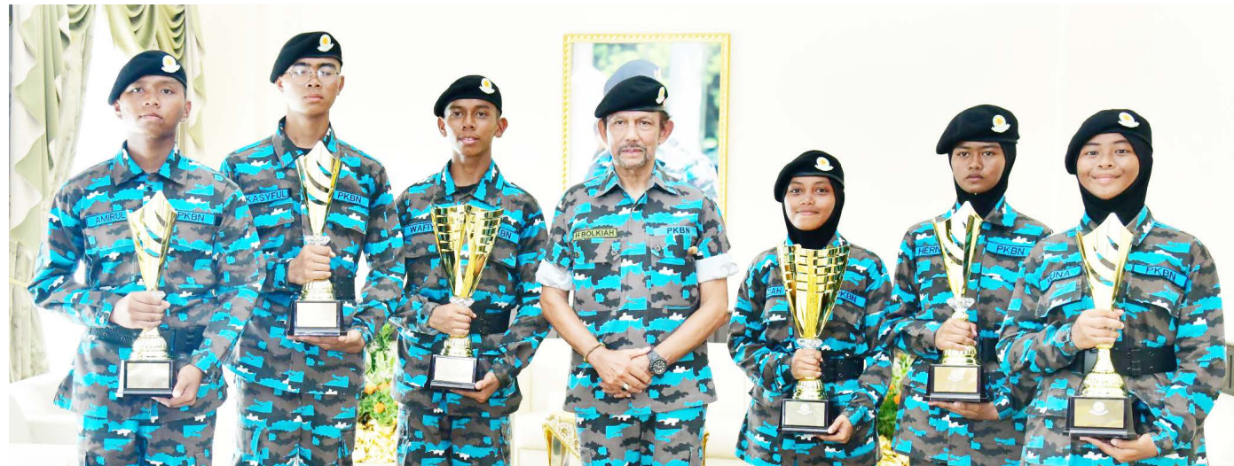
His Majesty Sultan Haji Hassanal Bolkiah Mu'izzaddin Waddaulah, Sultan and Yang Di-Pertuan of Brunei Darussalam in a group photo with the Overall Best Male and Female Trainees.

Since its formation, PKBN has produced two thousand and nine hundred, thirty (2,930) alumni. They were trained by 150 people consisting of supervisors, instructor, medical staff and operators from various organisation to shape youth, who are disciplined and prepared to face changes.