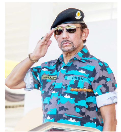
His Majesty the Sultan and Yang Di-Pertuan of Brunei Darussalam receives salute from the Passing Out Parade of PKBN trainees.

“Because the goal of the training was not just to develop youth, but the youth that are built were also heroes who can join the fieldwork with the community at any