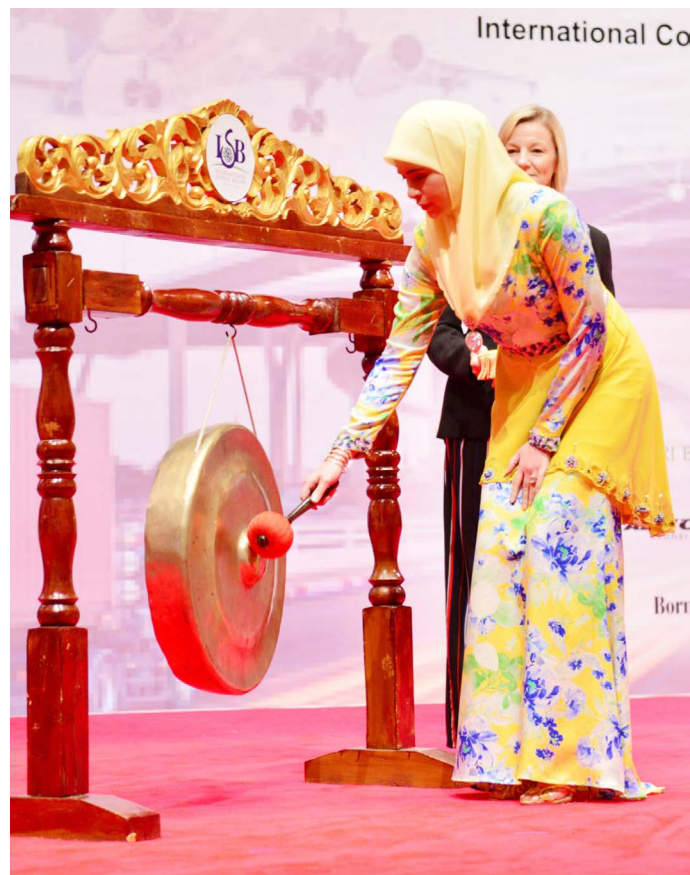
Her Royal Highness Paduka Seri Pengiran Anak Isteri Pengiran Anak Sarah binti Pengiran Haji Salleh Ab. Rahaman launches Borneo Global Issues Conference (BGIC), International School Brunei (ISB).

Her Royal Highness presents an appreciation gift to one of the working paper presenters.