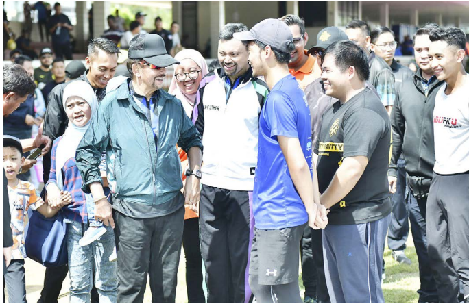
His Majesty the Sultan and Yang Di-Pertuan of Brunei Darussalam get-together with citizens and residents at the Taman Haji Sir Muda Omar 'Ali Saifuddin.