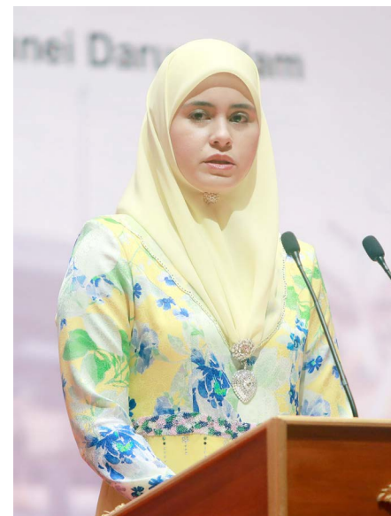
Her Royal Highness Paduka Seri Pengiran Anak Isteri Pengiran Anak Sarah binti Pengiran Haji Salleh Ab. Rahaman delivers a sabda (royal speech) at the Opening Ceremony of the International School Brunei (ISB) Borneo Global Issues Conference (BGIC) at the International Convention Centre in Berakas.

BANDAR SERI BEGAWAN, March 7 - This year's Borneo Global Issues Conference (BGIC), International School Brunei (ISB) theme 'Youths Call for More Sustainable Cities and Communities' aims to promote youths and community leaders towards achieving Brunei Vision 2035.