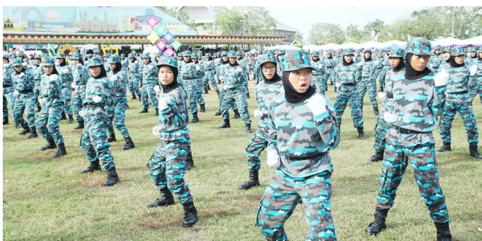
A performance by National Service Programme trainees.

Besides cycling, His Majesty and the royal family also took a closer look at the festivities of ‘Bandarku Ceria’ with