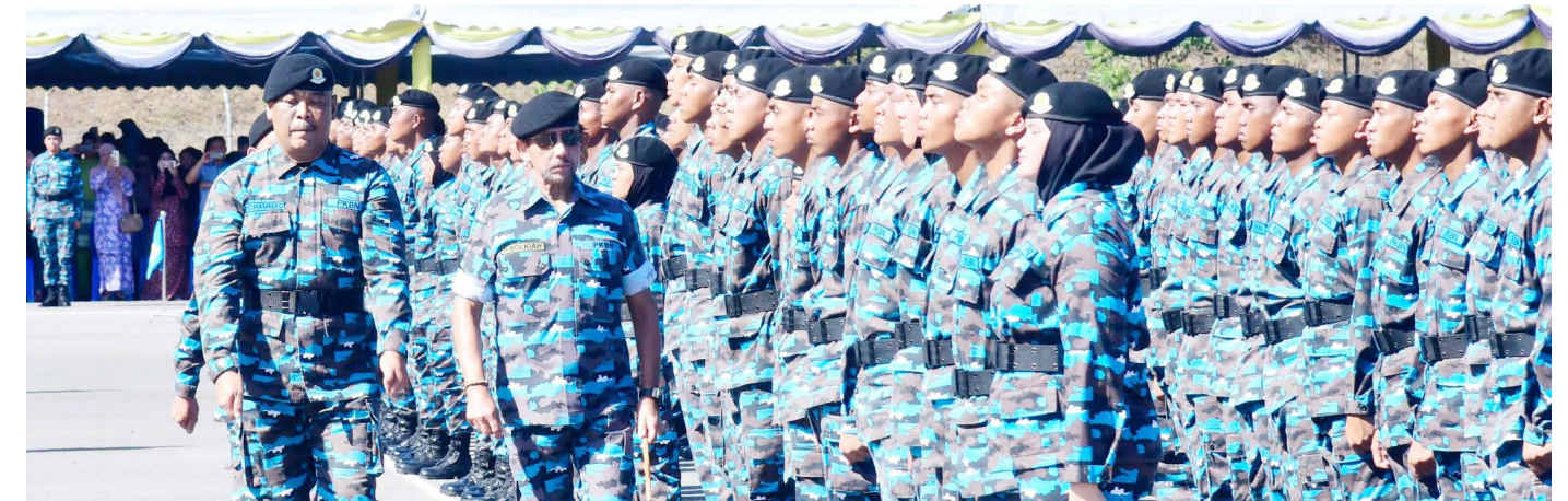
His Majesty Sultan Haji Hassanal Bolkiah Mu'izzaddin Waddaulah ibni Al-Marhum Sultan Haji Omar 'Ali Saifuddien Sa'adul Khairi Waddien, Sultan and Yang Di-Pertuan of Brunei Darussalam inspected the parade comprising a total 393 trainee of the 9 th National Service Programme (PKNB) intake after successfully completing 15 weeks of training beginning in December 2019.