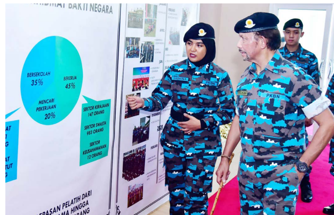
His Majesty the Sultan and Yang Di-Pertuan of Brunei Darussalam receives a short brief from the PKBN Alumni Association Committee during the tour exhibition.