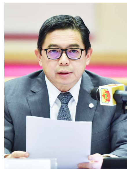
Yang Berhormat Dato Seri Setia Dr. Awang Haji Mohd. Amin Liew bin Abdullah, Minister at the Prime Minister's Office and Minister of Finance and Economy II at a press conference.

BANDAR SERI BEGAWAN, March 30 - The Ministry of Finance and Economy (MoFE) is deferring all business, personal and property loans in a new stimulus package that raises the total economic relief provided by the government amid the COVID-19 outbreak to $450 million.