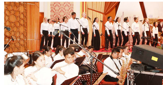
A musical performance by ISB students.

The four-day conference, which runs until March 9, was attended by 25 schools comprising of ISB, Colleges and Schools in the country with the aim of expanding student's understanding of global citizenship.