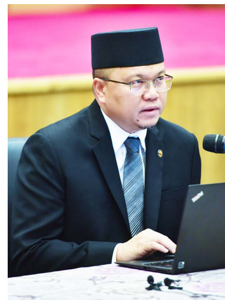
Yang Berhormat Dato Seri Setia Dr. Awang Haji Md. Isham bin Haji Jaafar, Minister of Health at a press conference.

BERAKAS, March 31 - Two new case of COVID-19 infection in the country, bringing the total number of cases in Brunei Darussalam to 129 people announced Yang Berhormat Dato Seri Setia Dr. Awang Haji Md. Isham bin Haji Jaafar, Minister of Health at the Media