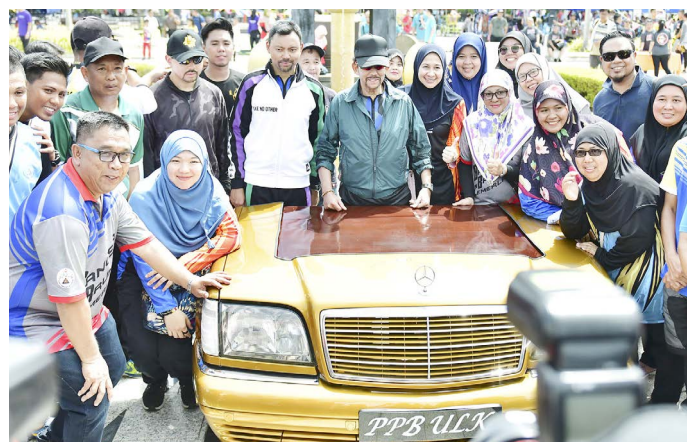
His Majesty and other members of the Royal Family in a group photo in front of a replica of an antic car on display in ‘Bandarku Ceria’.

various activities, festivals and performances prepared by 13 ministries, National Youth and Sports Associations, National Service Programme (PKBN) and Brunei Darussalam Contingent to the SEA Games 2019 in the Philippines.