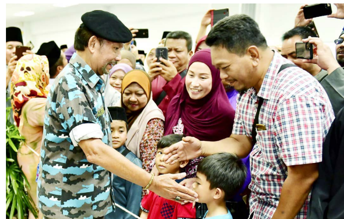
His Majesty greets by members of the public.