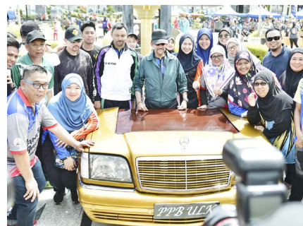
6. 'Semangat Kebangsaan 2020' Cycling Recreation towards a healthy community