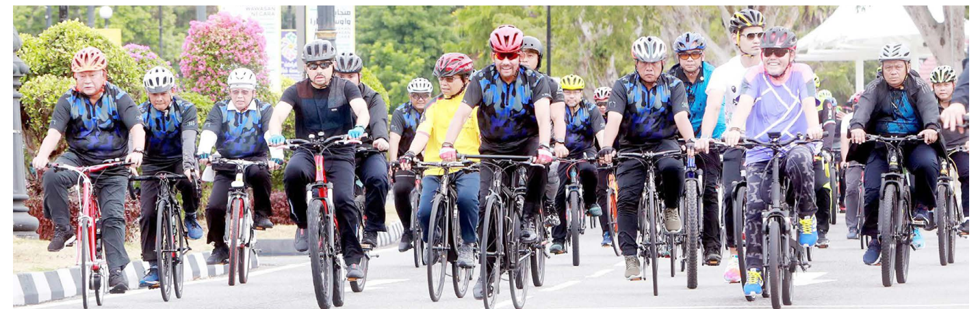
His Majesty Sultan Haji Hassanal Bolkiah Mu'izzaddin Waddaulah ibni Al-Marhum Sultan Haji Omar 'Ali Saifuddin Sa'adul Khairi Waddien, Sultan and Yang Di-Pertuan of Brunei Darussalam joined the 'Semangat Kebangsaan 2020' Recreational Cycling, which further enlivened the atmosphere in conjunction with the 36 th National Day.

BANDAR SERI BEGAWAN, March 1 - 'Semangat Kebangsaan 2020' Recreational Cycling not only combines aspects of healthy living and recreation but unites the nation through an appreciation of sports culture and a comprehensive community involvement that leads toward healthy citizens, which is crucial in achieving Brunei Vision 2035.