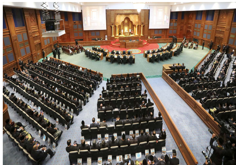
Atmosphere at the Legislative Council (LegCo) Conference Hall of the First Meeting of the 16 th LegCo session.