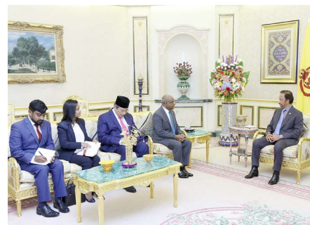
3. His Majesty receives audience