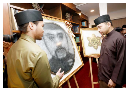
13. Gallery of the Yayasan Islamic Calligraphy and Arts Studies Centre launches