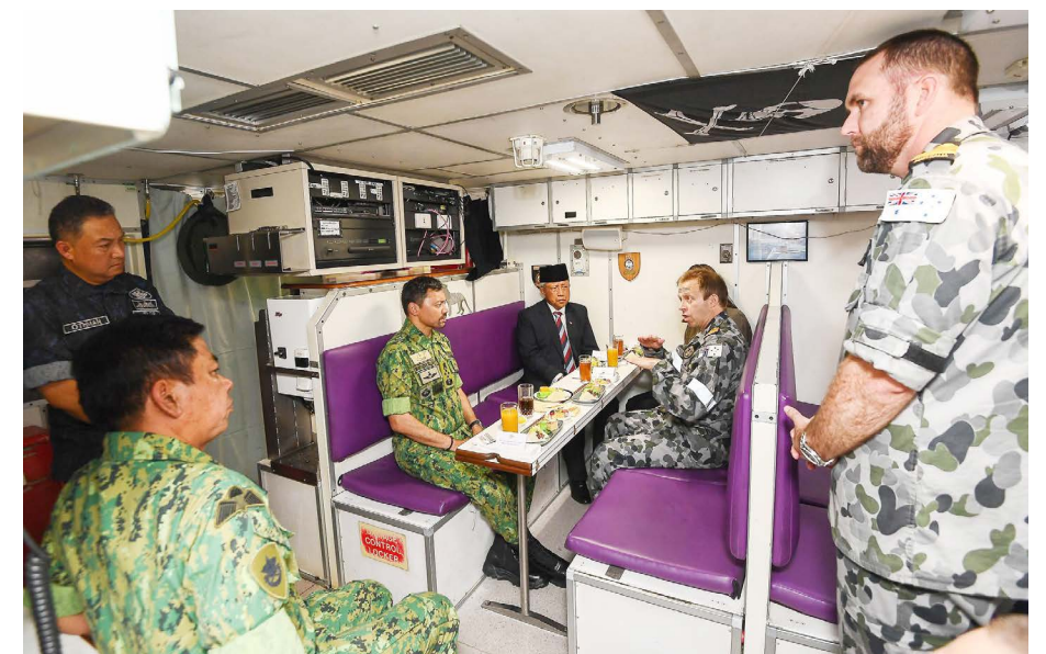
His Royal Highness was given a short briefing about to the Australian Collins Class Submarine HMAS Dechaineux.

The submarine also boasts a range of features including a high-performance hull form, highly automated controls, high shock resistance and an efficient weapons handling and discharge system.