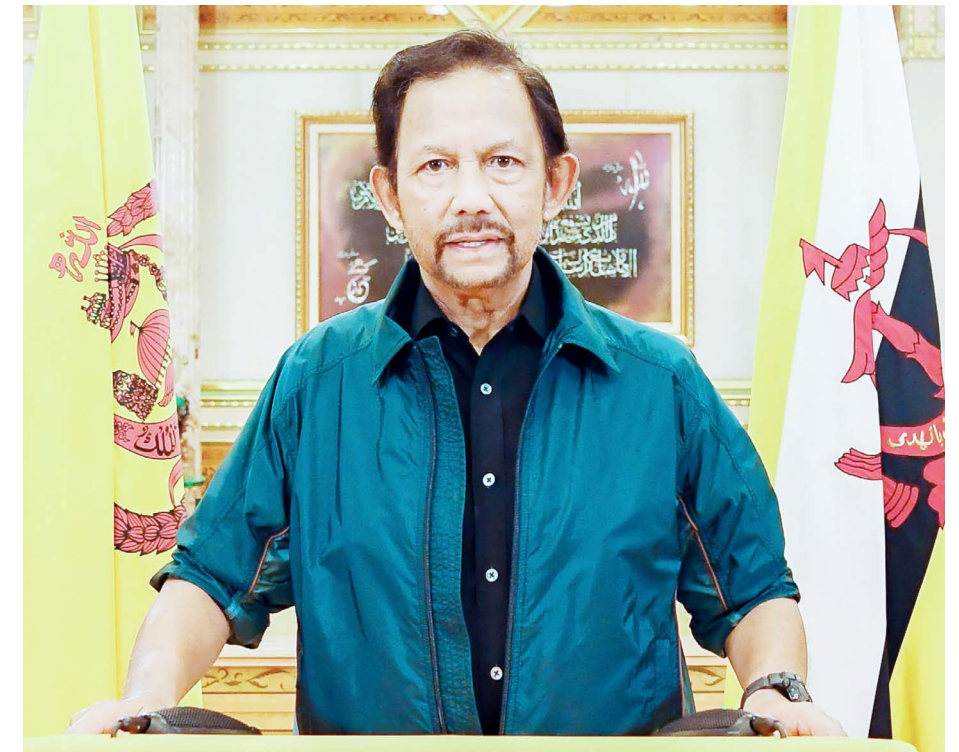
His Majesty Sultan Haji Hassanal Bolkiah Mu'izzaddin Waddaulah ibni Al-Marhum Sultan Haji Omar 'Ali Saifuddien Sa'adul Khairi Waddien, Sultan and Yang Di-Pertuan of Brunei Darussalam delivers in a special titah (royal speech) on the COVID-19 Pandemic held at Istana Nurul Iman.

The government, through the Ministry of Health has taken steps to enhance human resource capacity, not only in terms of doctors and nurses but also clinical capability.