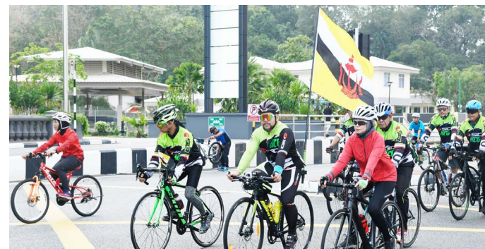
The march past led by 36 cyclists from four districts who have completed the 36-kilometre route.

The success of the event has been even more meaningful with active participation from all parties through the Whole of Government and Nation approach involving the entire community including non-governmental or NGO’s in carrying out the tasks and trusts provided in making this cycling adventure successful.