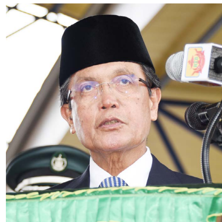
Yang Berhormat Pehin Orang Kaya Seri Kerna Dato Seri Setia (Dr.) Haji Awang Abu Bakar bin Haji Apong, Minister of Home Affairs delivers a speech at the Parade ceremony in conjunction with the 66 th Anniversary of the Prisons Department.

In addition, the Minister explained that in strengthening the management of prisons, the Prisons Department should plan for