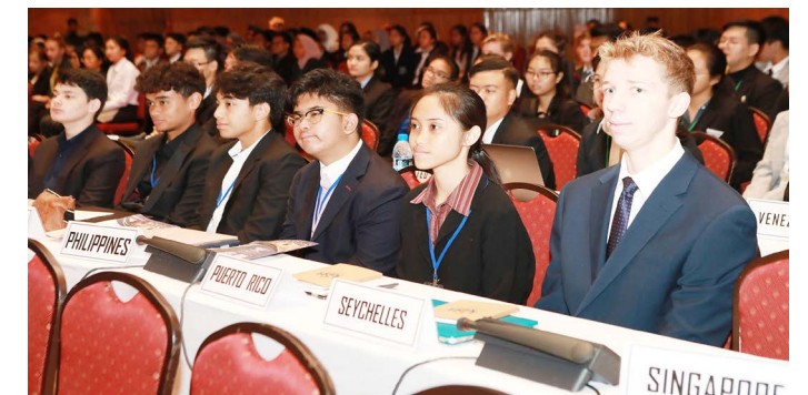
Participants at the conference.