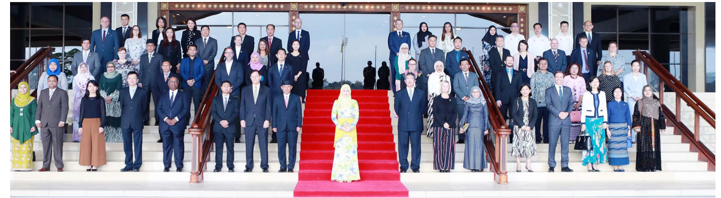
Her Royal Highness in a group photo with committee members of the 16 th ISB BGIC.