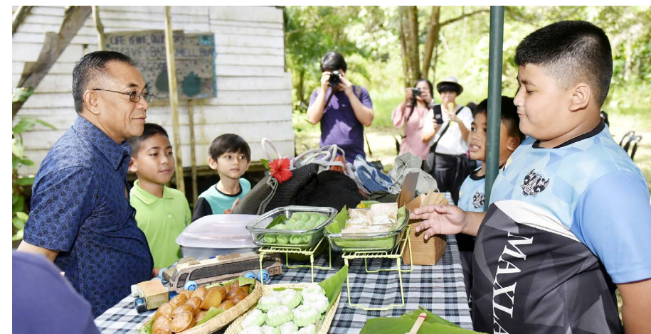
Yang Berhormat Dato Seri Setia Awang Haji Ali bin Apong, Minister of Primary Resources and Tourism with vendors at the Farmer's Market.

LAMUNIN, March 8 - React Company and Eco Ponies Garden has organised a Farmer's Market dubbed 'Re/Think Food'in conjunction with Brunei Gastronomy Week 2020 (BGW 2020) which also coincided with the International Women's Day 2020.