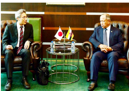
21. Close bilateral and multilateral defence relations