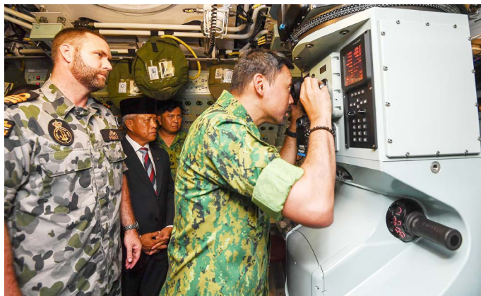
His Royal Highness takes a closer look at the facilities available in HMAS Dechaineux.