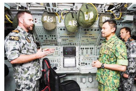
10. His Royal Highness visits HMAS Dechaineux