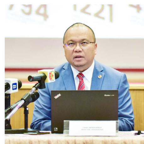
Yang Berhormat Dato Seri Setia Dr. Awang Haji Md. Isham bin Haji Jaafar, Minister of Health at a press conference.

BANDAR SERI BEGAWAN, March 26 - The Minister of Health (MoH) expressed his appreciation for the assistance provided by volunteers in the government's effort to control the spread of the COVID-19 outbreak in the country.