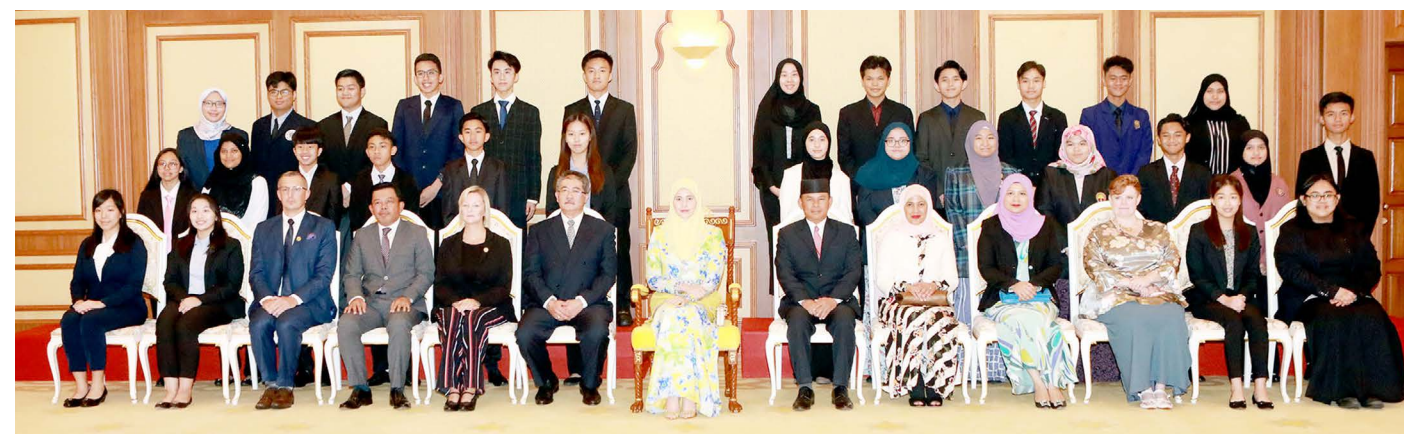
Her Royal Highness in a group photo with participants who attend the conference.