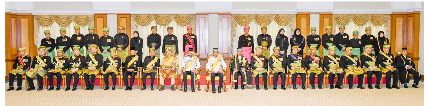
His Majesty the Sultan and Yang Di-Pertuan of Brunei Darussalam and other members of the Royal Family in a group photo with the members of the Legislative Council (LegCo).