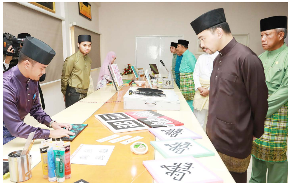
His Royal Highness taking a closer look at Islamic Calligraphy writing.