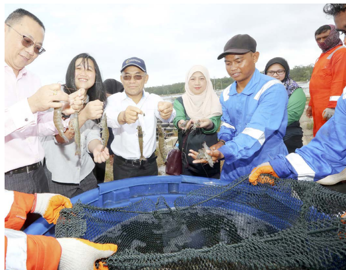
Yang Berhormat Dato Seri Setia Awang Haji Ali bin Haji Apong, Minister of Primary Resources and Tourism takes a closer look at the prawn harvest.

Golden Corporation Sdn. Bhd. also has integrated company for the entire prawns breeding chain, ranging from breeds