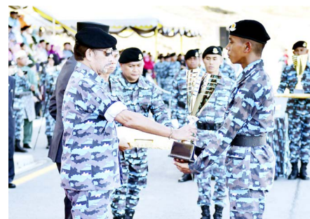
7. PKBN shape youths into high quality human resource models