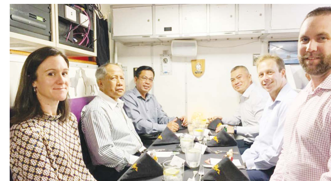
Yang Berhormat Pehin Datu Lailaraja Major General (Rtd) Dato Paduka Seri Haji Awang Halbi bin Haji Mohd. Yussof, Second Minister of Defence during the dinner reception aboard the Australian Collins Class Submarine HMAS Dechaineux.

The first submarine to dock in Brunei Darussalam will be from March 7 until Mac 9, 2020.