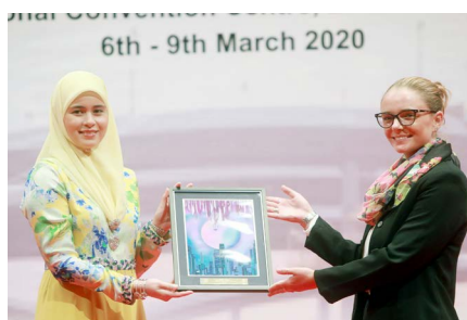
11. Smart City initiatives as a viable strategy