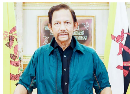
9. Trust in Allah the Almighty as the foundation of determination