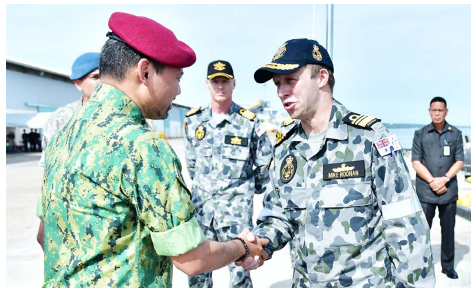
His Royal Highness Prince Haji Al-Muhtadee Billah receives junjung ziarah from Commanding Officer of the Royal Australian Navy.