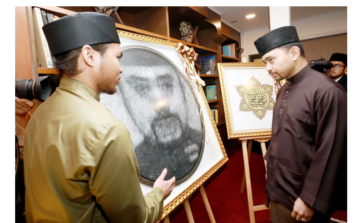
His Royal Highness Prince 'Abdul Malik ibni His Majesty Sultan Haji Hassanal Bolkiah Mu'izzaddin Waddaulah receives a pesembah a string art portrait of His Royal Highness.