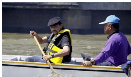
7 His Majesty participates in Brunei Darussalam Regatta 2013