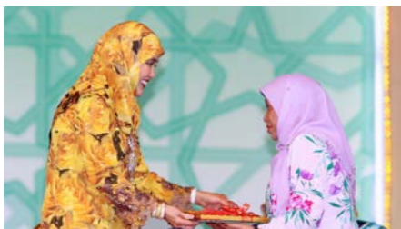
13 Her Majesty graces the 19 th Special Women Assembly