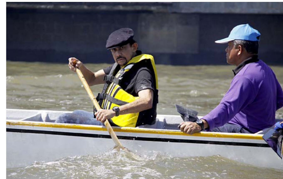
His Majesty Sultan Haji Hassanal Bolkiah Mu'izzaddin Waddaulah ibni Al-Marhum Sultan Haji Omar 'Ali Saifuddin Sa'adul Khairi Waddien, Sultan and Yang Di-Pertuan of Brunei Darussalam consented to lead Committee Team 'A' for the Fibre Glass 15 Rowers Race.

Among the invited guests were heads of states, foreign diplomats in the country, heads and senior officers of government departments and private sector, as well as penghulus and village heads.