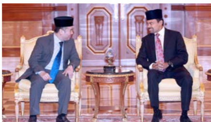
14 HRH Crown Prince receives Crown Prince of Kelantan