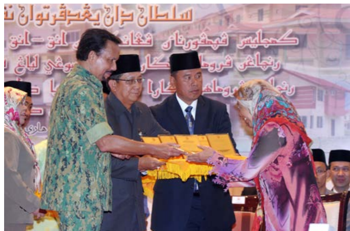
His Majesty Sultan Haji Hassanal Bolkiah Mu'izzaddin Waddaulah ibni Al-Marhum Sultan Haji Omar 'Ali Saifuddien Sa'adul Khairi Waddien, The Sultan and Yang Di-Pertuan of Brunei Darussalam consented to award housekeys to recipients under the National Housing Plan and the Rakyat Jati Land Award Scheme in the Belait District.