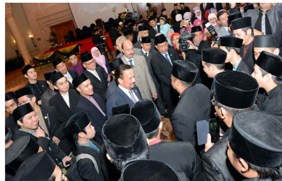
His Majesty The Sultan and Yang Di-Pertuan of Brunei Darussalam, Sultan and Yang Di-Pertuan of Brunei Darussalam consented to mingle with the students currently undergoing studies in Egypt.

On the welfare of the students, His Majesty consented for the government to bear the cost of up-front payment and a guarantee to lease a building for the purpose of the students' activities. His Majesty also consented to a specific allowance rate for students pursuing their Master's-level studies in Egypt and consented for the balance of the allowances to be aligned with the new rate.