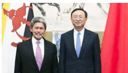
18 His Royal Highness Prince Mohamed Bolkiah holds bilateral talks