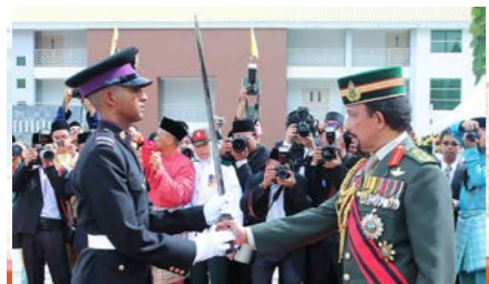
1 His Majesty at the 8 th Officers Cadet School Sovereign Parade