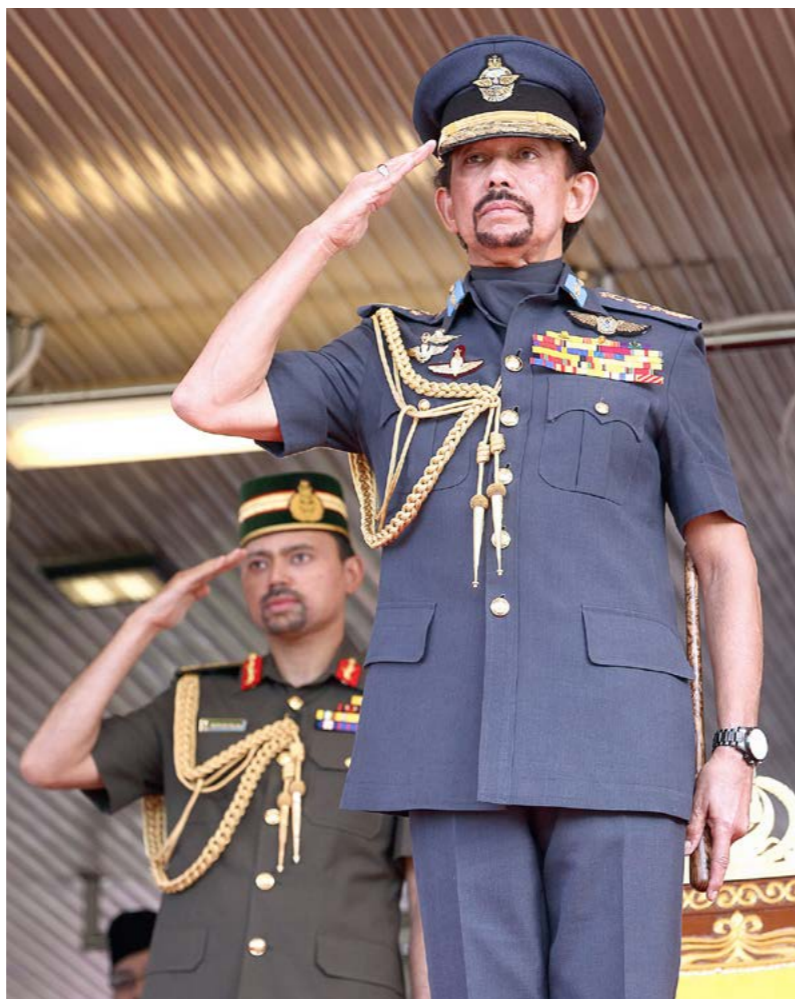
His Majesty Sultan Haji Hassanal Bolkiah Mu'izzaddin Waddaulah ibni Al-Marhum Sultan Haji Omar 'Ali Saifuddien Sa'adul Khairi Waddien, Sultan and Yang Di-Pertuan of Brunei Darussalam at the 29th National Day Celebration of Brunei Darussalam at the Taman Haji Sir Muda Omar 'Ali Saifuddien in Bandar Seri Begawan.

The procession was led by teams carrying the giant Brunei Darussalam national flag followed by the flag bearing the National Day logo.