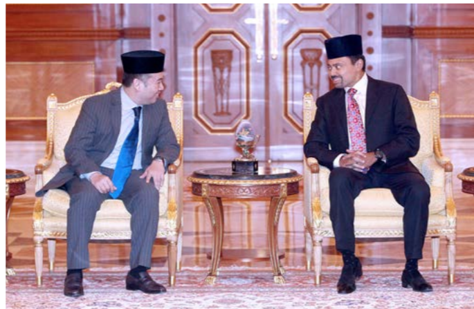
His Royal Highness Prince Haji Al-Muhtadee Billah ibni Sultan Haji Hassanal Bolkiah Mu'izzaddin Waddaulah, The Crown Prince and Senior Minister at The Prime Minister's Office and His Royal Highness Tengku Muhammad Fa-iz Petra ibni Sultan Ismail Petra, The Crown Prince of Kelantan.

BANDAR SERI BEGAWAN, February 9 - His Royal Highness Prince Haji Al-Muhtadee Billah ibni Sultan Haji Hassanal Bolkiah Mu'izzaddin Waddaulah, The Crown Prince and Senior Minister at The Prime Minister's Office welcomed the arrival of His Royal Highness Tengku Muhammad Fa-iz Petra ibni Sultan Ismail Petra, The Crown Prince of Kelantan at a luncheon held at Qashr Al-Meezaan.