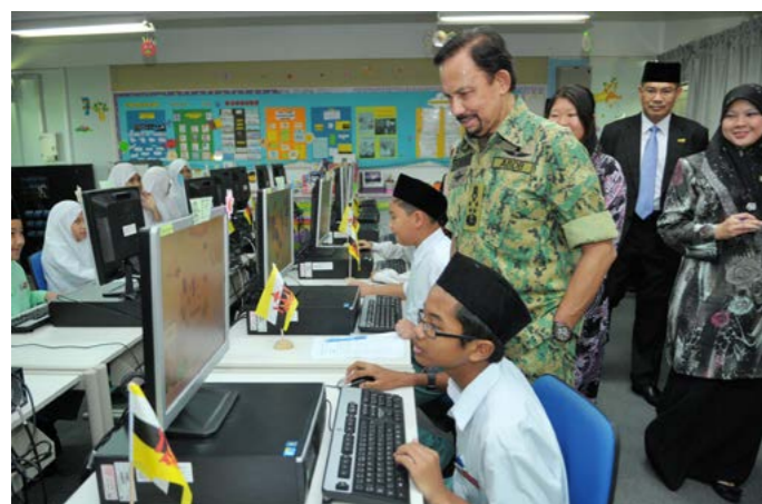
His Majesty Sultan Haji Hassanal Bolkiah Mu'izzaddin Waddaulah ibni Al-Marhum Sultan Haji Omar 'Ali Saifuddien Sa'adul Khairi Waddien, Sultan and Yang Di-Pertuan of Brunei Darussalam consented to visit classes and interact with students.

At Pengiran Jaya Negara Pengiran Haji Abu Bakar Secondary School, His Majesty was presented with a Taekwondo performance by the taekwondo club and the SINAR briefing organised by the Career and Counselling department of the school. The school is made up of 992 students and 107 teachers.