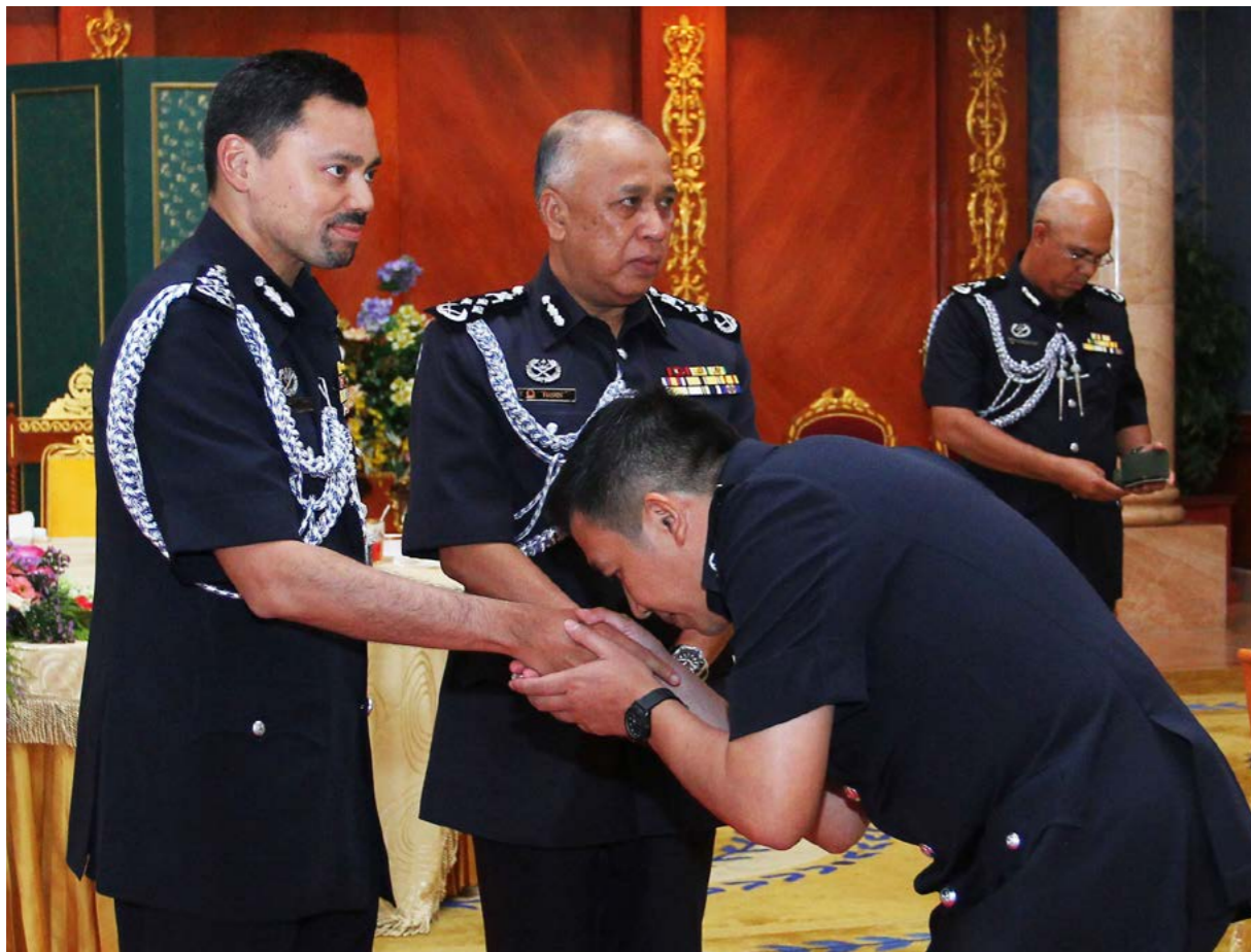
His Royal Highness Prince Haji Al-Muhtadee Billah ibni His Majesty Sultan Haji Hassanal Bolkiah Mu'izzaddin Waddaulah, the Crown Prince and Senior Minister at the Prime Minister's Office, and Deputy Inspector General of Police, Royal Brunei Police Force (RBPf) consented to receive junjung ziarah greetings from RBPf officers.