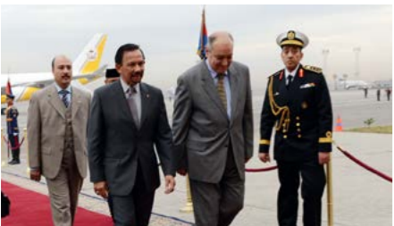
8 His Majesty consents to attend the 12 th OIC Summit