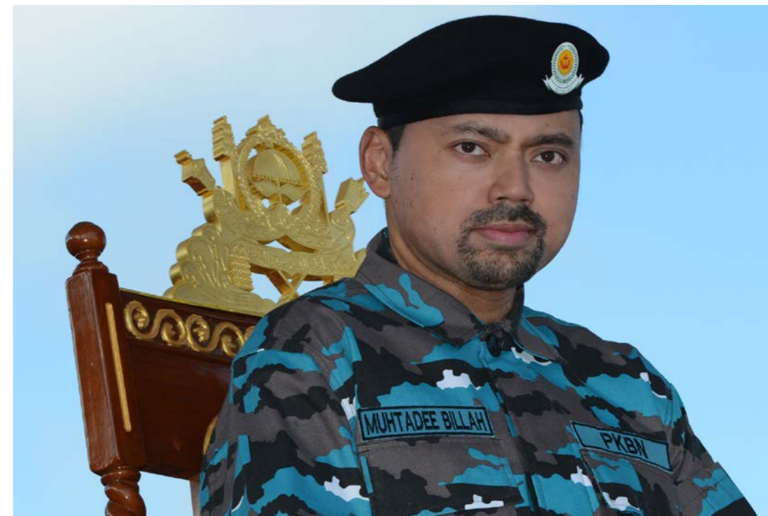
His Royal Highness Prince Haji Al-Muhtadee Billah ibni His Majesty Sultan Haji Hassanal Bolkiah Mu'izzaddin Waddaulah, The Crown Prince and Senior Minister at the Prime Minister's Office, at the National Service Programme (PKBN) Third Intake Training Camp at the Sports Village, Hassanal Bolkiah National Sports Complex.

His Royal Highness was appointed as Deputy Inspector General of Police on 5 May 2005 by His Majesty the Sultan and Yang Di-Pertuan of Brunei Darussalam where since then His Royal Highness regularly conducts working visits to the Royal Brunei Police Force to examine closely the roles and responsibilities of the Royal Brunei Police force as the oldest law enforcement agency in the country.