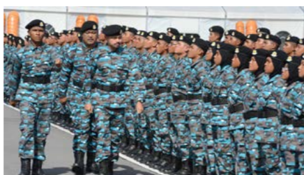
17 His Royal Highness Prince Haji Al-Muhtadee Billah visits PKBN Camp