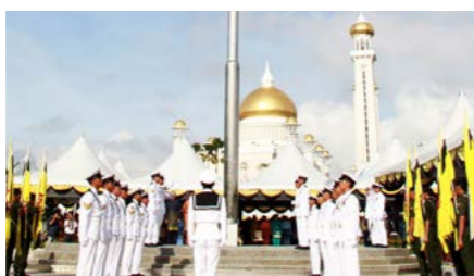
20 National Flag hoisted to celebrate 29 th National Day