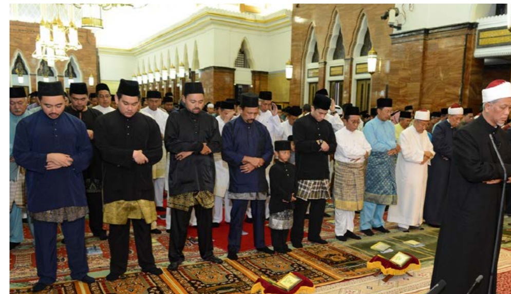
His Majesty The Sultan and Yang Di-Pertuan of Brunei Darussalam during the mass prayers held in conjunction with the 29th National Day celebration.

Before leaving the mosque, His Majesty consented to receive junjung ziarah greetings from the attendees.