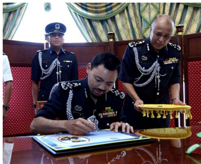
His Royal Highness Prince Haji Al-Muhtadee Billah consented to sign the Royal Parchment.

Before leaving the ceremony, His Royal Highness and