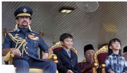
12 His Majesty attends National Day mass gathering