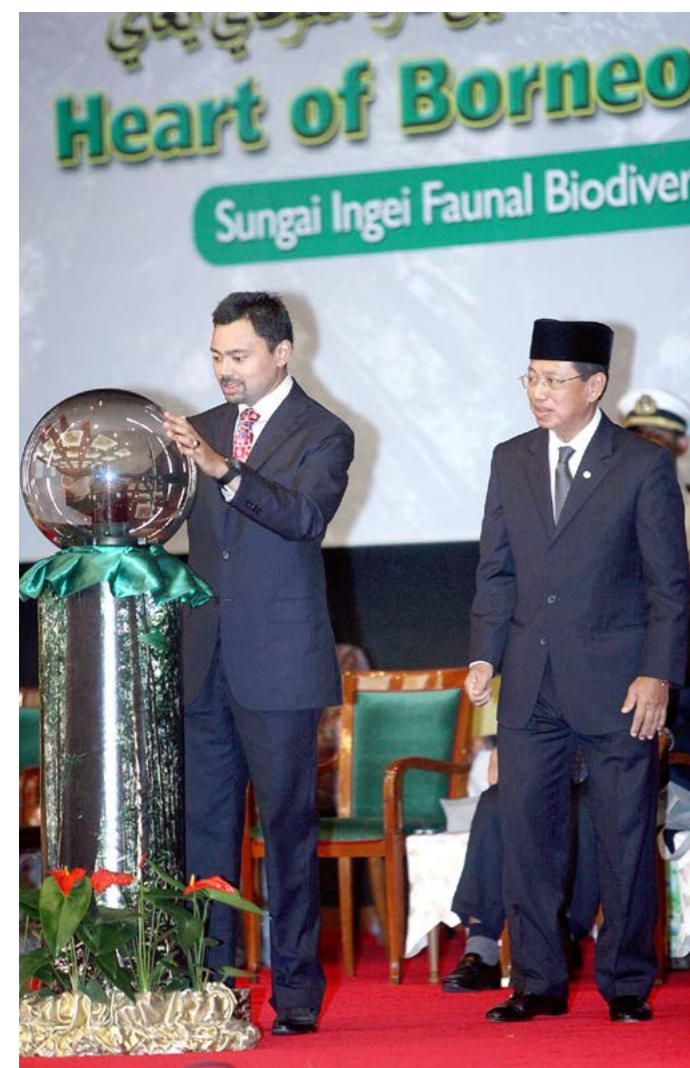
His Royal Highness Prince Haji Al-Muhtadee Billah ibni His Majesty Sultan Haji Hassanal Bolkiah Mu'izzaddin Waddaulah, The Crown Prince and Senior Minister as the Royal Patron of the Brunei Darussalam Heart of Borneo National Council officially launched the HoB Seminar for Sungai Ingei Faunal Expedition Project.

JERUDONG, FEBRUARY 9 - Brunei Darussalam needs to continue efforts in preservations explored by the Government of His Majesty the Sultan and Yang Di-Pertuan of Brunei Darussalam through the Ministry of Industry and Primary Resources to ensure protected forest environment can be maintained all the time and inherited by generations to come.