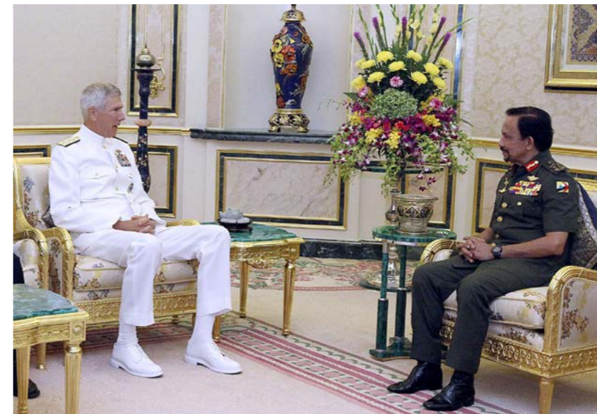
His Majesty Sultan Haji Hassanal Bolkiah Mu'izzaddin Waddaulah ibni Al-Marhum Sultan Haji Omar 'Ali Saifuddien Sa'adul Khairi Waddien, The Sultan and Yang Di-Pertuan of Brunei Darussalam and Supreme Commander of Royal Brunei Armed Forces consented to receive in audience His Excellency Admiral Samuel J. Locklear III, Commander of the United States Pacific Command.

BANDAR SERI BEGAWAN, February 4 - His Majesty Sultan Haji Hassanal Bolkiah Mu'izzaddin Waddaulah ibni Al-Marhum Sultan Haji Omar 'Ali Saifuddien Sa'adul Khairi Waddien, Sultan and Yang Di-Pertuan of Brunei Darussalam and Supreme Commander of Royal Brunei Armed Forces (RBAF) received in audience His Excellency Admiral Samuel J. Locklear III, Commander of the United States Pacific Command at the Istana Nurul Iman. His Excellency is in Brunei Darussalam for a three-day introductory visit.