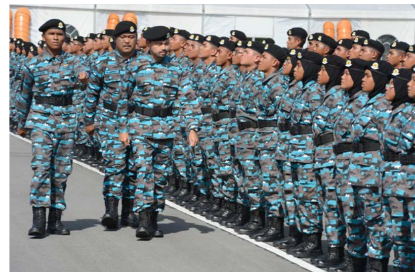
His Royal Highness consented to inspect the PKBN guard of honour.

Before leaving, His Royal Highness consented to sign the Royal Parchment and receive a pesambah. This was followed by junjung ziarah greetings from trainees and trainers as well as a group photo session.