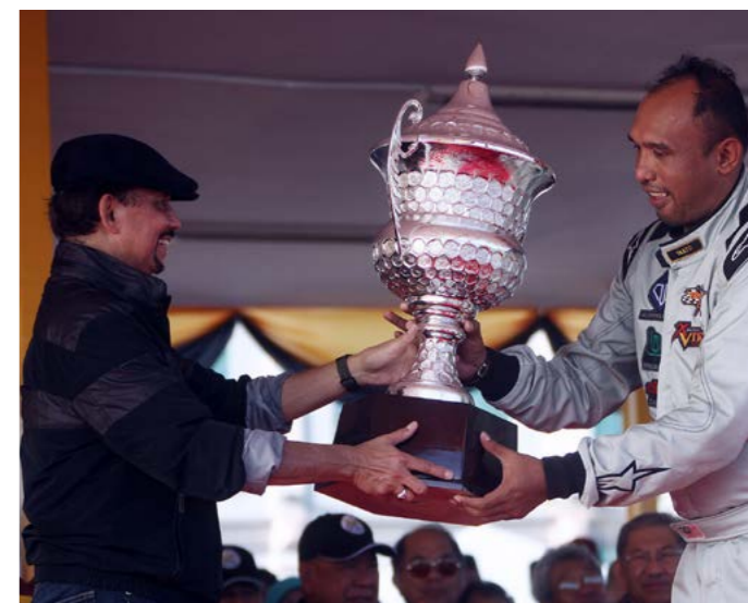
His Majesty Sultan Haji Hassanal Bolkiah Mu'izzaddin Waddaulah consented to award trophies to winners.