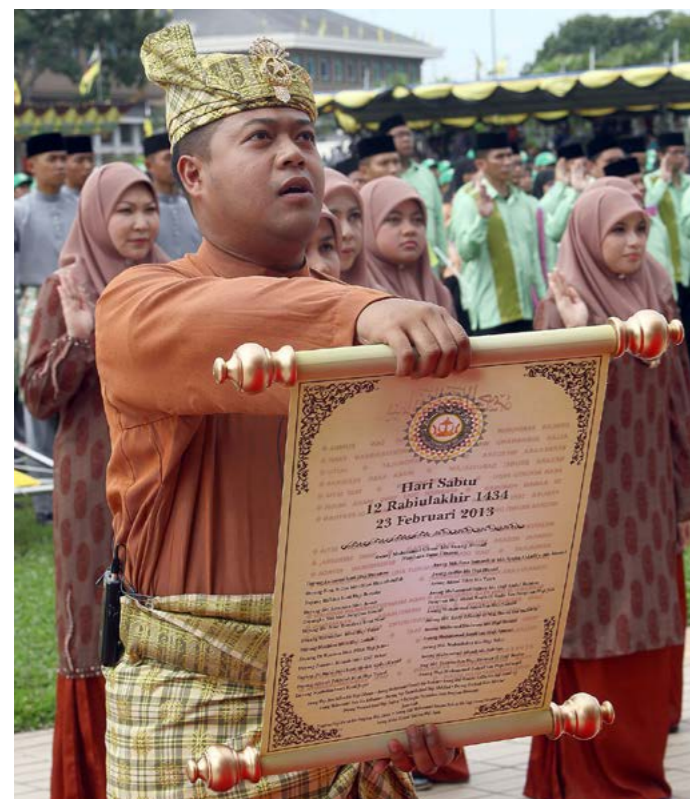
The National Day 'ikrar' (oath) was lead by Awang Muhammad Ghani bin Awang Ahmad.

His Majesty and members of the royal family also witnessed colorful field performances.