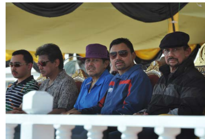
Accompanying His Majesty at the Brunei Regatta were His Royal Highness Prince Haji Al-Muhtadee Billah, The Crown Prince and Senior Minister at the Prime Minister's Office, His Royal Highness Prince Mohamed Bolkiah, His Royal Highness Prince Jefri Bolkiah and His Royal Highness Prince 'Abdul Malik.