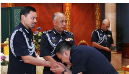
16 His Royal Highness attends birthday High Tea Celebration