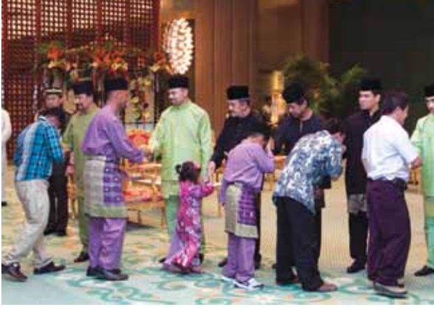
His Majesty and male members of royal family receive greeting from male guests.

BANDAR SERI BEGAWAN, September 3 - A total of 94,431 guests attended this year's Hari Raya Aidilfitri junjung ziarah (revered greetings) to His Majesty The Sultan and Yang Di-Pertuan of Brunei Darussalam, Her Majesty The Raja Isteri and members of the royal family at the Istana Nurul Iman.