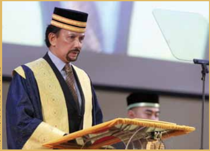
His Majesty gives emphasis on the need to produce capable generations.

TUNGKU, September 29 - Graduates are valuable assets that support the development of the society and country. Thus, they must continue to be produced. However, the quantity alone would not suffice without adequate quality.