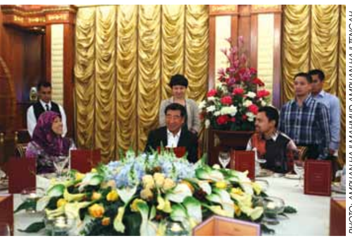
His Royal Highness The Crown Prince, His Excellency and Her Royal Highness at the banquet.

Also present was Her Royal Highness Princess Hajah Masna, Ambassador-at-Large at the Ministry of Foreign Affairs and Trade.