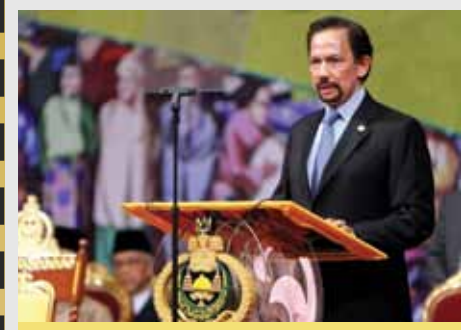
7 July declared as language month