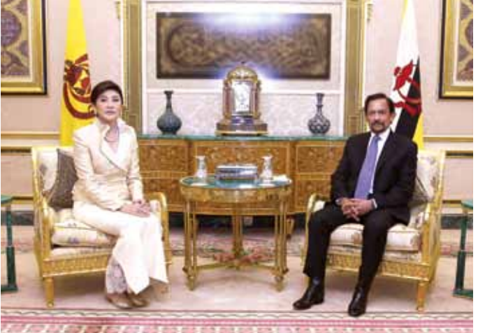
Both leaders during a one-to-one meeting at the Istana Nurul Iman.

BANDAR SERI BEGAWAN, September 10 - Brunei Darussalam and Thailand's bilateral relation has been further strengthened through the official visit by the Prime Minister of Thailand, Her Excellency Yingluck Shinawatra to Brunei Darussalam.