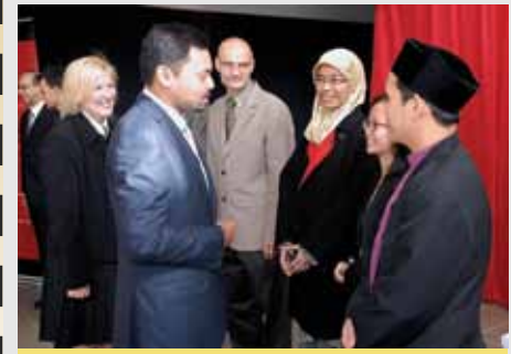
Their Royal Highnesses on official visit to Canada