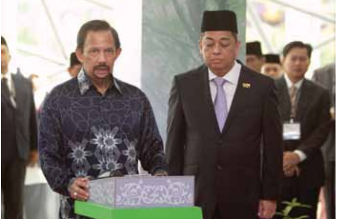
The BEE2011 officially launched by His Majesty.

JERUDONG, September 21 – The Brunei Energy Expo 2011 (BEE2011) seeks to showcase the various activities in Brunei Darussalam's energy sectors as well as a business and investment opportunities in the sector. The exhibitions also enable local, regional and international companies to exhibit their activities, services and products in the energy sectors including those relating to green energy such as solar and others.