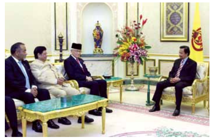
His Excellency E. Ahamed, the Minister of State for External Affairs of India on September 19.