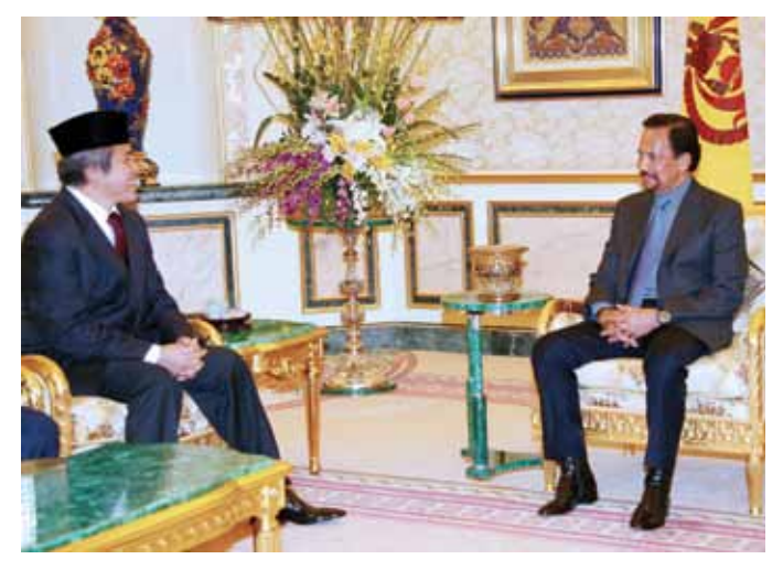
The Honourable Datuk Amar Haji Awang Tengah Ali Hasan, the Second Minister of Planning and Resource Management and Minister of Public Utilities of Sarawak, Malaysia on September 14.