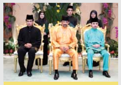
6 Three receive Sultan's Scholar