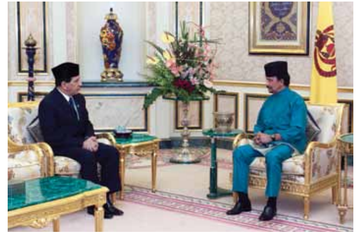
Retired Lieutenant General Sallah Ud'din, the outgoing High Commissioner of the Islamic Republic of Pakistan to Brunei Darussalam on September 19.