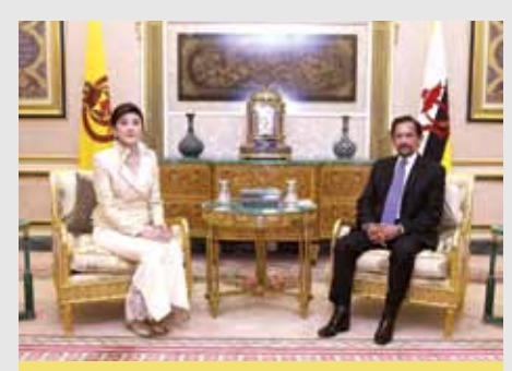
5 Brunei-Thailand: Share close relation