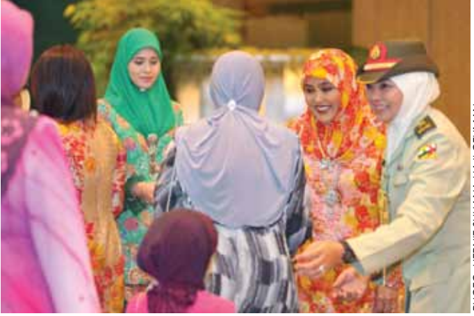
Female guests to the Istana Nurul Iman revered greetings to Her Majesty The Raja Isteri and female members of royal family.

The junjung ziarah (revered greetings) at Istana