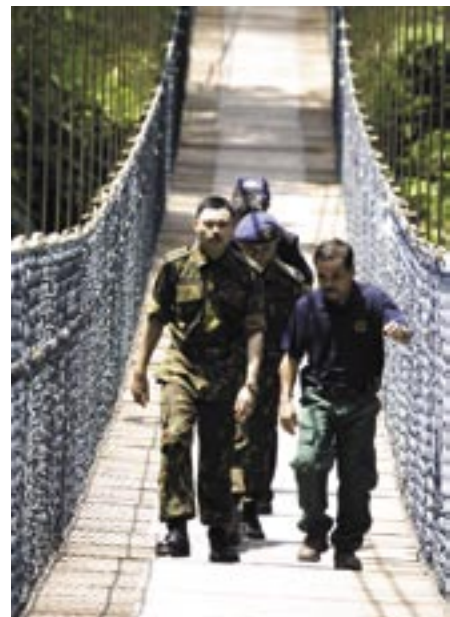
His Royal highness at the canopy walk across Ulu Sungai Temburong.

The visit concluded with a luncheon at the Two River Terrace of the Ulu-Ulu Resort.