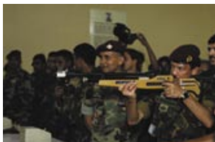
His Majesty consents to try a 'Walther' type-weapon made by India.