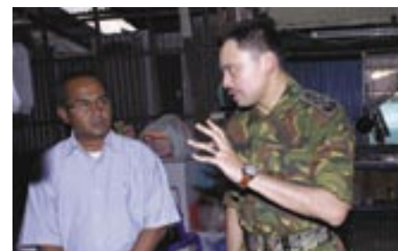
His Royal Highness at one of the house affected by the bad weather conditions in Kampong Ayer.

Kampong Ayer or the water village was hit with strong winds on May 11, 13, 14 and 16 where 53 houses across 12 mukims were affected. Thirteen of