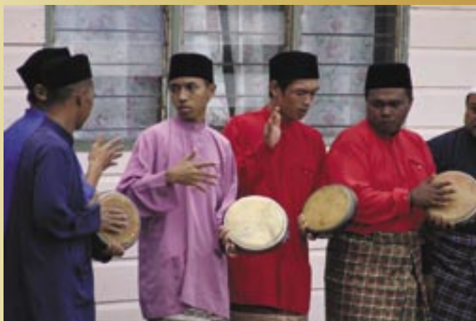
The hadrah group performing at a wedding.