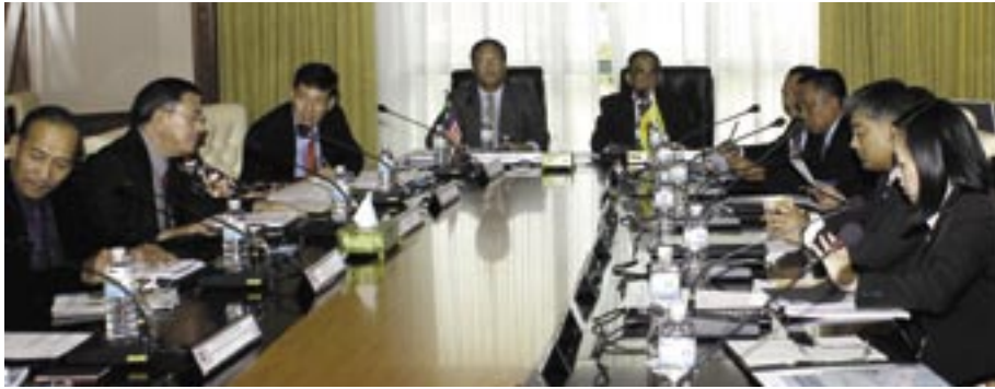
The 12 th annual meeting between Darussalam's Narcotics Control Bureau and the Narcotics Crime Investigation Department of the Royal Malaysian Police.

BANDAR SERI BEGAWAN, June 10 - Brunei Darussalam's Narcotics Control Bureau and the Narcotics Crime Investigation Department of the Royal Malaysian Police held their 12 th annual meeting where, Brunei Darussalam hosted the meeting this year.