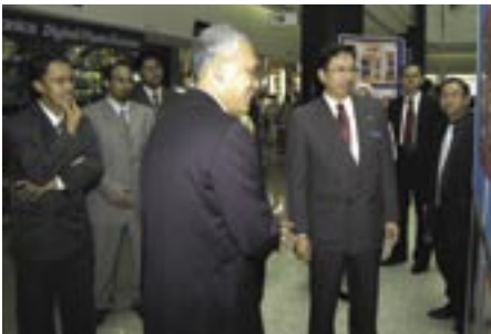
The Deputy Health Minister take a closer look at the exhibition in conjunction with the World Blood Donor day Celebration.

BANDAR SERI BEGAWAN, June 14 - A comprehensive National Blood Centre equipped with its own laboratory facilities will be set up. This is in line with the efforts to ensure an adequate and safe supply of blood.