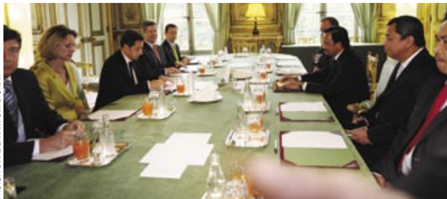
His Majesty The Sultan and Yang Di-Pertuan of Brunei Darussalam at the bilateral meeting with the President of the Republic of France, His Excellency Nicolas Sarkozy at the President Palace.

Brunei established diplomatic relations with France in 1984. Bilateral relations between the two countries have since seen positive progress. His Majesty last visited France in 1994.