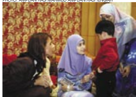
Her Royal Highness interacts with one of the autistic children.