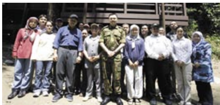
His Royal Highness in a group photo with officers and staffs of Belalong Field Research Centre.