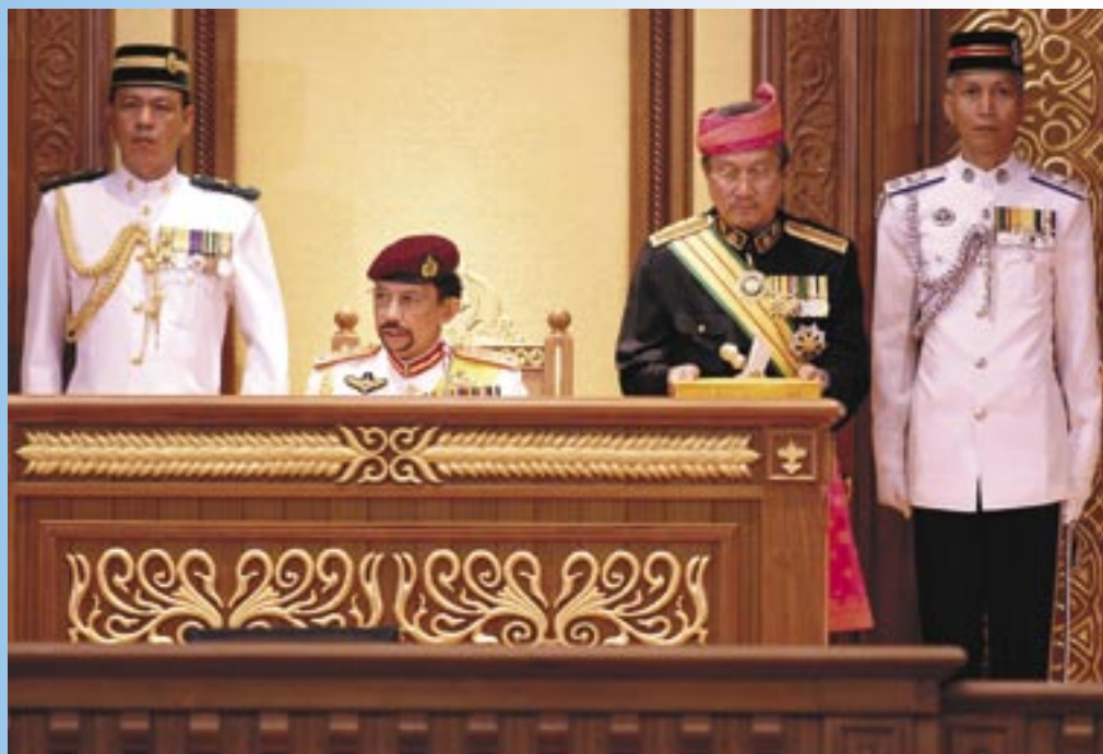
His Majesty delivers a titah at the opening ceremony of the new State Legislative Council Building.

It has several symbolic elements such as five and nine columns at Porte Cochere revealing the promulgation of the Brunei Constitution in 1959, while the eight and four columns leading