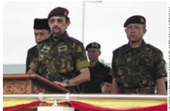
His Majesty delivers a titah (royal speech) at the 47 th anniversary of the RBAF.

celebration is centred at the Third Battalion Royal Brunei Land Force camp in Lumut of the Belait District. The theme for this year's celebration is "Empowering Youth to Strengthen National Defence".