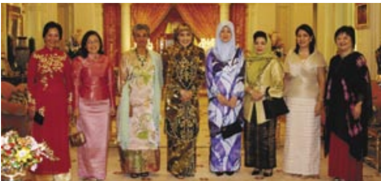
The spouse of Heads of the Police forces from Asean (ASEANPOL) on May 26.