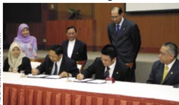
The signing ceremony was witnessed by the Vice Chancellor of UBD and Permanent Secretary at the Prime Minister's Office.

TUNGKU, June 5 - In a bid to create a culture of zero tolerance towards corruption in the country, Universiti Brunei Darussalam (UBD) and the Anti-Corruption Bureau (ACB) under the Prime Minister's Office, signed a Memorandum of Understanding (MoU) to collaborate in educating students on corruption activities.