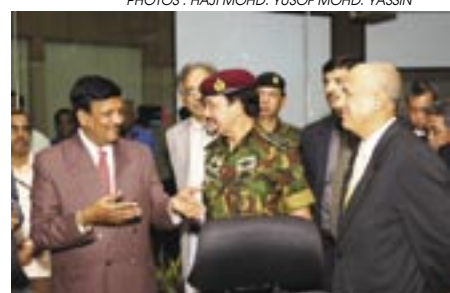
His Majesty given a briefing during a visit to the Telemetry, Tracking and Command Network in Bangalore.