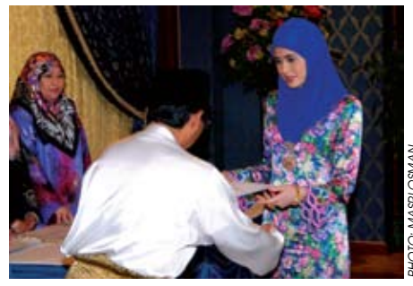
Her Royal Highness receives the award from the Deputy Minister of Education.

Based on academic merit, the University Book Prizes are also awarded annually to the most outstanding final