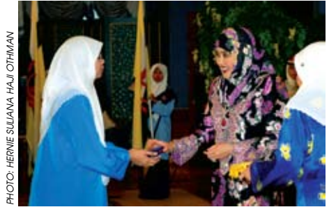
Her Majesty presents an award to one of the members of the association.

JERUDONG, November 2 - All members of the Brunei Darussalam Girl Guides Association were urged to continue with great determination to establish