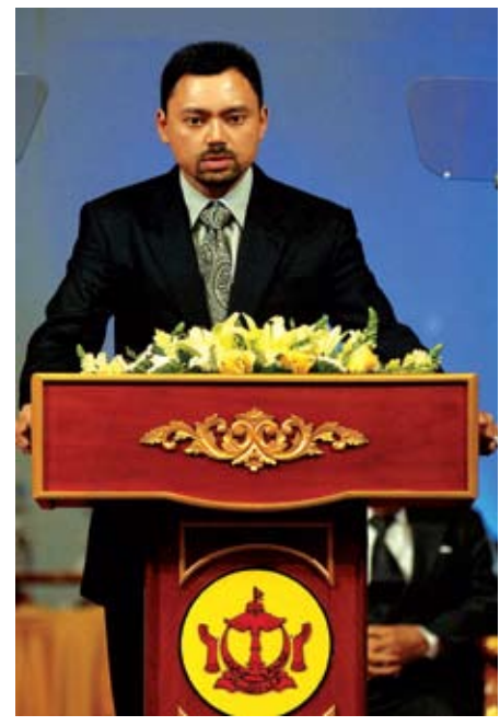
His Royal Highness delivers a sabda at the 15<sup>th</sup> Civil Service Day celebrations.

His Royal Highness also presented certificates to more than 1,011 pensioners who have retired from the civil service.