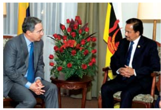
His Majesty discusses global issues during a meeting with the President of Colombia.

Brunei Darussalam and Colombia established diplomatic ties in 1992.