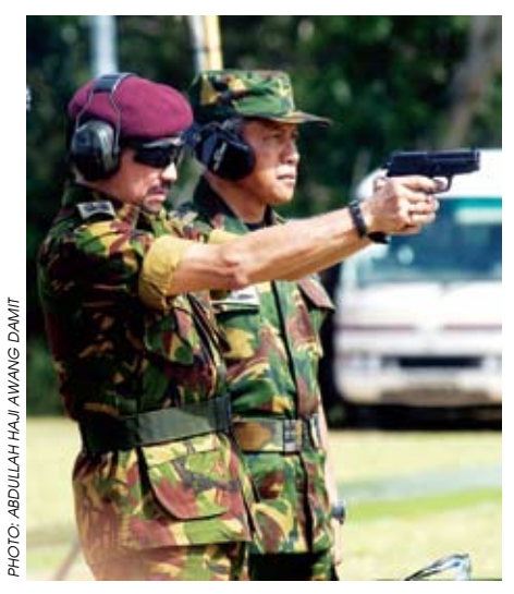
His Majesty participates in the VVIP Novelty Shooting Competition at the 9^{\rm th} BISAM.

TUTONG, November 6 - His Majesty The Sultan and Yang Di-Pertuan of Brunei Darussalam, the Minister of Defence and Supreme Commander of the Royal Brunei Armed Forces (RBAF) graced the closing ceremony of the 9<sup>th</sup> Brunei International Shooting Skill at Arms Meet (BISAM) held at Gallery 1 Binturan Shooting Range.