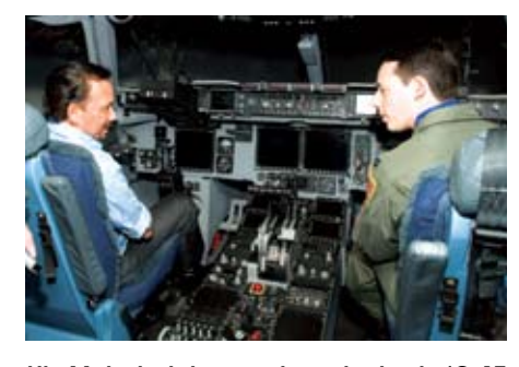
His Majesty takes a closer look at 'C-17 Simulator Facility' at Hickam Air Force Base.