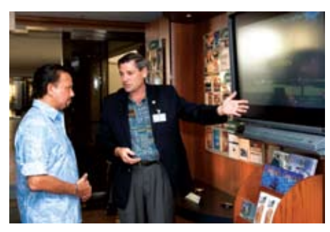
His Majesty during a visit to Asia Pasific Security Studies Centre.

His Majesty ended his visit to Hawaii with a visit to Asia Pasific Security Studies Centre located at Honolulu City.