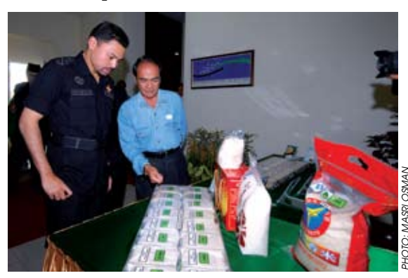
His Royal Highness is introduced to types of paddy.

His Royal Highness' itinerary also included a visit to Imang Dam. The