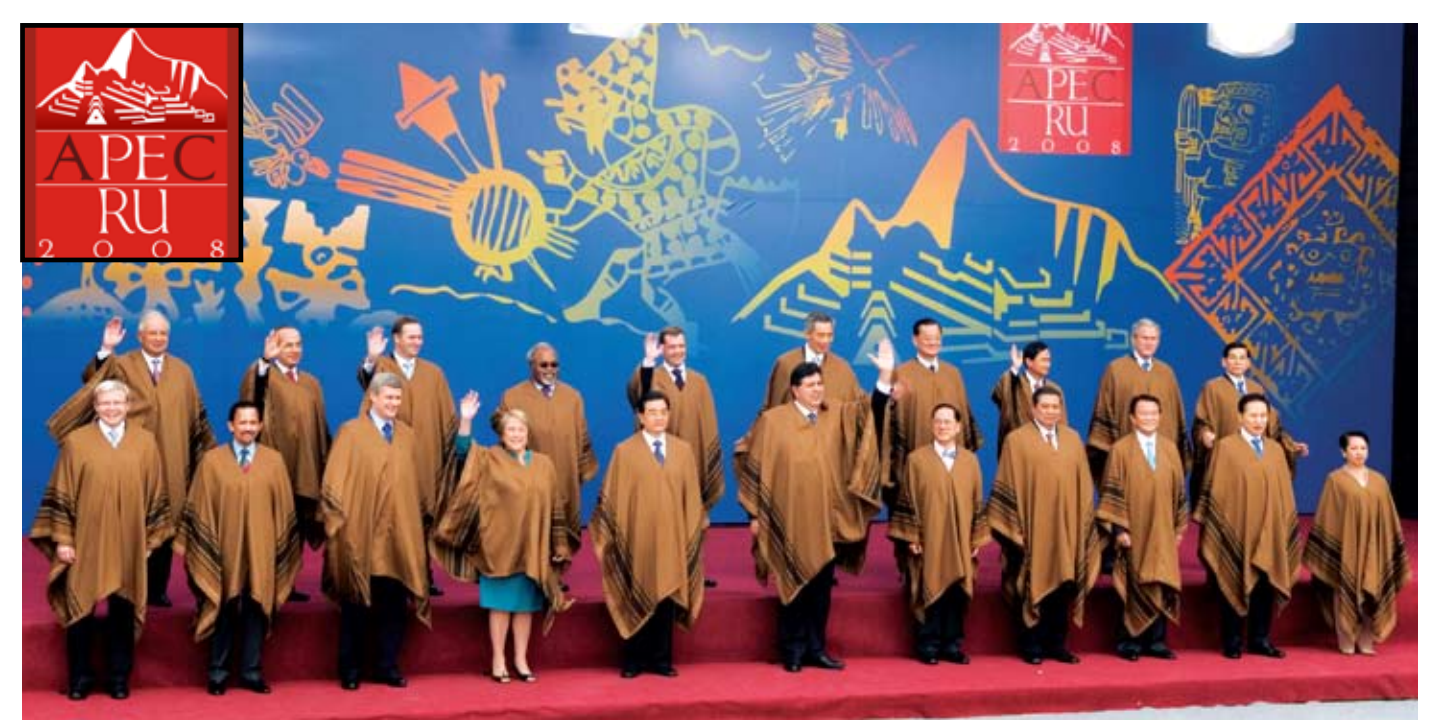
His Majesty in a group photo with other leaders of APEC.