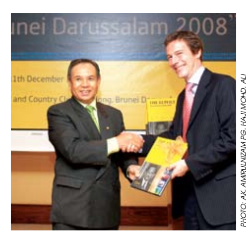
The Minister of Energy at the Prime Minister's Office at the launching of 'The Report:

In the first publication, more than 65 books have been distributed worldwide. A total of 26 per cent were distributed to Europe; 24 per cent to Asia; 21 per cent Mid East and 19 per cent to United States of America while 21,000 copies distributed in the