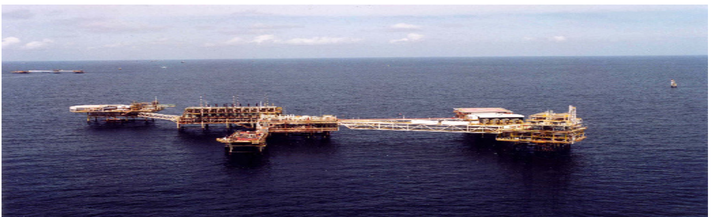
Offshore oil platform in Seria.