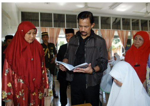
His Majesty scrutinise the teaching system at the Raja Isteri Pg. Anak Damit Arabic Girls Secondary School.

JALAN TUTONG March 8 - His Majesty The Sultan and Yang Di-Pertuan of Brunei Darussalam made a royal visit to two Arabic institutions and a college university situated on Mile One in Jalan Tutong.