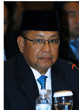
The Minister of Development chaired the 12 th ASEAN Ministers Meeting on Haze.

This meeting also saw the Ministers providing a report on fire prevention, monitoring and the progress achieved by each country in facing haze.