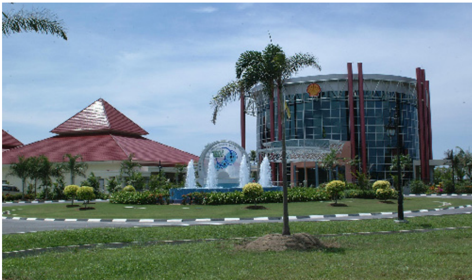
Oil & Gas Discovery Centre in Seria.