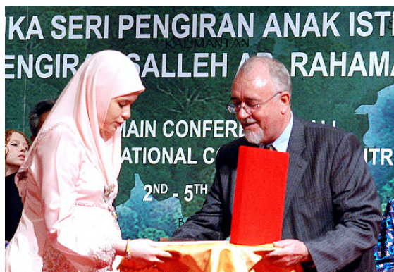
Her Royal Highness at the opening ceremony of the 5 th ISB Borneo Global Issues Conference.

BERAKAS, March 3 - Terrible floods, deadly landslides, poisoned rivers, dwindling-water supplies and watching our young growing up breathing noxious fumes, these are just some of the painful and lethal legacies that we stand to inherit and pass on to our children and their children.