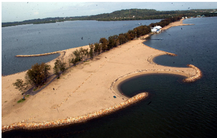
Aerial view of Serasa Beach