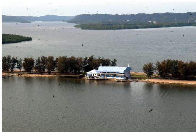
Sports complex built to accommodate water sports