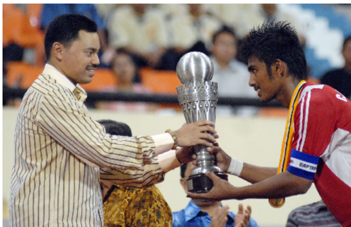
His Royal Highness presents the Hassanal Bolkiah Trophy to the captain of Thailand, the champion.

Winner of this championship received $20,000 cash prize with medals followed by $10,000 cash prize for first runner-up. This year's second runner-ups are Cambodia and Malaysia who each won $5,000 cash prize and medals.