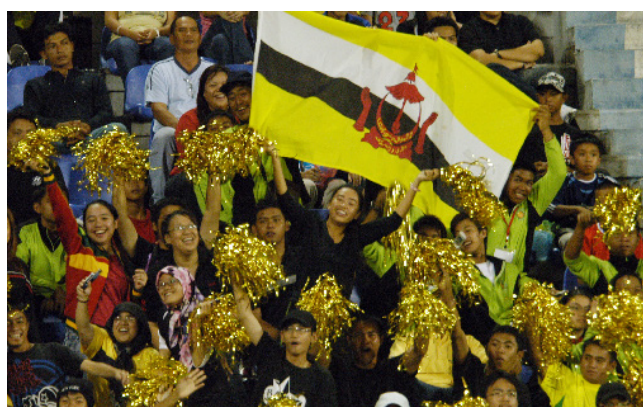
Among the Brunei's team supporters.