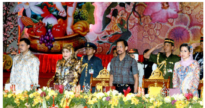
Their Majesties and Her Royal Highness upon arrival at the International Convention Centre at the get-together ceremony celebrating Chinese New Year.

The ceremony was highlighted by the thrilling lion dance from Chung Hwa Middle School and PDS International School students. The Tiong Hua community also showcased traditional Chinese and Malay dances.