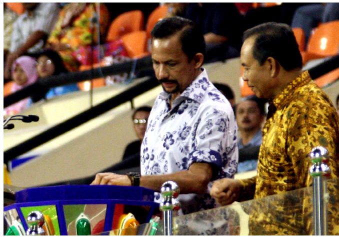
His Majesty officiates the Hassanal Bolkiah Trophy 2007.