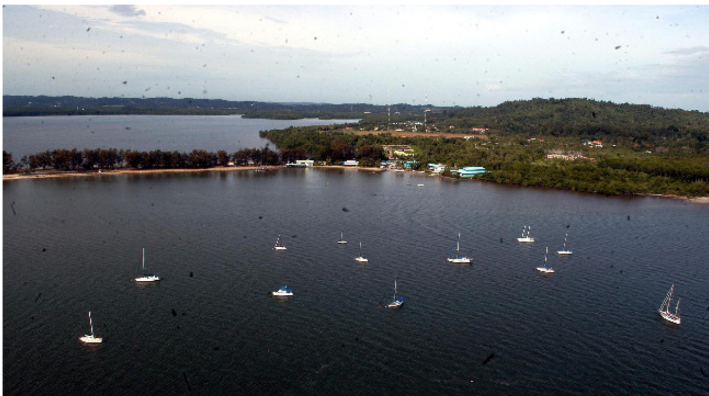
Serasa beach best location for yacht

Pantai Serasa is one of the most popular venues to spend your weekend. The calm environment with windy breath of fresh air will surely make a mark in one's heart as the place to spend time with your family and loved ones.