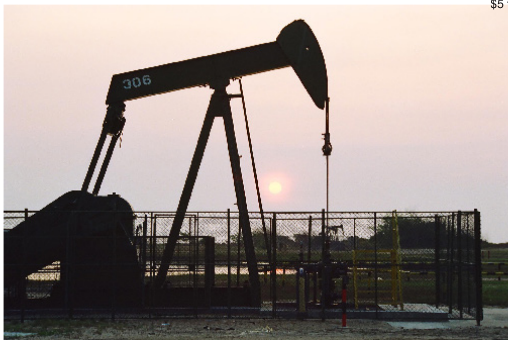
A 'nodding donkey' at Seria town.

The latest landmark in Seria is the Oil and Gas Discovery Centre (OGDC). It is set up by the Brunei Shell Petroleum in September 2002 and aimed at educating the public about science, technology and the environment. The OGDC is opened for visits from Tuesday and Sundays. Admissions fees are $1 for children below the age of 12, $2 for teens up to 17 and $5 for adults.