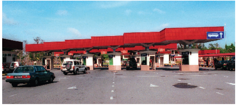
Sungai Tujoh Control Post, an exit to Miri, Sarawak

These are some of the interesting places you can visit if you are in the Belait District. More will be featured in the next edition.