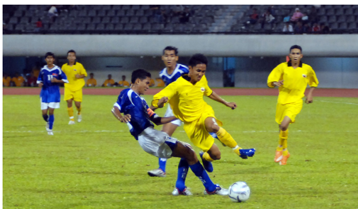
High spirit shown by the teams.