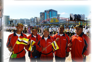
Colourful panorama depicting scenes during the 23 rd National Day at the Taman Sir Muda Omar Ali Saifuddien