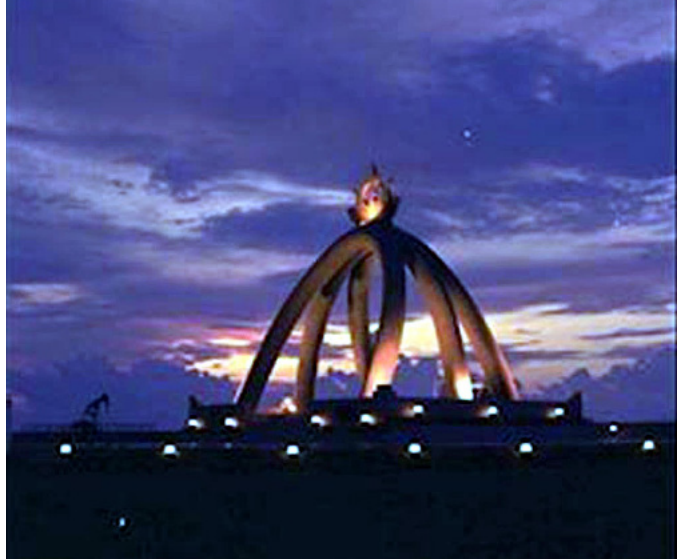
Billionth Barrel Monument