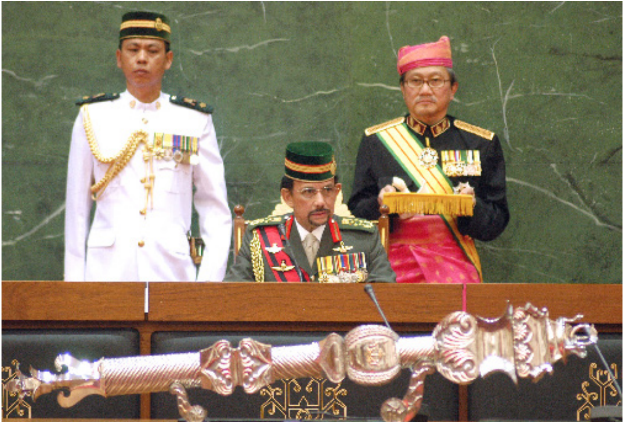
His majesty delivers a titah during the official opening of the First Meeting for the Third Session of the State Legislative Council.

The first session of the State Legislative Council; was held on September 25, 2004 while on September 2, 1005; His Majesty announced the appointment of the new members of the council which included five representatives from four districts. Then on March 15, 2006; First Meeting for the Second Session was opened with the main agenda of state budget allocation.