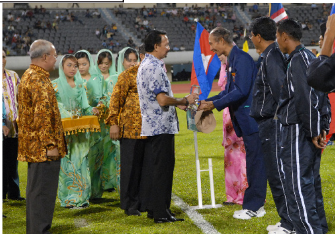
His Majesty introduced to team's manager.