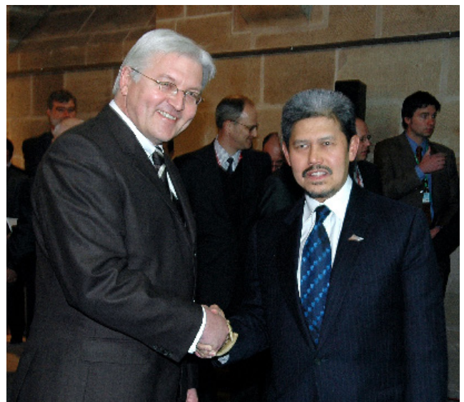
His Royal Highness Prince Mohammed Bolkiah with the Minister of Foreign Affairs of the Republic of German Federation at the reception in conjunction with the 16 th AEMM Meeting.

The Ministers received briefings on recent developments, assessed current cooperation and exchanged views about the future which His Royal Highness highlighted the 'Heart of Borneo' programme as an excellent example of modern multilateral cooperation in complex environmental matters.