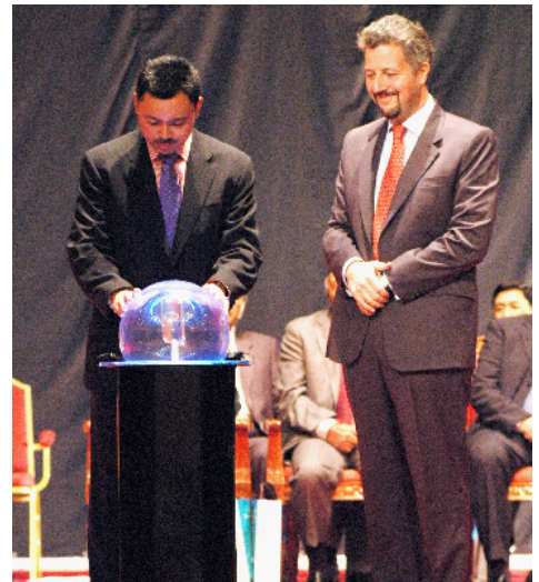
His Royal Highness officiates the Brunei Microsoft Office and the launching of Windows Vista and Microsoft Office 2007.

The company develops, manufactures and licences a wide range of software, including operating systems for personal computers, mobile phones, and intelligent devices. Also included are server applications for distributed environments and productivity applications for information workers.