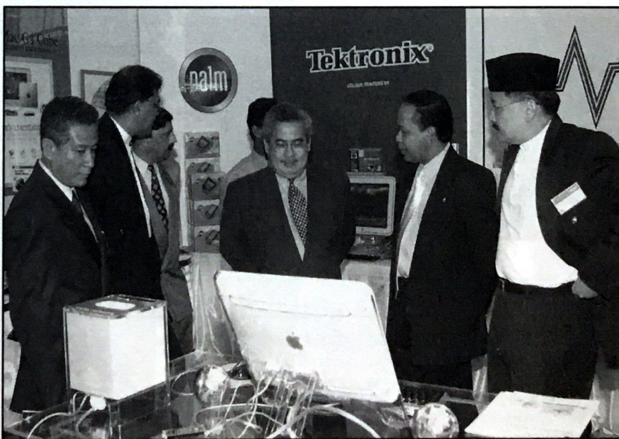
The Permanent Secretary of the Ministry of Finance, Pengiran Dato Haji Maidin tours the BITEK 2001 exhibition shortly after he declared it open.

Twenty-eight local IT companies displayed their products at the BITEK 2001.