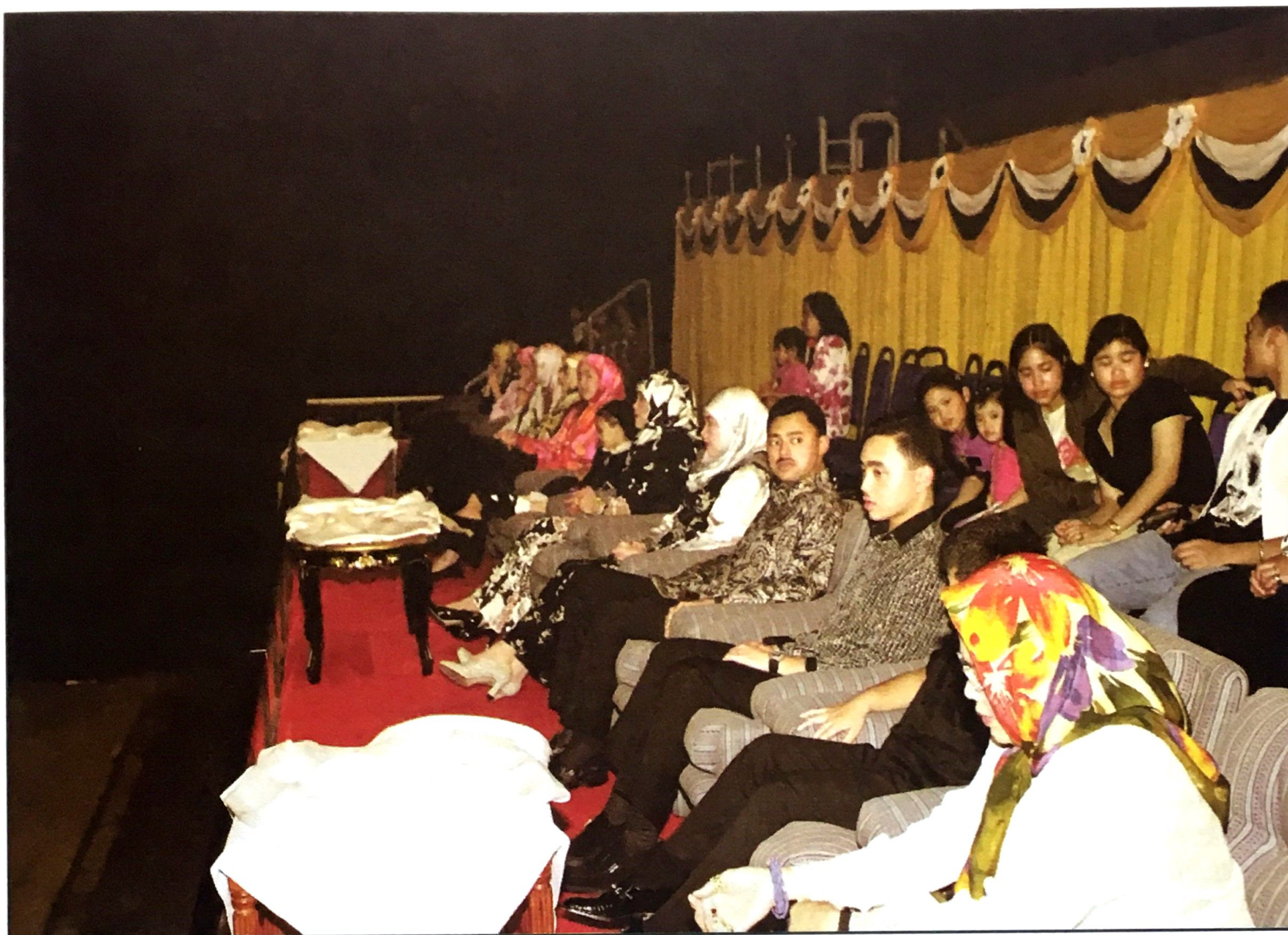
Amongst the audience watching the performances by the Little Mermaids were members of the royal family including Her Majesty Raja Isteri Pengiran Anak Hajjah Saleha, Her Royal Highness Pengiran Isteri Hajjah Mariam and His Royal Highness Crown Prince Haji Al-Muhtadee Billah.