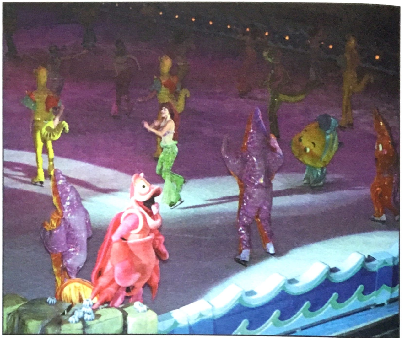
To the delights of children and adults alike, members of the Little Mermaids troupe perform a sketch during their tour of Brunei Darussalam.

The next issue of the Brunei Darussalam newsletter will appear on 15 May 2001. If there are events relating to our country you would like featured in this newsletter please call us on Tel: 02-383400/ext.BDN Division or better still, send us a report with a picture, if possible. All editorial rights reserved.