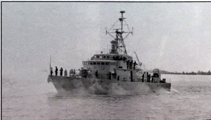
One of the Brunei Darussalam's naval patrol boats departs for the Republic of Singapore for a joint exercise between the two countries.

The annual military exercise provided exposure to the two countries' navy officers and crew men by engaging them in professional, social and sports activities.