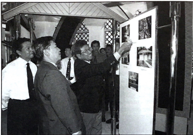
Director General of Economic Planning and Development explaining details about the Small Scale Tourism Infrastructure Projects to the acting Permanent Secretary of the Ministry of Industry and Primary Resources.

As befitted small-scale projects, much of the requirements focused on basic needs such as the setting up of Tourist Information Centres, the building of pavement connecting the Brunei Museum and the Malay Technol-