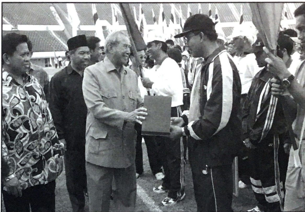
The Minister of Culture, Youth and Sports, Pehin Dato Haji Awang Hussain meets team leaders at the start of the fifth Brunei National Sports Meeting.