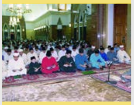
6 Brunei celebrates 14th National Day