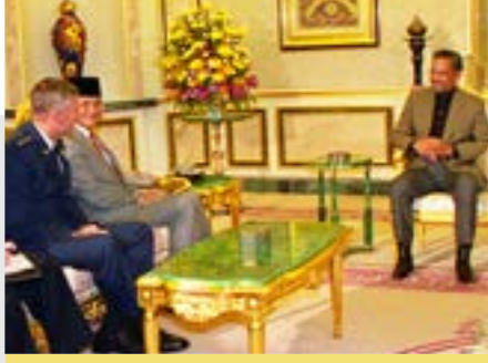
3 His Majesty grants audiences

Facebook - Jabatan Penerangan Jabatan Perdana Menteri Brunei Darussalam