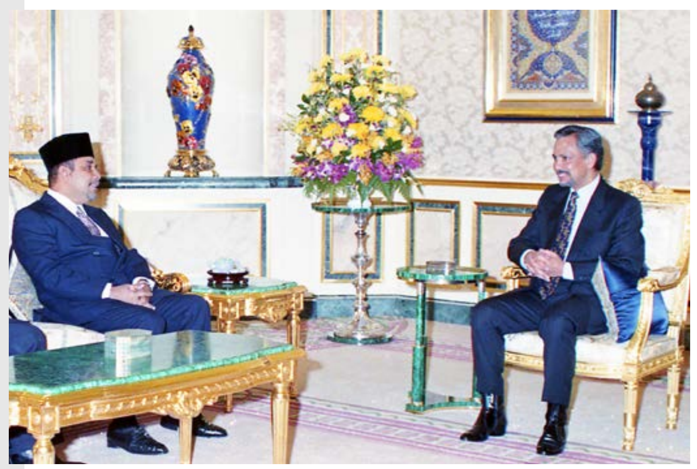
Yang Berhormat Datuk Seri Hamid bin Syed Jaafar Albar, Minister of Defence, Malaysia on February 12.