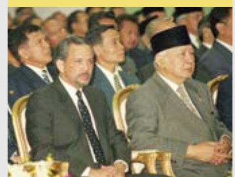
14 NAM CSSTC: enhancing technical co-operation