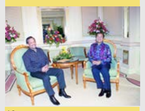
12 His Majesty hosts Royal Banquet