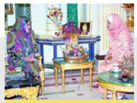
4 Audience with Her Majesty