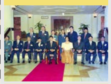
16 SEAMEC needs to give integrated efforts