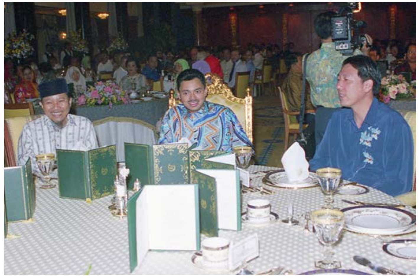
His Royal Highness Prince Haji Al-Muhtadee Billah during the banquet for the Southeast Asian Ministers of Education.