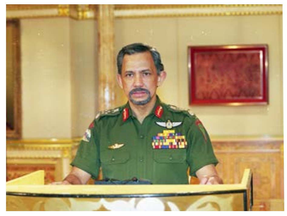
His Majesty Sultan Haji Hassanal Bolkiah Mu'izzaddin Waddaulah ibni Al-Marhum Sultan Haji Omar 'Ali Saifuddien Sa'adul Khairi Waddien, Sultan and Yang Di-Pertuan of Brunei Darussalam delivering titah (royal speech) in conjunction with Brunei Darussalam's 14th National Day Celebration.

Talking about the currency and economic crisis that are happening in Asia, the Monarch advised the need to learn from how the situations can change drastically