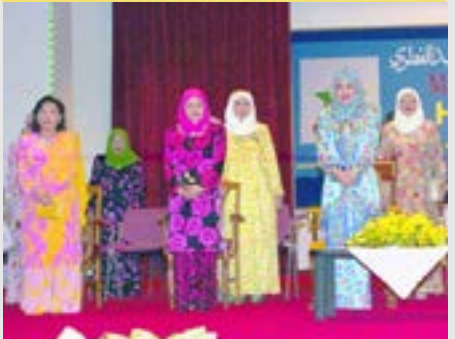
15 Women's Council hosts Hari Raya Celebration