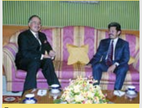
5 His Royal Highness receives audiences