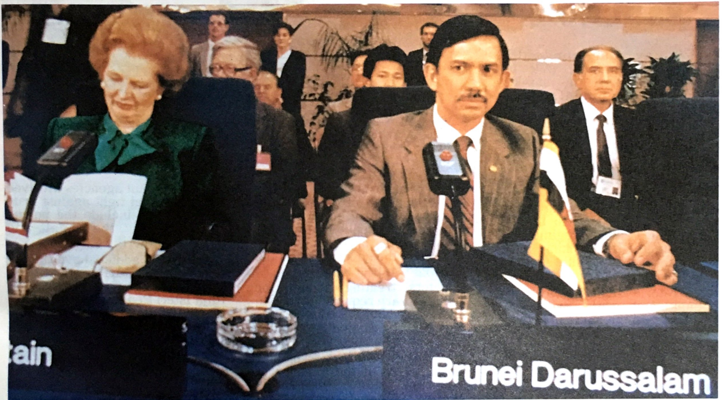
His Majesty Sultan Haji Hassanal Bolkiah Mu'izzaddin Waddaulah, Sultan and Yang Di-Pertuan Negara Brunei Darussalam at the Vancouver Commonwealth Heads of Government Meeting.

H is Majesty Sultan Haji Hassanal Bolkiah Mu'izzaddin Waddaulah Sultan and Yang Di-Pertuan Negara Brunei Darussalam attended his second Commonwealth Heads of Government Meeting in Vancouver, Canada beginning on October 13, 1987.