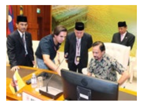
8 His Majesty inspects ASEAN Summit preparations