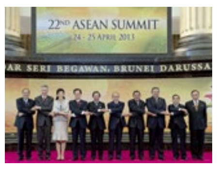
9 Maintain peace and stability of ASEAN