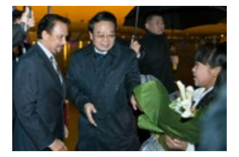
3 His Majesty arrives in Beijing