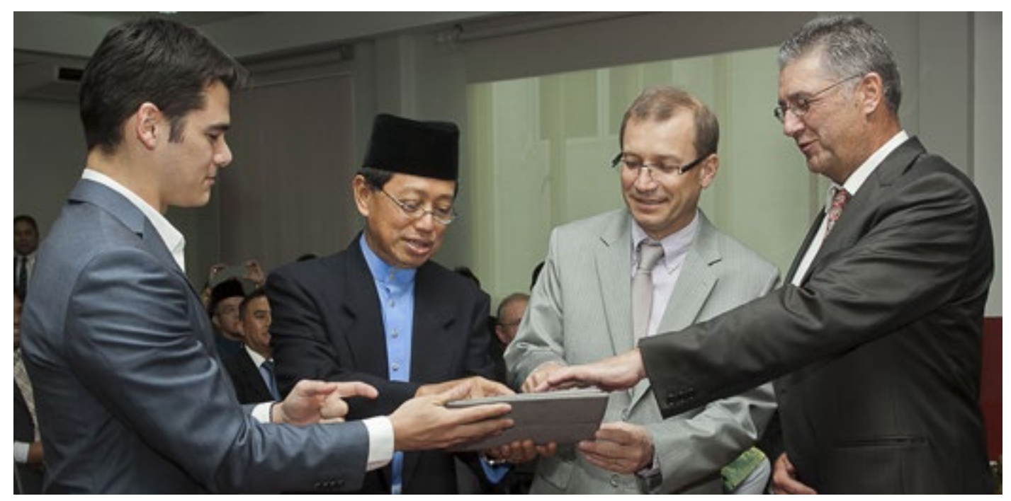
Yang Berhormat Pehin Orang Kaya Seri Utama Dato Seri Setia Awang Haji Yahya bin Begawan Mudim Dato Paduka Haji Bakar, Minister of Industry and Primary Resources launching the 'Discover Brunei Diving App'.

BANDAR SERI BEGAWAN , March 28 - Diving enthusiasts and iPad users in the country can now explore under water to locate diving areas with the launching of `Discover Brunei: Diving App' for iPads.