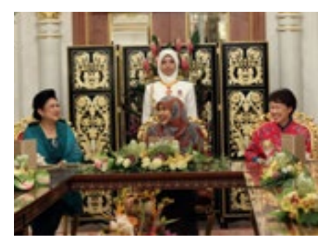
12 Dinner Banquet to welcome ASEAN leaders' spouses