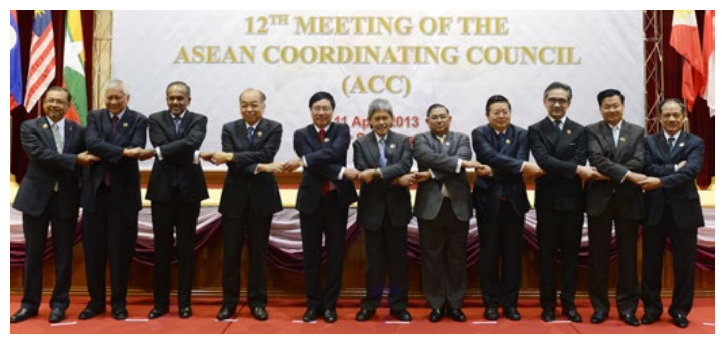
The ASEAN Foreign Ministers at the 9th Meeting of the ASEAN Political-Security Community (APSC) Council held at the International Convention Centre in Berakas.

BANDAR SERI BEGAWAN, April 11 - His Royal Highness Prince Mohamed Bolkiah ibni Al-Marhum Sultan Haji Omar 'Ali Saifuddien Sa'adul Khairi Waddien, Minister of Foreign Affairs and Trade as the Chairman of the 22nd ASEAN Foreign Ministers Meeting chaired the 9th ASEAN Political-Security Community (APSC) Council Meeting.