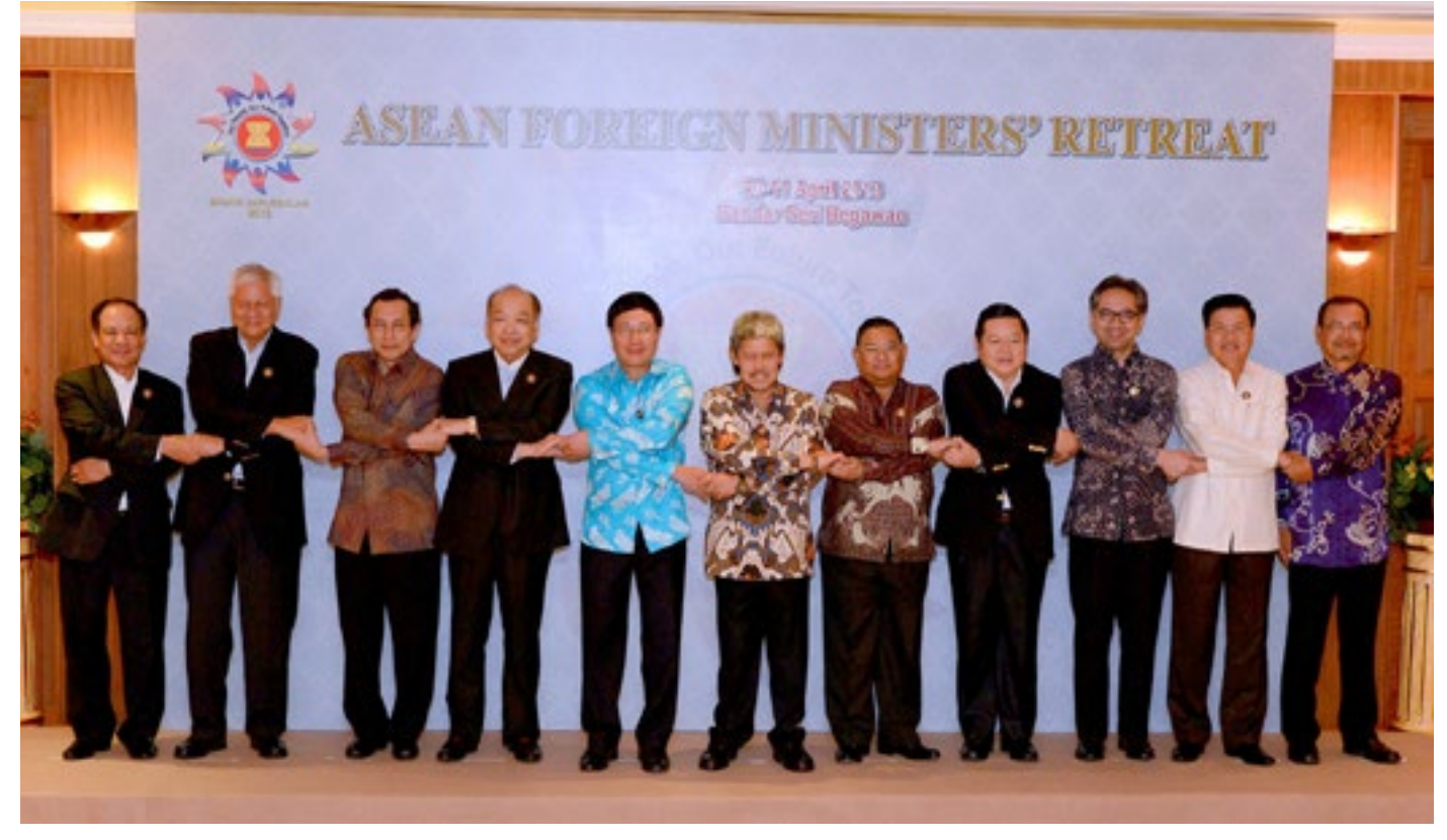
The ASEAN Foreign Ministers during the dinner banquet held at the International Convention Centre in Berakas.

BANDAR SERI BEGAWAN, April 10 - His Royal Highness Prince Mohamed Bolkiah ibni Al-Marhum Sultan Haji Omar 'Ali Saifuddien Sa'adul Khairi Waddien, Minister of Foreign Affairs and Trade as the Chairman of the 22nd ASEAN