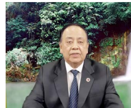
Yang Berhormat Minister of Energy at the 3 rd East Asia Energy Forum.

Carbon Capture Utilisation and Storage (CCUS)/Carbon Recycling in ASEAN/East Asia' and focused on the role of this clean energy technology in tackling the global climate challenge.