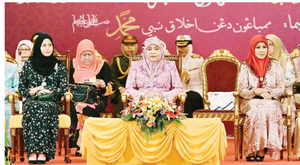
Her Majesty Duli Raja Isteri Pengiran Anak Hajah Saleha binti Al-Marhum Pengiran Pemancha Pengiran Anak Haji Mohamed Alam and members of the royal family during the Women's Special Assembly in conjunction with the Maulidur Rasul Celebration for 1442 Hijrah/2020 Masihi (left and below).