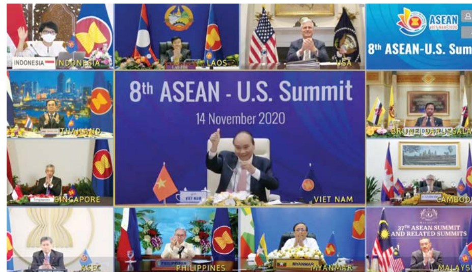
His Majesty Sultan Haji Hassanal Bolkiah Mu'izzaddin Waddaulah ibni Al-Marhum Sultan Haji Omar 'Ali Saifuddien Sa'adul Khairi Waddien, Sultan and Yang Di-Pertuan of Brunei Darussalam joining ASEAN leaders and ASEAN Dialogue Partners for the 8 th ASEAN-United States Summit, held virtually via video conference

BANDAR SERI BEGAWAN, November 14 - His Majesty Sultan Haji Hassanal Bolkiah Mu'izzaddin Waddaulah ibni Al-Marhum Sultan Haji Omar 'Ali Saifuddien Sa'adul Khairi Waddien, Sultan and Yang Di-Pertuan of Brunei Darussalam, joined other ASEAN Leaders and ASEAN Dialogue Partners for the 8 th ASEAN-United States (U.S.) Summit, held virtually via video conference.