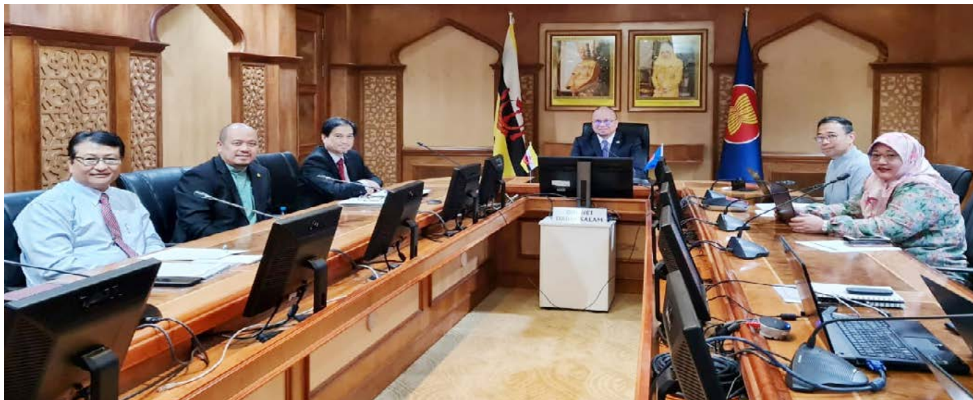
Yang Berhormat Minister of Health during the 3rd ASEAN-China Forum on Health Cooperation.

BANDAR SERI BEGAWAN, November 25 - Comprehensive cooperation and solidarity are important as the world is currently facing the COVID-19 pandemic, and efforts must achieve the global health goals.