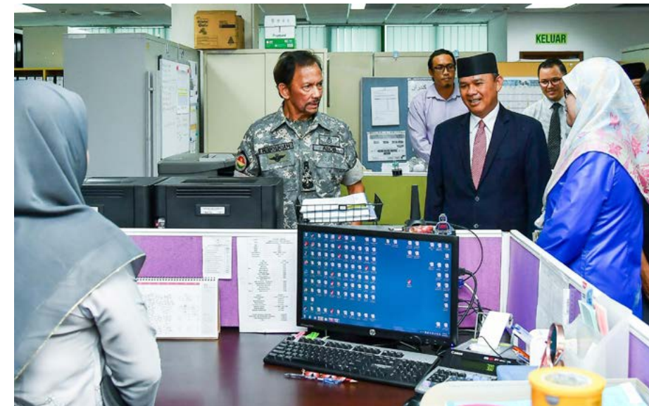
His Majesty the Sultan and Yang Di-Pertuan of Brunei Darussalam speaking to employees of MCYS (above and below).