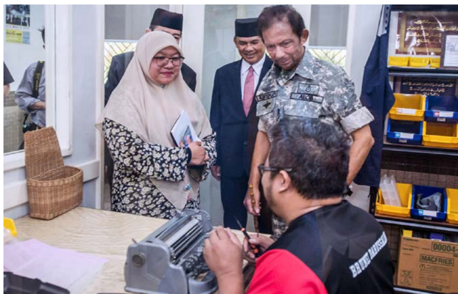
His Majesty the Sultan and Yang Di-Pertuan of Brunei Darussalam during the visit to Ministry of Culture, Youth and Sports (MCYS) (above and below).

"I wish to remind that this programme should not be conducted improvidently. We should think of its appropriateness in all aspects, especially in terms of culture and religion. According to its true definition, culture is not all about entertainment and amusement, but civilisation, which is of a much larger scope. I hope that MYCS understands this," concluded His Majesty.