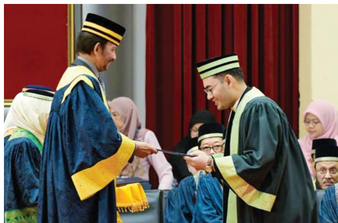
His Majesty Sultan Haji Hassanal Bolkiah Mu'izzaddin Waddaulah ibni Al-Marhum Sultan Haji Omar 'Ali Saifuddien Sa'adul Khairi Waddien, Sultan and Yang Di-Pertuan of Brunei Darussalam, Chancellor of Universiti Brunei Darussalam presenting certificates to graduates (above and below).