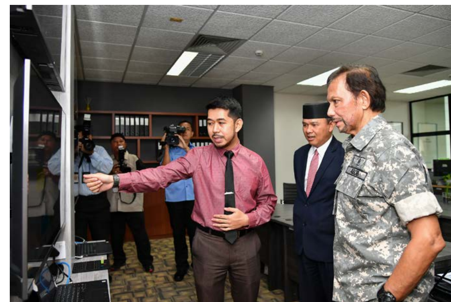
His Majesty during the visit to MCYS.