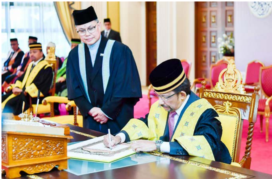
His Majesty Sultan Haji Hassanal Bolkiah Mu'izzaddin Waddaulah ibni Al-Marhum Sultan Haji Omar 'Ali Saifuddien Sa'adul Khairi Waddien, Sultan and Yang Di-Pertuan of Brunei Darussalam launching the Writing for UTB's Mushaf.

To date, UTB has produced over 5,141 BDTVEC HND, 295 Higher National Diploma Level 5, 1,926 undergraduates, 287 postgraduates and two PhD graduates.