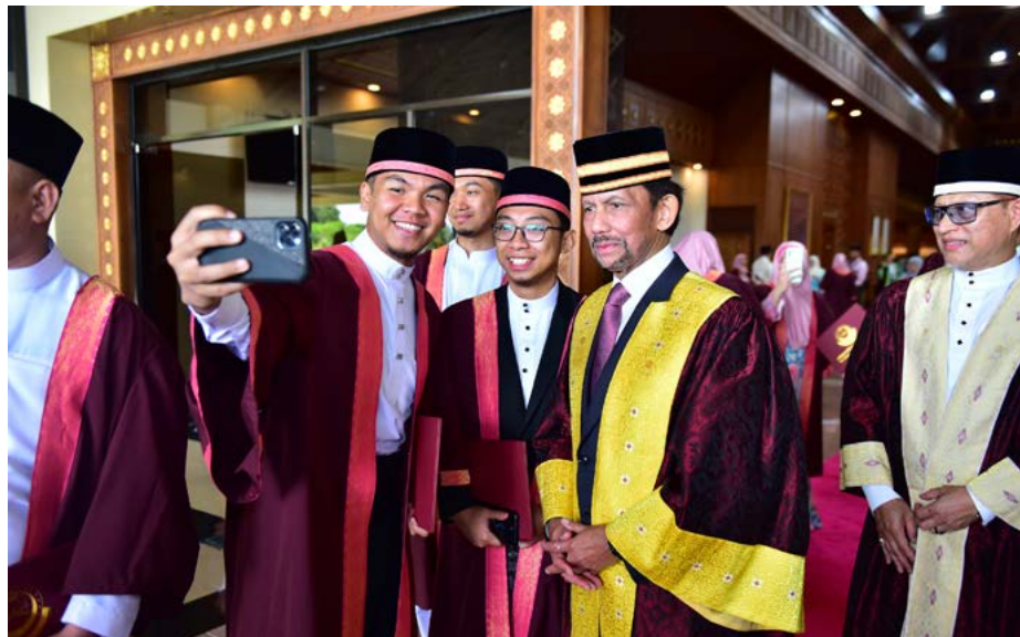
His Majesty Sultan Haji Hassanal Bolkiah Mu'izzaddin Waddaulah ibni Al-Marhum Sultan Haji Omar 'Ali Saifuddien Sa'adul Khairi Waddien, Sultan and Yang Di-Pertuan of Brunei Darussalam consented to take photos with graduates.

From the 251 graduates who received degrees and diplomas, one received Bachelor of Religious Teaching in the Study of Ahli Sunah Waljamah; 16 received Bachelor of Religious Teaching in Islamic Education while two others