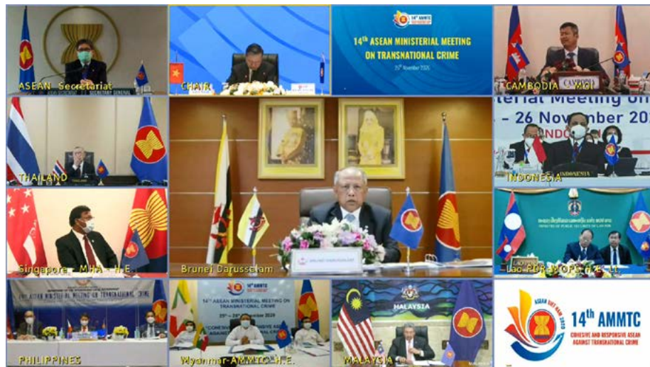
Yang Berhormat Second Minister of Defence as Chairman of the National Security Committee attending the 14th ASEAN Ministerial Meeting on Transnational Crime (AMMTC) virtually.