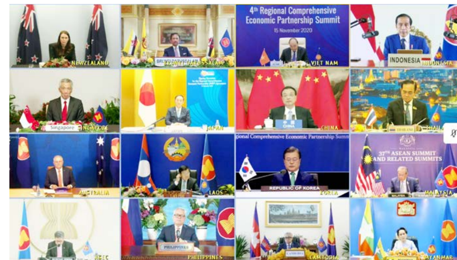
His Majesty Sultan Haji Hassanal Bolkiah Mu'izzaddin Waddaulah ibni Al-Marhum Sultan Haji Omar 'Ali Saifuddin Sa'adul Khairi Waddien, Sultan and Yang Di-Pertuan of Brunei Darussalam joining ASEAN Leaders and ASEAN Dialogue Partners for the 4 th Regional Comprehensive Economic Partnership (RCEP) Summit, held virtually via video conference.

The leaders also called for UN support in sharing best practices and experiences towards enhancing ASEAN capacity to tackle hostilities in sustaining regional and global peacekeeping; addressing climate change; and ensuring preparedness for natural disasters.