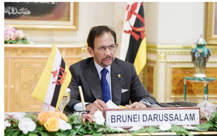
His Majesty Sultan Haji Hassanal Bolkiah Mu'izzaddin Waddaulah ibni Al-Marhum Sultan Haji Omar 'Ali Saifuddien Sa'adul Khairi Waddien, Sultan and Yang Di-Pertuan of Brunei Darussalam during the 21 st ASEAN-Republic of Korea Summit.

BANDAR SERI BEGAWAN, November 12 - His Majesty Sultan Haji Hassanal Bolkiah Mu'izzaddin Waddaulah ibni Al-Marhum Sultan Haji Omar 'Ali Saifuddien Sa'adul Khairi Waddien, Sultan and Yang Di-Pertuan of Brunei Darussalam at the 21 st ASEAN-Republic of Korea (ROK) Summit, held virtually via video conference in a titah (royal speech) delivered the ASEAN Common Statement, as Country Coordinator of ASEAN-ROK Dialogue Relations, in which His Majesty the Sultan and Yang Di-Pertuan of Brunei Darussalam appreciated His Excellency Moon Jae-In, President of ROK's continued personal efforts to strengthen ASEAN-ROK relations, including through the New Southern Policy-Plus as well as the ROK's strong support for ongoing ASEAN initiatives on measures to help overcome the COVID-19 pandemic.