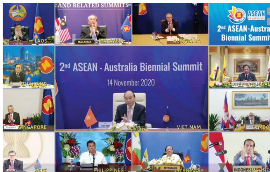
His Majesty Sultan Haji Hassanal Bolkiah Mu'izzaddin Waddaulah ibni Al-Marhum Sultan Haji Omar 'Ali Saifuddin Sa'adul Khairi Waddien, Sultan and Yang Di-Pertuan of Brunei Darussalam joining other ASEAN Leaders and ASEAN Dialogue Partners for the 2 nd ASEAN-Australia Biennial Summit.

In concluding the titah , His Majesty urged ASEAN and Australia to work for a swift regional economic recovery from the COVID-19 pandemic, and believed that the upgrading of the ASEAN-Australia-New Zealand Free Trade Agreement (AANZFTA) would bring better benefit to businesses and people.