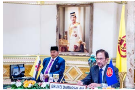
6. 23 rd ASEAN-China Summit: Realise full potential of ASEAN-China Free Trade Agreement