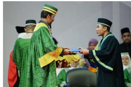
17. UNISSA's Mushaf - a source of blessings, a symbol of Islamic greatness