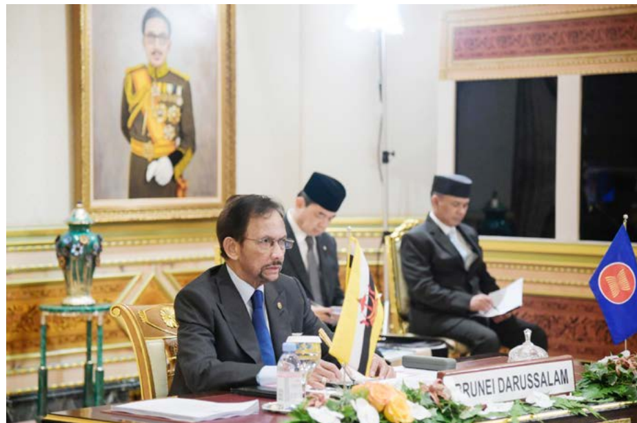
His Majesty Sultan Haji Hassanal Bolkiah Mu'izzaddin Waddaulah ibni Al-Marhum Sultan Haji Omar 'Ali Saifuddien Sa'adul Khairi Waddien, Sultan and Yang Di-Pertuan of Brunei Darussalam during the 23 rd ASEAN-Japan Summit, held virtually via video conference.

BANDAR SERI BEGAWAN, November 12 - At the 23 rd ASEAN-Japan Summit, His Majesty Sultan Haji Hassanal Bolkiah Mu'izzaddin Waddaulah ibni