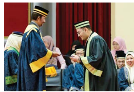
16. Maintain integrity, adhere to teachings of Islam