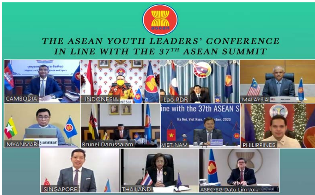
Yang Berhormat Minister of Culture, Youth and Sports of Brunei Darussalam (MCYS) during the ASEAN Youth Leaders' Conference, in line with 37 th ASEAN Summit, which was held via Video Conference.