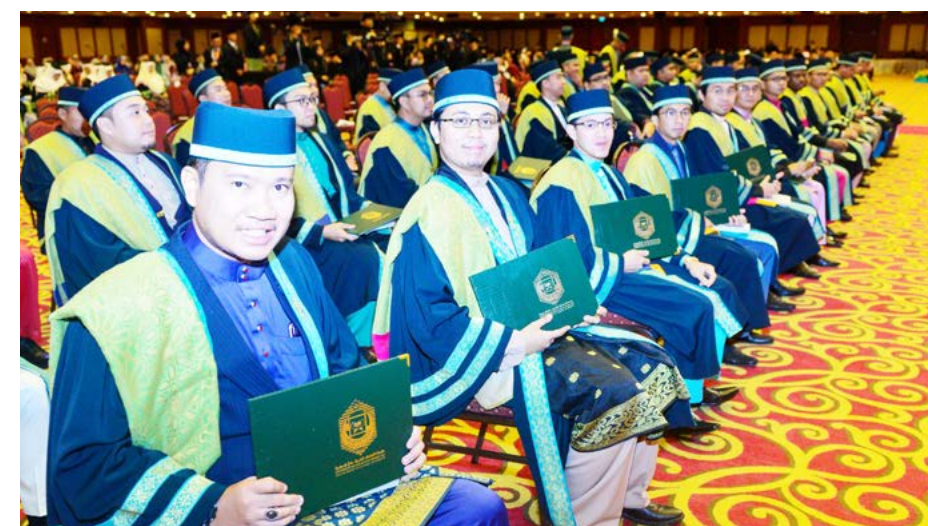
UNISSA graduates during the event.