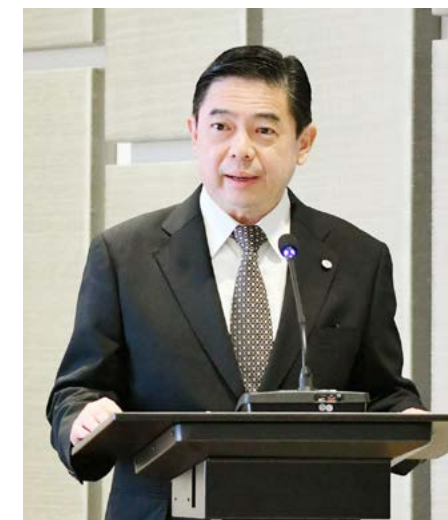
Yang Berhormat Minister at the Prime Minister's Office and Second Minister of Finance and Economy speaking at the forum held at Baiduri Bank Headquarters.

BANDAR SERI BEGAWAN, November 7 - Companies in the country are encouraged to develop their business by exploring new economic activities, including working closely with the Foreign Direct Investment (FDI) and export market potential.