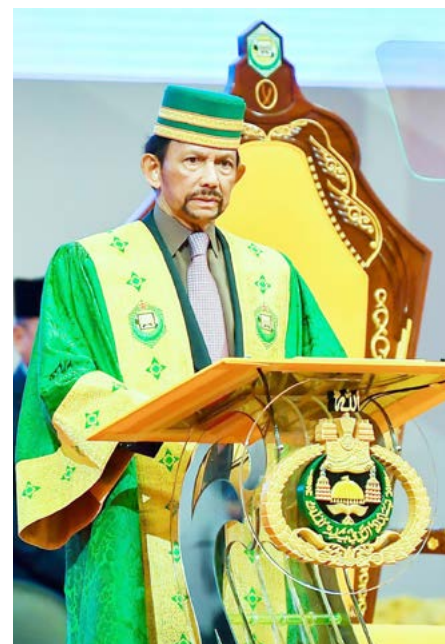
His Majesty Sultan Haji Hassanal Bolkiah Mu'izzaddin Waddaulah ibni Al-Marhum Sultan Haji Omar 'Ali Saifuddien Sa'adul Khairi Waddien, Sultan and Yang Di-Pertuan of Brunei Darussalam delivering a titah (royal speech) as Chancellor of Universiti Islam Sultan Sharif Ali (UNISSA), on the occasion of the university's 10 th Hafl Al-Takharuj (Convocation Ceremony), at the International Convention Centre.

BERAKAS, November 9 - The Universiti Islam Sultan Sharif Ali (UNISSA) Haflut Takharuj (Convocation Ceremony) this time was very meaningful and historic said His Majesty Sultan Haji Hassanal Bolkiah Mu'izzaddin Waddaulah ibni Al-Marhum Sultan Haji Omar 'Ali Saifuddien Sa'adul Khairi Waddien, Sultan and Yang Di-Pertuan of Brunei Darussalam as Chancellor of UNISSA in a titah (royal speech) on the occasion of the university's 10 th Hafl Al-Takharuj, at the International Convention Centre.