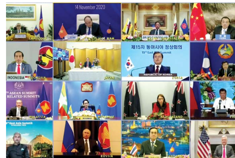
His Majesty Sultan Haji Hassanal Bolkiah Mu'izzaddin Waddaulah ibni Al-Marhum Sultan Haji Omar 'Ali Saifuddin Sa'adul Khairi Waddien, Sultan and Yang Di-Pertuan of Brunei Darussalam joining other ASEAN Leaders for the 15 th East Asia Summit virtually via video conference.

His Majesty stated that, with its vast population size and GDP, the EAS has great potential to push for a