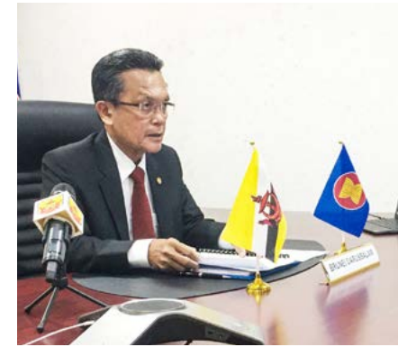
Yang Berhormat Minister of Home Affairs during the 8 th ASEAN Ministerial Meeting on Disaster Management (AMMDM) and the 9 th Meeting of the Conference of the Parties to the ASEAN Agreement on Disaster Management and Emergency Response (COP to AADMER) held virtually.