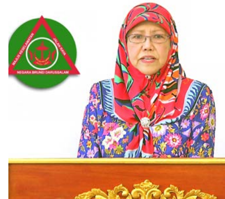
Her Royal Highness Princess Hajah Masna binti Al-Marhum Sultan Haji Omar 'Ali Saifuddien Sa'adul Khairi Waddien, Ambassador-at-Large at the Ministry of Foreign Affairs in her capacity as Royal Patron of the National Road Safety Council delivering a sabda (royal speech) through a recorded video message aired at the World Day of Remembrance for Road Traffic Victims (WDR) ceremony.

Her Royal Highness also extended her gratitude to MKKJR, other agencies and the community for the efforts in reducing road accidents in the country, adding that "it is our responsibility to ensure our roads are safe".