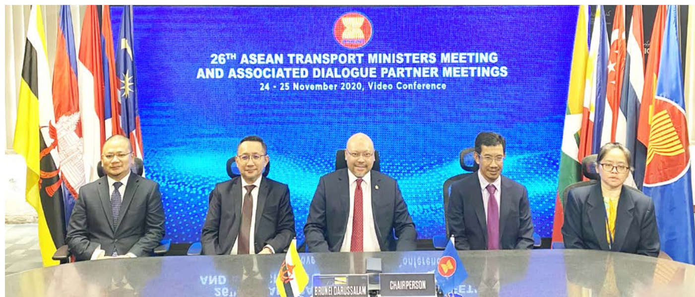
Yang Berhormat Minister of Transport and Infocommunications 26 th ATM Meeting and Associated Dialogue Partner Meetings held via video conference.