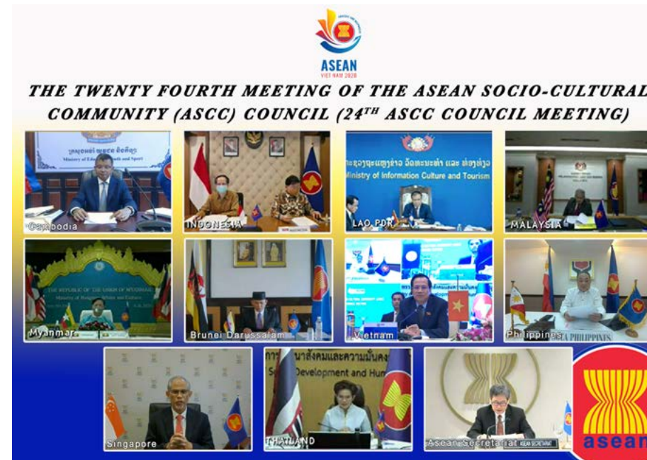
Yang Berhormat Minister of Culture, Youth and Sports (MCYS) of Brunei Darussalam during the 24 th ASEAN Socio-Cultural Community (ASCC) Council Meeting via video conference.