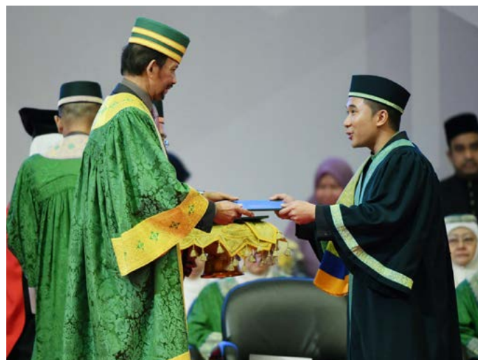
His Majesty Sultan Haji Hassanal Bolkiah Mu'izzaddin Waddaulah ibni Al-Marhum Sultan Haji Omar 'Ali Saifuddien Sa'adul Khairi Waddien, Sultan and Yang Di-Pertuan of Brunei Darussalam presenting certificates to graduates during Universiti Islam Sultan Sharif Ali's (UNISSA) 10 th Hafli Al-Takharri.