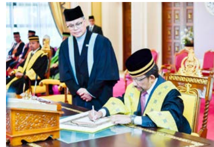
18. Prioritise Islamic ethics, cultural values in human resources