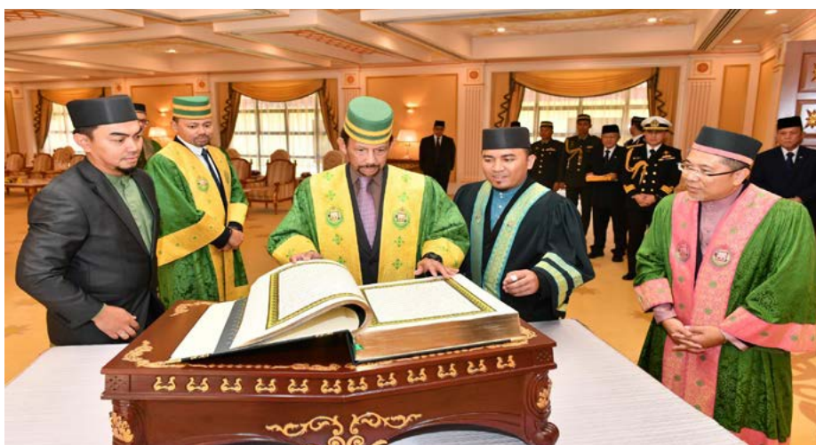
His Majesty the Sultan and Yang Di-Pertuan of Brunei Darussalam viewing UNISSA's Al-Quran Mushaf.

This year also saw graduates of two new degrees introduced by UNISSA awarded. A Bachelor of Tahfiz and Qiraat was