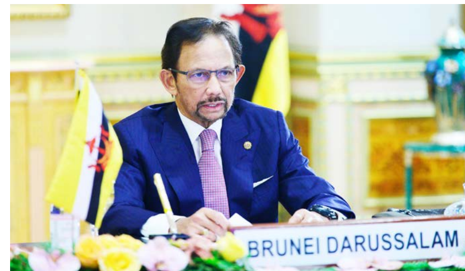
His Majesty Sultan Haji Hassanal Bolkiah Mu'izzaddin Waddaulah ibni Al-Marhum Sultan Haji Omar 'Ali Saifuddien Sa'adul Khairi Waddien, Sultan and Yang Di-Pertuan of Brunei Darussalam delivering a titah (royal speech) at the ASEAN-New Zealand Commemorative Summit, held virtually via video conference.

BANDAR SERI BEGAWAN, November 14 - His Majesty Sultan Haji Hassanal Bolkiah Mu'izzaddin Waddaulah ibni Al-Marhum Sultan Haji Omar 'Ali Saifuddien Sa'adul Khairi Waddien, Sultan and Yang Di-Pertuan of Brunei Darussalam in a titah (royal speech) expressed satisfaction in celebrating the 45 th anniversary of ASEAN-New Zealand Dialogue Relations, in which the cooperation continues to bring many mutual benefits for their peoples in a wide range of areas.