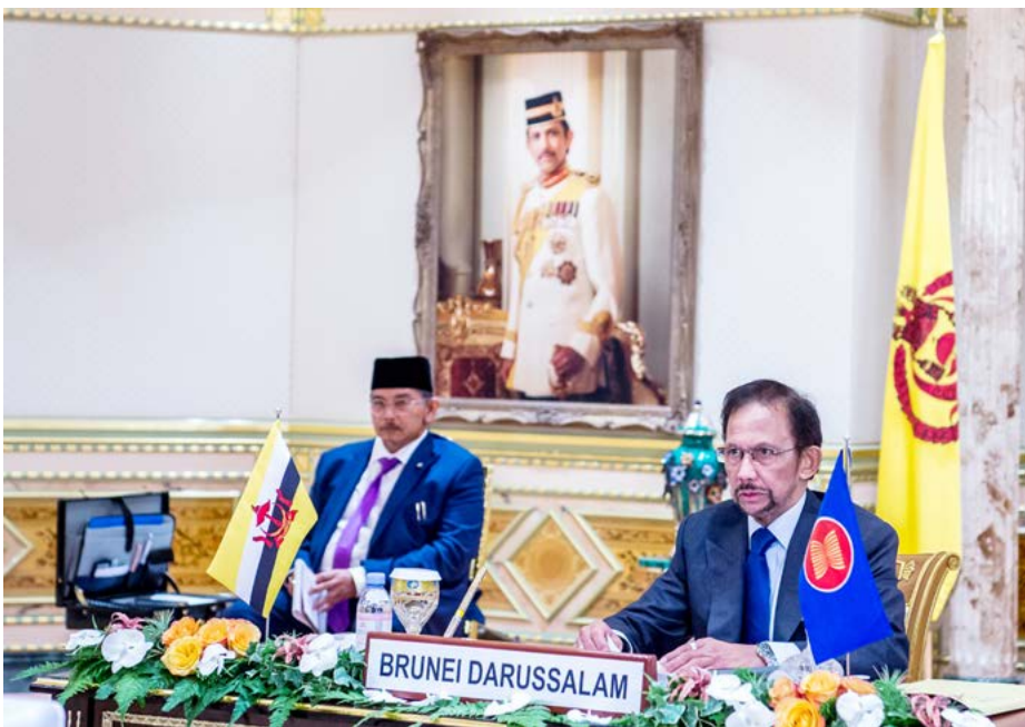
His Majesty Sultan Haji Hassanal Bolkiah Mu'izzaddin Waddaulah ibni Al-Marhum Sultan Haji Omar 'Ali Saifuddien Sa'adul Khairi Waddien, Sultan and Yang Di-Pertuan of Brunei Darussalam delivering a titah (royal speech) at the 23 rd ASEAN-China Summit.

Next year is a significant year to mark the 30 th Anniversary of ASEAN-China Dialogue Relations and Brunei-China Diplomatic Relations, as well as the centenary of the founding of the Communist Party of China.