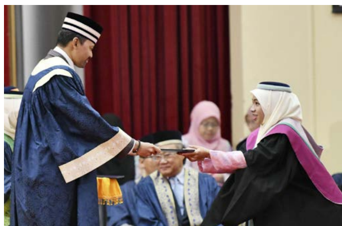
His Royal Highness Prince (Dr.) Haji Al-Muhtadee Billah ibni His Majesty Sultan Haji Hassanal Bolkiah Mu'izzaddin Waddaulah, the Crown Prince and Senior Minister at the Prime Minister's Office as Pro-Chancellor of University Brunei Darussalam (UBD) presenting a certificate to one of the graduates in the afternoon session.