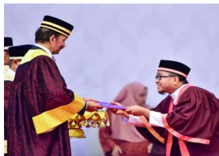
21. Produce religious scholars of quality and excellence