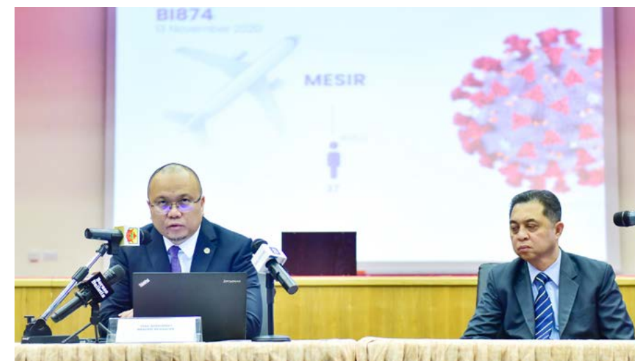
Yang Berhormat Minister of Health during a press conference on the latest COVID-19 situation in Brunei Darussalam at the Ministry of Health's (MoH) Al-Afiah Hall.

BANDAR SERI BEGAWAN, November 30 – In November, Brunei Darussalam recorded two new COVID-19 cases bringing the total number of confirmed cases to 150.