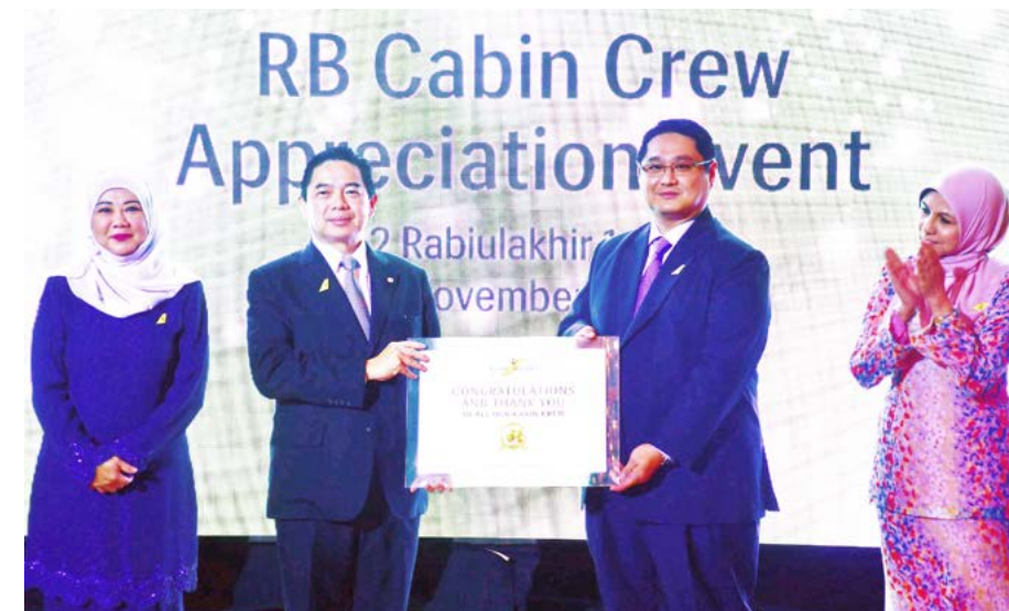
Yang Berhormat Minister at the Prime Minister's Office and Second Minister of Finance and Economy in his capacity as Chairman of RB Board of Directors presenting an appreciation plaque to a representative of Royal Brunei Airlines (RB).

JERUDONG, November 28 - Royal Brunei Airlines (RB) was announced the winner of the 2020 World's Leading Cabin Crew, announced at the 27 th Annual World Travel Awards (WTA), held virtually on November 27, marking an incredible accomplishment for the airline's cabin crew, to be ranked ahead of world-class airlines.