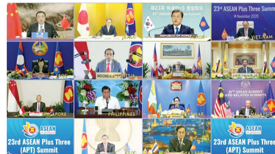
His Majesty Sultan Haji Hassanal Bolkiah Mu'izzaddin Waddaulah ibni Al-Marhum Sultan Haji Omar 'Ali Saifuddin Sa'adul Khairi Waddien, Sultan and Yang Di-Pertuan of Brunei Darussalam joining other ASEAN Plus Three (ASEAN+3) leaders for the 23 rd ASEAN+3 Summit virtually via video conference.

In addition, His Majesty encouraged the consideration of establishing arrangements between ASEAN+3