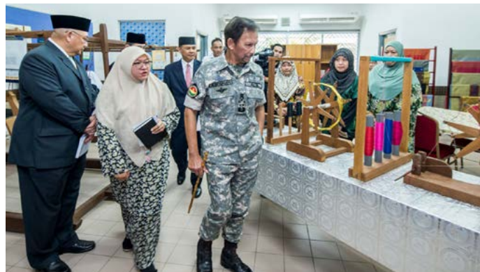
His Majesty Sultan Haji Hassanal Bolkiah Mu'izzaddin Waddaulah ibni Al-Marhum Sultan Haji Omar 'Ali Saifuddien Sa'adul Khairi Waddien, Sultan and Yang Di-Pertuan of Brunei Darussalam visiting a workshop at Pusat Bahagia (above and right).