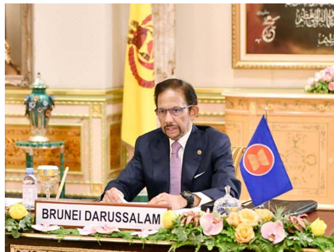
His Majesty Sultan Haji Hassanal Bolkiah Mu'izzaddin Waddaulah ibni Al-Marhum Sultan Haji Omar 'Ali Saifuddien Sa'adul Khairi Waddien, Sultan and Yang Di-Pertuan of Brunei Darussalam delivering a titah (royal speech) at the Closing Ceremony of the 37th ASEAN Summit and Related Summits and Handing Over of the ASEAN Chairmanship to Brunei Darussalam.

The people always come first in advancing together as one ASEAN Community, guided by values and aspirations articulated decades ago.