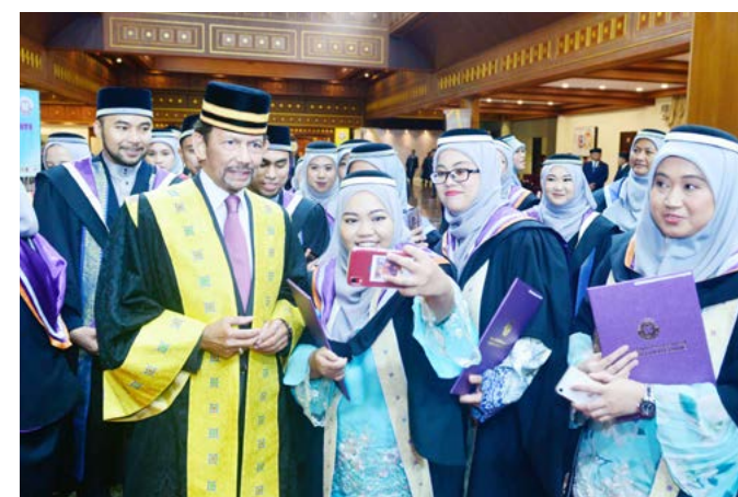
His Majesty the Sultan and Yang Di-Pertuan of Brunei Darussalam and His Royal Highness Prince (Dr.) Haji Al-Muhtadee Billah the Crown Prince and Senior Minister at the Prime Minister's Office and Pro-Chancellor of UTB consented to take photos with graduates at the UTB's 8 th Convocation (above and below).