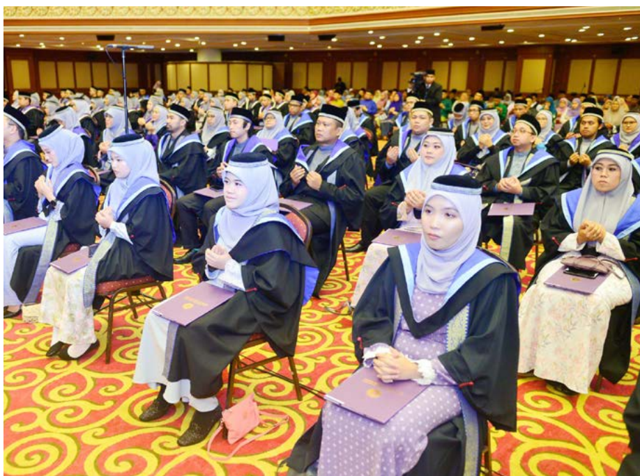
The graduates with their certificates during the ceremony (above and below).