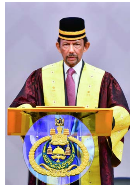
His Majesty Sultan Haji Hassanal Bolkiah Mu'izzaddin Waddaulah ibni Al-Marhum Sultan Haji Omar 'Ali Saifuddien Sa'adul Khairi Waddien, Sultan and Yang Di-Pertuan of Brunei Darussalam, Chancellor of Seri Begawan Religious Teachers University College (KUPU SB) delivering a titah (royal speech) during the 10 th Convocation of KUPU SB.

BERAKAS, November 23 – His Majesty Sultan Haji Hassanal Bolkiah Mu'izzaddin Waddaulah ibni Al-Marhum Sultan Haji Omar 'Ali Saifuddien Sa'adul Khairi Waddien, Sultan and Yang Di-Pertuan of Brunei Darussalam in a titah (royal speech) emphasised that the country places great hope on educators to shape and produce a generation that is excellent in all aspects, particularly in knowledge and noble character.