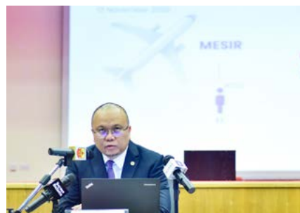
29. COVID-19: 2 new cases recorded in August