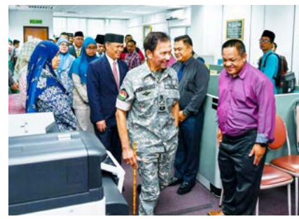
22. Issues regarding youths should not be neglected