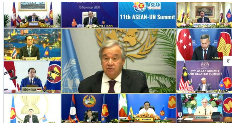
His Majesty Sultan Haji Hassanal Bolkiah Mu'izzaddin Waddaulah ibni Al-Marhum Sultan Haji Omar 'Ali Saifuddin Sa'adul Khairi Waddien, Sultan and Yang Di-Pertuan of Brunei Darussalam joining ASEAN Leaders and ASEAN Dialogue Partners for the 11 th ASEAN-UN Summit, held virtually via video conference.

BANDAR SERI BEGAWAN, November 15 – His Majesty Sultan Haji Hassanal Bolkiah Mu'izzaddin Waddaulah ibni Al-Marhum Sultan Haji Omar 'Ali Saifuddin Sa'adul Khairi Waddien, Sultan and Yang Di-Pertuan of Brunei Darussalam, in a titah (royal speech) congratulated Secretary-General António Guterres on the 75 th Anniversary of the United Nations (UN) and commended the UN's success and the World Health Organization (WHO) in leading the global response against the COVID-19 pandemic, while expressing support to the UN in his regard.