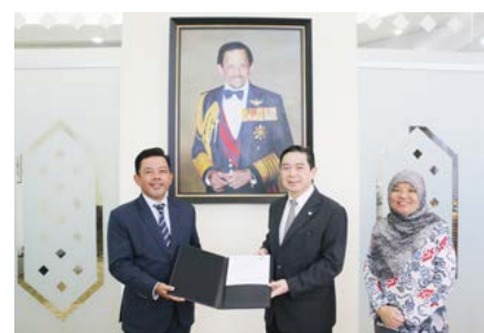
30. ABAC Brunei Presents ABAC Report