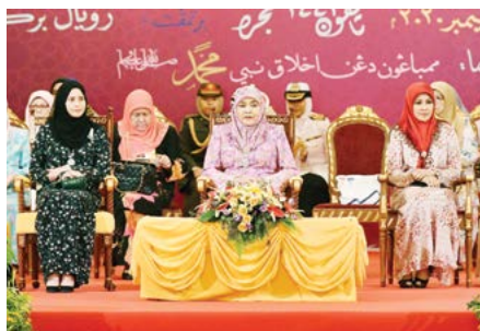
25. Her Majesty graces Women's Special Assembly