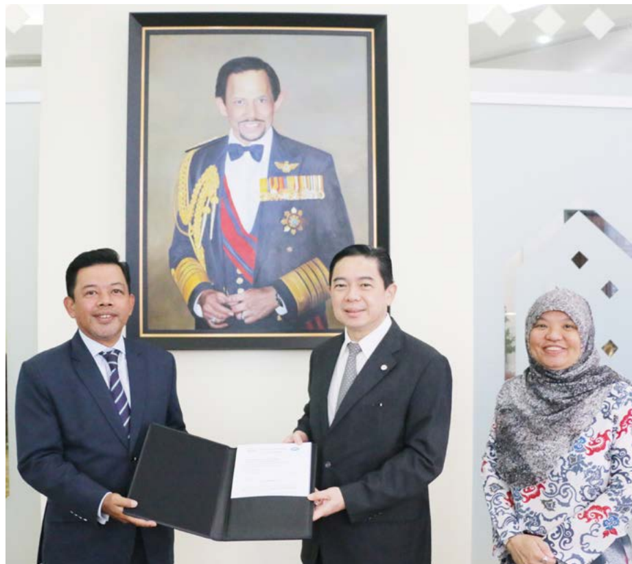
Yang Berhormat Minister at the Prime Minister's Office and Second Minister of Finance and Economy receiving the APEC Business Advisory Council (ABAC) Report from members of ABAC Brunei Darussalam.