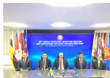
31. Ensure resilience of ASEAN transport sector