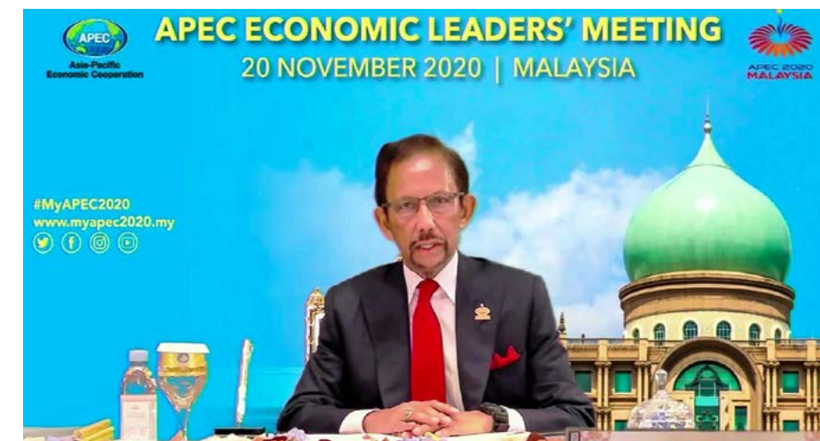
His Majesty the Sultan and Yang Di-Pertuan of Brunei Darussalam delivering a titah (royal speech) during APEC Leaders for the 27th AELM Leaders' Retreat.

As APEC economies work together to mitigate impacts of COVID-19, the relevance of APEC is more pronounced as