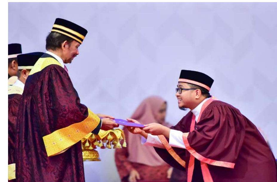
His Majesty the Sultan and Yang Di-Pertuan of Brunei Darussalam presenting certificates to graduates (above and below).