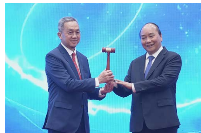
His Excellency the Prime Minister of the Socialist Republic of Viet Nam as ASEAN Chairman for 2020 hand over the ASEAN Chairmanship to Brunei Darussalam who will be the Chair of ASEAN for 2021.

The Closing Ceremony began with remarks by His Excellency Nguyễn Xuân Phúc, the Prime Minister of the Socialist Republic of Viet Nam as the ASEAN Chairman for 2020, among other things, reiterated ASEAN's strong commitment to multilateralism, dialogue, ASEAN Centrality, and shaping an inclusive rules-based regional architecture. The ASEAN Identity was emphasised in contributing to sustainable development of the region.