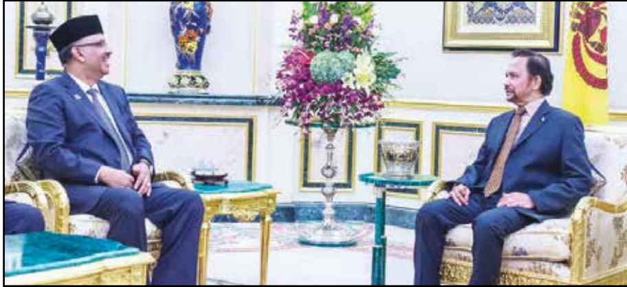
His Excellency Tan Sri Doctor Ali Hamsa, the Chief Secretary to the Government of Malaysia on November 26.

His Majesty Sultan Haji Hassanal Bolkiah Mu'izzaddin Waddaulah ibni Al-Marhum Sultan Haji Omar 'Ali Saifuddien Sa'adul Khairi Waddien, Sultan and Yang Di-Pertuan of Brunei Darussalam receives in audience at Istana Nurul Iman from: