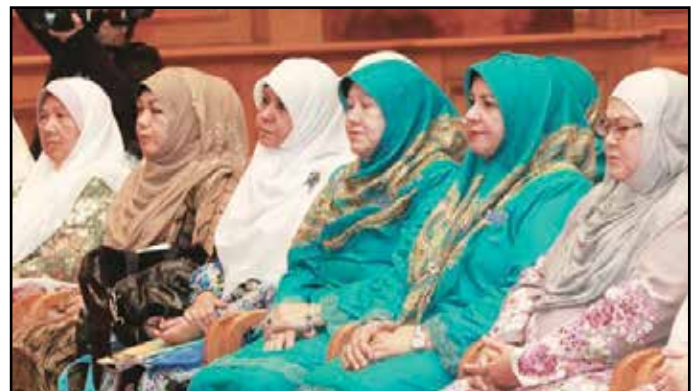
A section of the participants during the seminar.