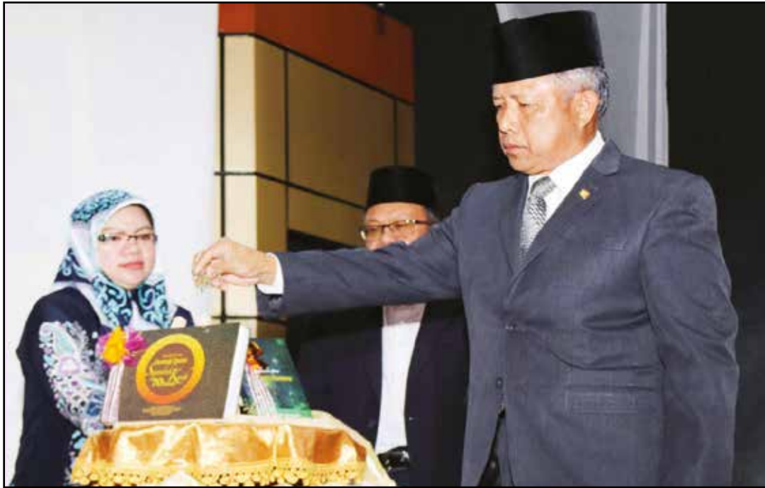
Yang Berhormat Pehin Datu Lailaraja Major General (Rtd) Dato Paduka Seri Haji Awang Halbi bin Haji Mohd Yussof, Minister of Culture, Youth and Sports launching the 6th Brunei Laureate Meeting 2016.

BANDAR SERI BEGAWAN, November 29 – Literary authors are an important segment of the society. Through writing, they found a myriad of thoughts, opinions, criticism, ideas and new knowledge in together developing Brunei Darussalam.