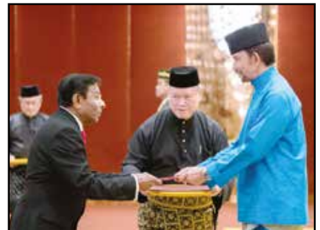
His Excellency Nimal Weeraratne, High Commissioner of the Democratic Socialist Republic of Sri Lanka.