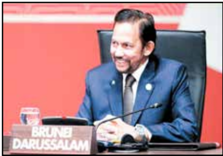
1. Committed to Reduce Climate Change Impact