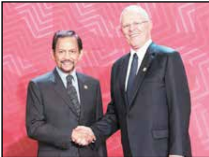
9. His Majesty Attends 24th APEC Economic Leaders Meeting