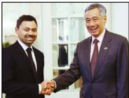
11. His Royal Highness The Crown Prince Visits Singapore