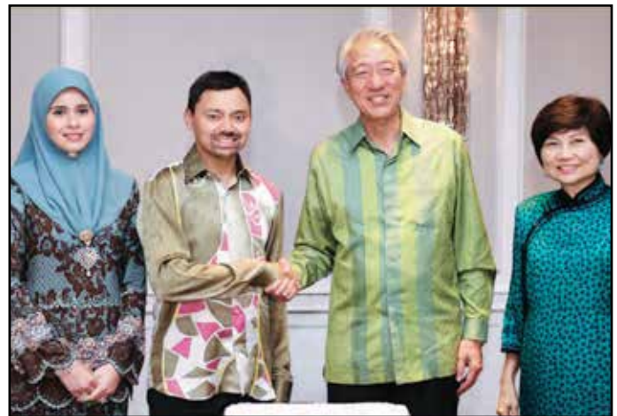
His Royal Highness the Crown Prince and Her Royal Highness Pengiran Anak Isteri Pengiran Anak Sarah binti Pengiran Haji Salleh Ab. Rahaman during a welcome dinner hosted by Deputy Prime Minister Teo Chee Hean and spouse.

His Royal Highness' visit reaffirms the excellent and long-standing ties between Brunei Darussalam and Singapore, and will further strengthen the deep and multi-faceted cooperation.