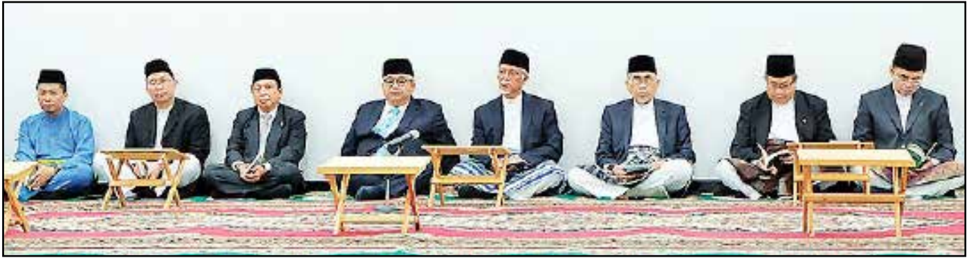
Among those present during the Thanksgiving Ceremony, to mark the moving of operations to the new Tutong District Courts building.

TUTONG, November 24 - The State Judiciary Department of the Prime Minister's Office, together with the Civil and Syariah Courts, held a Thanksgiving Ceremony in conjunction with the moving of operations to the newly completed Tutong District Courts building.