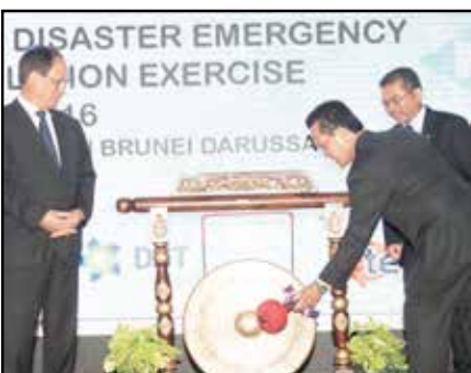
14. Brunei Hosts ARDEX 2016