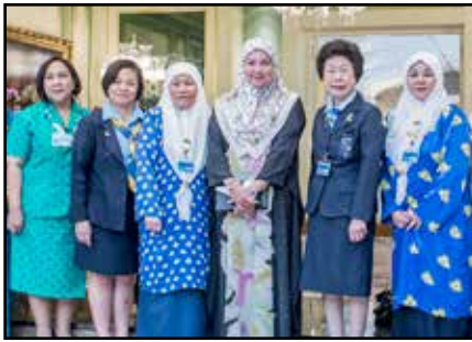
5. Royalty Receives FAPW Delegation