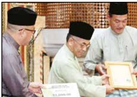
Yang Berhormat Dato Seri Setia Awang Haji Ali bin Haji Apong, Minister of Primary Resources and Tourism presenting the BRUNEI GAP certificate to the co-owner of Eco Nadi Agrobiz.

KIARONG, October 31 - ECO Nadi Agrobiz, which is a local agricultural company, has gained BRUNEI GAP (Good Agricultural Practice Brunei) recognition from the Department of Agriculture and Agrifood in May 2016.