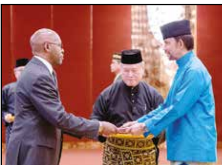
His Excellency Walubita Imakando, High Commissioner of the Republic of Zambia.