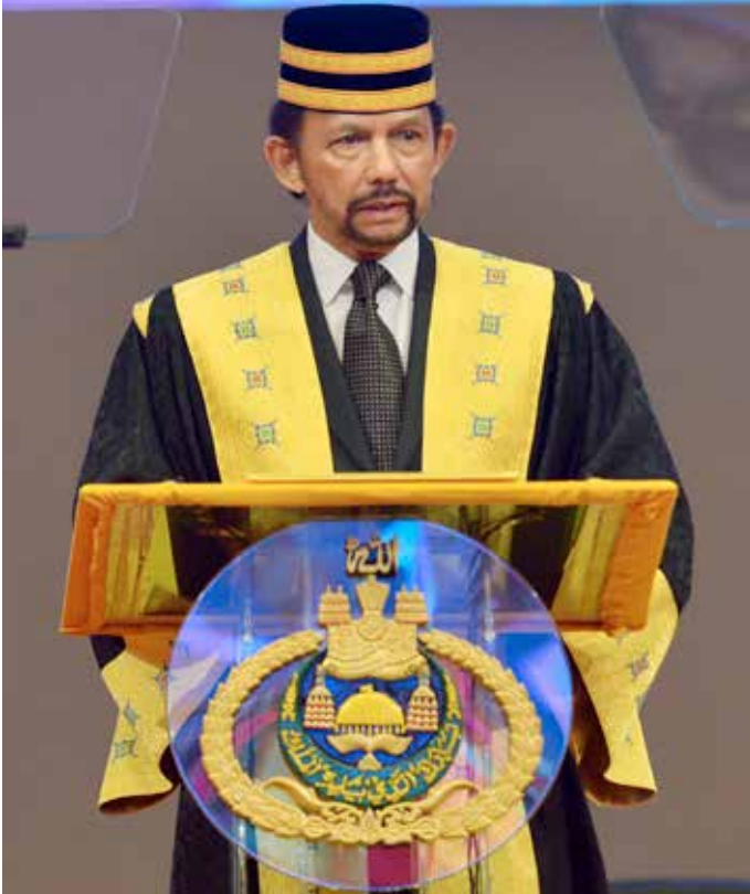
His Majesty Sultan Haji Hassanal Bolkiah Mu'izzaddin Waddaulah ibni Al-Marhum Sultan Haji Omar 'Ali Saifuddien Sa'adul Khairi Waddien, Sultan and Yang Di-Pertuan of Brunei Darussalam delivering a titah .

BERAKAS, NOVEMBER 7 - HIS Majesty Sultan Haji Hassanal Bolkiah Mu'izzaddin Waddaulah ibni Al-Marhum Sultan Haji Omar 'Ali Saifuddien Sa'adul Khairi Waddien, Sultan dan Yang Di-Pertuan Negara Brunei Darussalam as the Chancellor of Universiti Teknologi Brunei (UTB) urged UTB to increase its efforts to introduce relevant programmes to boost the economic development of the nation.