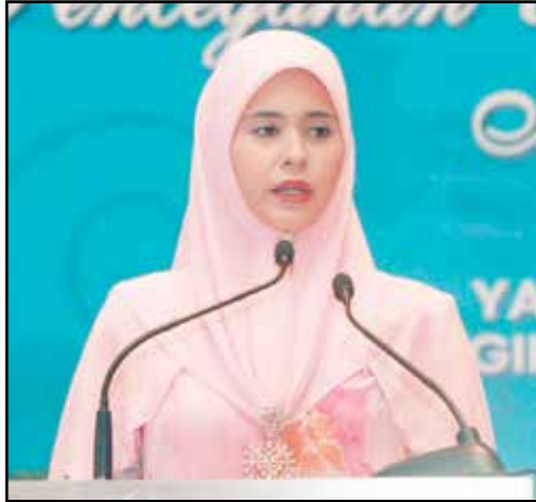
Her Royal Highness Paduka Seri Pengiran Anak Isteri Pengiran Anak Sarah binti Pengiran Haji Salleh Ab Rahaman delivering her sabda at the launching of the seminar.

“More importantly, PDE emphasises on efforts towards building good individuals with spiritual, religious, political, moral, cultural, and social attitudes and values.”