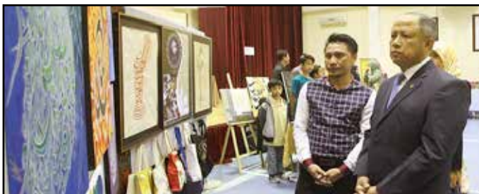
Yang Berhormat Pehin Datu Lailaraja Major General (Rtd) Dato Paduka Seri Haji Awang Halbi bin Haji Mohd Yussof, Minister of Culture, Youth and Sports officially opens the History Exhibition Gallery.

BANDAR SERI BEGAWAN, November 26 - Yang Berhormat Pehin Datu Lailaraja Major General (Rtd) Dato Paduka Seri Haji Awang Halbi bin Haji Mohd Yussof, Minister of Culture, Youth and Sports, launched the History Exhibition Gallery and 'Getting Close with History and Learning of Archives Programme' at the Brunei History Centre in collaboration with the State Archive and Department of Museums.