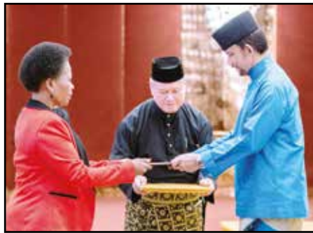
Her Excellency Samkelisiwe Isabel Mhlanga, High Commissioner of the Republic of South Africa.