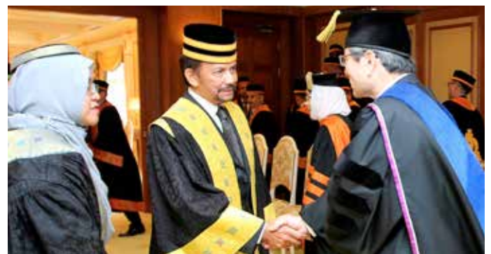
His Majesty the Sultan and Yang Di-Pertuan of Brunei Darussalam greeted by one of the UTB Council members.

UTB has a vision of becoming one of the top 10 engineering and technology universities in the Southeast Asia region by 2018 and is committed to fulfilling four strategic aspirations: to produce 360 degree students who are capable, responsible for the society and economic development of the country, and having a strong MIB values; excellent in all areas, namely teaching and learning, research and involvement in the community; establishing strategic partnerships with important stakeholders and the provision of diverse and stimulating intellectual learning environments.