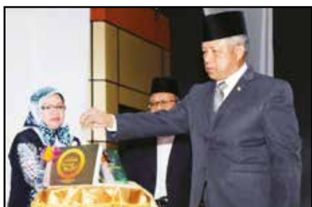
17. Literary Authors Important in Society