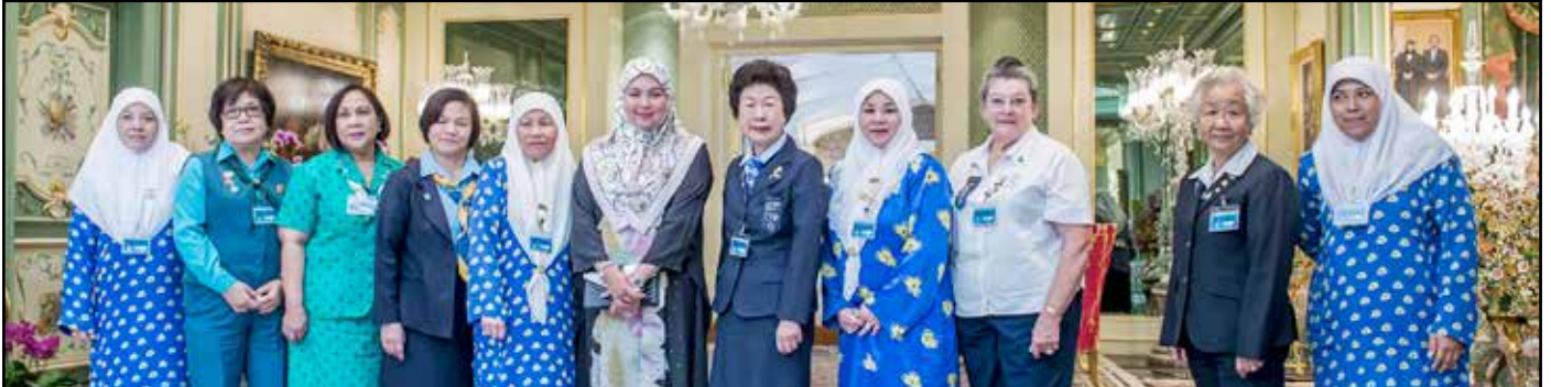
Her Royal Highness Princess Hajah Rashidah Sa'adatul Bolkiah binti His Majesty Sultan Haji Hassanal Bolkiah Mu'izzaddin Waddaulah, and the members of the Working Committee of the Friends of Asia Pacific World Association of Girl Guides and Girl Scouts (FAPW) in a group photo at the Istana Nurul Iman.

BANDAR SERI BEGAWAN, November 12 – Her Royal Highness Princess Hajah Rashidah Sa'adatul Bolkiah binti His Majesty Sultan Haji Hassanal Bolkiah Mu'izzaddin Waddaulah, Head of the Brunei Darussalam Girl Guides Association consented to receive a visit from members of the Working Committee of the Friends of Asia Pacific World Association of Girl Guides and Girl Scouts (FAPW) at the Istana Nurul Iman.