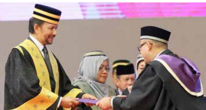
His Majesty the Sultan and Yang Di-Pertuan of Brunei Darussalam presenting the certificate to one of the graduates.