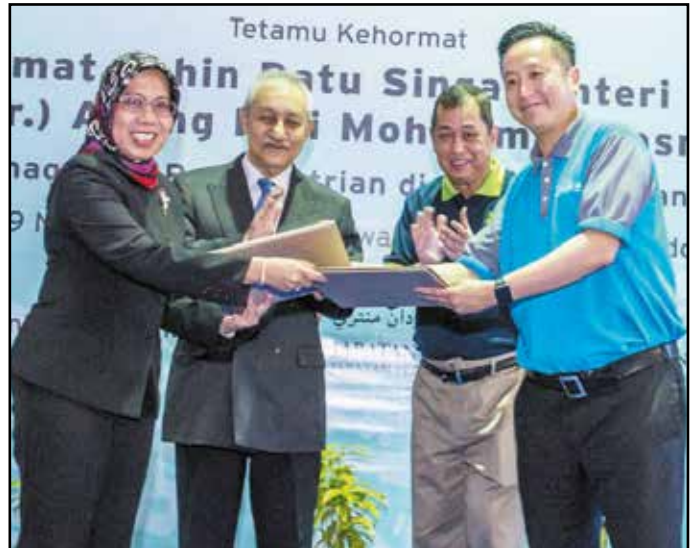
The exchange of documents between Darussalam Enterprise (DARE) and SME Corporation Malaysia. The exchange was witnessed by Yang Berhormat Pehin Datu Singamanteri Colonel (Rtd) Dato Seri Setia (Dr.) Awang Haji Mohammad Yasmin bin Haji Umar, Minister of Energy and Industry at the Prime Minister's Office.

The Career Fair Brunei 2016 is one of the government's efforts to involve all sectors of industry in the country as a whole in one place and this is the starting point of the Government of His Majesty the Sultan and Yang Di-Pertuan of Brunei Darussalam for Brunei Job Centre.