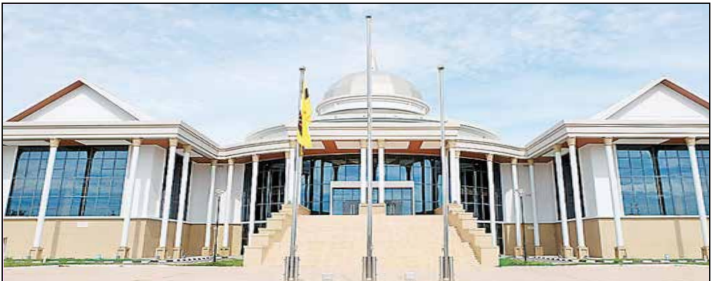
The new Tutong District Courts building