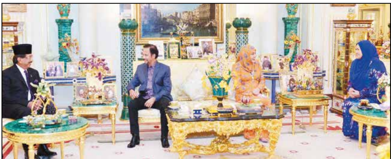
Yang Amat Berhormat Dato Seri Paduka Datuk Seri Panglima Haji Musa bin Haji Aman, Chief Minister of Sabah and spouse, Yang Amat Berbahagia Datin Seri Panglima Datuk Hajah Faridah binti Haji Tussin on November 28.

His Majesty Sultan Haji Hassanal Bolkiah Mu'izzaddin Waddaulah ibni Al-Marhum Sultan Haji Omar 'Ali Saifuddien Sa'adul Khairi Waddien, Sultan and Yang Di-Pertuan of Brunei Darussalam and Her Majesty Duli Raja Isteri Pengiran Anak Hajah Saleha binti Al-Marhum Pengiran Pemancha Pengiran Anak Haji Mohamed Alam receives in audience at Istana Nurul Iman from: