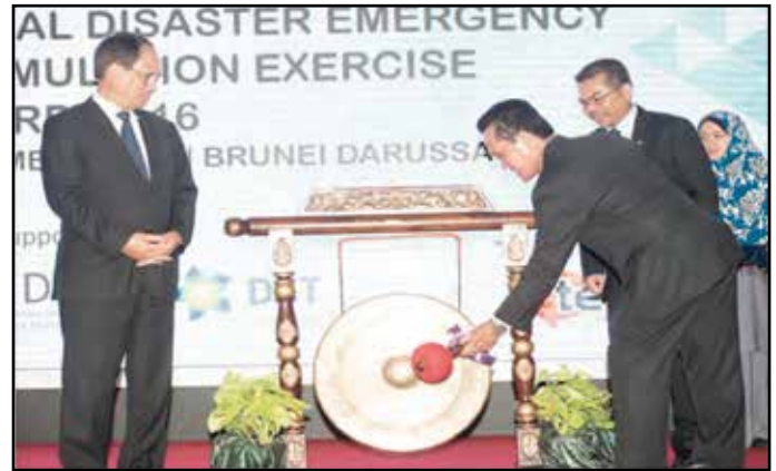
The Minister of Home Affairs launching the ARDEX 2016.

BANDAR SERI BEGAWAN, November 29 - The 'One ASEAN One Response' Strategy, in handling disaster, portrays ASEAN's continuous commitment in protecting its people.