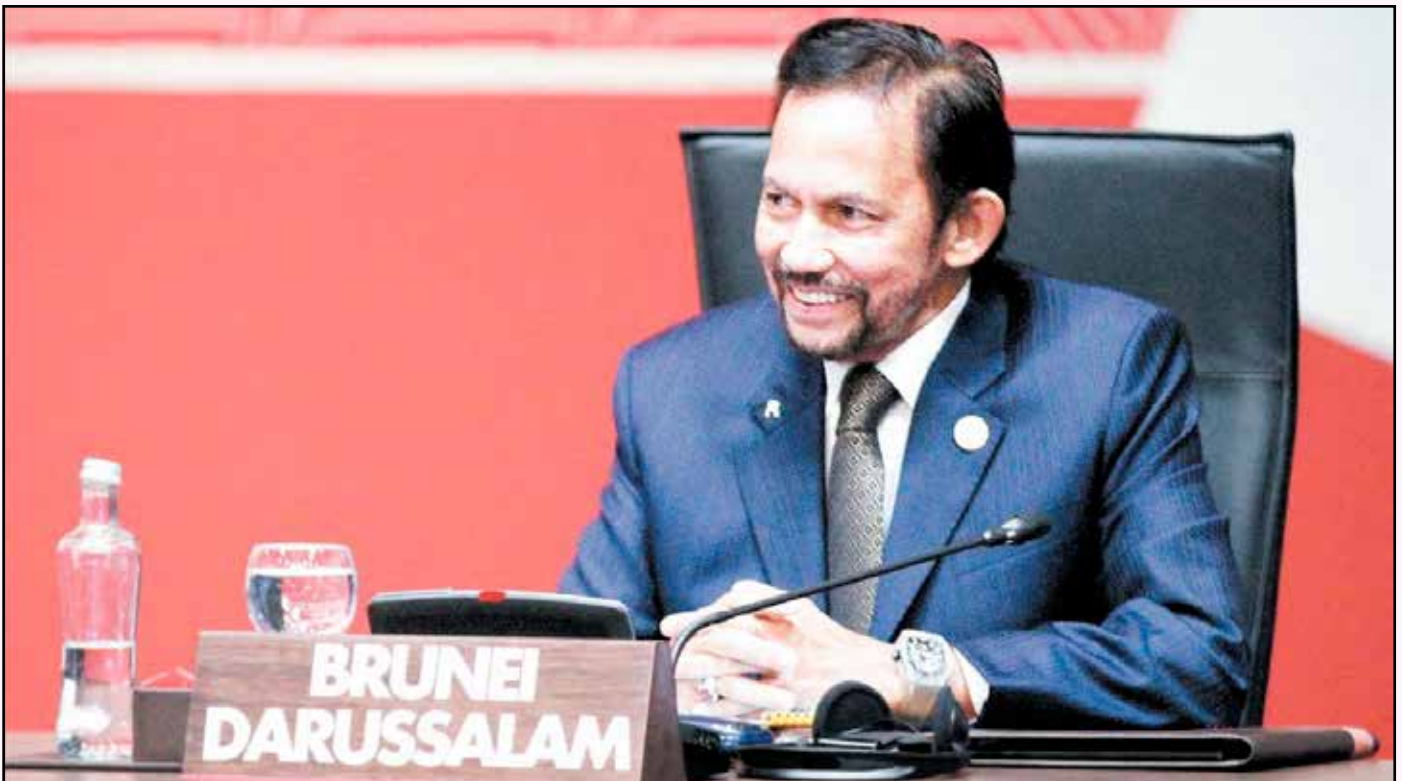
His Majesty Sultan Haji Hassanal Bolkhiah Mu'izzaddin Waddaulah ibni Al-Marhum Sultan Haji Omar 'Ali Saifuddien Sa'adul Khairi Waddien, Sultan and Yang Di-Pertuan of Brunei Darussalam at the Retreat Session of the 24th APEC Economic Leaders Meeting (AELM).

LIMA, PERU REPUBLIC, November 20 - His Majesty Sultan Haji Hassanal Bolkhiah Mu'izzaddin Waddaulah ibni Al-Marhum Sultan Haji Omar 'Ali Saifuddien Sa'adul Khairi Waddien, Sultan and Yang Di-Pertuan of Brunei Darussalam yesterday consented to attend the Retreat Session of the 24th APEC Economic Leaders Meeting (AELM) that was held at the Lima Convention Centre, Republic of Peru.