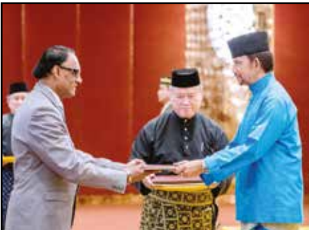
His Excellency Issop Patel, High Commissioner of the Republic of Mauritius.