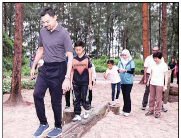
His Royal Highness the Crown Prince, Her Royal Highness Pengiran Anak Isteri Pengiran Anak Sarah and their children, Yang Teramat Mulia Pengiran Muda 'Abdul Muntaqim and Yang Teramat Mulia Pengiran Anak Muneerah Madhul Bolkiah at Coney Island Park, Punggol Waterway.