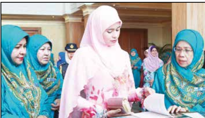
Her Royal Highness touring the exhibition held during the occasion.

In that direction, BASMIDA as the local NGO that has received the ASEAN People’s Award should move further forward to increase their role and contribution to ensure that the dynamic and progressive development aspirations of the ASEAN region.