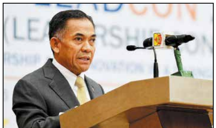
Yang Berhormat Dato Seri Setia Awang Haji Ali bin Haji Apong, Minister of Primary Resources and Tourism delivering his speech during the launching of the LeadCon 2016.