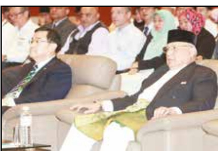
18. Islamic Fintech Potential for Collaboration and Investment