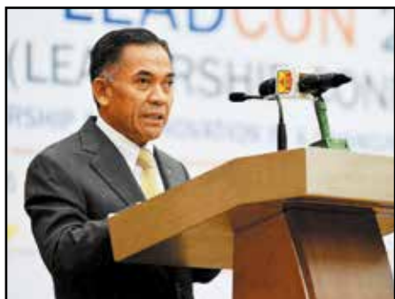
15. Leadership Conference 2016