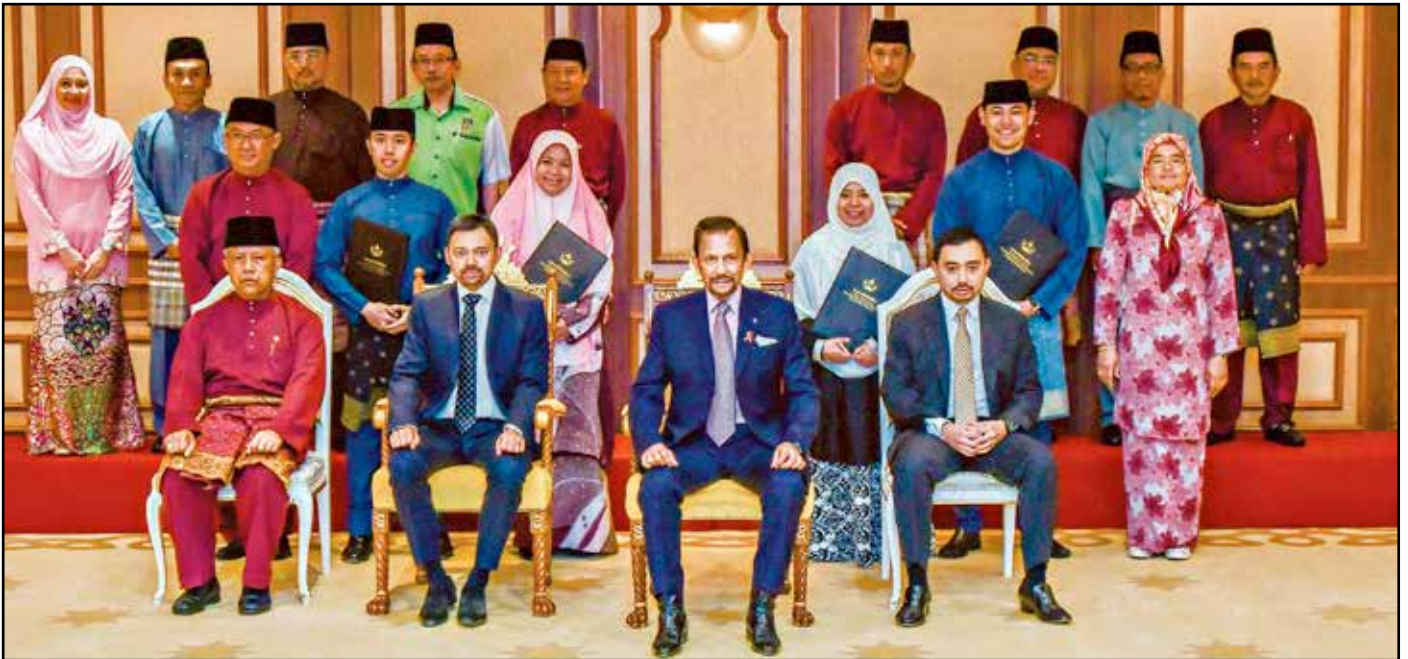
His Majesty the Sultan and Yang Di-Pertuan of Brunei Darussalam with the recipients of the Youth Awards 2016 in conjunction with the 11th National Youth Day celebration.