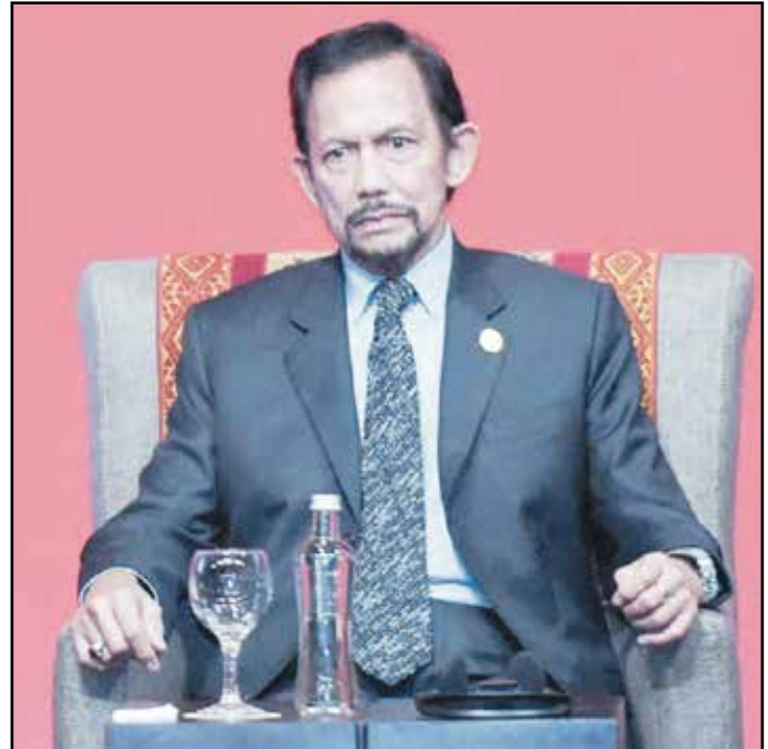
APEC Business Advisory Council (ABAC) Dialogue Session held at the Lima Convention Centre, Republic of Peru with the attendance of His Majesty Sultan Haji Hassanal Bolkiah Mu'izzaddin Waddaulah ibni Al-Marhum Sultan Haji Omar 'Ali Saifuddien Sa'adul Khairi Waddien, Sultan and Yang Di-Pertuan of Brunei Darussalam.

The Asia Pacific Economic Co-operation Business Advisory Council (ABAC) is the private sector arm of the APEC Cooperation Forum, which submits proposals to the APEC Economic Leaders through the annual dialogue and advises APEC officials on the business sector priorities and challenges.