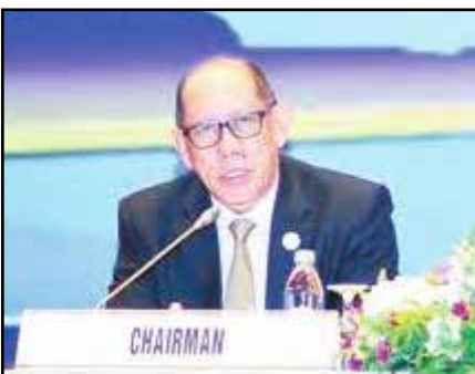
16. Relationships Important to Reduce ASEAN Digital Divide