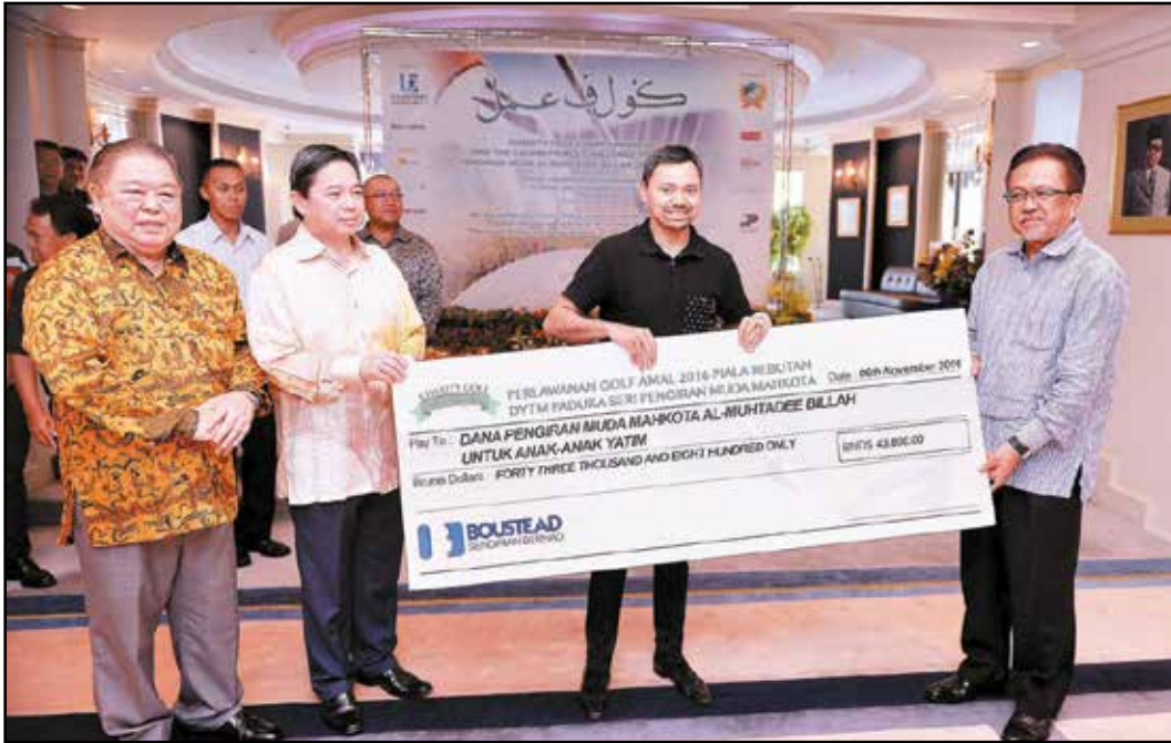
His Royal Highness Prince Haji Al-Muhtadee Billah ibni His Majesty Sultan Haji Hassanal Bolkiah Mu'izzaddin Waddaulah, the Crown Prince and Senior Minister at the Prime Minister's Office presenting a mock cheque for Fund for Orphans (DANA).

BANDAR SERI BEGAWAN, November 6 - His Royal Highness Prince Haji Al-Muhtadee Billah ibni His Majesty Sultan Haji Hassanal Bolkiah Mu'izzaddin Waddaulah, the Crown Prince and Senior Minister at the Prime Minister's Office graced the 11th Challenge Trophy for Duli Yang Teramat Mulia Paduka Seri Pengiran Muda Mahkota Al-Muhtadee Billah Fund for Orphans (DANA) Charity Golf Tournament 2016 prize presentation ceremony at the Royal Brunei Golf and Country Club.