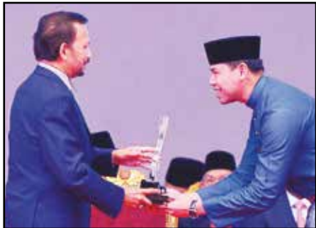
6. Youths Urged to Broaden Horizons