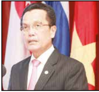
Yang Berhormat Pehin Orang Kaya Seri Kerna Dato Seri Setia Dr. Haji Awang Abu Bakar bin Haji Apong, Minister of Home Affairs, delivering his opening speech.