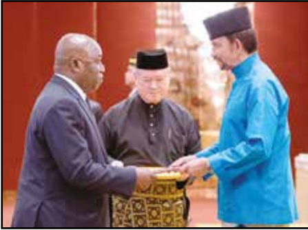
His Excellency Sylvestre Kouassi Bile, Ambassador Extraordinary and Plenipotentiary of the Republic of Côte d'Ivoire.