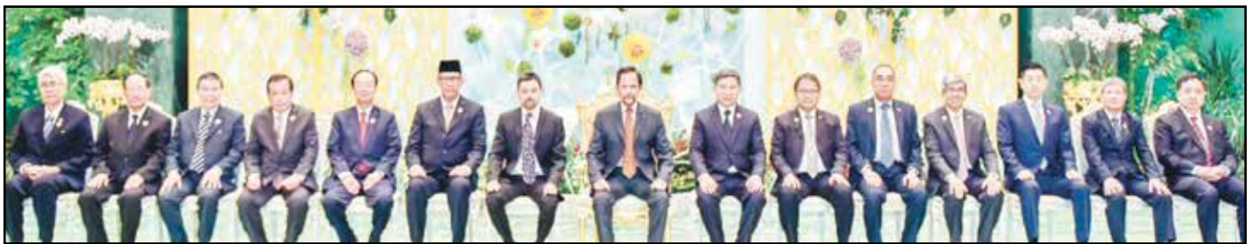
Ministers and heads of delegations from ASEAN member states and dialogue partners, as well as the Secretary General of ASEAN who were in Brunei Darussalam for the 16th ASEAN Telecommunications and Information Technology Ministers Meeting (16th ASEAN TELMIN) on November 26. Also in attendance was His Royal Highness Prince Haji Al-Muhtadee Billah, the Crown Prince and Senior Minister at the Prime Minister's Office.

His Majesty Sultan Haji Hassanal Bolkiah Mu'izzaddin Waddaulah ibni Al-Marhum Sultan Haji Omar 'Ali Saifuddien Sa'adul Khairi Waddien, Sultan and Yang Di-Pertuan of Brunei Darussalam and Her Majesty Duli Raja Isteri Pengiran Anak Hajah Saleha binti Al-Marhum Pengiran Pemancha Pengiran Anak Haji Mohamed Alam receives in audience at Istana Nurul Iman from: