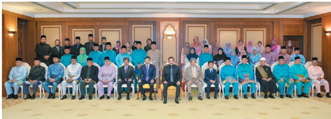
His Majesty, His Royal Highness Prince Haji Al-Muhtadee Billah, the Crown Prince and Senior Minister at the Prime Minister's Office; His Royal Highness Prince Mohamed Bolkihah; His Royal Highness Prince Haji Jefri Bolkihah and His Royal Highness Prince 'Abdul Wakeel in a group photo with the 26 th Teachers' Day Awards recipients as well as the Executive Committee of the event.

The Minister also said that the Ministry of Education (MOE) would continue to implement initiatives to improve the quality of teachers and all those involved in the country. One such initiative