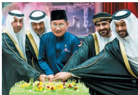
15. Reception in conjunction with the Kingdom of Saudi Arabia's 85 th National Day