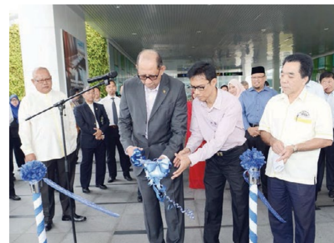
Yang Berhormat Dato Seri Setia Awang Haji Mustappa bin Haji Sirat, Minister of Communications launching the newly implemented metered taxi system at the Brunei International Airport.

"With the metered taxi system and steps taken by the Land Transport Department and the Motor Transport Licensing Authority, we hope that it will help increase the earnings of taxi