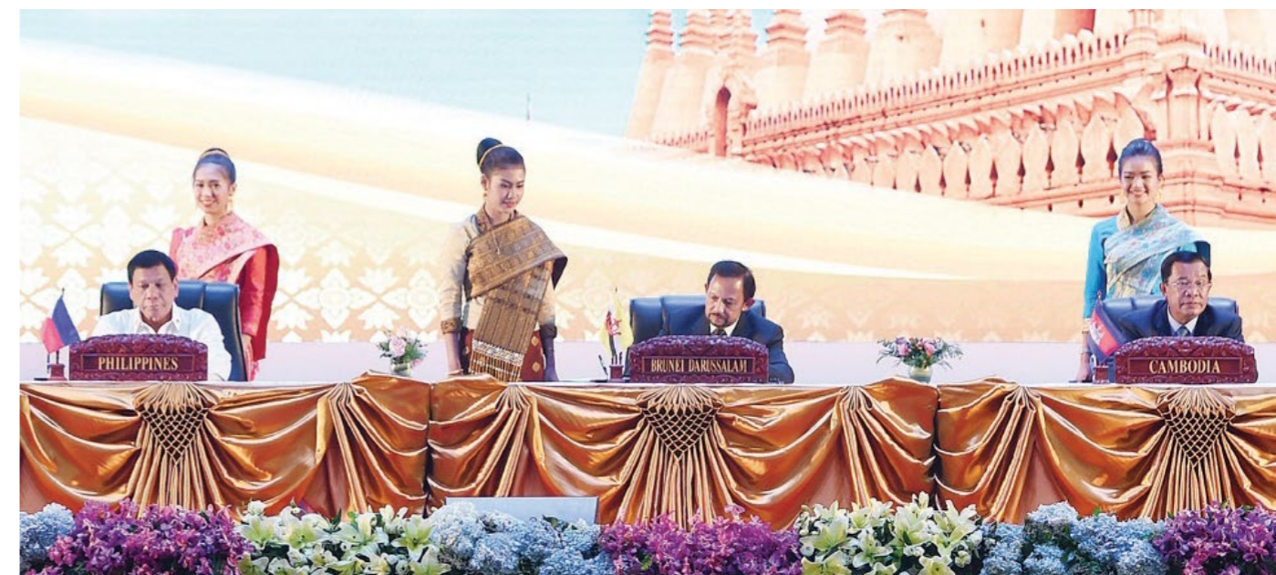
His Majesty signing the ASEAN Declaration; One ASEAN, One Response : ASEAN Responding to Disasters as One in the Region and Outside the Region.