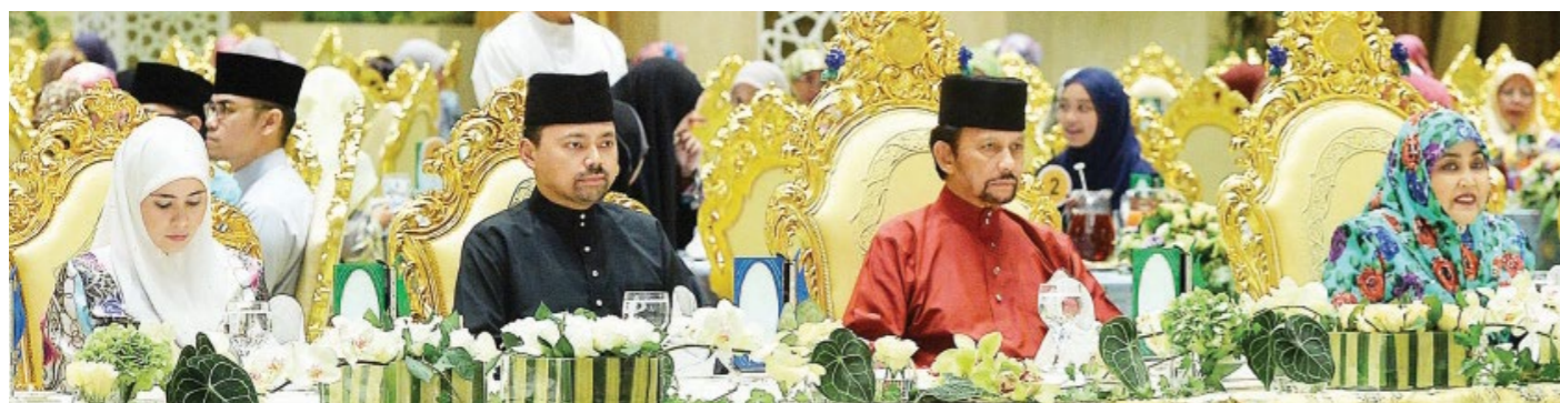
Their Majesties, His Royal Highness Prince Haji Al-Muhtadee Billah, the Crown Prince and Senior Minister at the Prime Minister's Office and Her Royal Highness Paduka Seri Pengiran Anak Isteri Pengiran Anak Sarah binti Pengiran Haji Salleh Ab Rahaman at the Hari Raya Aidiladha Celebration.