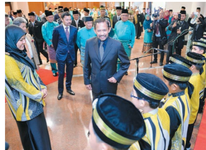
His Majesty mingling with primary students at the 26 th Teachers' Day Celebration.