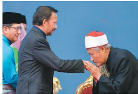
7. His Majesty graces 26 th Teachers' Day