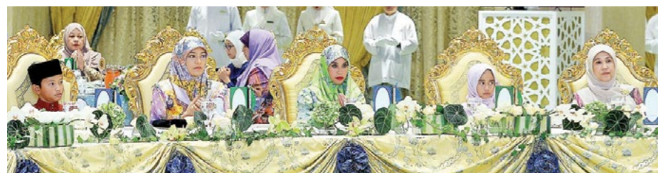
His Royal Highness Prince 'Abdul Wakeel, Her Royal Highness Princess Hajah Majeedah Nuurul Bolkiah, Her Royal Highness Princess 'Azemah Ni'matul Bolkiah, Her Royal Highness Princess Ameerah Wardatul Bolkiah, and Her Royal Highness Princess Hajah Amal Nasibah at the ceremony.

Their Majesties later consented to present sacrificial meat to 100 recipients comprised of 50 men and 50 women.