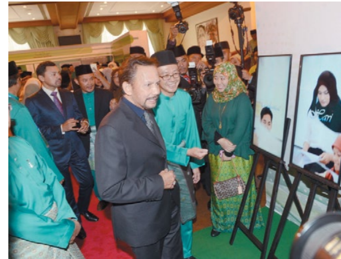
His Majesty viewing the 26 th Teachers' Day Exhibition, which showcased the students' celebrated inventions.