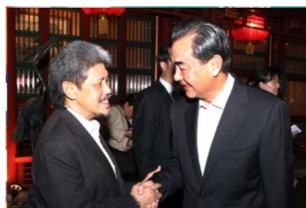
18. AMEM increases collaboration in energy sector