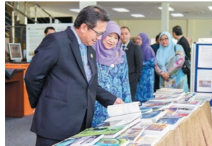
12. Libraries in need to adapt to modern changes