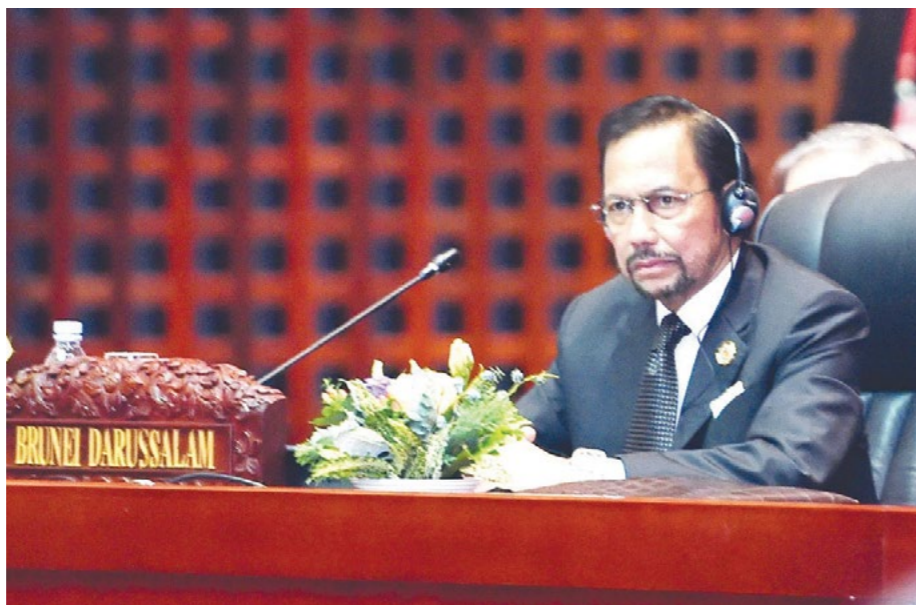
His Majesty Sultan Haji Hassanal Bolqiah Mu'izzaddin Waddaulah ibni Al-Marhum Sultan Haji Omar 'Ali Saifuddin Sa'adul Khairi Waddien, Sultan and Yang Di-Pertuan of Brunei Darussalam at Plenary Session of the 28 th ASEAN Summit.

Community was launched last year, public expectations from within and beyond the region were high. Despite the importance of these economic initiatives, and the potential benefits to the private sectors, ASEAN still has much to do if it were to reinforce its credibility, as a place to do business.