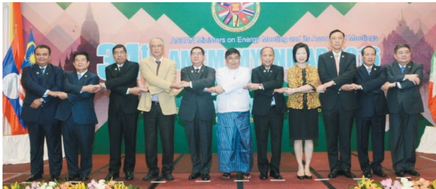
Heads of ASEAN Delegation in a group photo at the 34 th ASEAN Ministers on Energy Meeting (AMEM) and its Associated Meetings in Nay Pyi Taw, Republic of the Union of Myanmar.

NAY PYI TAW, REPUBLIC OF THE UNION OF MYANMAR, September 23 - The opening ceremony for the 34 th ASEAN Ministers on Energy Meeting (AMEM) and its Associated Meetings is currently taking place since the 21 st until the 23 rd of September 2016 at the Myanmar International Convention Centre II (MICC II). The ceremony also commemorated the launching of the ASEAN Energy Business Forum 2016.