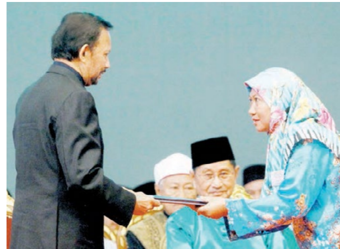
His Majesty presenting the 26 th Teachers' Day Awards to recipients (above and below).

is that teachers are given a variety of professional development training under the Teacher Professional Development Network.