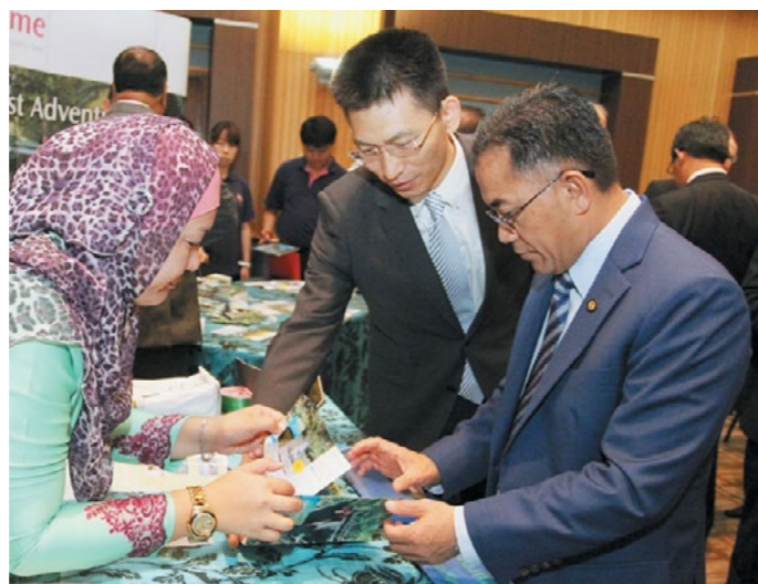
Yang Berhormat Dato Seri Setia Awang Haji Ali bin Haji Apong, Minister of Primary Resources and Tourism viewing the 'Temburong Holiday Destination' packages offered.

In addition, it will help and encourage local travel agents to engage more actively in promoting tourism products in domestic