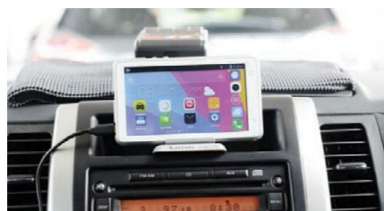
Taxis are equipped with a meter to ensure that taxi rates are controlled and regulated.