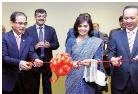
13. Conducive Business Environment encourages development of SMEs