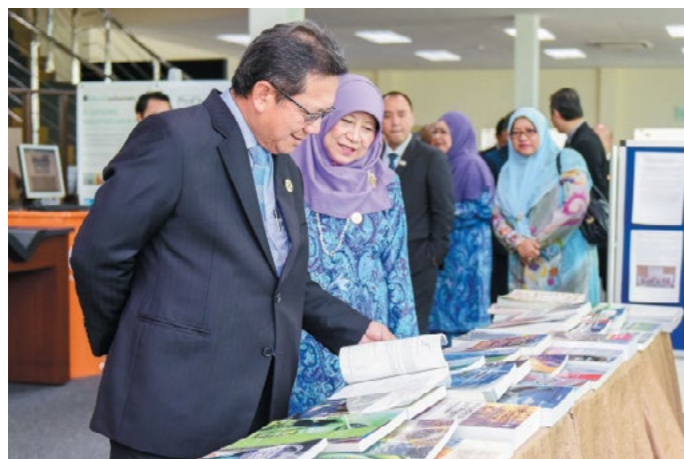
Yang Berhormat Pehin Orang Kaya Indera Pahlawan Dato Seri Setia Awang Haji Suyoi bin Haji Osman, Minister of Education touring the exhibitions at the 'Libraries Transform: Unlocking Your Potential as Librarians' conference held at the Universiti Teknologi Brunei (UTB) Library.