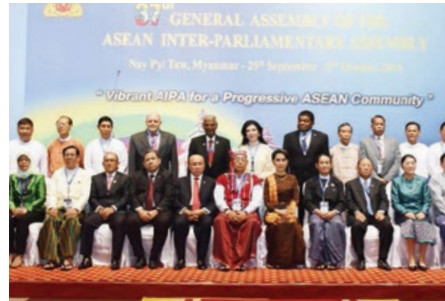
11. LegCo - Brunei fully supports 37 th AIPA