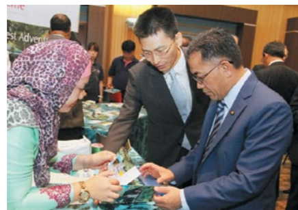
16. Temburong Holiday Destination packages offer interesting deals