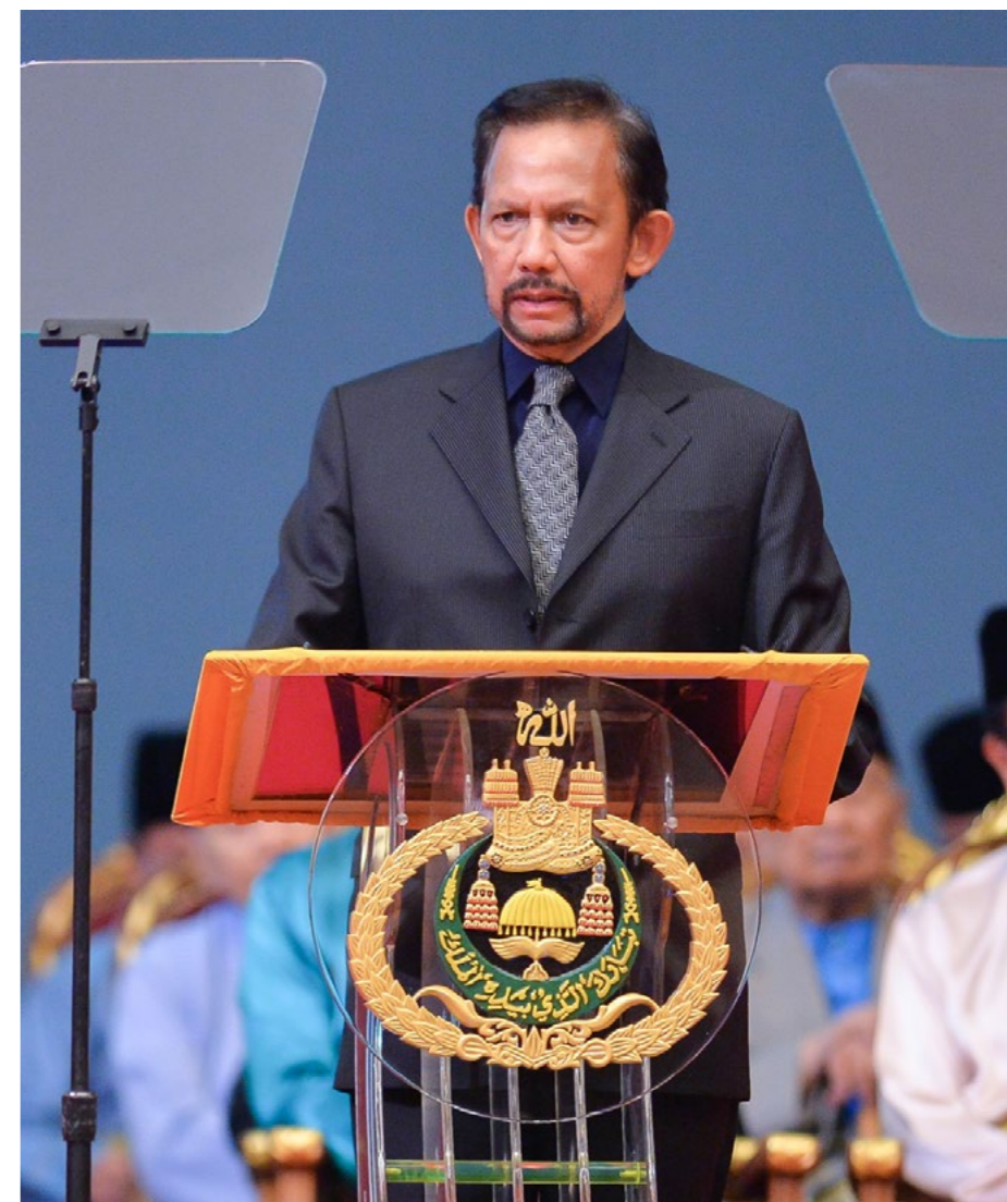
His Majesty Sultan Haji Hassanal Bolkiah Mu'izzaddin Waddaulah ibni Al-Marhum Sultan Haji Omar 'Ali Saifuddien Sa'adul Khairi Waddien, Sultan and Yang Di-Pertuan of Brunei Darussalam delivering a titah (royal speech) at the 26 th Teachers' Day celebration.

recitation of Surah Al-Fatihah dedicated to Al-Marhum Sultan Haji Omar 'Ali Saifuddien Sa'adul Khairi Waddien and teachers who have passed away, followed