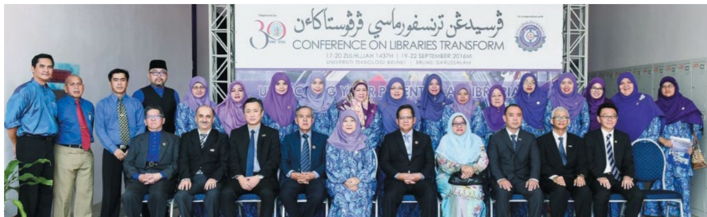
The Minister of Education in a group photo with members of the Brunei Darussalam Library Association (BLA).

"Other than that, MOE will assist in providing support towards activities of the BLA and libraries under the Ministry of Education in order to improve the quality of service and to achieve education excellence in support of the Brunei Vision 2035," concluded the Minister.