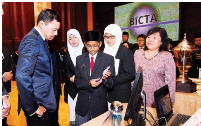
His Royal Highness viewing the exhibitions at BICTA 2016.

Regarding plans for APICTA in Taiwan, the team hopes to bring back results for the country's future.