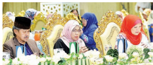
His Royal Highness Prince Mohamed Bolkiah and Her Royal Highness Pengiran Anak Isteri Pengiran Anak Hajah Zariah; and Yang Amat Mulia Pengiran Anak Isteri Pengiran Norhayati.