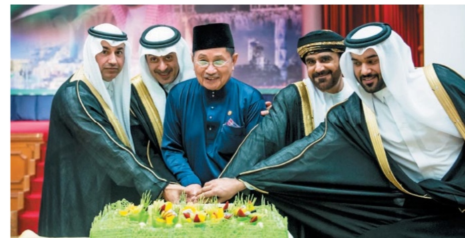
Yang Berhormat Pehin Udana Khatib Dato Paduka Seri Setia Ustaz Haji Awang Badaruddin bin Pengarah Dato Paduka Haji Othman, Minister of Religious Affairs with His Excellency Hisham bin Abdul Wahab bin Zar'ah, Ambassador Extraordinary and Plenipotentiary of Saudi Arabia to Brunei Darussalam during the cake cutting at the reception in conjunction with the 85 th National Day of the Kingdom of Saudi Arabia.

According to His Excellency, the new economy plan for the Kingdom of Saudi Arabia is suitable with the Saudi Vision 2030 where it aims to provide comfort to the people and the Government of