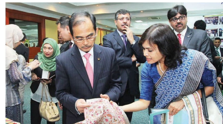
The Acting Minister receiving an explanation on the fineness of the texture produced by India.

strengthen the private sector in the local economy and to attract more foreign investors to invest in the country.