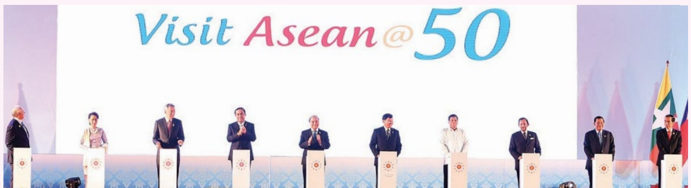
His Majesty Sultan Haji Hassanal Bolkiah Mu'izzaddin Waddaulah ibni Al-Marhum Sultan Haji Omar 'Ali Saifuddien Sa'adul Khairi Waddien, Sultan and Yang Di-Pertuan of Brunei Darussalam and the Prime Minister of the Lao People's Democratic Republic and Chairman of ASEAN as well as other ASEAN Leaders launching the Visit ASEAN@50: Golden Celebration.

VIENTIANE, LAOS, September 6 – His Majesty Sultan Haji Hassanal Bolkiah Mu'izzaddin Waddaulah ibni Al-Marhum Sultan Haji Omar 'Ali Saifuddien Sa'adul Khairi Waddien, Sultan and Yang Di-Pertuan of Brunei Darussalam attended the Opening Ceremony of the 28 th and 29 th ASEAN Summits and the Launch of the Visit ASEAN@50: Golden Celebration, held at the National Convention Centre, Vientiane.