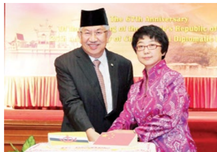
14. Brunei-China towards strategic cooperative relationship