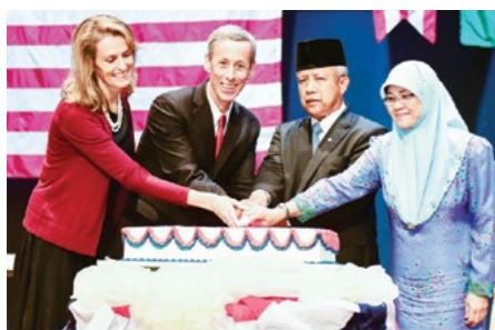
17. Brunei-US relations remains strong