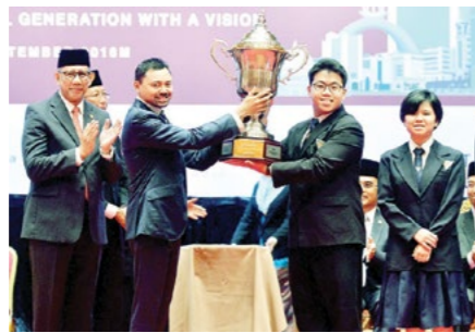
10. BHEALTH App, BICTA 2016 Champion