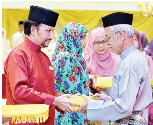
Their Majesties distributing the sacrificial meat to recipients.