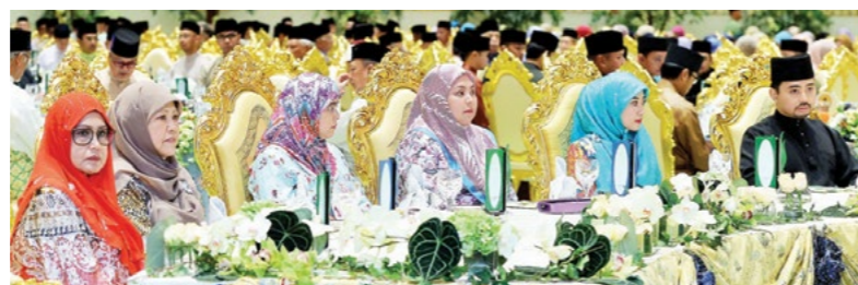
His Royal Highness Prince 'Abdul Malik and Yang Amat Mulia Pengiran Anak Isteri Pengiran Raabi'atul 'Adawiyah; Her Royal Highness Princess Hajah Rashidah Sa'adatul Bolkiah; Her Royal Highness Princess Hajah Hafizah Sururul Bolkiah; Her Royal Highness Princess Hajah Masna; and Her Royal Highness Princess Hajah Nor'ain.