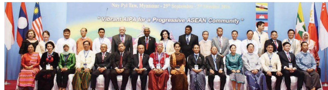
Yang Berhormat Pehin Orang Kaya Seri Lela Dato Seri Setia Awang Haji Abdul Rahman bin Dato Setia Haji Mohamed Taib, Speaker of the Legislative Council (seated, seventh, left) in a group photo at the 37 th AIPA in Nay Pyi Taw, Republic of the Union of Myanmar.

NAY PYI TAW, REPUBLIC OF THE UNION OF MYANMAR, September 30 - The 37 th ASEAN Inter-Parliamentary Assembly (AIPA) was officially launched yesterday by Aung San Suu Kyi, Myanmar's State Counsellor at Myanmar International Convention Centre, in Nay Pyi Taw, Republic of the Union of Myanmar.