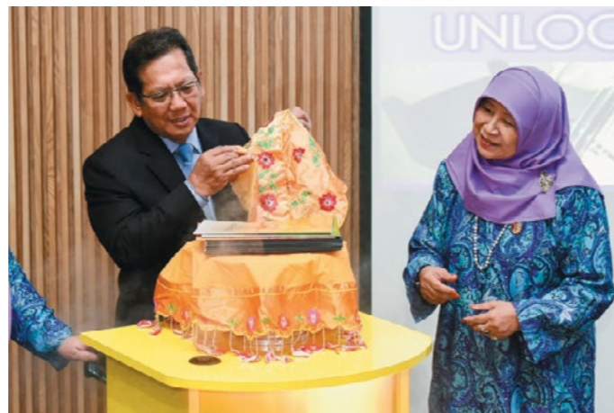
The Minister of Education during the book launching in conjunction with the opening of the 'Libraries Transform: Unlocking Your Potential as Librarians' conference.

TUNGKU LINK, September 20 – The transformation of libraries to support the distribution of information to patrons is greatly needed and must be in line with global change.