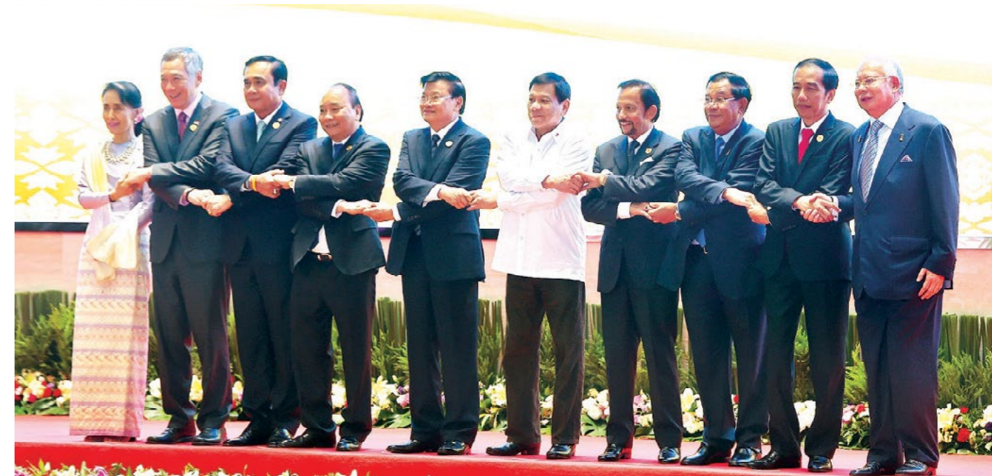
His Majesty with ASEAN Heads of States and Governments in a group photo before the Plenary Session.

During the event, His Majesty signed the ASEAN Declaration on One ASEAN, One Response: ASEAN Responding to Disasters as One in the Region and Outside the Region. The ASEAN Declaration was also signed by the Prime Minister of the Lao People's Democratic Republic and Chairman of ASEAN, as well as other heads of state and government of ASEAN.