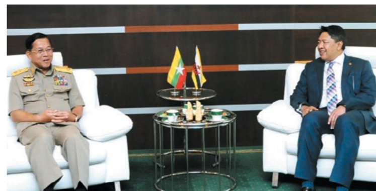
First Admiral (Rtd) Dato Seri Pahlawan Abdul Aziz bin Haji Mohd. Tamit, the Deputy Minister of Defence (right) with Senior General Min Aung Hlaing, the Commander-in-Chief of Defence Services at the Myanmar Armed Forces (left).

BANDAR SERI BEGAWAN, September 2 - Senior General Min Aung Hlaing, the Commander-in-Chief of Defence Services at the Myanmar Armed Forces, is currently in Brunei Darussalam with an accompanying delegation, on a three-day introductory visit.