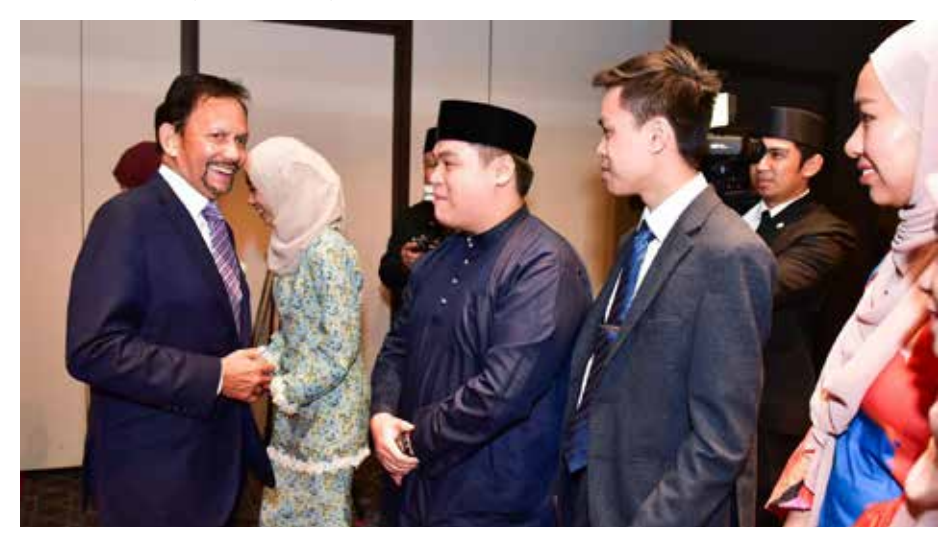
His Majesty the Sultan and Yang Di-Pertuan of Brunei Darussalam mingles and meets with citizens and residents of Brunei Darussalam consisting of students and respective families in the Republic of Korea (ROK) currently.