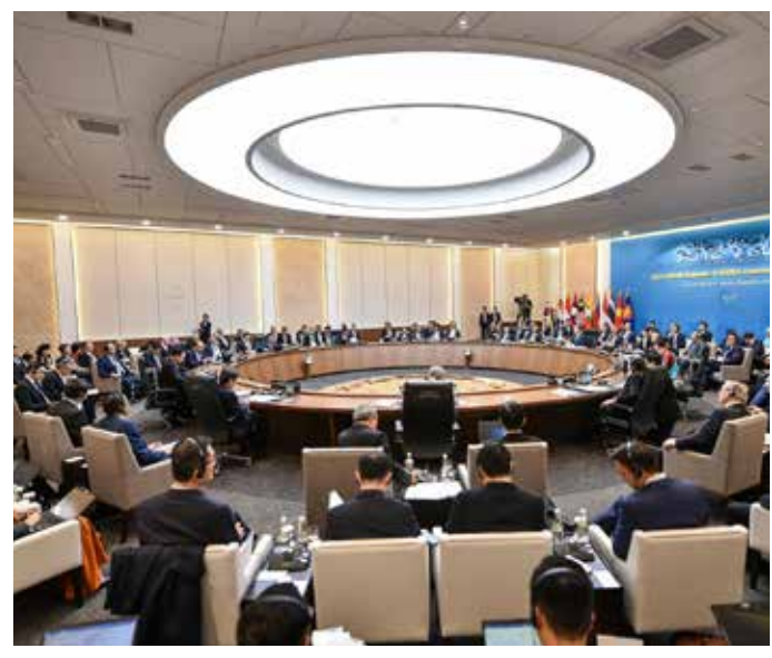
The 3rd ASEAN-ROK Commemorative Summit held at BEXCO.