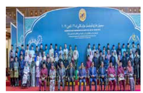
18. 26th Civil Service Day: Show integrity carrying out duties