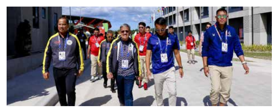
His Royal Highness Prince Haji Sufri Bolkiah visits the facilities provided at the Athlete's Village in New Clark City, Philippines.

His Royal Highness first visited the dining hall of the Athlete's village, Village Mall, Medical Room, dedicated to Brunei Darussalam athletes and delegates as well as rooms for national athletes.