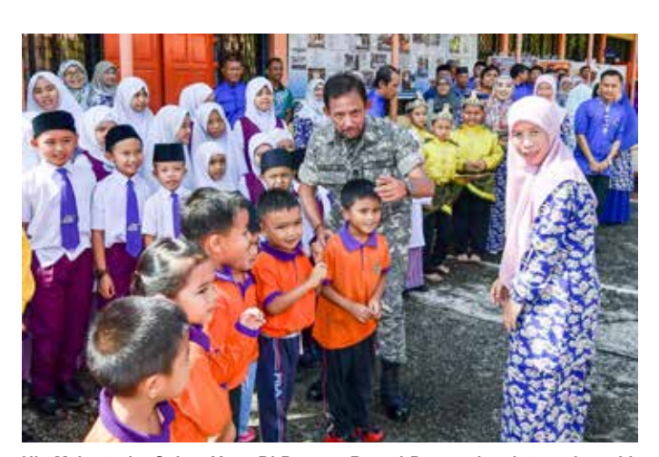
His Majesty the Sultan Yang Di-Pertuan Brunei Darussalam interacting with students and teachers from Sultan Hashim Secondary School.