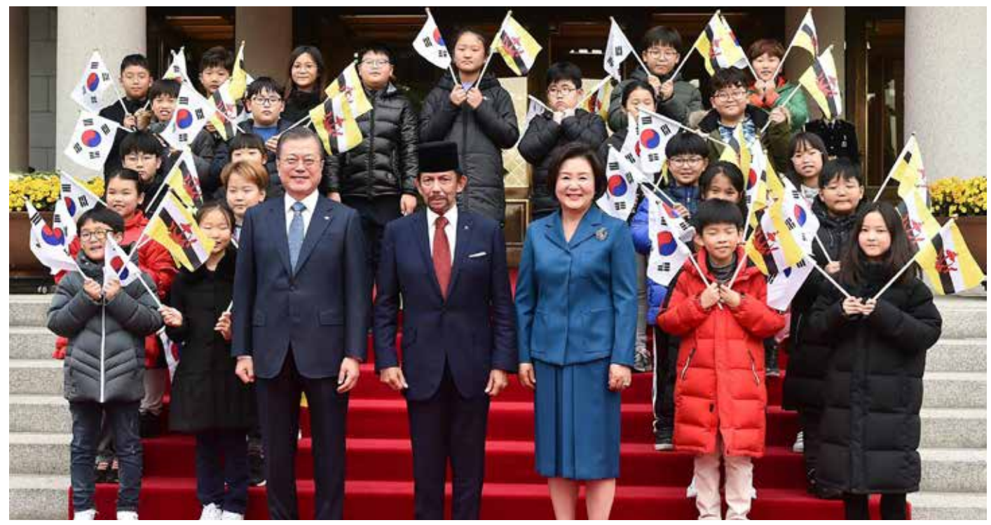
His Majesty the Sultan and Yang Di-Pertuan of Brunei Darussalam in a group photo with the President of the ROK and First Lady of the ROK.

Also enshrined within the Memorial Tower were memorial tablets of soldiers who died, including those never found and identified.