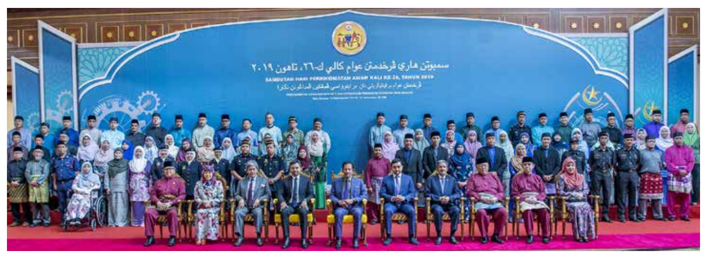
His Majesty the Sultan and Yang Di-Pertuan of Brunei Darussalam and other members of the royal family in a group photo with the award recipients at the 26th Civil Service Day Celebration 2019.

His Majesty then presented the awards and certificates of recognition to the recipients: the Premier Innovation Award for a Silver recipient to the Royal Customs and Excise Department, for its project paper 'Facilitating Application to Vehicle Entries and Exits at the Border Control Post'; and the Bronze Award to the Government Printing Department of the Prime Minister's Office (PMO), for its project paper titled 'The Printing Management System'; and Special Mention AIP to Lifesaver995 group from the Fire and Rescue Department, for its project paper, 'The Increase in Damaged and Missing Fire Hydrants Nationwide'; certificates of recognition through the Organisational Performance Grading Assessment Programme through Star Rating for achieving three stars (Good) 3PSA to the Public Service Department, PMO and the Public Service Commission, PMO; the Excellent Civil Service Employee Award to 49 civil servants; and the Civil Service Staff Meritorious and Dedication Award to 13 civil services staff.