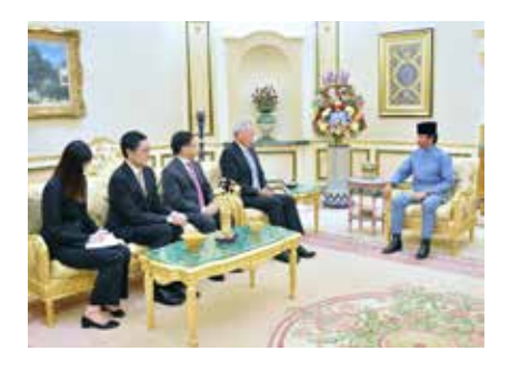
3. His Majesty receives audiences