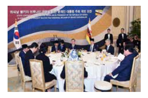
12. Brunei-ROK: Enhanced relationships in various fields