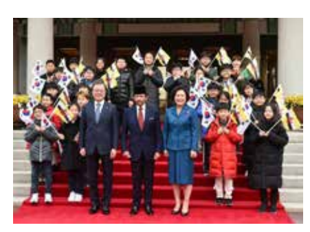
10. His Majesty attends a welcoming ceremony