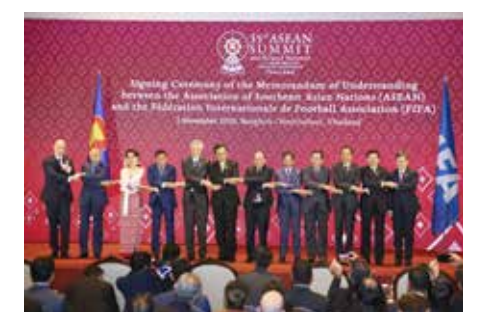
Rapid developments need to be managed, acted upon to realise ASEAN's goals