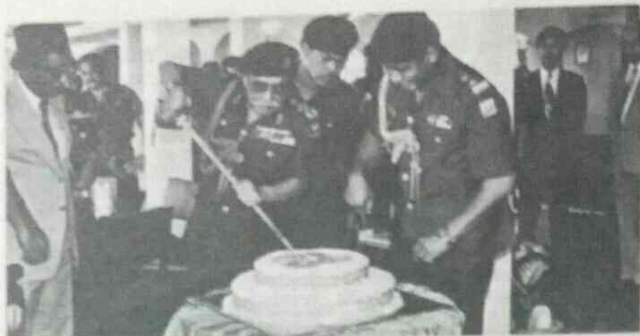
Royal birthday celebrant cuts cake presented by the Royal Brunei Armed Forces.