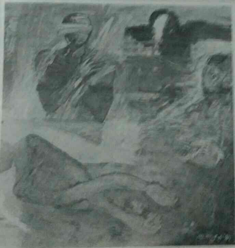
'Pain in a T-shirt' one of the artist's favourite paintings

I have been on a search for the perfect form, the perfect line, the perfect colour. He is always on a search for the perfect expression of his inner self. He has always been on a search for the perfect form, the perfect line, the perfect colour. He is always on a search for the perfect expression of his inner self.