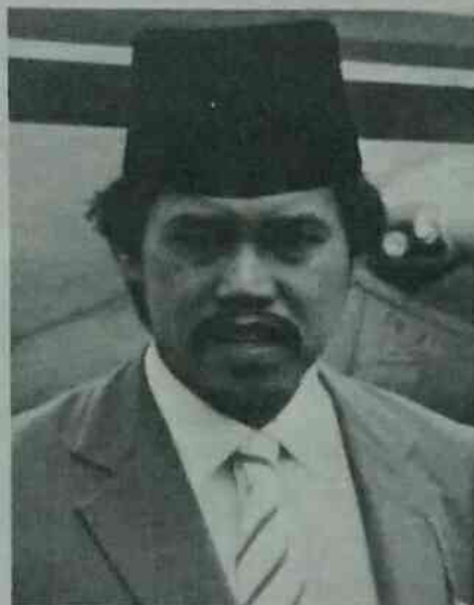
Duli Yang Teramat Mulia Paduka Seri Pengiran Perdana Wazir Sahibul Himmah Wal-Waqar Pengiran Muda Mohamed Bolkliah

We would, therefore, like to call upon the developed countries especially our dialogue partners to give due consideration