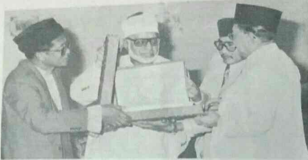
At the audience with Kebawah Duli (Yang Maha Mulia) Maulana Paduka Seri Begawan Sultan, General Sir Muda Omar Ali Saifuddien Saadul Khairi Waddien, the Defence Minister (right), Sheikh Al-Azhar (centre) presented a memento.