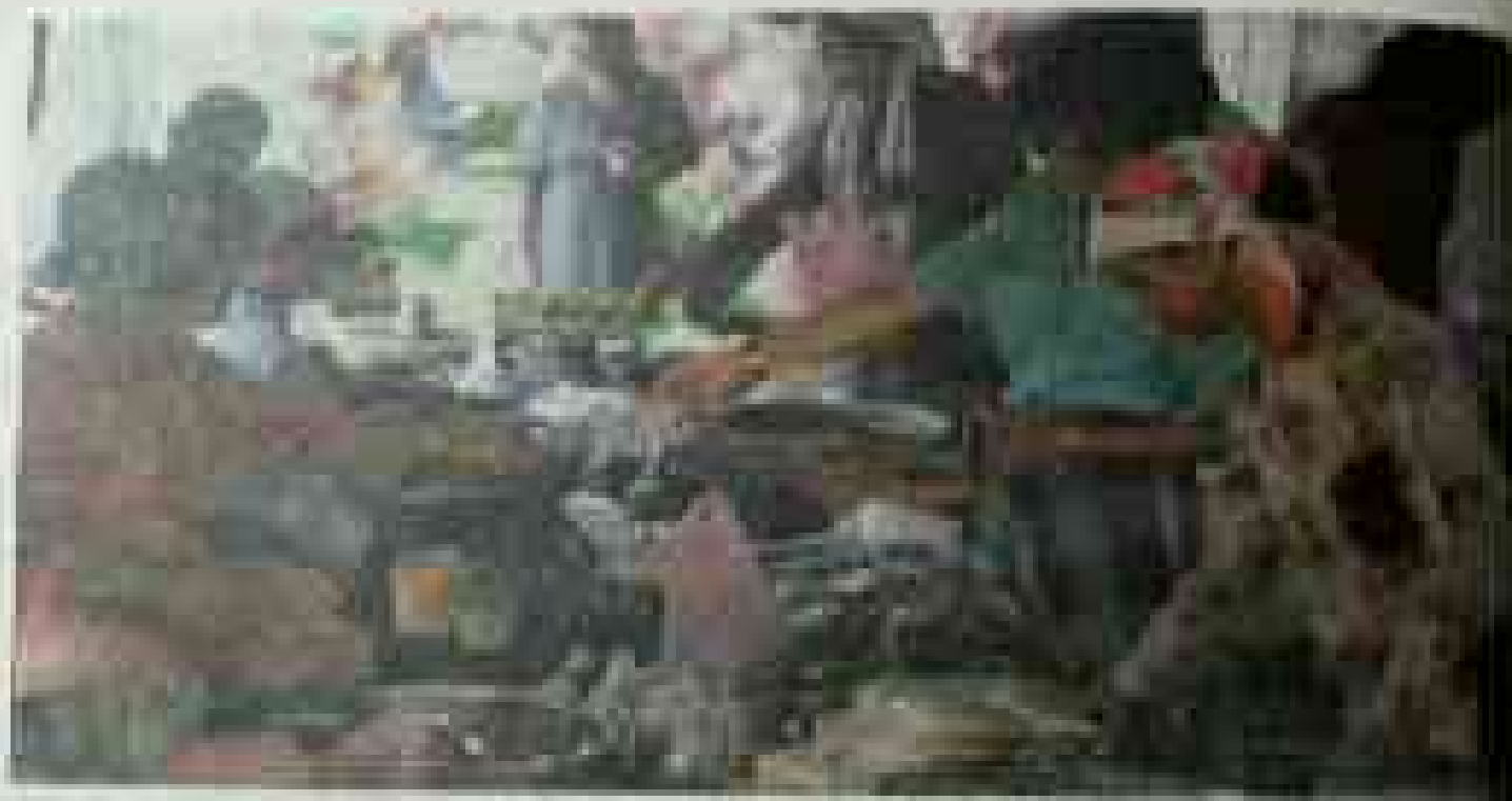
Market stalls in the heart of the capital, Dhaka, are a mix of modern and traditional. Many of the stalls are run by women.