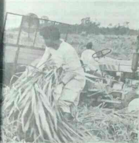
...grass being loaded for the stalls.