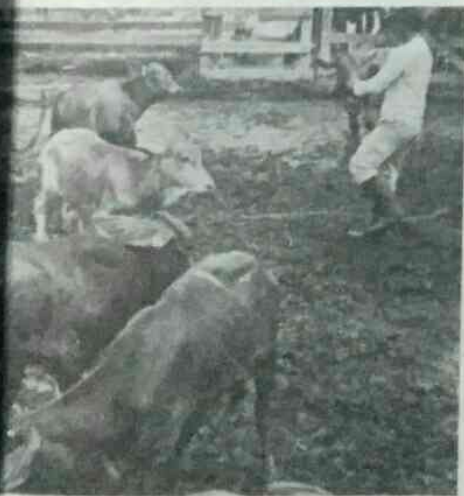
...cows weighing around 150 kilos, waiting to be ...rms.