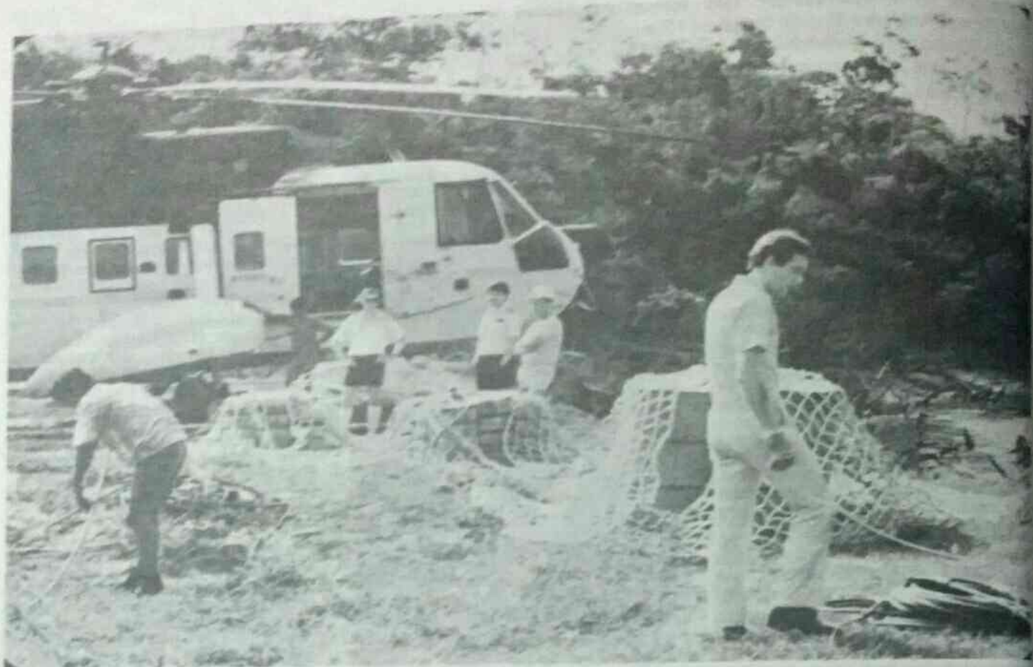
Helicopters brought supplies to this seismic survey party