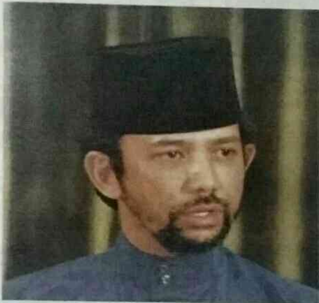
His Majesty Sultan Hassanal Bolkiah Mu'izzadin Waddaulah First Chancellor of the University of Brunei Darussalam