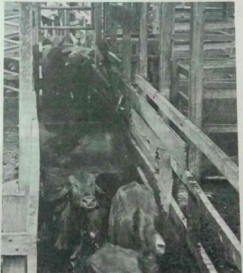
The cows get a regular dipping to control ectoparasites.