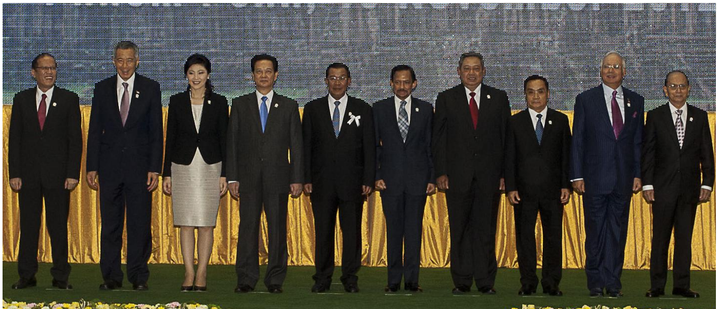
His Majesty Sultan Haji Hassanal Bolkiah Mu'izzaddin Waddaulah ibni Al-Marhum Sultan Haji Omar 'Ali Saifuddien Sa'adul Khairi Waddien, Sultan and Yang Di-Pertuan of Brunei Darussalam in a group photo with country leaders who attended the 21 st ASEAN Summit.