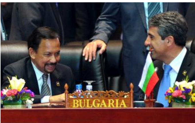
His Majesty sitting alongside ASEM member representative, the President of Bulgaria, His Excellency Rosen Asenov Plevneliev during the Plenary Session I.

Accompanying His Majesty at the meeting were Pehin Orang Kaya Laila Setia Dato Seri Setia Awang Haji Abdul Rahman bin Haji Ibrahim, Minister of Finance II at the Prime Minister's Office and Pehin Orang Kaya Pekerma Dewa Dato Seri Setia Lim Jock Seng, Minister of Foreign Affairs and Trade II.