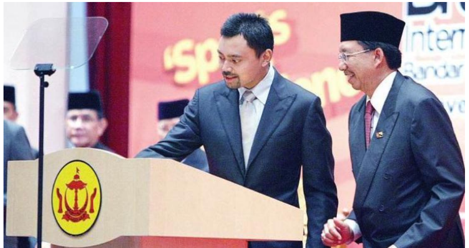
His Royal Highness Prince Haji Al-Muhtadee Billah launching the Brunei Sports Convention and Expo 2012.