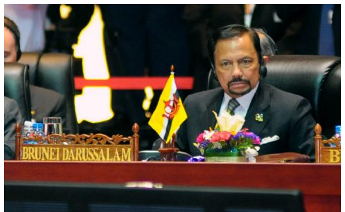
His Majesty participating in discussions on global economic and financial issues during the Plenary Session I.