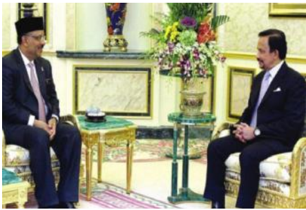
3. His Majesty receives audiences