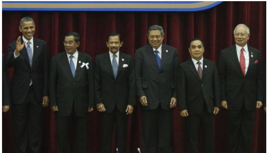
His Majesty Sultan and Yang Di-Pertuan of Brunei Darussalam and other leaders of other region at the ASEAN-US dialogue.

His Majesty further mentioned that Brunei Darussalam places great importance on food and energy security. With regards to