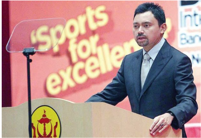
His Royal Highness Prince Haji Al-Muhtadee Billah ibni His Majesty Sultan Haji Hassanal Bolkiah Mu'izzaddin Waddaulah, the Crown Prince as Deputy Sultan delivering a sabda (royal speech) at the Opening Ceremony of the Brunei Sports Convention and Expo 2012.

According to the Crown Prince, the aim of the convention was to formulate an integrated and viable sports ecosystem in order to produce respectable sports athletes. On the other hand, participants of the event would also be able to learn and emulate the best practices, as well as study and analyse the experiences of regional and international champions.