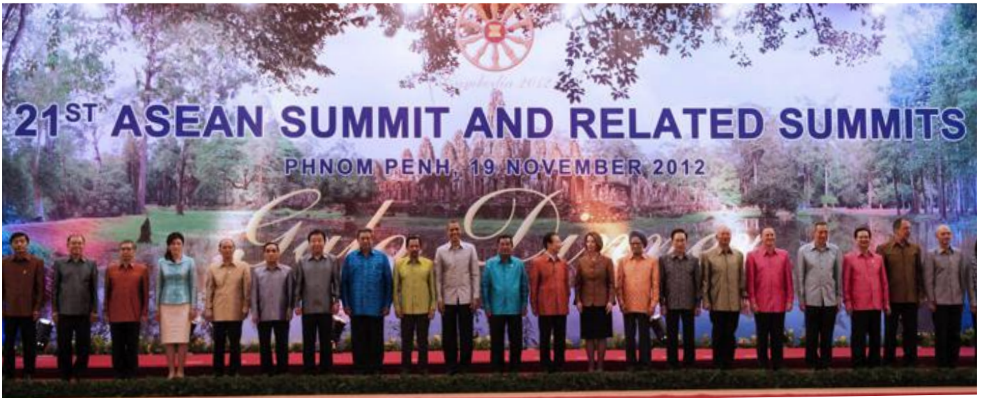
His Majesty Sultan Haji Hassanal Bolkiah Mu'izzaddin Waddaulah ibni Al-Marhum Sultan Haji Omar 'Ali Saifuddien Sa'adul Khairi Waddien, Sultan and Yang Di-Pertuan of Brunei Darussalam with other leaders of the region during the ASEAN Gala Night at the Diamond Island International Conference Center, Phnom Penh.