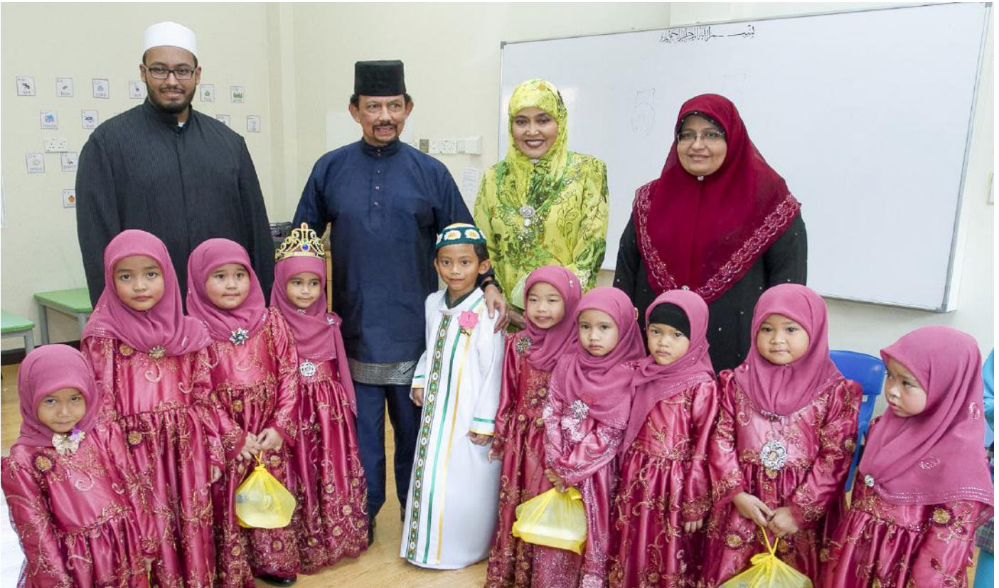
His Majesty Sultan Haji Hassanal Bolkiah Mu'izzaddin Waddaulah ibni Al-Marhum Sultan Haji Omar 'Ali Saifuddien Sa'adul Khairi Waddien, Sultan and Yang Di-Pertuan of Brunei Darussalam and Her Majesty Duli Raja Isteri Pengiran Anak Hajah Saleha binti Al-Marhum Pengiran Pemancha Pengiran Anak Haji Mohamed Alam consented to take a group photo with His Royal Highness Prince 'Abdul Wakeel and Her Royal Highness Princess Ameerah Wardatul Bolkiah as well as other students.