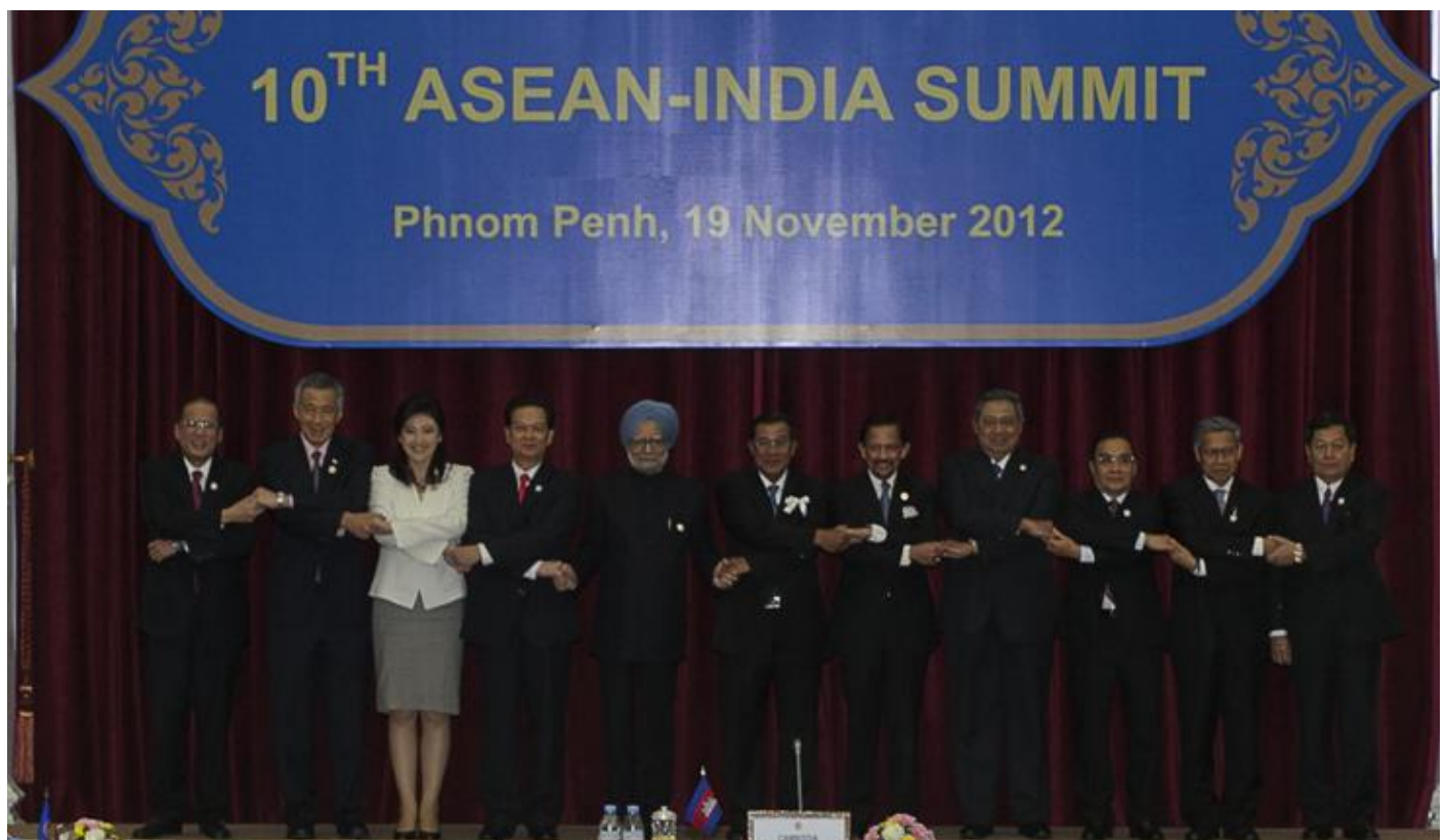
His Majesty the Sultan and Yang Di-Pertuan of Brunei Darussalam in a group photo with other ASEAN Leaders during the ASEAN-India Summit.

The Summit also witnessed the appointment of the new ASEAN Secretary-General for the period of January 2013 to December 2018, His Excellency Le Luong Minh from the