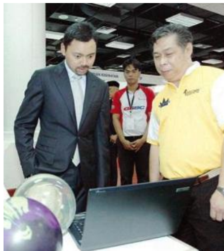
His Royal Highness Prince Haji Al-Muhtadee Billah touring the exhibition in conjunction with the Brunei Sports Convention and Expo.