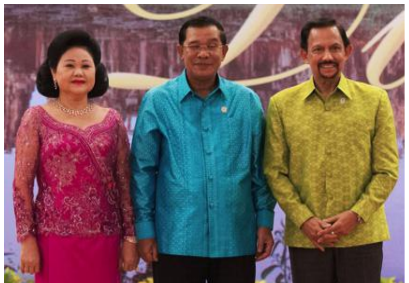
His Majesty Sultan Haji Hassanal Bolkih Mu'izzaddin Waddaulah ibni Al-Marhum Sultan Haji Omar 'Ali Saifuddien Sa'adul Khairi Waddien, Sultan and Yang Di-Pertuan of Brunei Darussalam in a group photo during the Gala Night with His Excellency Samdech Akka Moha Sena Padei Techo Hun Sen, Prime Minister of the Kingdom of Cambodia and spouse, Madam Lok Chumteav Kittipritthindit Bun Rany Hun Sen.