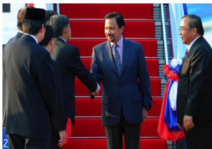
15. His Majesty arrives at Vientiane for the 9 th ASEM Summit