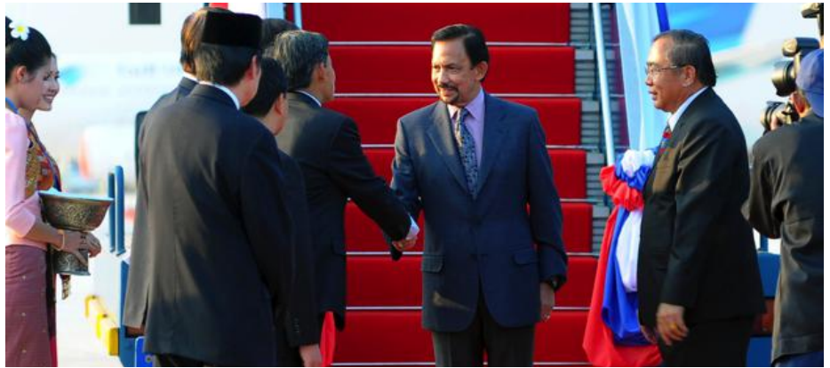
His Majesty Sultan Haji Hassanal Bolkiah Mu'izzaddin Waddaulah ibni Al-Marhum Sultan Haji Omar 'Ali Saifuddein Sa'adul Khairi Waddien, Sultan and Yang Di-Pertuan of Brunei Darussalam upon his arrival at Vientiane for the 9th Asia-Europe Meeting Summit.

The 9 th ASEM Summit brings together the Heads of State and The Government of the 48 partners from Asia and Europe. The theme of the 9 th ASEM Summit is 'Friends for Peace, Partners for Prosperity'.