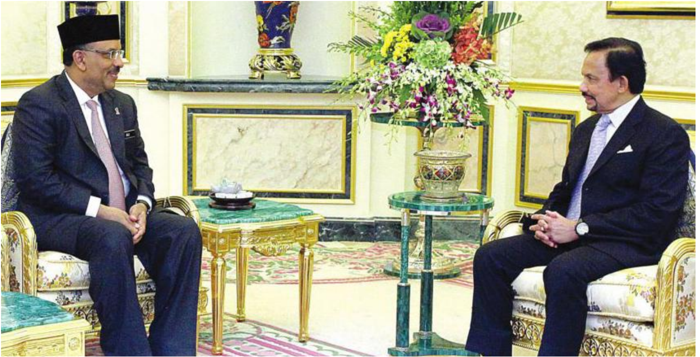
His Excellency K. Shanmugam, Minister of Foreign Affairs of Singapore on November 3.

His Majesty Sultan Haji Hassanal Bolkiah Mu'izzaddin Waddaulah ibni Al-Marhum Sultan Haji Omar 'Ali Saifuddien Sa'adul Khairi Waddien, Sultan and Yang Di-Pertuan of Brunei Darussalam received audiences at the Istana Nurul Iman from: