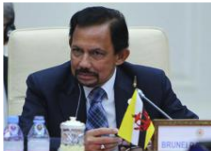
8. ASEAN Economic Community 2015