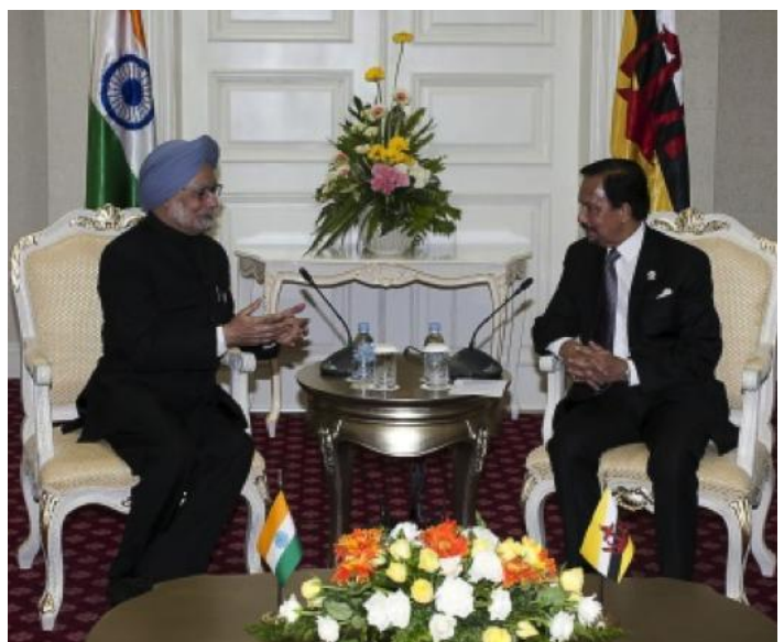
His Majesty the Sultan and Yang Di-Pertuan of Brunei Darussalam attending two separate bilateral meetings between His Excellency John Phillip Key, the Prime Minister of New Zealand (left) and (right) His Excellency Manmohan Singh, the Prime Minister of India.