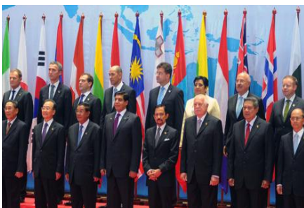
16. 9 th Asia-Europe Meeting Summit inaugurated