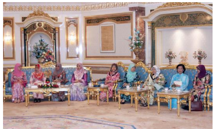
Other members of the royal family also present at the audience ceremony.