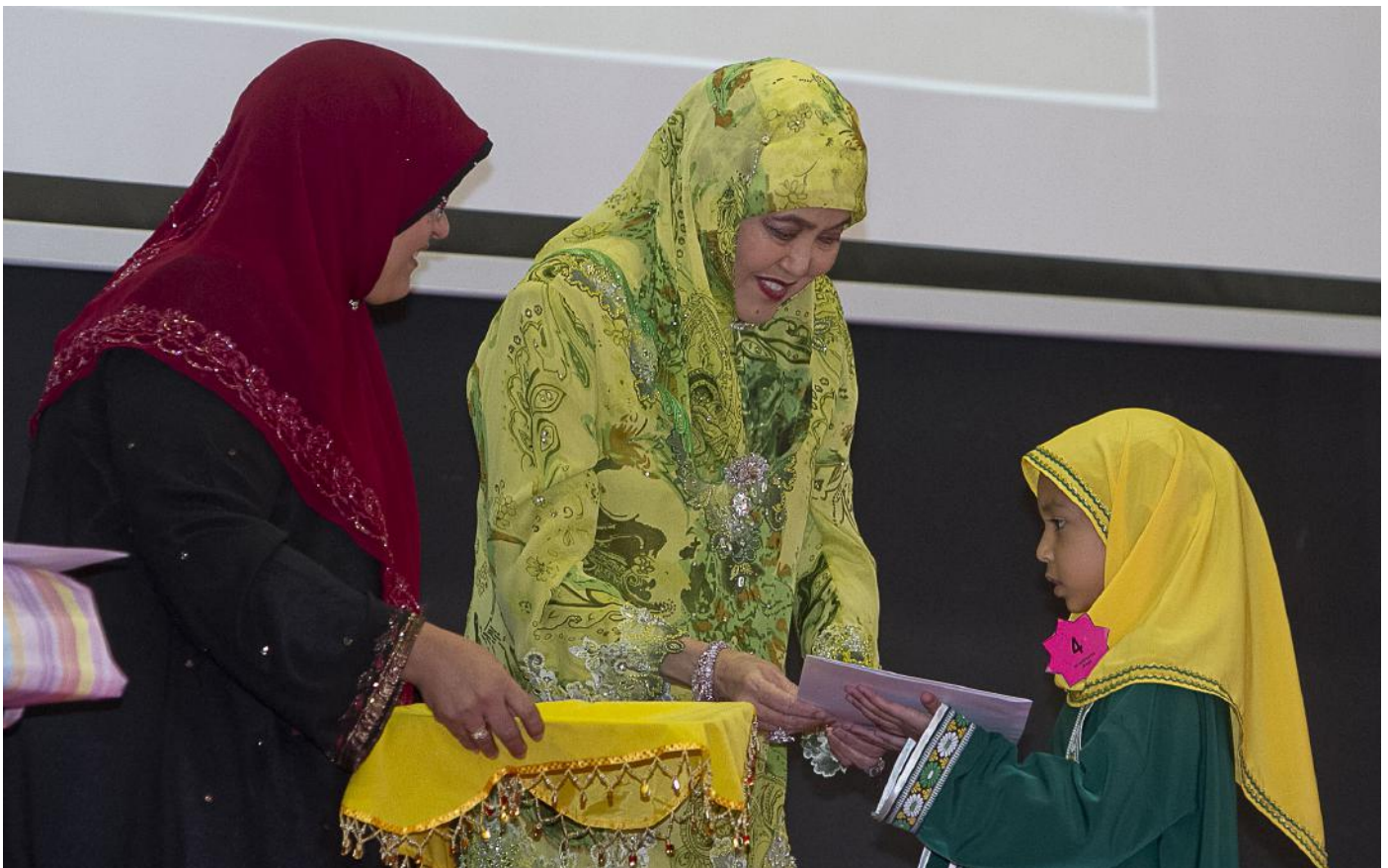
His Majesty the Sultan and Yang Di-Pertuan of Brunei Darussalam consented to present an award and certificate to His Royal Highness Prince 'Abdul Wakeel (left) and (right) Her Majesty presenting a certificate to a female student of Al-Falaah school.