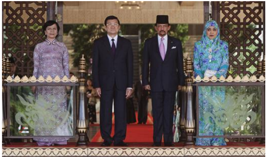
His Majesty Sultan Haji Hassanal Bolkiah Mu'izzaddin Waddaulah ibni Al Marhum Sultan Haji Omar 'Ali Saifuddien Sa'adul Khairi Waddien, Sultan and Yang Di-Pertuan of Brunei Darussalam, and Her Majesty Duli Raja Isteri Pengiran Anak Hajah Saleha binti Al-Marhum Pengiran Pemancha Pengiran Anak Haji Mohamed Alam; with His Excellency Truong Tan Sang, President of the Socialist Republic of Viet Nam and spouse, Madam Mai Thi Hanh receiving the Royal Salute followed by national anthem of each country.

Shortly after, an Audience Ceremony was held at the palace's Cheradi Laila Kencana. Apart from Their Majesties and the Vietnamese delegation, the session was also attended by His Royal Highness Prince Haji Al-Muhtadee Billah,