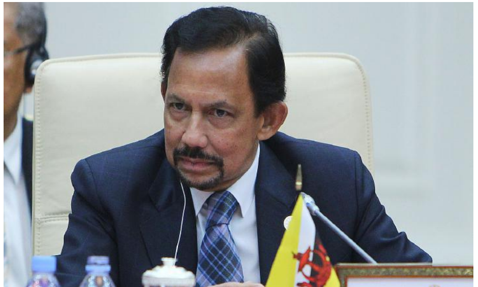
His Majesty in a meeting with the ASEAN Business Advisory Council (ABAC).

According to His Majesty, the Summit serves as a platform to coordinate effective and efficient approaches as well as efforts to strengthen collaboration between parties for mutual benefit.