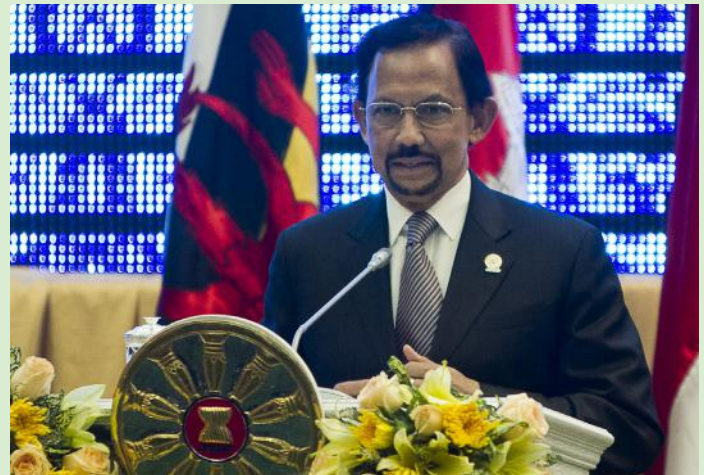
His Majesty Sultan Haji Hassanal Bolkiah Mu'izzaddin Waddaulah ibni Al-Marhum Sultan Haji Omar 'Ali Saifuddien Sa'adul Khairi Waddien, Sultan and Yang Di-Pertuan of Brunei Darussalam consented to deliver a titah (royal speech) during the 21 st ASEAN Summit closing ceremony at the Peace Palace, Phnom Penh.

These responsibilities, His Majesty the Sultan and Yang Di-Pertuan continued, are in line with the chairmanship guideline, under Article 32 of the ASEAN Charter. His Majesty also added that the ASEAN community has now multiplied since its establishment, with 40 per cent of its population consisting of young people who will be facing the full impact of globalisation.