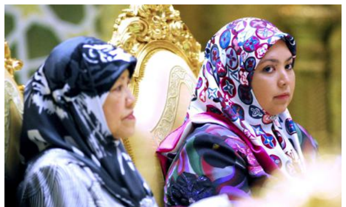
Other members of the royal family who were also present at the Royal Banquet.