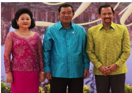
9. His Majesty highlights several areas to strengthen cooperation