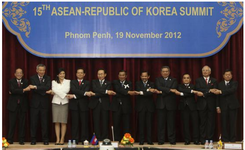
His Majesty Sultan Haji Hassanal Bolkiah Mu'izzaddin Waddaulah ibni Al-Marhum Sultan Haji Omar 'Ali Saifuddien Sa'adul Khairi Waddien, Sultan and Yang Di-Pertuan of Brunei Darussalam with other ASEAN Leaders at the 15 th ASEAN-Republic of Korea Summit.

important to strengthen all areas under the Action Plan, including security, to maintain peace and prosperity in the region.