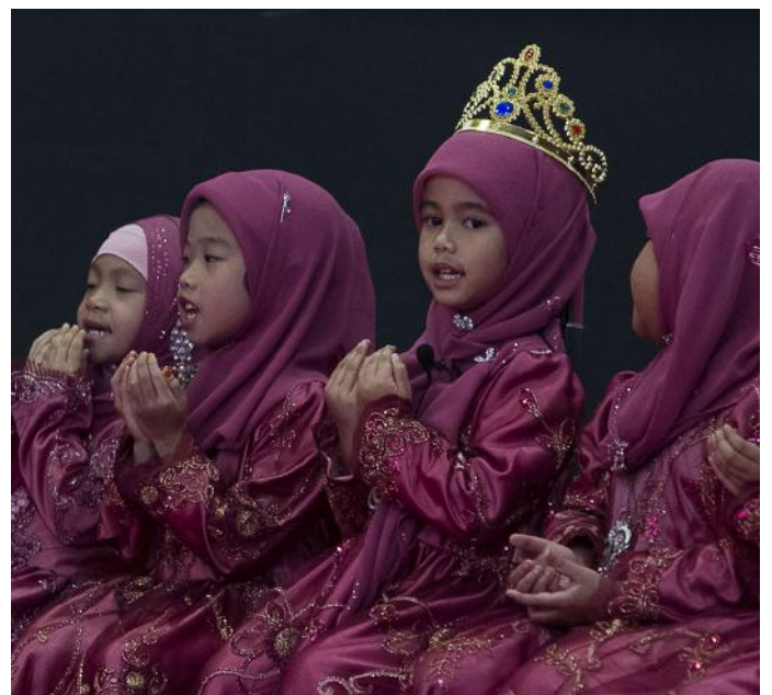
His Royal Highness Prince 'Abdul Wakeel and Her Royal Highness Princess Ameerah Wardatul Bolkiah during the performances.