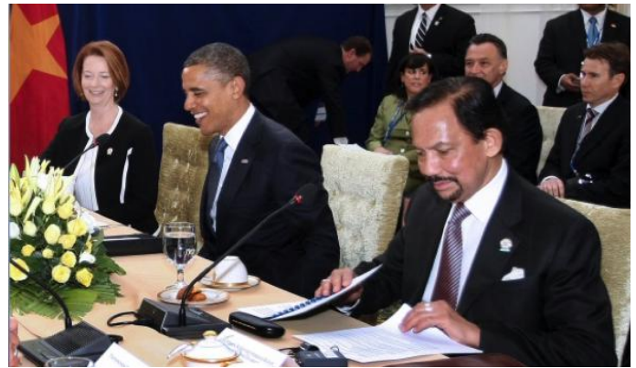
His Majesty Sultan Haji Hassanal Bolkiah Mu'izzaddin Waddaulah ibni Al-Marhum Sultan Haji Omar 'Ali Saifuddien Sa'adul Khairi Waddien, Sultan and Yang Di-Pertuan of Brunei Darussalam during the Trans-Pacific Partnership (TPP) meeting with His Excellency Barack Obama, President of the United States of America.

The Monarch also brought up the situation in Gaza and the sufferings of the Palestinians, urging international communities to find a lasting and sustainable resolution. His Majesty also advised the communities to identify the values of tolerance and understanding in achieving peace to resolve the conflict, as well as other conflicts in the rest of the world.