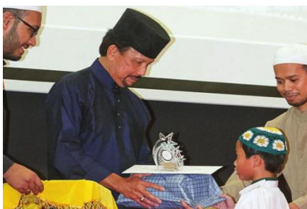
19. Al-Falaah School End of Year Closing Ihtifaal Ceremony