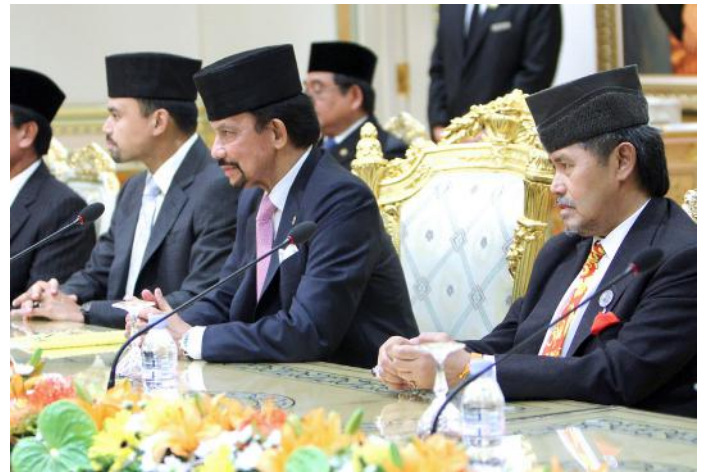
His Majesty Sultan Haji Hassanal Bolkiah Mu'izzaddin Waddaulah ibni Al-Marhum Sultan Haji Omar 'Ali Saifuddien Sa'adul Khairi Waddien, Sultan and Yang Di-Pertuan of Brunei Darussalam and members of the royal family witnessing the signing of the Memorandum of Understanding between Petroleum Brunei and PetroVietnam.

Three years after Viet Nam's admission into ASEAN, the country became the host for the 6 th ASEAN Summit, with the launching of the Hanoi Plan of Action and the successive pathway towards the ASEAN Community, which is hoped to be realised in two years' time, His Majesty continued.