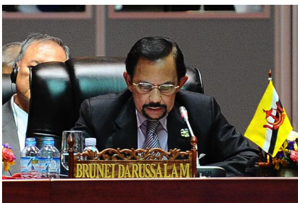
17. 'Human dimension' important in collaborative partnerships