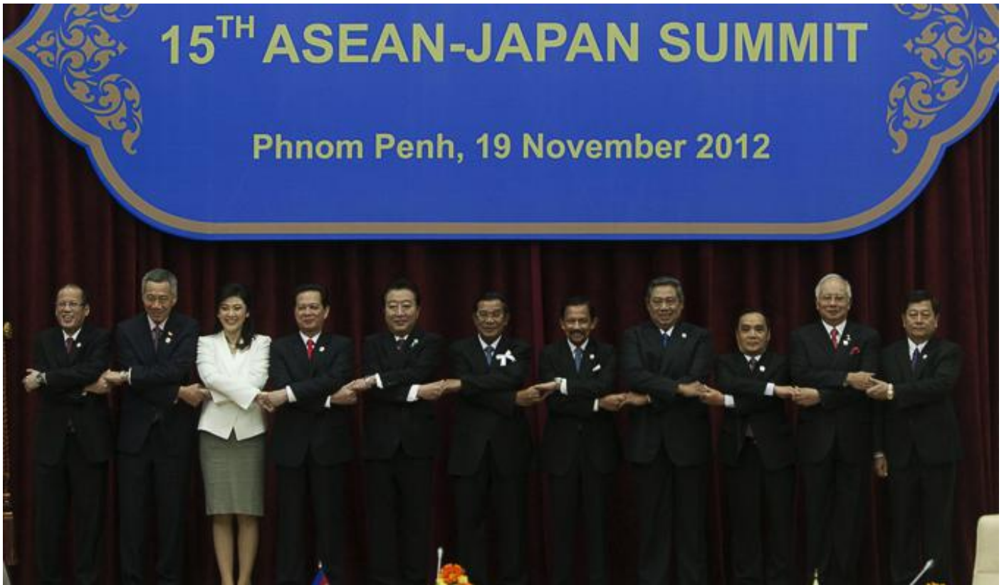
His Majesty Sultan Haji Hassanal Bolkiah Mu'izzaddin Waddaulah ibni Al-Marhum Sultan Haji Omar 'Ali Saifuddien Sa'adul Khairi Waddien, Sultan and Yang Di-Pertuan of Brunei Darussalam in a group photo with ASEAN leaders during the ASEAN-JAPAN Summit.