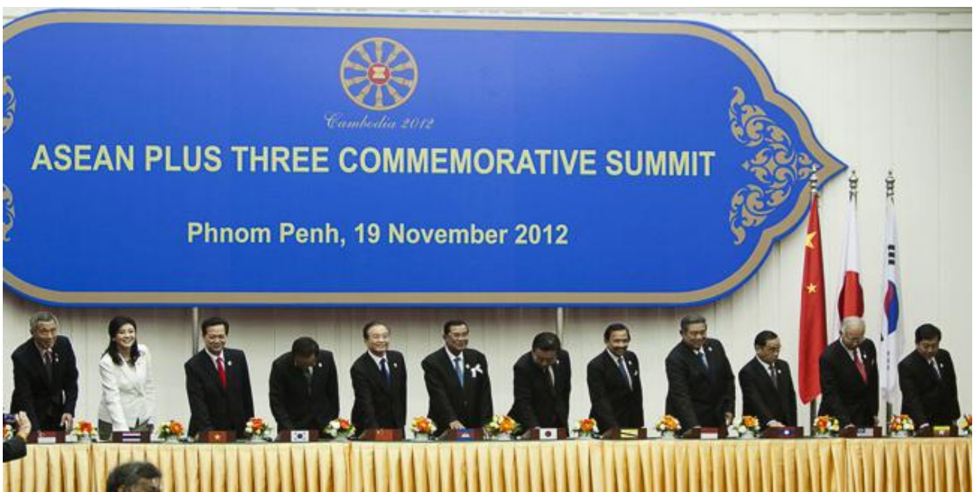
His Majesty the Sultan and Yang Di-Pertuan of Brunei Darussalam and other ASEAN leaders during the ASEAN Plus Three Commemorative Summit.

Before ending his titah for the session,