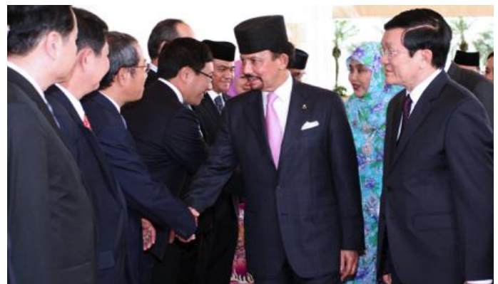
Their Majesties were introduced to the members of the President's delegation, which included His Excellency Nguyen Thien Nhan, Deputy Prime Minister; His Excellency Pham Binh Minh, Viet Nam Foreign Affairs Minister; His Excellency Nguyen Truong Giang, Ambassador Extraordinary and Plenipotentiary of the Socialist Republic of Viet Nam to Brunei Darussalam and other senior officials from the Socialist Republic of Viet Nam.