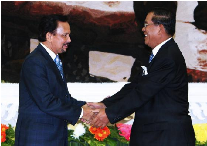
His Majesty Sultan Haji Hassanal Bolkhiah Mu'izzaddin Waddaulah ibni Al-Marhum Sultan Haji Omar 'Ali Saifuddien Sa'adul Khairi Waddien, Sultan and Yang Di-Pertuan of Brunei Darussalam shaking hands with His Excellency Samdech Akka Moha Sena Padei Techo Hun Sen, Prime Minister of the Kingdom of Cambodia.