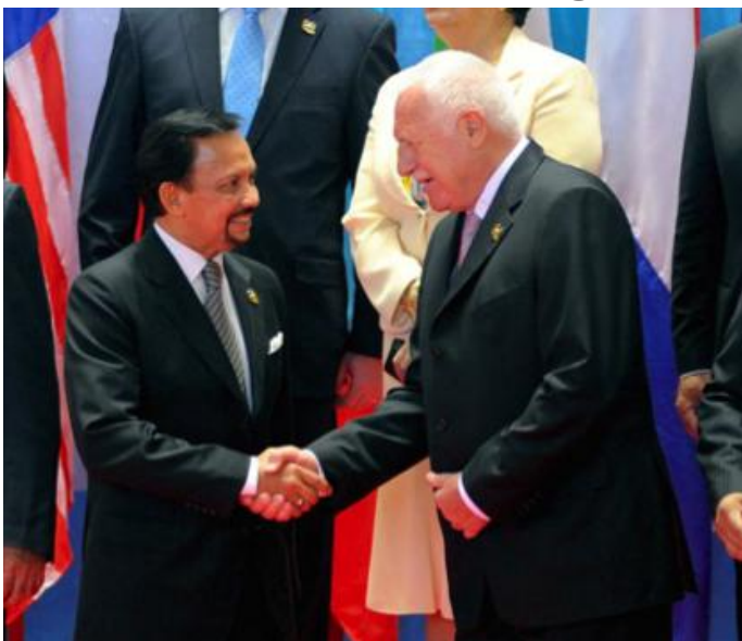
His Majesty Sultan Haji Hassanal Bolkiah Mu'izzaddin Waddaulah ibni Al-Marhum Sultan Haji Omar 'Ali Saifuddien Sa'adul Khairi Waddien, Sultan and Yang Di-Pertuan of Brunei Darussalam, being greeted by His Excellency Valclav Klaus, an ASEM member representative from Czech Republic, prior to the group photo session.

VIENTIANE, LAO PEOPLE'S DEMOCRATIC REPUBLIC, November 5 - His Majesty Sultan Haji Hassanal Bolkiah Mu'izzaddin Waddaulah ibni Al-Marhum Sultan Haji Omar 'Ali Saifuddien Sa'adul Khairi Waddien, Sultan and Yang Di-Pertuan of Brunei Darussalam attended the Opening Ceremony of the 9 th Asia-Europe Meeting (9 th ASEM) Summit in Vientiane, Lao People's Democratic Republic (Laos).