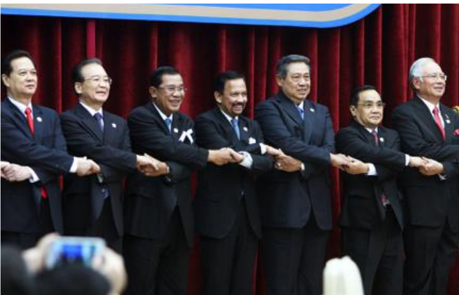
His Majesty the Sultan and Yang Di-Pertuan of Brunei Darussalam and other leaders of other countries at the ASEAN-China Summit.

At the 15 th ASEAN-Japan Summit held on the same day, His Majesty expressed the need to strive for sustainable energy in the future and balance economic as well as environmental interests.