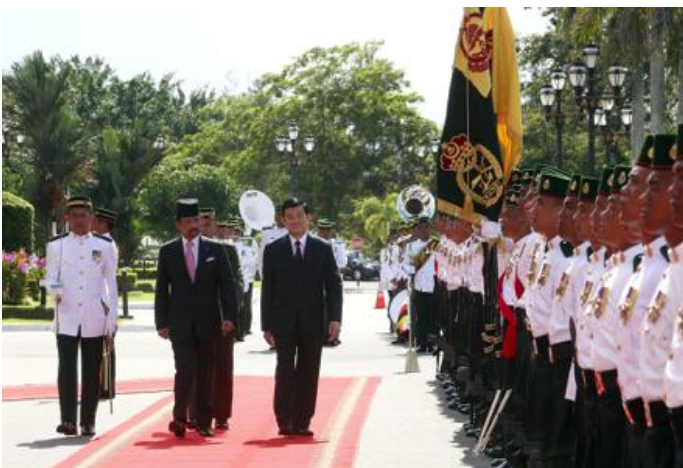
His Majesty the Sultan and Yang Di-Pertuan of Brunei Darussalam and His Excellency Truong Tan Sang inspecting the guard of honour by the members of the Royal Brunei Armed Forces.