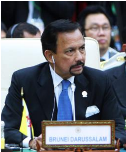
His Majesty Sultan Haji Hassanal Bolkiah Mu'izzaddin Waddaulah ibni Al-Marhum Sultan Haji Omar 'Ali Saifuddien Sa'adul Khairi Waddien, Sultan and Yang Di-Pertuan of Brunei Darussalam during the ASEAN-US dialogue.