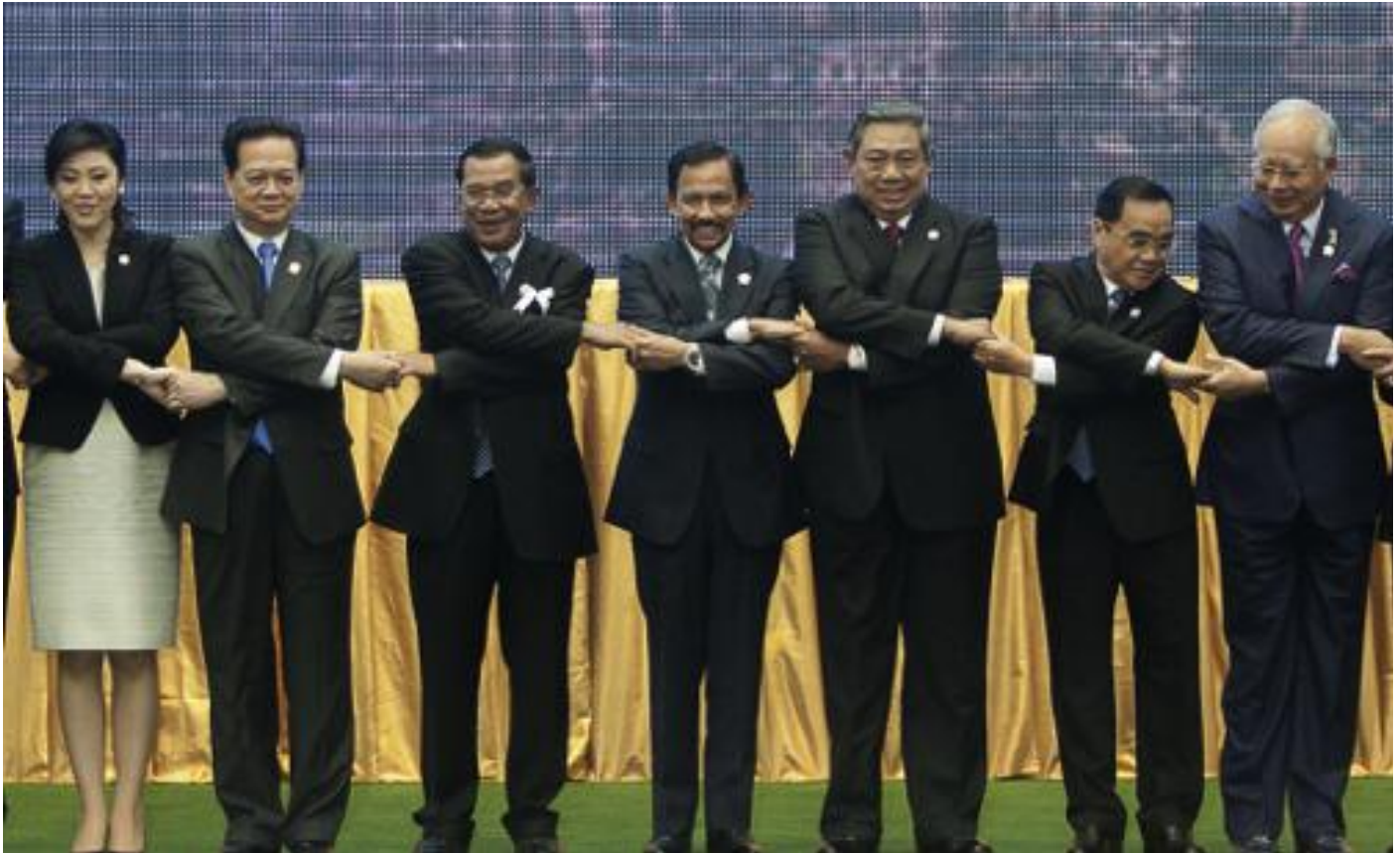
'One Community, One Destiny'... His Majesty Sultan Haji Hassanal Bolkih Mu'izzaddin Waddaulah ibni Al-Marhum Sultan Haji Omar 'Ali Saifuddien Sa'adul Khairi Waddien, Sultan and Yang Di-Pertuan of Brunei Darussalam consented to join other ASEAN leaders for a group photo session.