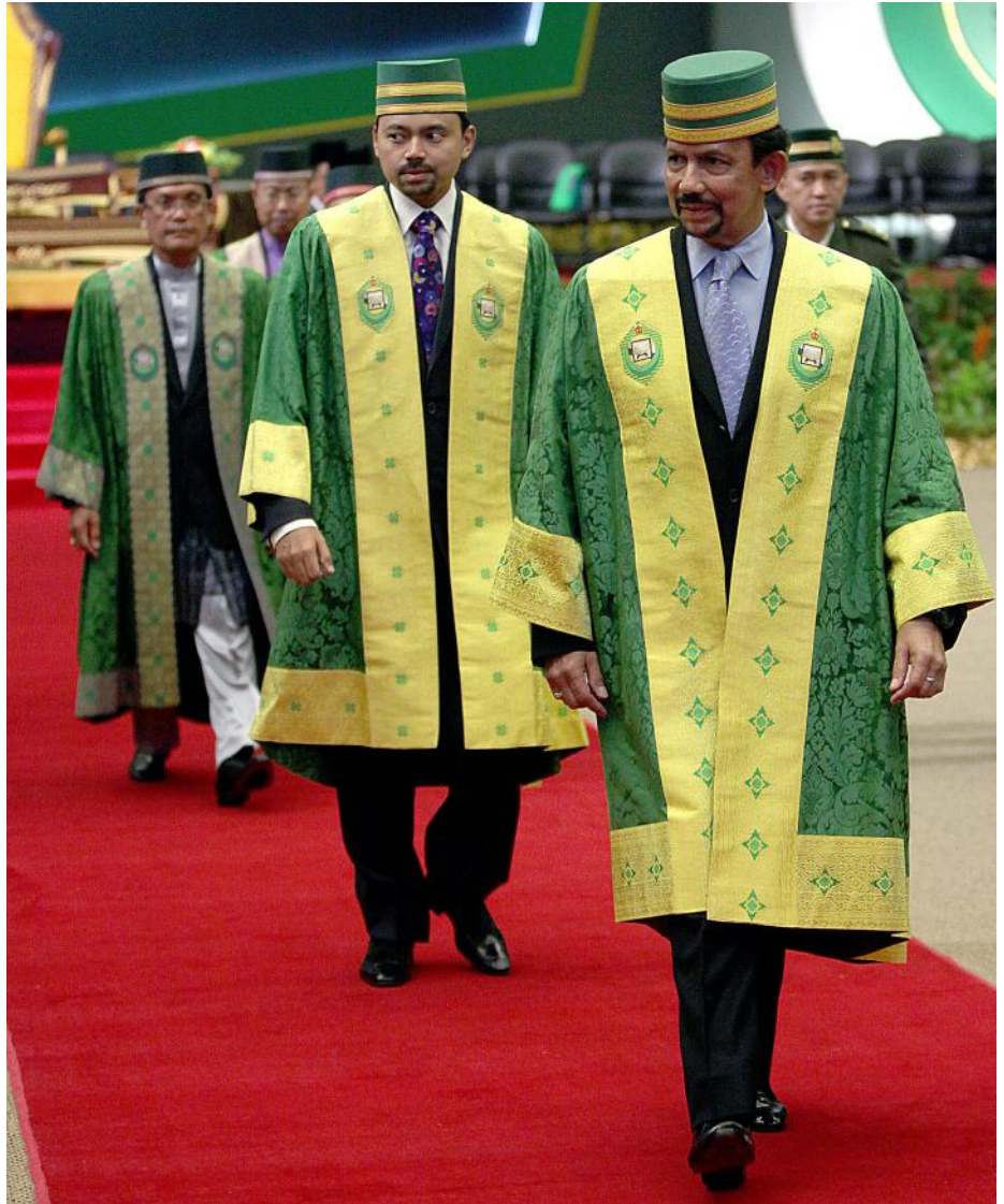
His Majesty Sultan Haji Hassanal Bolkiah Mu'izzaddin Waddaulah ibni Al-Marhum Sultan Haji Omar 'Ali Saifuddien Sa'adul Khairi Waddien, Sultan and Yang Di-Pertuan of Brunei Darussalam, as Chancellor of Sultan Sharif Ali Islamic University (UNISSA) and His Royal Highness Prince Haji Al-Muhtadee Billah ibni His Majesty Sultan Haji Hassanal Bolkiah Mu'izzaddin Waddaulah, the Crown Prince and Senior Minister at the Prime Minister's Office, as Pro-Chancellor of UNISSA, gracing UNISSA's 2 nd Hafi Al-Takharuj.

Among those receiving their certificates at the ceremony were 22 master's degree