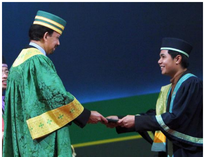
His Majesty the Sultan and Yang Di-Pertuan of Brunei Darussalam presenting certificates to graduates.