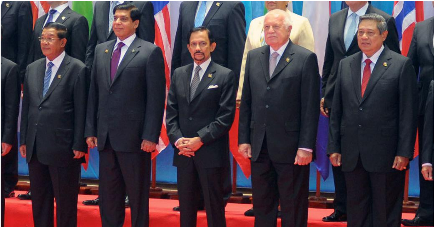
His Majesty Sultan Haji Hassanal Bolkiah Mu'izzaddin Waddaulah ibni Al-Marhum Sultan Haji Omar 'Ali Saifuddien Sa'adul Khairi Waddien, Sultan and Yang Di-Pertuan of Brunei Darussalam and other leaders the 9 th ASEM Summit.