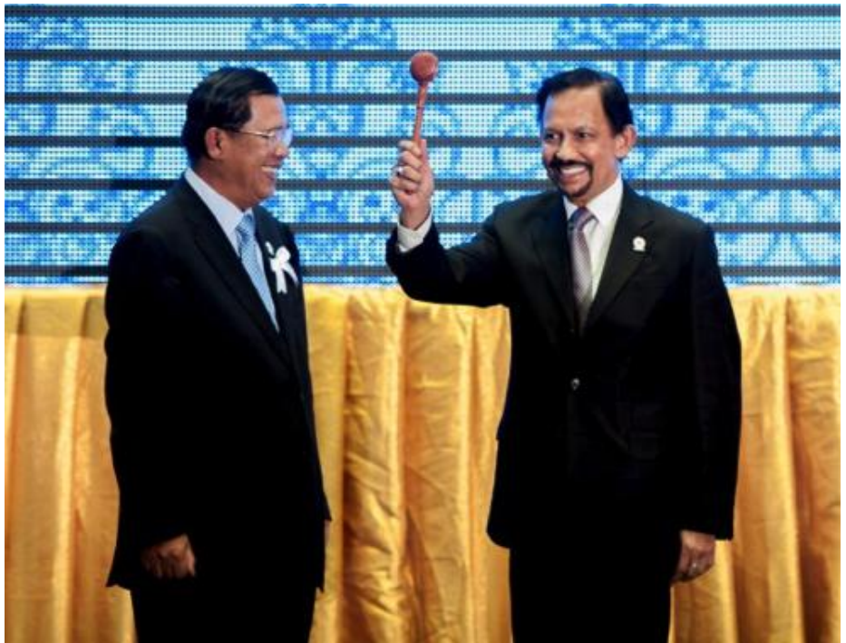
His Majesty Sultan Haji Hassanal Bolkiah Mu'izzaddin Waddaulah ibni Al-Marhum Sultan Haji Omar 'Ali Saifuddien Sa'adul Khairi Waddien, Sultan and Yang Di-Pertuan of Brunei Darussalam symbolically accepting the responsibilities as Chairman of ASEAN 2013 from His Excellency Samdech Akka Moha Sena Padei Techo Hun Sen, Prime Minister of Cambodia.

His Majesty also voiced his endorsement for the objectives of the 21 st Century Agreement, which requires practical and pragmatic approach. In this matter, the