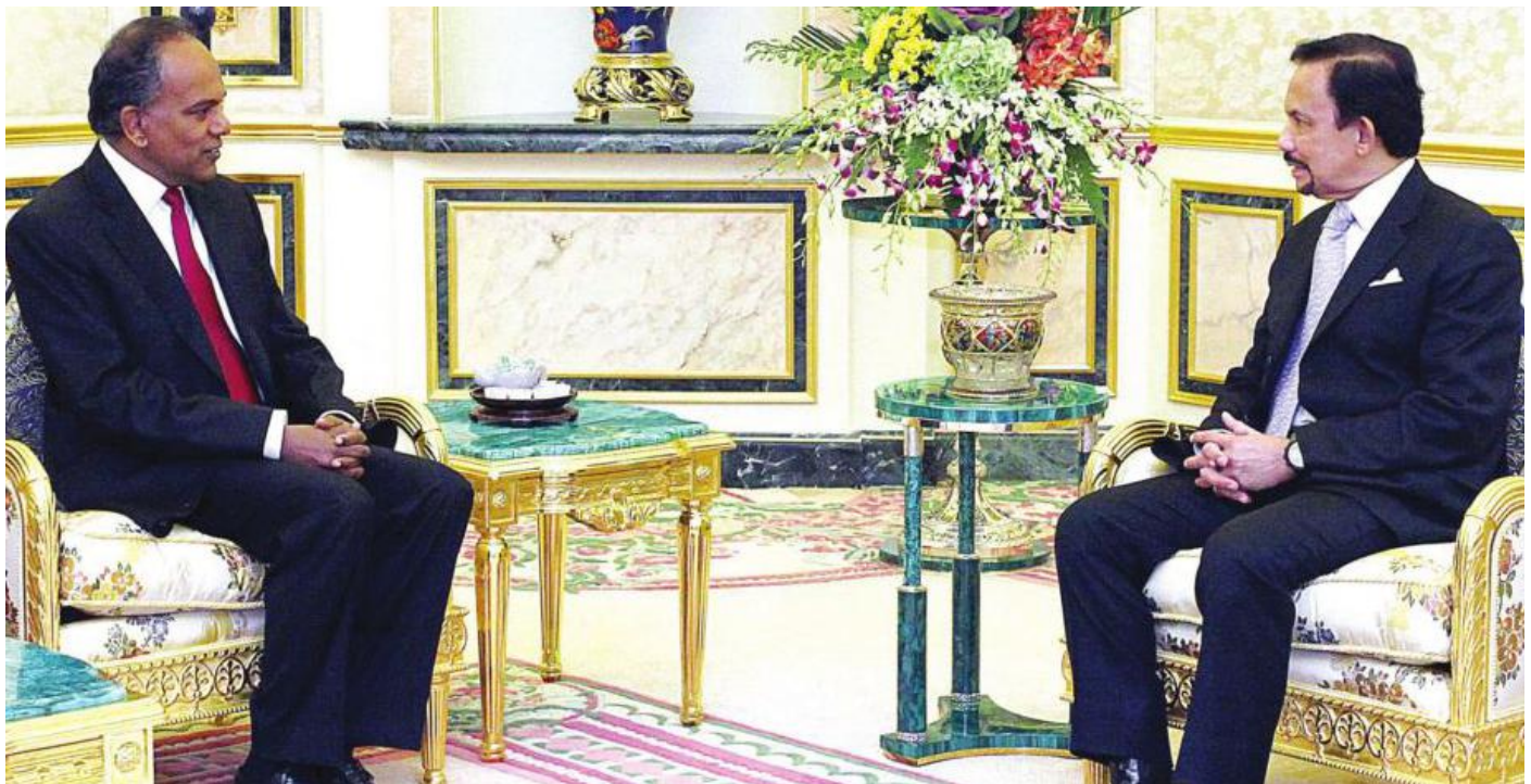
His Excellency Dato' Sri Dr. Ali bin Hamsa, Chief Secretary of Malaysia on November 3.