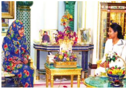
4. Her Majesty receives audiences