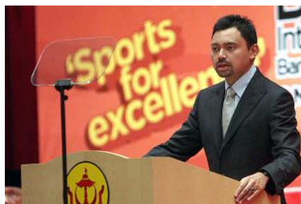
24. Launching of Brunei Sports Convention and Expo 2012