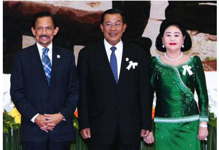
His Majesty the Sultan and Yang Di-Pertuan of Brunei Darussalam with His Excellency Samdech Akka Moha Sena Padei Techo Hun Sen, Prime Minister of Cambodia, and spouse, Madam Lokchumteav Kattiprithbint Bun Rany Hun Sen.