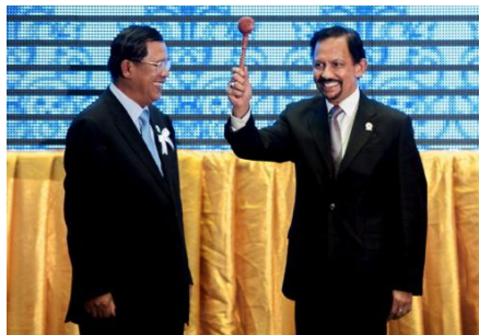
6. Brunei to host ASEAN Summit 2013

Facebook - Jabatan Penerangan Jabatan Perdana Menteri Brunei Darussalam