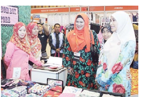
10. KLIHF2016 returns

His Majesty's Bestowment of 7. Personal Gift