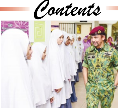
His Majesty inspects development of 4. Arabic Institution