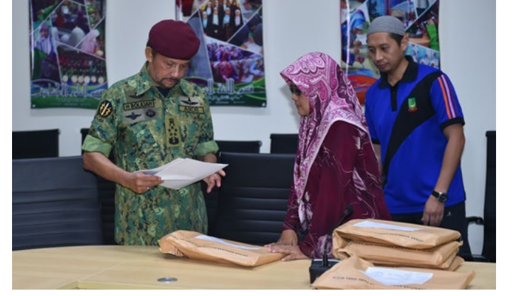
His Majesty checking the exam papers during the visit to Sekolah Persediaan Arab Bandar Seri Begawan (SPABSB).