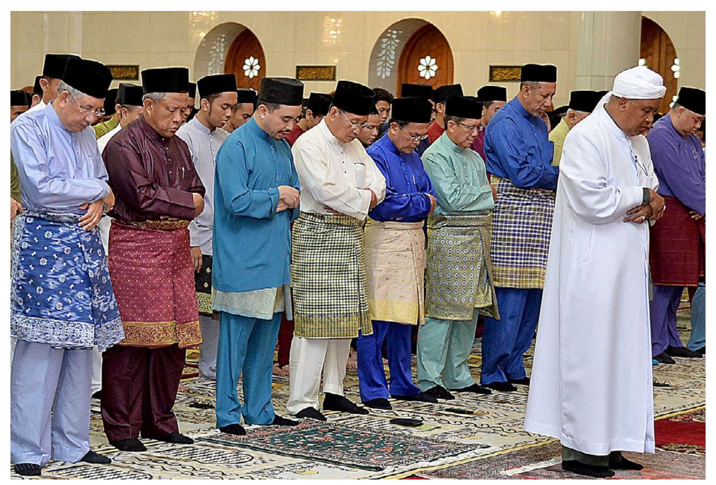
His Royal Highness joining the Zuhur mass prayer

The ceremony promotes a rise in awareness among youths in the reading and understanding of the Al-Quran as a guide in life, as well as to boost the understanding and team work between the agencies involved in the development of youths.