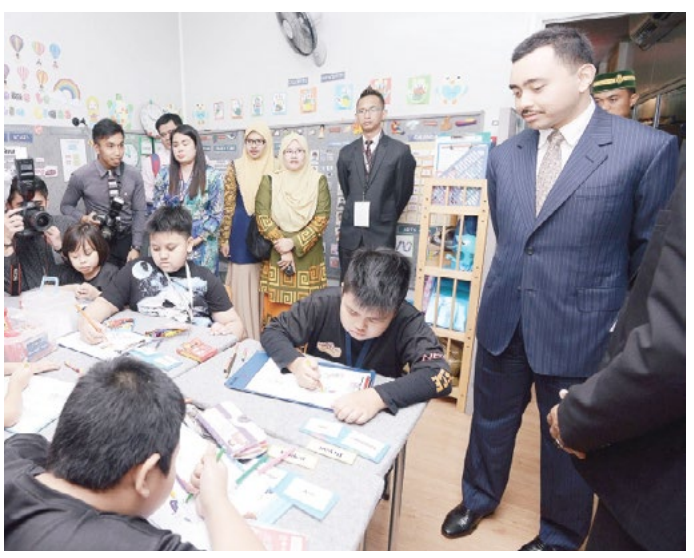
His Royal Highness Prince 'Abdul Malik observing a learning session at SMARTER EDGE Centre during the visit.