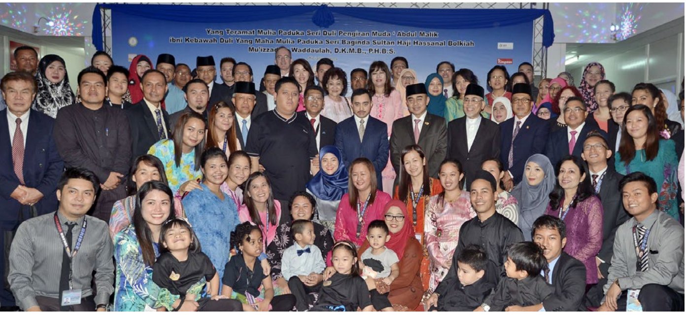
His Royal Highness in a group photo with SMARTER EDGE Centre members.

The centre was built in order to provide the best environment, therefore the organisation has developed unique strategies and curriculum that have been approved by the United Nations Educational, Scientific and Cultural Organization (UNESCO). The SMARTER Association has introduced new programmes and their own unique activities as well as curriculum known as Social, Training, Educational and Psychological (STEP). These developed programmes acquire all the necessary criterias such as having easy access, and having the capability to teach at a lower cost, technology and organisation. To date, the Brunei SMARTER Association has established three centres; one in Kuala Belait, the second one in Kampung Jangsak, both opened in 2004 and it's latest one, the EDGE centre in Kampung Mata-Mata.