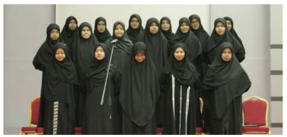
A choral speaking performance by international students from the Kingdom of Thailand.