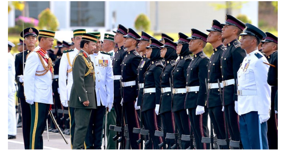
His Majesty inspecting the Guard of Honour during the Sovereign's Parade of Officer Cadets of the 17th Intake of the Officer Cadet School, Defence Academy RBAF.

The eight corners of the torch of the prestigious intensive military