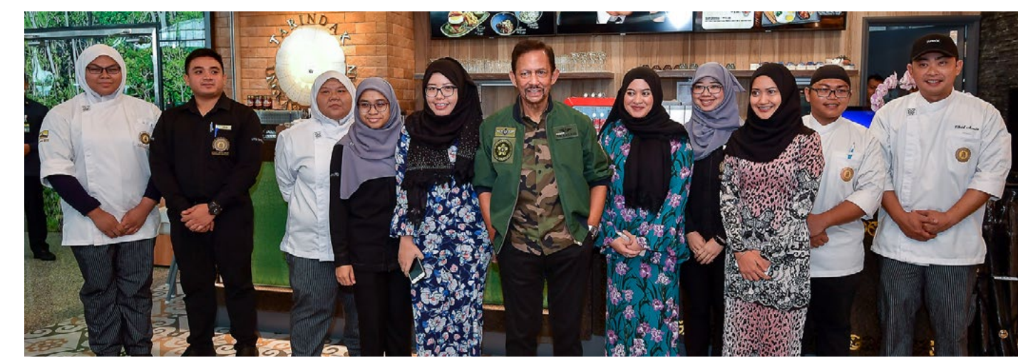
His Majesty in a group photo with the graduates running the Restoran Tarindak Ungkayah Graduan.