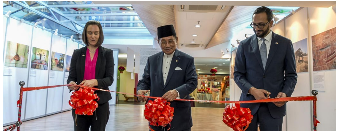
Yang Berhormat Pehin Udana Khatib Dato Paduka Seri Setia Ustaz Haji Awang Badaruddin bin Pengarah Dato Paduka Haji Awang Othman, Minister of Religious Affairs (centre) and Her Excellency Nicola Rosenblum, High Commissioner of Australia to Brunei Darussalam (left) launching the 'Boundless Plains; The Australian-Muslim Connection' photographic exhibition.