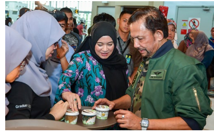
His Majesty taking a closer look at the locally made ice cream which comes in numerous fruit flavours, served at Restoran Tarindak Ungkayah Graduan.