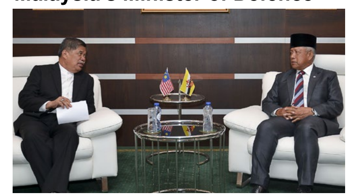
Yang Berhormat Pehin Datu Lailaraja Major General (Rtd) Dato Paduka Seri Haji Awang Halbi bin Haji Mohd. Yussof, Second Minster of Defence with The Honourable Haji Mohamad bin Sabu, Minister of Defence of Malaysia.

BANDAR SERI BEGAWAN, January 23 - Bilateral defense cooperation between Brunei Darussalam and Malaysia that have long existed, remains strong with joint military exercises and exchange of visits from officials of both countries.