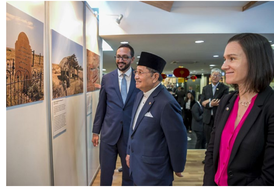
Excellency in her speech, among others, The Minister of Religious Affairs viweing the Photographic exhibition.

The exhibition is opened to the public until the 3rd of February.