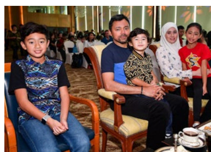
10. Their Royal Highnesses attend Celebration of Dance organised by Studio Elevé