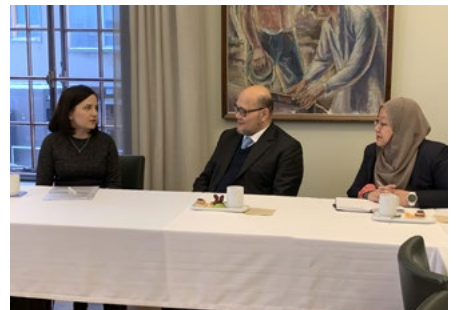
21. Brunei - Finland bilateral cooperation strengthens