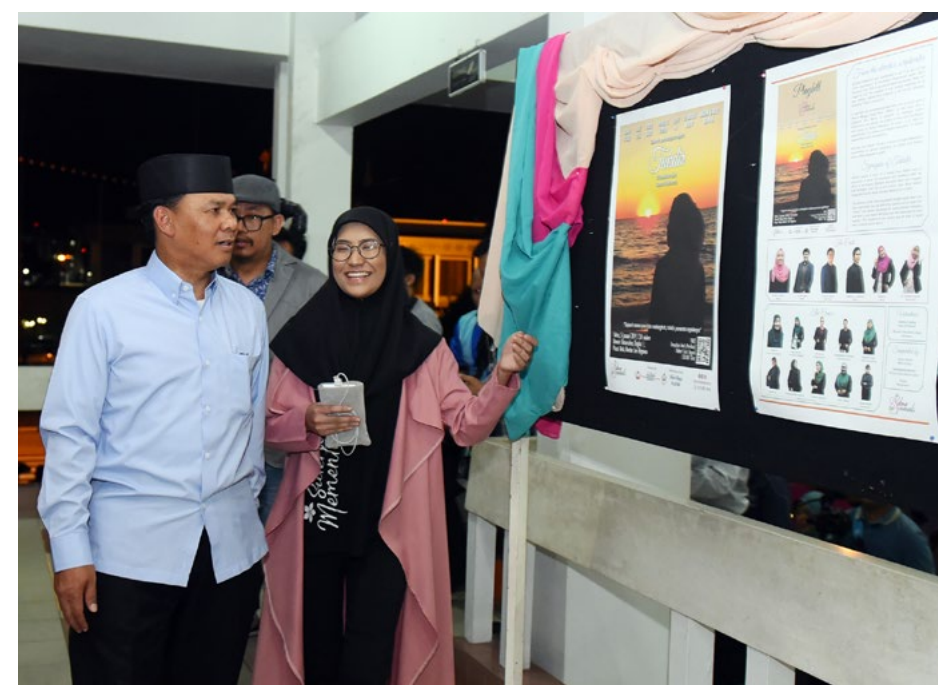
Yang Berhormat Major General (Rtd) Dato Paduka Seri Haji Aminuddin Ihsan bin Pehin Orang Kaya Saiful Mulok Dato Seri Paduka Haji Abidin, Minister of Culture, Youth and Sports listening to a briefing about the theatrical performance titled 'Takdir' by Sutera Memento.