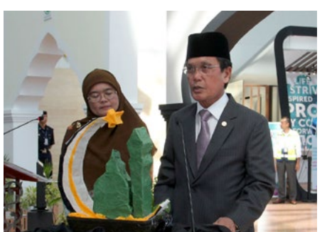
12. BSB as a Capital of Islamic Culture of Asian Region 2019