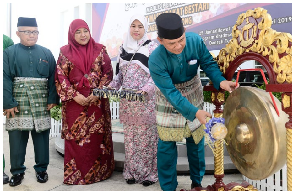
Yang Berhormat Major General (Rtd) Dato Paduka Seri Haji Aminuddin Ihsan bin Pehin Orang Kaya Saiful Mulok Dato Seri Paduka Haii Abidin, Minister of Culture, Youth and Sports launching the Temburong Bestari Community Centre.

Present as a guest of honour and to officially launch the Temburong Bestari Community Centre was Yang Berhormat Major General (Rtd) Dato Paduka Seri Haji Aminuddin Ihsan bin Pehin Orang Kava Saiful Mulok Dato Seri Paduka Haji Abidin, Minister of Culture, Youth and