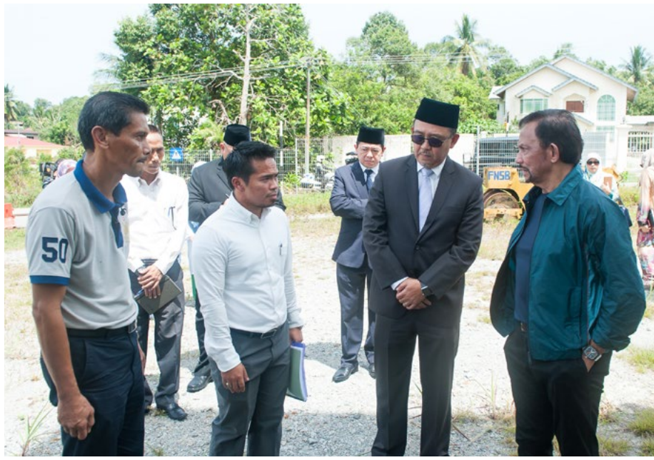
His Majesty Sultan visiting the site of the new Lambak Religious School building which is under contruction at Jalan Bedil.

The new Religious School will be equipped with facilities such as classrooms, teacher rooms, prayer rooms, multipurpose hall, ablution place, canteen, library, principal and assistant room, clerk, VIP room, meeting room, toilets, stage and dressing room for men and women, cleaning rooms, bookstores and stores goods.