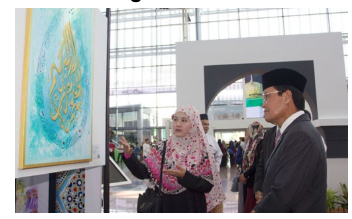
ormat Pehin Orang Kaya Seri Kerna Dato Seri Setia (Dr.) Haji Awang Abu Bakar bin Haji Apong, Minister of Home Affairs viweing one of the artwork featured int the Exhibition on the Bandar Seri Begawan Islamic

Present as the guest of honour at the ceremony and to launch the event was Yang Berhormat Yang Berhormat Pehin Orang Al-Quds Al-Sharif Photography Exhibition.