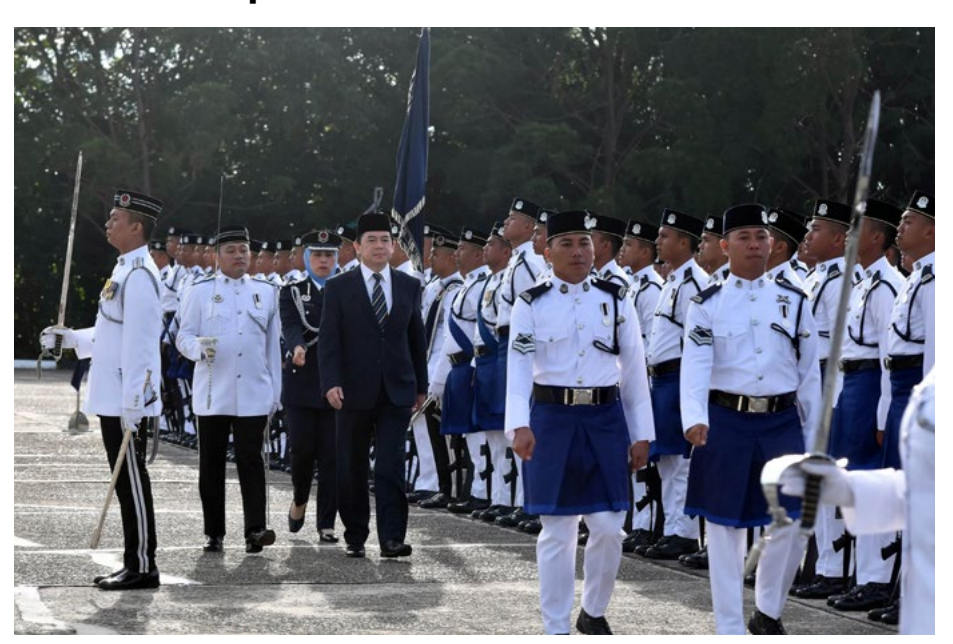
Yang Berhormat Dato Seri Setia Dr. Awang Haji Mohd. Amin Liew bin Abdullah, Minister at the Prime Minister's Office and the Second Minister of Finance and Economy inspecting the parade of Royal Brunei Police Force in conjunction with 98th Police Day Celebration at Police Training Centre.

GADONG, January 15 - The Royal Brunei Police Force (RBPF) as the specific law enforcement agency in the country is urged to continue to play its role as a close partner to the community, and work together in crime prevention efforts in the