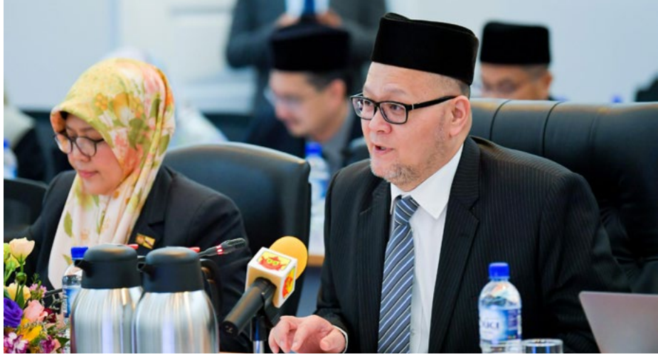
Yang Berhormat Dato Seri Setia Awang Haji Hamzah bin Haji Sulaiman, the Minister of Education delivering his welcoming speech during the Muzakarah Session (Dialogue Session) between the Ministry of Education and the members of the Legislative Council.

The Minister also addressed some of the strategies and initiatives that have been and is being implemented by MOE, which spans all levels of primary, secondary, post-secondary, technical and vocational education and higher education.