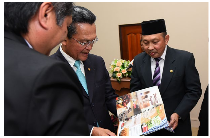
Yang Berhormat Pehin Orang Kaya Seri Kerna Dato Seri Setia (Dr.) Haji Awang Abu Bakar bin Haji Apong, Minister of Home Affairs taking a closer look at the First Edition of the Tutong District One Village One Product (1K1P) Guidebook.

TUTONG, January 31 - More than 100 types of products from 27 entrepreneurs from the Tutong District have been listed in the First Edition of Tutong District One Village One Product (1K1P) Guidebook which was launched in an effort to ease interaction between entrepreneurs and consumers of local products in the country.