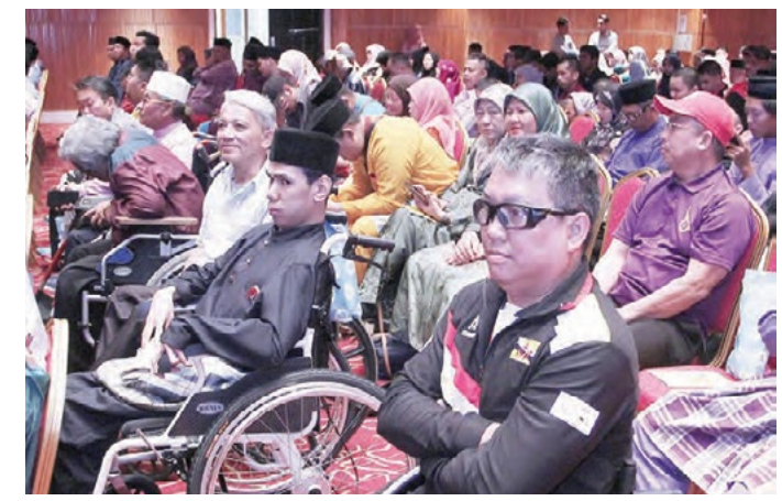
Among the invited guests present at the ceremony.

The forum was aimed at sharing knowledge and information related to the direction of efforts for participation and development of Persons with Disabilities in the present and future.