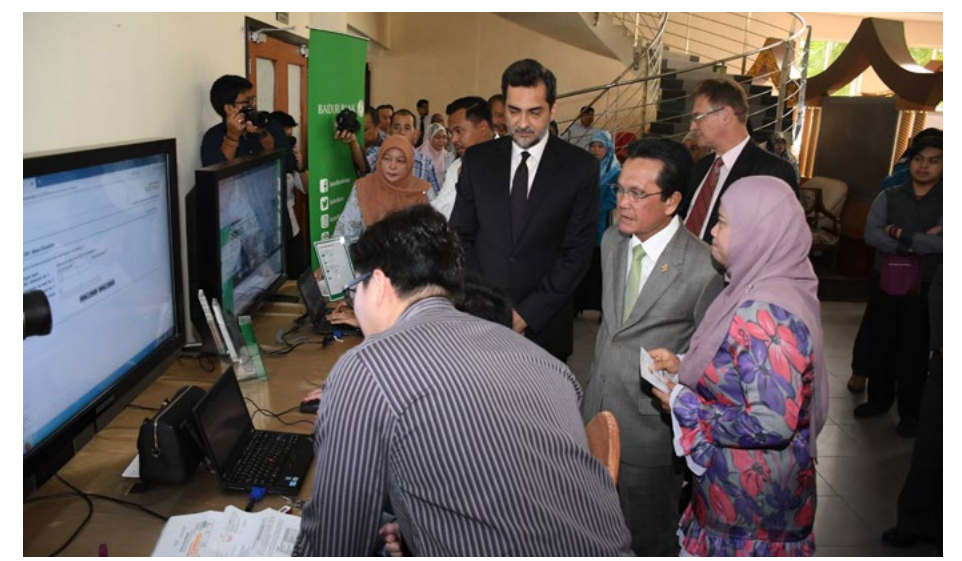
The Minister of Home Affairs being briefed on how payment is made through the smartphone application.

In addition, this service will provide convenience to taxpayers to settle building tax claims at any time easily and quickly,