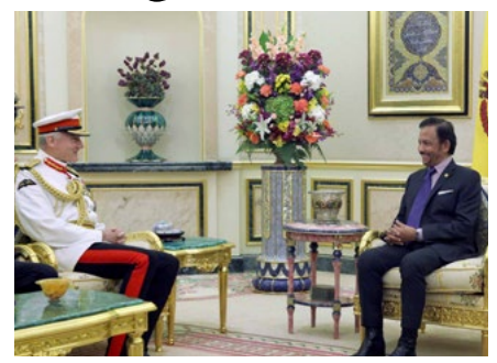
3. His Majesty receives audiences