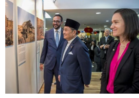
15. Photography exhibition highlights Australian Islamic history