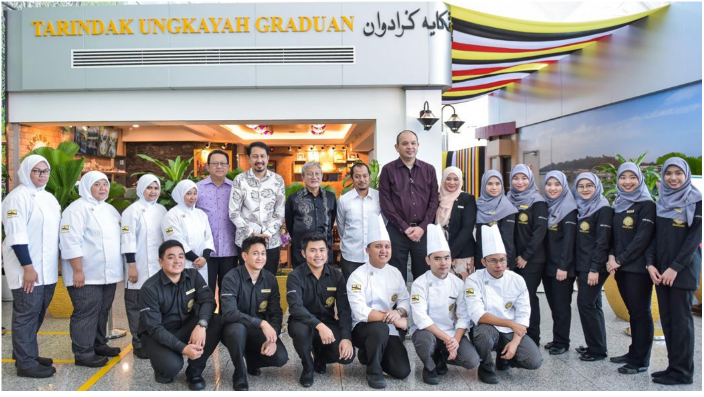
Graduates of Restoran Tarindak Ungkayah Graduan with invited guests at the Official Launching and Opening Ceremony of the restaurant.

BANDAR SERI BEGAWAN, January 6 - Restoran Tarindak Ungkayah Graduan, a restaurant completely operated by 16 local graduates was launched and opened at the Departure Hall of the Brunei International Airport.