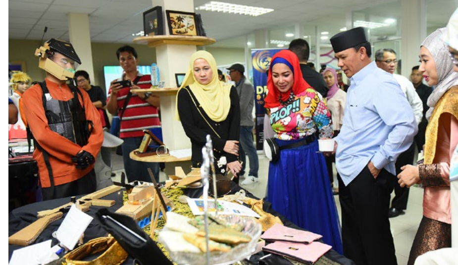
The Minister viewing the display of arts and handicrafts made from songket and wasted cardboard while touring the 'Ruang Belia Kitani' (Our Youths' Lounge).

The Youth Centre Week Night is a collaboration between the Youth and Sports Department and Youth Volunteers, and is held once a month, on the first Saturday of the first week of every month, by organising pro-active activities that