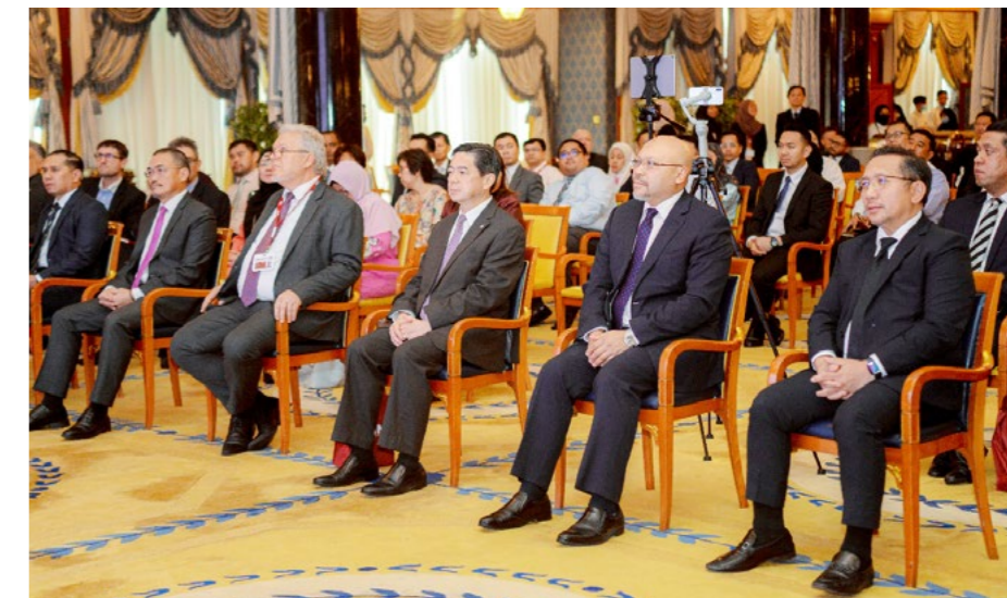
Present as Guest of Honours were Yang Berhormat Minister at the Prime Minister's Office and Second Minister of Finance and Economy as the Chairman of UNN; and Yang Berhormat Minister of Transport and Infocommunications.