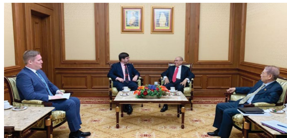
Yang Berhormat Speaker of the Legislative Council and the British High Commissioner to Brunei Darussalam during the courtesy call.

At the meeting, both parties also touched on matters of mutual concern on the outbreak of COVID-19. His Excellency stated that Brunei Darussalam has taken rigorous measures to curb the pandemic. Both parties hope that UK and other affected nations can find a solution to control it.