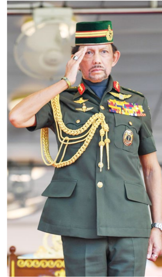
His Majesty Sultan Haji Hassanal Bolkiah Mu'izzaddin Waddaulah Ibn Al-Marhum Sultan Haji Omar Ali Saifuddien Sa'adul Khairi Waddien, Sultan and Yang Di-Pertuan of Brunei Darussalam receiving a Royal Salute.