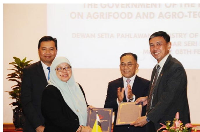
Yang Berhormat Minister of Primary Resources and Tourism witnessing the exchange of signed documents between representatives of both countries.

Earlier, the Minister of Primary Resources and Tourism held a virtual bilateral discussion with Her Excellency Grace Fu Hai Yien, Minister for Sustainability and the Environment and Lim Kok Thai, Chief Executive Officer of Singapore Food Agency.