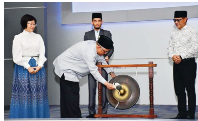
Yang Mulia Deputy Minister of Religious Affairs officiating KUPU SB's Open Day.

Thailand Day is a special collaboration between the Royal Thai Embassy in Brunei Darussalam and KUPU SB with the support of Thai students studying in the country.