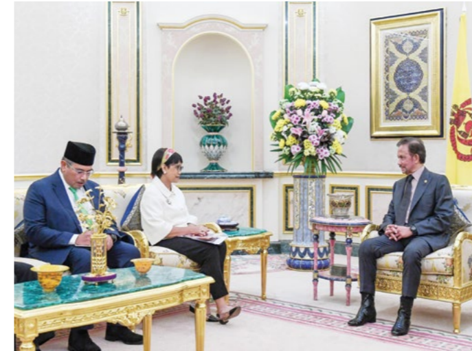
Her Excellency Retno L.P. Marsudi, Minister of Foreign Affairs of the Republic of Indonesia on February 17.

His Majesty Sultan Haji Hassanal Bolkiah Mu'izzaddin Waddaulah ibni Al-Marhum Sultan Haji Omar 'Ali Saifuddien Sa'adul Khairi Waddien, Sultan and Yang Di-Pertuan of Brunei Darussalam received in audience at Istana Nurul Iman: