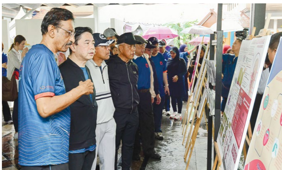
Cabinet Ministers being briefed during a tour of the exhibition.

as a reminder that the enduring power of cooperation and collective actions matter for a healthier, brighter world without cancer.