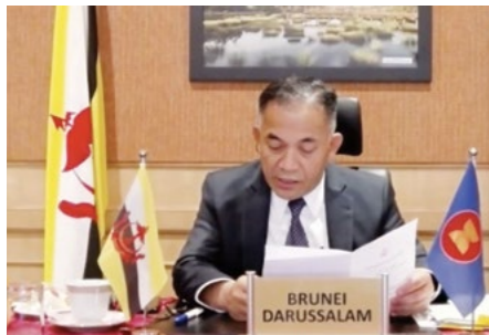
10. Tourism Industry greatly affected by impacts of COVID-19