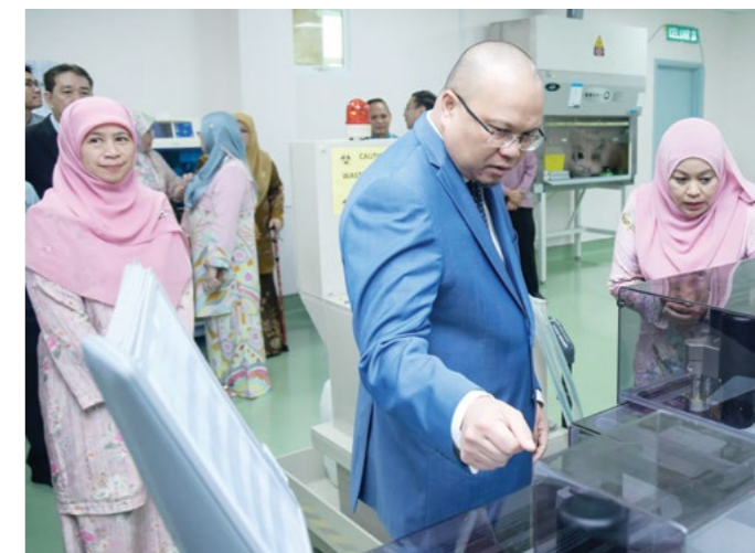
Yang Berhormat Minister of Health reviewing the Total Laboratory Automation System, National Clinical Chemistry Reference Laboratory, Department of Laboratory Services.