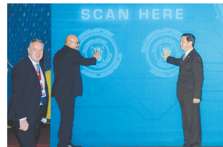
Yang Berhormat Minister at the Prime Minister's Office and Second Minister of Finance and Economy; and Yang Berhormat Minister of Transport and Infocommunications officiating the launch of Borneo IX, held at the Royal Berkshire Hall, Royal Brunei Polo and Riding Club.

The development will also support the main purpose of the Government of His Majesty the Sultan and Yang Di-Pertuan of Brunei Darussalam in implementing the digitisation plan needed to achieve the objectives of Brunei Vision 2035 as part of the National ICT Development Plan.