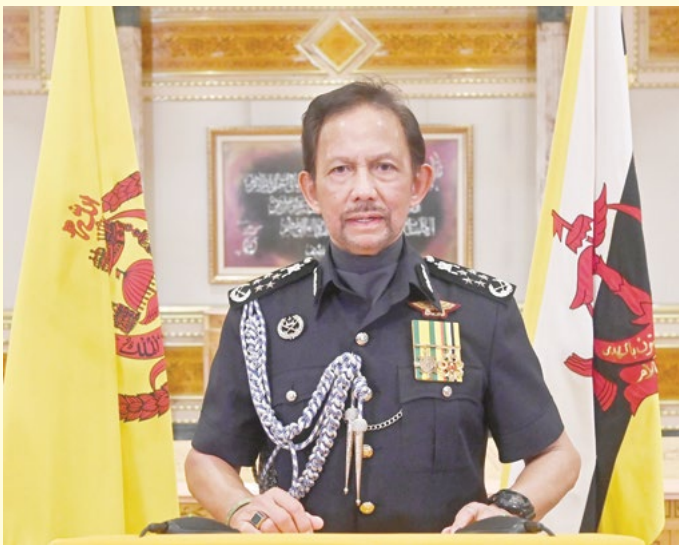
His Majesty Sultan Haji Hassanal Bolkiah Mu'izzaddin Waddaulah ibni Al-Marhum Sultan Haji Omar 'Ali Saifuddien Sa'adul Khairi Waddien, Sultan and Yang Di-Pertuan of Brunei Darussalam from Istana Nurul Iman delivering a titah (royal speech) to mark Brunei Darussalam's 37 th National Day Celebration.

BANDAR SERI BEGAWAN, February 22 - His Majesty Sultan Haji Hassanal Bolkiah Mu'izzaddin Waddaulah ibni Al-Marhum Sultan Haji Omar 'Ali Saifuddien Sa'adul Khairi Waddien, Sultan and Yang Di-Pertuan of Brunei Darussalam highlighted in a titah (royal speech) in conjunction with the 37 th National Day of Brunei Darussalam's celebration from Istana Nurul Iman on February 22 that National Day is not merely a celebration, but a time to remember and to reflect on the value of independence and indeed is not something we can buy but a gift from Allah the Almighty.