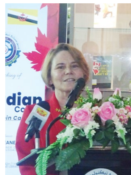
Her Excellency while delivering her speech at the ceremony.