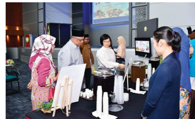
Yang Mulia Deputy Minister of Religious Affairs and Her Excellency Ambassador Extraordinary and Plenipotentiary of the Kingdom of Thailand touring the exhibition.