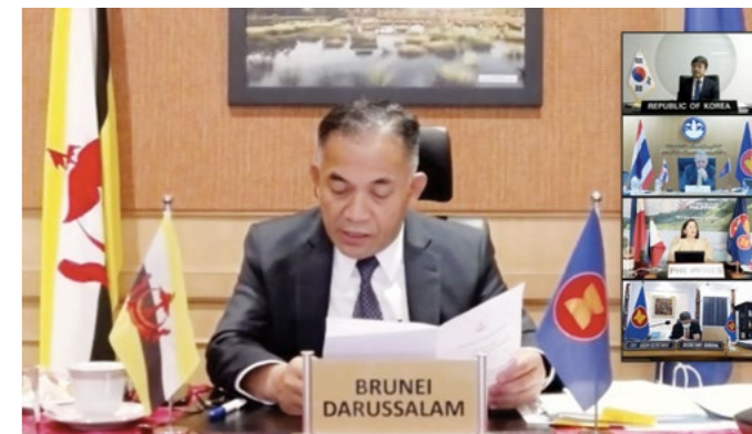
Yang Berhormat Minister of Primary Resources and Tourism delivering his speech through video conference.

Cooperation with the Plus Three Countries (China, Japan and