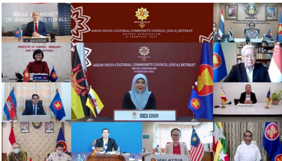
Permanent Secretary (Community and Culture) at the Ministry of Culture, Youth and Sports, in her capacity as Brunei Darussalam's SOCA Leader, chairing the Senior Officials Committee for the ASEAN Socio-Cultural Community (SOCA) Retreat, held on February 8 via video conference.

The meeting also reiterated ASEAN's commitment in continuing regional collective efforts to mitigate the impacts of the COVID-19 pandemic, by implementing the ASEAN Comprehensive Recovery Framework, and following up on the recommendations of the Mid-Term Review of the ASCC Blueprint 2025, to enhance the ASEAN Community's