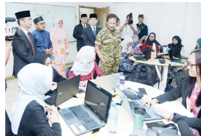
His Majesty mingling with the students.

In line with an increase in the number of schools, it is inevitable for various issues to occur and therefore His Majesty hoped that all will run smoothly, particularly for the students in their respective schools, so that they may gain discipline and noble values.