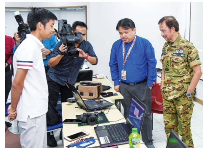
His Majesty being briefed by a teaching staff during the visit.

"Hence, the question of building a new campus to accommodate the four schools under PB should be considered," said His Majesty.