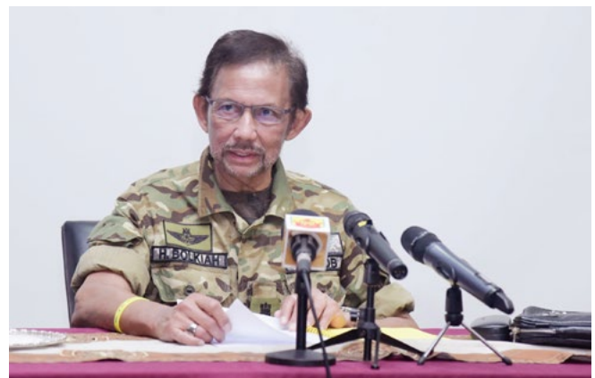
His Majesty Sultan Haji Hassanal Bolkiah Mu'izzaddin Waddaulah ibni Al-Marhum Sultan Haji Omar 'Ali Saifuddien Sa'adul Khairi Waddien, Sultan and Yang Di-Pertuan of Brunei Darussalam delivering a titah (royal speech) during the visit.