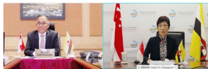
Yang Berhormat Minister of Primary Resources and Tourism during the virtual bilateral discussion with Her Excellency Grace Fu Hai Yien, Minister for Sustainability and the Environment and Lim Kok Thai, Chief Executive Officer of Singapore Food Agency.