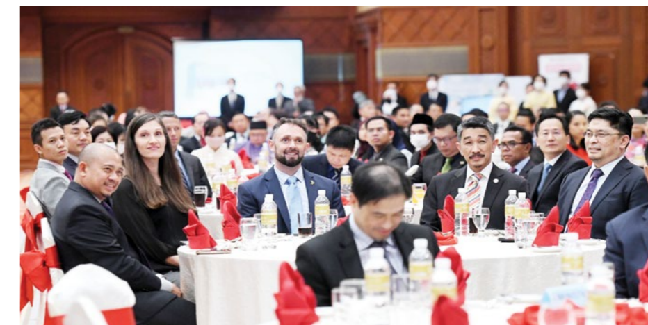
Among the guests in attendance at the reception held at Rizqun International Hotel.