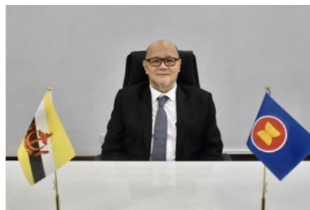
18. ASEAN-India Online Hackathon strengthens educational cooperation