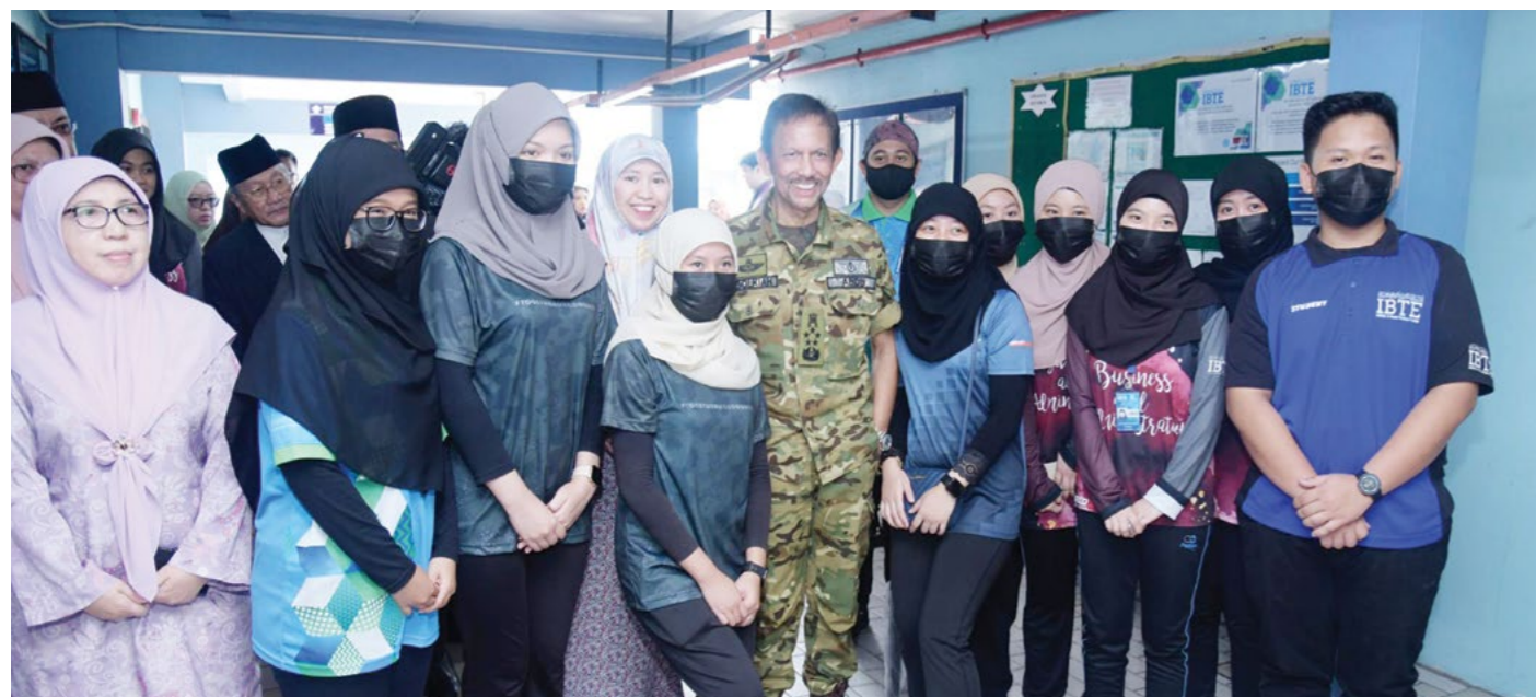
His Majesty Sultan Haji Hassanal Bolkih Mu'izzaddin Waddaulah ibni Al-Marhum Sultan Haji Omar Ali Saifuddin Sa'adul Khairi Waddien, Sultan and Yang Di-Pertuan of Brunei Darussalam in a group photo with students at IBTE Business Campus.

From PB, His Majesty then visited the two campuses under the Institute of Brunei Technical Education (IBTE) namely IBTE Business Campus located at Jalan Pasar Gadong and IBTE School of Aviation (School of Aviation) located at IBTE Sultan Saiful Rijal Campus, Jalan Utama Berakas where His Majesty ended his visit.