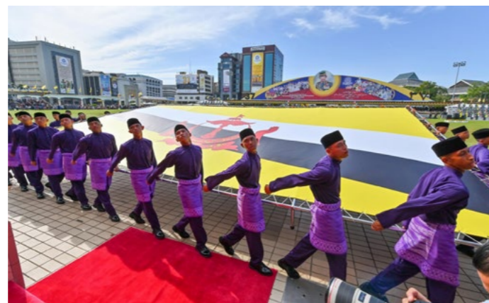
The march past of giant-sized National Flag Bearers Team.