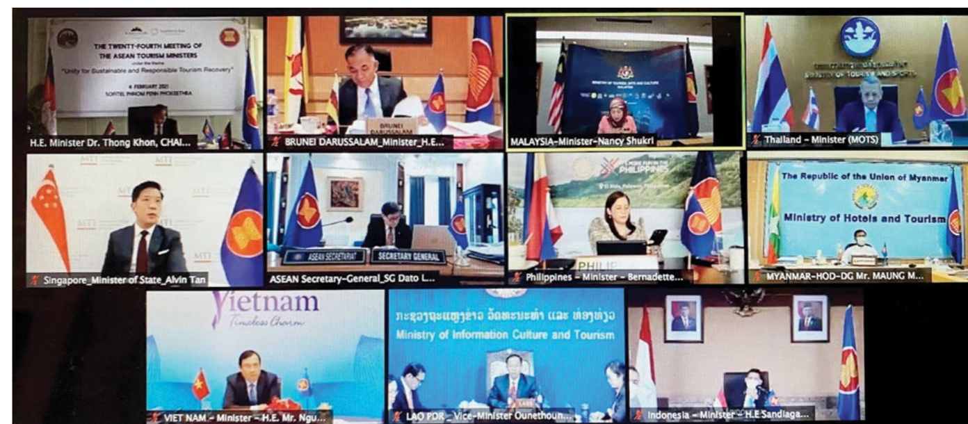
Brunei Darussalam with other ASEAN counterparts discussing matters concerning impacts of COVID-19 over tourism industry.

The Chairmanship of Cambodia to host ASEAN Tourism Forum 2021 has been extended to January 2022 in order to enable Cambodia to host the ASEAN Tourism Forum (ATF) in 2022.