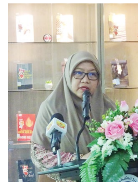
Vice Chancellor of Universiti Teknologi Brunei expressing her gratitude to the Canadian High Commissioner for the contribution.