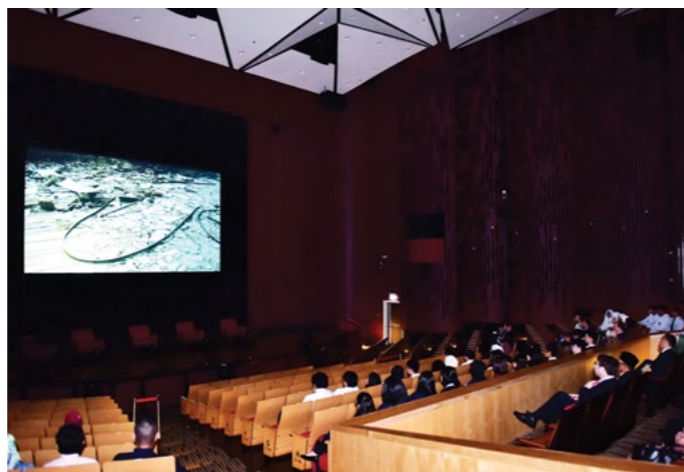
The documentary featured a first-hand account of humanity's impact on nature.