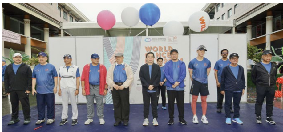
Cabinet Ministers and PJSC's Goodwill Ambassador and Messenger of Cancer Awareness at The World Cancer Day weekend.

The trishaws will travel along a two kilometre route carrying a message of this year's theme "I Am and I Will" which is an empowering call to action, and