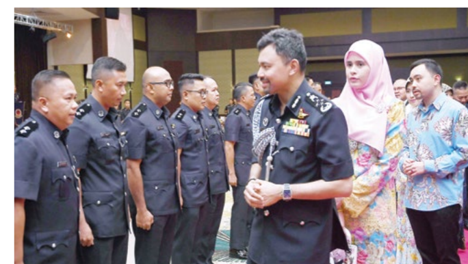
Their Royal Highnesses with the police inspectorate Squad 1 and 2 who were recently promoted.