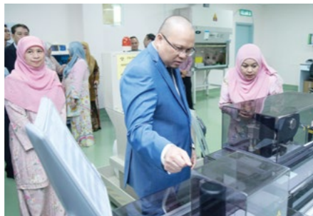
13. Launching of Total Laboratory Automation System