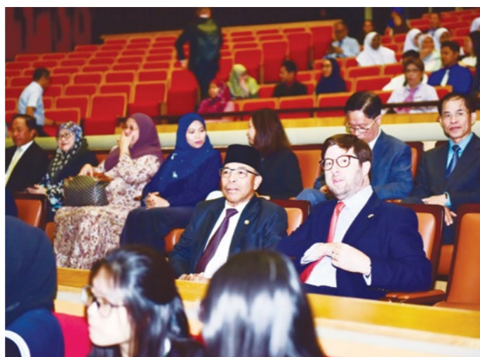
Yang Berhormat Minister of Development watching a film screening "A Life on Our Planet" by Sir David Attenborough hosted by the British High Commission in Brunei Darussalam.

Also present were Members of the Legislative Council and Heads of Foreign Diplomats to Brunei Darussalam.