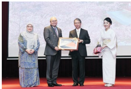
14. Support Brunei's efforts to diversify economy, green society