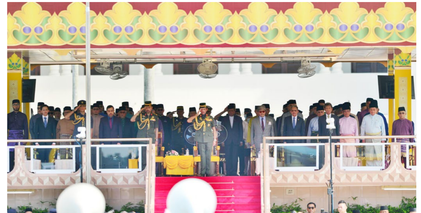
His Majesty the Sultan and Yang Di-Pertuan of Brunei Darussalam; His Royal Highness Prince Haji Al-Muhtadee Billah, the Crown Prince and Senior Minister at the Prime Minister's Office; His Royal Highness Prince 'Abdul Malik; His Royal Highness Prince 'Abdul Mateen; His Royal Highness Prince 'Abdul Wakeel ; His Royal Highness Prince Mohamed Bolkiah; His Royal Highness Prince Haji Sufri Bolkiah and His Royal Highness Prince Haji Jefri Bolkiah at the 37 th National Day Celebration.