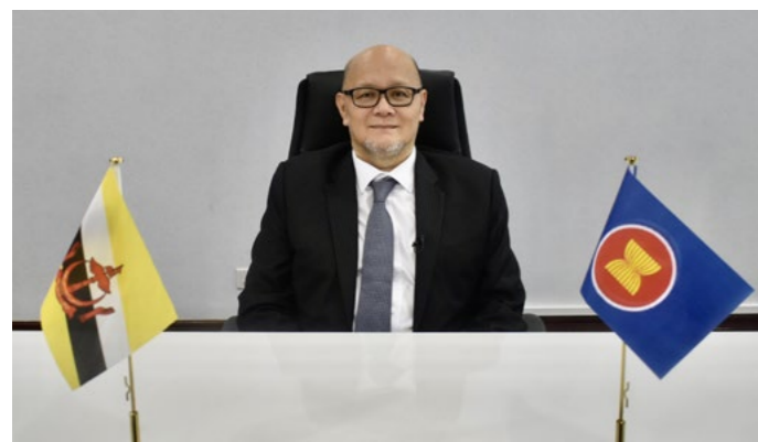
Yang Berhormat Minister of Education delivering a message through a pre-recorded video.

BANDAR SERI BEGAWAN, February 5 - The prize giving ceremony for the ASEAN-India Online Hackathon was held yesterday, which was attended by guests and delegates from ASEAN and the Republic of India.