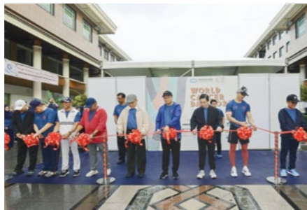
15. Empowering call-to-action urging collective commitment fighting cancer