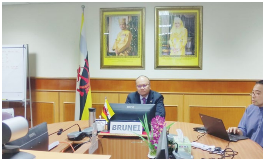
Yang Berhormat Minister of Health representing Brunei Darussalam at the 4 th Meeting to Access to COVID-19 Tools (ACT) Accelerator Facilitation Council online.

The panel members are from companies including AstraZeneca, Johnson & Johnson, AXA and the Minister of Health of the Republic of Indonesia discussed the challenges of achieving access to vaccines fairly and equitably as well as