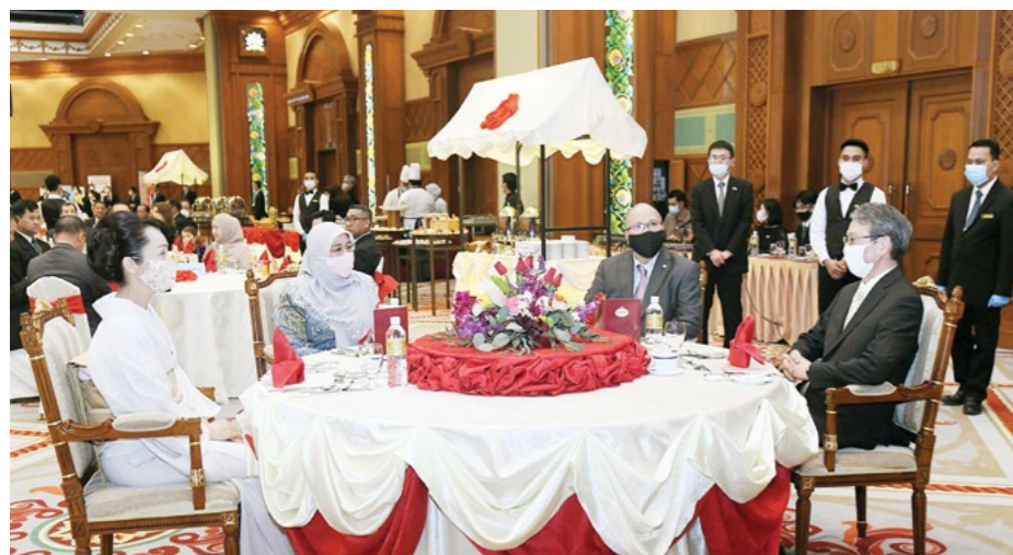
The Guest of Honour representing the Government of His Majesty the Sultan and Yang Di-Pertuan of Brunei Darussalam at the reception was Yang Berhormat Minister of Health.

BANDAR SERI BEGAWAN, February 17 - Japan will continue to support Brunei Darussalam's efforts to diversify its economy and foster green society through cooperation in the green energy sector, such as Advanced Hydrogen Energy Chain Association for Technology Development (AHEAD) for hydrogen production and cooperation with Mitsubishi Corporation in solar energy. Japan will work together with other countries, including Brunei Darussalam,