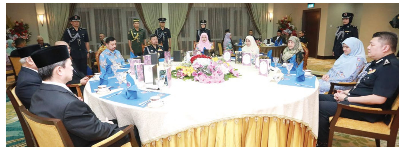
His Royal Highness and Her Royal Highness Paduka Seri Pengiran Anak Isteri Pengiran Anak Sarah and members of the royal family during the high tea reception to mark the 47 th birthday of His Royal Highness the Crown Prince.