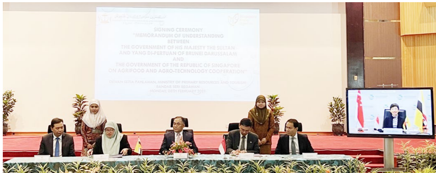
Witnessing the signing ceremony between His Majesty's Government and the Government of the Republic of Singapore were Yang Berhormat Minister of Primary Resources and Tourism of Brunei and the Minister of Primary Resources and Trade of Singapore.