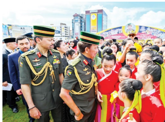
His Majesty the Sultan and Yang Di-Pertuan of Brunei Darussalam; His Royal Highness Prince Haji Al-Muhtadee Billah, the Crown Prince and Senior Minister at the Prime Minister's Office and His Royal Highness Prince 'Abdul Malik mingling with some of the performers of the celebration.

mission of His Majesty's Government in building the country's human resource or manpower towards accomplishing the goals of Brunei Vision or Wawasan Brunei 2035. It also reflects the resilience of the country's development, the younger generation's preparedness in defending their country, while responding to the challenges of the technological boom, communication and the Fourth Industrial Revolution.