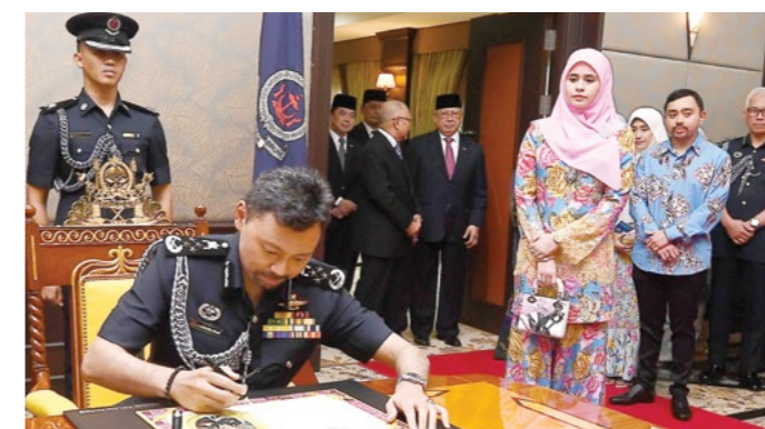
His Royal Highness the Crown Prince signing the commemorative parchment.