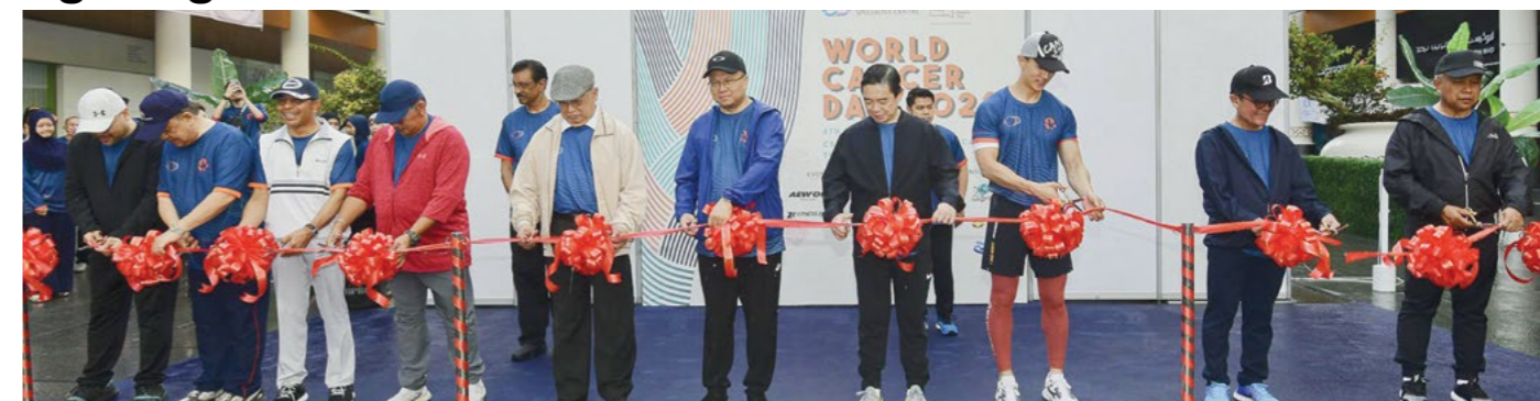
Cabinet Ministers during the ribbon cutting ceremony in conjunction with World Cancer Day together with PJSC's Goodwill Ambassador and Messenger of Cancer Awareness, Wu Chun.

BANDAR SERI BEGAWAN, February 28 - The number of cancer cases in Brunei Darussalam continues to increase annually where in 2019, a total of 704 cases were diagnosed compared to 664 cases in 2018.