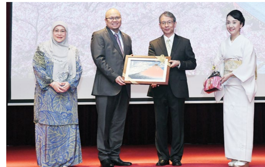
Yang Berhormat Minister of Health receiving a souvenir from His Excellency Eiji Yamamoto.

Japanese government together with the International Olympic Committee is fully committed to hold the Tokyo Olympics and Paralympic Games as scheduled, while prioritising the health and safety of all athletes and spectators as well as Brunei athletes are invited to Tokyo.