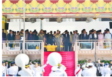
5. 37 th National Day : Generate physical development in tandem with spiritual progress