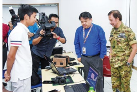
7. Unscheduled visit to PB, IBTE : Irregular policies lead to weak administration