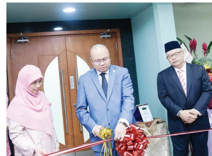
Yang Berhormat Minister of Health officiating the Total Laboratory Automation System at Raja Isteri Pengiran Anak Saleha Hospital (RIPAS).

With the system, the quality of the National Clinical Chemistry Reference Laboratory Service will be improved by providing more accurate and consistent laboratory test results according to the 'turnaround time' of each test. The system also offers the feature of reducing the risk of exposure to patient's blood samples which then assures the guaranteed safety of staff.