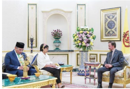
3. His Majesty receives audiences