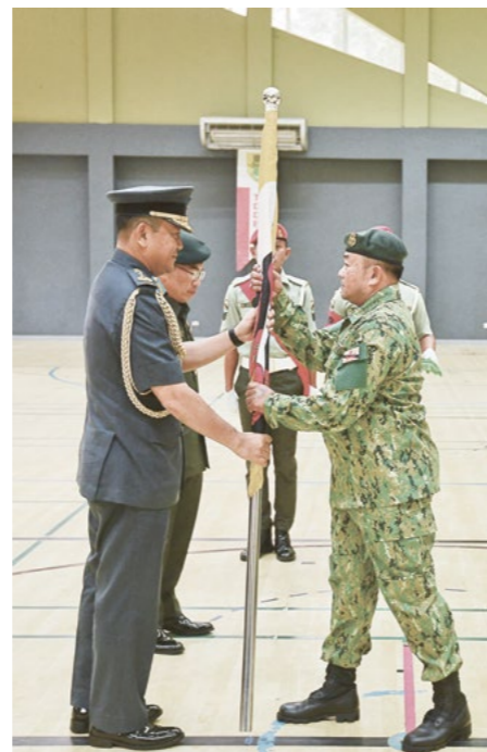
Royal Brunei Armed Forces (RBAF) Commander handing over the national flag to Head of Delegation (above).