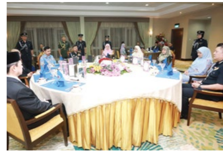
8. RBAF and RBPF host Crown Prince's birthday