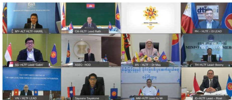
Permanent Secretary (Economy) at the Ministry of Finance and Economy representing Brunei Darussalam at the 39 th Meeting of the High-Level Task Force on ASEAN Economic Integration (HLTF-EI) via video conference.