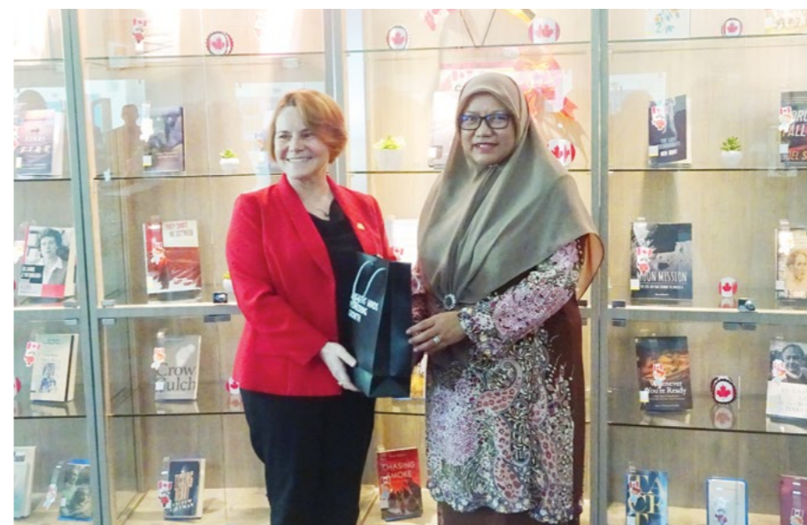
Her Excellency Canadian High Commissioner to Brunei Darussalam receiving a souvenir from Vice Chancellor of UTB.

The book donation is hoped to offer additional value to the library's growing foreign mission collection while fostering love for reading within the UTB community. The Le Coin Canadian also acts as the added value for students and staff in UTB.