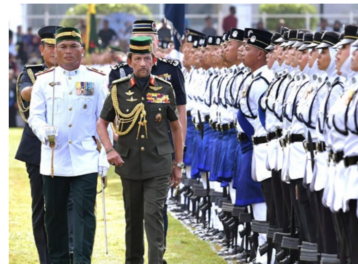
His Majesty Sultan Haji Hassanal Bolkih Mu'izzaddin Waddaulah Ibn Al-Marhum Sultan Haji Omar Ali Saifuddin Sa'adul Khairi Waddien, Sultan and Yang Di-Pertuan of Brunei Darussalam inspecting the Guard of Honour at the 37 th National Day Celebration.

Further enlivening the celebration was the field performance with the theme, "Menjayakan Wawasan Negara" (Accomplishing the National Vision), involving 1,000 participants from various sectors and national development agencies, portraying the vision and