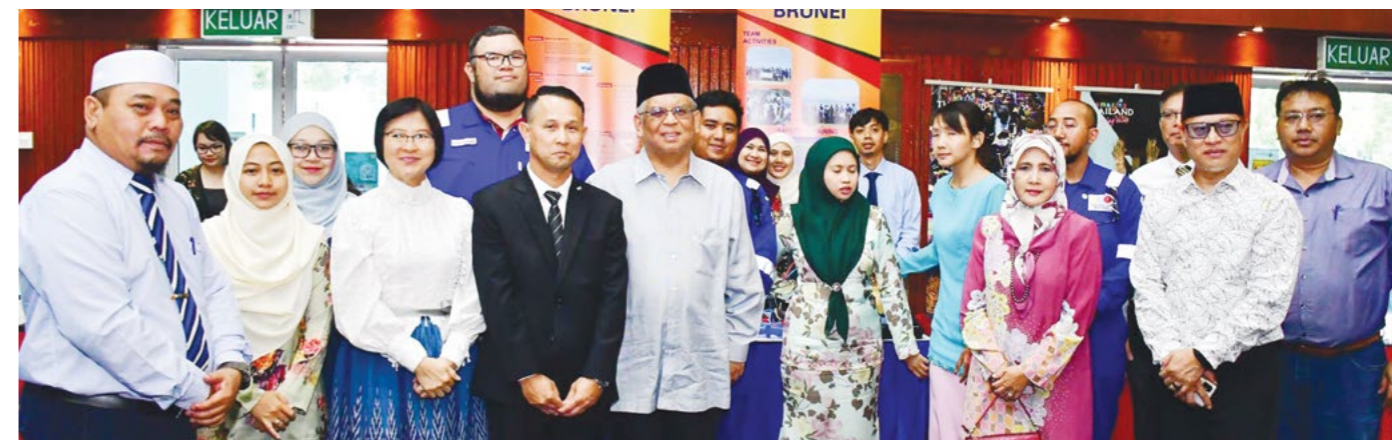
Yang Mulia Deputy Minister of Religious Affairs in a group photo at the KUPU SB's Open Day.