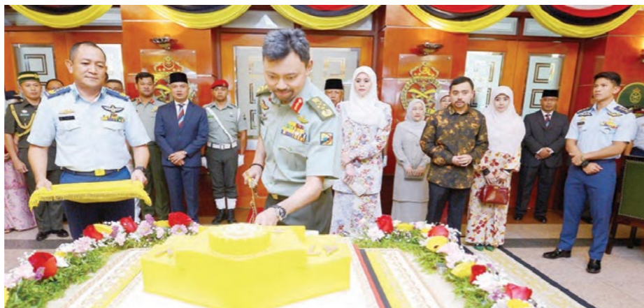
His Royal Highness Prince Haji Al-Muhtadee Billah ibni His Majesty Sultan Haji Hassanal Bolkiah Mu'izzaddin Waddaulah, the Crown Prince and Senior Minister at the Prime Minister's Office during the cake-cutting ceremony at the high-tea reception hosted by RBAF. Also present were Her Royal Highness Paduka Seri Pengiran Anak Isteri Pengiran Anak Sarah binti Pengiran Haji Salleh Ab. Rahaman; His Royal Highness Prince 'Abdul Malik and Yang Amat Mulia Pengiran Anak Isteri Pengiran Raabi'atul 'Adawiyah binti Pengiran Haji Bolkiah; and His Royal Highness 920 Captain (U) Prince 'Abdul Mateen.

The pesambah was an all-terrain high-powered electric bicycle which is in line with current trend in which the ordinary bicycle is now powered by electricity. It also reflects the significance of cycling as a rapidly developing sports in the country.