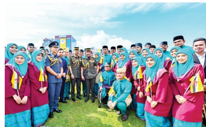
His Majesty and Their Royal Highnesses in a group photo with some of the participants.