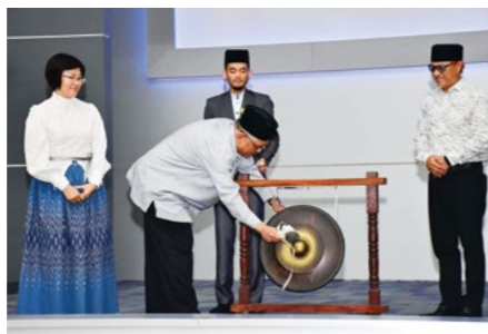
19. KUPU SB's Open Day fosters ties with Thai community