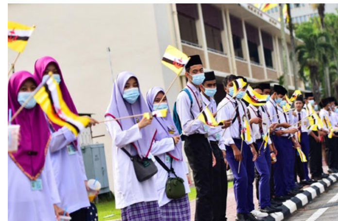
Enthusiastic students lined up to fly the national flag welcoming the arrival of the royal entourage.