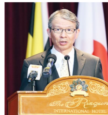
His Excellency Ambassador Extraordinary and Plenipotentiary of Japan to Brunei Darussalam delivering his speech.

The event was also attended by representatives from Japanese companies based in the country, exhibiting locally made products exported to the Japanese market.