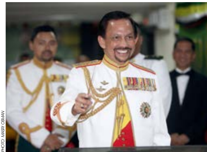
His Majesty at the RBAF's regimental dinner.

Also attending was His Royal Highness Prince General Haji Al-Muhtadee Billah, The Crown Prince and Senior Minister at the Prime Minister's Office and General of RBAF.