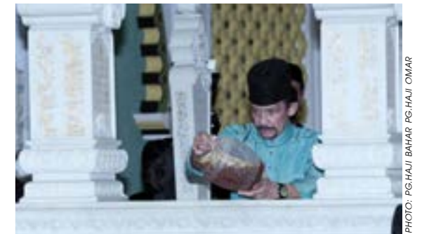
His Majesty pouring scented water on the royal mausoleum.

Al-Marhum Sultan Haji Omar 'Ali Saifuddien Sa'adul Khairi Waddien passed away on September 7, 1986; while Al-Marhumah Duli Raja Isteri Pengiran Anak Damit passed away on September 13, 1979.