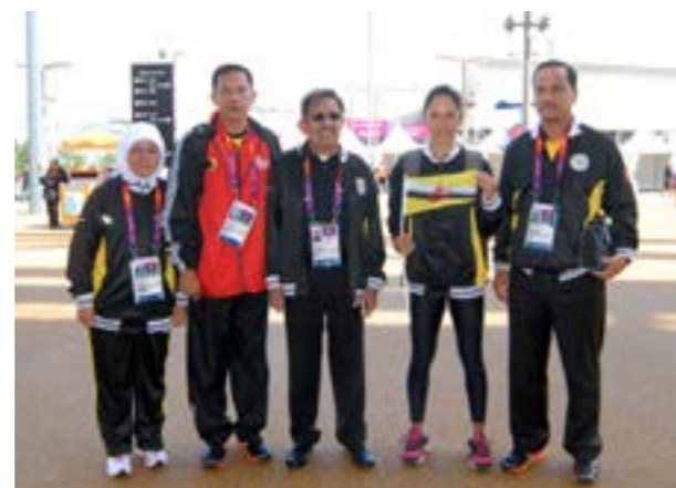
His Royal Highness with one of the Brunei's athletes.

In a separate occasion, His Royal Highness attended a reception hosted by the Qatar National Olympic Council (QNOC) in London on July 27. His Royal Highness took a closer look on an exhibition on the development of sports in the State of Qatar. The state is bidding to host the 32 nd Olympic Games in 2020.