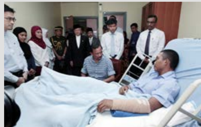
His Majesty visiting a member of RBAF who survived the helicopter crash at RIPAS Hospital.