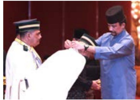
His Majesty consented to bestow one of the recipients.

His Majesty then awarded the 'Darjah Seri Paduka Mahkota Brunei Yang Amat Mulia' (SMB) Darjah Ke III or 'The Most Honourable of the Crown of Brunei (Third Class)' to 70 people. Twelve recipients were awarded the 'Darjah Seri Ugama Islam Negara Brunei Yang Amat Bersinar' (SUB) or 'The Most Esteemed Order of Islam Brunei (Fourth Class)'. Two hundred and forty-three people received the 'Darjah Setia Negara Brunei Yang Amat Bahagia' (PSB) or 'The Most Blessed Order of Setia Negara Brunei (Fourth Class)'. And 15 people received the 'Darjah Seri Ugama Islam Negara Brunei Yang Amat Bersinar' (PUB) or 'The Most Esteemed Order of Islam Brunei (Fifth Class)'.