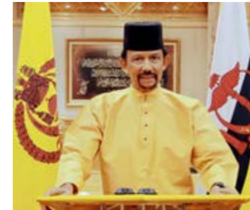
His Majesty delivers a titah (royal speech) in conjunction with Hari Raya Aidilfitri 1433H.

BANDAR SERI BEGAWAN, August 19 - Brunei Darussalam celebrates Hari Raya Aidilfitri as a symbol of victory after undergoing the holy month of Ramadan where one is required to fast from dawn to dusk.