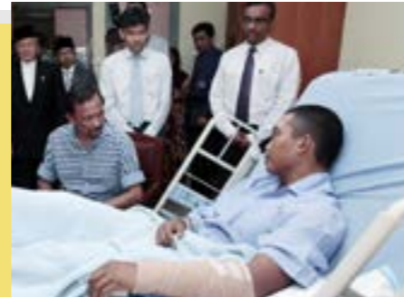
8 His Majesty sends condolences to victims of helicopter crash