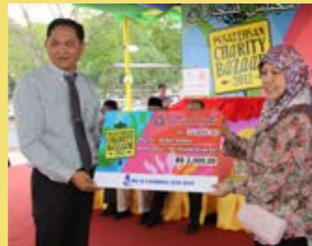
16 Pusat Ehsan organises activities to raise fund