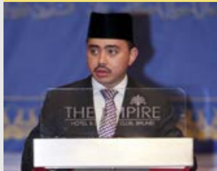
15 His Royal Highness: Nurture a culture on using Jawi spelling