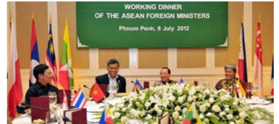
His Royal Highness during the Working Dinner for ASEAN Foreign Ministers.

The theme for this year's ASEAN Summit is 'ASEAN: One Community, One Destiny'.