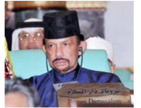
His Majesty at 4 th Extraordinary Session of the Islamic Summit Conference.

cultures and civilisation; current political issues faced by the Middle East and the Southeast Asia; and efforts to strengthen cooperation in fields of economy and social.