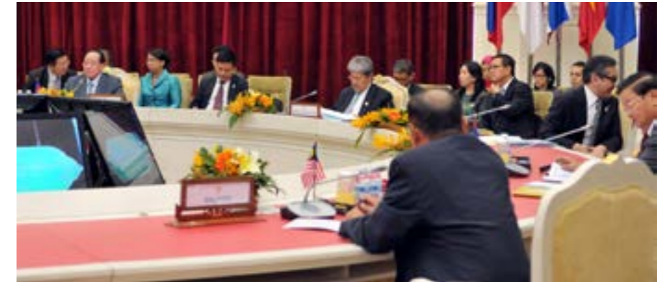
His Royal Highness during the meeting.