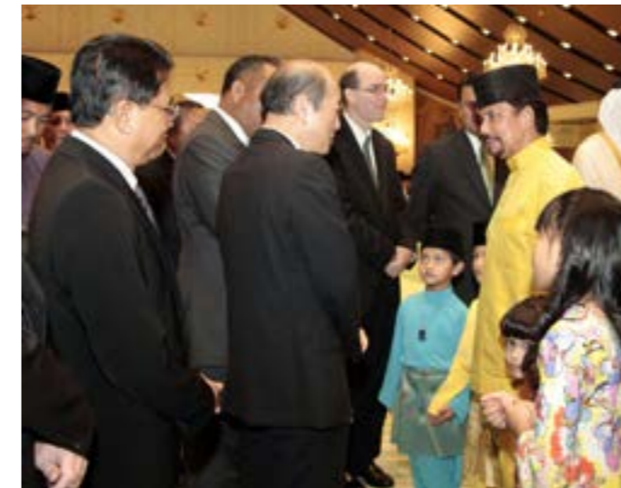
His Majesty mingles with Brunei-based foreign dignitaries.