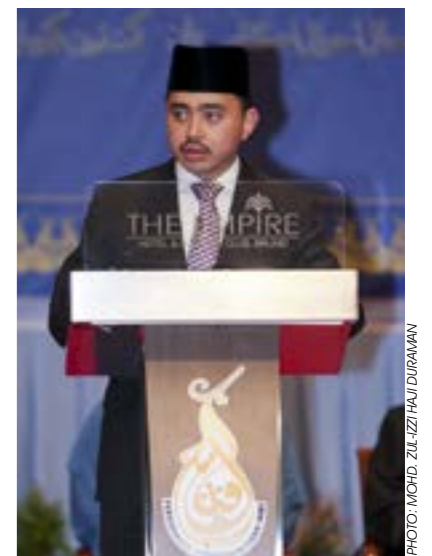
His Royal Highness delivers a sabda (royal speech) at the opening of National Conference on Jawi Spelling: Methodology and Coordination.

The presentation of the premier paper 'Issues on the usage of Jawi spelling and methods of developing it' was delivered by the Syarie Chief Judge, Pehin Dato Ustaz Haji Awang Yahya. Approximately 300 local participants comprising representatives from ministries and education institutions as well as members of the public attended the conference.