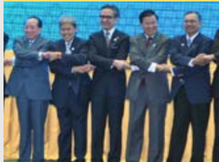
12 His Royal Highness attends ASEAN Foreign Ministers' Meeting