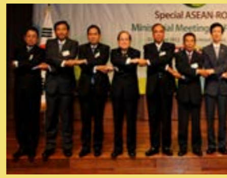
18 Brunei committed sustain its forest resources