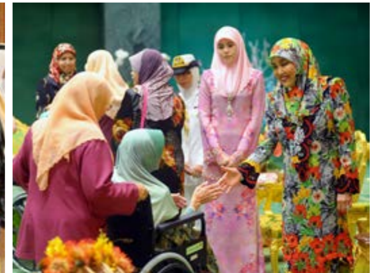
Her Majesty receives greeting from female citizen.

BANDAR SERI BEGAWAN, August 20 - In conjunction with Hari Raya Aidilfitri celebration, His Majesty The Sultan and Yang Di-Pertuan of Brunei Darussalam and Her Majesty The Raja Isteri received Hari Raya Aidilfitri greetings from state dignitaries, senior government officers and Brunei-based foreign dignitaries.