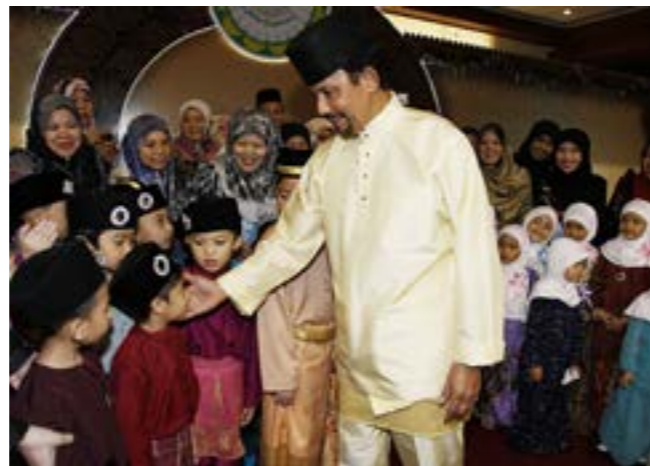
His Majesty mingles with students of Sultan Haji Hassanal Bolkiah Foundation School during the Hari Raya Aidilfitri celebration.

"In the 10 th National Development Plan 2012-2017, wherein through the Economic Strategy, we continuously make efforts to build a competitive economy which can create quality employment opportunities for citizens and residents in public and private sectors," said His Majesty.