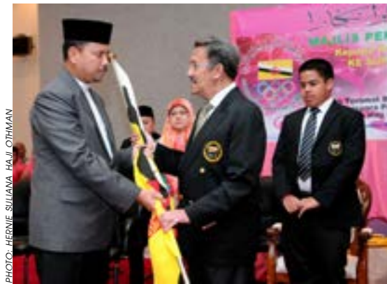
His Royal Highness handling our national flag to Brunei's chef-de-mission.

BANDAR SERI BEGAWAN, July 19 - Brunei Darussalam's participation in this year's Olympic Games marked a historical milestone as Brunei's contingent was represented by more than one athlete including one female athlete.