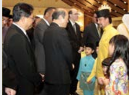
9 Royalty receives Hari Raya Aidilfitri greetings