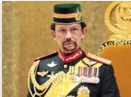
1 HM: Three initiatives enhance housing welfare