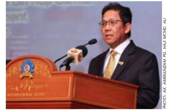
Minister of Development officially opened the congress.

The congress and general assembly are held biennially and are rotated amongst the member countries. A pre-congress meeting will be held between congresses in facilitating the preparation for the congress.