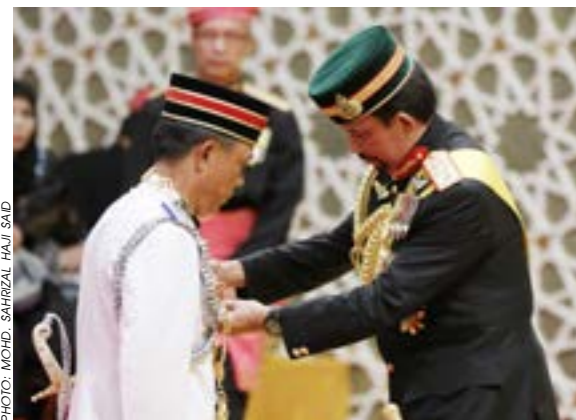
One of the awarded recipients of Brunei Darussalam's State Decorations and Honorary Medals from His Majesty The Sultan and Yang Di-Pertuan of Brunei Darussalam.

BANDAR SERI BEGAWAN, July 15 - In conjunction with the 66 th birthday anniversary of His Majesty The Sultan and Yang Di-Pertuan of Brunei Darussalam, 52 people were awarded with Brunei Darussalam's State Decorations and Honorary Medals at the Audience and Investiture ceremony.