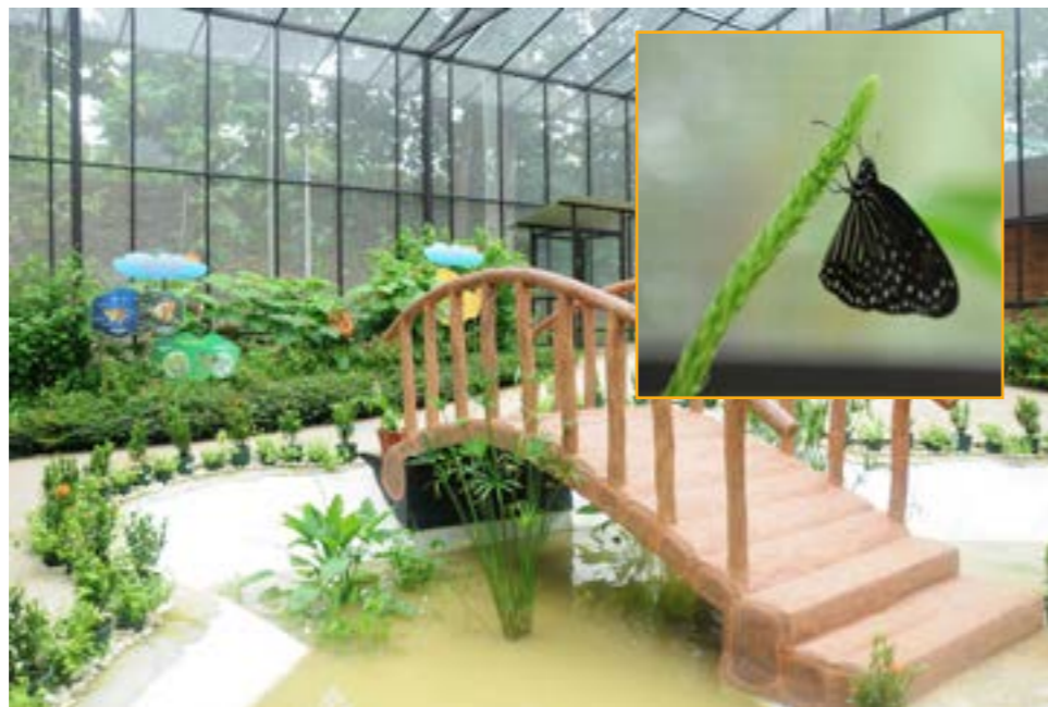
Inside view of the garden.

The garden is a project under the management of the Department of Brunei Museums through its Natural History and Tasek Merimbun Heritage Park Section. With the opening of the garden, a children's story book entitled Si Kelabang was launched.