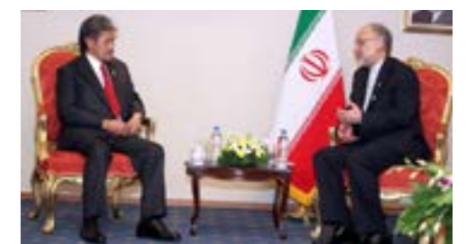
His Royal Highness with Iran's Minister of Foreign Affairs.