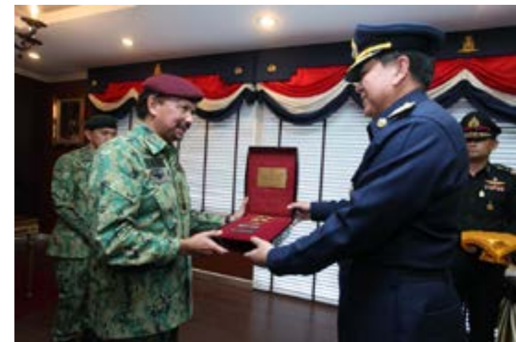
His Majesty bestowed with Honorary Wing-Counter Terrorism from Supreme Commander of the Royal Thai Army.

His Majesty was in Bangkok for an official visit.