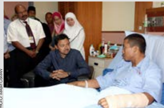
His Royal Highness Prince Haji Al-Muhtadee Billah, The Crown Prince and Senior Minister at the Prime Minister's Office visiting the survivor at the RIPAS Hospital.