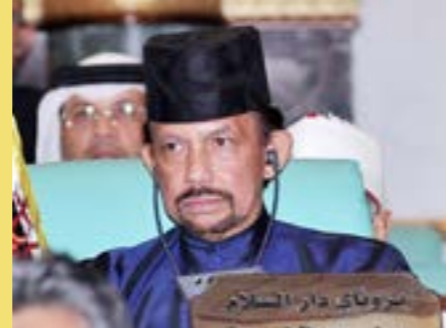
11 HM: Brunei committed help unite ummah for OIC's future