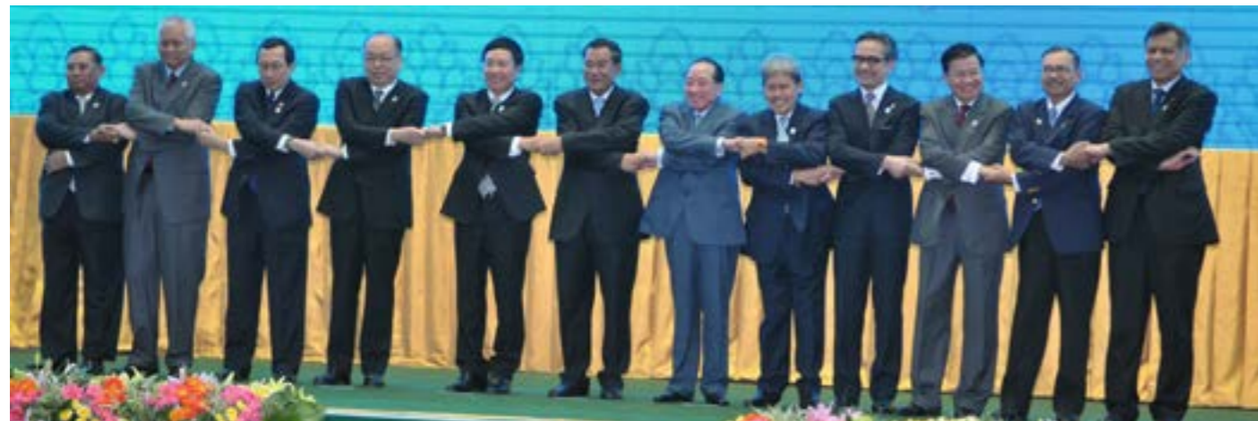
Group photo session with heads and leaders of delegation from ASEAN countries for the 45 th ASEAN Foreign Minister's Meeting (AMM).