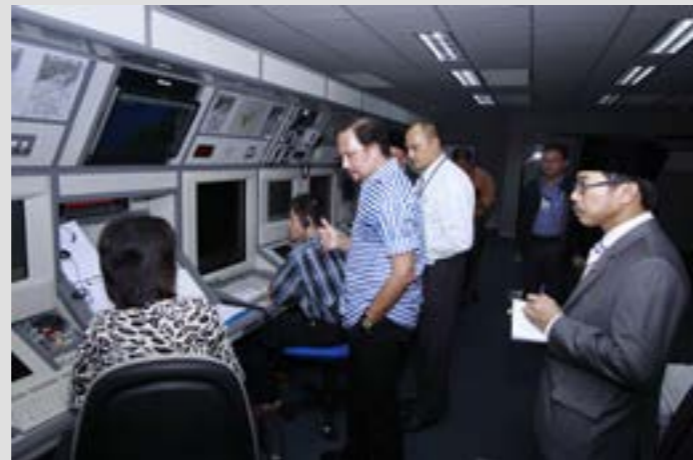
His Majesty at the Air Traffic Control Tower at Brunei International Airport.

On July 28, His Royal Highness Prince Haji Al-Muhtadee Billah, The Crown Prince and Senior Minister at the Prime Minister's Office also visited the two personnel.