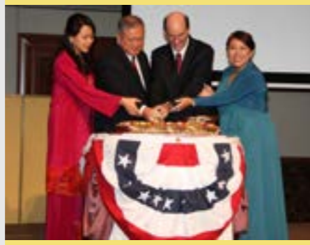
17 Minister attends reception