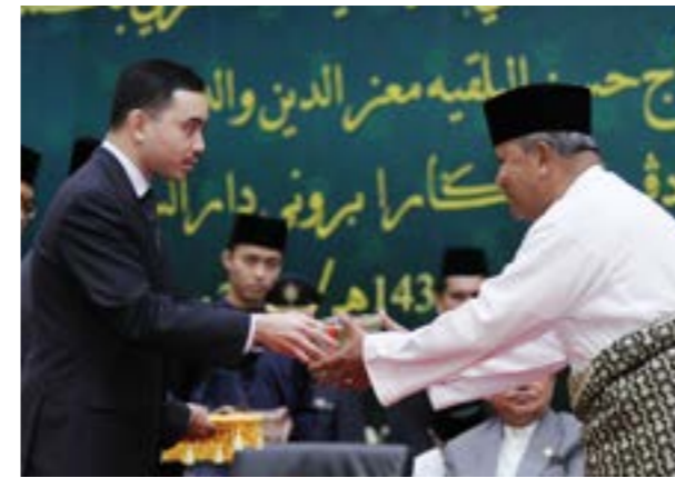
One of the representatives of mukim receives dates from His Royal Highness.

TUNGKU LINK, July 3 - As personal gift of His Majesty The Sultan and Yang Di-Pertuan of Brunei Darussalam to Muslims in this nation-state, a total of 148 metric tonnes of 'Safawi' dates supplied by Al-Madinah Dates Company, Saudi Arabia will be distributed. The amount has increased by five metric tonnes, compared to last year due to the increasing number of Muslims residing in this country. Every Muslim living in this country regardless of age or nationality will each receive 300 grams of dates.