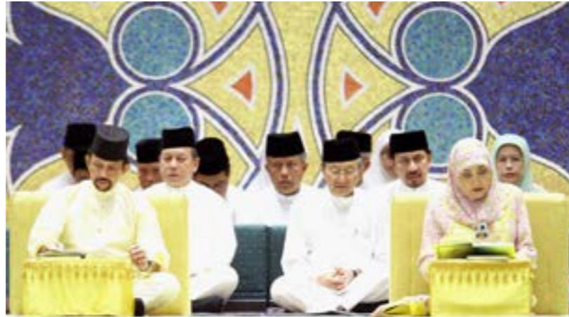
Their Majesties during the 66-time Khatam Al-Qur'an ceremony by Mukim and Village Consultative Councils in conjunction with His Majesty The Sultan and Yang Di-Pertuan of Brunei Darussalam's 66 th birthday.

The mass reading of Al-Qur'an Khatam ceremony started with the recital of Surah Adh Dhuhaa up to Surah An-Naas .