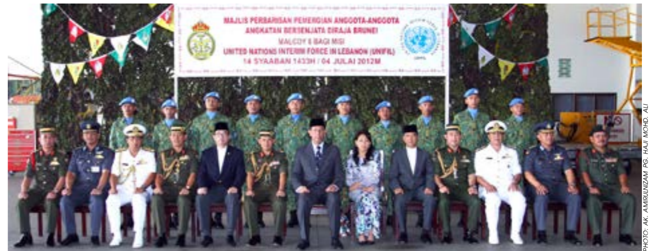
Group photo session of the pre-departure ceremony.

RIMBA, July 4 - Ten personnel of the Royal Brunei Armed Forces (RBAF) joined troops from Malaysia under the command of Malaysian Company 8 (MALCOY 8) to take part in the peacekeeping mission with the United Nations Interim Force in Lebanon (UNIFIL).