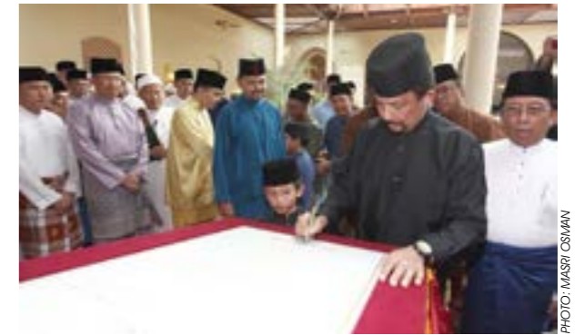
His Majesty signs the plaque in commemorating the opening of Ash-Shaliheen Mosque at the Prime Minister's Office.

The construction of these mosques is under the 2007-2012 National Development Plan.