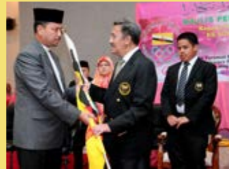
14 Olympic Games 2012: Historical milestone for Brunei