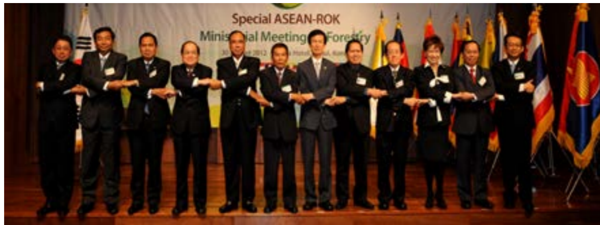
Group photo of representatives from ASEAN member states and Republic of Korea.