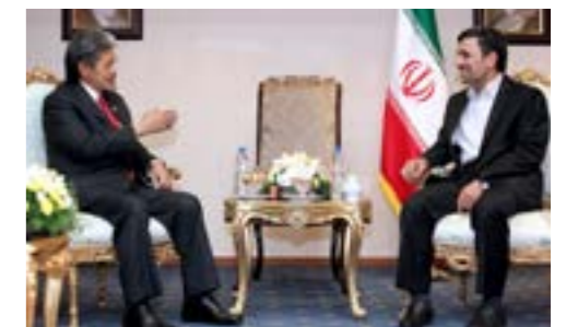
His Royal Highness with His Excellency President of Iran.

Before the conclusion of the 16 th NAM Summit, a bilateral meeting was held between Brunei Darussalam and the Islamic Republic of Iran to discuss bilateral relationship and mutual cooperation. His Royal Highness held the meeting with the President of Iran, His Excellency Dr. Mahmoud Ahmadinejad; Iran's Minister of Foreign Affairs, His Excellency Dr. Ali Ahbar and the Minister of Petroleum, His Excellency Rostam Ghasemi.