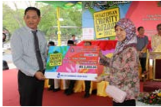
Her Royal Highness receives a mock check from one of the donors at the Pusat Ehsan Charity Bazaar 2012.

BANDAR SERI BEGAWAN, August 31 - Pusat Ehsan Al-Ameerah Al-Hajjah Maryam is hosting a three-day Charity Bazaar with the aim to raise fund starting from August 31 to September 2.