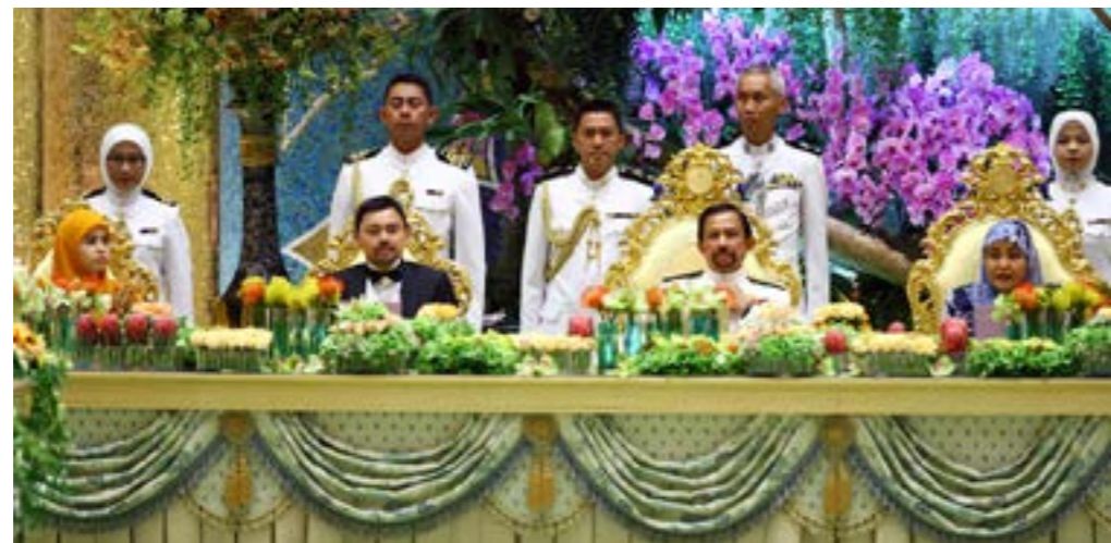
Their Majesties and members of the royal family at the state banquet.