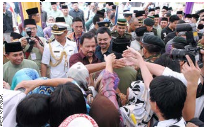
Citizens and residents in Belait District greeting His Majesty and members of the royal family at the get-together ceremony.

BELAIT, July 16 - As part of the activities to celebrate the 66 th royal birthday of His Majesty The Sultan and Yang Di-Pertuan of Brunei Darussalam, a get-together ceremony was held in all four districts.