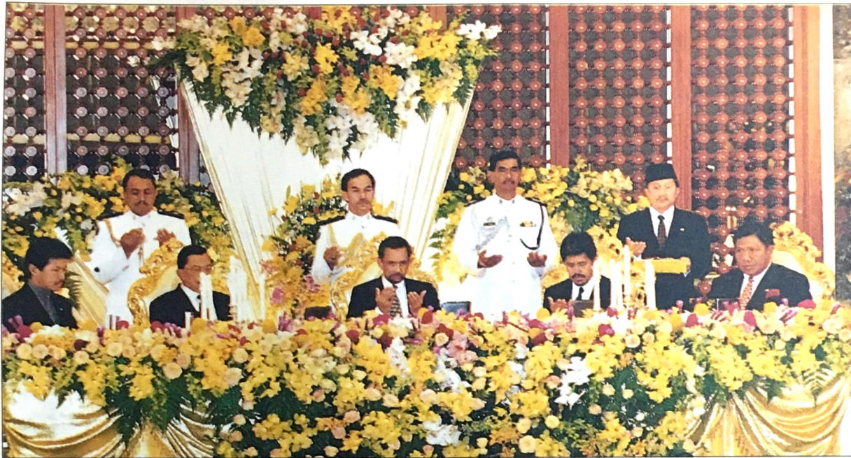
Hands are raised as the do'a is read for blessings during a dinner at Istana Nurul Iman hosted by His Majesty The Sultan and Yang Di-Pertuan of Brunei Darussalam in honour of the visiting Prime Minister of Thailand, His Excellency General Chavalit Youngchaiyudh, picture at left.