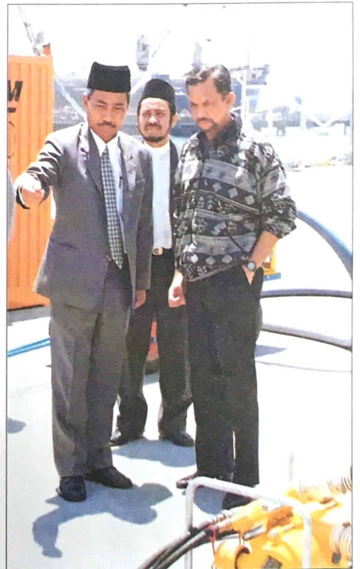
His Majesty pauses to ask questions and getting more briefing as he toured the Muara port and the Marine Department, both also under The Ministry of Communications.

• from page 4 (Sultan visits communications Ministry and departments under its charge)