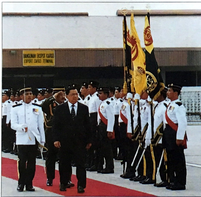
Accompanied on the dais by Brunei Darussalam's Foreign Affairs Minister, His Royal Highness Prince Mohamed Bolkiah who welcomed him at the Brunei International airport on behalf of His Majesty The Sultan and Yang Di-Pertuan of Brunei Darussalam, the Thai Prime Minister takes the salute during a guard of honour mounted by men of the Royal Brunei Armed Forces, which he also inspected, picture at left and right.