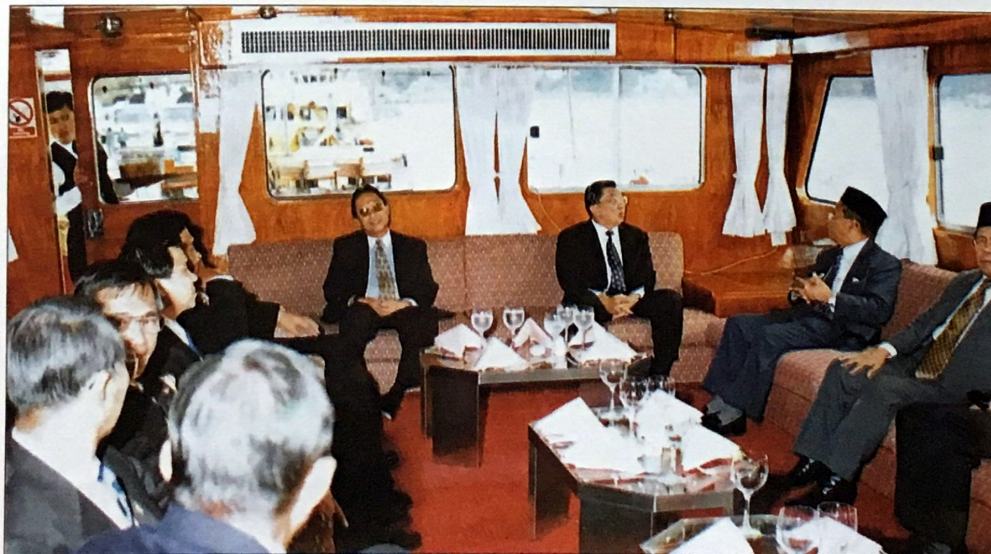
The Thai Prime Minister, accompanied by Brunei officials, took time off from serious discussions to take a cruise around the scenic Kampong Ayer (settlement on water made up of chains of villages) on the Brunei river, left. Right: His Royal Highness Prince Mohamed Bolkiah, Minister of Foreign Affairs discussing various issues with his Thai counterpart, His Excellency Prachuab Chaيسان, who was in the Thai Prime Minister's delegation, as was the Thai Labour Minister, His Excellency Chatchai Earsakul, seen in picture at far right having a separate meeting with the Special Adviser to His Majesty in the Prime Minister's Office cum Home Affairs Minister, Yang Berhormat Pehin Orang Kaya Laila Setia Bakti Diraja Dato Laila Utama Haji Awang Isa.