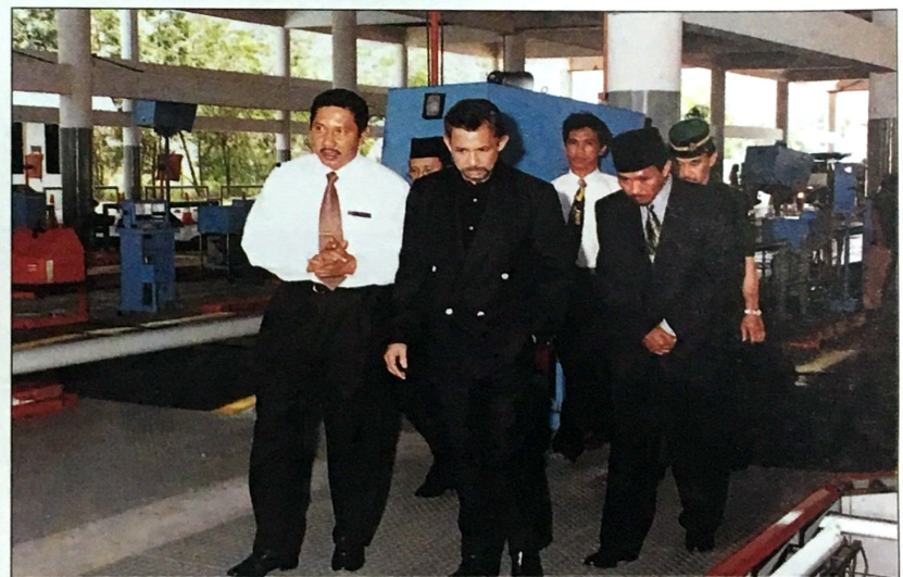
• from page 3 (Sultan visits Communications Ministry and departments under its charge)

The minister pointed that the departments concerned will formulate action programmes to meet these objectives when the policy has been agreed.