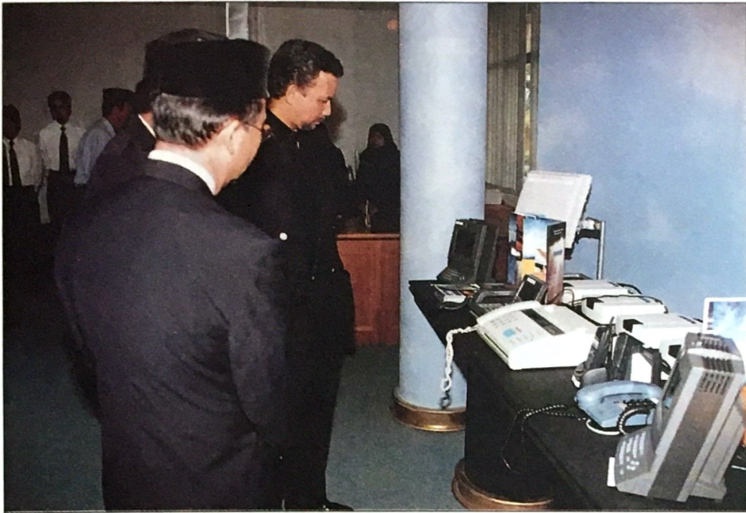
His Majesty during his visits to the Departments of Telecommunications, left, Postal Services, left below, Civil Aviation, below, and Land Transports, bottom. All these departments come under the charge of the Ministry of Communications.