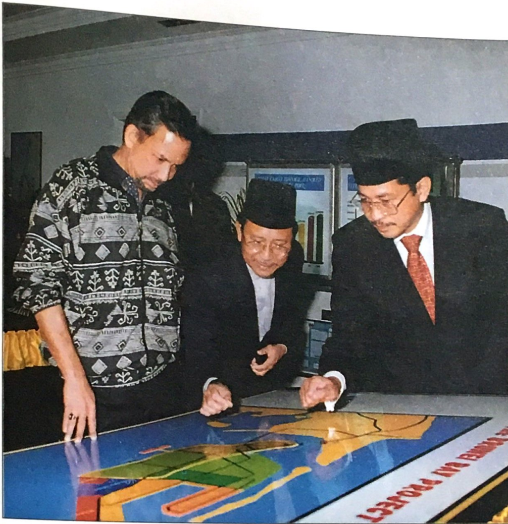
The Minister of Communications briefing His Majesty on a proposed project on Pulau Muara Besar, during his tour of the Marine Department (left).