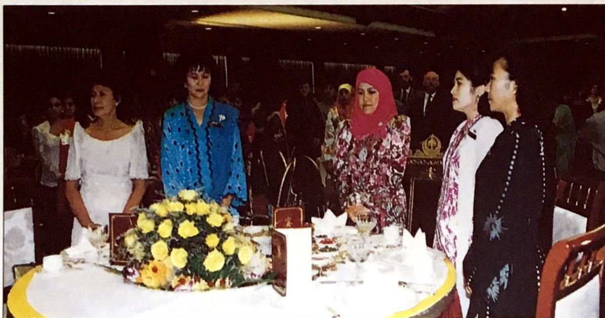
Her Royal Highness Princess Hajjah Masna also spoke of the ever-increasingly challenging responsibilities of secretaries at a dinner for the delegates of ASA.

The five-day congress, with its theme 'Unity Towards Professional Development' covered among others, topics on Emotional Intelligence - Pioneering Frontiers in Personal and Professional Development; Networking - The Art of Working Smarter and Management Proficiency For Professional Secretaries.