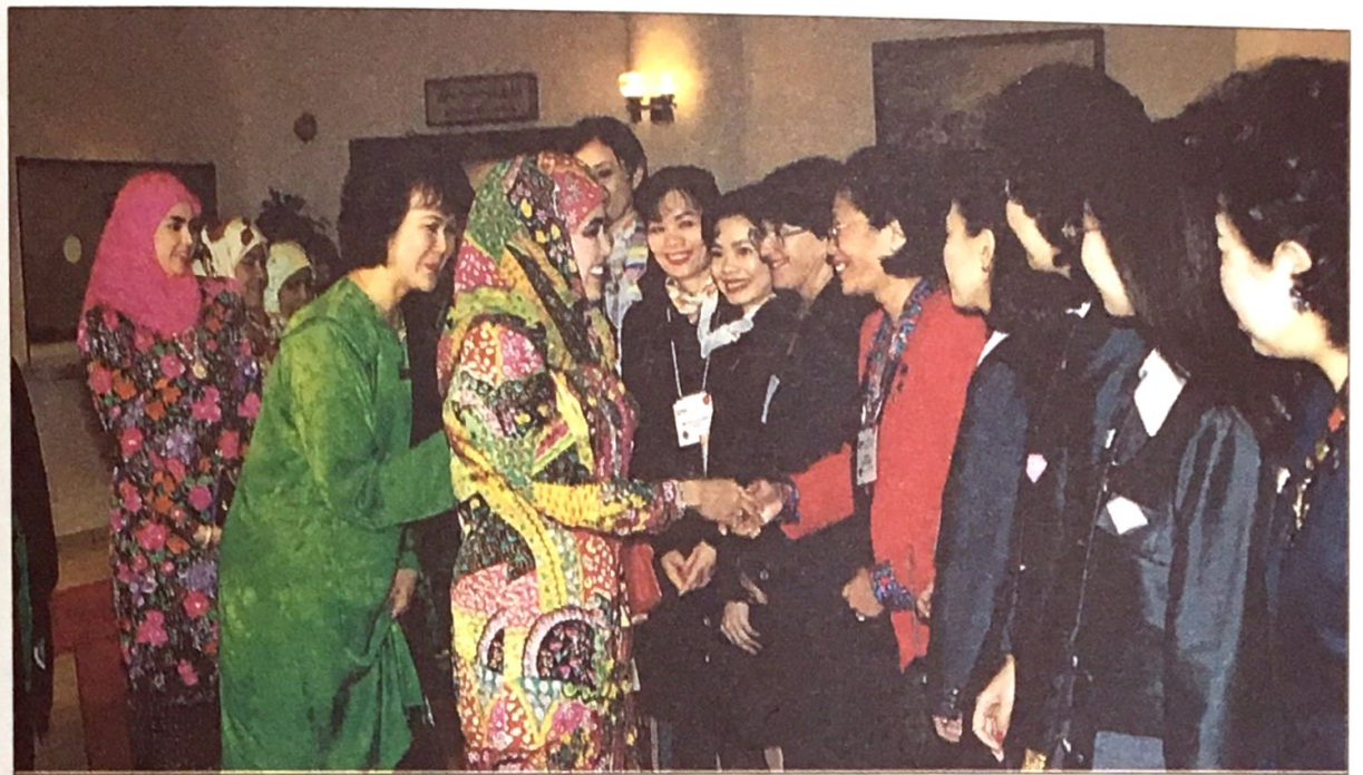
Her Majesty Paduka Seri Baginda Raja Isteri Pengiran Anak Hajjah Saleha opened the 12th Congress of the Association of Secretaries in Asia (ASA) with a call for secretaries to continually up-date training and skills so as to keep abreast of today's rapid development and changes. Picture shows Her Majesty meeting ASA delegates.

H er Majesty Paduka Seri Baginda Raja Isteri Pengiran Anak Hajjah Saleha has said that secretaries need to equip themselves with the necessary training and skills that will enable them to handle the demand and challenges of their job, as well as to face the ever-changing work environment.