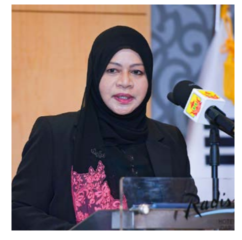
Acting Chief Executive Officer of the Institute of Brunei Technical Education as the Director of Technical Education presenting her speech.

The mobility programme is a growing trend in Asia and the rest of the world, owing to its numerous benefits and