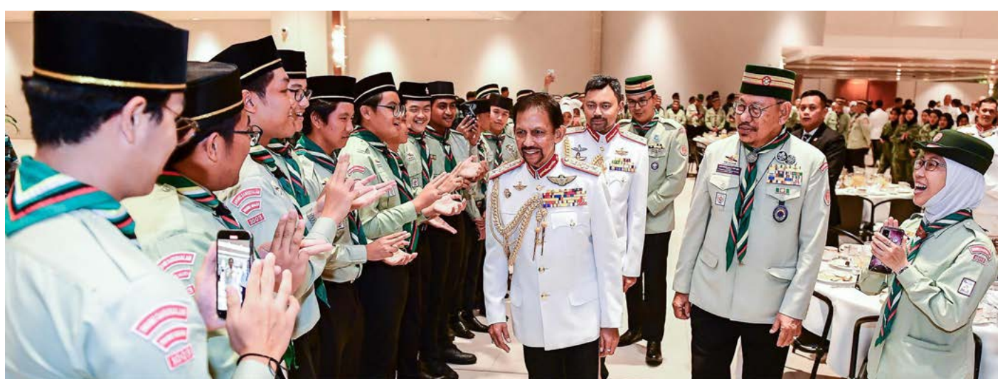
His Majesty mingling with members of the Scouts Association of Brunei Darussalam.

The banquet was also attended by Pengiran-pengiran Cheteria; Cabinet Ministers: Members of the Privy Council; Deputy Ministers; Pengiranpengiran Peranakan; Pehin-pehin Manteri; Manteri-manteri Hulubalang; High Commissioners; Ambassadors; Permanent Secretaries; Deputy Permanent Secretaries; and Heads of Government Departments.