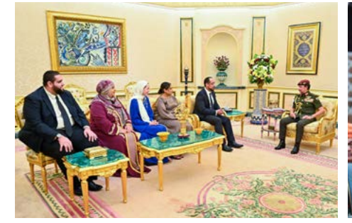
His Majesty receives audiences 3.