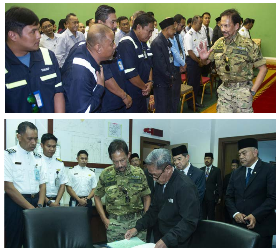
His Majesty visiting the administration office.

His Majesty also warned against cronyism and nepotism in administration and management, be it in HMSF or any other organisation.