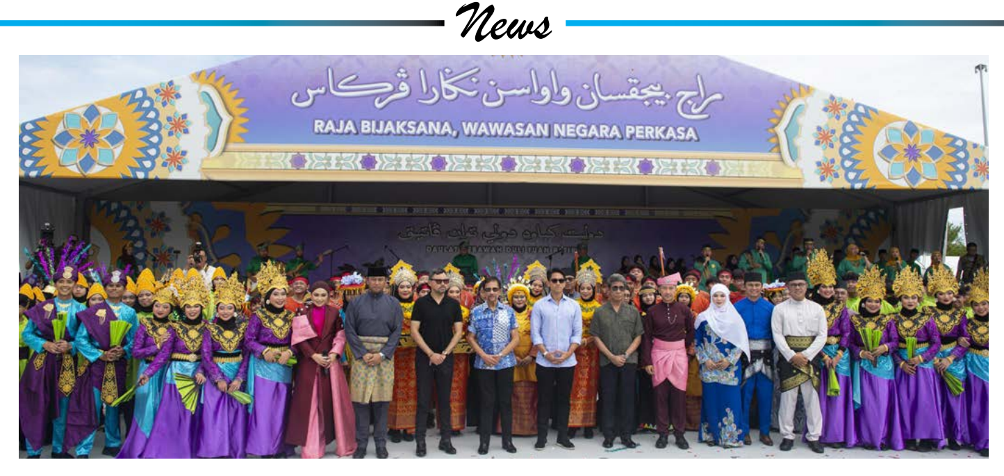
His Majesty and members of the royal family in a group photo with the performers.

Prior to event, on July 22, Belait District became the first district to welcome His Majesty in the series of Get-Together Ceremonies conducted in each four districts.