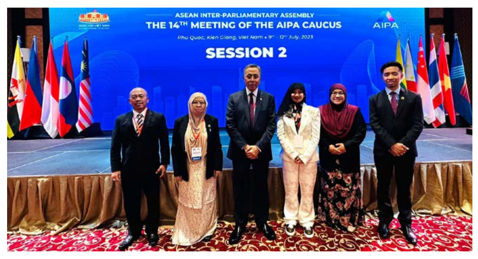
Members of the State Legislative Council at the meeting.

During the meeting, LegCo members reported on the status of the resolutions voted at the AIPA General Assembly last year, covering advances and initiatives in the areas of politics, economy, social, as well as women's