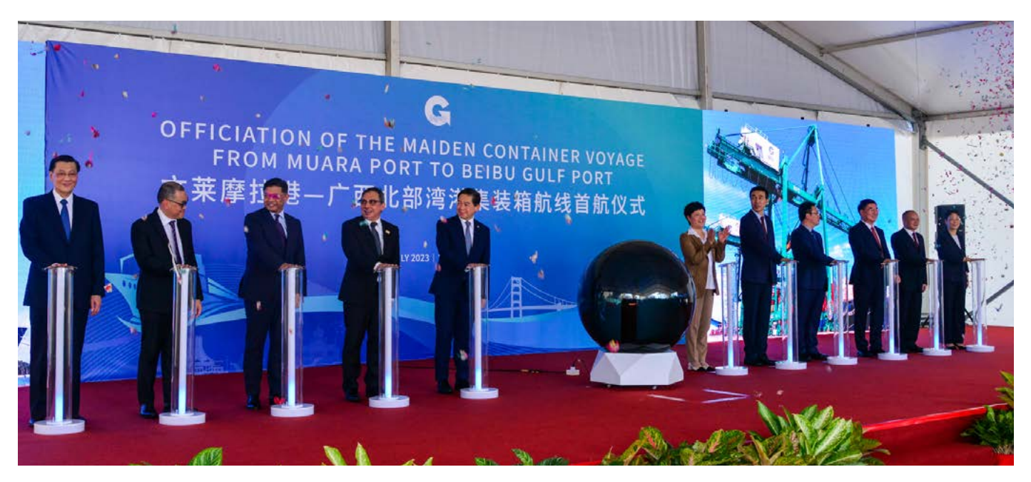
Yang Berhornat Minister at PMO and Second Minister of Finance and Economy as Chairman of Muara Port Sdn. Bhd.; Yang Berhormat Minister of Development; Yang Berhormat Minister of Transport and Infocommunications; Yang Mulia Deputy Minister of Finance and Economics; and Her Excellency Executive Vice-Governor of the Guangxi Zhuang Autonomous Region during the Inauguration of the First Maiden Vessel Call from Brunei Darussalam's Muara Port, Brunei Darussalam to the Republic of China's Beibu Bay Port.

The port, which facilitates interrelationships, will also present exciting opportunities for commerce and investment that will benefit both countries and boost regional economic development by connecting BIMP-EAGA to China via the Muara Port.