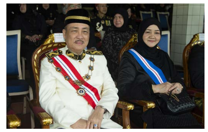
Also present were His Majesty's special guests (above and below left).