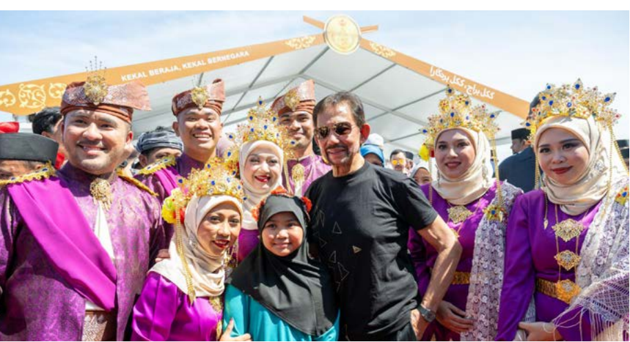
His Majesty in a group photo with the performers of the Tutong District.

His Majesty then proceeded to the Main Hall of the Community Hall Complex in Pekan Bangar for a Luncheon.