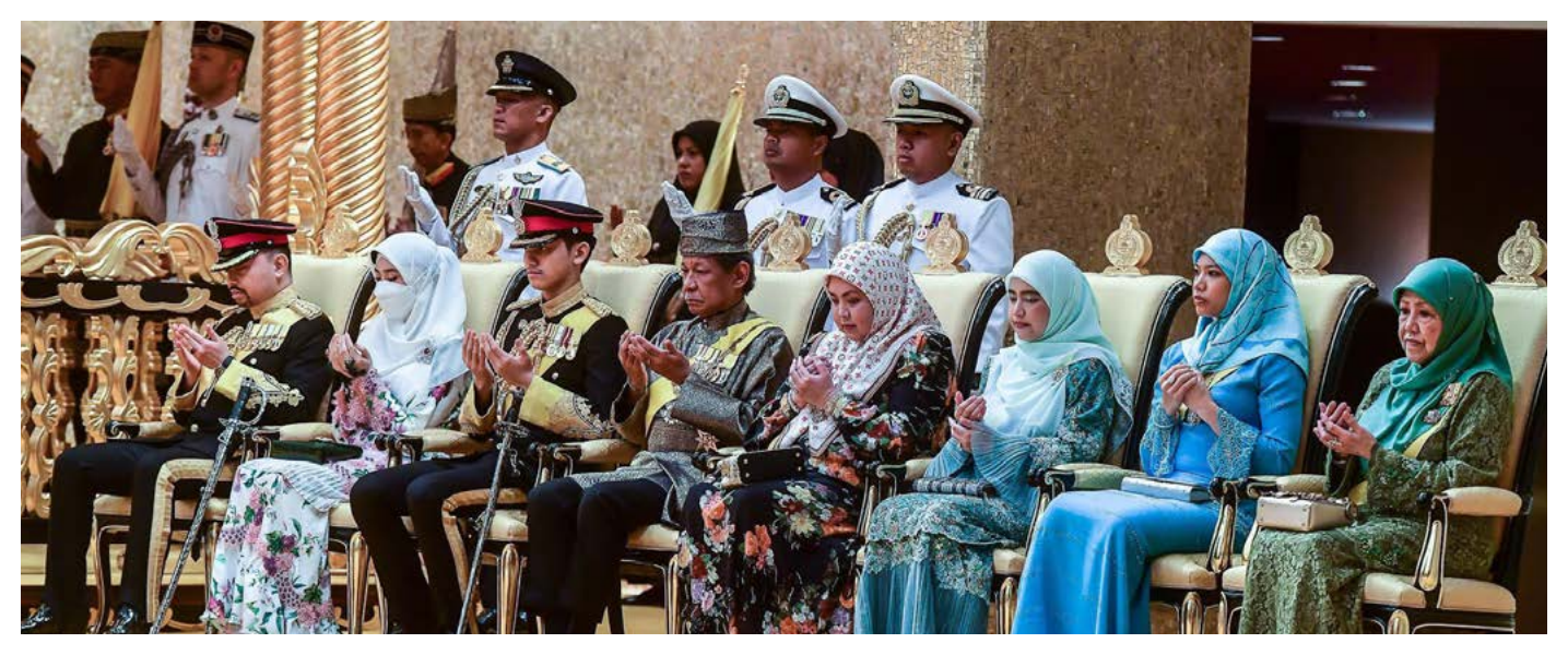
Also present at the ceremony were members of the royal family.