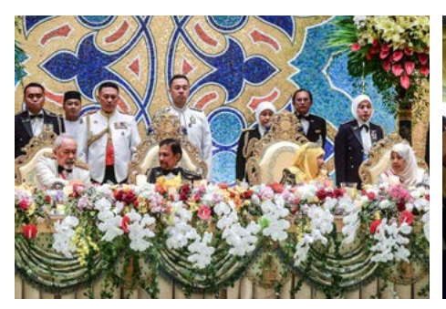
10. Royal Banquet in conjunction 13. Get-Together and Junjung Ziarah with His Majesty's 77th Birthday Celebration