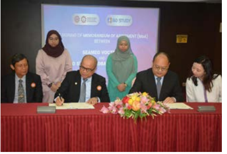
VOCTECH receives boost in capacity building

technological latest developments in healthcare