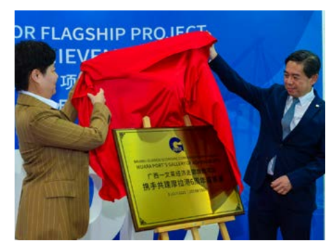
Yang Berhormat Minister at the Prime Minister's Office (PMO) and Second Minister of Finance and Economy; and Her Excellency Executive Vice-Governor of the Guangxi Zhuang Autonomous Region launching the Muara Port Gallery of Achievements at Cruise Ship Centre.

Following the inauguration, Yang Berhormat Minister at PMO and Second Minister of Finance and Economics; and Her Excellency Cai Lixin launched the Muara Port Gallery of Achievements located at the Cruise Ship Centre.