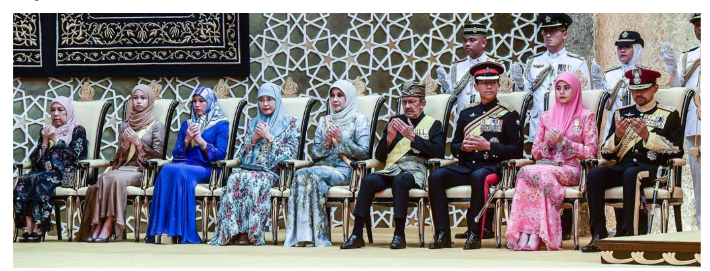
Also present at the Ceremony were members of the royal family.