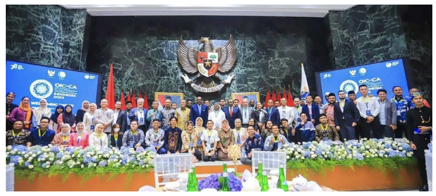
A group photo of the Religious Teachers University College of Seri Begawan (KUPU SB) at the Organisation of Islam Cooperation-Cultural Activities (OIC-CA) 2023 in Balikpapan, East Kalimantan, the Republic of Indonesia.

THE REPUBLIC OF INDONESIA, July 10 – The Religious Teachers University College of Seri Begawan (KUPU SB) is joining the Organisation of Islam Cooperation-Cultural Activities (OIC-CA) 2023, held in Jakarta, Samarinda and Balikpapan, East Kalimantan, the Republic of Indonesia from July 7 to 14.