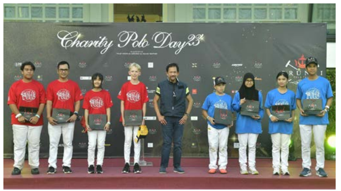
His Majesty in a group photo with the participants of the Royal Brunei Polo Junior Academy Challenge.