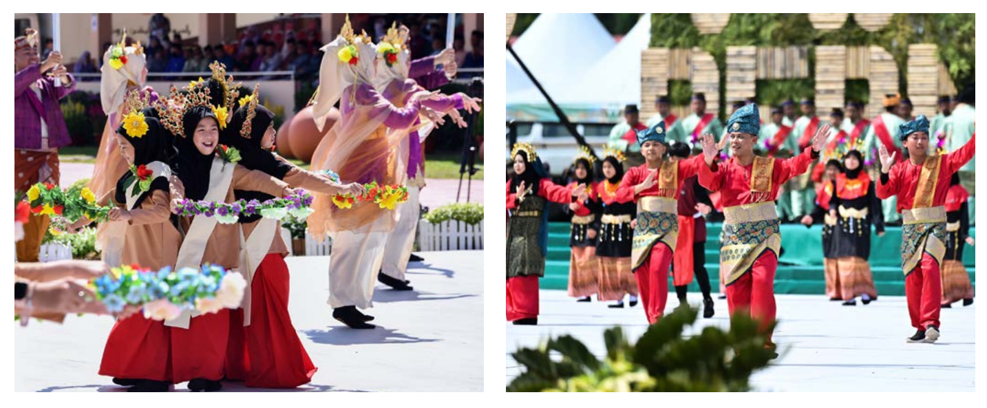
Snapshots of performances during the Get-Together and Junjung Ziarah Ceremonies.

His Majesty viewing the longest Tikar Mengkuang ever weaved in the country. Four Temburong youths weaved the 77-foot and 1-inch long mat for two months, which was recorded in The Book of Brunei Records as one of the longest mats in the country.