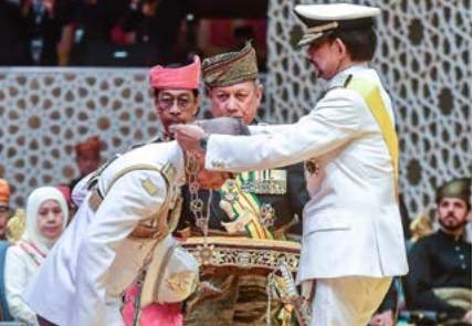
6. Investiture and Grand Parade Ceremony