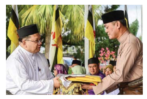
30 Hoisting of giant-sized national 35 SEAMEO flag marks start of His Majesty's Birthday Celebration

22. No nepotism and cronyism in 26. Share administration and management