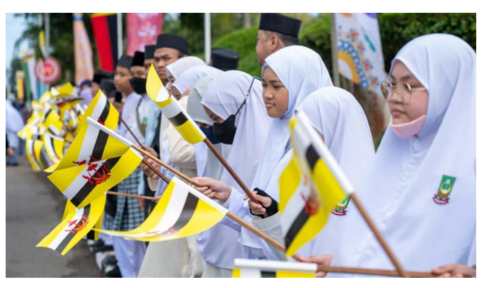
Students waving the miniature Brunei flags welcoming His Majesty and the other members of the royal family to the Get-Together Ceremony in the Belait District.

The Tutong District was the second to welcome His Majesty in a Get-Together Ceremony on July 25.