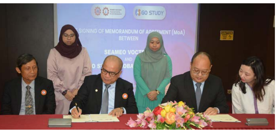
The Memorandum of Agreement Signing Ceremony between SEAMEO VOCTECH and Go Study Education at Seri Kerna Hall (above and below).

The Memorandum of Agreement calls for collaboration in skill training and professional development programs, as well as the sharing of experiences and support with teaching resources, capacity building, and other relevant initiatives.