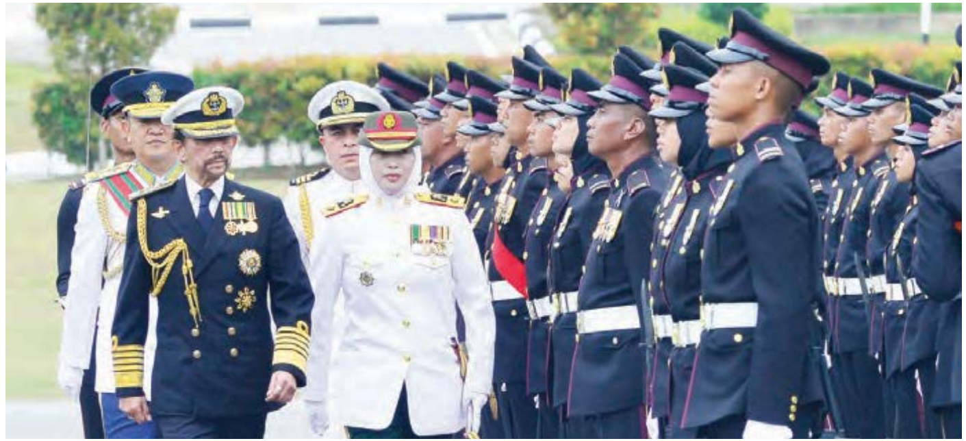
His Majesty inspecting the Guard of Honour under the cor