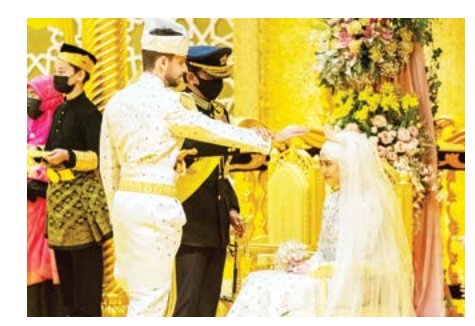
20. Tradition-filled Royal Wedding