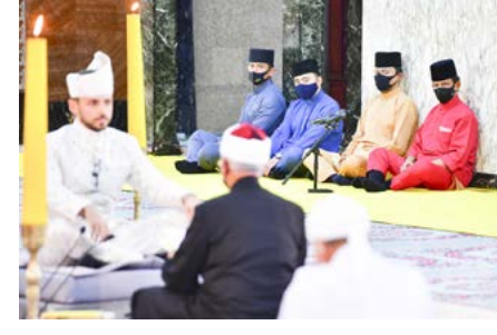
19. Royal Solemnisation Ceremony