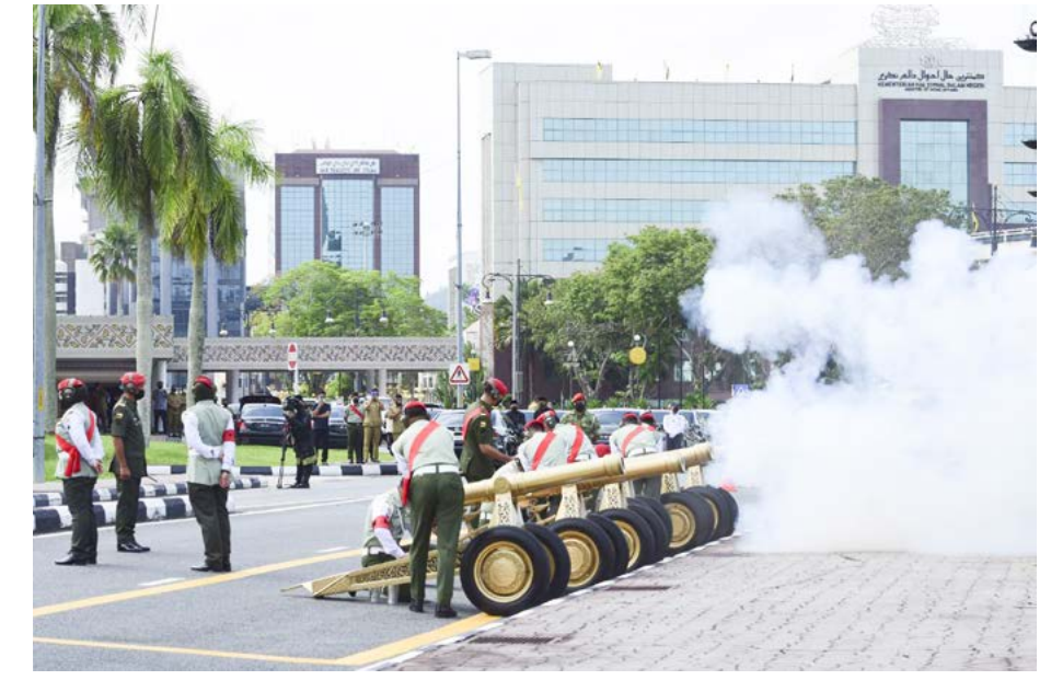
Twenty-one shots of the cannon alongside the beating of Nakara were followed by the sound of Gendang Labik, Serunai , as well as the Gong and Chanang .

Also present at the ceremony were Yang Amat Mulia Pengiran-Pengiran Cheteria, cabinet ministers, members of councils, deputy ministers, Pengiran-Pengiran Peranakan, Pehin-Pehin Manteri, Manteri-Manteri Hulubalang, Manteri-Manteri Pedalaman, heads of Diplomatic Missions, members of the Legislative Council, permanent secretaries, and heads of government departments.