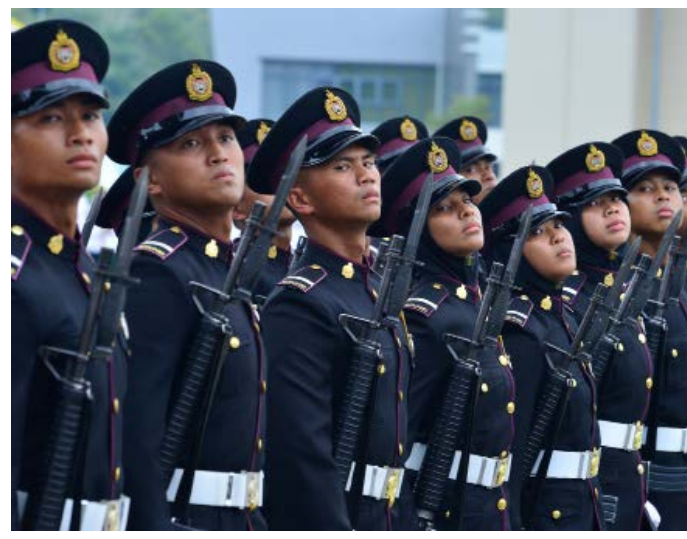
Some of the Officer Cadets of the 20th intake.