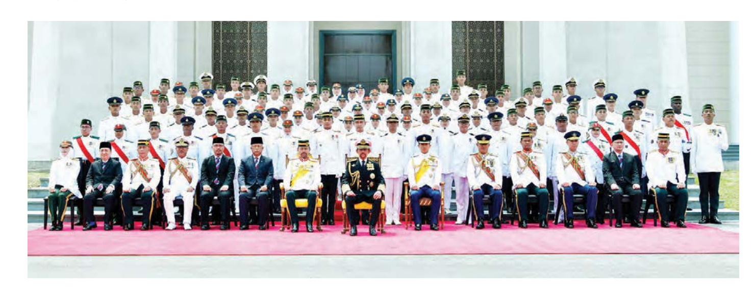
His Majesty and Their Royal Highnesses in a group photo with 20th Intake of Officer Cadets.