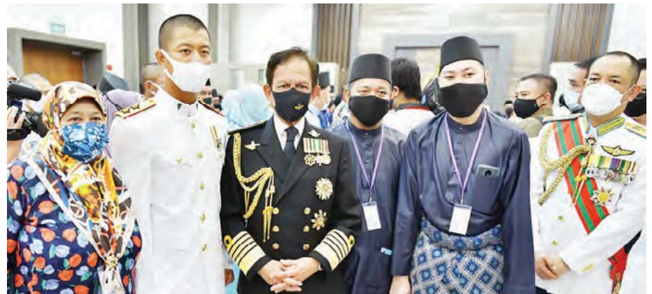
His Majesty in a group photo with officer cadets at the Sovereign's Parade for the 20<sup>th</sup> Intake of Officer Cadets.