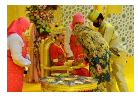
15. Istiadat Berbedak Pengantin