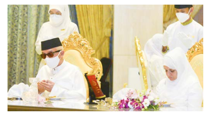
Parents of the royal bridegroom at the Royal Banquet.