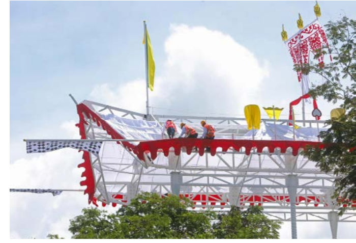
Seventeen cannon shots resound and at the same time, the Royal Regalia are taken down one by one.