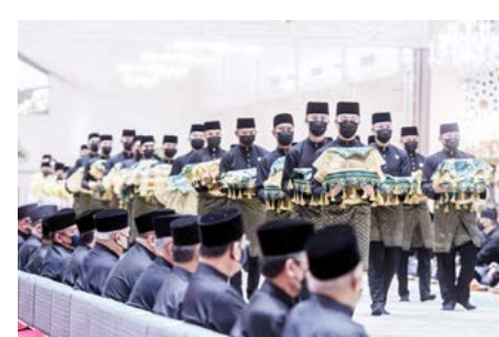
13. Istiadat Menghantar Tanda Diraja dan Pertunangan Diraja