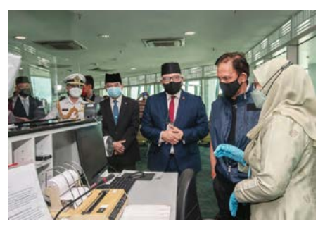
Unscheduled visit to Brunei 4. International Airport