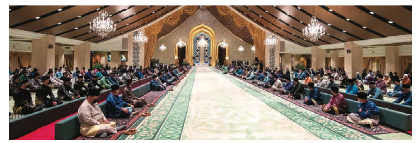
The Istiadat Bersuruh Diraja Ceremony, which took place at the Balai Persantapan, Istana Nurul Iman.