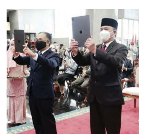
Yang Berhormat Minister of Primary Resources and Tourism and Yang Berhormat Minister of Culture, Youth and Sports in a group photo (left) and launching the izi.Travel application, held at the Royal Regalia Museum in the capital (right).

Bureau; Department of Adat Istiadat Negara; Radio Television Brunei; and the Department of Information.