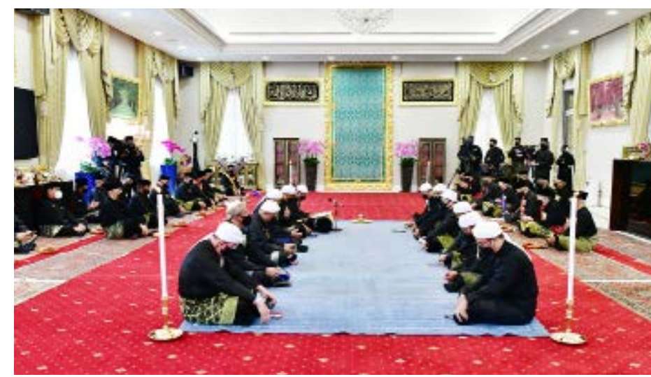
The Majlis Istiadat commencing with the Zikir Syarafil Anam presented by Pehin-Pehin Khatib, Begawan-Begawan Pehin Khatib and Mudim-Mudim.

Yang Dimuliakan Pehin Orang Kaya Lela Pahlawan then informed Yang Amat Mulia Pengiran Maharaja Setia Laila Diraja Sahibul Irshad that the ceremony has been completed.