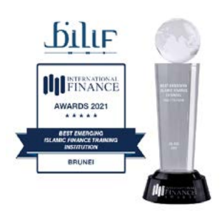
Finance Award 2021