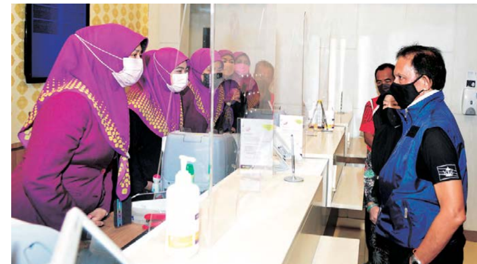
His Majesty visiting the counters of Bank Islam Brunei Darussalam (BIBD) during the unscheduled visit.

Prior to leaving the RBTS headquarters, His Majesty also visited the customer services counters of Bank Islam Brunei Darussalam (BIBD).