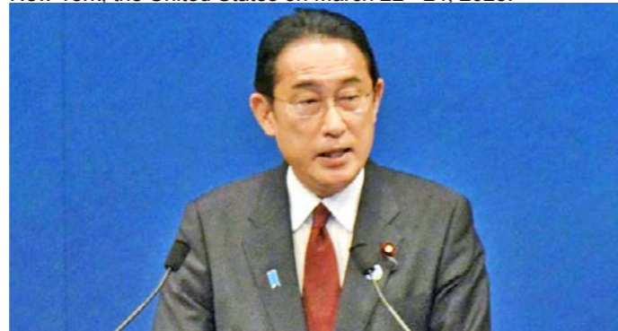
His Excellency Prime Minister of Japan delivering his speech.

He also reiterated and called on Member States and partners to participate in the 2 nd International High-Level Conference on the International Decade for Action – "Water for Sustainable Development" to be held in Dushanbe, Tajikistan on June 6 - 9 and the 2023 UN Water Conference in New York, the United States on March 22 - 24, 2023.