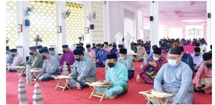
The Ministry of Development and its departments on April 7. Leading the delegation was Yang Berhormat Dato Seri Setia Ir. Awang Haji Suhaimi bin Haji Gafar, Minister of Development.