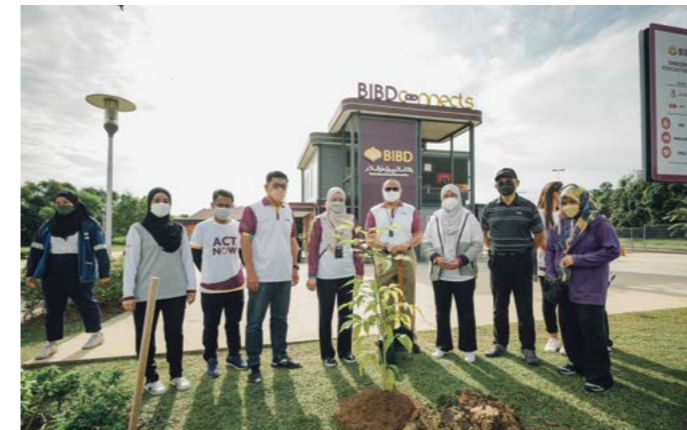
Yang Mulia Deputy Minister of Development; Yang Berhormat Member of Legislative Council; and Acting Managing Director and Chief Executive Officer of BIBD at BIBD Connects Lambak.

BANDAR SERI BEGAWAN, April 1 - Bank Islam Brunei Darussalam (BIBD) started a nationwide tree planting initiative in conjunction with the International Day of Forests.