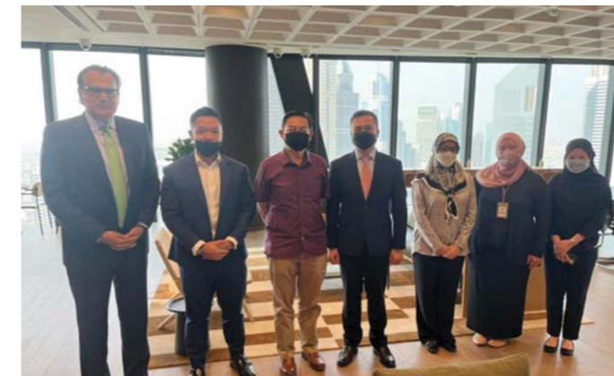
Yang Berhormat Minister at the Prime Minister's Office (PMO) and Second Minister of Finance and Economy at the BIBD ME Office located at the Dubai International Financial Center.

BANDAR SERI BEGAWAN, April 1 - His Majesty Sultan Haji Hassanal Bolkiah Mu'izzaddin Waddaulah ibni Al-Marhum Sultan Haji Omar 'Ali Saifuddin Sa'adul Khairi Waddien, Sultan and Yang Di-Pertuan of Brunei Darussalam had a warm welcome with the Bank Islam Brunei Darussalam team (BIBD) Middle-East (ME) Limited at Expo 2020 Dubai, recently.