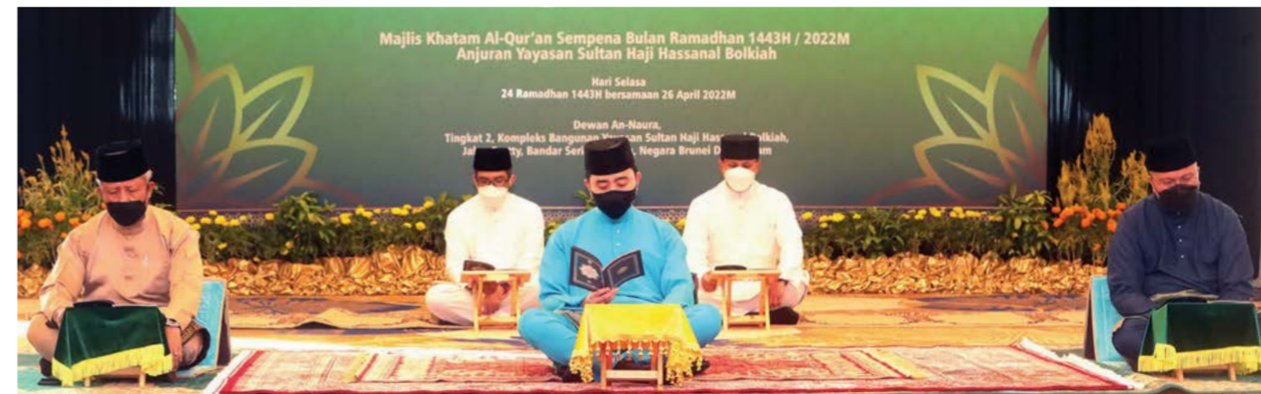
His Royal Highness Prince 'Abdul Malik ibni His Majesty Sultan Haji Hassanal Bolkiah Mu'izzaddin Waddaulah, Chairman of the Yayasan Sultan Haji Hassanal Bolkiah Committee of Governors at the Khatam Al-Quran Ceremony.

BANDAR SERI BEGAWAN, April 26 - His Royal Highness Prince 'Abdul Malik ibni His Majesty Sultan Haji Hassanal Bolkiah Mu'izzaddin Waddaulah, Chairman of the Yayasan Sultan Haji Hassanal Bolkiah (YSHHB) Committee of Governors graced the YSHHB Khatam Al-Quran Ceremony which took place at Dewan An-Naura, Level 2, YSHHB Complex.