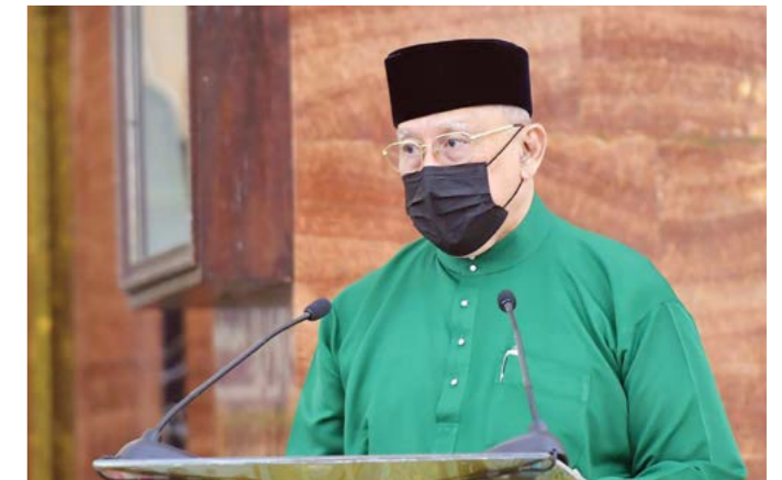
Yang Berhormat Minister at Prime Minister's Office as the Co-Chairman of the Committee of the nationwide Selawat Tafrijiyyah Year 1443 Hijrah delivering his welcoming speech.

Similar gatherings were also held simultaneously at Hassanal Bolkiah Mosque in National Housing Scheme Kampung Mentiri, Muhammad Jamalul Alam Mosque in Belait District, Hassanal Bolkiah Mosque in Tutong District, and Utama Mohammad Salleh Mosque in Temburong District.