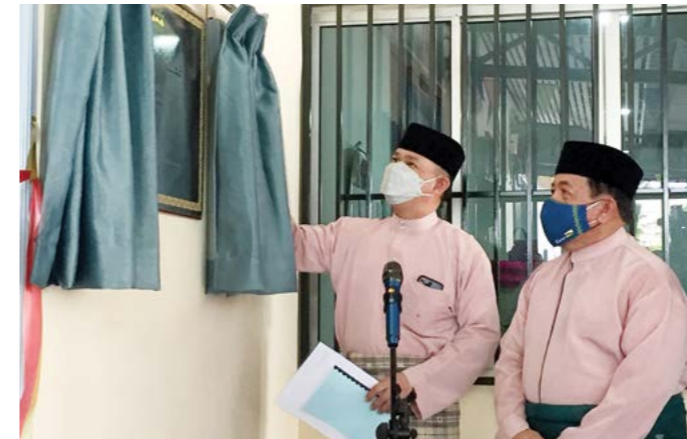
The Minister officiating the new headquarters.