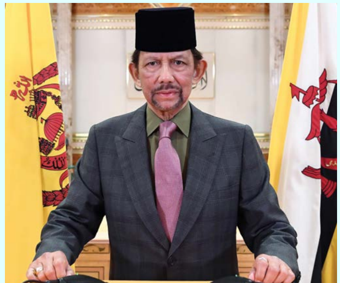
His Majesty Sultan Haji Hassanal Bolkiah Mu'izzaddin Waddaulah ibni Al-Marhum Sultan Haji Omar 'Ali Saifuddien Sa'adul Khairi Waddien, Sultan and Yang Di-Pertuan of Brunei Darussalam delivering a titah (royal speech) welcoming the Ramadan for 1443 Hijrah/2022 Masihi at Istana Nurul Iman.

We are now destined to face two equally challenging situations, the demand to fast and the demand to deal with COVID-19.