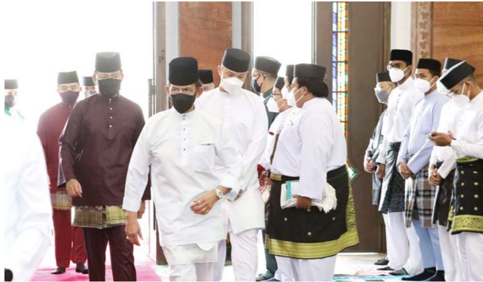
His Majesty Sultan Haji Hassanal Bolkiah Mu'izzaddin Waddaulah ibni Al-Marhum Sultan Haji Omar 'Ali Saifuddien Sa'adul Khairi Waddien, Sultan and Yang Di-Pertuan of Brunei Darussalam gracing the nationwide Selawat Tafrijiyyah recitation, accompanied by His Royal Highness Prince Haji Al-Muhtadee Billah, the Crown Prince and Senior Minister at the Prime Minister's Office; His Royal Highness Prince 'Abdul Malik; and His Royal Highness Prince 'Abdul Mateen.