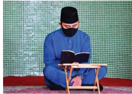
8. HRH attends Tahlil Ceremony