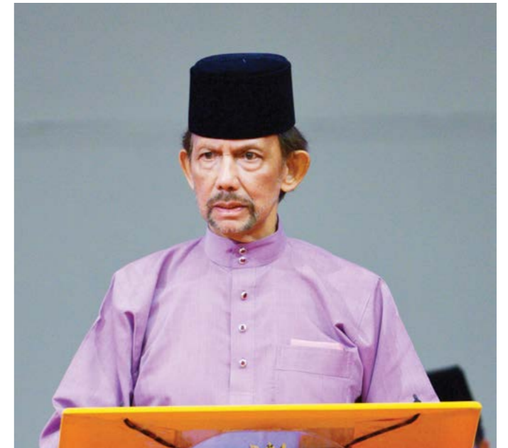
His Majesty Sultan Haji Hassanal Bolkiah Mu'izzaddin Waddaulah ibni Al-Marhum Sultan Haji Omar 'Ali Saifuddien Sa'adul Khairi Waddien, Sultan and Yang Di-Pertuan of Brunei Darussalam delivering a titah (royal speech) at the annual National Level Nuzul Al-Quran Celebration for 1443 Hijrah, held at the International Convention Centre (ICC).

In a titah , His Majesty also mentioned that those faithful must believe that by holding on to the Al-Quran through reading,