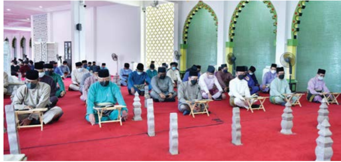
The Ministry of Home Affairs and the departments under it as well as the Mukim and Village Consultative Councils on April 7. Leading the delegation was Yang Berhormat Pehin Orang Kaya Seri Kerna Dato Seri Setia (Dr.) Haji Awang Abu Bakar bin Haji Apong, Minister of Home Affairs.

The tahlil ceremonies for the late parents and son of His Majesty the Sultan and Yang Di-Pertuan of Brunei Darussalam: Al-Marhum Sultan Haji Omar 'Ali Saifuddien Sa'adul Khairi Waddien; Al-Marhumah Duli Raja Isteri Pengiran Anak Damit and Al-Marhum His Royal Highness Prince Haji 'Abdul 'Azim were held by: