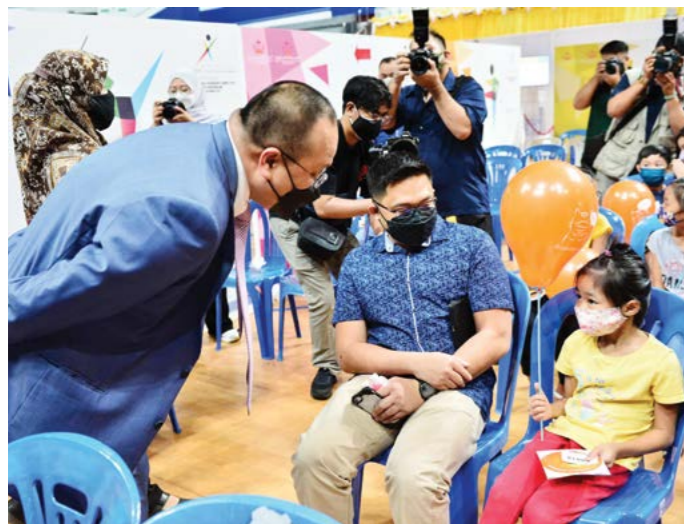
Yang Berhormat Minister of Health during his visit to the Indoor Stadium Vaccination Centre.

BERAKAS, April 2 – The National COVID-19 Vaccination Programme for children aged 5 to 11 began simultaneously at all vaccination centres nationwide.