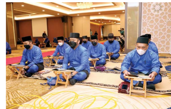
Among those who participated in the Khatam Al-Quran Ceremony.