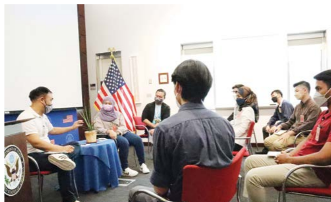
Youth representatives from environmental Non-Government Organisations (NGOs) discuss environmental sustainability at the United States Embassy in Brunei Darussalam in conjunction with Earth Day.