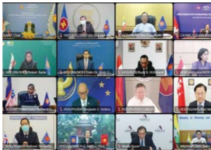
16. Green and sustainable infrastructure - part of economic recovery efforts