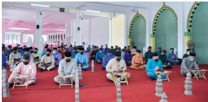
The Ministry of Health and its departments on April 18. Leading the delegation was Yang Berhormat Dato Seri Setia Dr. Haji Awang Mohammad Isham bin Haji Jaafar, Minister of Health.