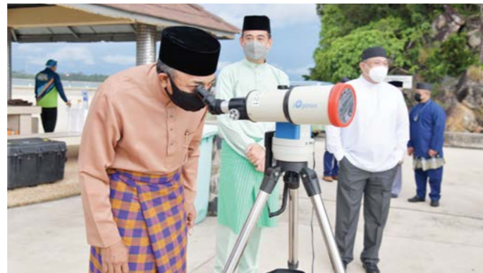
Yang Berhormat Minister of Development conducting the moon sighting at Tanjung Batu Recreational Park.

It was followed by the recitation of tahlil and doa arwah and mass Maghrib Prayer.