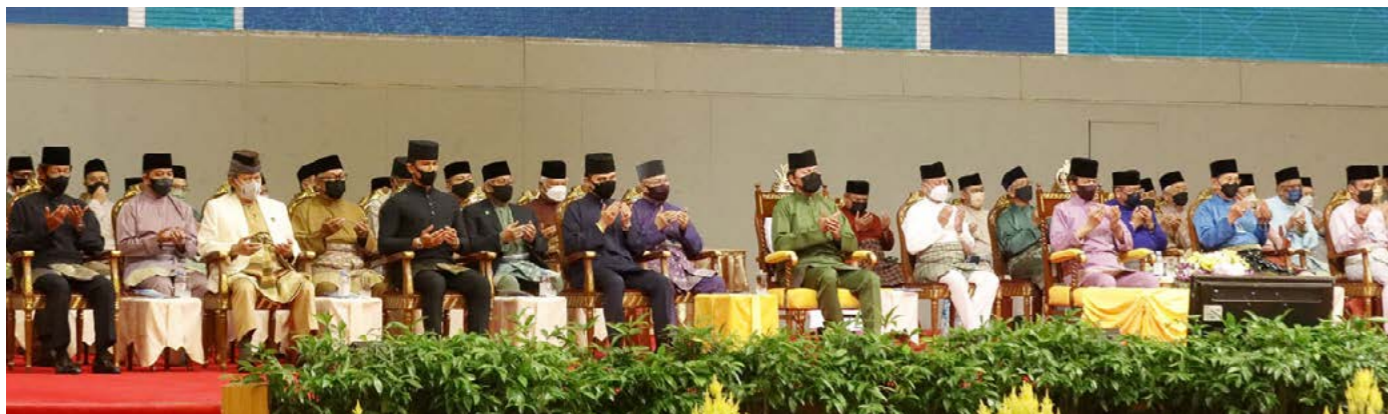
His Majesty Sultan Haji Hassanal Bolkiah Mu'izzaddin Waddaulah ibni Al-Marhum Sultan Haji Omar 'Ali Saifuddien Sa'adul Khairi Waddien, Sultan and Yang Di-Pertuan of Brunei Darussalam; and His Royal Highness Prince Haji Al-Muhtadee Billah, the Crown Prince and Senior Minister at the Prime Minister's Office, His Royal Highness Prince 'Abdul Malik; His Royal Highness Prince 'Abdul Mateen; His Royal Highness Prince Mohamed Bolkiah and His Royal Highness Prince Haji Jefri Bolkiah at the event.

the Al-Quran. If we consider the pandemic as a catastrophe that is dragging us into darkness, the Al-Quran is capable of taking us out of the darkness by continuously reading it.