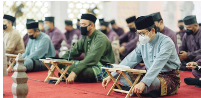
Bank Islam Brunei Darussalam (BIBD) and its group of companies on April 25. Present at the ceremony was Yang Berhormat Minister at the Prime Minister's Office and Second Minister of Finance and Economy as the Chairman of the Board of BIBD.