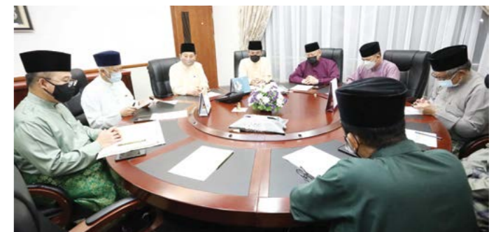
Yang Berhormat Minister of Home Affairs, Yang Berhormat Minister of Religious Affairs, Yang Berhormat Minister at the Prime Minister's Office, Yang Berhormat Minister of Culture, Youth and Sports; and Yang Berhormat Chief Syar'ie Judge at the meeting.

The result of the moon sighting was relayed to Yang Berhormat Pehin Udana Khatib Dato Paduka Seri Setia Ustaz Haji Awang Badaruddin bin Pengarah Dato Paduka Haji Awang Othman, Minister of Religious Affairs as President of MUIB during a meeting at the MuRA premises together with the presence of members of MUIB comprising Yang Berhormat Pehin Orang Kaya Seri Kerna Dato Seri Setia (Dr.) Haji Awang Abu Bakar bin Haji Apong, Minister of Home Affairs; Yang Berhormat Dato Seri