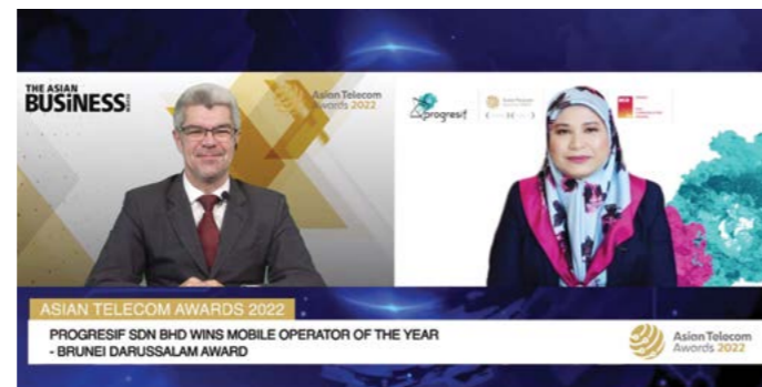
Progresif Chief Executive Officer receiving the awards virtually.

ACMF also thanked Sustainable Finance Institute Asia (SFIA) and the Industry Advisory Panel Working Groups under the Joint Sustainable Finance Working Group for their support and effort in developing ASEAN's sustainable capital market.