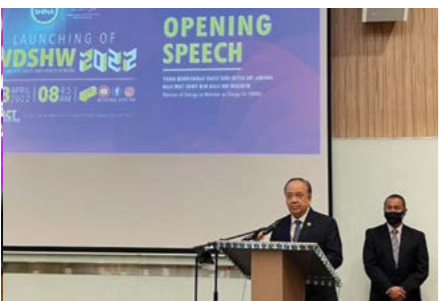
18. Act together to build a positive safety and health culture