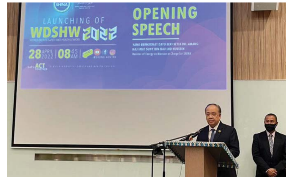
Yang Berhormat Minister of Energy officiating the launching of the online registration E-SHENA.

Everyone has an important role to create a positive and preventative safety and health culture in the workplace, in order to prevent injury or fatality.