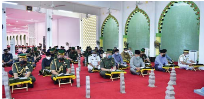
The Ministry of Defence and the Royal Brunei Armed Forces (RBAF) on April 8. In attendance was Yang Berhormat Pehin Datu Lailaraja (Rtd) Major General Dato Paduka Seri Haji Awang Halbi bin Haji Mohd. Yussof, Second Minister of Defence.