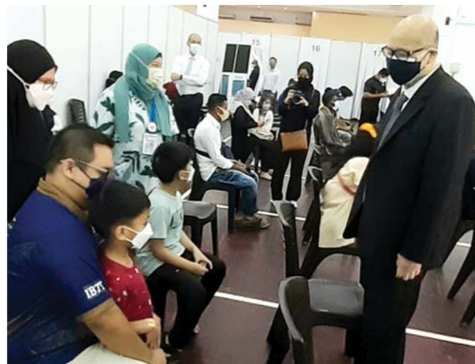
Yang Berhormat Minister of Education during his visit to the Dewan Seri Kenangan, Tutong District.