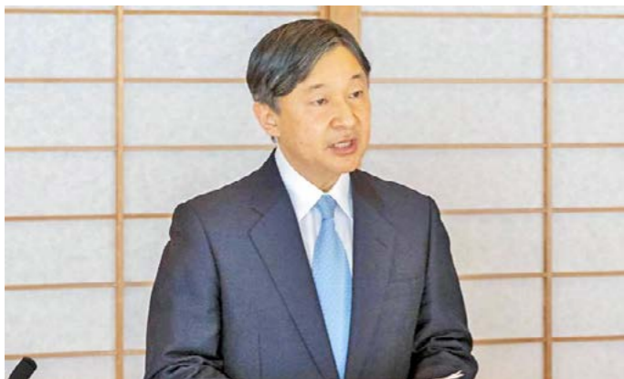
His Majesty Emperor of Japan delivering his welcoming address.