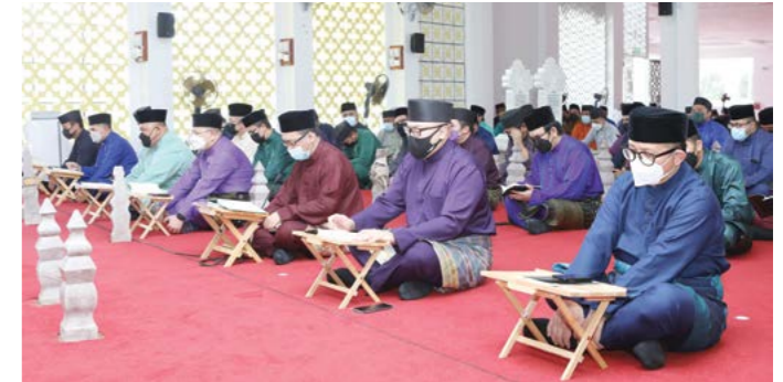
The Ministry of Transport and Infocommunications as well as its departments and Authority Agencies on April 20. Present at the ceremony was Yang Berhormat Dato Seri Setia Awang Abdul Mutalib bin Pehin Orang Kaya Seri Setia Dato Paduka Haji Mohammad Yusof, Minister of Transport and Infocommunications.