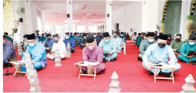
The Ministry of Primary Resources and Tourism as well as its departments on April 9. Leading the delegation was Yang Berhormat Dato Seri Setia Awang Haji Ali bin Apong, Minister of Primary Resources and Tourism.