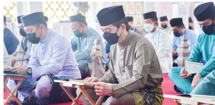
The Ministry of Finance and Economy and its departments on April 6. Present at the ceremony was Yang Berhormat Minister at the Prime Minister's Office and Second Minister of Finance and Economy.