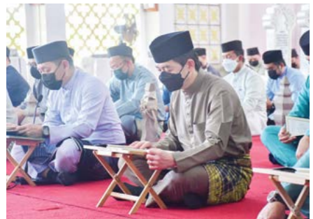
10. Tahlil ceremonies at Royal Mausoleum