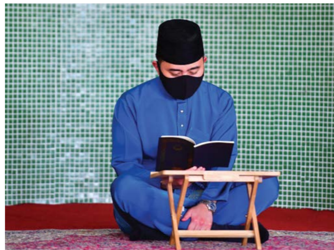
His Royal Highness Prince 'Abdul Malik ibni His Majesty Sultan Haji Hassanal Bolkiah Mu'izzaddin Waddaulah, Chairman of the Yayasan Sultan Haji Hassanal Bolkiah Committee of Governors attending the Tahlil Ceremony for Al-Marhum Sultan Haji Omar 'Ali Saifuddin Sa'adul Khairi Waddien; Al-Marhumah Duli Raja Isteri Pengiran Anak Damit; and Al-Marhum His Royal Highness Prince Haji 'Abdul 'Azim at the Royal Mausoleum.

BANDAR SERI BEGAWAN, April 11 - Nearly 200 officers and staff of the Yayasan Sultan Haji Hassanal Bolkiah (YSHHB) delegation attended a Tahlil Ceremony for Al-Marhum Sultan Haji Omar 'Ali Saifuddin Sa'adul Khairi Waddien; Al-Marhumah Duli Raja Isteri Pengiran Anak Damit; and Al-Marhum His Royal Highness Prince Haji 'Abdul 'Azim. The ceremony took place at the Royal Mausoleum.