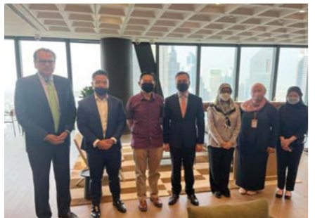
15. BIBD ME improves cooperation between Brunei and UAE