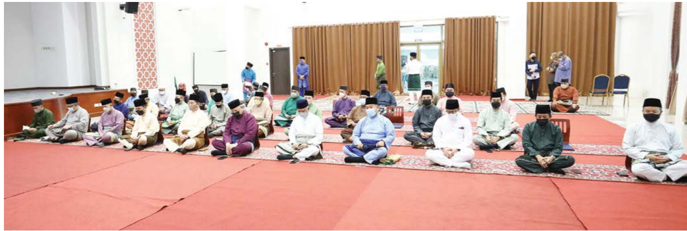
A religious event was held at the Ministry of Religious Affairs while waiting for the outcome of the moon sighting.