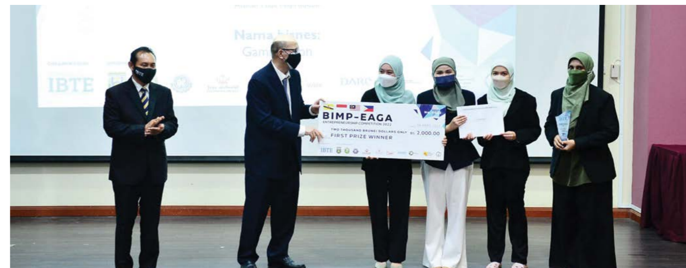
Yang Berhormat Minister of Education presents the top prizes to Team Gamification from Universiti Brunei Darussalam (UBD).

BERAKAS, April 28 - An educational board game developed by the Gamification Team from Universiti Brunei Darussalam (UBD) won the top prize of $2,000 from the BIMP-EAGA Entrepreneurship Competition.