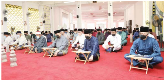
The Prime Minister's Office and its departments on April 5. Among those present were Yang Berhormat Dato Seri Setia Haji Awang Abdul Mokti bin Haji Mohd. Daud, Minister at the Prime Minister's Office; Yang Berhormat Dato Seri Setia Dr. Awang Haji Mohd. Amin Liew bin Abdullah, Minister at the Prime Minister's Office and Second Minister of Finance and Economy; and Yang Berhormat Pehin Datu Seri Maharaja Dato Paduka Seri Setia (Dr.) Ustaz Haji Awang Abdul Aziz bin Juned, the State Mufti.