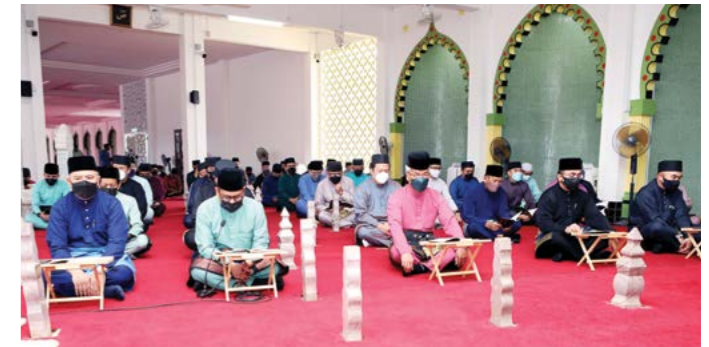
The Ministry of Energy and the departments as well as its Statutory Bodies on April 9. Leading the delegation was Dato Seri Paduka Awang Haji Matsatejo bin Sokiaw, Deputy Minister of Energy.