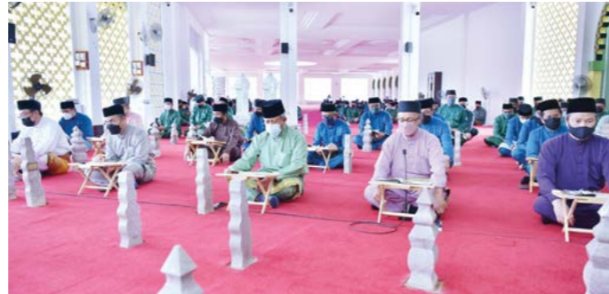
Perbadanan Tabung Amanah Islam Brunei (Perbadanan TAIB) and its subsidiaries on April 12. Present at the ceremony was Yang Berhormat Second Minister of Defence as Chairman of Perbadanan TAIB Board of Directors.