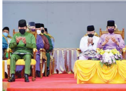
3. Al-Quran - permanent asset to be harnessed