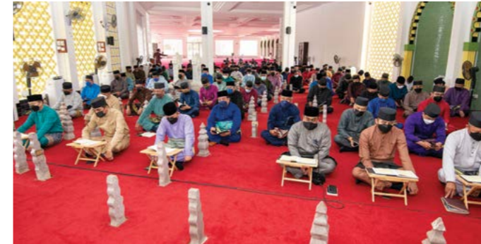
The Ministry of Culture, Youth and Sports and its departments on April 11. Leading the delegation was Yang Berhormat (Rtd) Major General Dato Paduka Seri Awang Haji Aminuddin Ihsan bin Pehin Orang Kaya Saiful Mulok Dato Seri Paduka Haji Abidin, Minister of Culture, Youth and Sports.