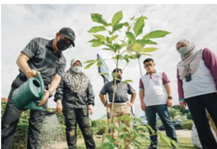
21. Tackling climate change