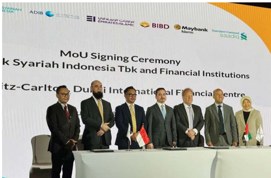
Senior Executive Officer at BIBD ME (fourth from left) with officers from Bank Syariah Indonesia (BSI) at the signing ceremony.

BANDAR SERI BEGAWAN, April 8 - BIBD Middle East (ME) Limited, a wholly-owned subsidiary of Bank Islam Brunei Darussalam (BIBD), signed a Memorandum of Understanding (MoU) with Bank Syariah Indonesia (BSI) to foster cooperation in the region.