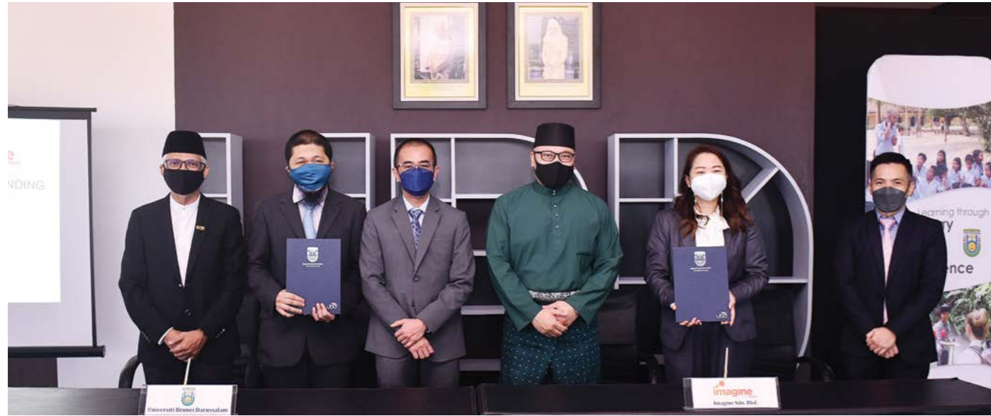
Yang Berhormat Minister of Transport and Infocommunications during the signing ceremony.

TUNGU LINK, April 21 - Universiti Brunei Darussalam (UBD) and Imagine Sdn. Bhd. (Imagine) signed a Memorandum of Understanding (MoU) aimed at bridging the digital divide in Brunei Darussalam and better understanding the digital needs of low-income households and individuals, further enabling the Smart Nation initiative towards the National Vision 2035.