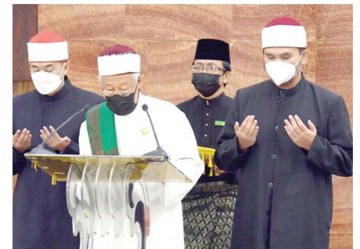
Yang Berhormat the State Mufti reciting the special doa (above), and the mass recitation of Selawat Tafrijiyyah (below).