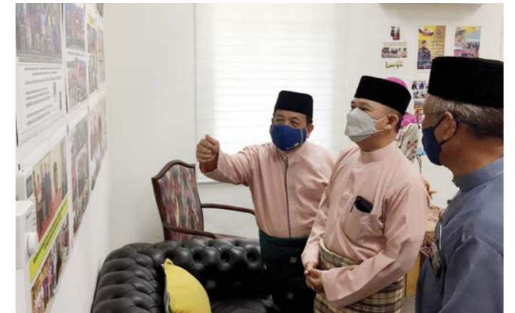
The Minister touring the exhibition.

"With the new headquarters," added the Minister, "this is the