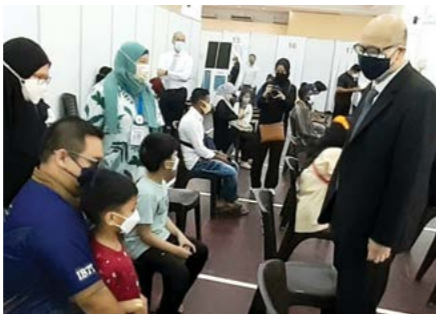
12. National COVID-19 vaccination for children commences