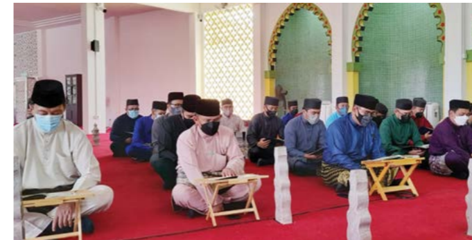
The Employees Trust Fund (TAP) on April 18. Present at the ceremony was Yang Berhormat Minister of Culture, Youth and Sports as Chairman of the TAP Board.