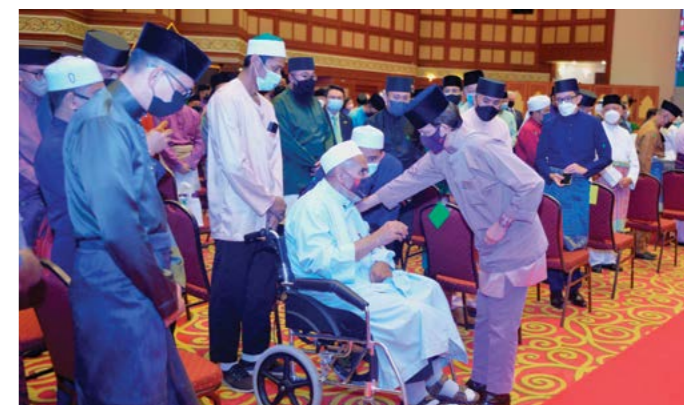
His Majesty at the event.