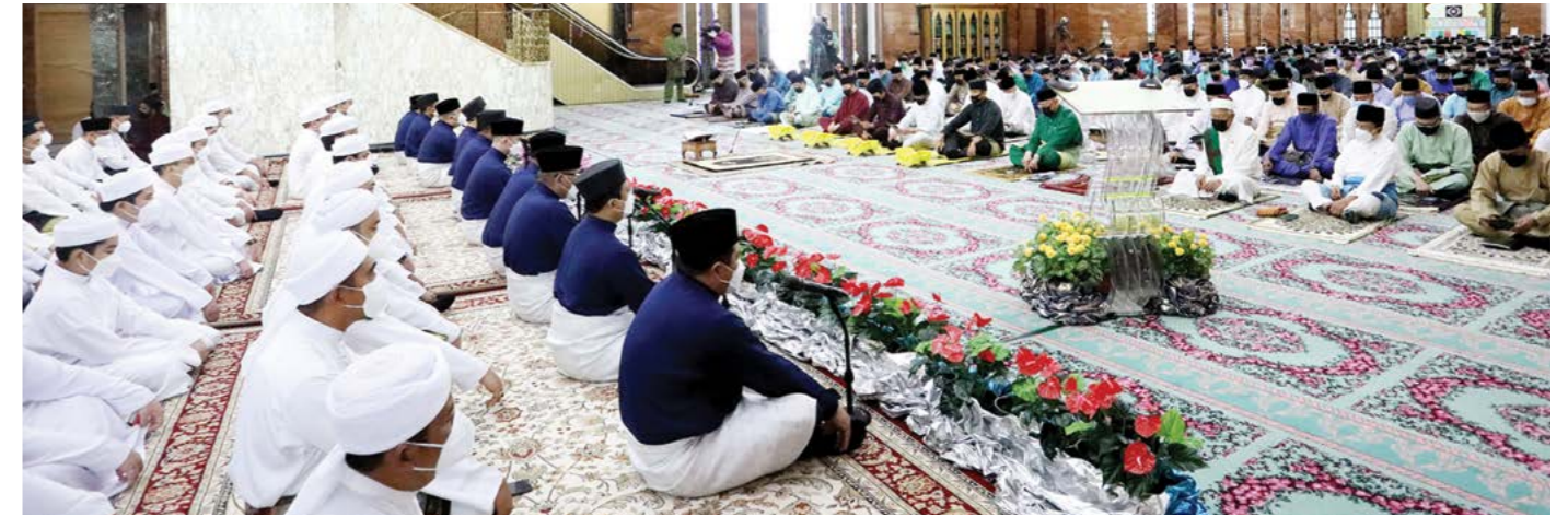
Participants from each category delivering their presentation.