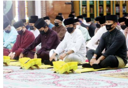
6. Echo of Selawat Tafrijiyyah throughout the country