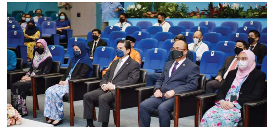
Yang Berhormat Minister at the Prime Minister's Office and Second Minister of Finance and Economy during the launching ceremony of the Brunei Trade Website.

For more information on this website, the public can contact the Trade Division, Level 3, MoFE, at +673 2383696 or by email to 'tf@mofe.gov.bn' or Certificate of Origin Office, Level 1, MoFE or by email to 'coo.officebrunei@mofe.gov.bn'.