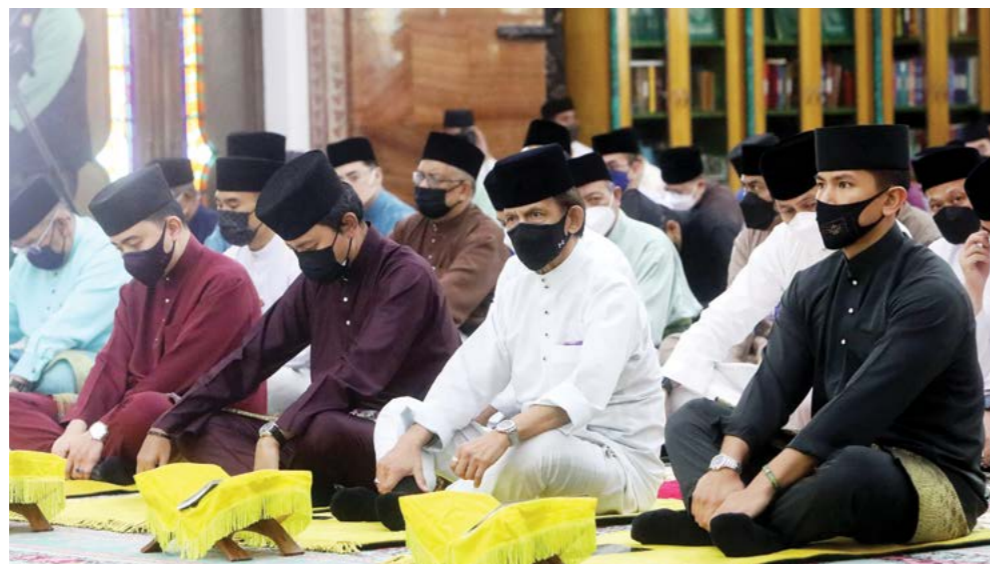
His Majesty the Sultan and Yang Di-Pertuan of Brunei Darussalam and Their Royal Highnesses joining the congregation at the Omar 'Ali Saifuddien Mosque during the recitation of Selawat Tafrijiyyah.