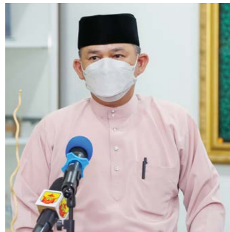
Yang Berhormat Minister of Culture, Youth and Sports delivering his speech at the Inauguration Ceremony of the WARGAMAS Headquarters Building.

The Minister of Culture, Youth and Sports added that this is a reflection of senior citizens as human beings who are rich in experience and treasures of knowledge who dare to contribute their thoughts and