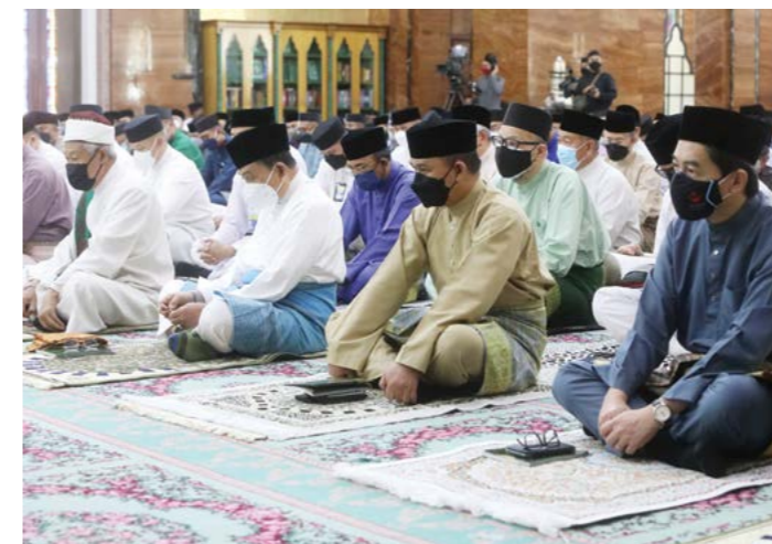
Among those present at the nationwide Selawat Tafrijiyyah Year 1443 Hijrah/2022 Masihi Recitation Ceremony (above and below).