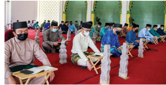
The Ministry of Education as well as its departments through the Examination Department, National Education Council Secretariat and the Brunei Technology Centre, on April 23. Leading the delegation was Yang Berhormat Dato Seri Setia Awang Haji Hamzah bin Haji Sulaiman, Minister of Education.