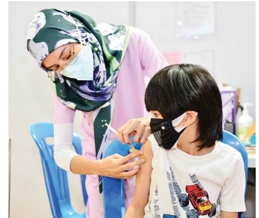
One of the children receiving his first dose.

Meanwhile in the Tutong District, the programme was held at Dewan Seri Kenangan. Present to observe the process was Yang Berhormat Dato Seri Setia Awang Haji Hamzah bin Haji Sulaiman, Minister of Education.