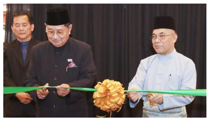
The Minister of Religious Affairs and the Minister of Primary Resources and Tourism officiating the Heart of Islam Exhibition Launching Ceremony.

opportunity to share several initiatives carried out by ASEAN and Brunei Darussalam's Ministry of Education (MoE) on the issue of transitioning from school to workplace. The Minister also congratulated Italy (the country assuming the G20 Presidency for the year 2021) on the country's successful leadership throughout the meetings; and expressed his support towards the G20 Joint Declaration on Transitions from School to Work.