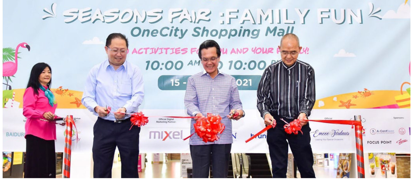
nat Minister of Home Affairs officiating the launching of the Seasons Fair : Family Fun Expo

SALAMBIGAR, June 18 - For the first time ever, the Chinese Chamber of Commerce, Bandar Seri Begawan (CCC BSB) is holding the Seasons Fair : Family Fun Expo, which will run for six days, from June 15 to 20 at One City Shopping Complex.