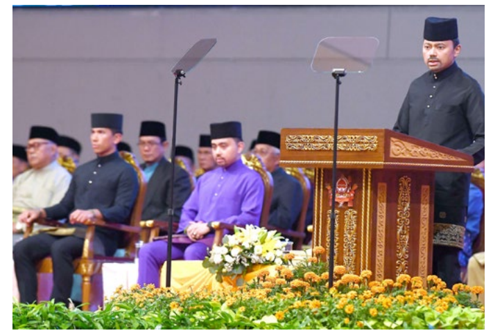
His Royal Highness the Crown Prince delivering a sabda (royal speech) during the first day of the National Al-Quran Reading Musabagah for Adults 1442 Hiirah/2021 Masihi