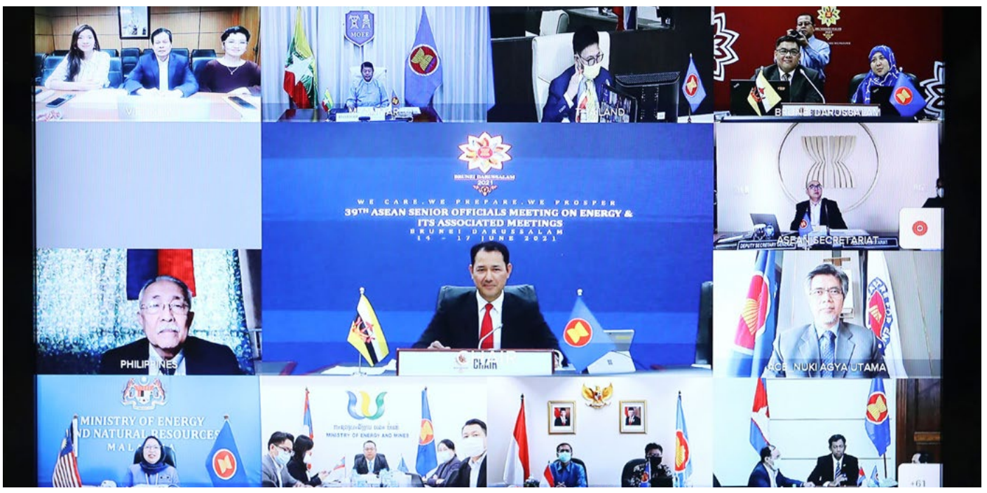
The 39th Senior Officials Meeting on Energy (SOME) taking place via video conference at the International Convention Centre, Berakas.

BANDAR SERI BEGAWAN, June 14 – The 39<sup>th</sup> Senior Officials Meeting on Energy (SOME) draws its curtains starting today to June 17 via video conference at the International Convention Centre, Berakas.