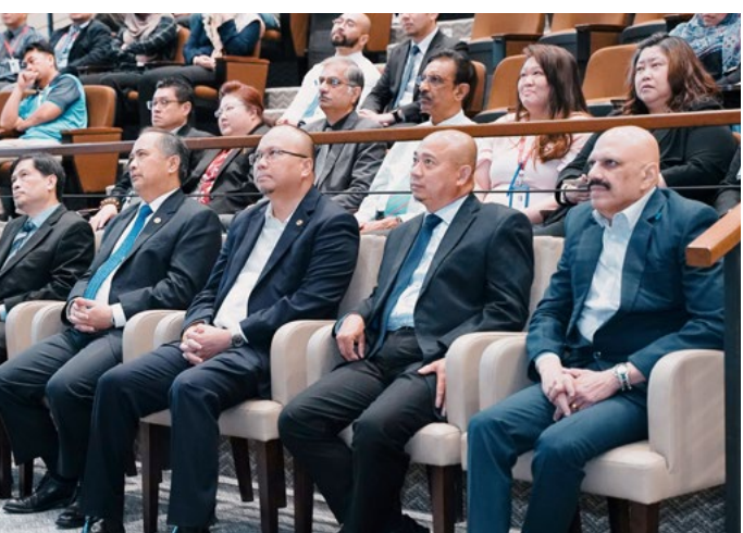
Yang Berhormat Minister of Health attending the talk held in conjunction with the World Day for Safety

helping employers and employees with risk reduction and assessment.