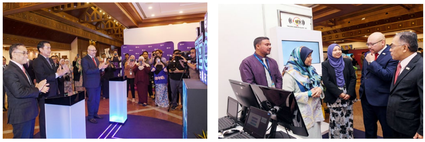
Yang Berhormat Minister of Primary Resources and Tourism and Yang Berhormat Minister of Transport and Info-communications launching the Digital Technology Week Exhibition.

BANDAR SERI BEGAWAN, June 17 – Yang Berhormat Dato Seri Setia Awang Haji Ali bin Apong, Minister of Primary Resources and Toursim; and Yang Berhormat Dato Seri Setia Awang Abdul Mutalib bin Pehin Orang Kaya Seri Setia Dato Paduka Haji Mohammad Yusof launched the Digital Technology Week Exhibition at the International Convention Centre, Berakas.