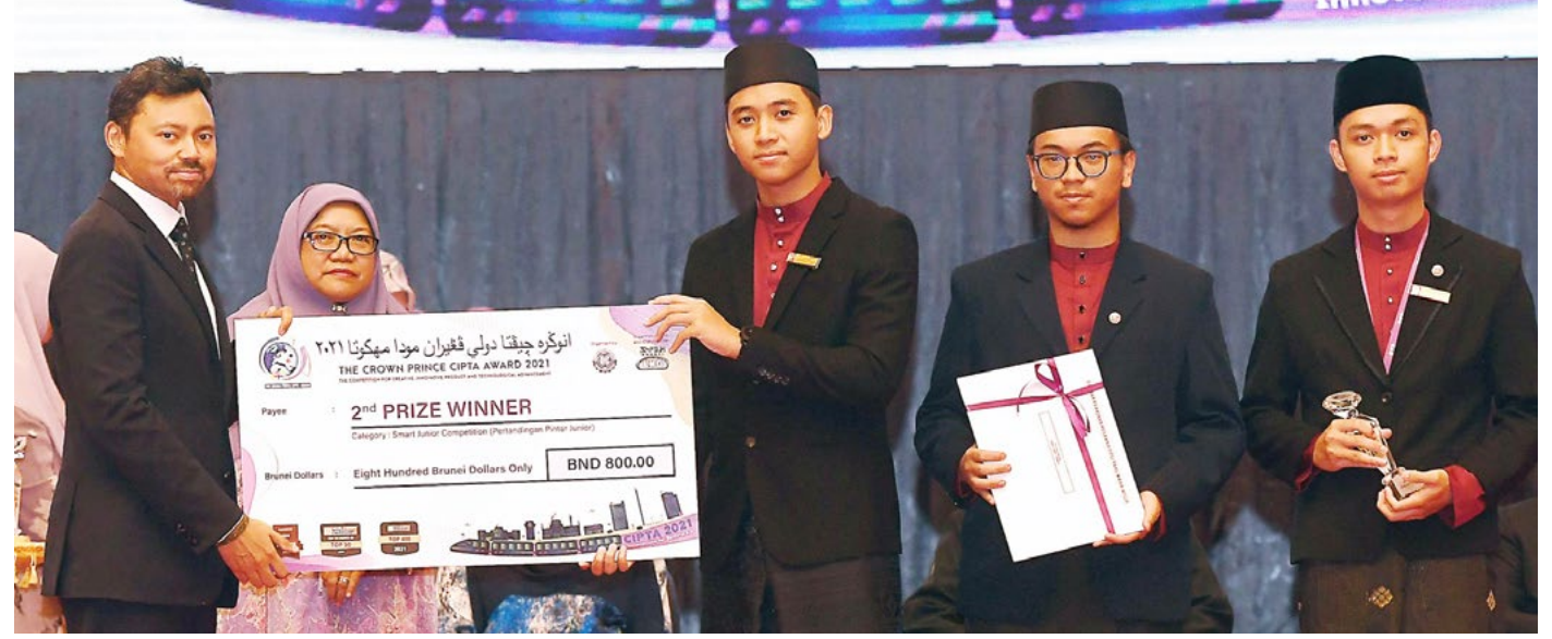
His Royal Highness the Crown Prince awarding prizes to one of the winning teams of the Crown Prince CIPTA Award 2021.

The winning projects will be showcased at the UTB Gallery starting from June 21, where they will be available for public viewing.