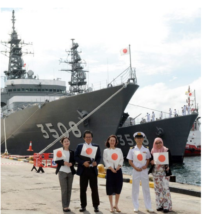
The Japan Maritime Self-Defense Force (JMSDF), JS Kashima and JS Setoyuki at the Muara Port.

The value and volume of retail transactions have grown in the past year amid the COVID-19 pandemic and a shift in customer behaviour. BIBD continues to show prudence – decreasing its Non-Performing Loans (NPL) from 0.93 per cent to 0.73 per cent.