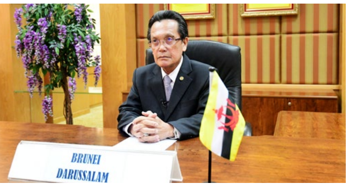
Yang Berhormat Minister of Home Affairs attending the 109th International Labour Conference (ILC) via online.

"According to the Labour Force Survey in 2019, Brunei Darussalam's unemployment rate was 6.8 per cent. Since its establishment in 2020, the Manpower Planning and Employment Council (MPEC) has managed to increase local employment to almost four times compared to previous years, with an achievement of 103 per cent or 12,763 individuals employed," the Minister of Home Affairs explained.