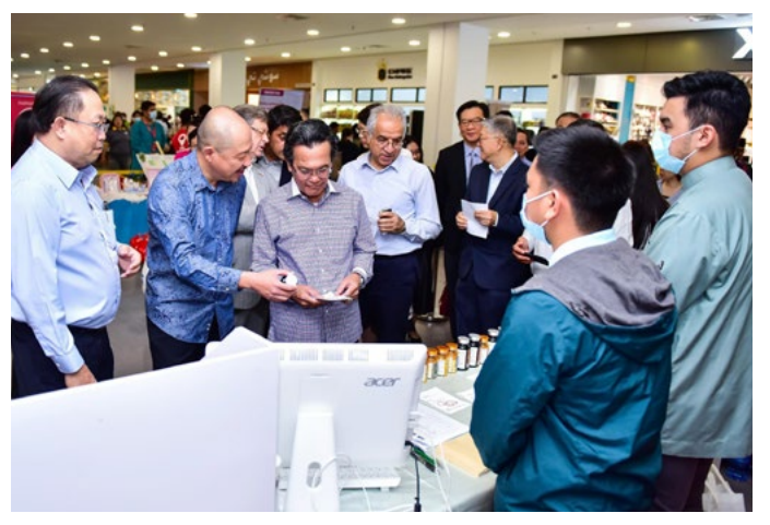
Yang Berhormat Minister of Home Affairs taking a closer look at the products showcased at the expo.

On the same day, the Minister also joined Yang Berhormat Dato Seri Setia Awang Haji Hamzah bin Haji Sulaiman, Minister of Education at the G20 Joint Education and Labour and Employment Ministers Meeting - which was also held online following the G20 Education Ministers Meeting.