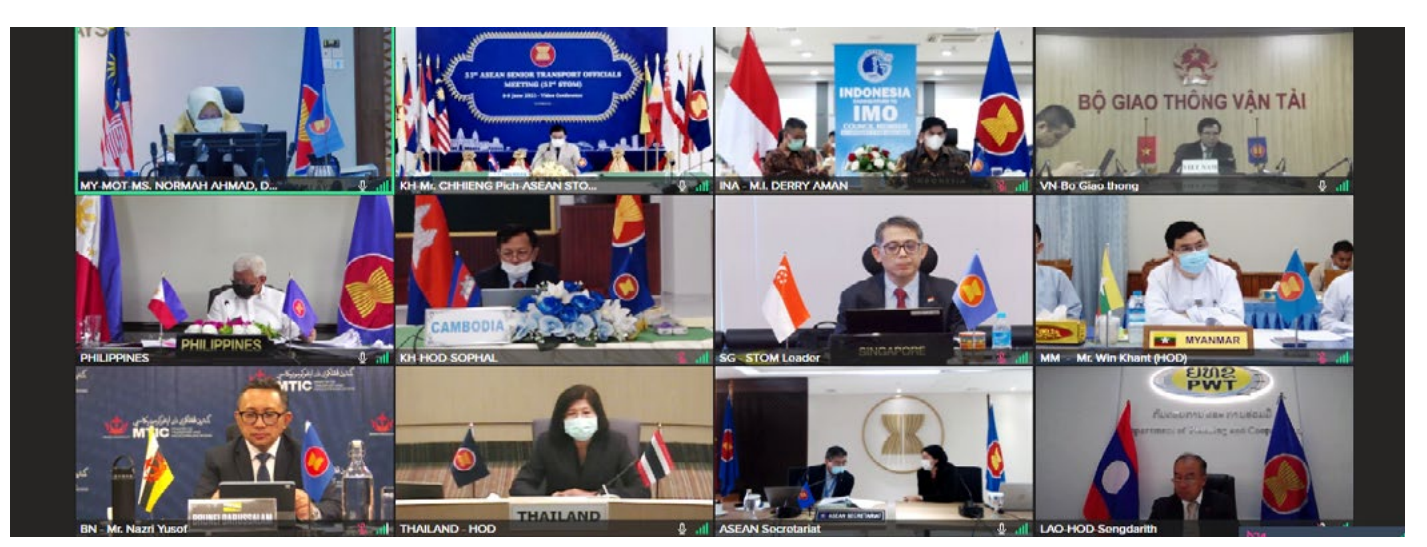
The 51st ASEAN Senior Transport Officials Meeting (STOM) held via video conference.

The outcomes of 51st STOM will be followed up during the 52nd STOM: which will focus on finalising the Annual Priorities/Kev The 51st STOM included discussions on the status of programmes, activities and projects under the Kuala Lumpur Deliverables for Transport in 2021 for consideration of the 27th Transport Strategic Plan (KLTSP) 2016-2025, which are carried ASEAN Transport Ministers (ATM) Meeting that will take place out by the ASEAN Transport Working Groups. on November.