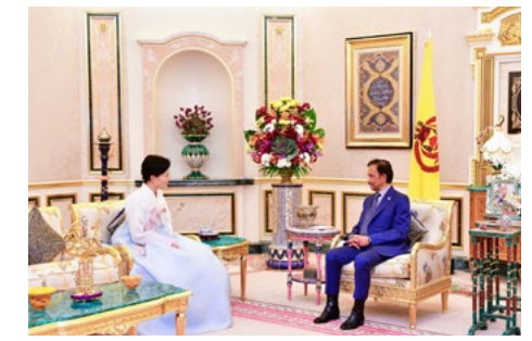
3. His Majesty receives audience