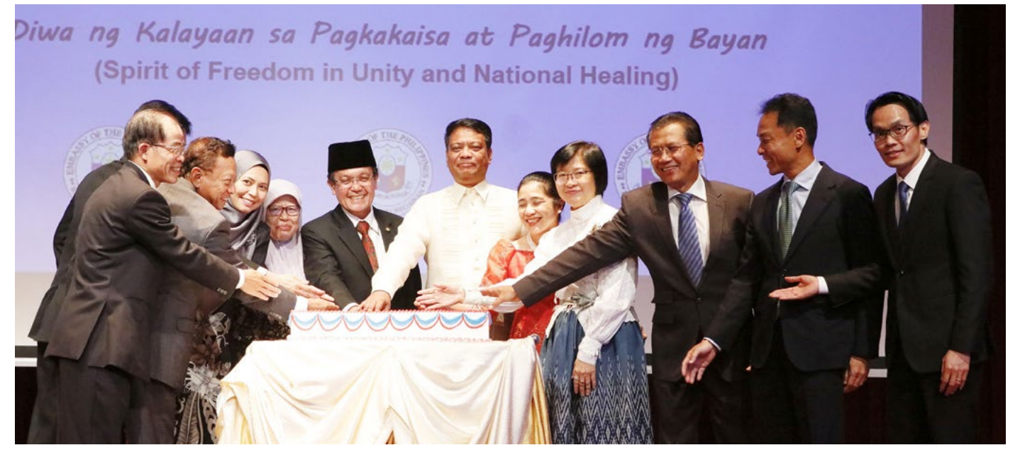
Yang Berhormat Minister of Home Affairs and spouse at the Reception Ceremony held in conjunction with the 123rd Philippine Independence Day.

BANDAR SERI BEGAWAN, June 15 – The Embassy of the Republic of the Philippines to Brunei Darussalam organised a Reception Ceremony in conjunction with the 123<sup>rd</sup> Philippine Independence Day at the Songket Ballroom, Rizgun International Hotel.