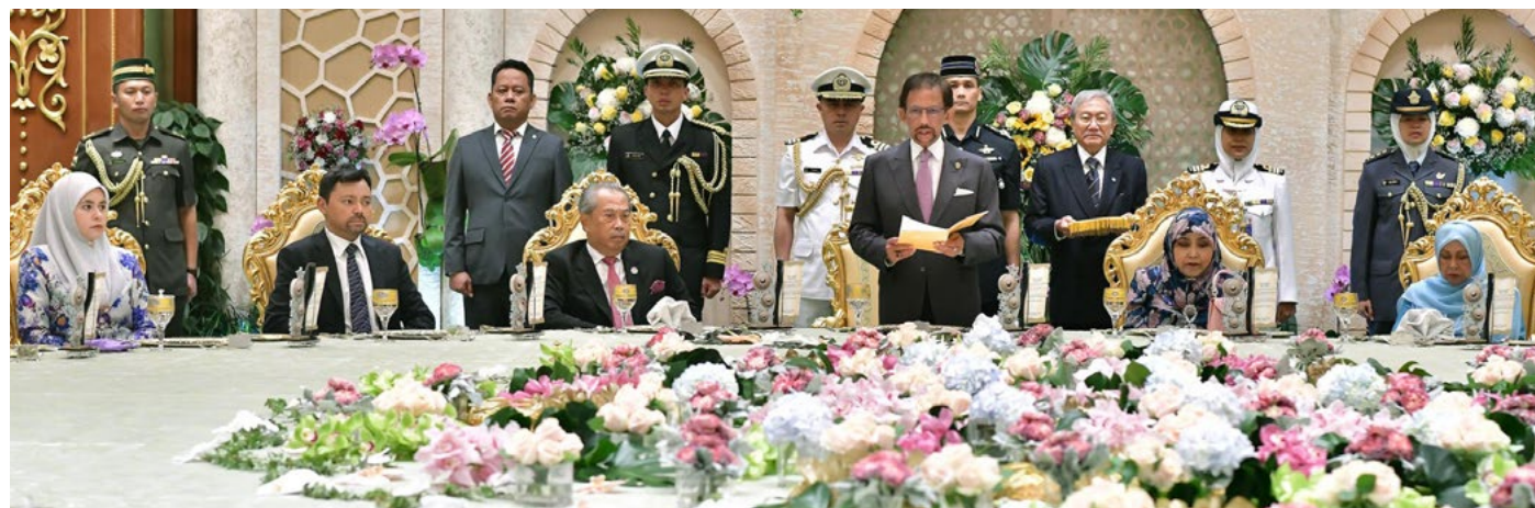
His Majesty Sultan Haji Hassanal Bolkiah Mu'izzaddin Waddaulah ibni Al-Marhum Sultan Haji Omar 'Ali Saifuddin Sa'adul Khairi Waddien, Sultan and Yang Di-Pertuan of Brunei Darussalam delivers a tital during the Official Luncheon Ceremony. Also in attendance were Her Majesty Duli Raja Isteri Pengiran Anak Hajah Saleha binti Al-Marhum Pengiran Pemancha Pengiran Anak Haji Mohamed Alam; Yang Amat Berhormat Tan Sri Muhyiddin Yassin, the Prime Minister of Malaysia and spouse, Yang Amat Berbahagia Puan Sri Noorainee Abdul Rahman; and His Royal Highness Prince Haji Al-Muhtadee Billah, the Crown Prince and Senior Minister at the Prime Minister's Office and Her Royal Highness Paduka Seri Pengiran Anak Isteri Pengiran Anak Sarah binti Pengiran Salleh Ab. Rahaman.

On this occasion, Yang Amat Berhormat offered his highest congratulations to His Majesty and Brunei Darussalam on the 37 th National Day Celebration on February 23.