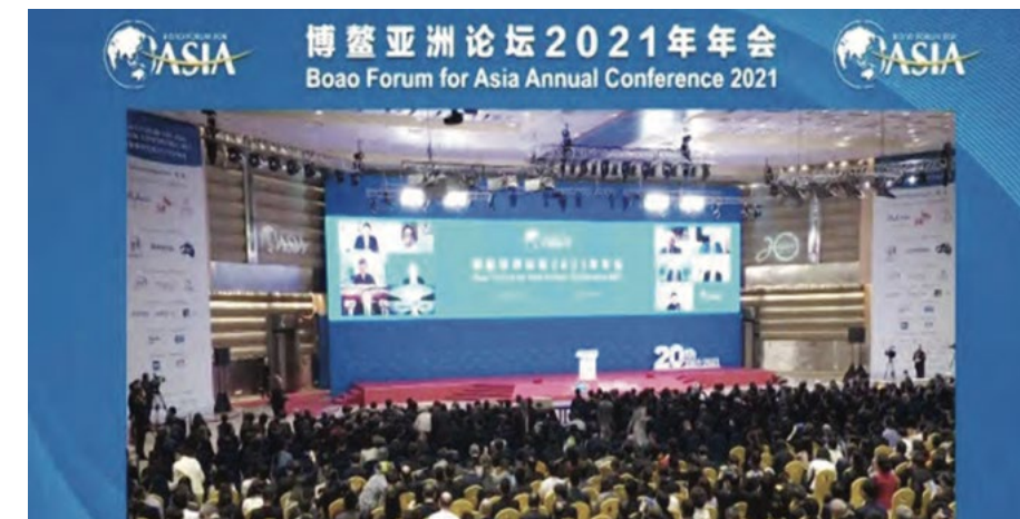
The Opening Plenary of the Boao Forum for Asia (BFA) Annual Conference 2021 in Boao, People's Republic of China.

Jointly initiated by 29 Asia-Pacific countries in February 2001, BFA serves as a high-level platform of dialogue bringing together more than 2,000 delegates from governments, businesses, media, academic institutions and international organisations from Asia and beyond, including leaders from host country People's Republic of China and other economies, to share their insights and proposals on the development of Asia and the world.