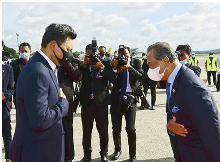
His Royal Highness Paduka Seri Pengiran Muda Mahkota Pengiran Muda Haji Al-Muhtadee Billah ibni Kebawah Duli Yang Maha Mulia Paduka Seri Baginda Sultan Haji Hassanal Bolkiah Mu'izzaddin Waddaulah, Senior Minister at the Prime Minister's Office as the personal representative of His Majesty the Sultan and Yang Di-Pertuan of Brunei Darussalam and Yang Amat Berhormat Tan Sri Muhyiddin Yassin, the Prime Minister of Malaysia and delegation at the Brunei International Airport on April 4.