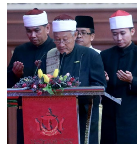
The recitation of Surah Al-Fatihah led by Yang Berhormat the State Mufti.