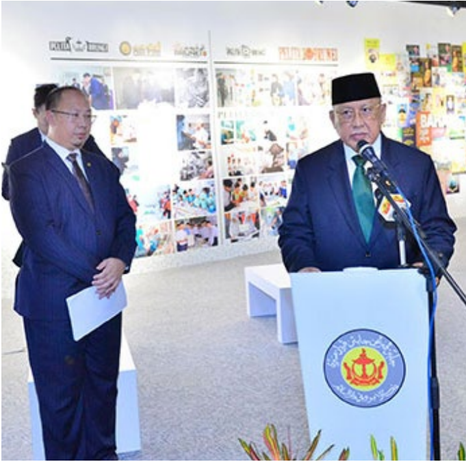
Yang Berhormat Minister at the Prime Minister's Office officiating Galeri Lentera Makmur.