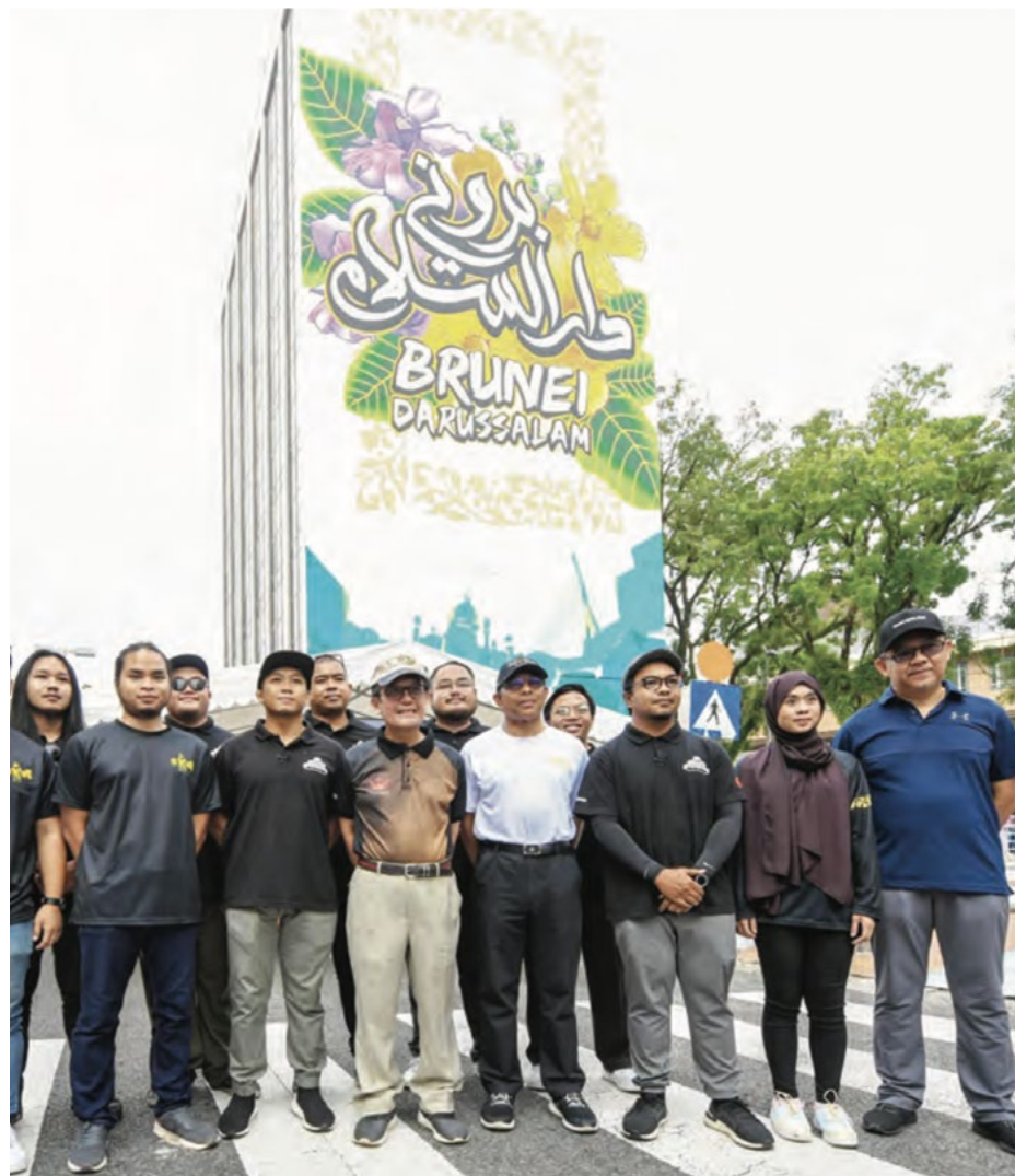
Yang Berhormat Minister of Home Affairs and Yang Berhormat Minister of Development in a group photo with local artists involved in the third phase 'The Pedestrianisation of Jalan Roberts and Adjacent Alleyways' project, also known as The Big Wall.

The project was also completed with the support of the BSB Municipal Department and the Public Works Department as well as the involvement of several agencies.