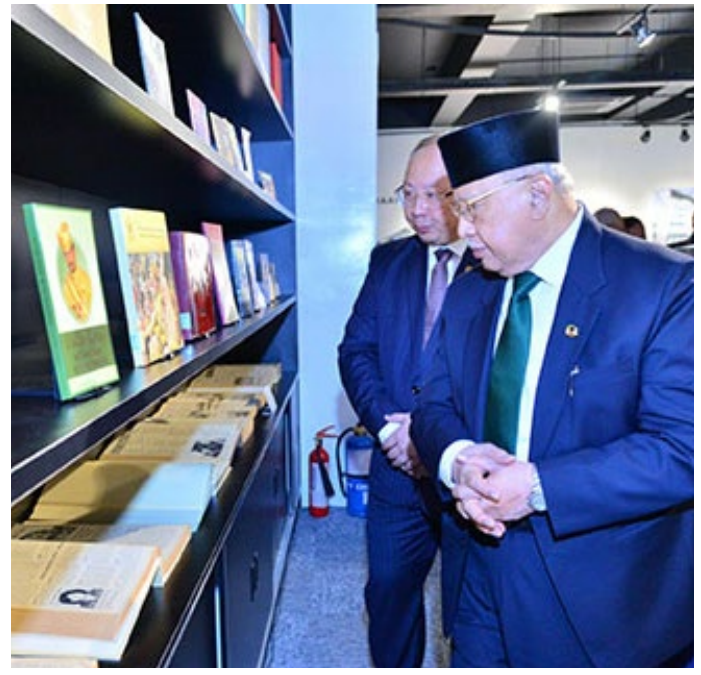
Yang Berhormat Minister at the Prime Minister's Office touring the gallery.

BANDAR SERI BEGAWAN, April 10 – In tracing the 69 years of its establishment, the Department of Information has experienced various paradigm shifts in disseminating information to all levels of society in Brunei Darussalam.