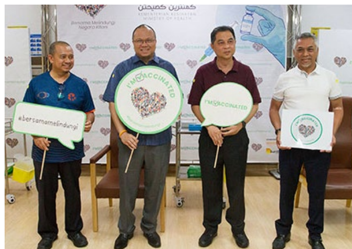
Yang Berhormat Minister of Health in a group photo after receiving the first dose of COVID-19 vaccine.

This matter was emphasised by the Minister of Health, during the implementation of the National Vaccination Programme for COVID-19 throughout the country where for the Brunei-Muara