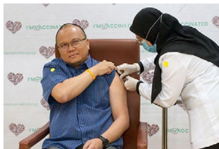
23. Commencement of National Vaccination Programme for COVID-19