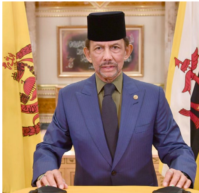
His Majesty Sultan Haji Hassanal Bolkiah Mu'izzaddin Waddaulah ibni Al-Marhum Sultan Haji Omar 'Ali Saifuddien Sa'adul Khairi Waddien, Sultan and Yang Di-Pertuan of Brunei Darussalam delivering a titah (royal speech) in conjunction with celebrating the month of Ramadan 1442 Hijrah/2021 Masihi at Istana Nurul Iman.

BANDAR SERI BEGAWAN, April 13 - Alhamdulillah, the awaited Ramadan is here again. We Muslims should be grateful for being able to welcome the blessed month of Ramadan, in which the Al-Quran was revealed and there is a night that is better than a thousand months in it.