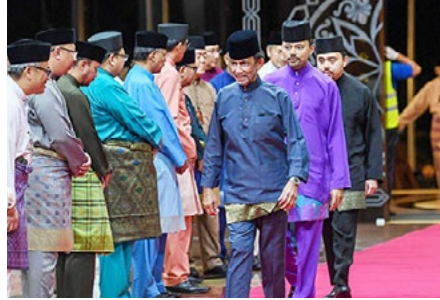
15. National Level Nuzul Al-Quran: Celebration for 1442 Hijrah Al-Quran brings healing, happiness