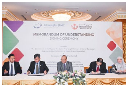
24. Ministry of Health signs with Gleneagles JPMC