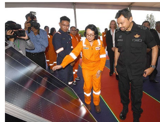
His Royal Highness being briefed on the Solar Power Plant Project.

were presented at Universiti Brunei Darussalam and Universiti Teknologi Brunei to provide opportunities for students to gain knowledge about the solar energy industry.