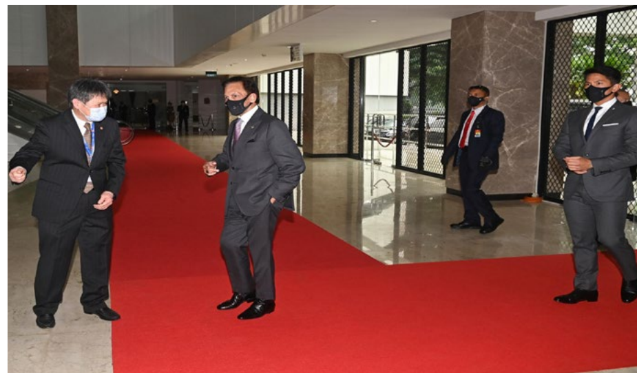
His Majesty the Sultan and Yang Di-Pertuan of Brunei Darussalam being greeted on arrival at the ASEAN Secretariat Building by His Excellency Dato Paduka Lim Jock Hoi, Secretary-General of ASEAN. Accompanying His Majesty was His Royal Highness Prince 'Abdul Mateen.

His Majesty then expressed appreciation for the support of ASEAN Member States for Brunei Darussalam's Chairmanship of ASEAN this year, under the theme "We Care, We Prepare, We Prosper".