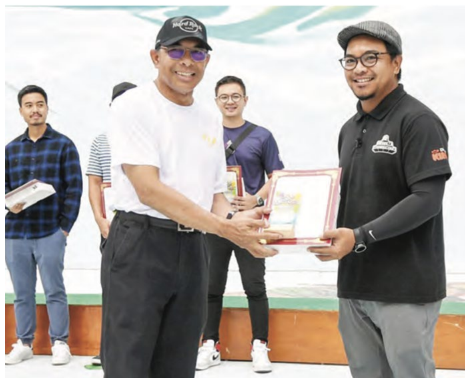
Yang Berhormat Minister of Development presenting a certificate to one of the local artists in making the project a success.