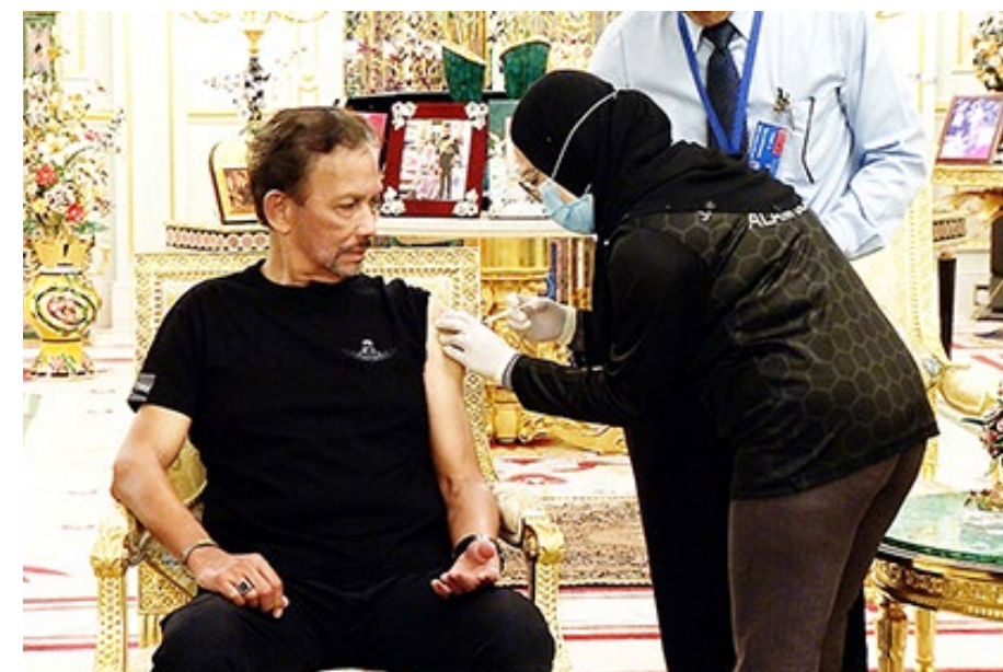
His Majesty Sultan Haji Hassanal Bolkiah Mu'izzaddin Waddaulah ibni Al-Marhum Sultan Haji Omar 'Ali Saifuddin Sa'adul Khairi Waddien, Sultan and Yang Di-Pertuan of Brunei Darussalam receiving the first dose of COVID-19 vaccine injection on April 1.

BERAKAS, APRIL 22 - With the consent of His Majesty Sultan Haji Hassanal Bolkiah Mu'izzaddin Waddaulah ibni Al-Marhum Sultan Haji Omar 'Ali Saifuddin Sa'adul Khairi Waddien, Sultan and Yang Di-Pertuan of Brunei Darussalam, the Ministry of Health would like to inform the public that His Majesty the Sultan and Yang Di-Pertuan of Brunei Darussalam has received the second dose of COVID-19 vaccine injection, therefore has completed the COVID-19 vaccination.