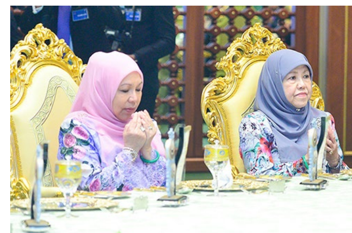
Her Royal Highness Princess Hajah Masna, Ambassador-At-Large at Minister of Foreign Affairs (right); and Her Royal Highness Princess Hajah Amal Umi Kalthum Al-Islam (left) during the Luncheon.