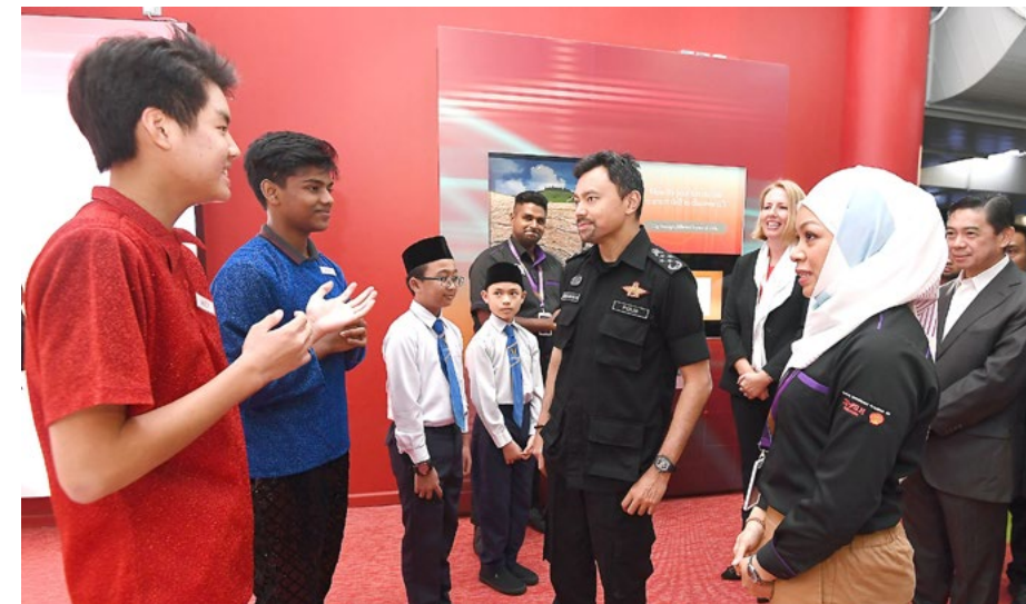
His Royal Highness interacting with students.

With almost 90 per cent of BSP's workforce being locals, the project will also be used