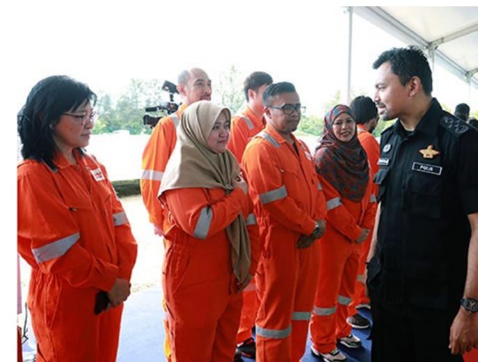
His Royal Highness interacting with the Project and Asset Teams.