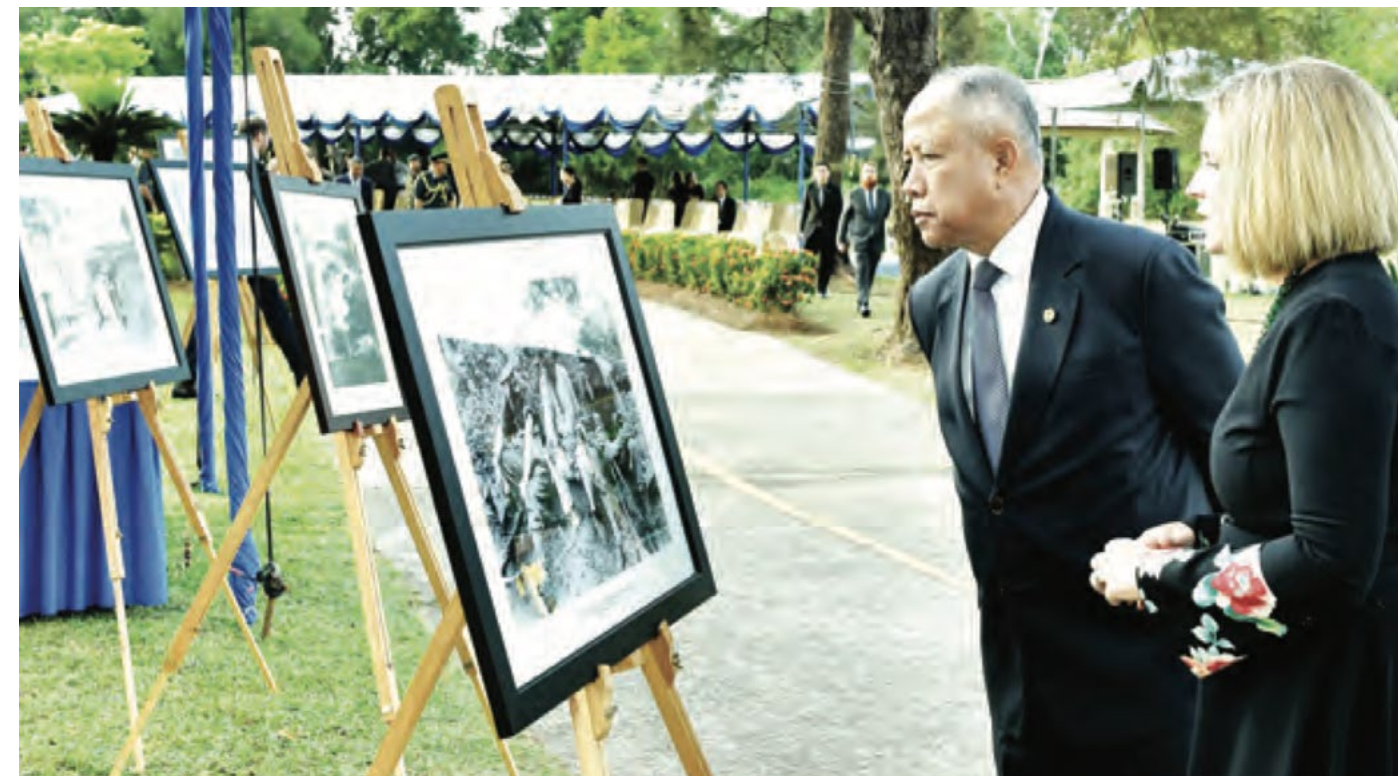
Yang Berhormat Second Minister of Defence taking a closer look at memorial pictures of Australians and New Zealand men and women who have served in their nations' armed forces.

sent several dozen soldiers to war, however Australia has contributed peacekeeping operations and is mostly unarmed for more than three times as much.