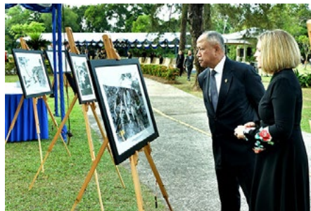
22. Commemorating Anzac Day