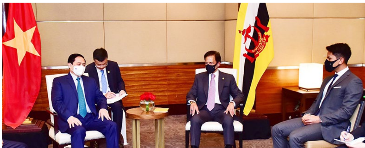
His Majesty Sultan Haji Hassanal Bolkih Mu'izzaddin Waddaulah ibni Al-Marhum Sultan Haji Omar 'Ali Saifuddin Sa'adul Khairi Waddien, Sultan and Yang Di-Pertuan of Brunei Darussalam during a courtesy call from His Excellency Phạm Minh Chính, Prime Minister of the Socialist Republic of Viet Nam. Also in attendance was His Royal Highness Prince 'Abdul Mateen.

JAKARTA, April 24 - His Majesty Sultan Haji Hassanal Bolkih Mu'izzaddin Waddaulah ibni Al-Marhum Sultan Haji Omar 'Ali Saifuddin Sa'adul Khairi Waddien, Sultan and Yang Di-Pertuan of Brunei Darussalam received a courtesy call from His Excellency Phạm Minh Chính, Prime Minister of the Socialist Republic of Viet Nam, which took place at Grand Hyatt Hotel.