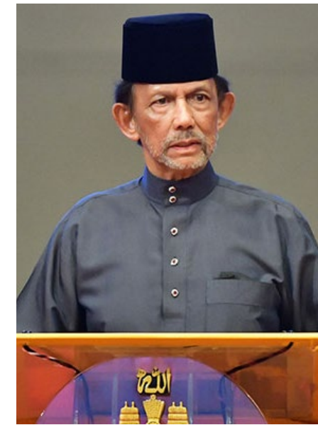
His Majesty Sultan Haji Hassanal Bolkiah Mu'izzaddin Waddaulah ibni Al-Marhum Sultan Haji Omar 'Ali Saifuddien Sa'adul Khairi Waddien, Sultan and Yang Di-Pertuan of Brunei Darussalam delivering a titah (royal speech) at the National Level Nuzul Al-Quran Celebration for 1442 Hijrah, which took place at the International Convention Centre, Berakas.

BANDAR SERI BEGAWAN, April 29 - The benefits of reading the Al-Quran will not only be gained by the readers, but will also bring peace, security and prosperity to the country, said His Majesty Sultan Haji Hassanal Bolkiah Mu'izzaddin Waddaulah ibni Al-Marhum Sultan Haji Omar 'Ali Saifuddien Sa'adul Khairi Waddien, Sultan and Yang Di-Pertuan Brunei Darussalam in a titah (royal speech) in conjunction with the National Level Nuzul Al-Quran Celebration for 1442 Hijrah, which took place at the International Convention Centre, Berakas.