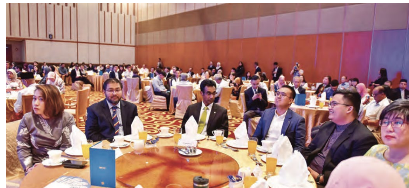
Among the guests present at the launching event.