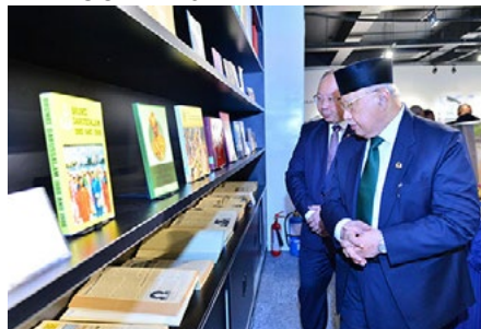
26. Department of Information records historical milestone