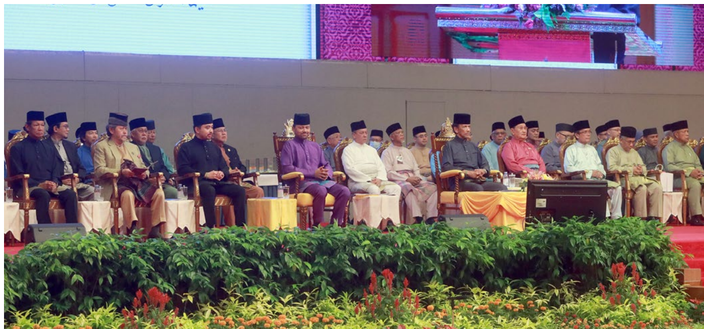
His Majesty and other members of the royal family at the National Level Nuzul Al-Quran Celebration for 1442 Hijrah.