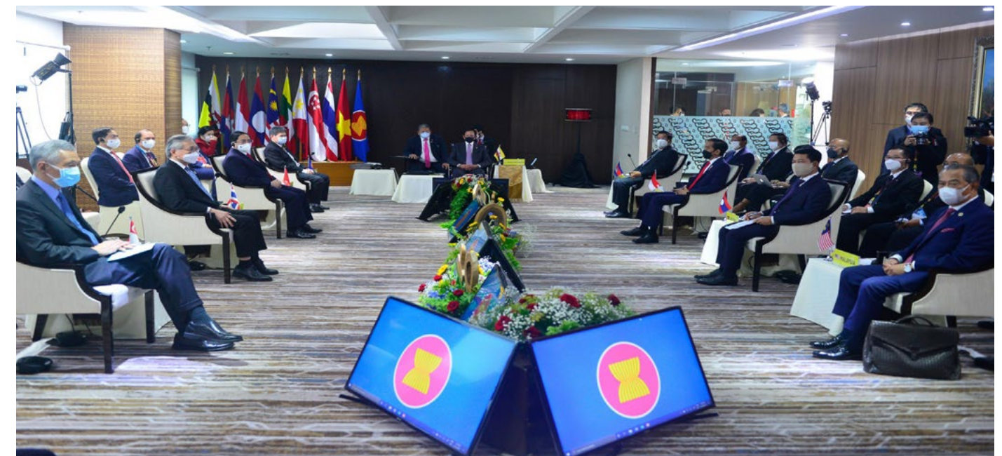
His Majesty chairing the ASEAN Leaders' Meeting which was held at the Bali Room, ASEAN Secretariat Building, Indonesia.