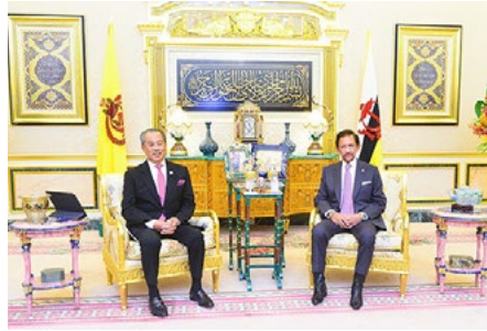
7. Official visit of the Prime Minister of Malaysia