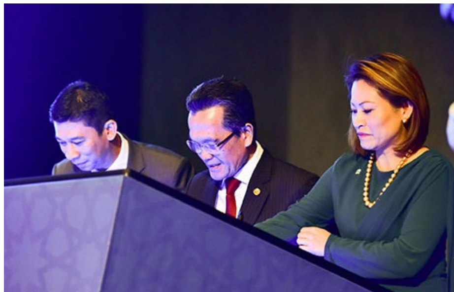
Yang Berhormat Minister of Home Affairs during the launching of Standard Chartered Securities Islamic Investments, which took place at The Empire Brunei.