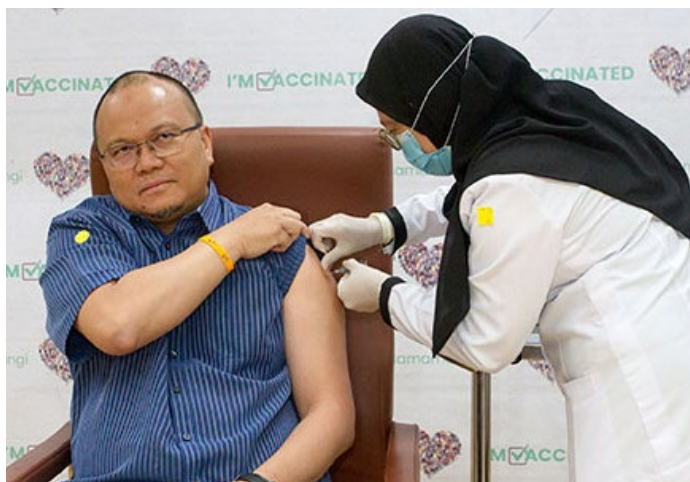
Yang Berhormat Minister of Health receiving the first dose of COVID-19 vaccine.