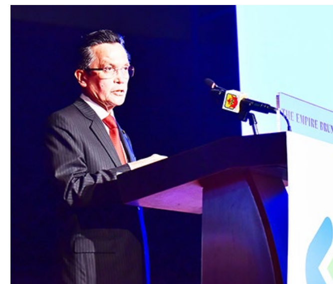
Yang Berhormat Minister of Home Affairs delivering his speech at the launching ceremony of the Islamic Window and Islamic Fund Standard Chartered Securities.

JERUDONG, April 12 - The Autoriti Monetari Brunei Darussalam (AMBD) continues to play an important role in developing Islamic finance as one of the components of Brunei's financial ecosystem, which also includes providing a regulatory framework and thriving and effective supervision based on the financial system, in addition to being able to accommodate new business opportunities.