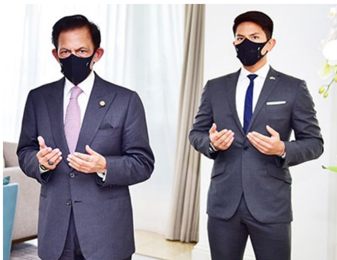
His Majesty Sultan Haji Hassanal Bolkih Mu'izzaddin Waddaulah ibni Al-Marhum Sultan Haji Omar 'Ali Saifuddin Sa'adul Khairi Waddien, the Sultan and Yang Di-Pertuan of Brunei Darussalam and His Royal Highness Prince 'Abdul Mateen before leaving Jakarta after the ASEAN Leaders' Meeting.