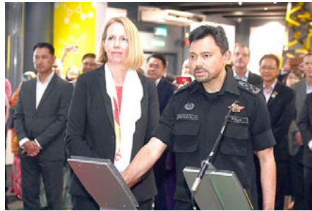
18. Committed in realising economic development