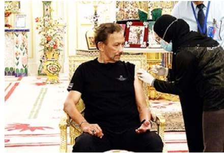
13. Vaccines used are safe, effective, and of quality