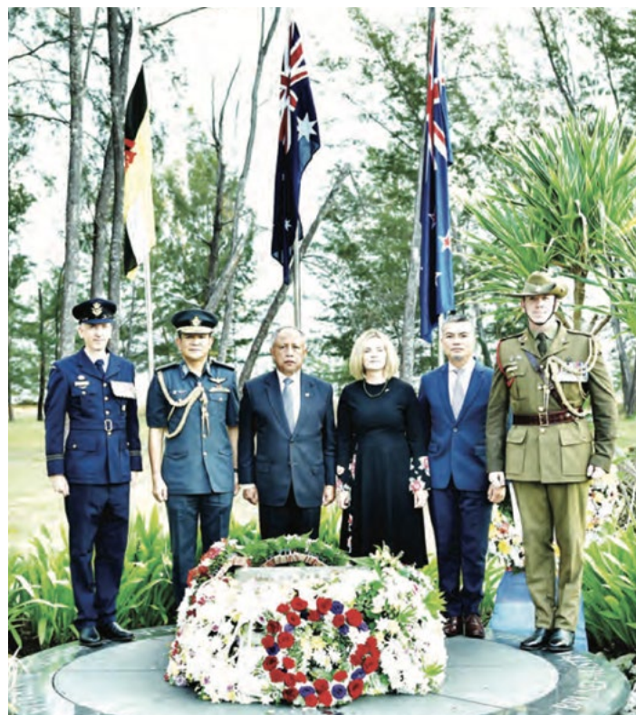
A group photo at the Brunei-Australia Memorial at Muara Beach in conjunction with Anzac Day.