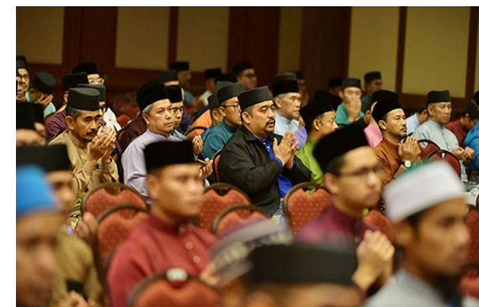
Among the attendees of the National Level Nuzul Al-Quran Celebration for 1442 Hijrah.