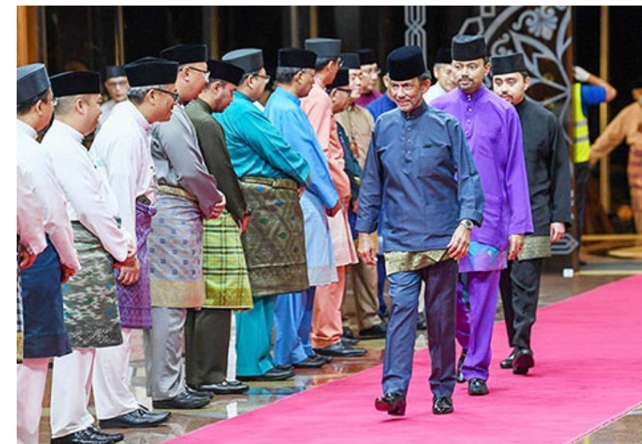
His Majesty the Sultan and Yang Di-Pertuan of Brunei Darussalam; His Royal Highness Prince Haji Al-Muhtadee Billah, the Crown Prince and Senior Minister at the Prime Minister's Office; and His Royal Highness Prince 'Abdul Malik gracing the National Level Nuzul Al-Quran Celebration for 1442 Hijrah.

His Majesty then presented prizes to the winners of the National Musabaqah Al-Quran Memorisation and its Understanding for 1442 Hijrah/2021 Masihi.