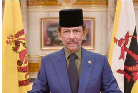
14. Be grateful of the Almighty's blessing