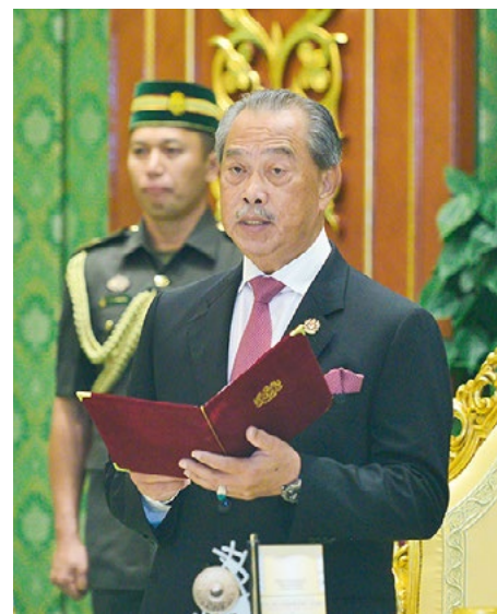
Yang Amat Berhormat Tan Sri Muhyiddin Yassin, the Prime Minister of Malaysia delivering his speech.

The titah was followed by a speech from Yang Amat Berhormat. Yang Amat Berhormat in his speech stated that the close cooperative relationship, especially in the economic field will be further enhanced and strengthened between