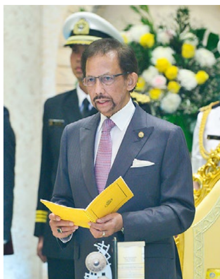
His Majesty Sultan Haji Hassanal Bolkhiah Mu'izzaddin Waddaulah ibni Al-Marhum Sultan Haji Omar 'Ali Saifuddien Sa'adul Khairi Waddien, Sultan and Yang Di-Pertuan of Brunei Darussalam delivering a titah (royal speech).

chairman of ASEAN, Brunei will focus its attention and efforts towards improving the regional situation and ensuring the achievement of the ASEAN vision 2025.