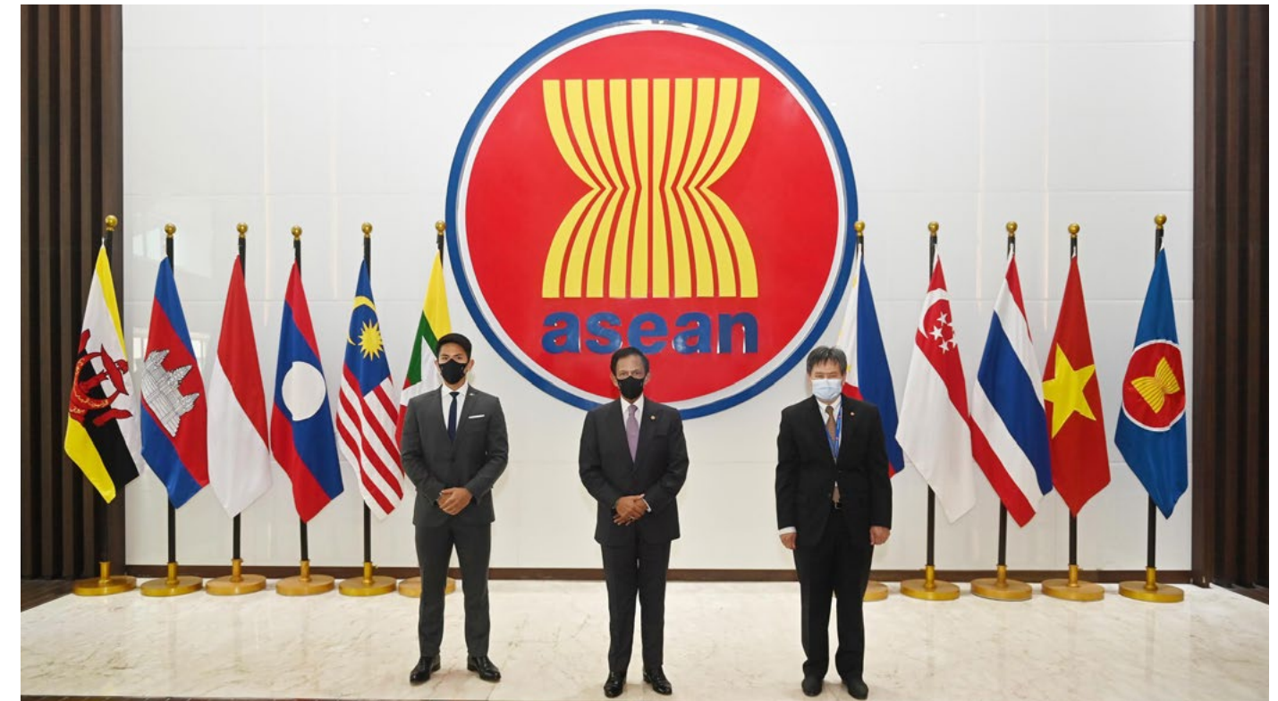
His Majesty the Sultan and Yang Di-Pertuan of Brunei Darussalam, His Royal Highness Prince 'Abdul Mateen and His Excellency Secretary-General of ASEAN in a group photo.