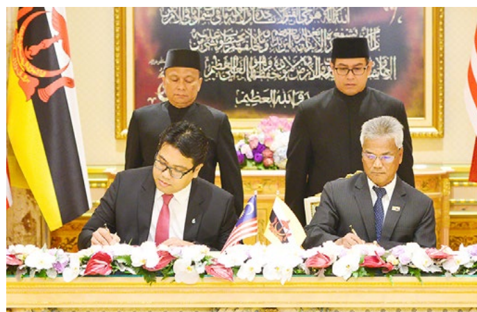
Yang Mulia Acting Minister of Energy and the President and the Chief Executive Officer PETRONAS signing the Letter of Acknowledgement between the Brunei National Unitisation Secretariat and Petroleum National Berhad (PETRONAS).