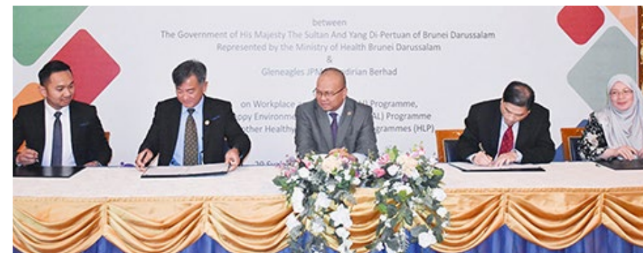
Yang Berhormat Minister of Health witnessing the signing of Memorandum of Understanding (MoU) between the Ministry of Health and Gleneagles JPMC Sdn. Bhd.

was attended by Yang Berhormat Dato Seri Setia Dr. Awang Haji Md. Isham bin Haji Jaafar, Minister of Health to witness the signing ceremony.