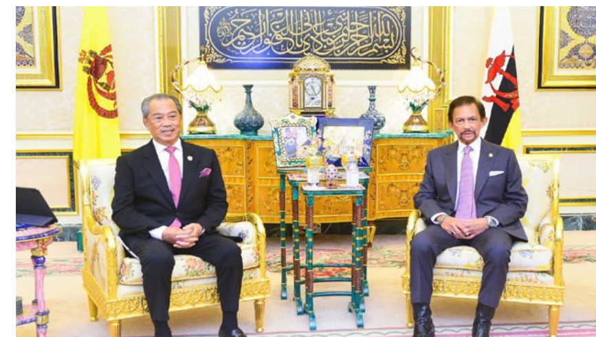
His Majesty Sultan Haji Hassanal Bolkih Mu'izzaddin Waddaulah ibni Al-Marhum Sultan Haji Omar 'Ali Saifuddin Sa'adul Khairi Waddien, the Sultan and Yang Di-Pertuan of Brunei Darussalam and Yang Amat Berhormat Tan Sri Muhyiddin Yassin, the Prime Minister of Malaysia during the Four-Eye Meeting.

BANDAR SERI BEGAWAN, April 5 - His Majesty Sultan Haji Hassanal Bolkih Mu'izzaddin Waddaulah ibni Al-Marhum Sultan Haji Omar 'Ali Saifuddin Sa'adul Khairi Waddien, the Sultan and Yang Di-Pertuan of Brunei Darussalam held a Four-Eye Meeting with Yang Amat Berhormat Tan Sri Muhyiddin Yassin, the Prime Minister of Malaysia at Cheradi Ratna Kenchana to start the 23 rd Annual Leaders' Consultation between Brunei Darussalam and Malaysia.