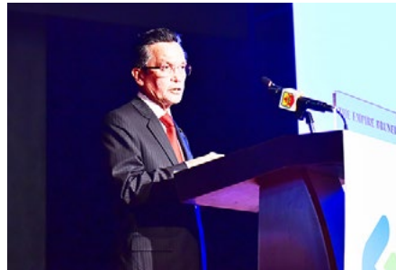
21. Diversify domestic investment opportunities