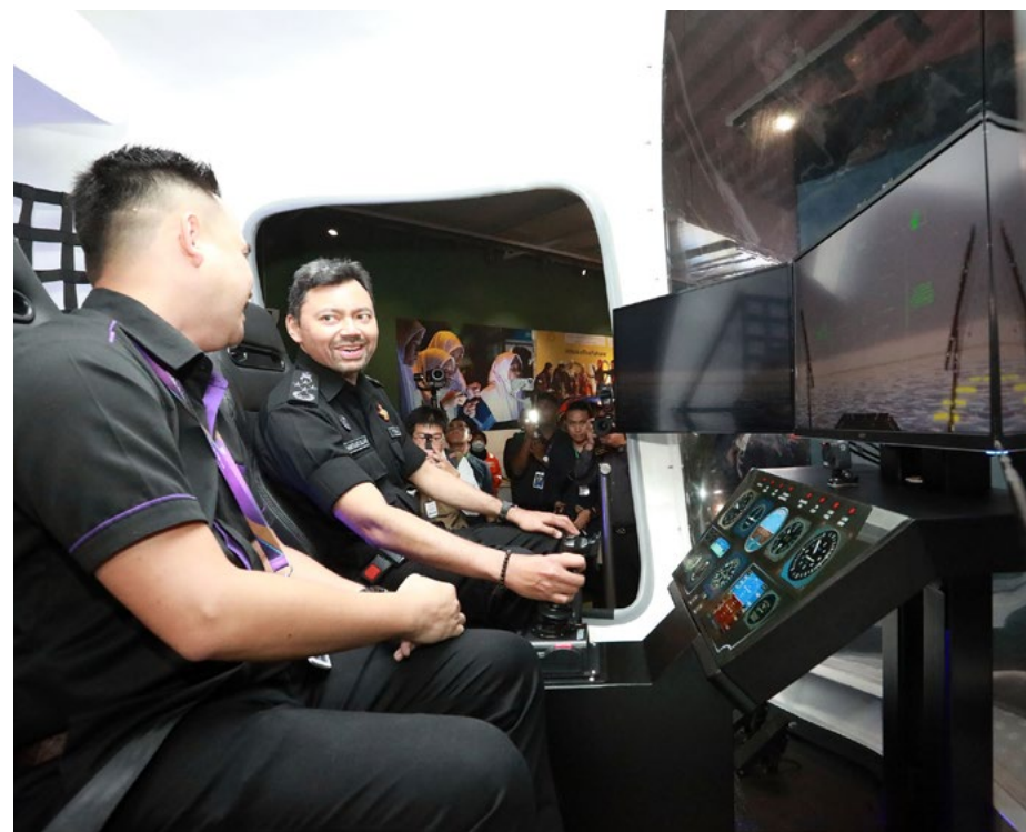
His Royal Highness the Crown Prince on the helicopter simulator.

His Royal Highness then officiated the opening of BSP's Flagship Solar 3.3 Megawatt Photo Voltaic Plant and was later briefed about the Solar Power Plant Project.