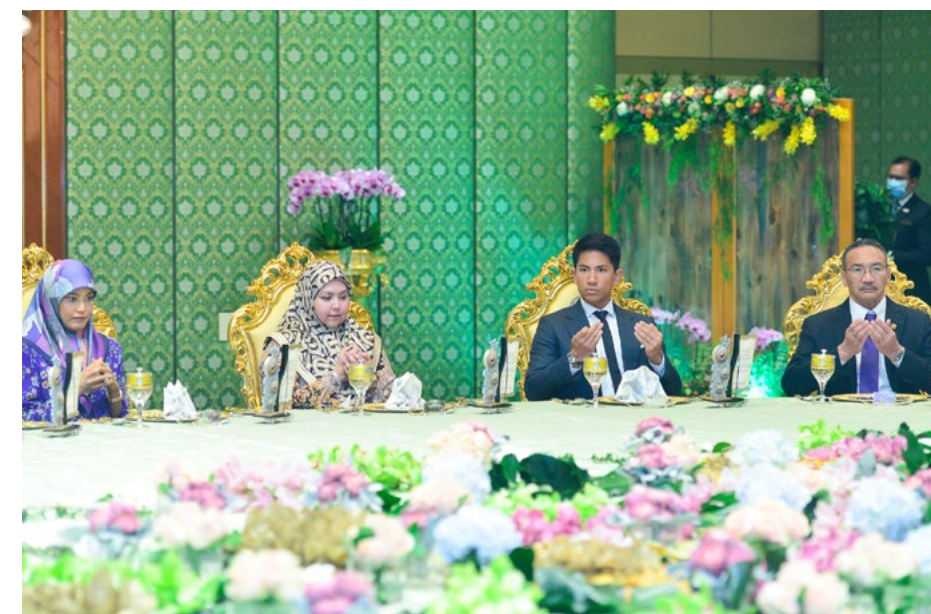
His Royal Highness Prince 'Abdul Mateen; Her Royal Highness Princess Hajah Rashidah Sa'adatul Bolkhiah; Her Royal Highness Princess Hajah Majeedah Nuurul Bolkhiah and Yang Berhormat Dato' Seri Hishammuddin Tun Hussein, Minister of Foreign Affairs of Malaysia during the Luncheon.

In his speech, Yang Amat Berhormat understood that more than 20,000 Malaysians who are in this country whether working, studying and doing business, appreciate and enjoy the