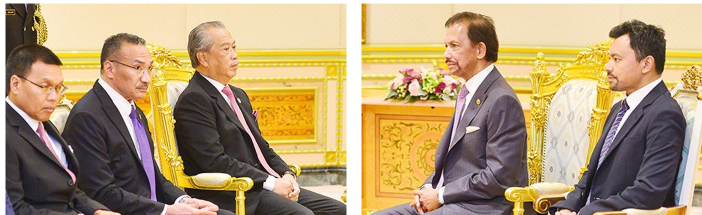
His Majesty Sultan Haji Hassanal Bolkiah Mu'izzaddin Waddaulah ibni Al-Marhum Sultan Haji Omar 'Ali Saifuddin Sa'adul Khairi Waddien, the Sultan and Yang Di-Pertuan of Brunei Darussalam witnessing the signing of the MoU and Letter of Acknowledgment between the two governments together with Yang Amat Berhormat Prime Minister of Malaysia. Also in attendance was His Royal Highness Prince Haji Al-Muhtadee Billah, the Crown Prince and Senior Minister at the Prime Minister's Office.

BANDAR SERI BEGAWAN, April 5 - The signing of both Memorandum of Understanding (MoU) and the Letter of Acknowledgement between the Government of His Majesty the Sultan and Yang Di-Pertuan of Brunei Darussalam and Government of Malaysia took place at Baitul Mesyuarah, Istana Nurul Iman.