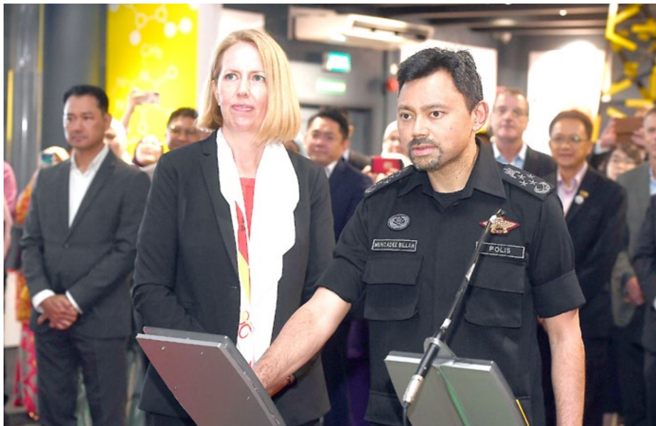
His Royal Highness Prince Haji Al-Muhtadee Billah ibni His Majesty Sultan Haji Hassanal Bolkiah Mu'izzaddin Waddaulah, the Crown Prince and Senior Minister at the Prime Minister's Office, as Chairman of the Board of Directors of the Brunei Shell Joint Venture Companies officiating the opening of Seria Energy Lab.

The Official Opening Ceremony of Seria Energy Lab took place at the Seria Energy Lab Exhibition Hall.