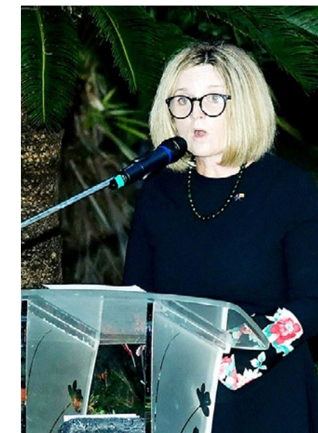
Her Excellency High Commissioner of Australia to Brunei Darussalam delivering her welcoming speech.

The event also witnessed the flags of Australia and New Zealand hoisted at the memorial to commemorate the services of Australians and New Zealand men and women who have been and continue to fight and serve worldwide.