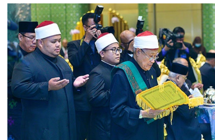
The recitation of a doa selamat by Yang Berhormat the State Mufti.