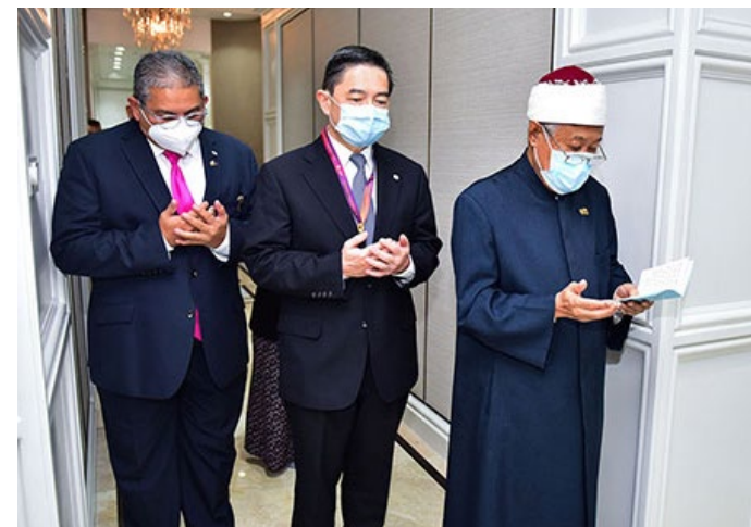
Prior to leaving the hotel, a doa selamat was recited by Yang Berhormat the State Mufti. Also present were Yang Berhormat Minister at the Prime Minister's Office and Second Minister of Finance and Economy; and Yang Berhormat Second Minister of Foreign Affairs.

After the meeting, a Chairman's Statement on the ASEAN Leaders' Meeting was issued. The ASEAN Leaders' Meeting is a significant milestone for ASEAN as it was held at the ASEAN Secretariat for the first time since the establishment of ASEAN on