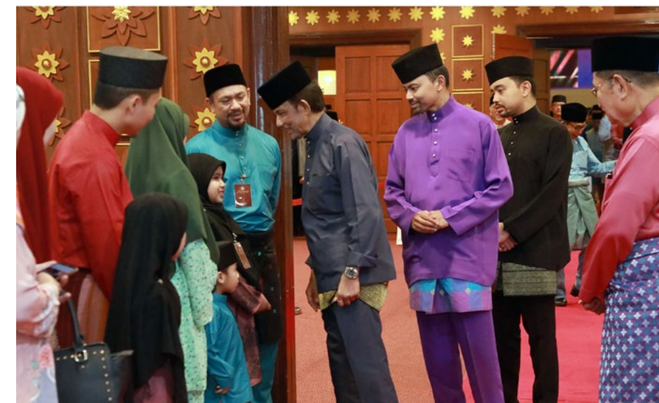
His Majesty interacting with one of the participants with her family (above), and His Majesty in a group photo with one of the participants and his family (below).

The theme, among others, outlines that the world's affairs is one of the Fardu Kifayah imposed on Muslims as there are many necessary infrastructure in human life to attain al-falah , which is success in this world and the hereafter, as well as preserving the well-being of the universe. This includes human physical sufficiency and serenity of life that can be found through the balance of material needs and human spiritual needs.