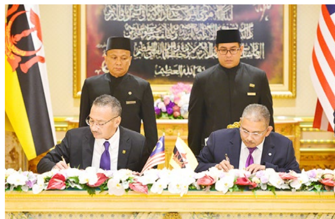
Yang Berhormat Second Minister of Foreign Affairs and Yang Berhormat Minister of Foreign Affairs of Malaysia signing the Memorandum of Understanding on Cooperation in Disaster Management.