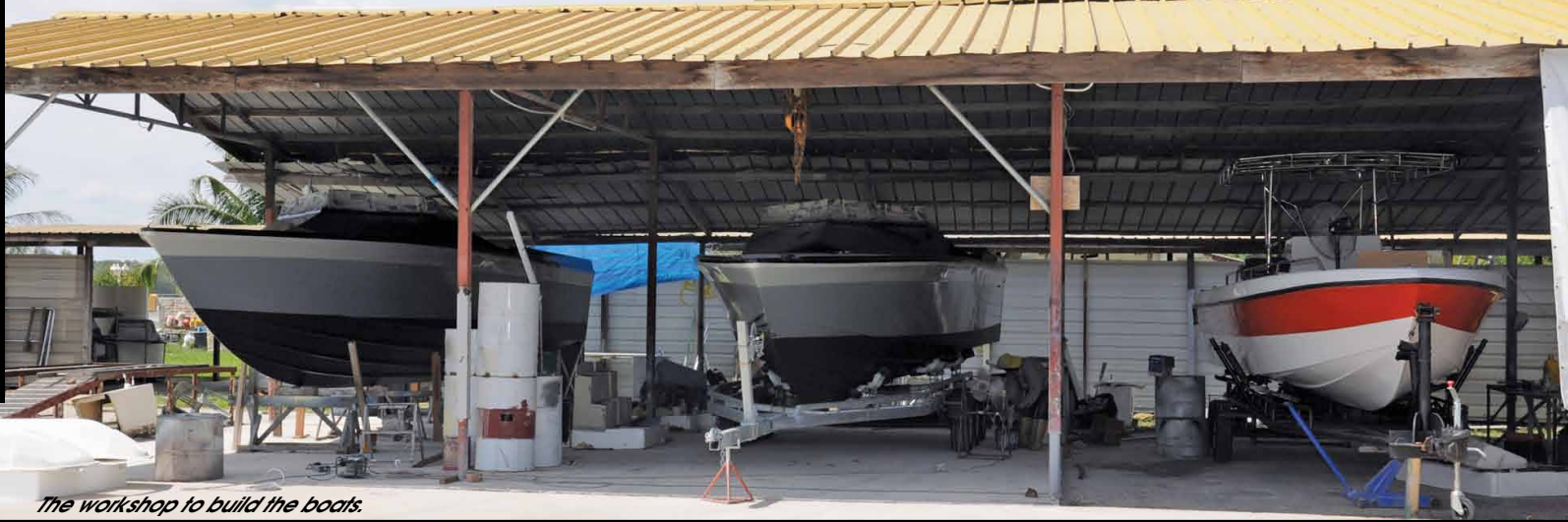
The workshop to build the boats.

As a non-seasonal business, Perusahaan Seri Melati not only offers fiberglass boat-making and repairs but also received demands for making fiberglass related products.