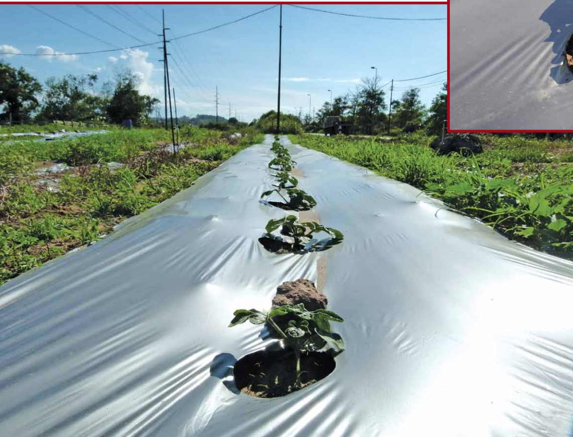
Growing watermelon may take up to 120 days (until harvesting) depending on the location of planting. Pictures show watermelon seedlings.