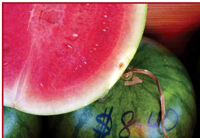
The watermelon rinds are also cooked as vegetables.

She further stated that the major problem is fungal disease especially during rainy and windy season. There was a time where all crops were damaged due to the disease and she needed to replant the seedlings.