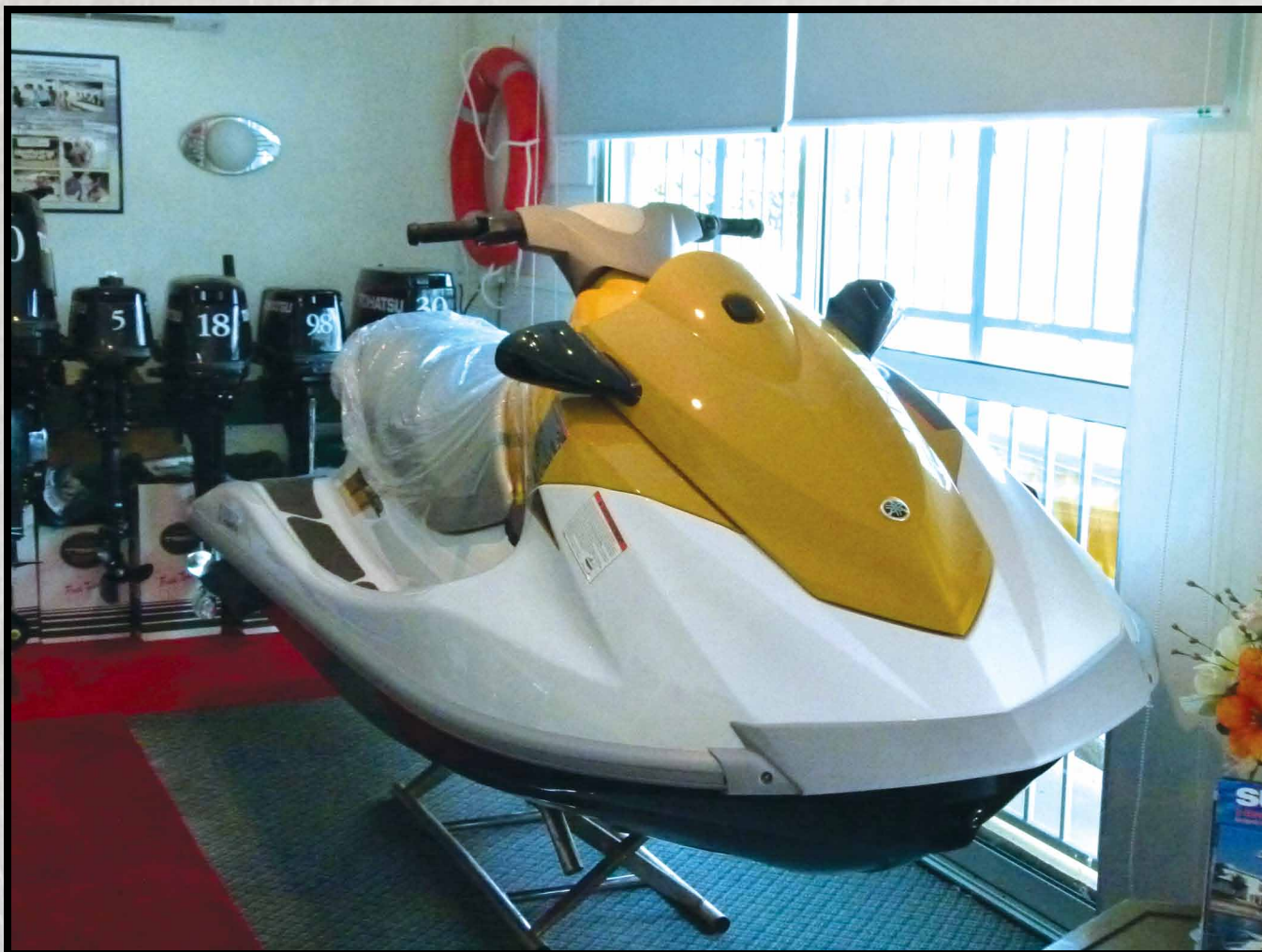
Jet Ski, one of Perusahaan Seri Melati's products.