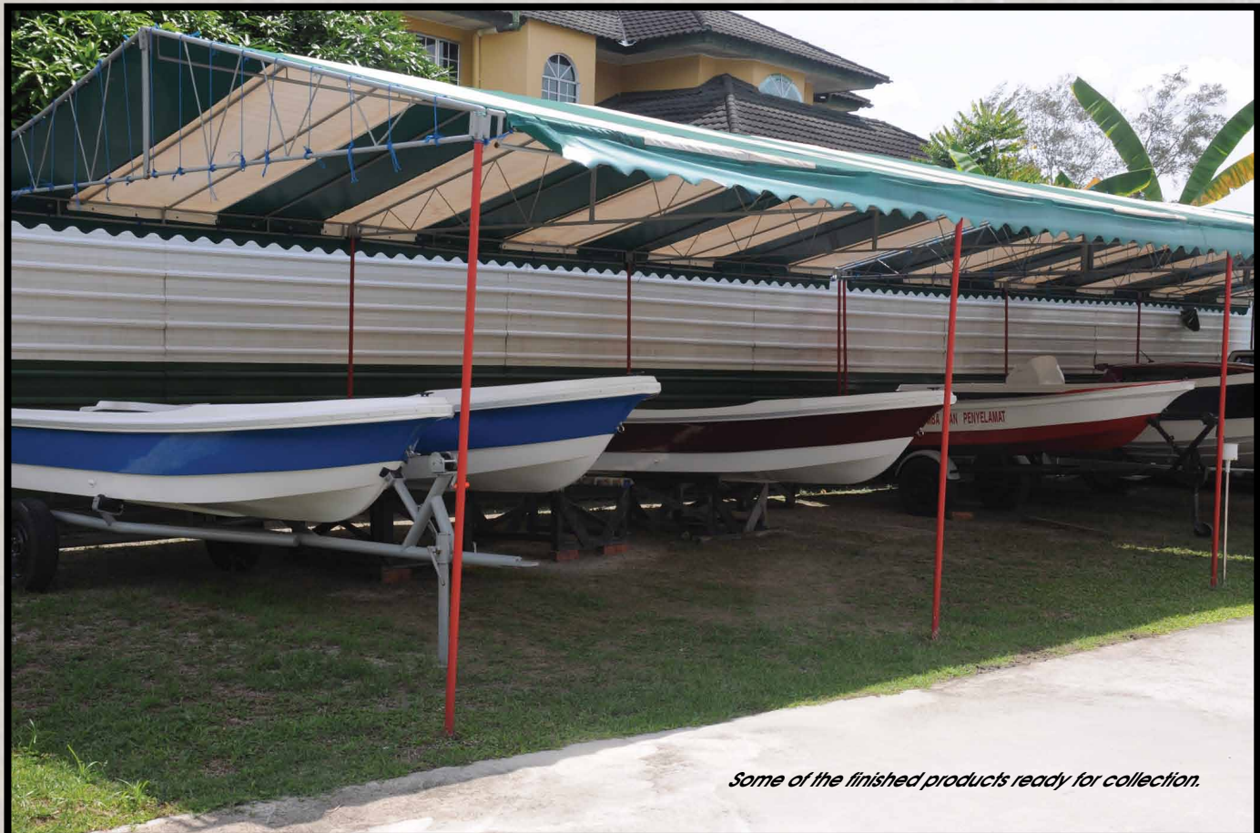
Some of the finished products ready for collection.

The mistakes in mixing the chemical and not according to right timing may lead to defect products," said Awang Haji Abd. Rashid.