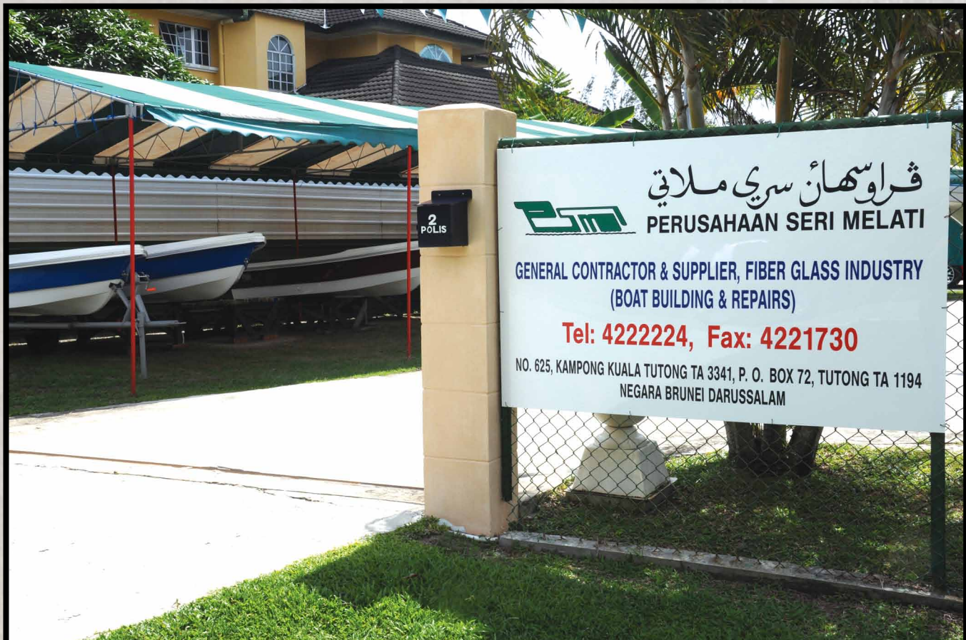
Perusahaan Seri Melati operating at this site since 1979.

At the time, most of the fiberglass boats in Brunei were imported from neighbouring countries as there was no respective enterprise established in Brunei.