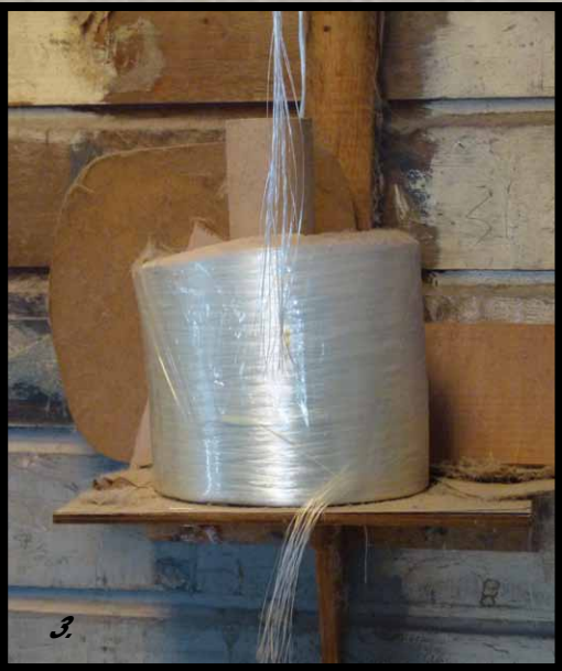
Pictures 1-3 : Some of the materials being used in the process of making fiberglass products.