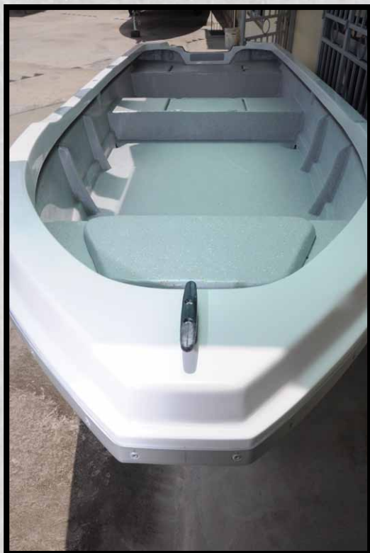
Another product of the enterprise.

The establishment of Perusahaan Seri Melati marked a milestone in the country's boat-making industry as the first fiberglass boat enterprise undertaken by local. Its establishment was very well received by public, government and private sectors.