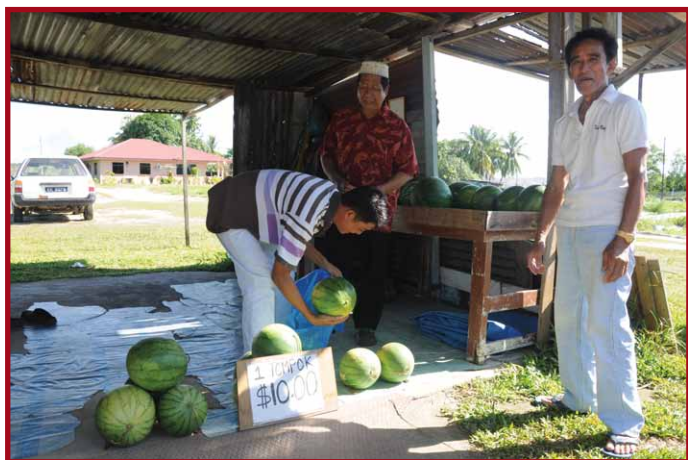
A customer purchasing watermelon.