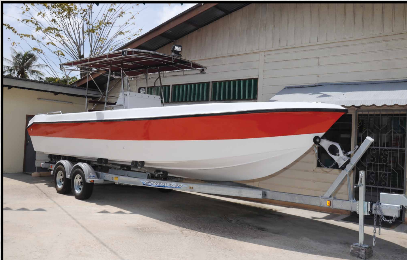
One of the fiberglass boat types produced at the enterprise.