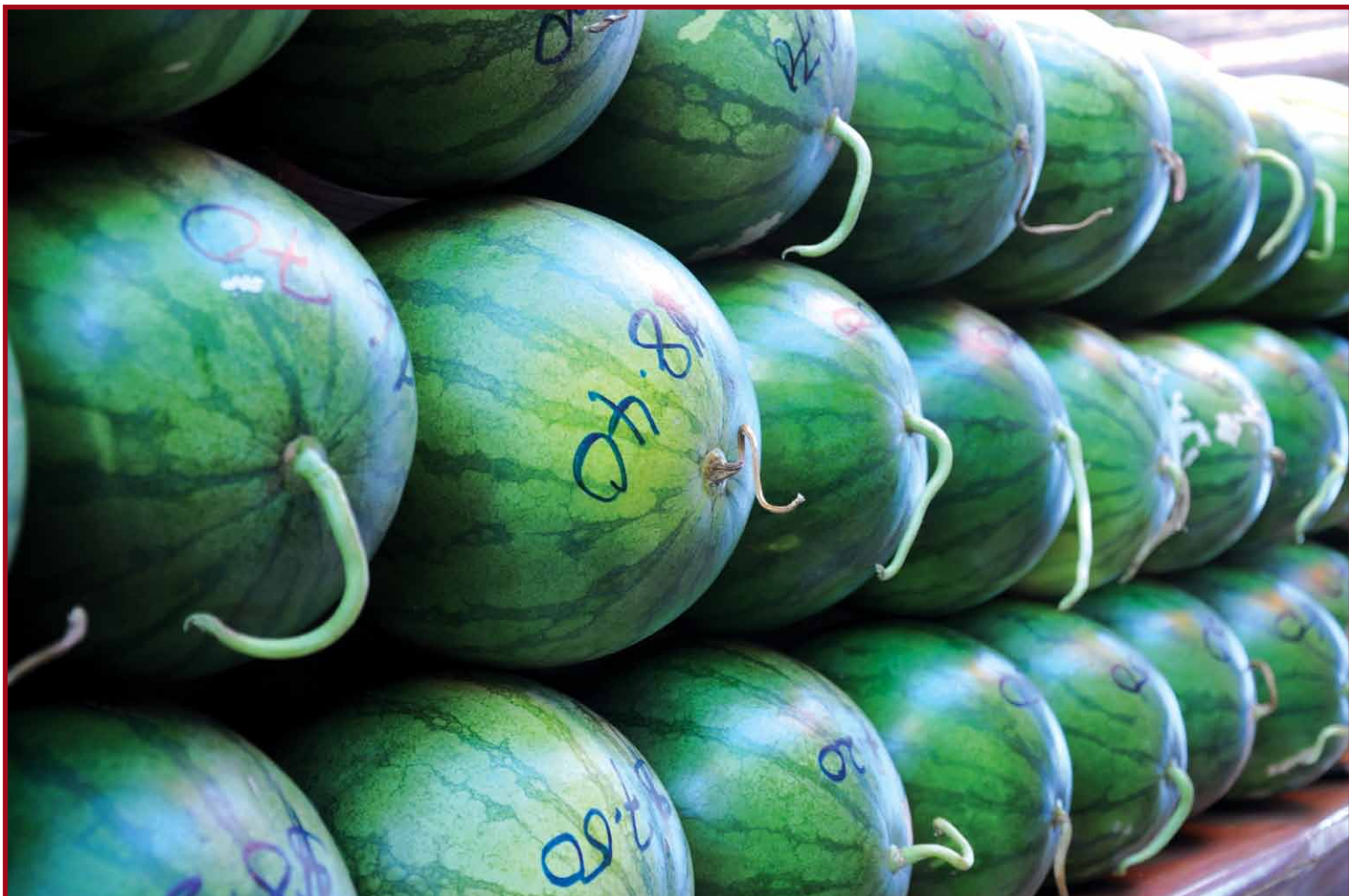
The watermelons are priced according to its weight.

He also expressed his hope that the farming of watermelon will gain more support from the relevant authority; among others is by providing appropriate land or area for farming.