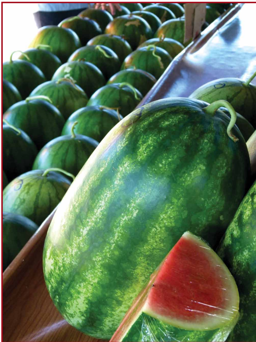
A sample of his watermelon on display at the stall.