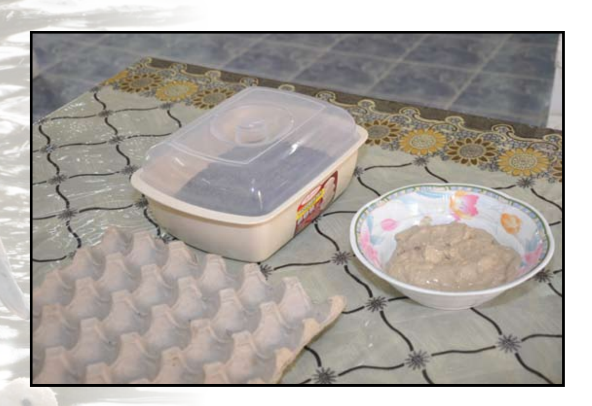
Salting the eggs using soil which has been mixed with paddy husks.