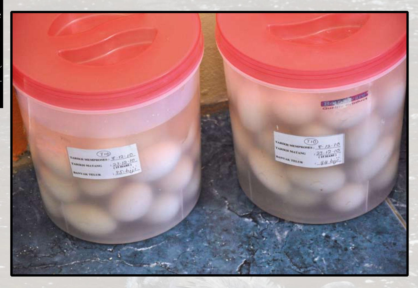
Another method of salting the eggs is by submerging the eggs in salt water where it will take a fortnight to complete.