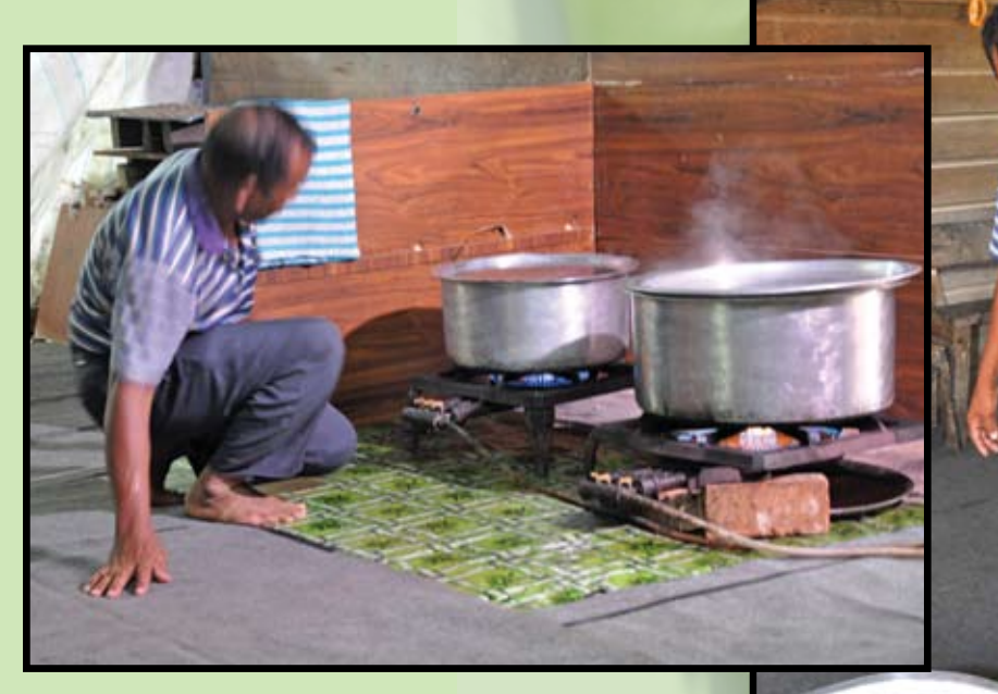
Coconut cream and Beras Jawa boiled and cooked separately.