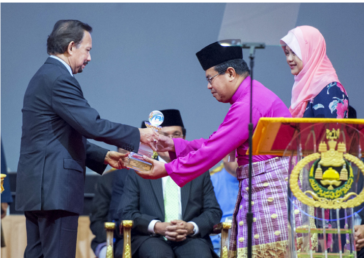
His Majesty presents an award at the 21 st Civil Service Day celebration held at the International Convention Centre in Berakas.

His Majesty was accompanied by His Royal Highness Prince Haji Al-Muhtadee Billah ibni His Majesty Sultan Haji Hassanal Bolkiah Mu'izzaddin Waddaulah, The Crown Prince and Senior Minister at the Prime Minister's Office; His Royal Highness Prince Mohamed Bolkiah ibni Al-Marhum Sultan Haji Omar 'Ali Saifuddien Sa'adul Khairi Waddien, the Minister of Foreign Affairs and Trade; His Royal Highness Prince Haji Sufri Bolkiah ibni Al-Marhum Sultan Haji Omar 'Ali Saifuddien Sa'adul Khairi Waddien and His Royal Highness Prince 'Abdul Malik ibni His Majesty Sultan Haji Hassanal