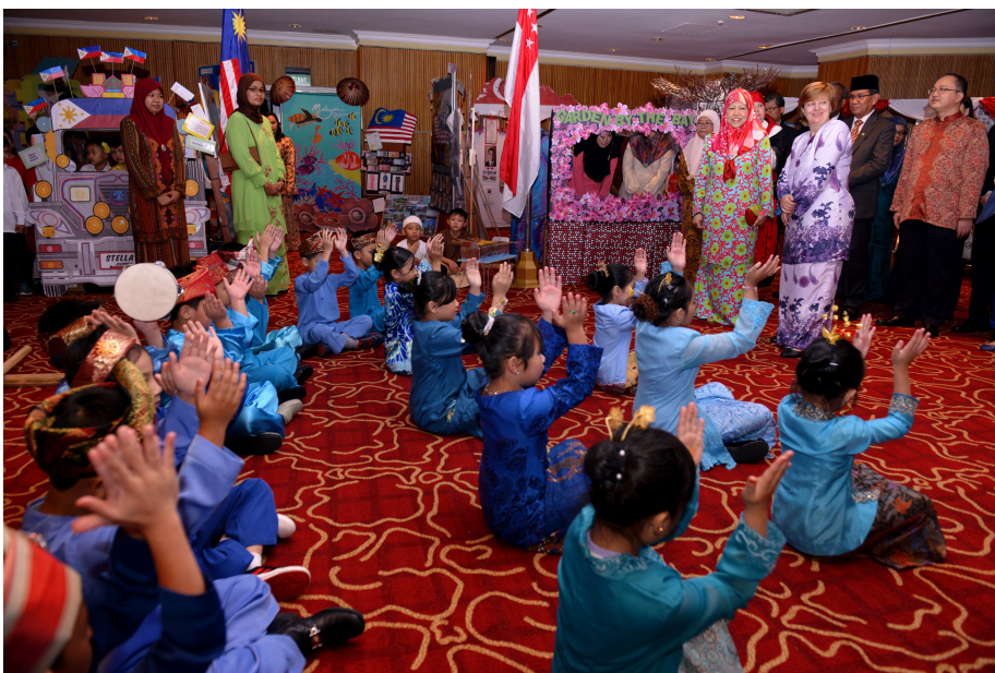
Her Royal Highness, as the Acting Minister of Foreign Affairs and Trade, graces the 'Around the World in Forty Minutes' exhibition organised by Stella School.