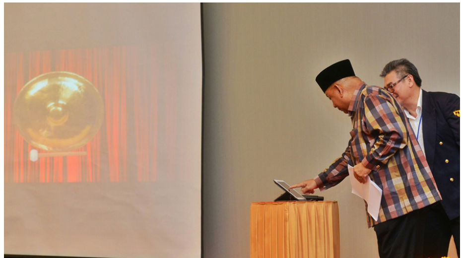
The Minister of Communications at the opening ceremony of the 4 th International Neural Network Society Symposia Series at the Parkview Hotel.

"We are fortunate to be able to witness the fastest and most fascinating in the development of technology, especially in the ICT sector. Brunei Darussalam does not want to be left behind and the symposium would enable us to engage