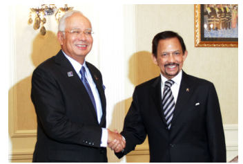
20 HM attends 18 th Annual Leaders' Consultation between Brunei Darussalam and Malaysia