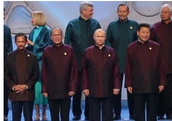
8 HM attends APEC Economic Leaders' Meeting 2014