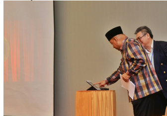
16 Minister launches 4 th International Neural Network Society Symposium