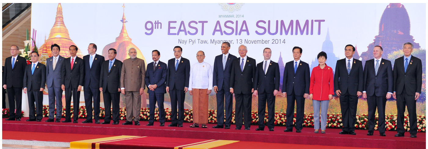
His Majesty The Sultan and Yang Di-Pertuan of Brunei Darussalam in a group photo with leaders at the 9 th East Asia Summit.