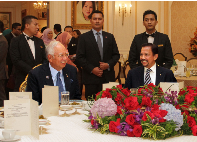
His Majesty with the Prime Minister of Malaysia during a luncheon.