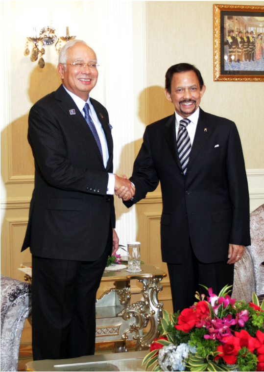
His Majesty shaking hands with the Prime Minister of Malaysia.