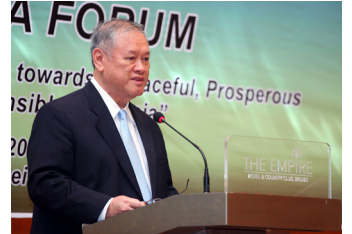
17 Minister attends 12 th East Asia Forum