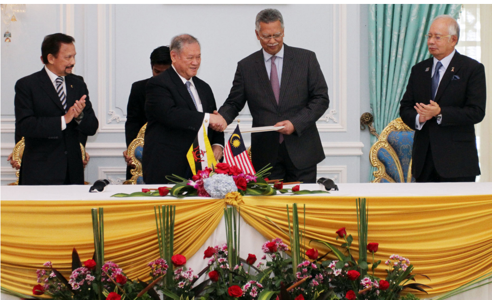
His Majesty and the Prime Minister of Malaysia witnessing the signing of the 'Joint Announcement by Petroleum Brunei and Petronas' between Brunei Darussalam and Malaysia.