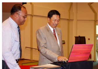
19 Minister urges public to monitor and safeguard children from online threats