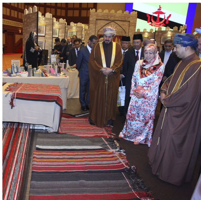
Her Royal Highness observes the Oman Cultural Week exhibition at the International Convention Centre in Berakas.

Three main activities involving art and heritage exhibition as well as cultural performances and seminars have been organised for the cultural week.