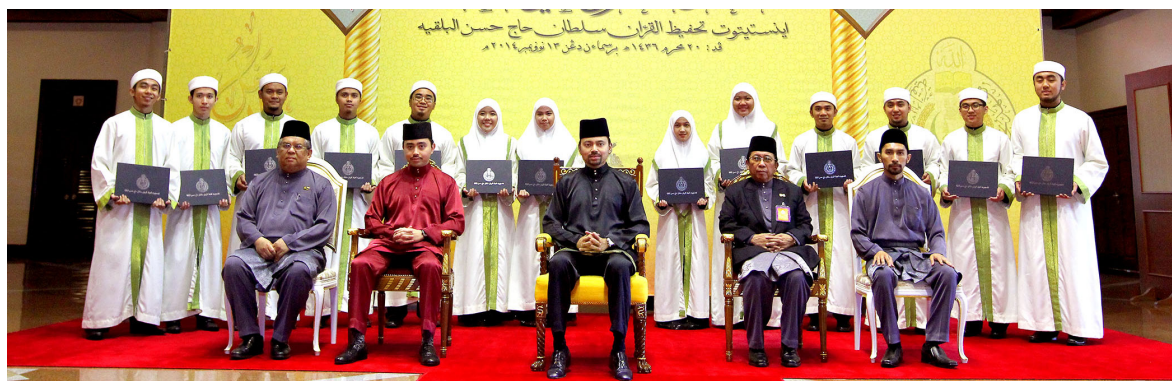
His Royal Highness The Crown Prince and His Royal Highness Prince 'Abdul Malik in a group photo with the ITQSHHB graduates.

Earlier, Their Royal Highnesses were greeted upon arrival by the Minister of Home Affairs, The Honourable Pehin Udana Khatib Dato Paduka Seri Setia Ustaz Haji Awang Badaruddin bin Pengarah Dato Paduka Haji Awang Othman and members of the Knowledge Convention 2014 Steering Committee.