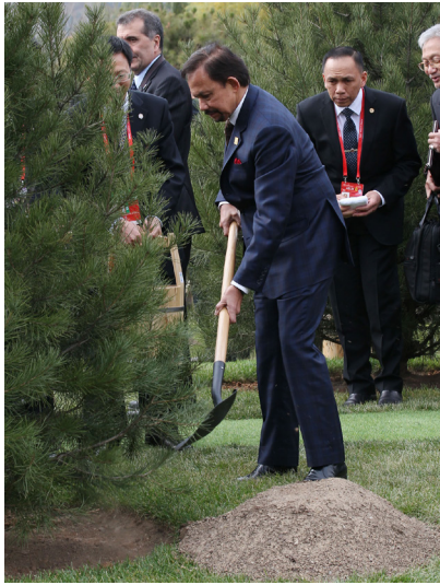
His Majesty attends the tree-planting ceremony in Summer Garden, Yanqi Lake.