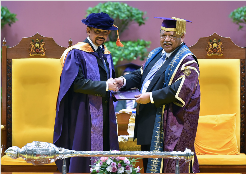
His Majesty The Sultan and Yang Di-Pertuan of Brunei Darussalam receives the Honorary Doctorate of Law from Universiti Sains Malaysia's Chancellor, His Royal Highness The Raja of Perlis.