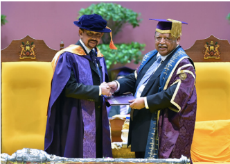
1 HM receives Honorary Doctorate of Law