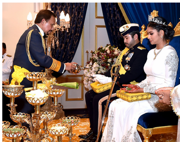
Their Majesties lead the Merenjis and Menepung Tawar ceremony at the Istana Besar Johor Bahru.

The banquet commenced with an opening doa read by the Mufti of Johor Darul Ta'zim.