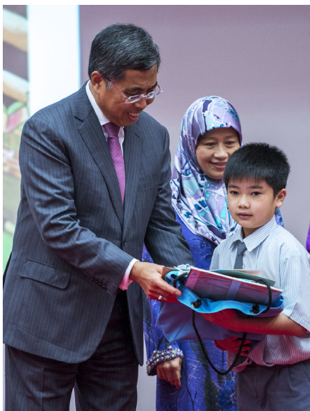
The Minister of Health awards a prize to one of the winners of the Children's Art Competition.