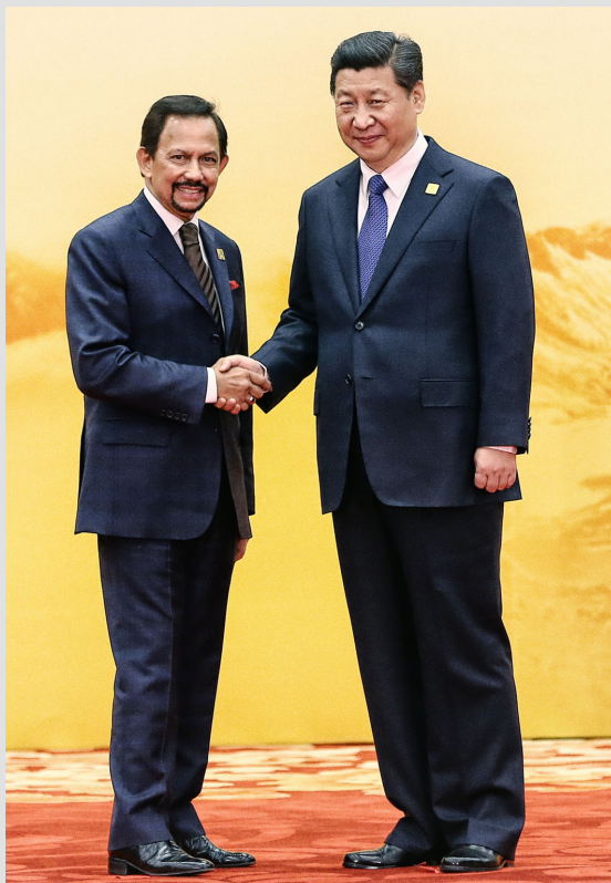
His Majesty The Sultan and Yang Di-Pertuan of Brunei Darussalam and the President of the People's Republic of China at the 22 nd APEC Economic Leaders' Meeting in Beijing.