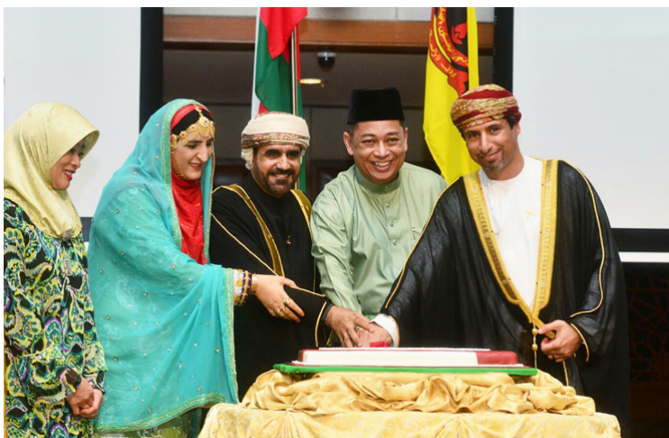
The Minister of Energy at the Prime Minister's Office cutting a cake to commemorate the Sultanate of Oman's 44 th National Day.