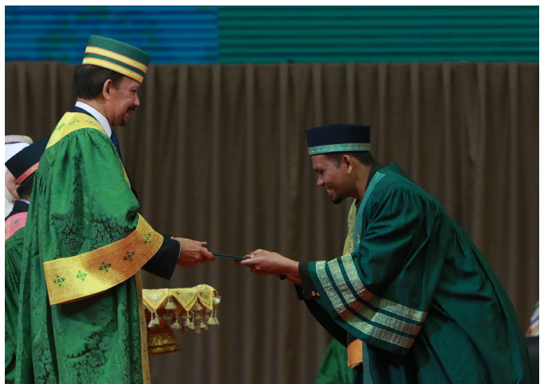
His Majesty awards one of the 115 UNISSA graduates at the International Convention Centre in Berakas.

In this regard, His Majesty is supportive of UNISSA's efforts in strengthening and empowering the Mazhab (sect)