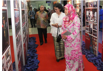
15 HRH tours Brunei-Indonesia 30 th anniversary exhibition