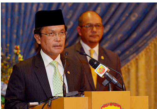
The Minister of Education delivers a speech at the Early Childhood Care and Education International Conference.

The conference was themed 'First Steps to Nurturing Future Leaders', which is highly relevant and timely as the goals for provision of quality early childhood education and care have been identified as policy priorities by our government and those around the world, said the minister.