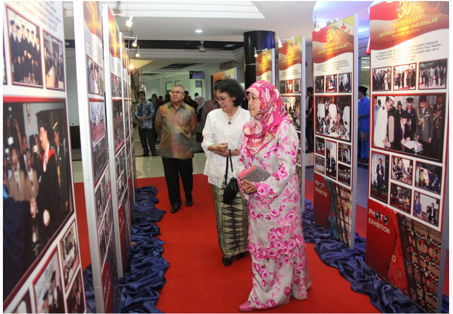
Her Royal Highness tours the exhibition held to commemorate the 30 th anniversary of Brunei-Indonesia relations at the International Convention Centre.

At the celebration, Her Royal Highness watched six colourful Indonesian dances and cultural performances by Kotabaru Regency.