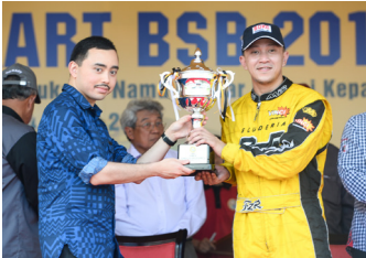
14 HRH Prince 'Abdul Malik graces Go-kart Championship