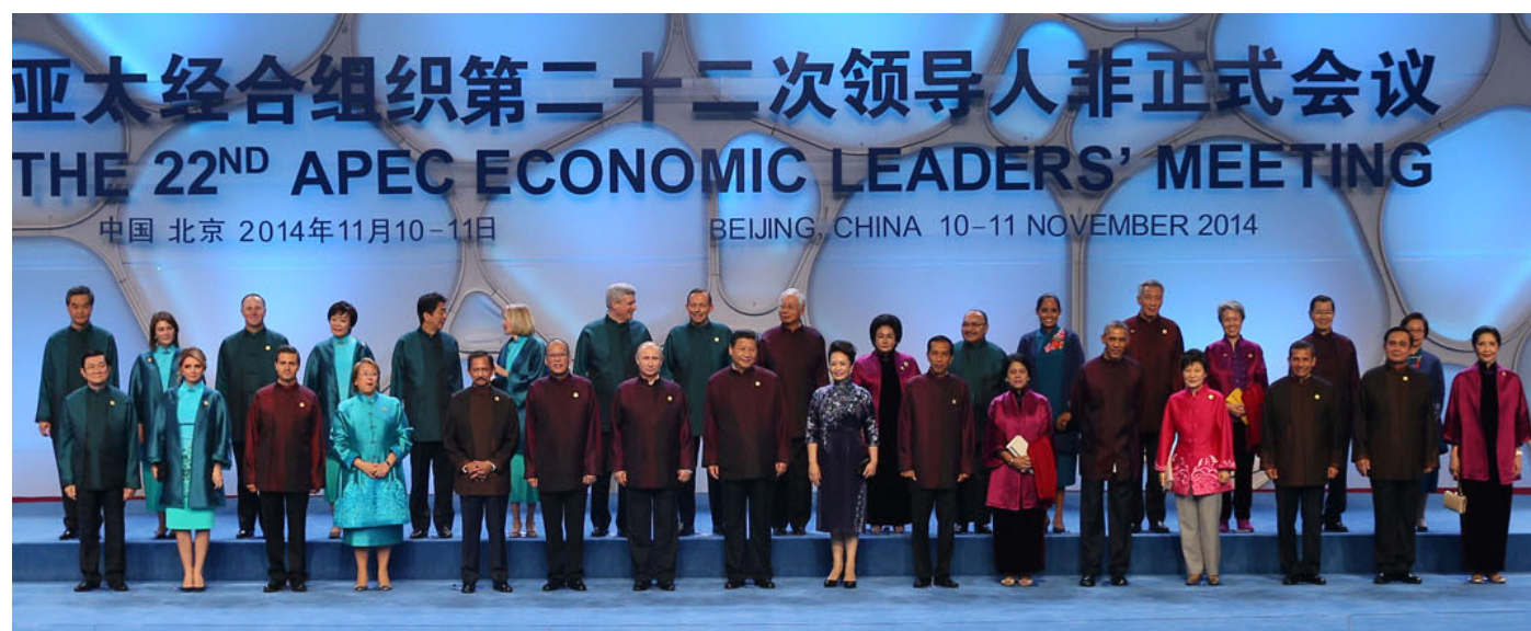
His Majesty The Sultan and Yang Di-Pertuan of Brunei Darussalam in a group photo with leaders at the welcoming dinner for the 22 nd APEC Economic Leaders' Meeting 2014.