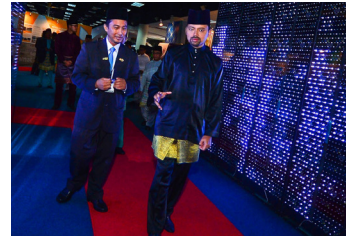
13 HRH The Crown Prince graces Knowledge Convention 2014