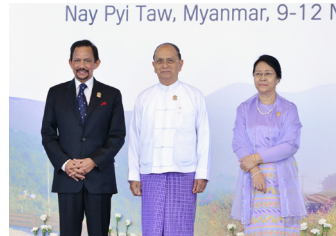
10 HM attends 25 th ASEAN Summit and related meetings in Republic of the Union of Myanmar