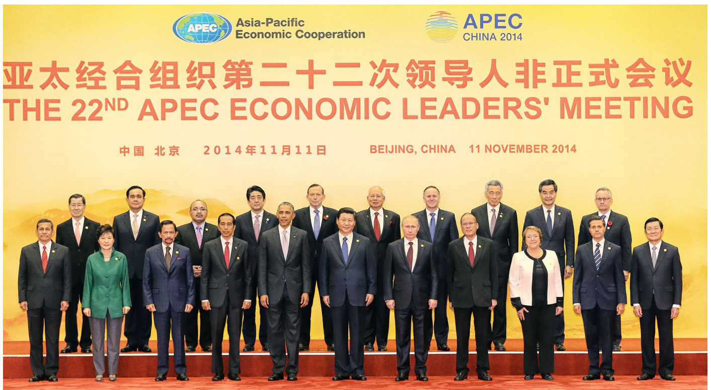
His Majesty in a group photo with leaders at the 22 nd APEC Economic Leaders' Meeting.