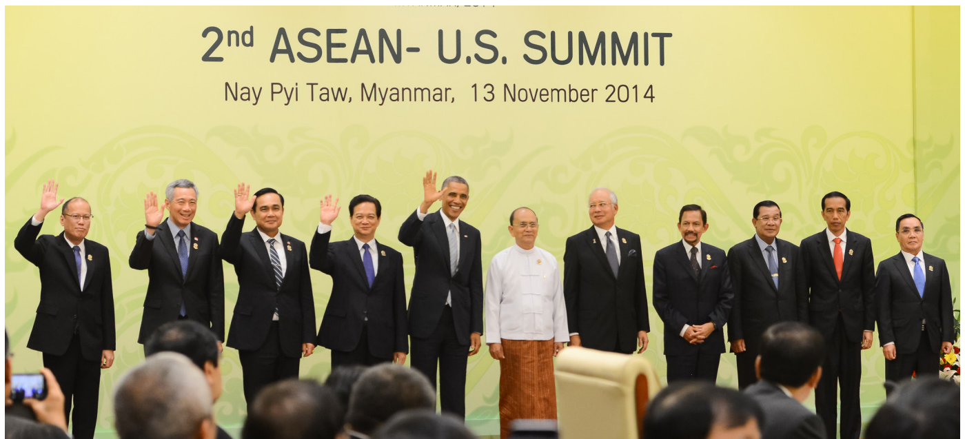
His Majesty The Sultan and Yang Di-Pertuan of Brunei Darussalam in a group photo with leaders at the end of US-Asean Summit.