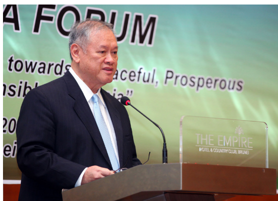
The Minister of Foreign Affairs and Trade II delivers an opening speech at the 12 th East Asia Forum at the Empire Hotel and Country Club.

JERUDONG, November 17- The Minister of Foreign Affairs and Trade II, The Honourable Pehin Orang Kaya Pekerma Dewa Dato Seri Setia Lim Jock Seng attended the 12 th East Asia Forum hosted by Brunei Darussalam for the first time at the Empire Hotel and Country Club.