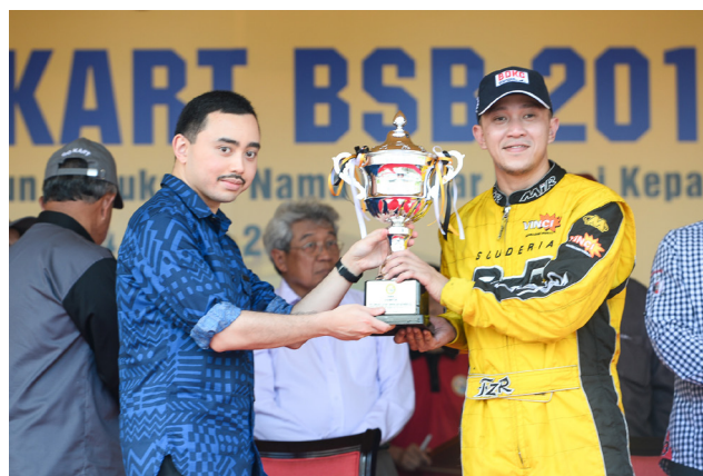
His Royal Highness presents a trophy to one of the go-kart championship winners.

Prior to leaving the event, His Royal Highness received a pesambah (gift) and observe the other side events such as the charity sale, the Brunei Strongest Man competition, Brunei DJ competition, Tamiya competition as well as a bazaar.