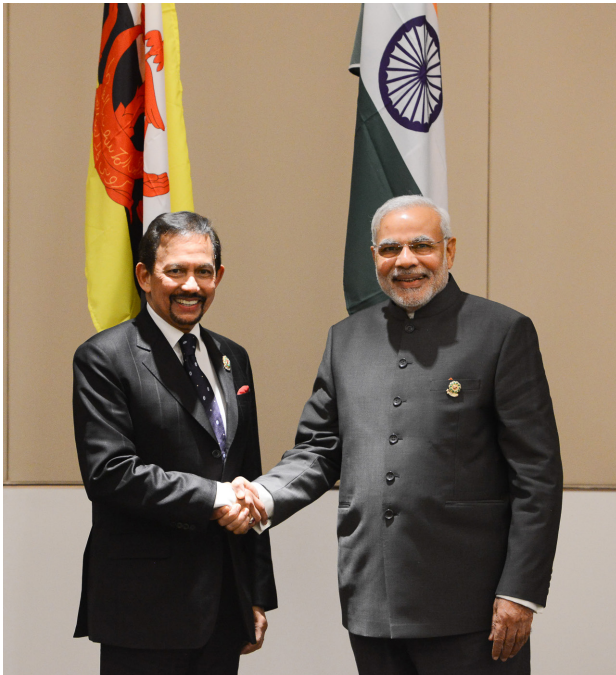
His Majesty The Sultan and Yang Di-Pertuan of Brunei Darussalam with His Excellency Narendra Modi, the Prime Minister of the Republic of India.

* From page 10 (His Majesty attends 25 th ASEAN Summit and related meetings in Republic of the Union of Myanmar)