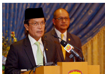
18 Minister: Investing in early childhood education a priority