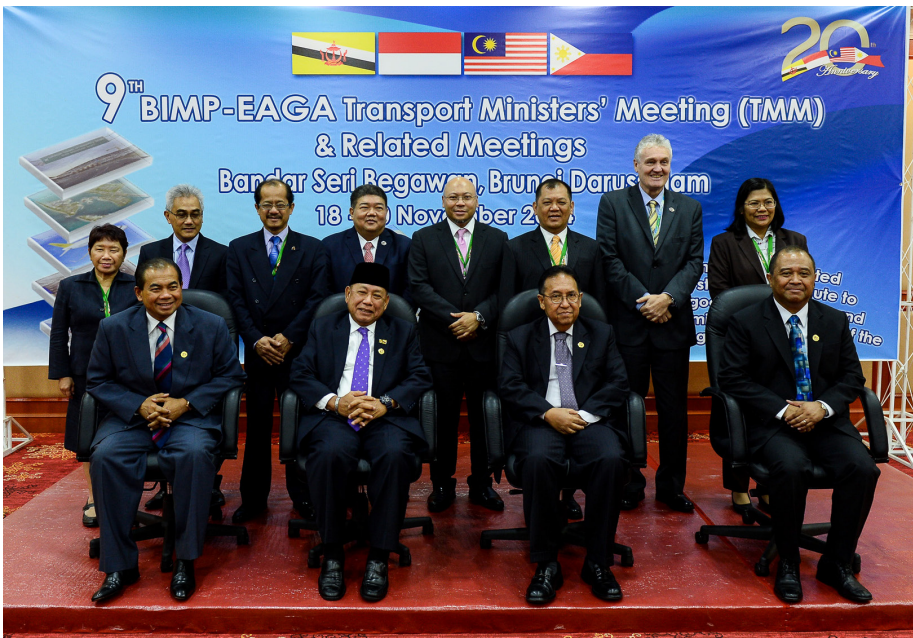
The Minister of Communications with leaders at the 9 th BIMP-EAGA Transport Ministers' Meeting.

Today, he said, many roads and bridges have been built in addition to an increase in air links.