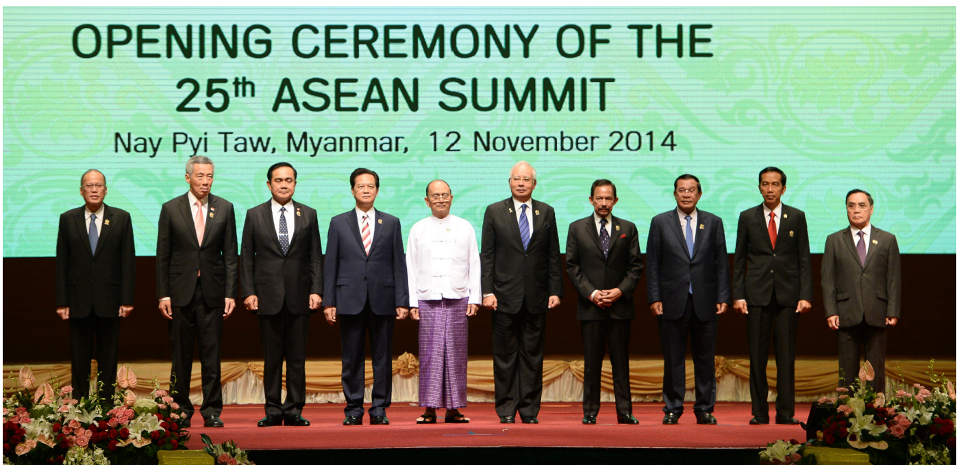
His Majesty with leaders at the opening ceremony of the 25 th ASEAN Summit in Nay Pyi Taw, Myanmar.