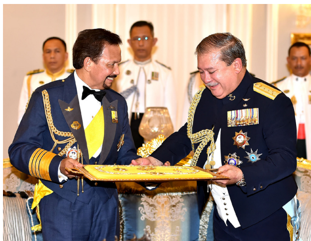
His Majesty confers the Darjah Kerabat Mahkota Brunei upon the Sultan of Johor Darul Ta'zim at the Istana Besar Johor Bahru.

JOHOR DARUL TA'ZIM, November 8 – His Majesty Sultan Haji Hassanal Bolkiah Mu'izzaddin Waddaulah ibni Al-Marhum Sultan Haji Omar 'Ali Saifuddien Sa'adul Khairi Waddien, The Sultan and Yang Di-Pertuan of Brunei Darussalam consented to confer the Darjah Kerabat Mahkota Brunei (D.K.M.B.) upon His Royal Highness Sultan Ibrahim ibni Al-Marhum Sultan Iskandar, the Sultan of Johor Darul Ta'zim at the Istana Besar Johor Bahru.