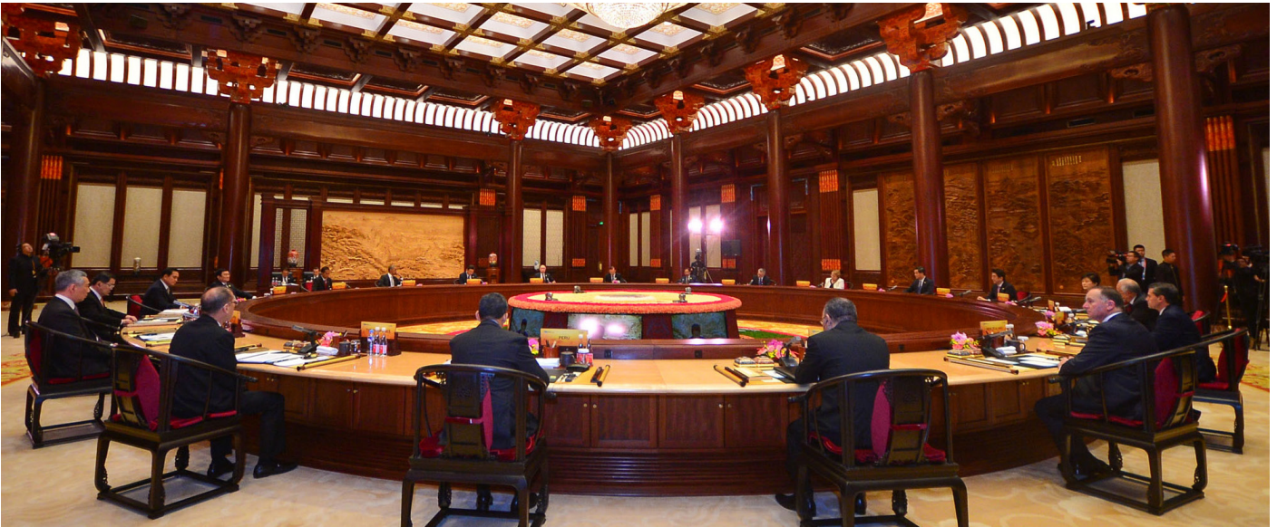
World leaders attend the first Retreat session of 22 nd APEC Economic Leaders' Meeting.