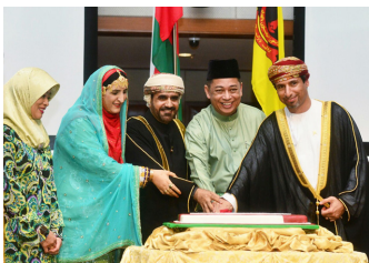
17 Embassy of Sultanate of Oman celebrates sultanate's 44 th National Day