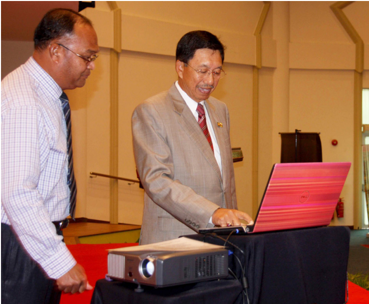
The Minister of Culture, Youth and Sports officiates the launch of the Universal Children's Day in Belait District.

KUALA BELAIT, November 20 - The Minister of Culture, Youth and Sports urged the public, particularly parents, to increase their monitoring and protect children from online threats and violence when the youngsters surf the Internet.