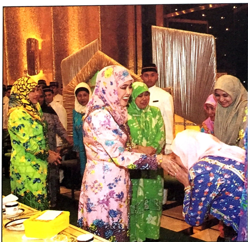
Her Majesty Raja Isteri Pengiran Anak Hajjah Saleha, Her Royal Highness Pengiran Isteri Hajjah Mariam and other members of the royal family listening to a talk by a guest speaker from Malaysia at this year's Israk Mikraj celebration, above, while below shows Her Majesty and Her Royal Highness consenting to receive greetings from those present at the gathering.