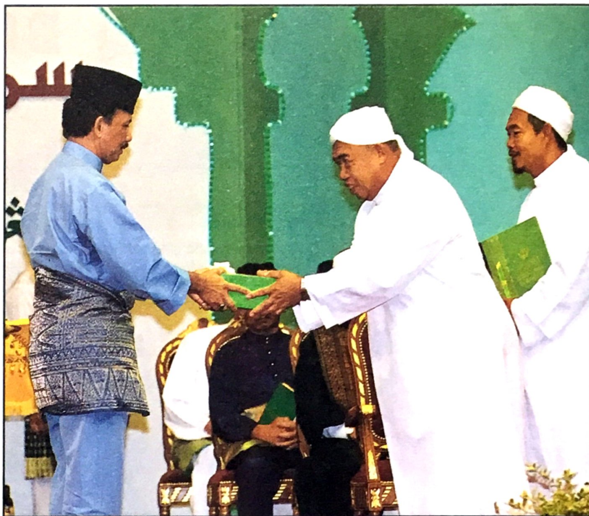
His Majesty The Sultan and Yang Di-Pertuan of Brunei Darussalam presents the 'Takmir Masjid' award to the imam of Mohammad Jamalul Alam mosque which won the category for main mosques. The presentation of award to mosques was the highlight of the celebration. There were altogether four categories and mosques were adjudged on such merits as their activities, maintenance etc.

A ny unhealthy culture or influence regardless of its origin is a scourge that must be stopped, His Majesty The Sultan and Yang Di-Pertuan of Brunei Darussalam has said.