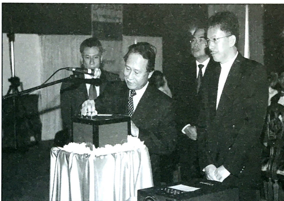
The Communications Minister, Yang Berhormat Pehin Dato Awang Haji Zakaria launches the 'Simpur.net', another Internet service provided by Data Stream Technology (DST).

e-home costs $44.99 and includes two e-mail addresses with up to 10mb POP and web mail disk space for each