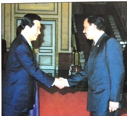
His Majesty being welcomed by His Excellency Mr. Kim Dae-jung during the dinner

* From centre page ( Third ASEM Summit )