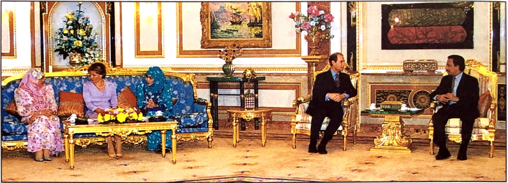
His Majesty Sultan Haji Hassanal Bolkiah Mu'izzaddin Waddaulah, The Sultan and Yang Di-Pertuan of Brunei Darussalam in conversation with His Royal Highness Prince Edward, Earl of Wessex, while Her Majesty Raja Isteri Pengiran Anak Hajjah Saleha and Her Royal Highness Pengiran Isteri Hajjah Mariam converse with his wife, Her Royal Highness Princess Sophie, The Countess of Wessex, during an audience at Istana Nurul Iman.

Their Royal Highnesses Prince Edward and Princess Sophie, the Earl and Countess of Wessex began a three-day visit to Brunei Darussalam on 25 October.