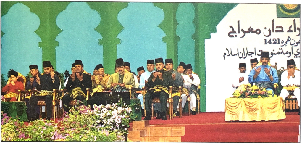
His Majesty Sultan Haji Hassanal Bolkiah Mu'izzaddin Waddaulah, The Sultan and Yang Di-Pertuan of Brunei Darussalam, together with Their Royal Highnesses Crown Prince Haji Al-Muhtadee Billah, Prince Mohamed Bolkiah, Prince Haji Sufri Bolkiah, Prince 'Abdul Malik and Prince 'Abdul Mateen sit in homage of the do'a read by the State Mufti.

* From page 2 (Israk Mikraj celebration)