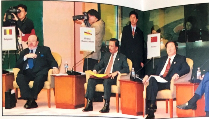
His Majesty together with other leaders during the 2nd Session of the Closed Meeting held at COEX Convention Centre, above. They also held a discussion and exchanged views during a luncheon hosted by the President of Korea, below.