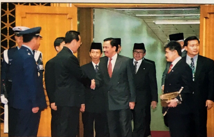
* From page one (Third ASEM Summit)

mitments, such as its active role in supporting United Nation's (UN) efforts especially in arms control and peacekeeping, and emphasised the important role of the EU in assisting developing countries to come to terms with modern economic conditions.