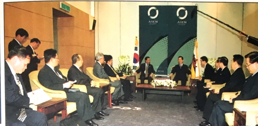
Above: His Majesty in discussion with His Excellency President Kim Dae-Jung of the Republic of Korea on efforts to upgrade bilateral relations between both countries and preparations for the forthcoming APEC Summit in Bandar Seri Begawan. The meeting was held at the COEX Convention Centre in Seoul. Below: His Majesty and leaders of the ASEAN countries enter the auditorium of the COEX Convention Centre for the opening ceremony of the ASEM Summit.