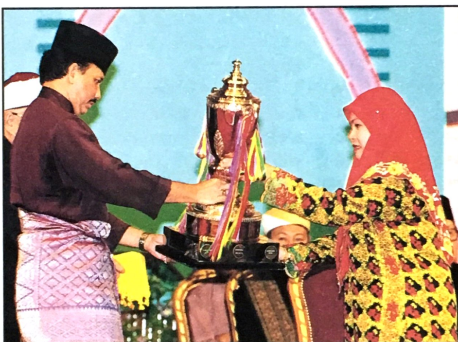
Among members of the royal family who attended the prize presentation ceremony for the National Quran Reading Competition, below.