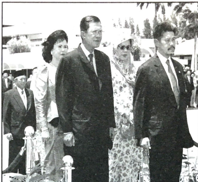
His Excellency Mr. Hun Sen and wife, Madame Bun Rany Hun Sen being welcomed at the Brunei International airport by His Royal Highness Prince Mohamed Bolkiah, the Minister of Foreign Affairs and Her Royal Highness Pengiran Anak Isteri Pengiran Anak Hajjah Zariah.

The next issue of the Brunei Darussalam newsletter will appear on 15 September 2000. If there are events relating to our country you would like featured in this newsletter please call us on Tel: 02-383941 or better still, send us a report with a picture, if possible. All editorial rights reserved.