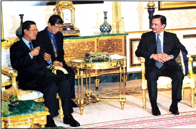
His Majesty Sultan Haji Hassanal Bolkiah Mu'izzaddin Waddaulah, The Sultan and Yang Di-Pertuan of Brunei Darussalam and the Cambodian Prime Minister, His Excellency Mr. Hun Sen in the midst of conversation during the audience at Istana Nurul Iman.

His Majesty Sultan Haji Hassanal Bolkiah Mu'izzaddin Waddaulah, The Sultan and Yang Di-Pertuan of Brunei Darussalam said that his Government would explore ways to enhance the bilateral cooperation that had already been initiated between Cambodia and Brunei Darussalam particularly in the area of human resource development.