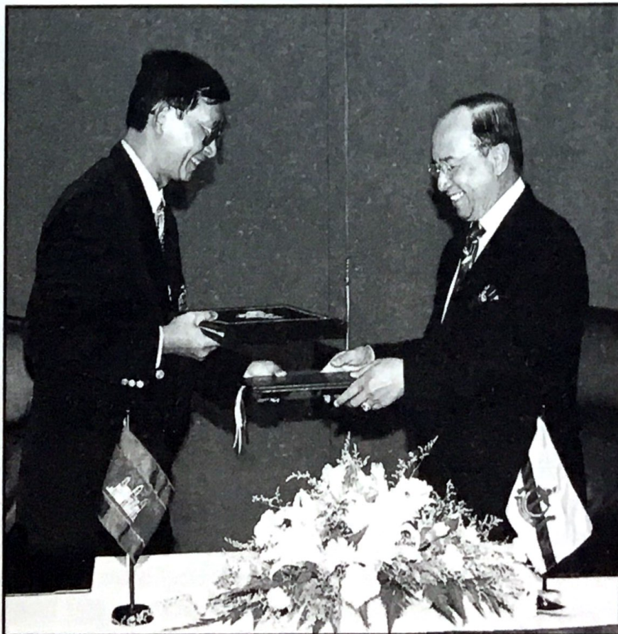
Minister of Industry and Primary Resources, Yang Berhormat Pehin Orang Kaya Setia Pahlawan Dato Seri Setia Haji Awang Abdul Rahman and the Minister of Trade of Cambodia, His Excellency Mr. Cham Prasidh exchanging Agreement on Trade.

The Royal Brunei Airlines is currently operating to 23 destinations throughout Asia, Australia, the Middle East and Europe.