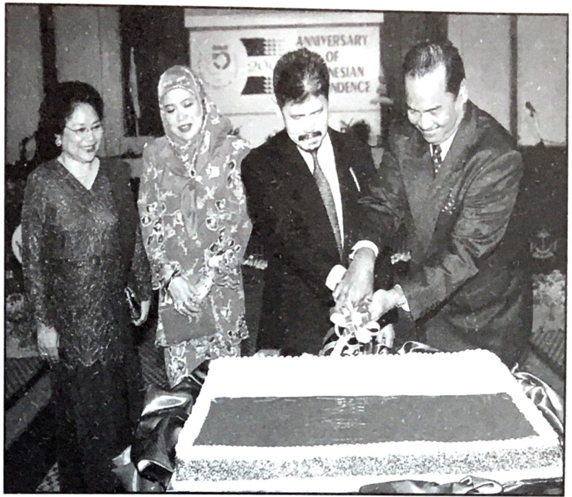
His Royal Highness Prince Mohamed Bolkiah, Minister of Foreign Affairs, and the Ambassador of the Republic of Indonesia to Brunei Darussalam, His Excellency Mr. Rahardjo Djojonegoro cut a cake to mark the 55 th Anniversary of the Proclamation of Independence of the Republic of Indonesia.

A high-speed telecommunications infrastructure-the RaGAM 21-will link the Cyber Park to the Asia-Pacific Information Infrastructure (APII) and the Global Information Network (GII). Other activities include an incubation for an IT hub for e-commerce trading, a base for e-commerce, virtual shops, business portal hub or Internet marketing, a test-bed for Internet-related and multimedia services, high-tech