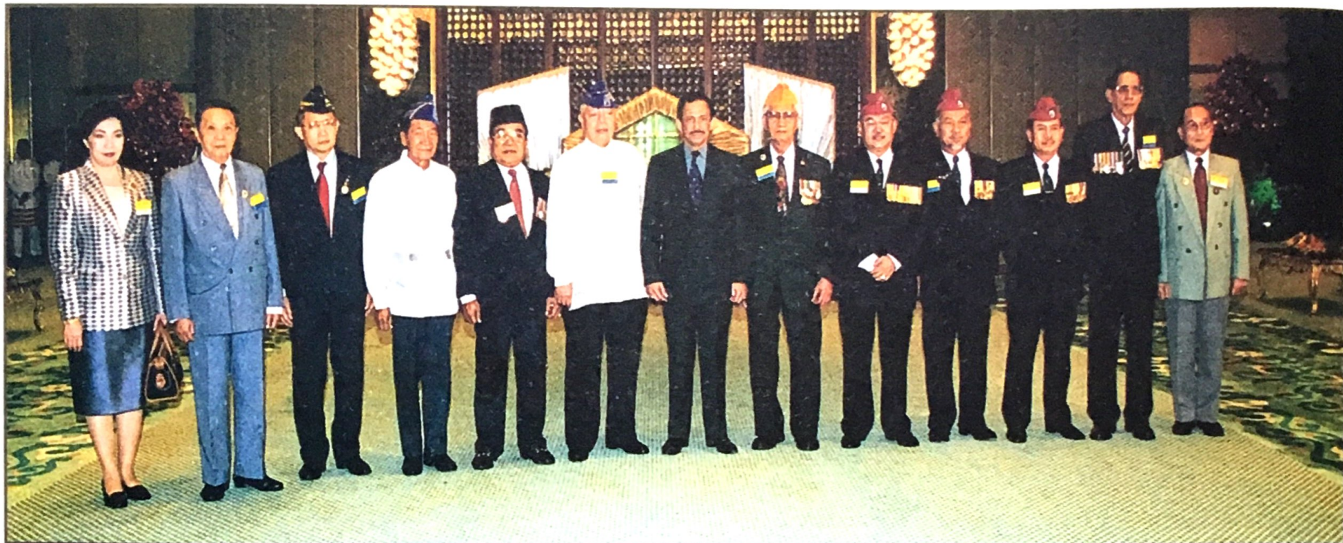
His Majesty Sultan Haji Hassanal Bolkiah Mu'izzaddin Waddaulah, The Sultan and Yang Di-Pertuan of Brunei Darussalam in a group photo with Heads of Delegations of the 9 th Veterans Confederation of Asean countries (VECONAC) at Istana Nurul Iman.