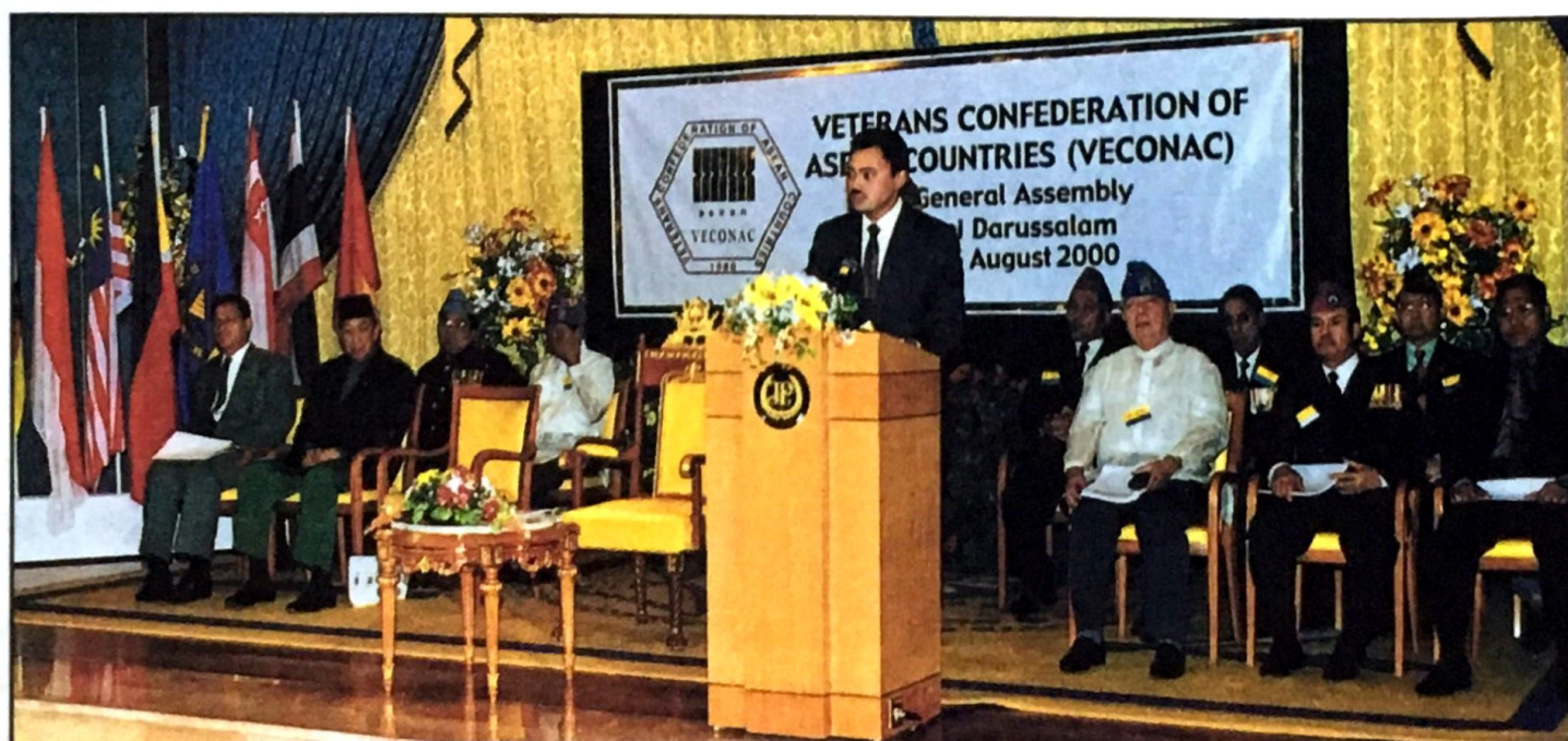
His Royal Highness Crown Prince Haji Al-Muhtadee Billah at the Official Opening of the Veterans Confederations of ASEAN Countries (VECONAC) General Assembly at Jerudong Park Polo Club.

His Royal Highness noted that members of the VECONAC belong to a special group of people, who have done a lot for their countries and who