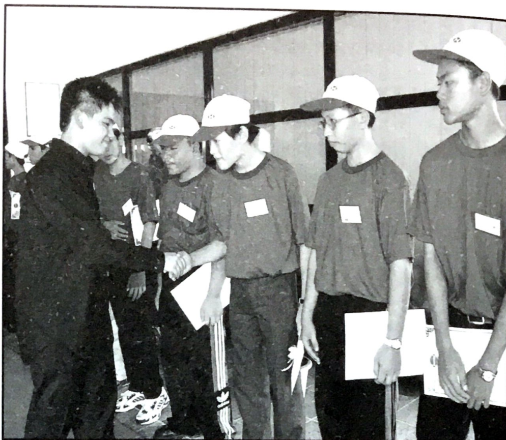
His Royal Highness Prince Haji 'Abdul 'Azim exchanging greetings with participants of the Anti-Drugs Boys Camp.

The camp aims to instill awareness among youths on drug abuse.