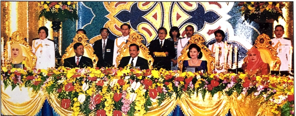
His Majesty The Sultan and Yang Di-Pertuan of Brunei Darussalam, Her Majesty Raja Isteri Pengiran Anak Hajjah Saleha, Her Royal Highness Pengiran Isteri Hajjah Mariam, Cambodian Prime Minister, His Excellency Mr. Hun Sen and Madame Bun Rany Hun Sen during the banquet at Istana Nurul Iman.