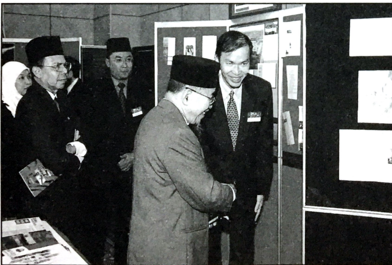
The Acting Minister of Health, Yang Berhormat Pehin Orang Kaya Laila Wijaya Dato Seri Setia Haji Awang Abdul Aziz taking a closer look at the exhibition in conjunction with the 7 th BIMST Public Health Conference.

The Acting Minister of Health, Yang Berhormat Pehin Orang Kaya Laila Wijaya Dato Seri Setia Haji Awang Abdul Aziz, has stressed the need to make interdisciplinary efforts to address the physical, mental and environmental health concerns of communities and populations at risk by way of health promotion and education, as well as the prevention of diseases.