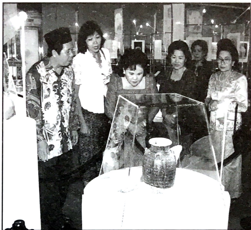
Madame Bun Rany Hun Sen, wife of the Cambodian Prime Minister, tours the exhibition at the Brunei Museum.

was introduced to Cabinet Ministers, senior government officials and Heads of Foreign Missions in Brunei Darussalam.