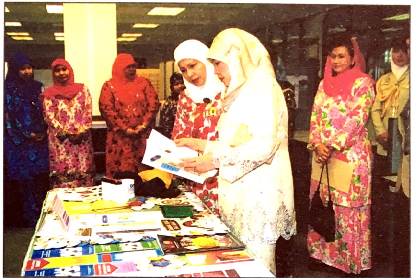
Her Royal Highness Pengiran Isteri Hajjah Mariam looking at the leaflets on anti-drug campaign produced by the Narcotic Control Bureau during her visit to the Bureau's headquarters at Jalan Tungku.

The 9 th VECONAC General Assembly began from 21 to 25 August, and the first of its kind being hosted by Brunei Darussalam.