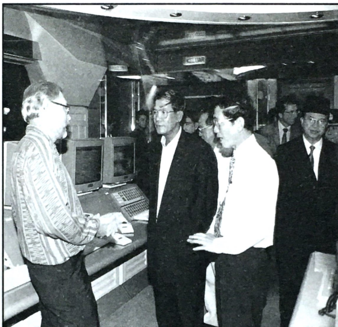
The Prime Minister being briefed on the operations of the Brunei Shell Petroleum.

* From page one ( Visit of Cambodian Prime Minister )