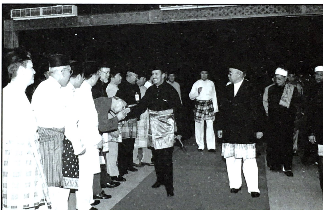
His Royal Highness Prince Haji Sufri Bolkiah being greeted on arrival at the International Convention Centre.

His Royal Highness said that the image of youths living without religious teachings and guidance, as seen