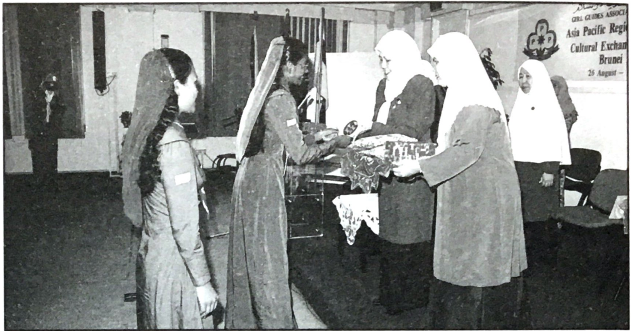
Her Royal Highness Princess Hajjah Masna presented souvenir to participants.

"As we are now on the verge of entering into the final year of the project, I am confident that the review or evaluation of it would demonstrate its success in strengthening contacts between member organisations in the region," said Her Royal Highness.