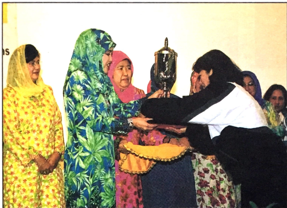
Her Majesty Raja Isteri Pengiran Anak Hajjah Saleha presenting a trophy to the Captain of the International Women Club of Brunei Darussalam, winner of the 6 th Badminton Tournament.

Her Majesty Raja Isteri Pengiran Anak Hajjah Saleha has consented to present prizes to winners of the 6 th Badminton Tournament for the Patron of the Women Council's Trophy on 13 August. The presentation ceremony was held at the Royal Brunei Airlines' Sports Complex in Berakas.