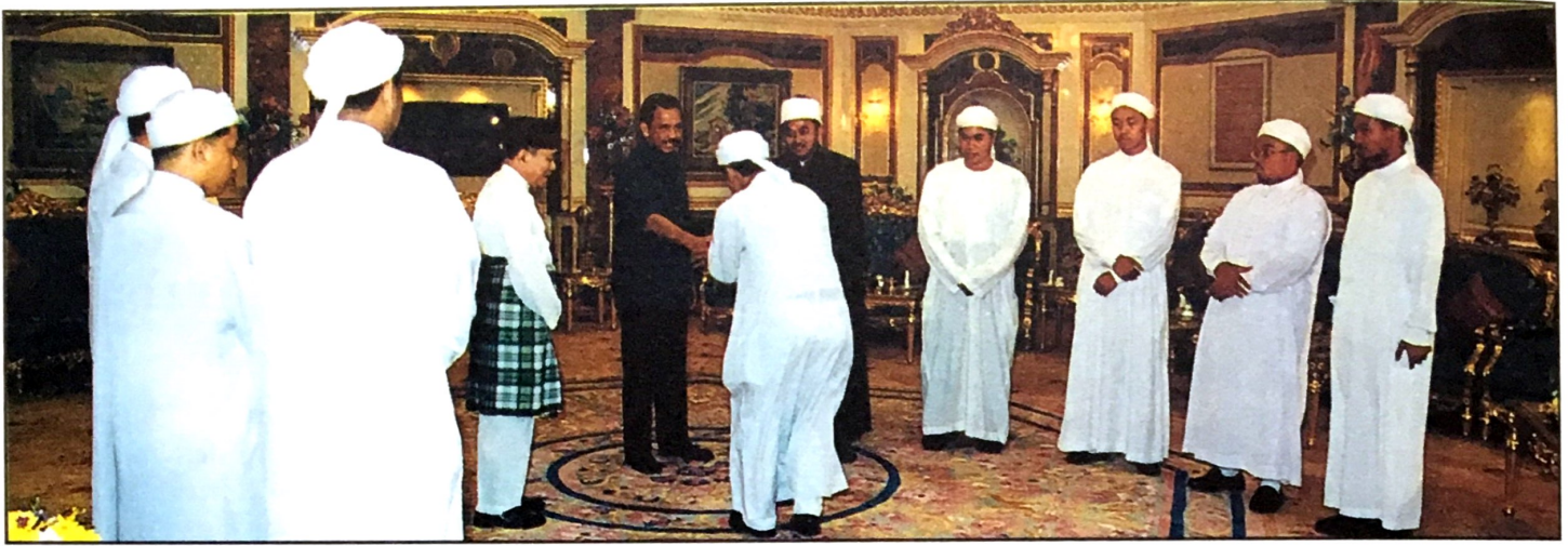
His Majesty Sultan Haji Hassanal Bolkiah Mu'izzaddin Waddaulah, The Sultan and Yang Di-Pertuan of Brunei Darussalam grants in audience 11 students of Sultan Hassanal Bolkiah Tahfiz Al-Quran Institute at Istana Nurul Iman.