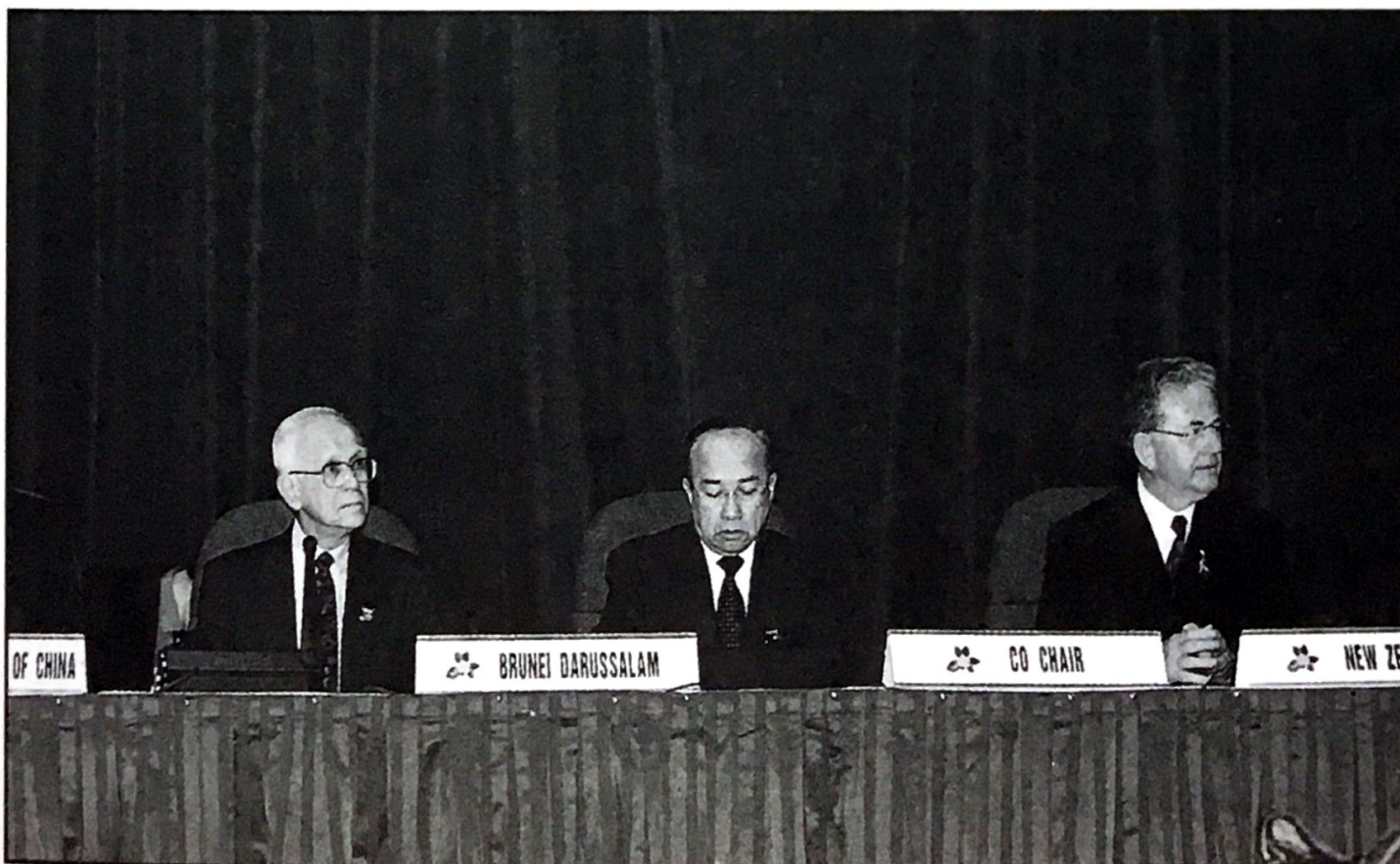
The Minister of Industry and Primary Resources, Yang Berhormat Pehin Orang Kaya Setia Pahlawan Dato Seri Setia Haji Awang Abdul Rahman and New Zealand's Minister of Finance, The Honourable Dr. Michael Cullin co-chair the Joint Press Conference of the 7 th APEC Finance Ministers Meeting at the International Convention Centre in Berakas.