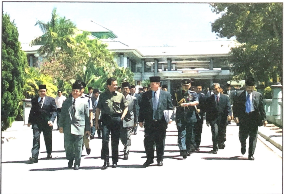
His Majesty Sultan Haji Hassanal Bolkiah Mu'izzaddin Waddaulah, The Sultan and Yang Di-Pertuan of Brunei Darussalam tours the Jerudong Park Polo Club, above, and being briefed on the venues, where preparations are being made for the 9 th APEC Summit, below.

At the Jerudong Park Polo Club, His Majesty was briefed by the Executive Director of APEC 2000.