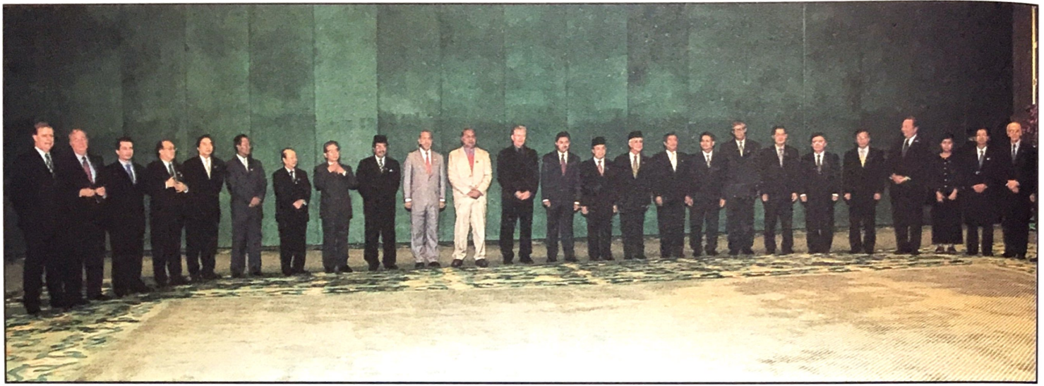
His Royal Highness Crown Prince Haji Al-Muhtadee Billah, the Deputy Sultan and heads of delegations for the 7 th APEC Finance Ministers Meeting and heads of International Financial Institutions in a group picture after the audience at Istana Nurul Iman.