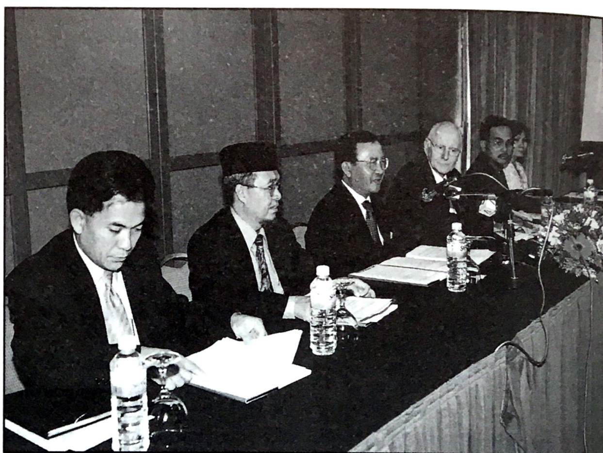
The Deputy Minister of Finance, Dato Seri Paduka Awang Haji Selamat during the Press Briefing on Brunei International Financial Centre (BIFC).

In his opening remarks, the Minister outlined the agenda for the meeting, which covered a broad range of issues, from the regional economy to developments in strengthening the in-