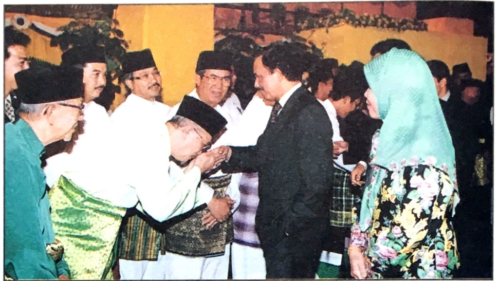
His Majesty The Sultan and Yang Di-Pertuan of Brunei Darussalam mingles with teachers at the celebration held at the International Convention Centre.

The next issue of the Brunei Darussalam newsletter will appear on 15 October 2000. If there are events relating to our country you would like featured in this newsletter please call us on Tel: 02-383941 or better still, send us a report with a picture, if possible. All editorial rights reserved.