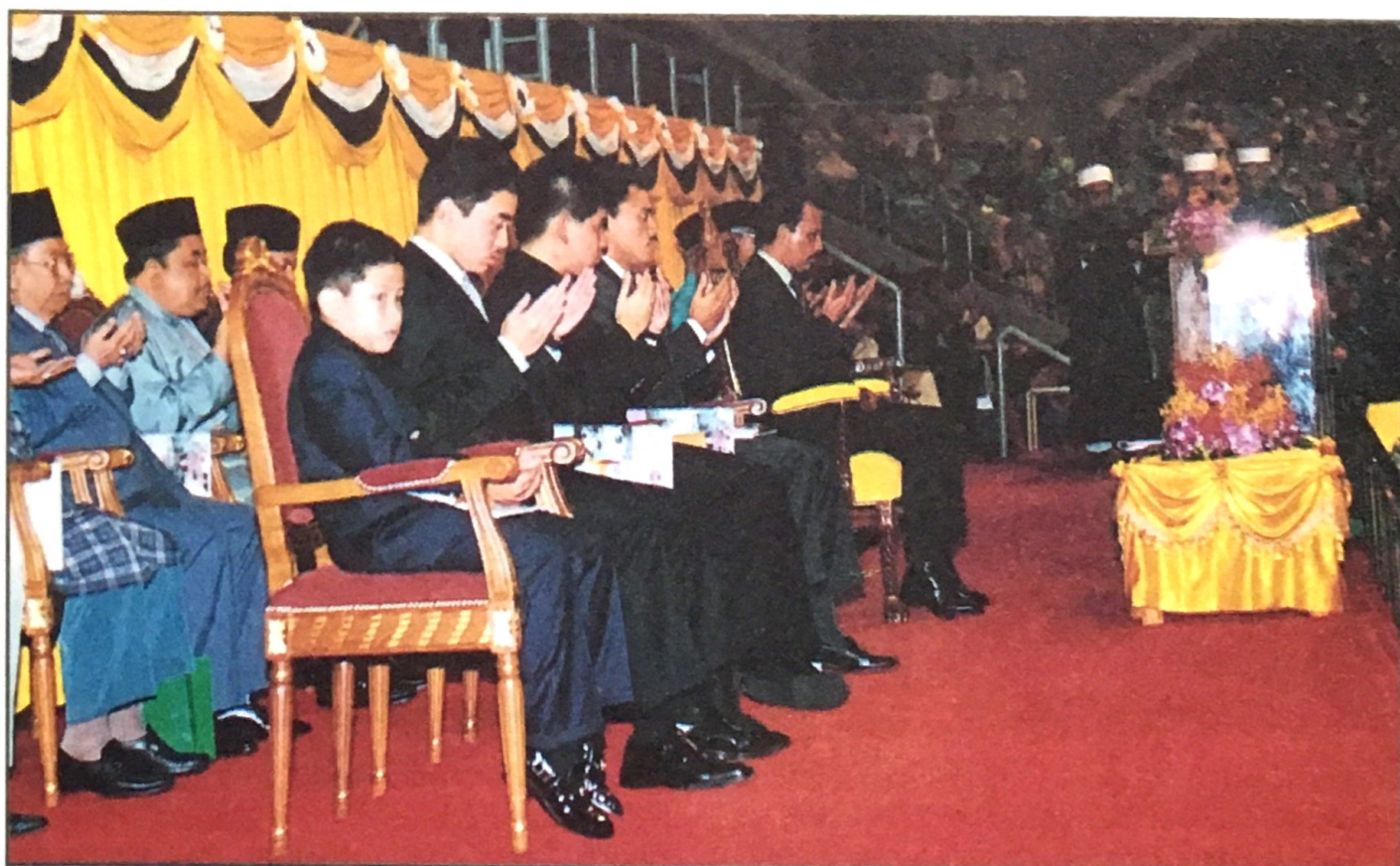
His Majesty Sultan Haji Hassanal Bolkiah Mu'izzaddin Waddaulah, The Sultan and Yang Di-Pertuan of Brunei Darussalam together with His Royal Highness Crown Prince Haji Al-Muhtadee Billah, His Royal Highness Prince Haji 'Abdul 'Azim, His Royal Highness Prince 'Abdul Malik and His Royal Highness Prince 'Abdul Mateen sit on homage of the do'a read by the State Mufti in conjunction with the 10 th Teacher's Day.