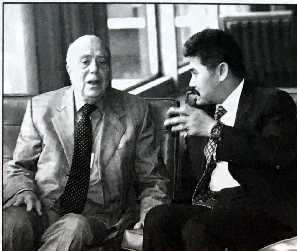
His Royal Highness Prince Mohamed Bolkiah and the Secretary-General of the OIC, His Excellency Dr. Azzeddine Laraki, in the midst of discussion during the meeting at the UN Headquarters building in New York.