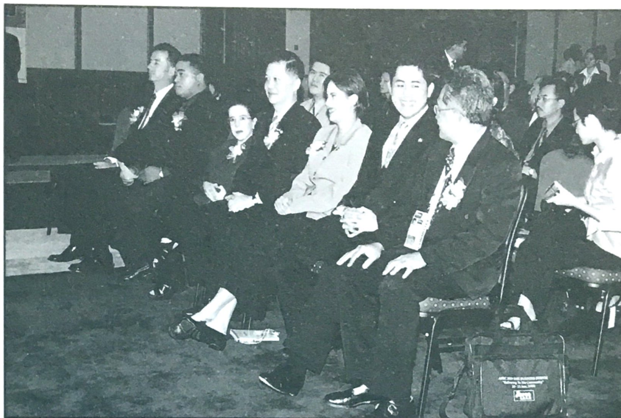
Yang Amat Mulia Pengiran Muda Abdul Qawi, the Executive Deputy Chairman and Director of QAF Brunei, officiating the formation of the Young Entrepreneurs Association of Brunei (YEAB) and the launching of its website at the International Convention Centre in Berakas on June 21.

Before the live 'Town Hall' session got under way, Yang Amat Mulia Pengiran Muda Abdul Qawi, the Executive Deputy Chairman and Director of QAF Brunei, officially opened the formation of the Young Entrepreneurs Association of Brunei (YEAB) and launched its website (HYPERLINK " http://www.yea-brunei.com " www.yea-brunei.com ) at the International Convention Centre in