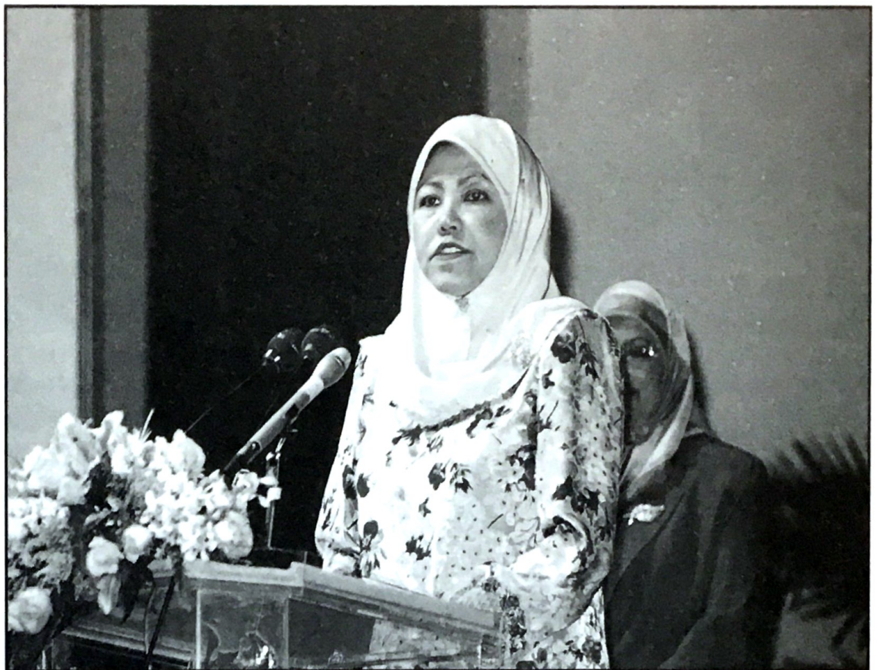
Her Royal Highness Princess Hajjah Masna, Ambassador-at-Large at the Ministry of Foreign Affairs urging small and medium enterprises in the developing economies to ally strategically with each other and large corporations in the developed economies.

In fact, women entrepreneurs were more fortunate because the advancement of electronic technology, such as