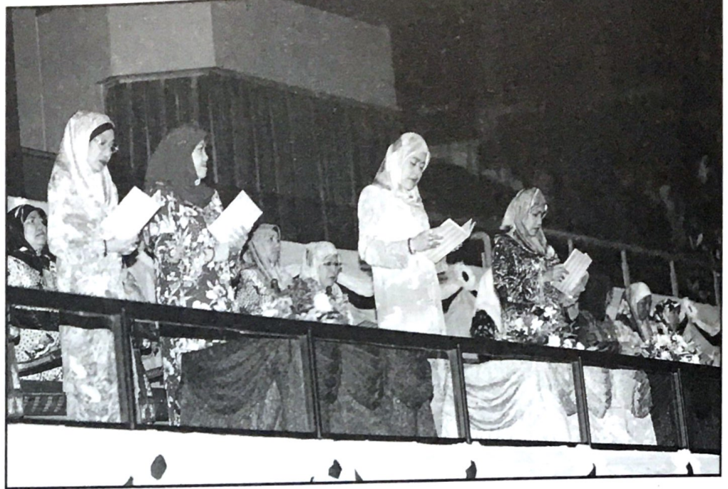
Her Royal Highness Pengiran Anak Isteri Pengiran Anak Hajjah Zariah, flanked by Her Royal Highness Princess Hajjah Masna and Her Royal Highness Princess Hajjah Noor Ehsani on the left, and Her Royal Highness Princess Hajjah Nor'ain on the right, attending the Women's Special Gathering in observance of the birthday anniversary celebration of Prophet Muhammad (peace be upon him).

H er Royal Highness Pengiran Anak Isteri Pengiran Anak Hajjah Zariah, the wife of the Deputy Sultan, has attended the Women Special Gathering in observance of Prophet Muhammad's, (peace be upon him) birthday anniversary celebration. The gathering was held at the Indoor Stadium of the Sultan Hassanal Bolkiah Sports Complex in Berakas on 21 June.