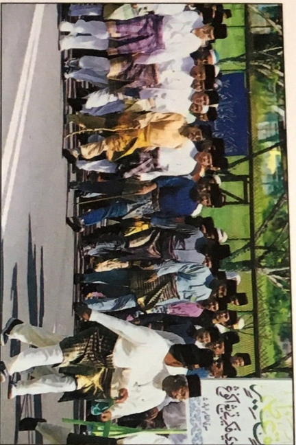
His Majesty Sultan Haji Hassanal Bolkiah Mu'izzaddin Waddaulah, The Sultan and Yang Di-Pertuan of Brunei Darussalam along with members of the royal family leads thousands of Muslims in the Brunei-Muara district in a mass procession around Brunei Darussalam's capital, Bandar Seri Begawan, above.