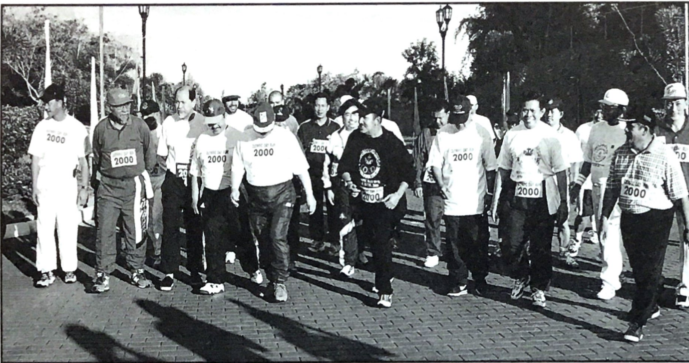
His Royal Highness Prince Haji Sufri Bolkiah, President of Brunei Darussalam's National Olympic Council, joins more than 800 runners in the Olympic Day Run 2000 at the Hassanal Bolkiah National Stadium in Berakas.

H is Royal Highness Prince Haji Sufri Bolkiah, President of the Brunei Darussalam's National Olympic Council, joined more than 800 runners in the Olympic Day Run 2000 on 25 June.