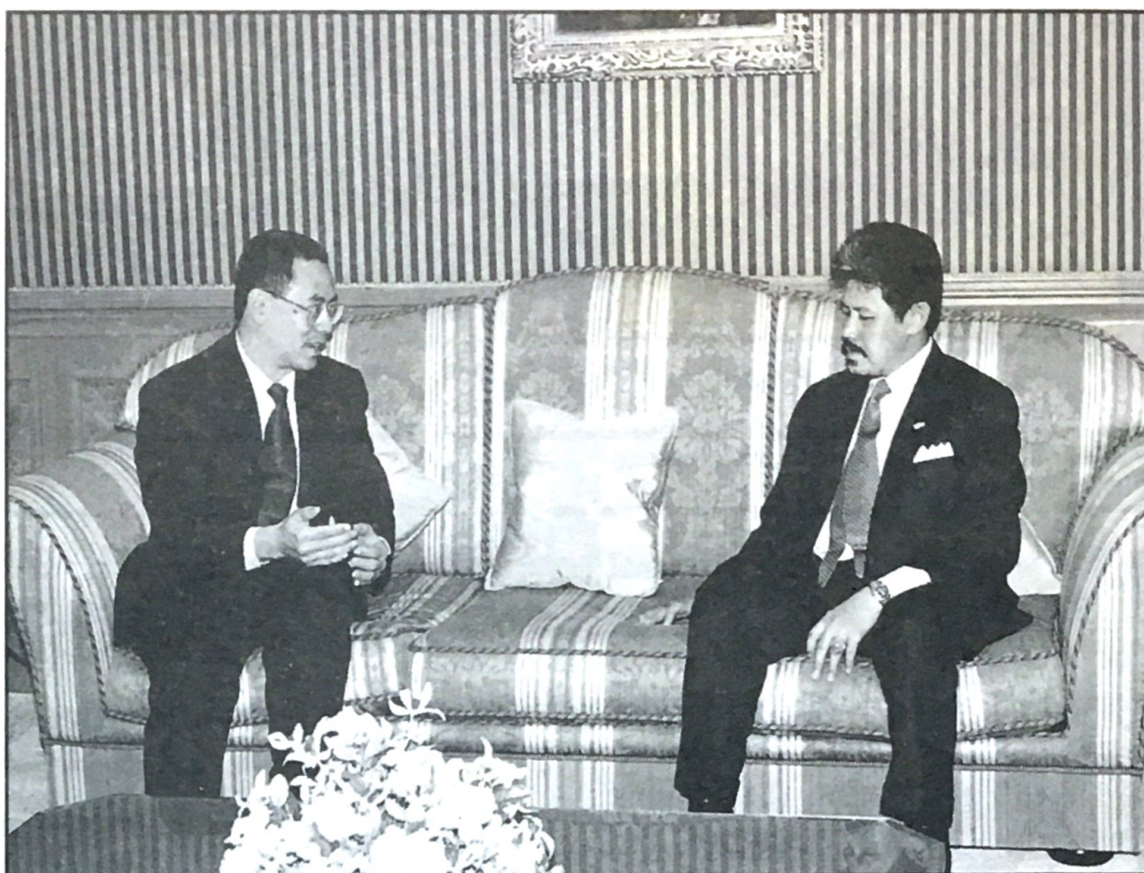
His Royal Highness Prince Mohamed Bolkiah, the Deputy Sultan, receiving in audience Singapore Minister for Defence and Minister of Information and Arts, His Excellency Mr. David Lim Tik En, at the Balai Penghadapan Bukit Kayangan.