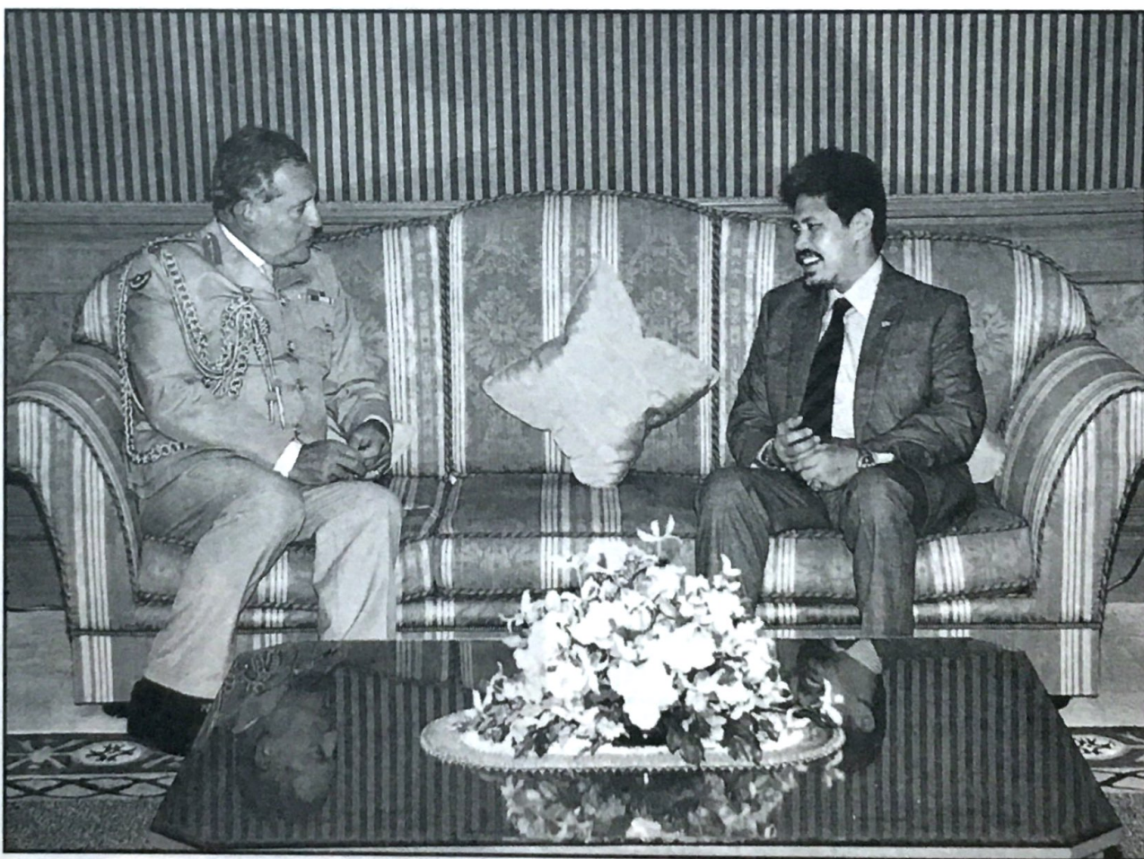
His Royal Highness in conversation with General Sir Charles Guthrie, the Defence's Chief of Staff of the United Kingdom, during an audience on 26 June.