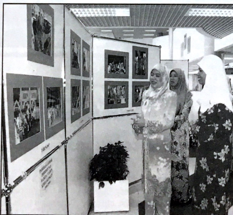
Her Royal Highness Pengiran Anak Isteri Pengiran Anak Hajjah Zariah views an exhibition, displaying pictures of the previous Women's Gatherings, criminal statistics, cases and pictures of abuses and violence.

The gathering was jointly organised by the Ministry of Religious Affairs, Ministry of Culture, Youth and Sports and the Brunei Darussalam's Women Council. An exhibition, displaying pictures of the previous Women's Gatherings, criminal statistics and cases and pictures on abuses and violence was also held.