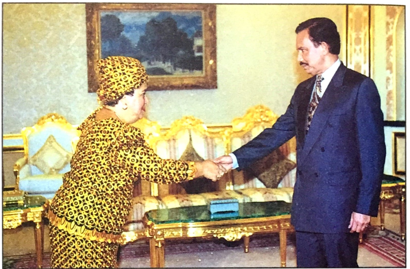
Above: The African Republic of Malawi's Minister of Foreign Affairs and International Cooperation, the Honourable Mrs. Lilian E. Patel, MP having an audience with His Majesty The Sultan and Yang Di-Pertuan of Brunei Darussalam at Istana Nurul Iman.