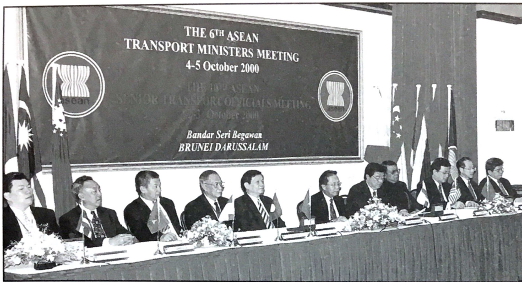
The Minister of Communications, Yang Berhormat Pehin Dato Awang Haji Zakaria, 6 th from left, chairs a joint press conference at the conclusion of the 6 th ASEAN Transport Ministers' meeting in Bandar Seri Begawan.