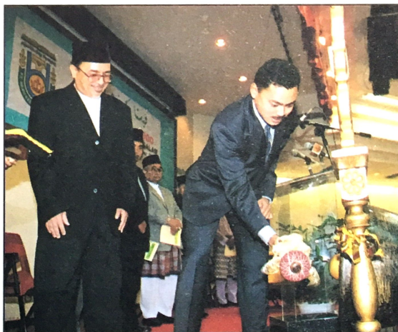
His Royal Highness Crown Prince Haji Al-Muhtadee Billah, who is the Pro-Chancellor of Universiti Brunei Darussalam (UBD) struck the gong to officiate the launching of U B D ' s Convocation Festival 2000.

Brunei Darussalam's ties with Tanzania took effect on the day of the signing.