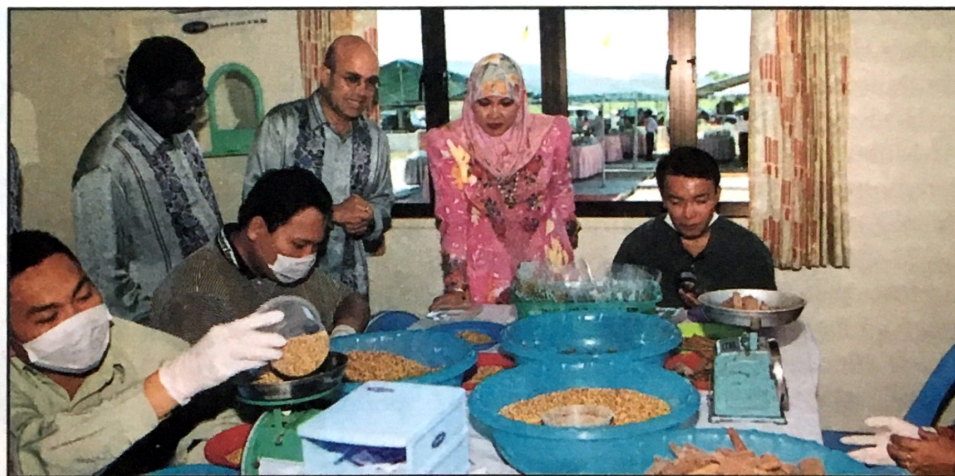
Her Royal Highness Pengiran Isteri Hajjah Mariam being briefed as she stopped-by at the industrial training section of the new centre.