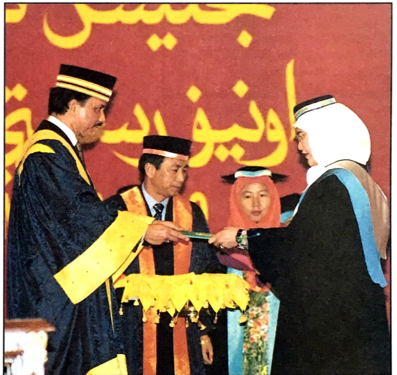
His Majesty The Sultan and Yang Di-Pertuan of Brunei Darussalam presenting Bachelor of Arts degree (administration and public policy) to one of the recipients – His Majesty's own daughter, Her Royal Highness Princess Hajjah Majeedah Nuurul Bolqiah.

The monarch was happy to note that of late the expertise available at UBD has also benefited both the government and private agencies, which was in line and timely with the uni-