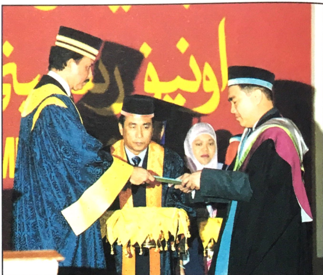
Above: One of the latest graduates receiving his degree from His Majesty The Sultan and Yang Di-Pertuan of Brunei Darussalam during Universiti Brunei Darussalam's 12 th Convocation ceremony. Below: The just-graduated Princess Hajjah Majeedah Nuurul Bolqiah in a group photo with her father, His Majesty Sultan Haji Hassanal Bolkiah Mu'izzaddin Waddaulah, The Sultan and Yang Di-Pertuan of Brunei Darussalam and her brothers and sisters. Bottom: His Royal Highness Crown Prince Haji Al-Muhtadee Billah presenting certificate to a graduate of the Sultan Hassanal Bolkiah Institute of Education held on the same day as Universiti Brunei Darussalam's 12 th convocation ceremony.

10 received Post-Degree Diploma in Counseling, eight in Certificate in Science Education (Lower Secondary), 7 received Certificate in Education Management, 28 received Certificate in Special Education, 18 received Certificate in Counseling and 69 received Certificate in Education.