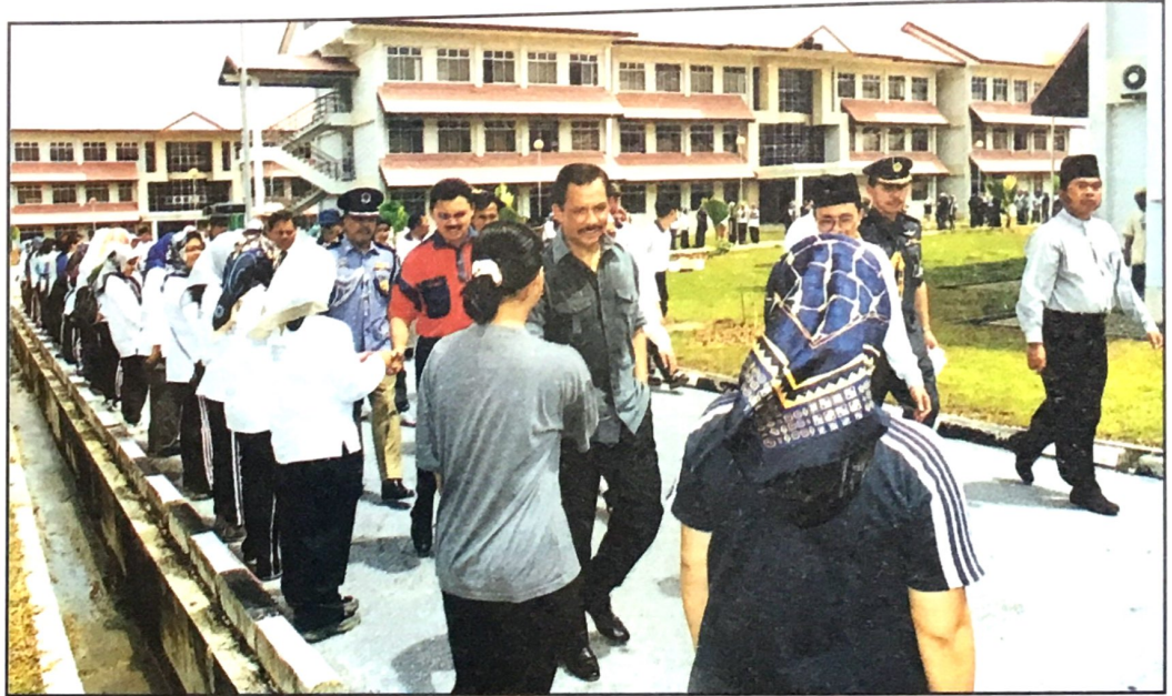
UBD undergraduates lining up to meet His Majesty and His Royal Highness The Crown Prince at the end of the keep-Brunei Darussalam-green project.

The beautifying project for UBD surroundings is a long-term activity to create public awareness of the importance of preserving a green, clean environment. In addition, it was also held to unite members of the public, government and private sectors as well as the University community to implement the eco-friendly project.