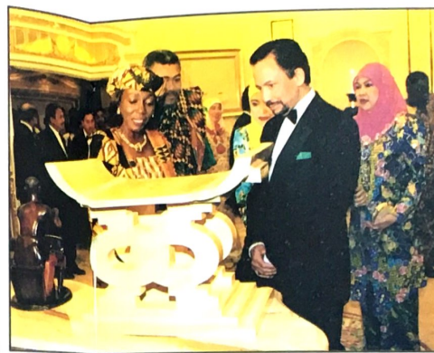
His Majesty The Sultan and Yang Di-Pertuan of Brunei Darussalam and Ghanaian President Lt. Rawlings, members of the royal family and those of accompanying Ghanaian delegation stand in homage of the nations' anthems of Brunei Darussalam and Republic of Ghana, which preceded a banquet at Istana Nurul Iman given by the Brunei monarch in honour of the Ghanaian Head of State and first lady, left.