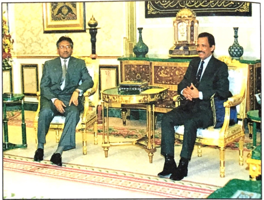
The Brunei monarch and Pakistan's Chief Executive, His Excellency General Pervez Musharraf discussed bilateral matters as well as those pertaining to regional and international affairs when they met at Istana Nurul Iman.