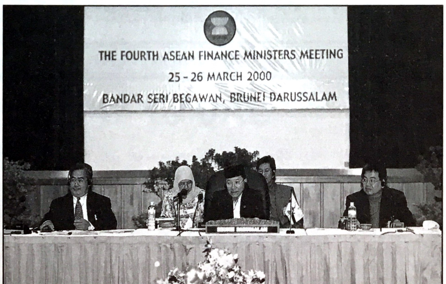
Yang Berhormat Pehin Orang Kaya Laila Wijaya Dato Seri Setia Haji Awang Abdul Aziz during a joint ministerial media conference held at International Convention Centre.

Aside from ASEAN's Finance Ministers, the fourth AFMM was also attended by representatives of international financial institutions such as the World Bank and the International Monetary Development Bank (ADB).