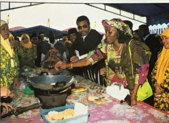
Left: The Ghanaian first couple enjoying a session of local Bruneian kueh (traditional cakes and delicacies) making demonstration during visits to various communities.

The couple took a cruise on the luxury boat, Tanjong Bekarang, and stopped at the house of the head of Mukim Tamoi cum the Ketua Kampong of Tamoi Ujong (villages).