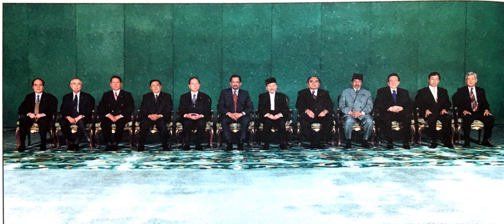
Finance Ministers of ASEAN's member nations and the ASEAN Secretary-General in a group photo with His Majesty The Sultan and Yang Di-Pertuan of Brunei Darussalam when the ruler granted them an audience at Istana Nurul Iman.