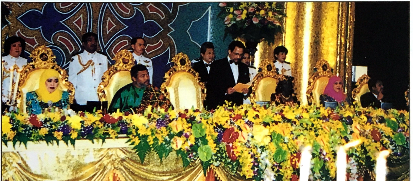
His Majesty The Sultan and Yang Di-Pertuan of Brunei Darussalam calling for close partnership between Brunei and Ghanaian public and private sectors, during a banquet at Istana Nurul Iman in honour of visiting Ghanaian President recently.