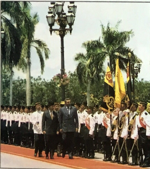
Left: The Ghanaian President accompanied by His Majesty inspects a guard of honour in front of Istana Nurul Iman as gesture of his official welcome to Brunei Darussalam for a 3-day state visit.

The visiting of President of Ghana and First Lady Nana Konadu Agyemman Rawlings also visited Brunei's famous, the Kampong Ayer (Water Village).