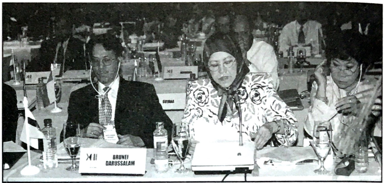
Her Royal Highness Princess Hajjah Masna, the Ambassador-at-Large at the Ministry of Foreign Affairs, attending the 13th Meeting of the Non-Aligned Movement (NAM) held at the Cartagena Conference Centre in Colombia.

Her Royal Highness noted that a new world order has indeed emerged with the ending of the cold war, and this has brought with it an unprecedented explosion of information and knowledge, the impact