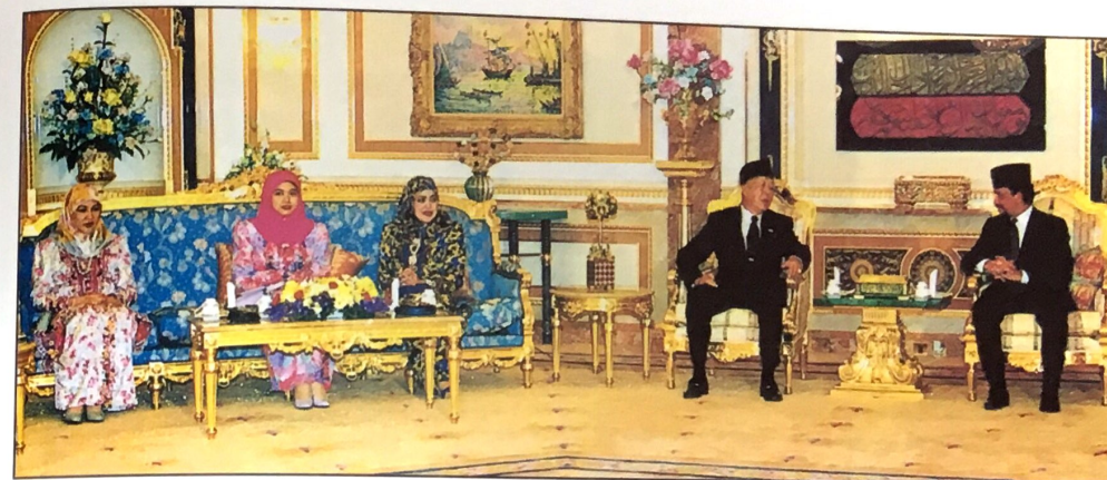
* From page one (Visit of Yang Di-Pertuan Agong)

Shah Al-Haj, Yang Di Pertuan Agong of Malaysia and The Raja Permaisuri Agong, Tuanku Siti Aishah at Istana Nurul Iman on 31 January.