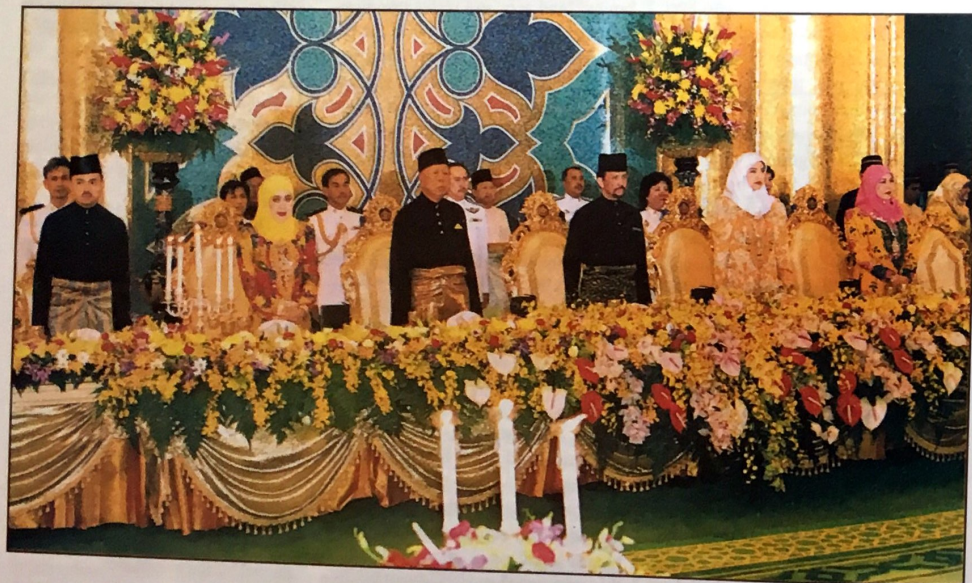
His Majesty The Sultan and Yang Di-Pertuan of Brunei Darussalam, Her Majesty The Raja Isteri, Her Royal Highness The Pengiran Isteri, His Majesty The Yang Di-Pertuan Agong, Her Majesty The Raja Permaisuri Agong and His Royal Highness Crown Prince Haji Al-Muhtadee Billah at a Banquet held at Istana Nurul Iman.