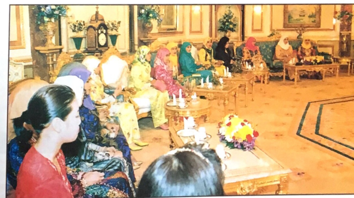
Her Majesty The Raja Isteri, Her Royal Highness The Pengiran Isteri and Her Majesty The Raja Permaisuri Agong and other members of the royal family of Brunei Darussalam and Selangor Darul Ehsan, prior to the Banquet at Istana Nurul Iman, below. Also present at the ceremony were His Royal Highness Crown Prince Haji Al-Muhtadee Billah, His Royal Highness Prince Mohamed Bolkiah, His Royal Highness Prince Haji Sufri Bolkiah, His Royal Highness Prince 'Abdul Malik, His Royal Highness Prince 'Abdul Mateen and members of the royal family of Selangor Darul Ehsan, bottom of page.