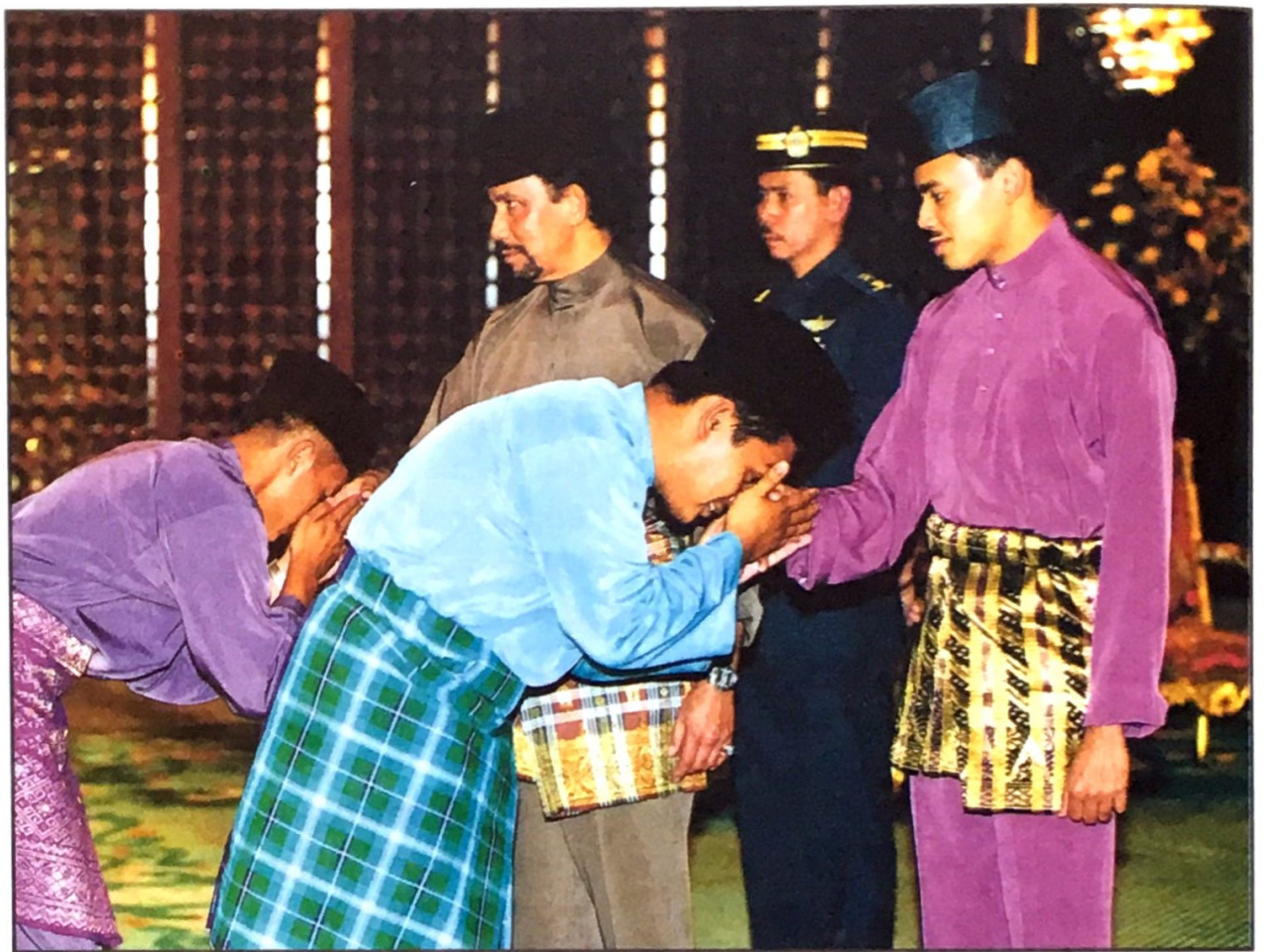
His Majesty Paduka Seri Baginda Sultan Haji Hassanal Bolkiah Mu'izzaddin Waddaulah, Sultan and Yang Di-Pertuan of Brunei Darussalam and His Royal Highness Crown Prince Haji Al-Muhtadee Billah receive 'junjung ziarah' from male pilgrims, above, while Her Majesty Paduka Seri Baginda Raja Isteri Pengiran Anak Hajjah Saleha and Her Royal Highness Pengiran Isteri Hajjah Mariam receive 'junjung ziarah' from the female pilgrims, below.

This year, 1,400 pilgrims in the country will be performing the Haj, the fifth tenet or pillar of Islam, using the Darussalam Holdings Package and several others private packages. The first group from the Darussalam Holdings Package will leave the country on 24 February, while the first group from the private packages will depart on 17 February.