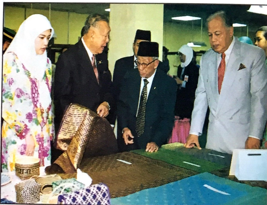
Their Majesties The Yang Di-Pertuan Agong and The Raja Permaisuri Agong visiting the Royal Regalia Building near the capital of Bandar Seri Begawan, above, and the Malaysian King, above left, sprinkling 'ayeng asah-asahan' on the graves of His Majesty The Sultan and Yang Di-Pertuan of Brunei Darussalam's late parents. Picture left shows Their Majesties The Yang Di-Pertuan Agong and The Raja Permaisuri Agong visiting the weaving section of the Arts and Handicraft Centre at Jalan Residency.