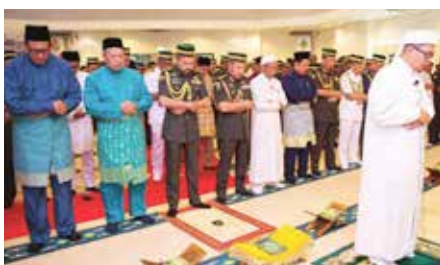
14 Crown Prince attends religious ceremony to mark 56th RBAF anniversary