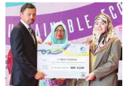
11 The Crown Prince CIPTA Awards 2017