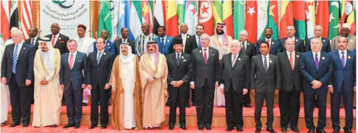
His Majesty joined for a group photograph with His Majesty King Salman bin Abdulaziz Al-Saud; His Excellency Donald J. Trump, President of the United States of America; as well as other Head of States and Government from the other Arabs and Islamic countries.

The Arab Islamic American Summit with the theme: "Together We Prevail", focused and discussed greater collaboration in addressing threats of violence and extremism that is growing worldwide, by promoting tolerance and moderation.