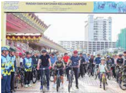
8 'Riadah Dan Kayuhan Keluarga Harmoni 2017'