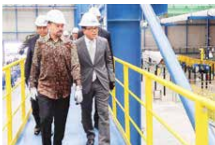
10 $52-million FDI project Officially Launched