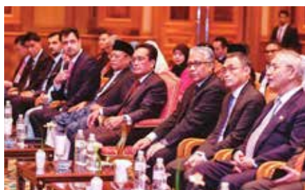
16 International Banking Conference