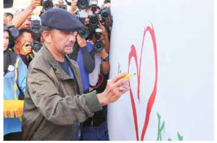
His Majesty and other members of the royal family graced the National Family Day and Bandarku Ceria events which took place in and around Taman Haji Sir Muda Omar 'Ali Saifuddien in Bandar Seri Begawan

Bandar Seri Begawan, May 6 - The family recreation at and around Taman Haji Sir Muda Omar 'Ali Saifuddien was part of the Bandarku Ceria Programme that takes place every Sunday.