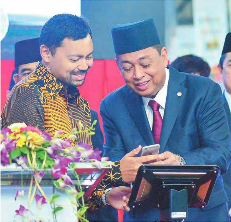
The Crown Prince and Senior Minister at the Prime Minister's Office, inaugurated and officially launched Made in Brunei Initiative.

Bandar Seri Begawan, May 6 – His Royal Highness Prince Haji Al-Muhtadee Billah ibni His Majesty Sultan Haji Hassanal Bolkhiah Mu'izzaddin Waddaulah, the Crown Prince and Senior Minister at the Prime Minister's Office, inaugurated and officially launched Made in Brunei Initiative.