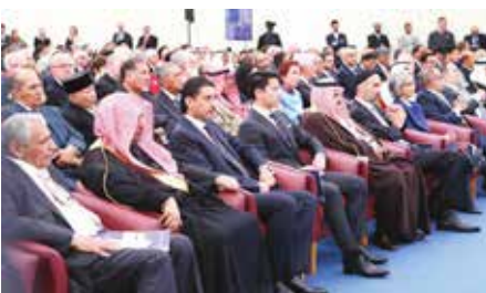
15 Inauguration Ceremony of New Building of the Oxford Centre For Islamic Studies