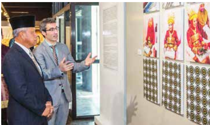
The Minister of Culture, Youth and Sports at the launch of International Museum Day 2017 held at the Royal Wharf Art Gallery in the capital.