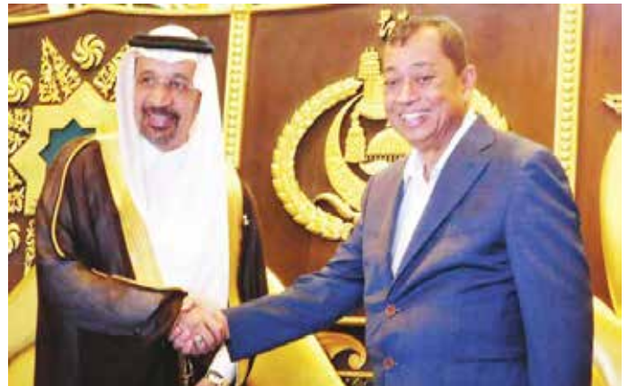
Yang Berhormat Pehin Datu Singamanteri Retired Colonel Dato Seri Setia Doctor Awang Haji Yasmin bin Haji Umar, Minister of Energy and Industry at the Prime Minister's Office and His Excellency Khalid Al-Falih, Minister of Industry and Mineral Resources of the Kingdom of Saudi Arabia.

His Excellency's visit to the country is timely with the directive of both leaders, where both countries can have the opportunity to explore further bilateral cooperation and economic opportunities. Both ministers also discussed the potential of extending the existing OPEC and Non-OPEC Declaration of Cooperation signed in December 2016, which has set out the production