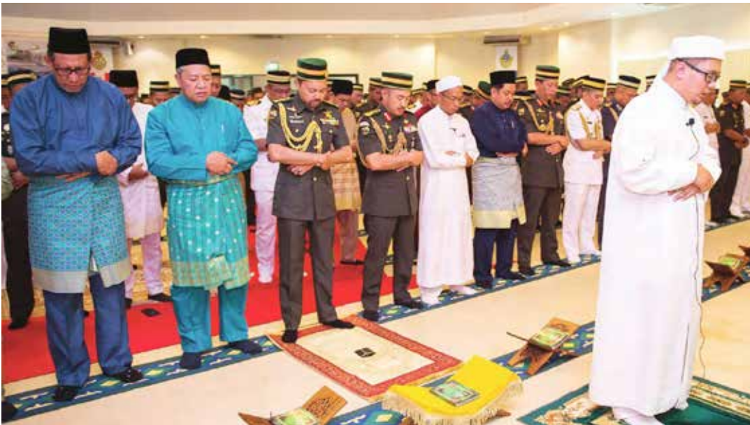
His Royal Highness Prince General Haji Al-Muhtadee Billah ibni His Majesty Sultan Haji Hassanal Bolkiah Mu'izzaddin Waddaulah, The Crown Prince and Senior Minister at the Prime Minister's Office, and General of the Royal Brunei Armed Forces (RBAF) attended a religious ceremony at the Ministry of Defence's Surau Ad-Difa' in the Bolkiah Garrison, to commemorate the RBAF's 56th anniversary.