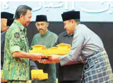
7 Presentation of Land Lots and House Keys