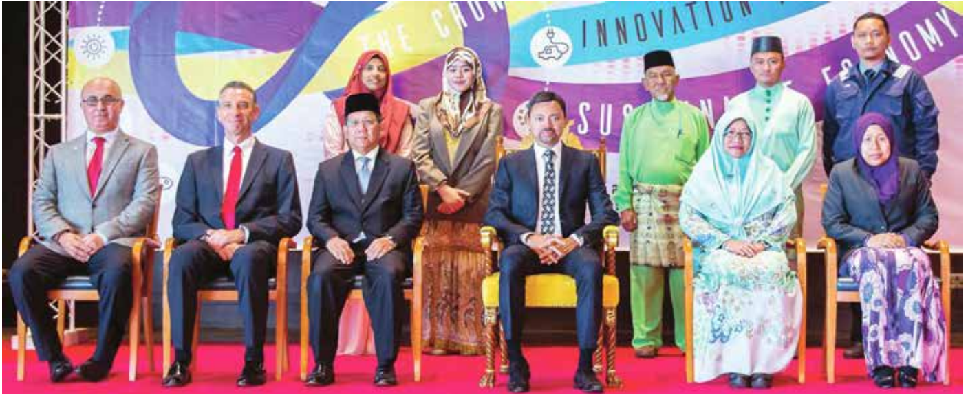
His Royal Highness Prince Haji Al-Muhtadee Billah ibni His Majesty Sultan Haji Hassanal Bolkiah Mu'izzaddin Waddaulah, the Crown Prince, Senior Minister at the Prime Minister's Office and Pro-Chancellor of Universiti Teknologi Brunei (UTB) in a group photo during the Crown Prince Creative and Innovative Product and Technological Advancement (CIPTA) Awards ceremony.