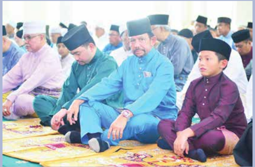
His Majesty the Sultan and Yang Di-Pertuan of Brunei Darussalam consented to attend and joined the congregation of the first Friday prayer at Pehin Khatib Abdullah Mosque, the new mosque in Kampong Kulapis in the Brunei Muara District.

Shortly after the arrival, His Majesty proceeded to the mosque lobby where His Majesty con-