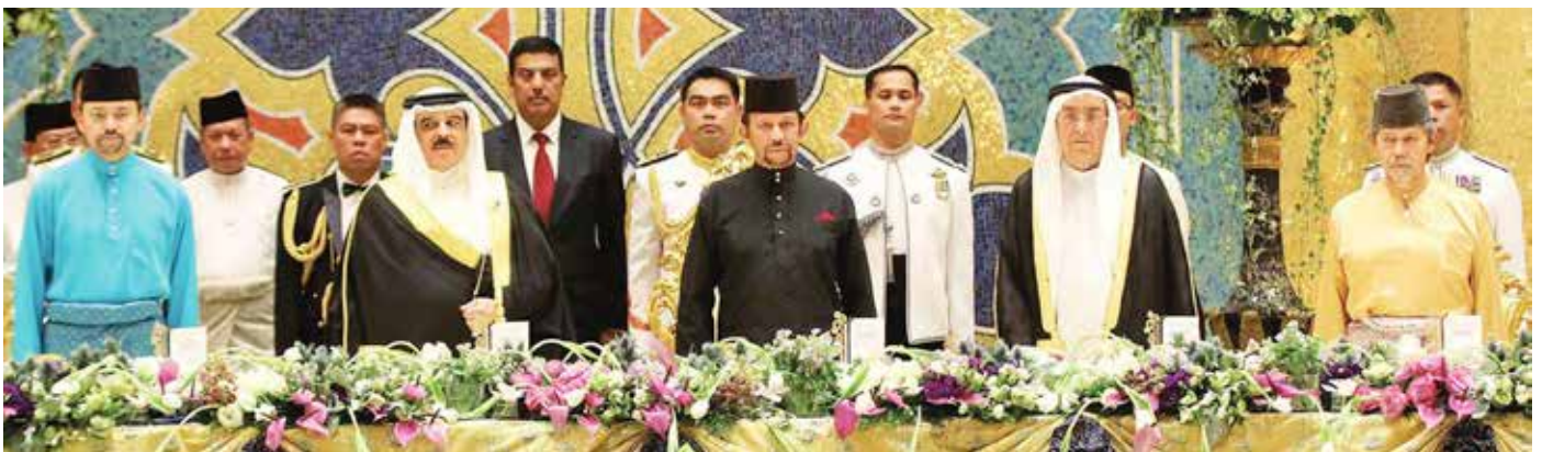
His Majesty The Sultan and Yang Di-Pertuan of Brunei Darussalam hosted a Royal Banquet in honour of the State Visit of His Majesty King Hamad bin Isa Al-Khalifa.