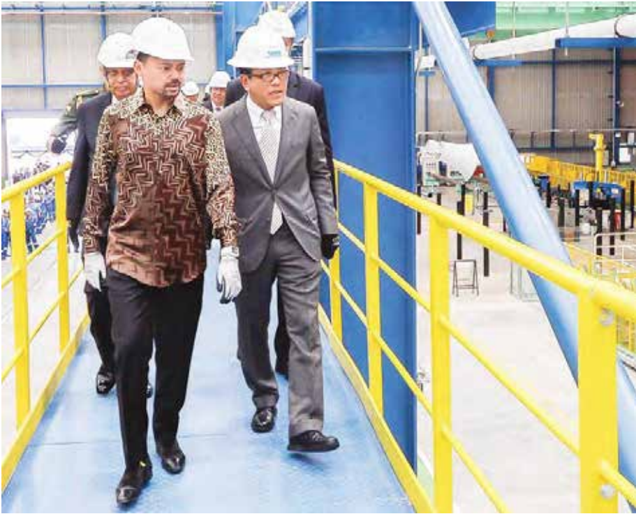
His Royal Highness Prince Haji Al-Muhtadee Billah ibni His Majesty Sultan Haji Hassanal Bolkiah Mu'izzaddin Waddaulah, The Crown Prince and Senior Minister at the Prime Minister's Office tours the threading plant and service centre of SCTSB

Brunei Darussalam , May 10 - His Royal Highness Prince Haji Al-Muhtadee Billah ibni His Majesty Sultan Haji Hassanal Bolkiah Mu'izzaddin Waddaulah, the Crown Prince and Senior Minister at the Prime Minister's Office officially launched one of the largest foreign direct investment (FDI) projects in Brunei.