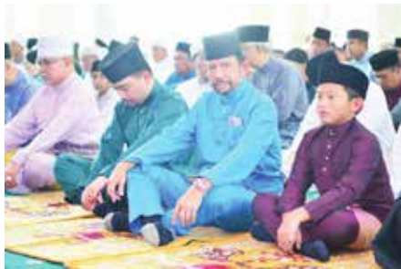
1 His Majesty Officiates New Mosque, Joins First Fardhu Friday Prayer