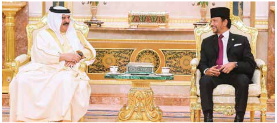
Prior to the Royal Banquet, His Majesty received a courtesy call from His Majesty King Hamad bin Isa Al-Khalifa at the Royal Lounge.

His Majesty the Sultan and Yang Di-Pertuan of Brunei Darussalam welcomed the arrival of His Majesty King Hamad bin Isa Al-Khalifa. Prior to the Royal Banquet, His Majesty received a courtesy call from His Majesty King Hamad bin Isa Al-Khalifa at the Royal Lounge. Also present was: His Royal Highness Prince Haji Al-Muhtadee Billah, the Crown Prince and Senior Minister at the Prime Minister's Office, His Royal Highness Prince Mohamed Bolkiyah, His Royal Highness