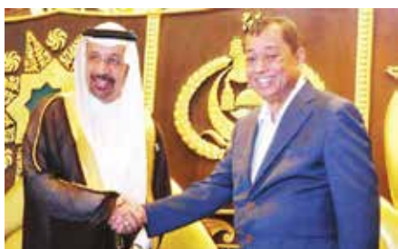
18 Agree To Rebalancing Oil Prices