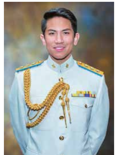
His Royal Highness 920 Substantive Captain (Air Force) Prince 'Abdul Mateen ibni His Majesty Sultan Haji Hassanal Bolkiah.

His Royal Highness is an outstanding military officer with a career path that began as an Officer Cadet undergoing basic training at the Royal Military Academy Sandhurst (RMAS), which started