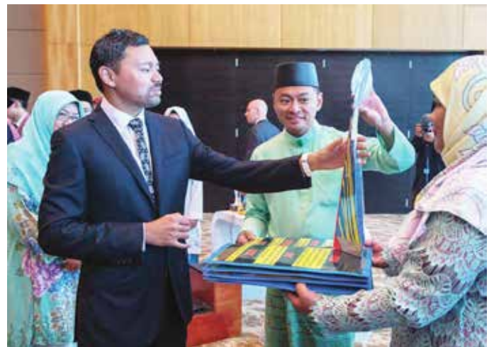
His Royal Highness The Crown Prince views an exhibition by one of the participants.

The Crown Prince CIPTA Awards also assists the country's agenda in the field of Science, Technology and Engineering towards achieving the target ratio of 60:40 for Science and Literature degree graduates. The presence of His Royal Highness reflected His Royal Highness's care and concern for the development of design and innovation in Science, Technology and Engineering.