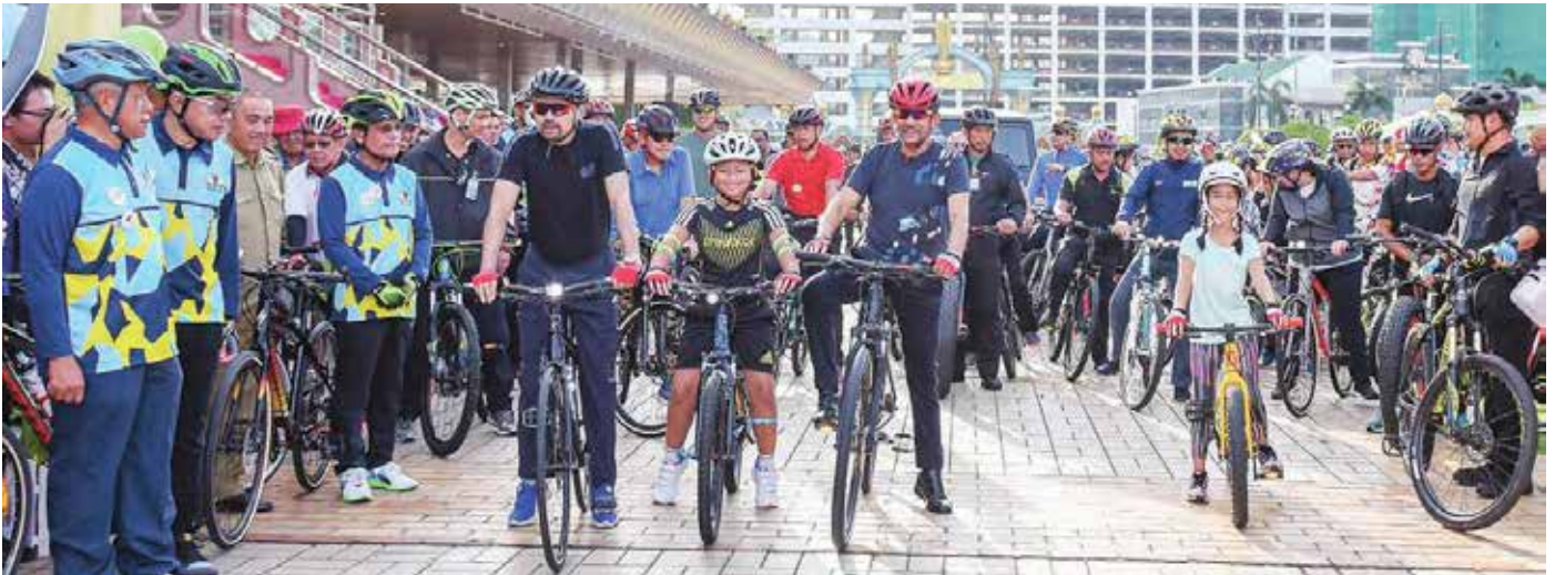
His Majesty and other members of the royal family Grace The Family Recreational Activities

Bandar Seri Begawan, May 6 - His Majesty Sultan Haji Hassanal Bolkiah Mu'izzaddin Waddaulah ibni Al-Marhum Sultan Haji Omar 'Ali Saifuddien Sa'adul Khairi Waddien, Sultan and Yang Di-Per-tuan of Brunei Darussalam yesterday took part in the "Riadah dan Kayuhan Keluarga Harmoni 2017", or the Harmonious Family Recreation and Cycling 2017.