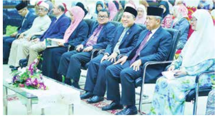
Yang Berhormat Pehin Datu Lailaraja Retired Major General Dato Paduka Seri Haji Awang Halbi bin Haji Mohamad Yusof, the Minister of Culture, Youth and Sports who is also the Acting Minister of Health at the 'Opening Ceremony of Conference on Philanthropy for Humanitarian Aid CONPHA 2017'.

With the theme "Philanthropy for Humanitarian Aid as a mechanism to alleviate poverty and maintain human dignity", the two-day conference aims to bring together researchers, practitioners and policy makers related to the issues of humanitarian aid. It is also intended to be a platform for discussion of issues relevant to the resolution, the ideas and the sharing of knowledge and experience, which is expected to submit proposals that