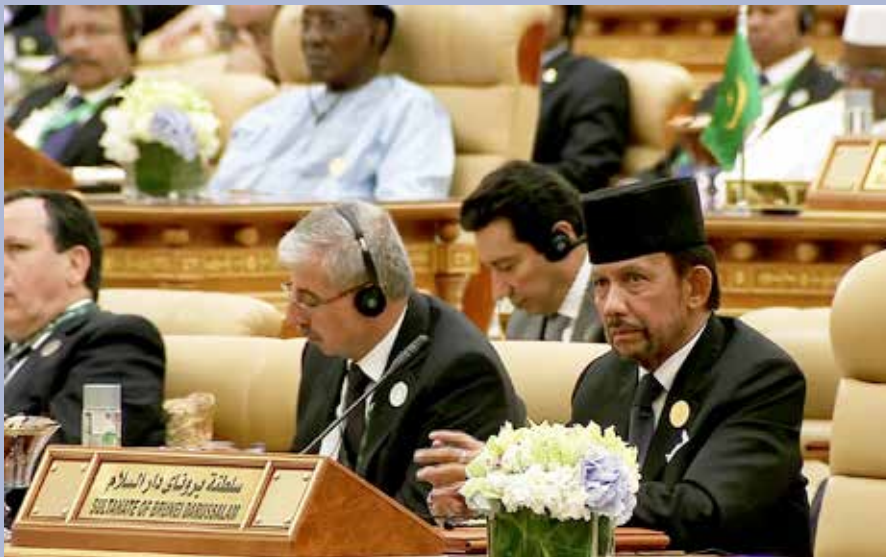
His Majesty the Sultan and Yang Di-Pertuan of Brunei Darussalam consented to attend the Arab Islamic American Summit held in Riyadh, Saudi Arabia.

Riyadh, May 21 - His Majesty Sultan Haji Hassanal Bolkiah Mu'izzaddin Waddaulah ibni Al-Marhum Sultan Haji Omar 'Ali Saifuddien Sa'adul Khairi Waddien, Sultan and Yang Di-Pertuan of Brunei Darussalam attended the Arab Islamic American Summit which was held at the King Abdul Aziz International Conference Centre in Riyadh.