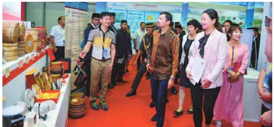
About 200 enterprises joined the expo, selling food, baked goods, pharmaceuticals, ICT services cosmetics and clothing. There was also participation from several local companies promoting inbound tours and travel.