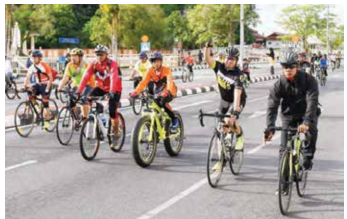
Members of the public taking part in the 'Riadah dan Kayuhan Keluarga Harmoni 2017'.