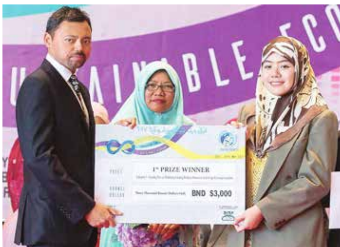
His Royal Highness Prince Doctor Haji Al-Muhtadee Billah ibni His Majesty Sultan Haji Hassanal Bolkiah Mu'izzaddin Waddaulah, The Crown Prince, Senior Minister at the Prime Minister's Office and Pro-Chancellor of Universiti Teknologi Brunei (UTB) presenting a prize to one of the winners.

Bandar Seri Begawan, May 25 - His Royal Highness Prince Doctor Haji Al-Muhtadee Billah ibni His Majesty Sultan Haji Hassanal Bolkiah Mu'izzaddin Waddaulah, the Crown Prince, Senior Minister at the Prime Minister's and Pro-Chancellor of Universiti Teknologi Brunei (UTB) graced the Crown Prince Creative and Innovative Product and Technological Advancement (CIPTA) Awards ceremony.