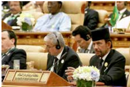
1 His Majesty Attends Arab Islamic American Summit