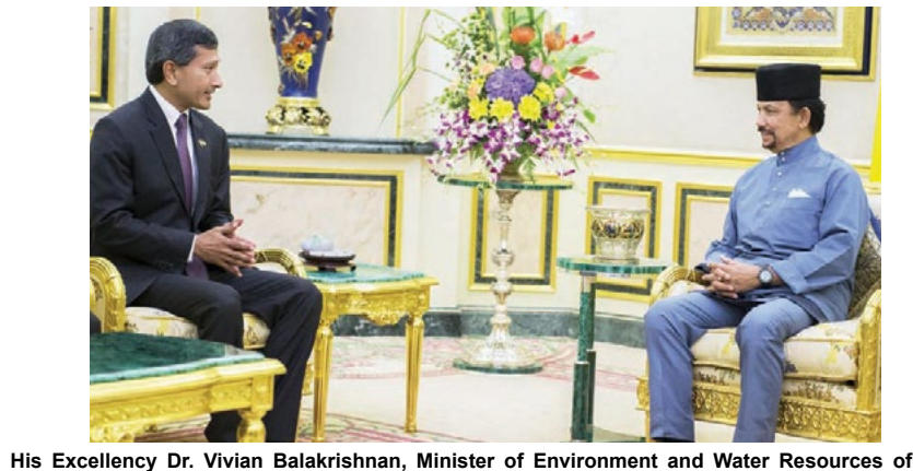
Singapore on April 30.