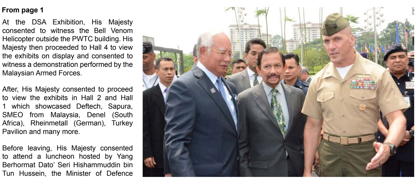
His Majesty being briefed by one of the exhibitors from the United States of America.