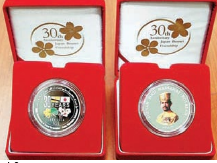
18. AMBD launches coins to mark 30 years of Brunei-Japan diplomatic ties

16. His Royal Highness attends 4th Annual Investment Meeting 2014