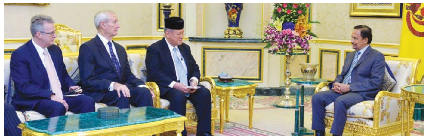
The Honourable Bruce Scott MP, the Deputy Speaker of the House of Representatives of Australia on April 9.