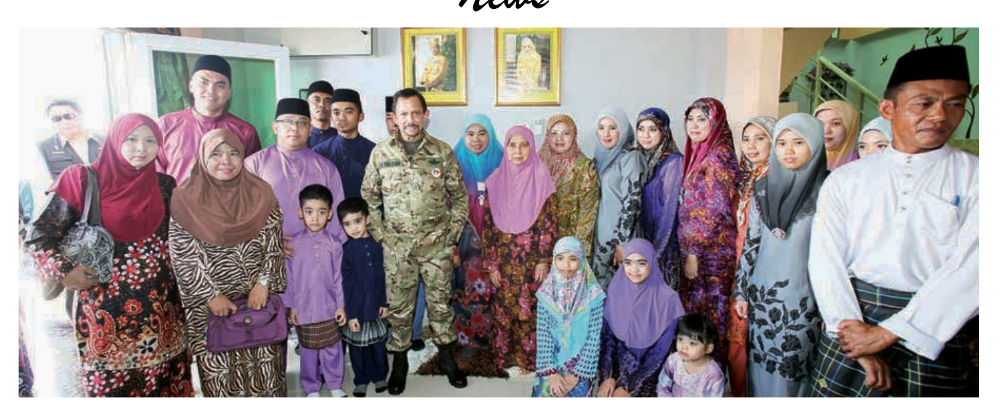
His Majesty in a group photo with the family of one of the recipients of the house keys during His Majesty's visit to the recipient's house

The implementation of the National Housing Programme through the National Housing Scheme and the Indigenous Citizens Land Award Scheme since 1996 has provided a total of 21,333 housing units nationwide. Of the total, 14,426 houses have been awarded to eligible recipients, of whom 8,616 are from the Brunei-Muara District.