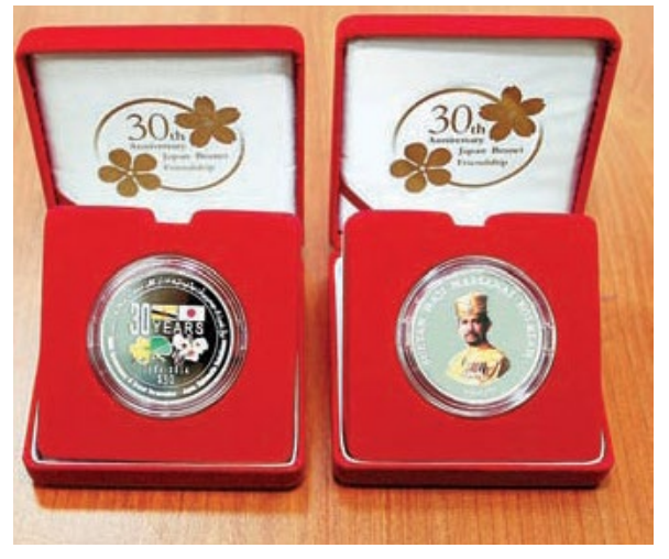
The silver commemorative coins launched in conjunction of the 30^{\rm th} Anniversary of Brunei-Japan diplomatic relations.

BANDAR SERI BEGAWAN, April 2 – In conjunction with the 30<sup>th</sup> Anniversary of Brunei-Japan diplomatic relations, Autoriti Monetari Brunei Darussalam (AMBD) launched commemorative silver coins that are legal to be used in the country.