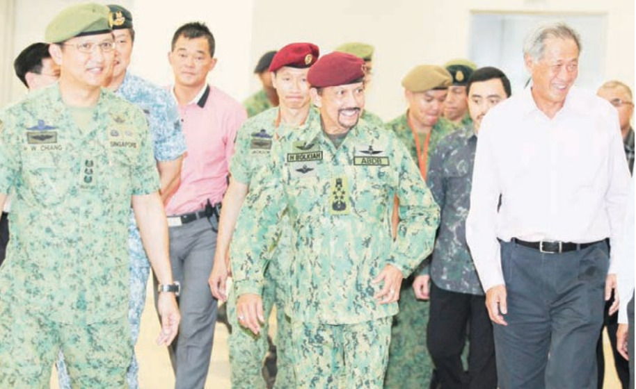
Complex (MMRC) at Pasir Laba Camp.