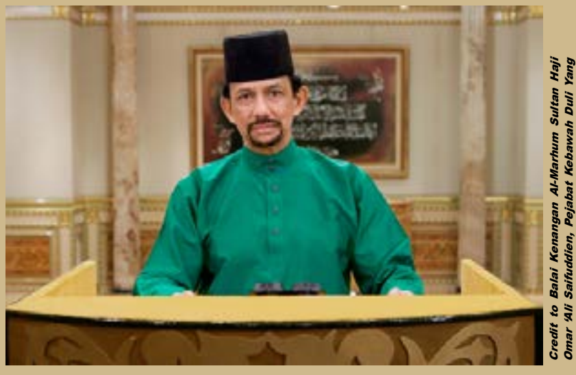
His Majesty delivers his speech at the Istana Nurul Iman.