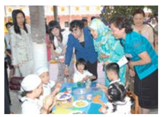
Her Royal Highness at the Guangxi Zhuang Nursery.