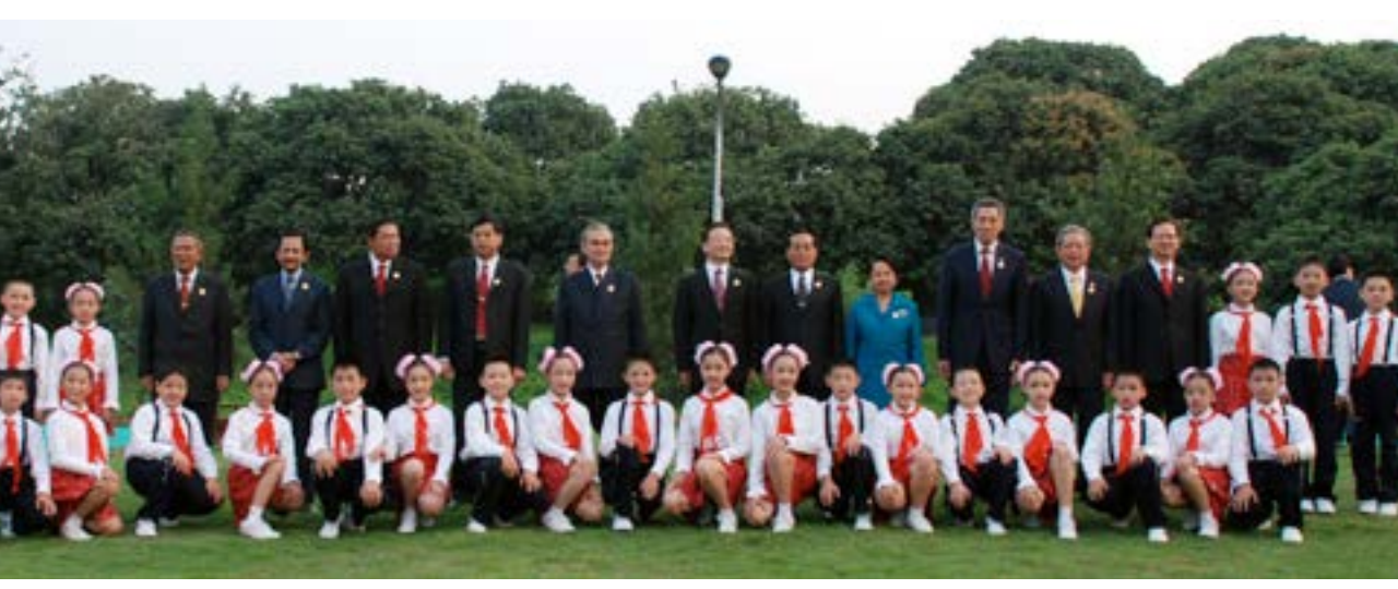
His Majesty with leaders of other ASEAN member countries and Prime Minister of China in a group photo after planting of trees.