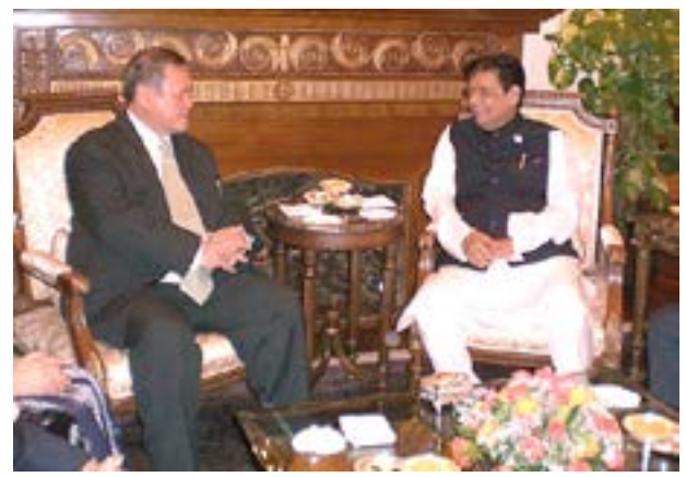
Minister of Foreign Affairs and Trade II (Second) in a meeting with India's Minister of State for External Relations, His Excellency E. Ahmed.

He also held meetings with India's Minister of Defence and Minister of State for Communications and Information Technology. He also had discussions with members of the Federation of Indian Chamber of Commerce and Industries (FICCI). The discussions were aimed at promoting economic cooperation between Brunei Darussalam and the Republic of India.