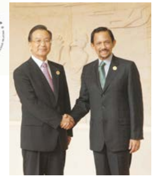
His Majesty with His Excellency Prime Minister of China prior to bilateral meeting

His Majesty receives in audience, Prime Minister of Lao's People Democratic Republic, His Excellency Bouasone Bouphavanh.