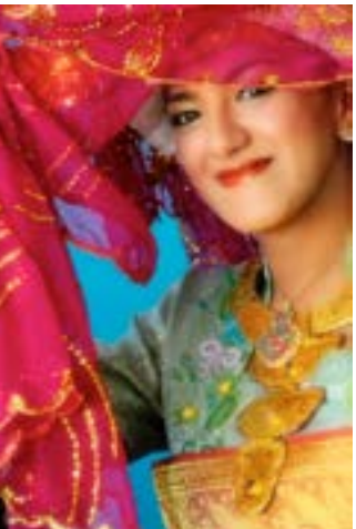
The bride with traditional wedding costume.