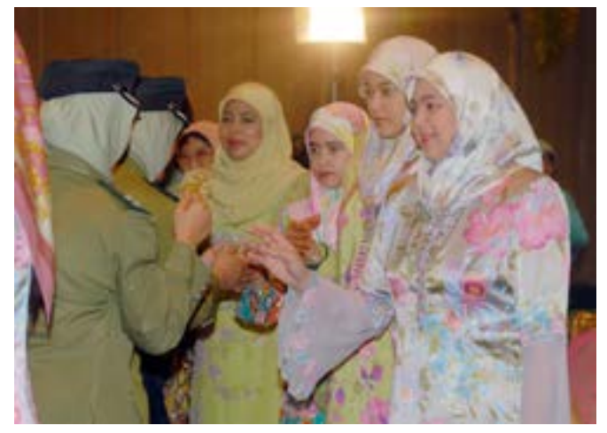
Female members of royal family receive women uniformed personnel.