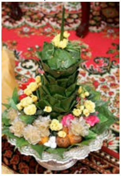
Sirih junjung as part of the Hantaran Berian.