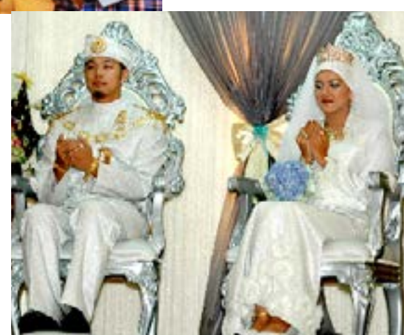
The new wed-couple on the dais.

Brunei Malay wedding is unique on its own. It has been practiced for decades and the tradition remains strong. A unique