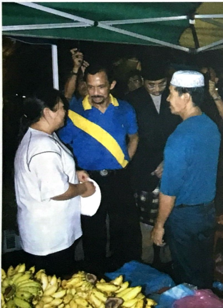
His Majesty taking a closer look at the night stalls in Gadong

At the ceremony, awards were given to exemplary religious schools for the year 1426 Hijrah (Islamic calendar). Awards were given to Tumpuan Telisai Religious School as winner, Pengiran Anak Puteri Azemah Ni'matul Bolkiah Religious School as first-runner up and Pengiran Anak Puteri Rashidah Sa'adatul Bolkiah Religious School as second-runner up.