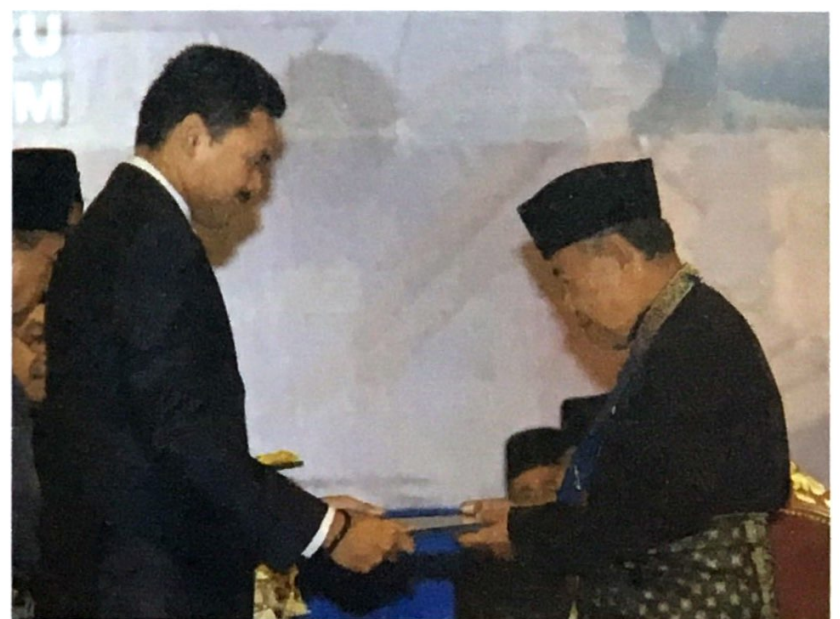
A recipient of a Teachers' Day Award receives his certificate from His Royal Highness

His Royal Highness the Crown Prince consented to grace the Teachers' Day celebration on behalf of His Majesty The Sultan and Yang Di-Pertuan of Brunei Darussalam. His Majesty was still abroad having attended the ASEAN-UN Leaders Meeting, High-Level Plenary Meeting and the General Debate