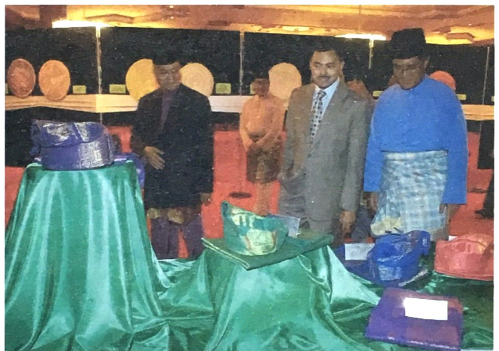
His Royal Highness taking a closer look at an exhibition displayed at the Department of Royal Custom and Traditions

The Deputy Sultan continued his series of working visit to two departments under Ministry of Defence by visiting the Directorate of Administration and Manpower and the Directorate of Finance and Acquisition on September 19 and 22 respectively.