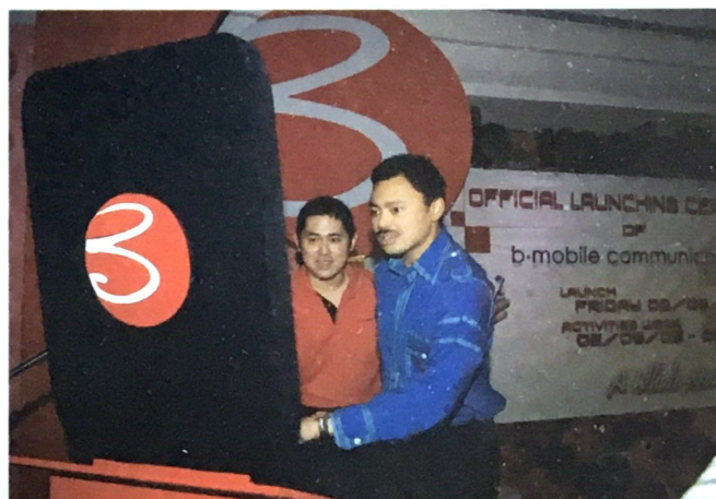
His Royal Highness officially launch B-Mobile, the first 3G telecommunication network in Brunei Darussalam

Communications in Brunei Darussalam had been progressively evolving ever since its introduction in 1920. From wireless telegraph circuit, Very High Frequency (VHF) radio to fixed land lines, Brunei now has three telecommunications network namely; Telekom Brunei which provides fixed land lines services; Data Stream Technologies (DST) Communications Sdn Bhd which provides Global System for Mobile Communications (GSM) and internet services; and B-Mobile as the first 3G network provider.