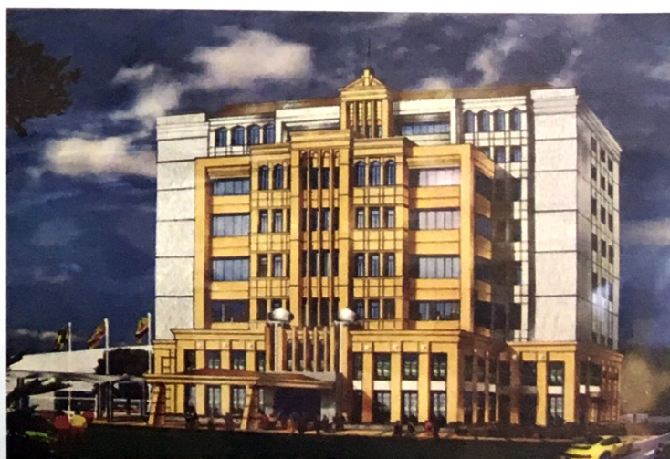
A replica design of the new City Hall Building

The new building will enable varieties of cultural and traditional activities to take place. It will also house the Municipal Department.