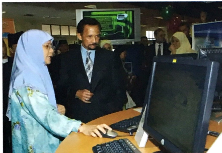
Exhibition at the National Summit on Information Society showcasing latest Info-communications technologies

The 17 th convocation ceremony took place on September 6 at the Chancellor Hall of UBD. His Majesty awarded 54 graduates with their Masters Degree and 657 graduates with their First Degree. While His Royal Highness The Crown Prince awarded 357 graduates with their Diplomas and Certificates.