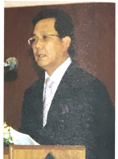
Pehin Dato Paduka Haji Awang Suyoi, Minister of Health at the launching of Alignment Workshop

Main referral hospital of this country, Raja Isteri Pengiran Anak Saleha (RIPAS) Hospital, as the frontline agency in the medical field, should ensure that all of her divisions are operating efficiently. The divisions should help one another and work in unity.