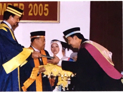
His Majesty presenting a graduate with a certificate

It is high time for Brunei Darussalam to have its own Islamic University. This university would serve as basis to fulfil the current and future needs and be national landmark. This was highlighted by His Majesty The Sultan and Yang Di-Pertuan of Brunei Darussalam at the 17 th Convocation Ceremony of University Brunei Darussalam (UBD).