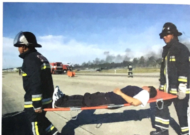
Air crash exercise at the Brunei International Airport