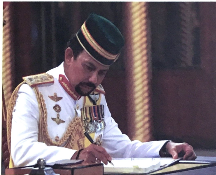
His Majesty signs the amended Constitution on September 29, 2004 at the Lapau in Bandar Seri Begawan

Previously, His Majesty announced his consent to reactivate the State Legislative Council at his 58 th birthday anniversary on July 15, 2004. The first session of the State Legislative Council was held on September 25, 2004 at the International Convention Centre in Berakas.