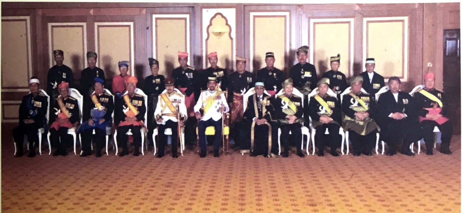
His Majesty The Sultan and Yang Di-Pertuan of Brunei Darussalam in a group photo with the previous members of the State Legislative Council