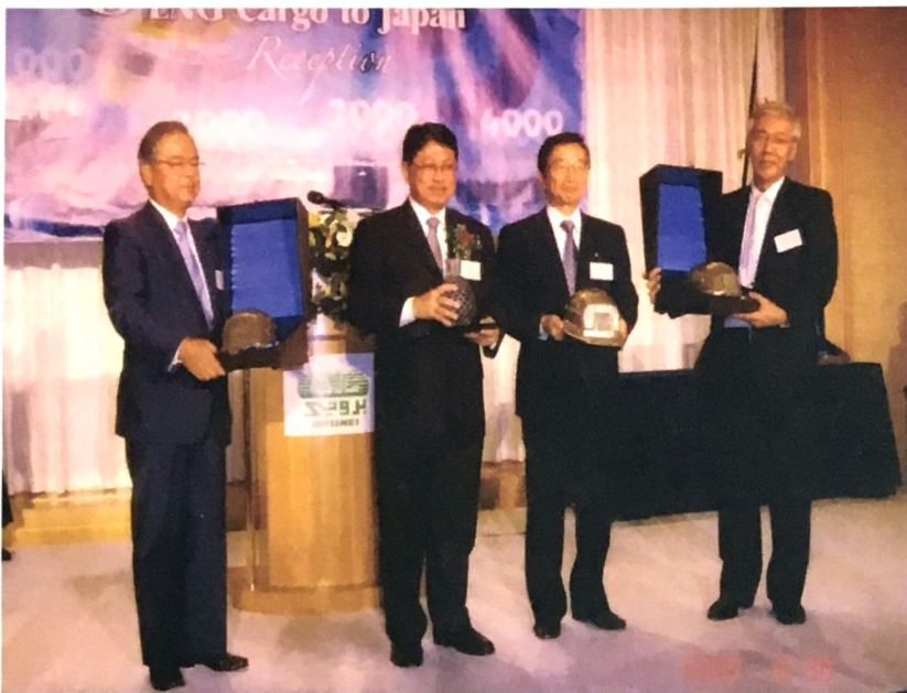
Pehin Dato Paduka Haji Awang Yahya, Minister of Energy at a reception to mark the 5000 th cargo delivery of BLNG to Japan

A significant milestone in the history of Brunei Liquefied Natural Gas (LNG) was achieved with the delivery of the 5000 th cargo to Japan. The cargo was sent on June 15 this year.