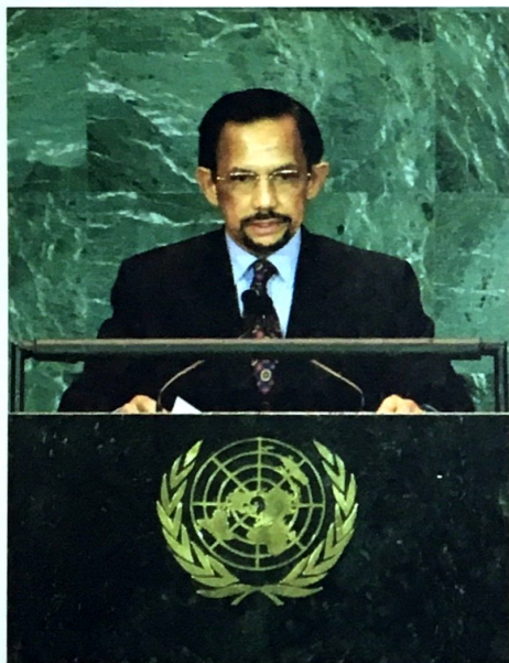
His Majesty delivers a speech at the General Debate of the 60 th Session of the United Nations General Assembly in New York

His Majesty said this at the General Debate of the 60 th Session of the United Nations General Assembly in New York on September 17.