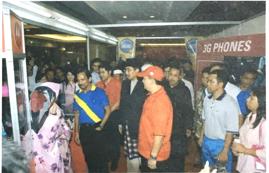
Members of the public took the opportunity to talk with the sovereign