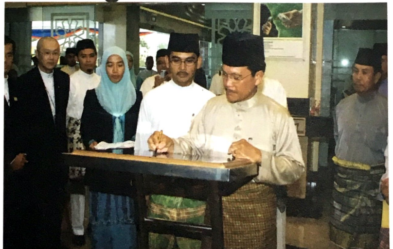
Two latest products of IBB launched at the newly opened IBB branch