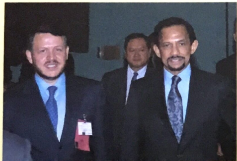
His Majesty with His Majesty King Abdullah II bin Al-Hussien, the King of Jordan