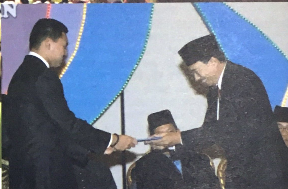
Pehin Dato Paduka Haji Awang Hazair, the Deputy Minister of Health receives his certificate from His Royal Highness