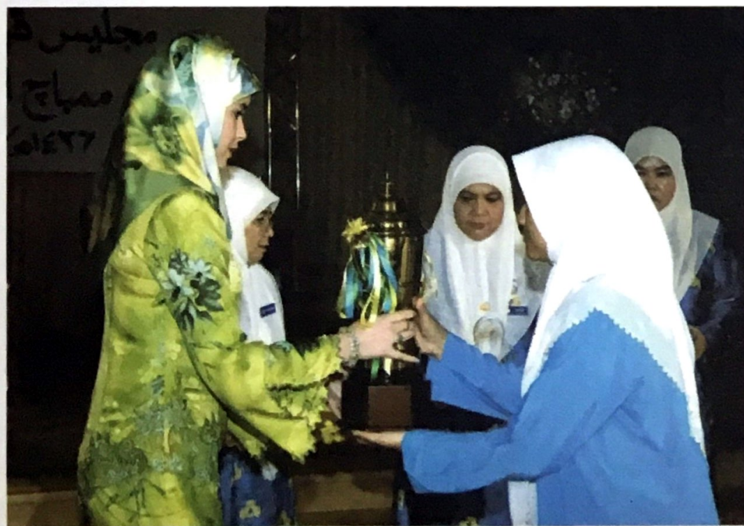
Her Royal Highness presented a trophy to the winner of the Quran reading competition organised by Girl Guide Association

At the 12 th Civil Service Day, His Royal Highness presented the Quality Control Circle (KQC) award. The award was won by Orchid Group from the Ministry of Industry and Primary Resources. A certificate presentation was also held for 90 newly retired government officers.