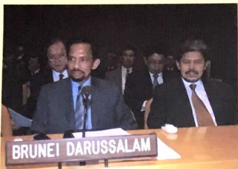
His Majesty and His Royal Highness Prince Mohamed Bolkiah at the Second ASEAN-UN Summit