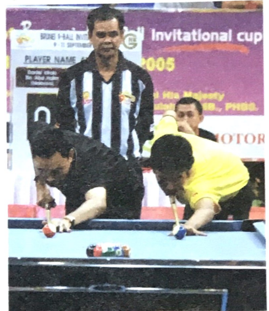
His Royal Highness taking part in the tournament