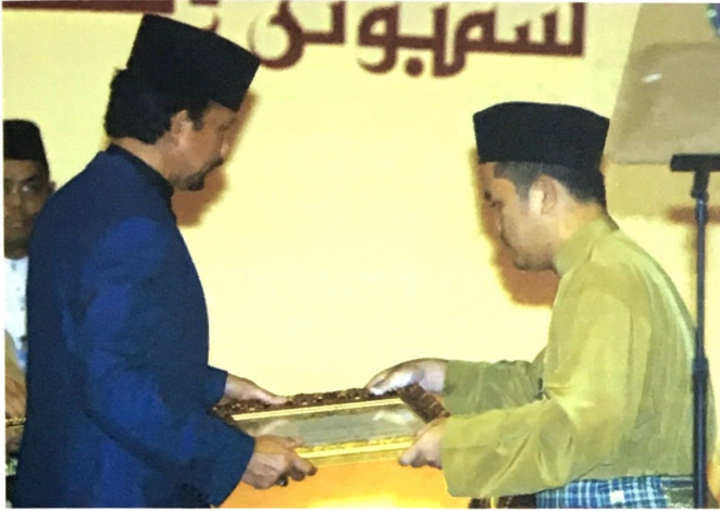
Recipient of the Exemplary Religious School Award receives the award from His Majesty

In an effort to develop the society and the nation, we should not be carried away with modernity. We should be more cautious in selecting the path of progress which is in accordance with the guidelines set by Allah The Almighty.