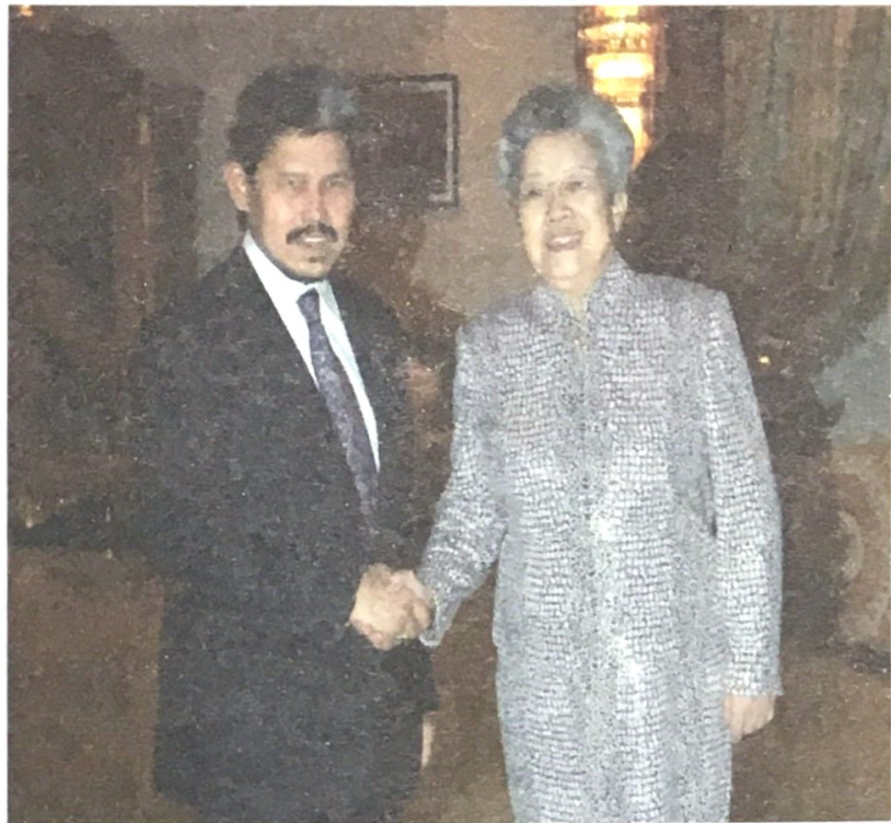
His Royal Highness Prince Mohamed Bolkiah and Her Excellency Wu Yi prior to dinner hosted in honour of Her Excellency's working visit to Brunei

Her Excellency Wu Yi was on a three-day official visit to Brunei.