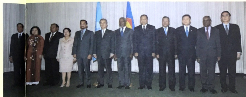
His Majesty with world leaders at the ASEAN-UN Summit and UN General Assembly in New York

"But behind all these efforts are the kinds of values we want to see in Southeast Asia. By these, I mean there are the ones you yourself have promoted, Secretary-General. The ones you have underlined very well indeed in your report on "larger freedom", mutual respect and understanding among all peoples no matter what their background or culture shared expertise and human resources. Recognition of our common humanity and common needs. And, perhaps most important of all the belief that dialogue and negotiation are the only acceptable basis on which to conduct International Affairs," said His Majesty.