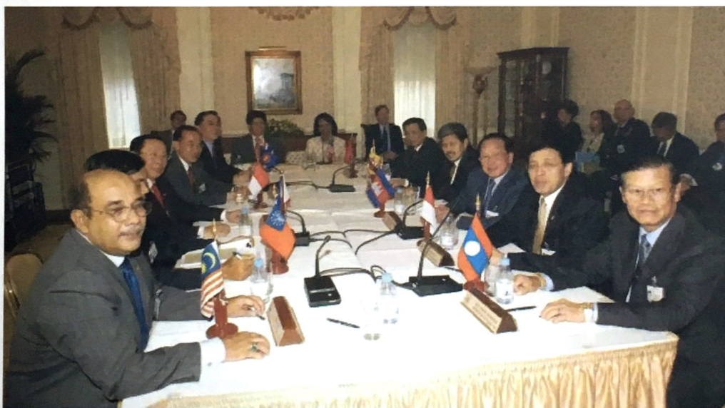
ASEAN Foreign Ministers in a meeting with United States' State Secretary

His Royal Highness Prince Mohamed Bolkiah, Minister of Foreign Affairs and Trade was in New York, United States of America to attend an ASEAN Foreign Ministers Informal Meeting at the United Nations Headquarters on September 12.