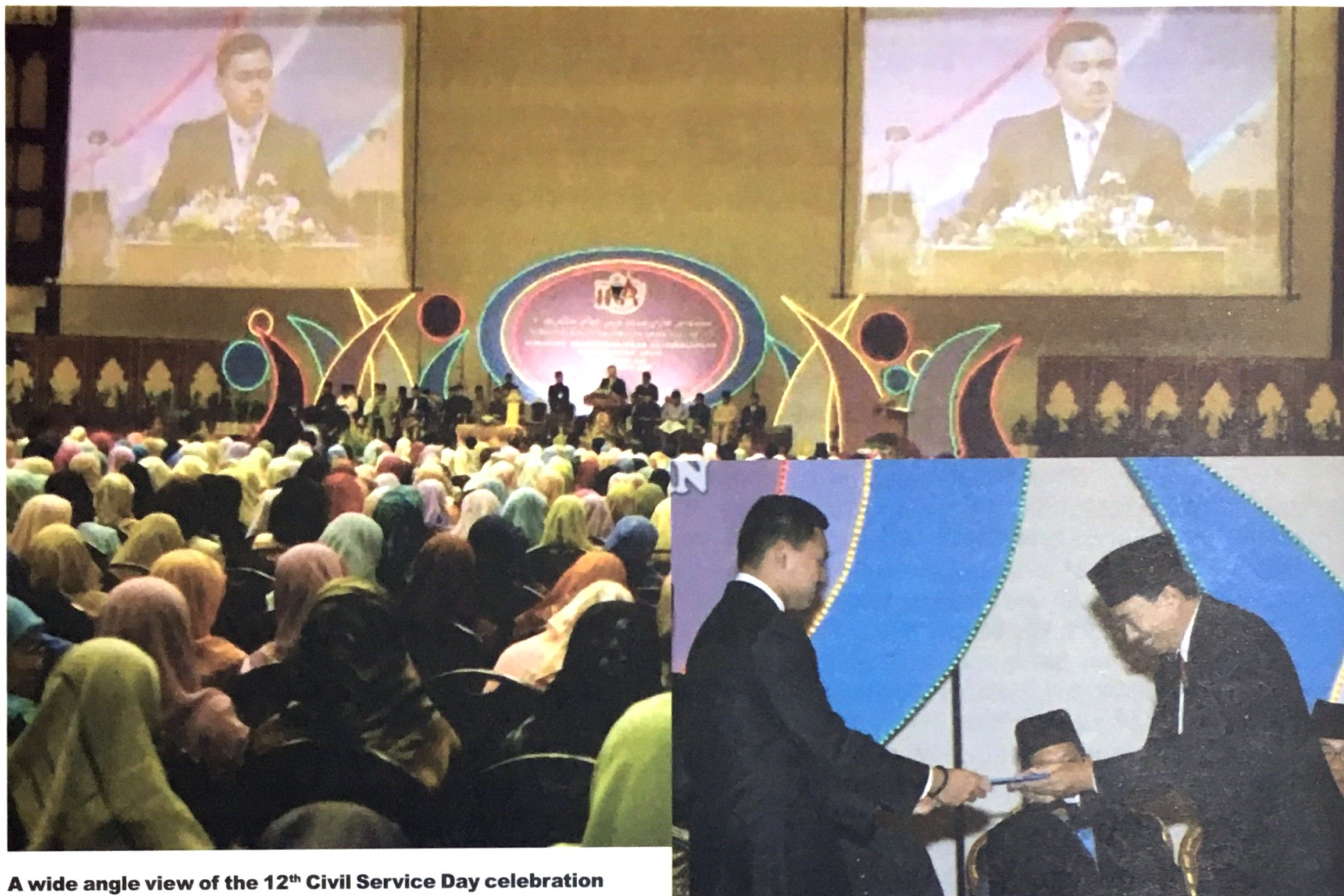
A wide angle view of the 12 th Civil Service Day celebration