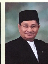
YB Pehin Udana Khatib Dato Paduka Seri Setia Ustaz Haji Awang Badaruddin bin Pengarah Dato Paduka Haji Othman, Deputy Minister of Religious Affairs.