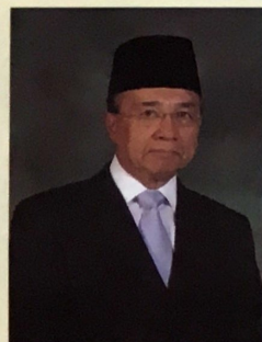
YB Pehin Orang Kaya Seri Lela Dato Seri Setia Awang Haji Abdul Rahman bin Dato Setia Haji Mohamed Taib, Minister of Education.