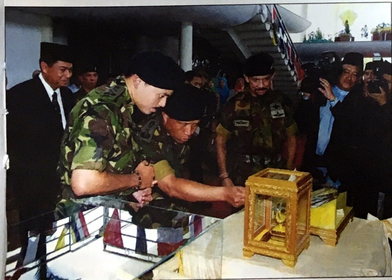
Token of appreciations were presented to commemorate the presence of His Majesty and His Royal Highness the Crown Prince at the celebration