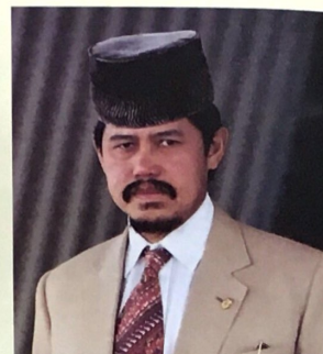
His Royal Highness Prince Mohamed Bolkiah, Minister of Foreign Affairs.