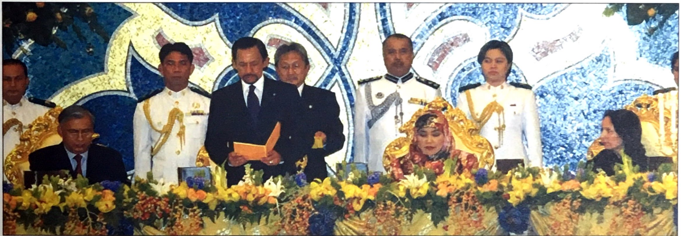
Their Majesties, His Excellency The Prime Minister of Pakistan and consort at a dinner banquet