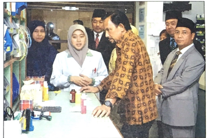
Pharmacy area was also under Royal scrutiny