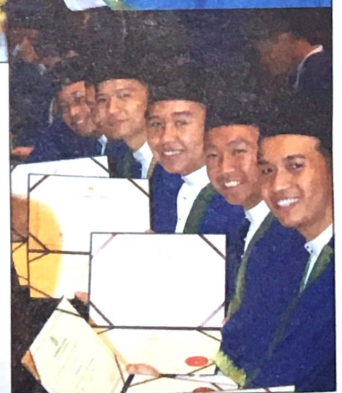
Proud and happy graduates show off their certificates