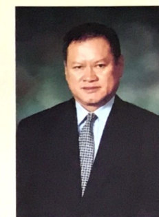
YB Pehin Orang Kaya Pekerma Dewa Dato Seri Paduka Lim Jock Seng, Minister of Foreign Affairs II.