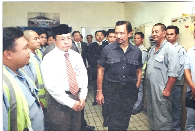
Staff members of the Royal Brunei Airlines receive a visit from His Majesty

Brunei International Airport became operational in 1974. The airport's inauguration marked an important date in the history of civil aviation in Brunei. The airport is operating until now and further development projects were done to improve its standard as the gateway to Brunei.