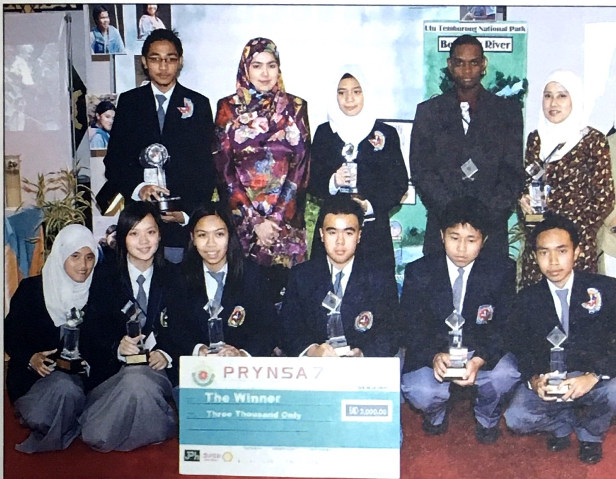
HRH Princess Hajah Rashidah (standing, 2 nd right) with Winners of the PRYNSA 7.