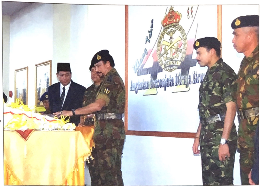
His Majesty officially opens the 44th anniversary of Royal Brunei Armed Forces

RBAF celebrates its anniversary every May 31. This year's celebration carries the theme "Together We Strengthen Armed Forces' Self Reliance".