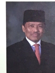
YM Dato Paduka Haji Yusof bin Haji Abdul Hamid, Deputy Minister of Communications.