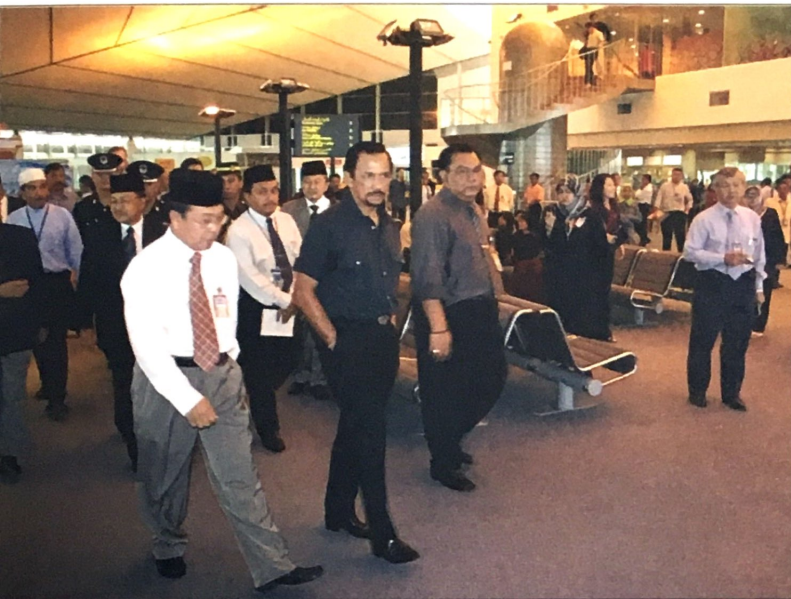
His Majesty visits the departure lounging area at the Brunei International Airport