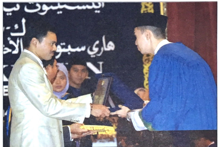
A graduate receives his award from His Royal Highness

ITB is one of the higher academic institutions in Brunei Darussalam where Higher National Diploma courses are offered. The first intake was recruited in 1986. Currently, the institute is divided into two schools; School of Engineering and School of Business Management.