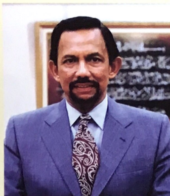
His Majesty The Sultan and Yang Di-Pertuan of Brunei Darussalam as the Prime Minister, Minister of Defence and Minister of Finance.