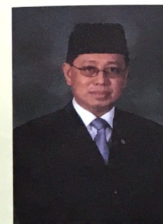
YB Pehin Orang Kaya Seri Utama Dato Seri Paduka Awang Haji Yahya bin Begawan Mudim Dato Paduka Haji Bakar, Minister of Energy at the Prime Minister's Office.