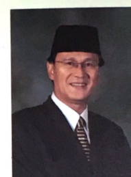
YM Dato Paduka Haji Eusoff Agaki bin Haji Ismail, Deputy Minister at the Prime Minister's Office.