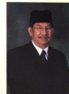
YB Pehin Orang Kaya Laila Setia Dato Paduka Haji Abd Rahman bin Haji Ibrahim, Minister of Finance II.