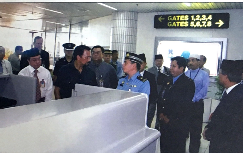
An immigration official explains briefly to His Majesty at the Custom and Immigration booth

Department of Civil Aviation (DCA) and Royal Brunei Airlines (RBA) received a visit by His Majesty The Sultan and Yang Di-Pertuan of Brunei Darussalam on May 12.