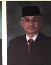
YM Dato Paduka Awang Haji Yakub bin AbuBakar, Deputy Minister of Culture, Youth and Sports.