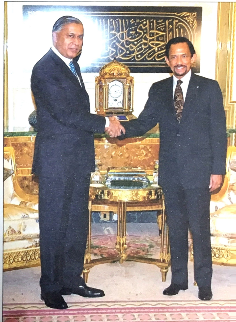
His Majesty The Sultan and Yang Di-Pertuan of Brunei Darussalam with His Excellency Shaukat Aziz, the Prime Minister of Pakistan

The sovereign also expressed his appreciation towards Pakistan nationals who have contributed to Brunei's own development.