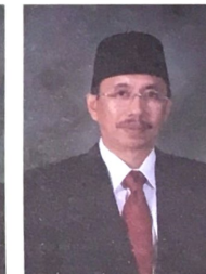
YB Pehin Orang Kaya Pekerma Lela Diraja Dato Paduka Haji Hazair bin Haji Abdullah, Deputy Minister of Health.