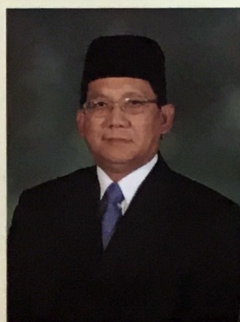
YB Pehin Orang Kaya Indera Pahlawan Dato Paduka Haji Suyoi bin Haji Osman, Minister of Health.