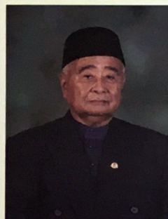
YB Pehin Jawatan Luar Pekerma Raja Dato Seri Utama Dr Ustaz Haji Mohd Zain bin Haji Serudin, Minister of Religious Affairs.