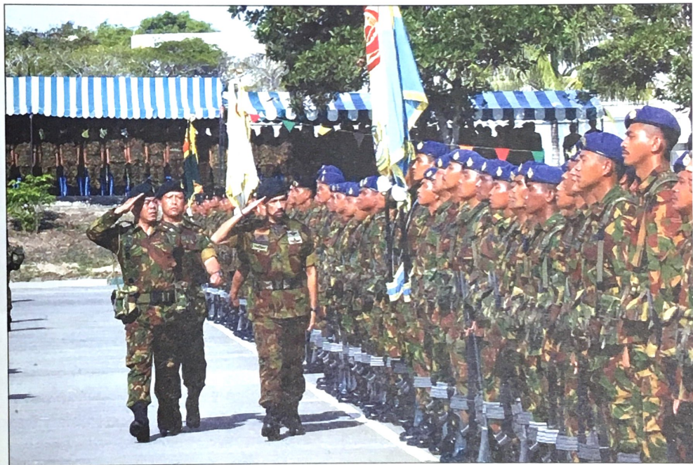
Guard-of-honour to welcome the arrival of the sovereign