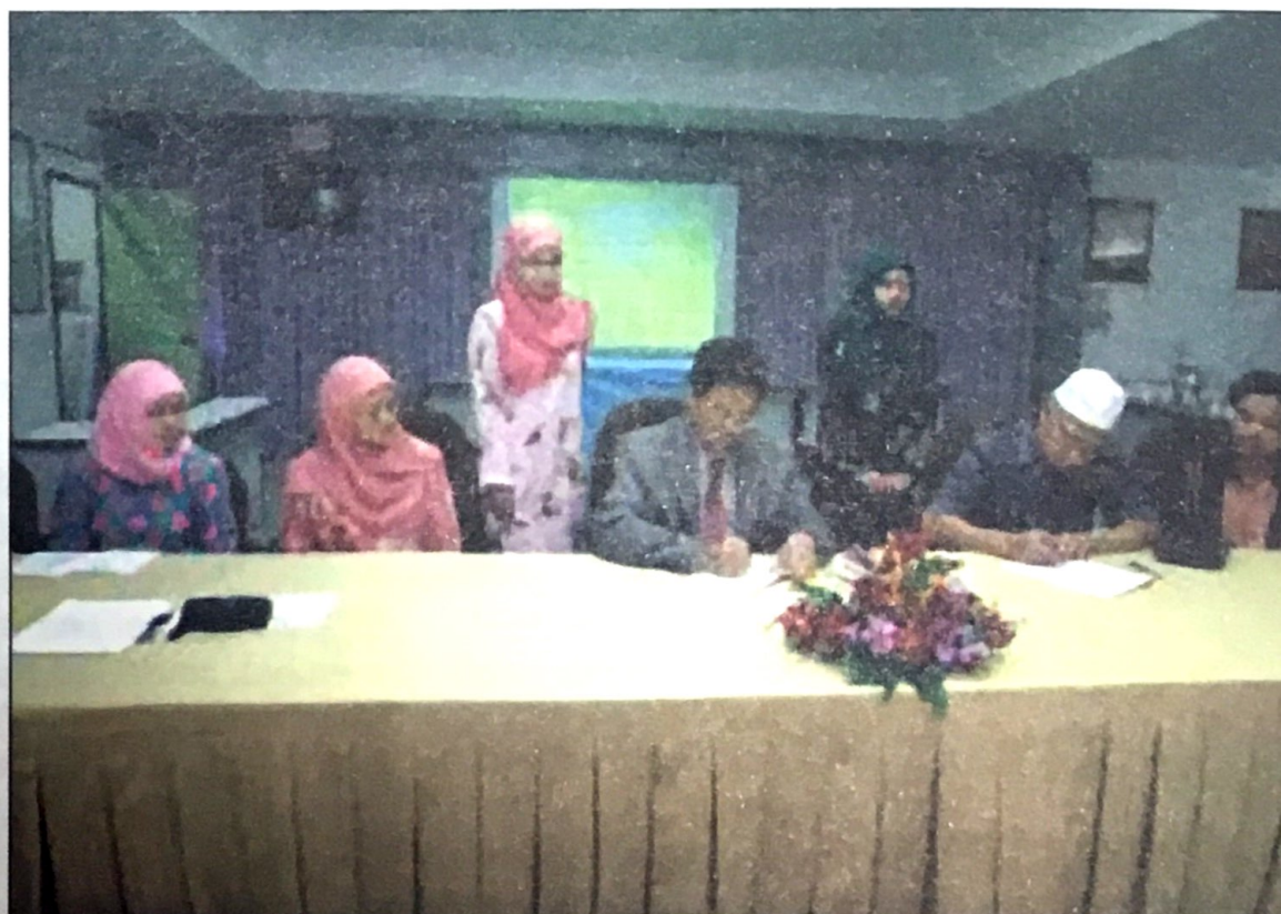
Director of Agriculture (center) signs an agreement which allows selected companies to lease lands lots for agricultural purposes

The Government of His Majesty had given a number of incentives to promote the agricultural sector. Various facilities such as water and electricity, and low rates for land leases are among the incentives given.