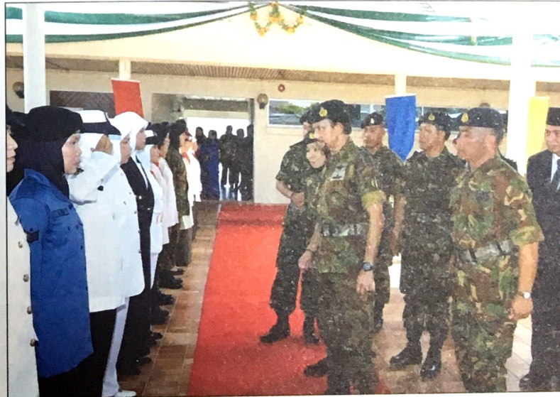
His Majesty meets members of the Women's Company