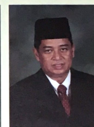
YB Pehin Datu Singamenterri colonel (N) Dato Paduka Haji Mohamad Yasmin bin Haji Umar, Deputy Minister of Defence.