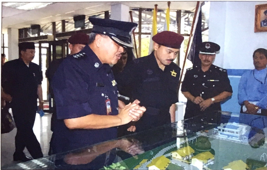
The Police Commissioner briefs His Royal Highness during a work-visit