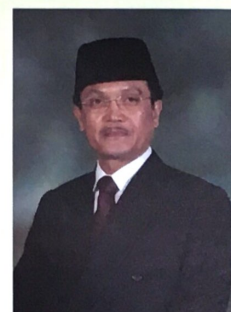
YB Pehin Orang Kaya Seri Kerna Dato Seri Setia Haji Awang Abu Bakar bin Haji Apong, Minister of Communications.