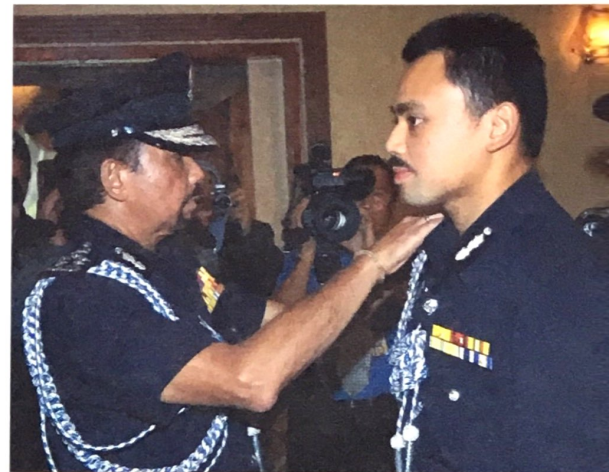
His Royal Highness receives the rank of Deputy Inspector General of Police

Within the 84 years of establishment, RBPF had made great strides towards excellence. RBPF introduced the first intake of Women Police on August 4, 1971. In 1984, RBPF became a member of INTERPOL and ASEANAPOL. RBPF also participated in UNTAC mission in Cambodia and COMSA mission in South Africa in 1992 and 1993 respectively. Currently, RBPF have seven Police Districts; four located in Brunei Muara District and one each at the other three districts.