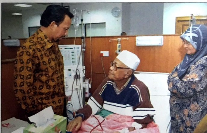
A patient at the Rimba Health Centre talks with His Majesty