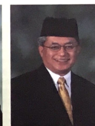
YM Dato Paduka Haji Hamdilah bin Haji Abdul Wahab, Deputy Minister of Industry and Primary Resources.