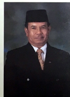
YB Pehin Orang Kaya Seri Dewa Major General (R) Dato Seri Pahlawan Awang Haji Mohammad bin Haji Daud, Minister of Culture, Youth and Sports.