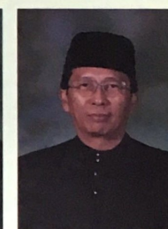
YM Pengiran Dato Seri Setia DrHaji Mohammad bin Pengiran Haji Abd Rahman, Deputy Minister of Education.