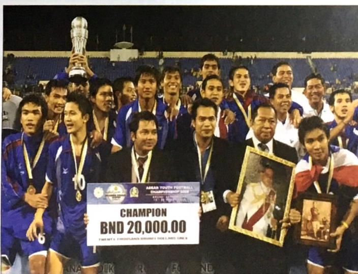
B$20,000 for the winner

For this tournament, Myanmar came in second with Laos and Vietnam at third place after losing their semi-finals.