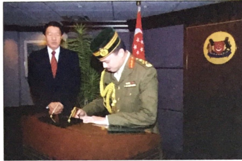
His Royal Highness signs a guestbook