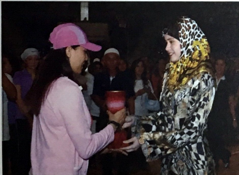
Winner of RBA charity netball tournament receives a trophy