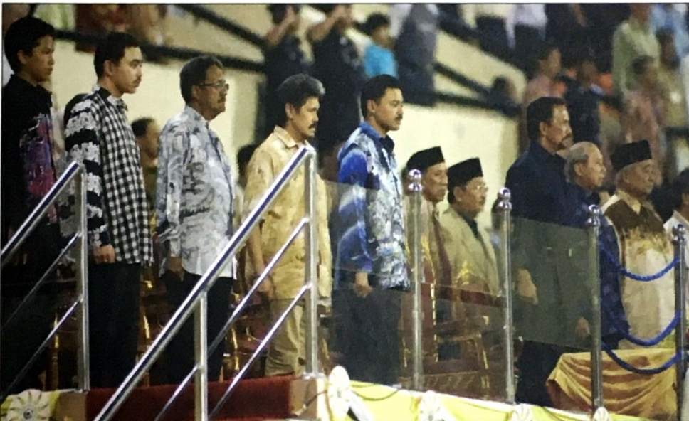
Royal entourage witness the opening of the Hassanal Bolkiah Trophy