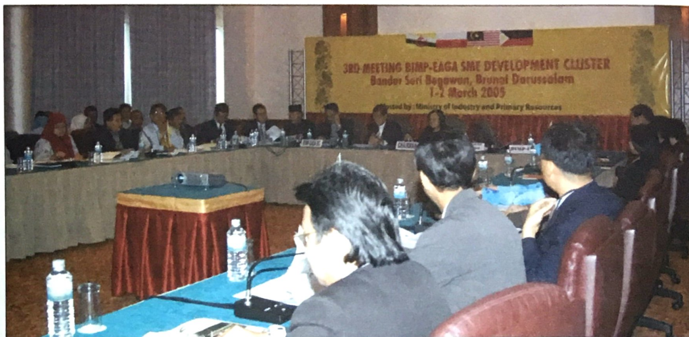
3 rd Meeting for BIMP-EAGA Development Cluster was held in Bandar Seri Begawan