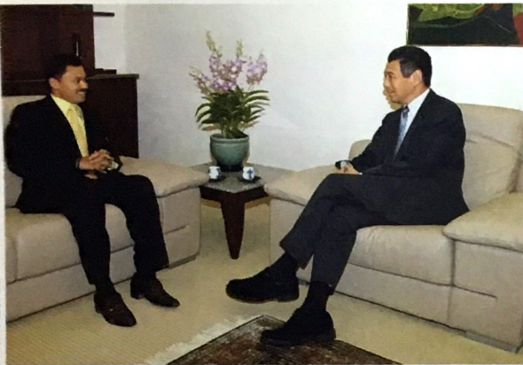
His Royal Highness with the Prime Minister of Singapore His Excellency Lee Hsien Loong