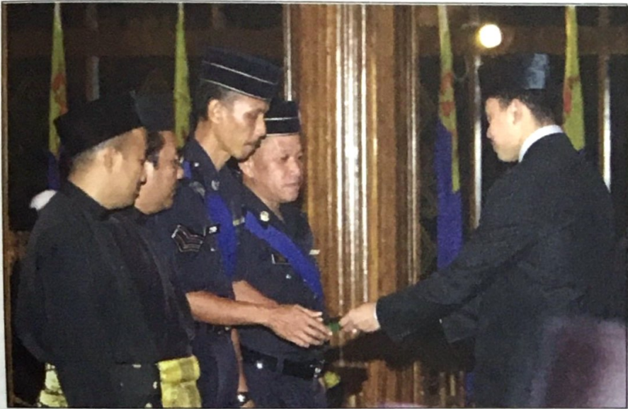
A recipient receives his honorary medal from His Royal Highness

H is Majesty The Sultan and Yang Di-Pertuan of Brunei Darussalam consented to award honorary medals in conjunction with his 58 th birthday anniversary.