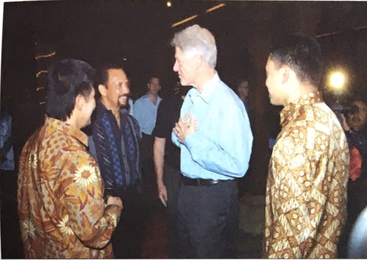
His Majesty with the former president of the United States, His Excellency President Bill Clinton