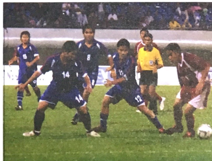
Exciting match displayed during the final of Hassanal Bolkiah Trophy

* From frontpage (Hassanal Bolkiah Trophy)