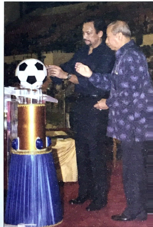
His Majesty The Sultan and Yang Di-Pertuan of Brunei Darussalam officially opens the championship