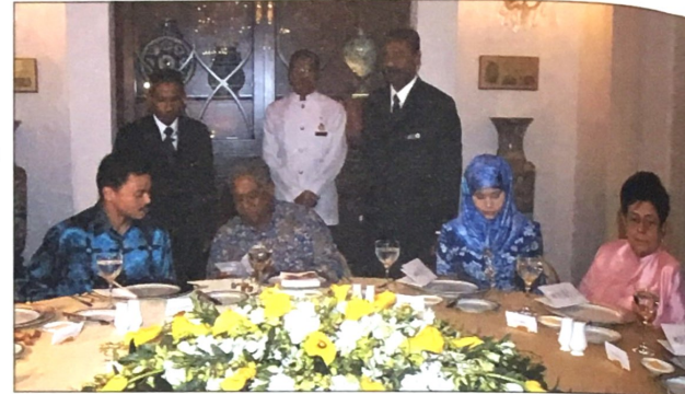
Their Royal Highnesses at the banquet hosted by the President of Singapore and consort