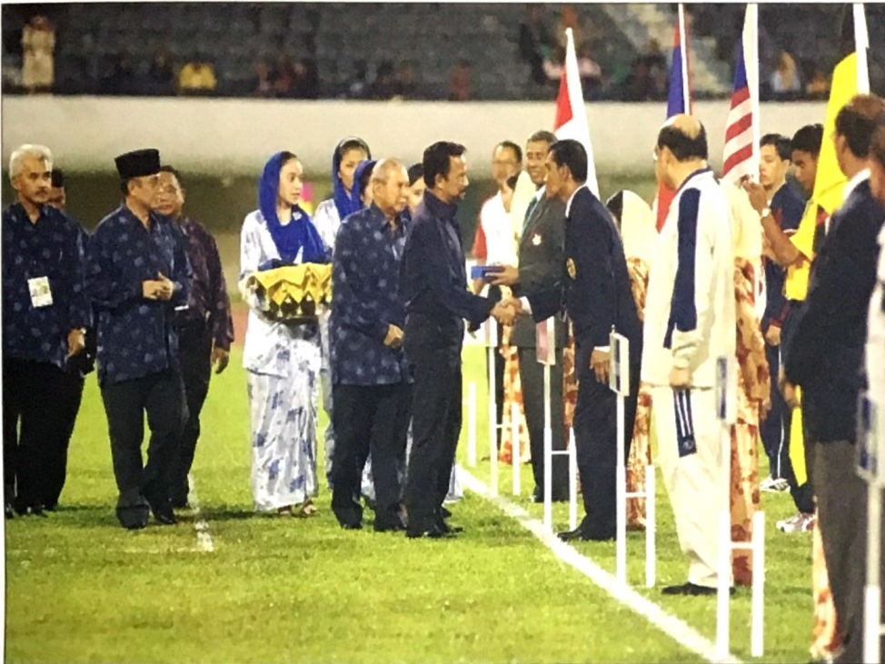
His Majesty meets officials from respective teams