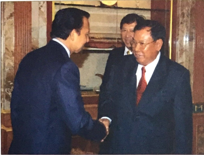
His Majesty and the Prime Minister of Laos