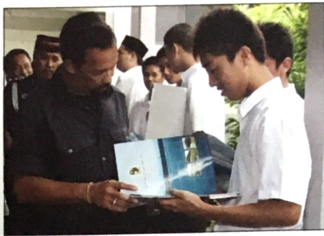
A student showing his books to His Majesty

Sekolah Tinggi Perempuan Raja Isteri (STPRI), an all girls' school was among the school visited by His Majesty