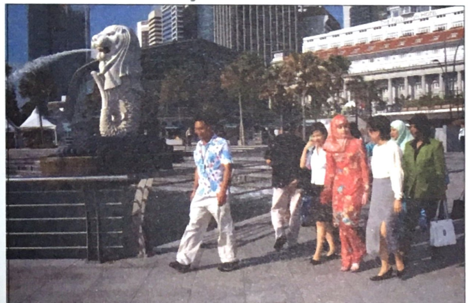
Her Royal Highness on a City Tour in Singapore

During their visit, Their Royal Highnesses attended a banquet hosted by His Excellency President S.R Nathan at the Istana Negara. Their Royal Highnesses also attended a luncheon hosted by His Excellency Senior Minister of Singapore and spouse. Their Royal Highnesses also attended a banquet hosted by Rear Admiral (NS) Teo Chee Hean, the Minister of Defence and spouse at the Grand Hyatt Hotel.