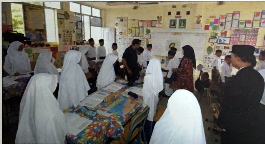
His Majesty talks to a student of the Raja Isteri Fatimah Primary School

Caring monarch mingles with the students