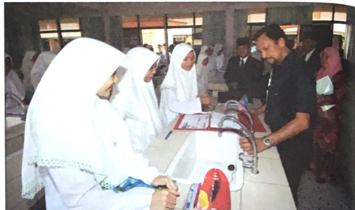
Science Laboratory, one of the facilities provided in the school