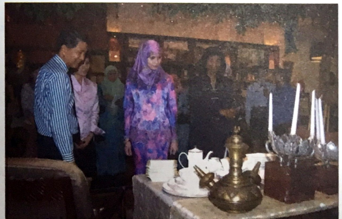
Her Royal Highness visits the Asian Civilisation Museum