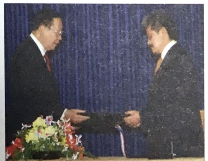
MOU signed to enhance cooperation in higher education and professional training

The MOU signed is hoped to enhance the cooperation in higher education and professional training in degree and post degree level.