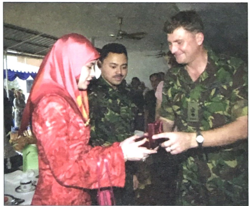
Her Royal Highness receives a memento from officials of the Brunei Garrison

His Royal Highness went to Bukit Puan in Labi to witness the jungle training activity of Brunei Garrison. While Her Royal Highness visited the Hornbill School and Family Community Centre.