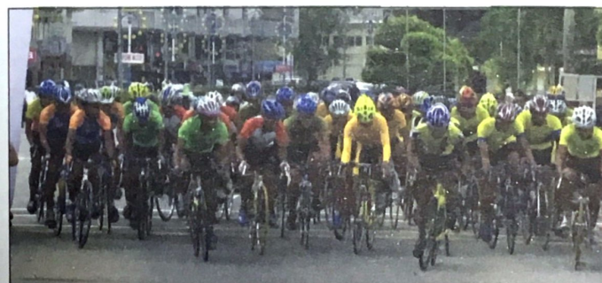
Cyclers at the 1 st Le Tour De Brunei which offered a total of B$40,000 prize money

The second stage of the race brought cyclist to travel the longest route from Bandar Seri Begawan to Kuala Belait district covering 167 km.