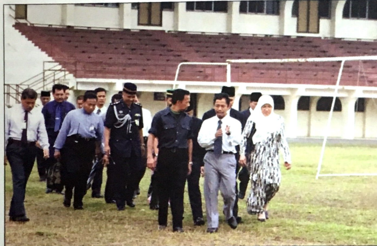
Football field for extra curriculum activities as one of the many facilities available in the school