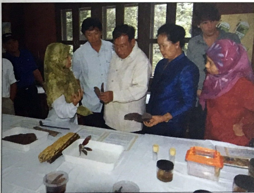
His Excellency at the Kuala Belalong Rainforest Research Centre based at Temburong District