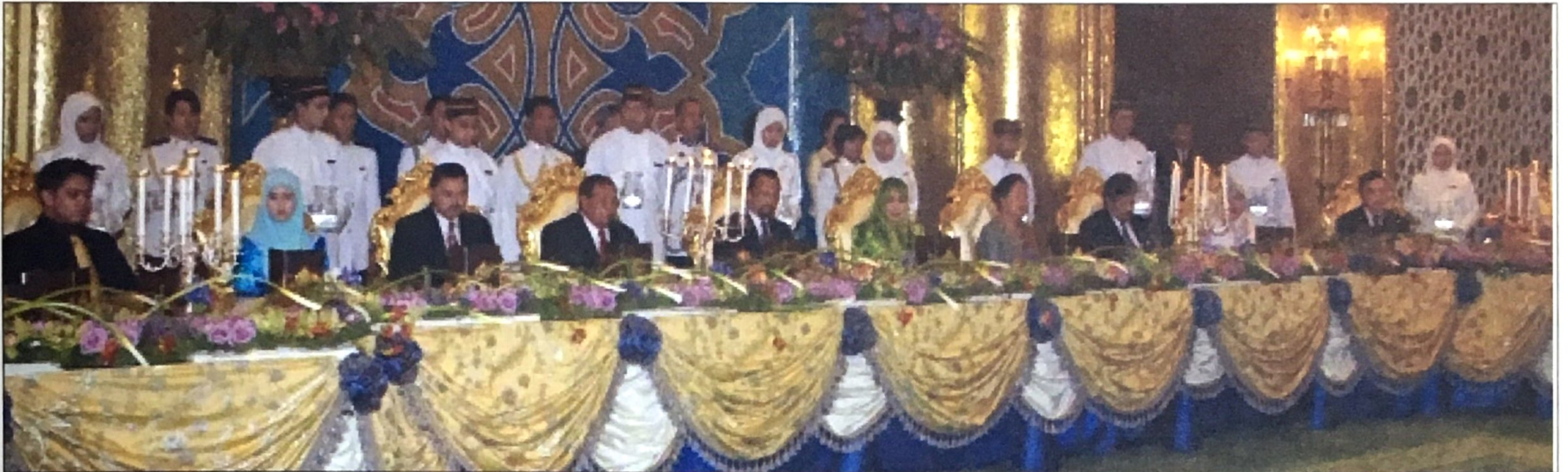
Their Majesties with the Prime Minister of Laos and consort in a dinner banquet in conjunction with the state-visit of the Prime Minister of Laos to Brunei