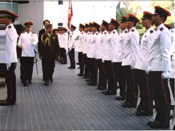
Guard-of-honour to welcome the Crown Prince