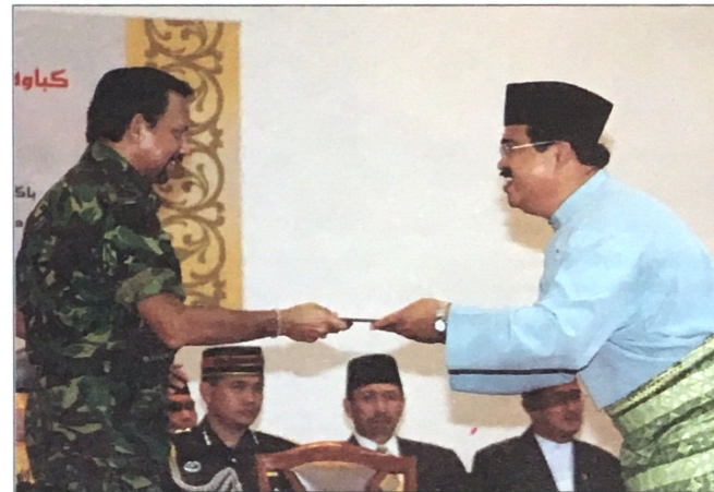
A recipient of a new home receives his key from His Majesty

The Crown Prince visited schools, residences of Penghulu of visited mukims, kain songket weaving enterprise, balai ibadat, mosque, mini museum, police station, boat building business and marine fire brigade station.