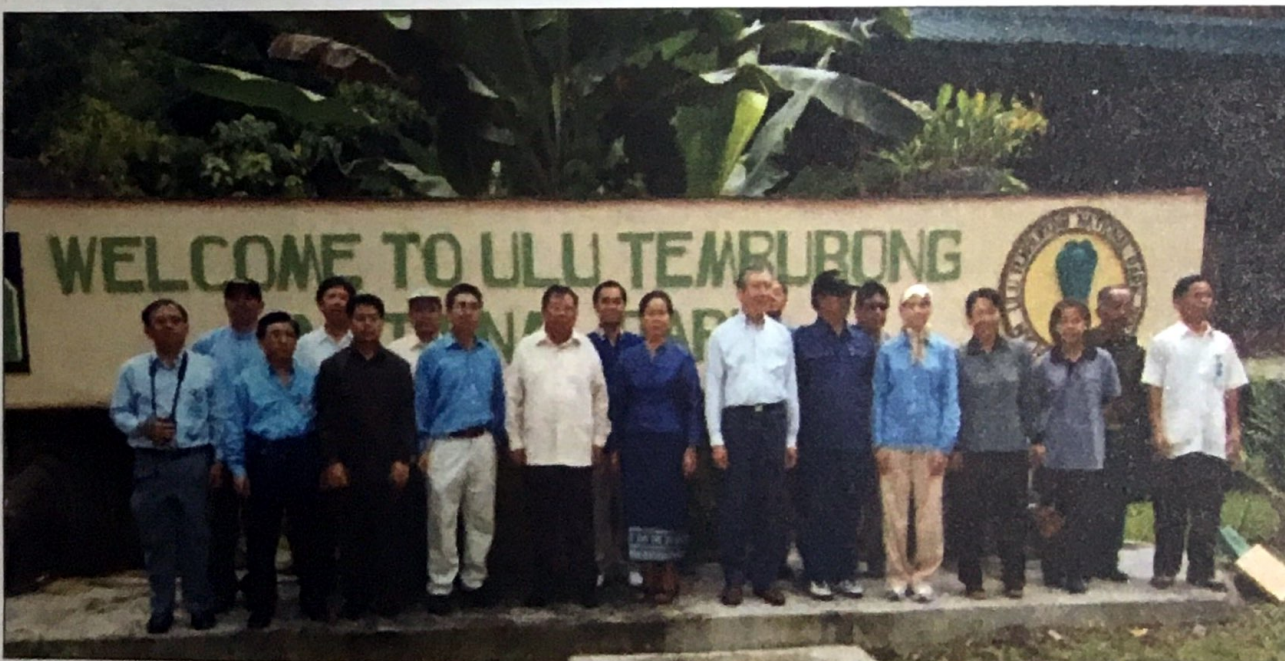
Group photo of His Excellency and consort at the Ulu Temburong National Park

R elations between Brunei Darussalam and the Laos People's Democratic Republic are purposeful and practical.