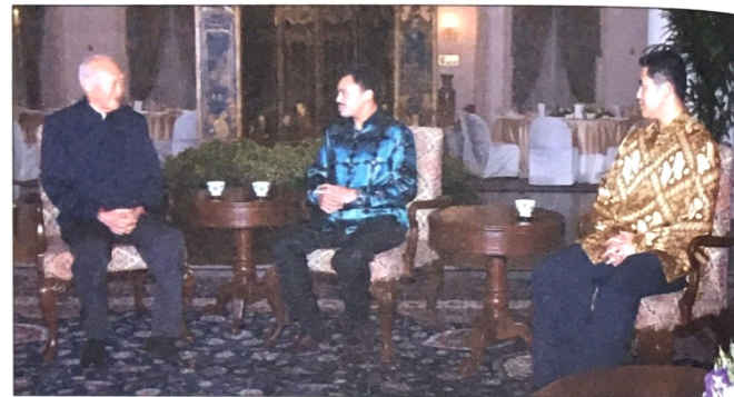
His Royal Highness receives audience from Minister Mentor, His Excellency Lee Kuan Yew