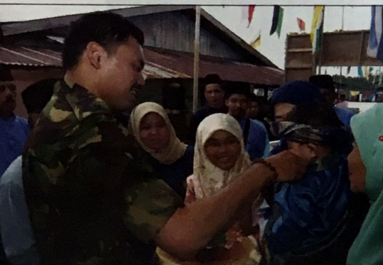
His Royal Highness mingles with residents of Kampong Ayer

H is Royal Highness Crown Prince Pengiran Muda Haji Al-Muhtadee Billah was on working visit to Mukim Amo in Temburong District and several mukims of Kampong Ayer of the Brunei-Muara district on March 5 and 30 respectively.