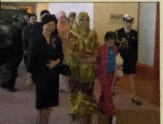
Her Majesty upon arrival in the Republic of Singapore