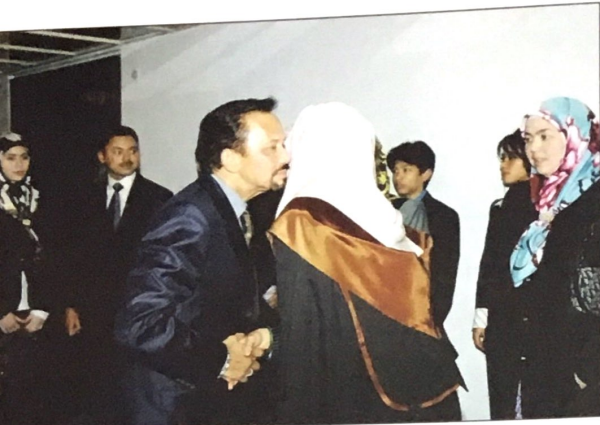
His Majesty gives his blessings to Her Royal Highness