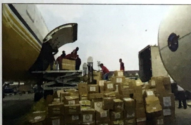
Tonnes of donations sent to Aceh