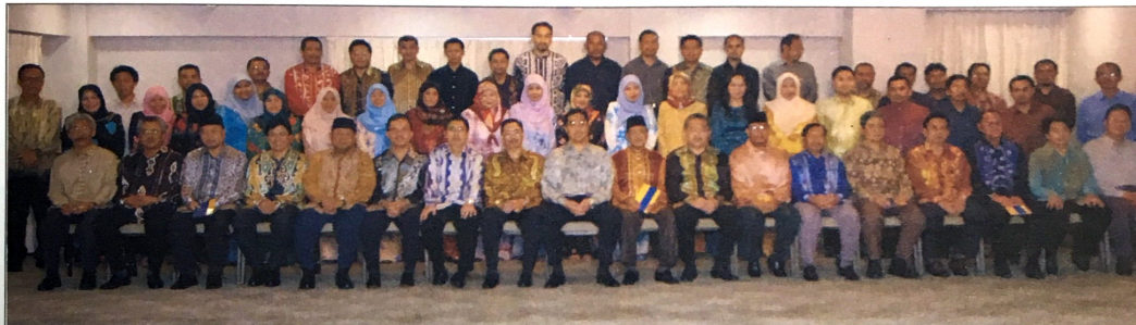
Public relations practitioners in a group photo with Acting Minister of Home Affairs, Permanent Secretaries, Deputy Permanent Secretaries and Director Generals from various ministries

It took place on January 24 at Orchid Garden Hotel in Berakas.