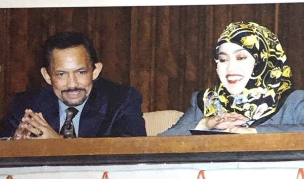
Their Majesties look upon as Her Royal Highness receives her certificate in Master of Arts in Environment Development