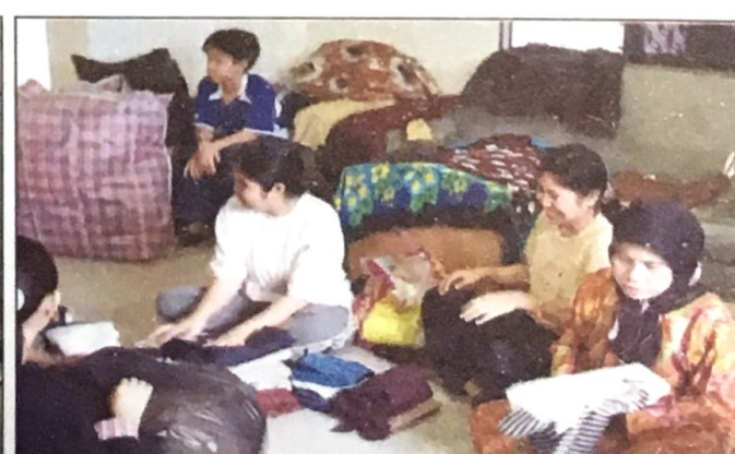
Students packing clothing items as part of donations contributed by Ministry of Education