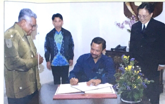
His Majesty signs a guestbook