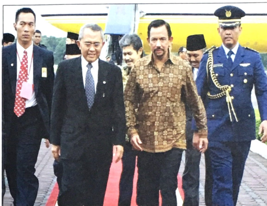
His Majesty upon arrival in Jakarta