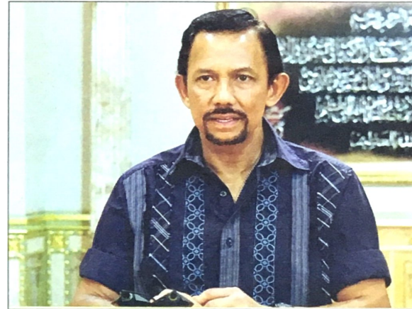
His Majesty Sultan Haji Hassanal Bolkiah Mu'izzaddin Waddaulah, The Sultan and Yang Di-Pertuan of Brunei Darussalam delivers a speech on the eve of New Year 2005

The sovereign also expressed his hope that with the upcoming New Year