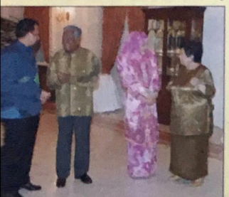
Their Majesties and His Excellency President S.R Nathan and Mrs Nathan at a banquet