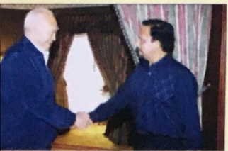
His Majesty and His Excellency Minister Mentor Lee Kuan Yew in a one-to-one meeting