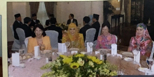
Her Majesty and Her Royal Highness at a luncheon hosted by the Prime Minister of Singapore