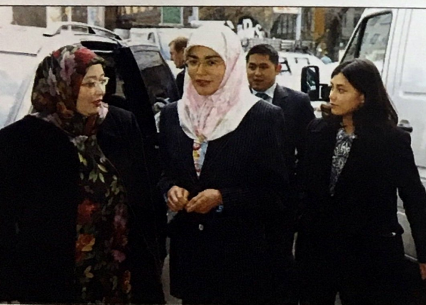
Her Royal Highness upon arrival at the Royal Festival Hall in London