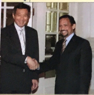
His Majesty and the Prime Minister of Singapore, His Excellency Lee Hsien Loong