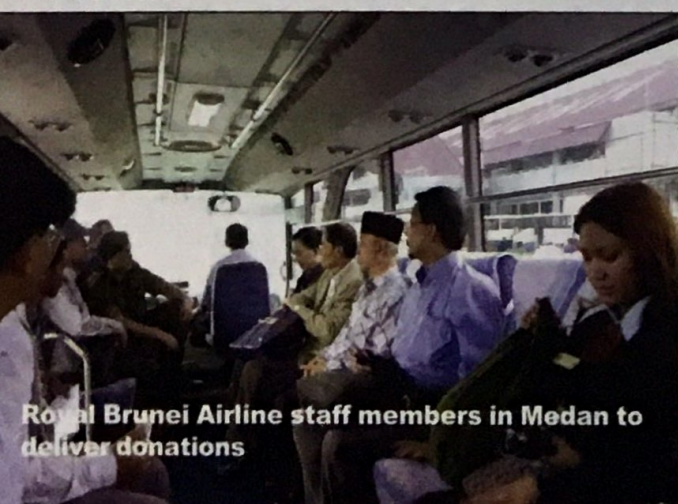
Royal Brunei Airline staff members in Medan to deliver donations