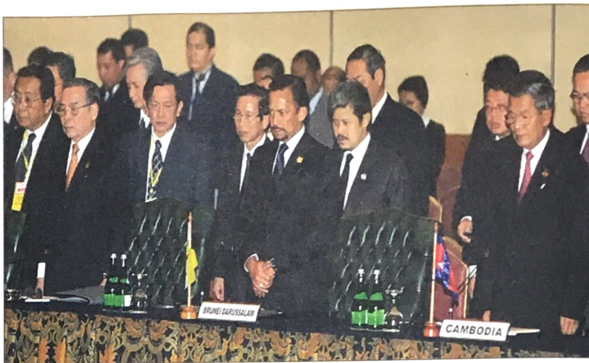
His Majesty at the special ASEAN Leaders meeting

The meeting ended with a declaration on action to strengthen emergency relief, rehabilitation, reconstruction and prevention of the aftermath of earthquake and tsunami disaster.