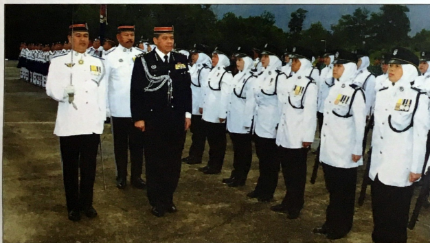
Commissioner of Royal Brunei Police Force at a parade inspection in conjunction with the 84 th anniversary of the agency

RBPF had chosen 'Stabilising Nation's Peace Together with the Community' ( Memantapkan Keamanan Negara Bersama Masyarakat ) as the theme for the 84 th year anniversary. The theme defines RBPF as a prominent law enforcement body in the country would continuously enhance and strengthen any relevant police's tasks and activities for the safety and peace of the nation with cooperation from members of the public.