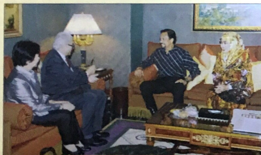
Their Majesties in an audience with the Deputy Prime Minister of Singapore and consort

Brunei-Singapore relations also established co operations in education, health, trade, defense, information and broadcasting, air services and technical co operations.