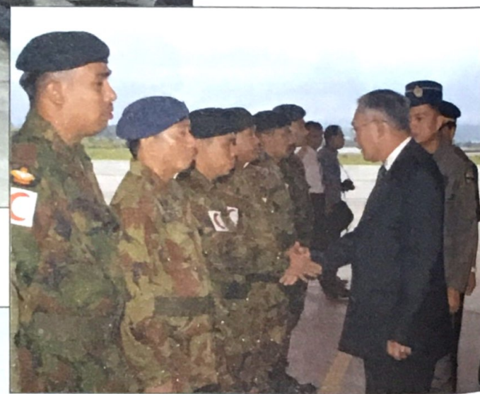
Deputy Minister of Defence bids the delegate of humanitarian aid farewell