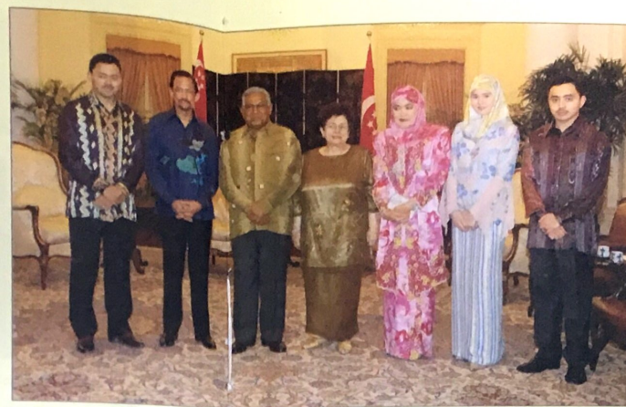
Their Majesties, His Excellency the President of Singapore with consort, Their Royal Highnesses in a group photo prior to dinner banquet