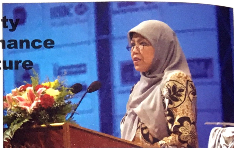
Her Royal Highness said Brunei is currently undertaking a consultative study to review and improve on the present state of human resource development policies and programs

"The challenge here was obviously the complexity of the skills and knowledge required of our people to absorb and master them," said Her Royal Highness.