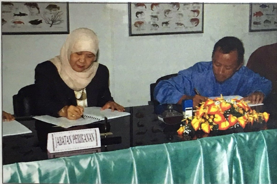
Fishing industry receives a boost with the newly purchased surveillance boat