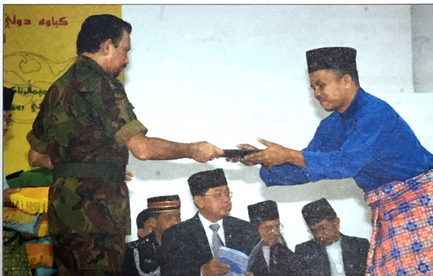
A recipient receives his key for his new house

From the total recipients; 54 received land grants based at the Kampong Lambak Kanan; 22 received land grants based at the Kampong Rimba; 129 received land grants based at Kampong Rimba; 61 received house keys under the Kampong Rimba National Housing – level two; 19 received house keys under the Kampong Rimba National Housing – level four; three received house keys to semi-detached houses under