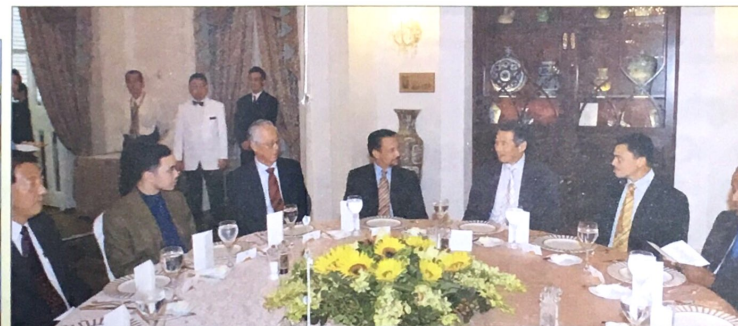
His Majesty and His Excellency at a luncheon hosted by Prime Minister of Singapore, His Excellency Lee Hsien Loong