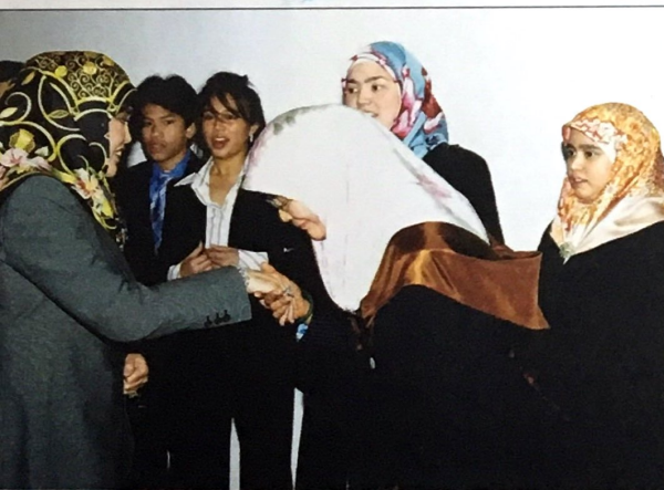
Her Royal Highness greets Her Majesty after the convocation ceremony