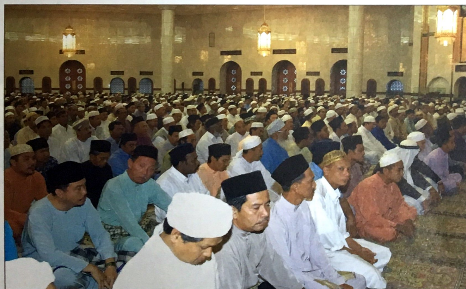
Muslims performing Aidil Adha prayers throughout the nation-state

That is the role of education and advise in the bid to build the ummah . When the education and advise are in the wrong, it would ruin the ummah , said His Majesty.