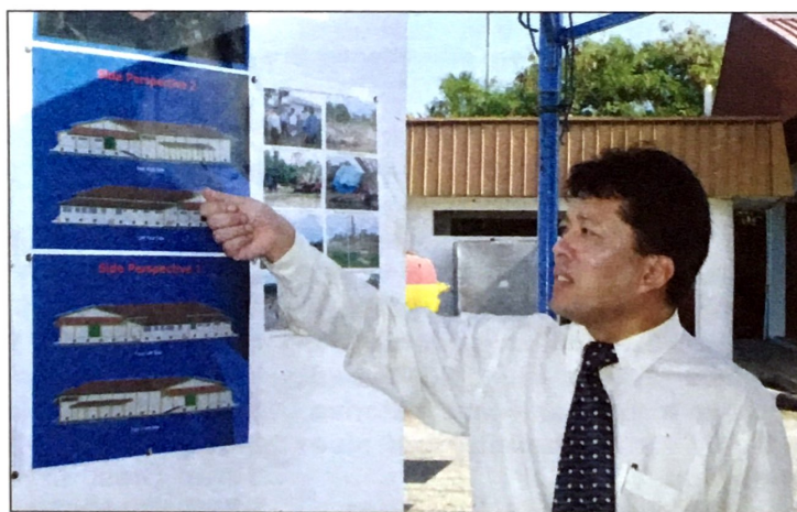
An officer briefs on the construction of storage centre