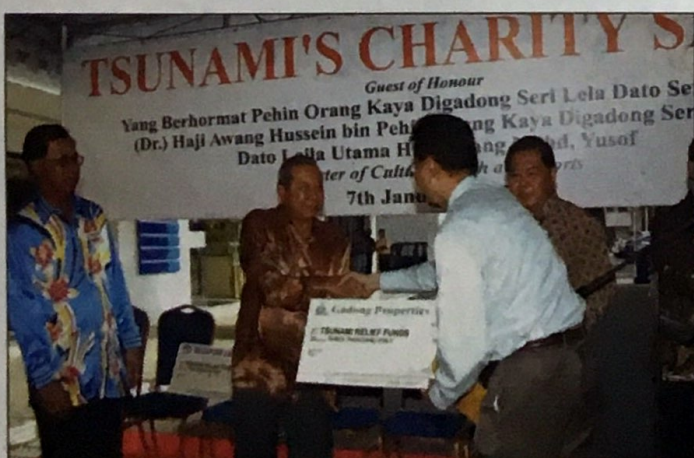
Minister of Culture, Youth & Sports receives donations from private sector

RBA would contribute $25 for every one way economy class ticket purchased online until February 5.