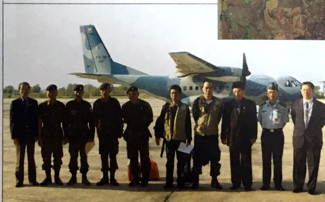
A group photo of the contingent before departing for Aceh