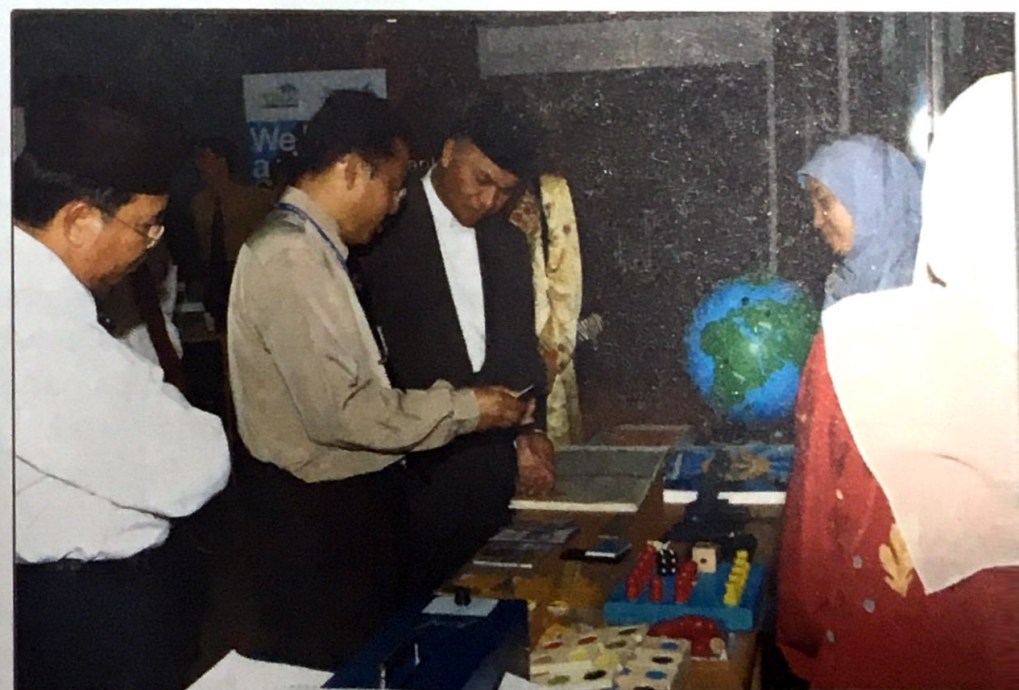
Officers tour the exhibition showcased in conjunction with the World Braille Day

Availability of hi-technology devices in the market to aid individuals with visual impairment can also help them develop their self-confidence and interact with the community locally or regionally, he adds.