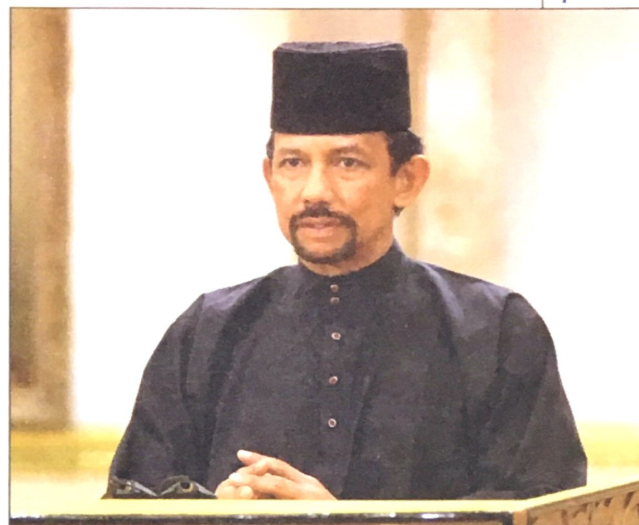
His Majesty delivers a royal address on the eve of Aidil Adha celebration