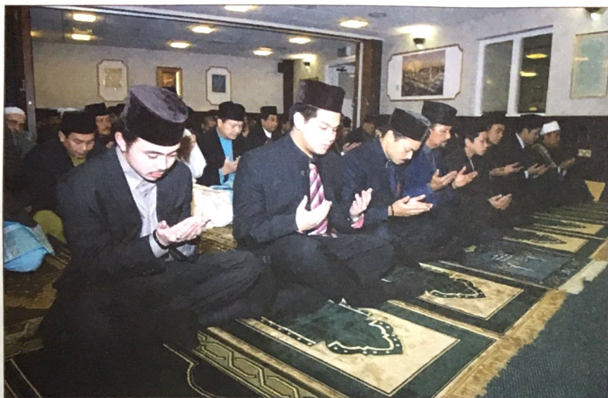
Royal entourage at Aidil Adha prayer in London