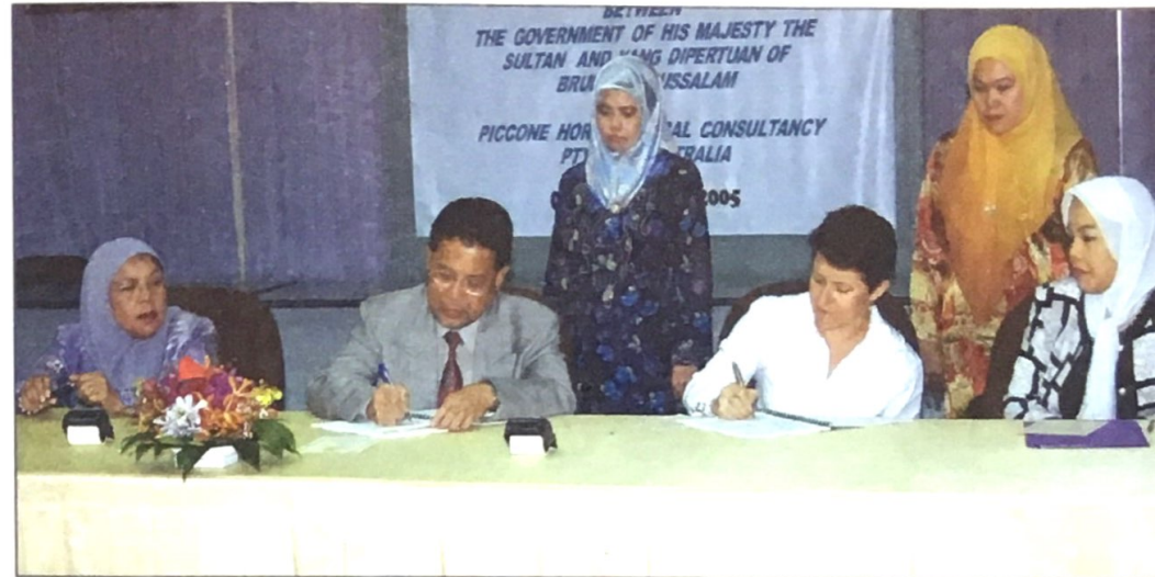
An agreement was reached between the Ministry of Industry and Primary Resources with Piccone Horticultural Consultancy Private Limited to cultivate and commercialise mushroom plantations in Brunei