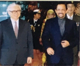
His Majesty upon arrival in the Republic of Singapore greeted by the Deputy Prime Minister of Singapore, His Excellency Dr. Tony Tan