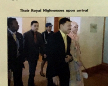
Their Royal Highnesses upon arrival