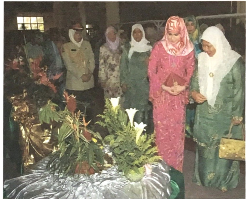
Her Royal Highness at the opening of the Cleanliness and Landscaping competition and exhibition of live flowers

Also present was Her Royal Highness Princess Hajah Majeedah Nuurul Bulqiah.