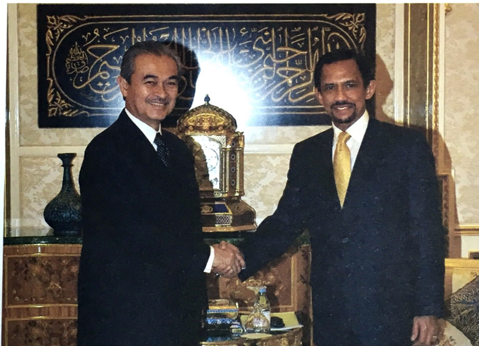
His Majesty The Sultan and Yang Di-Pertuan of Brunei Darussalam and the Right Honourable Dato Seri Abdullah Haji Ahmad Badawi, the Prime Minister of Malaysia at an audience at Istana Nurul Iman

The Right Honourable Dato Seri Abdullah was in Brunei Darussalam for a