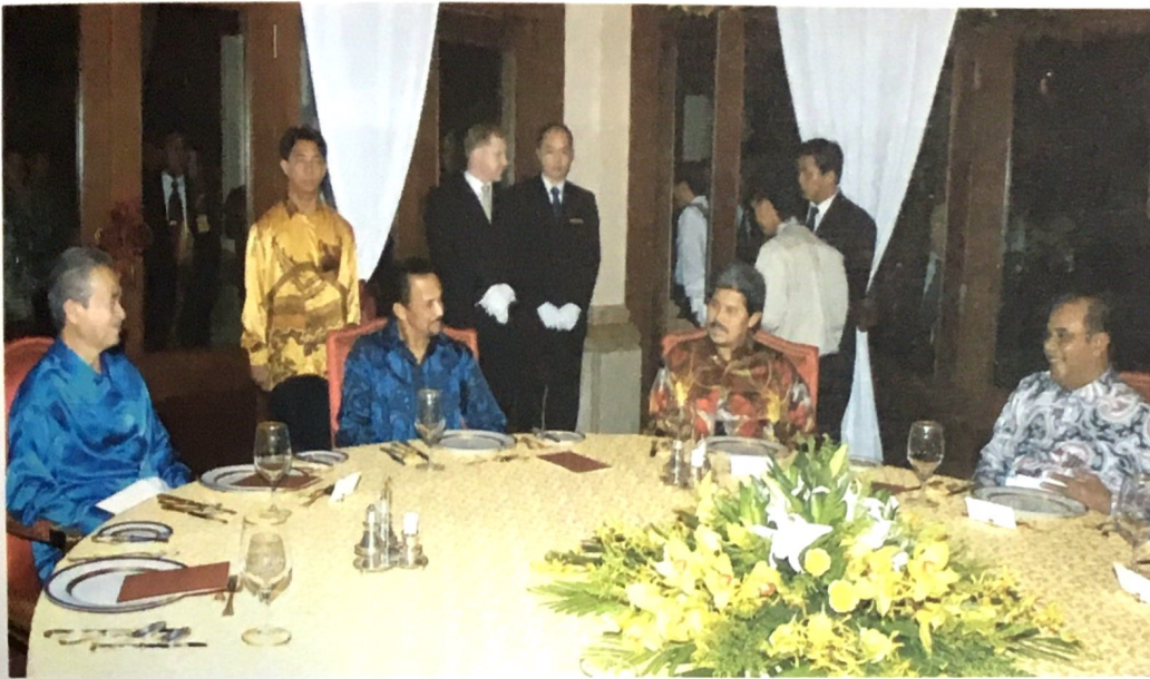
His Majesty and the Right Honourable at a dinner held at the Empire Hotel & Country Club