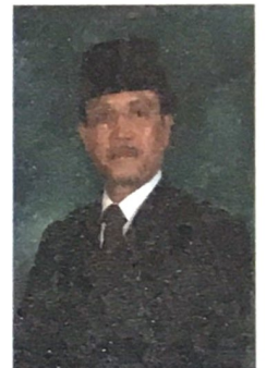
Minister of Communication outlines the importance of Service Hub 2024

He also touched on future plans by the Ministry whereby provision of services would be transferred to the private sector that are more business focused. While the Ministry would be focusing on providing a conducive legal and regulatory environment that are flexible, responsive and able to promote innovation and creativity.