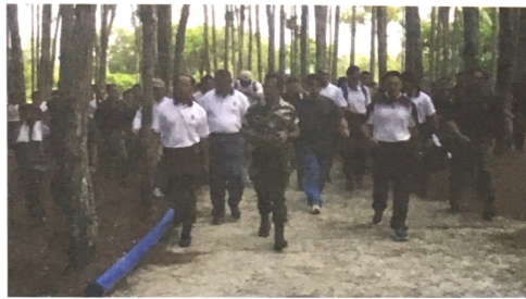
His Majesty leading the walk at Bukit Shahbandar