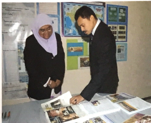
His Royal Highness on a work visit to various departments under the Prime Minister's Office. Among visited were Management Services Department, Audit Department, Petroleum Unit and Economic Development and Planning Department, Internal Security Department, Anti-Corruption Bureau and Narcotics Control Bureau, Information Department, Government Printing Department and Department of Radio Televisyen Brunei.