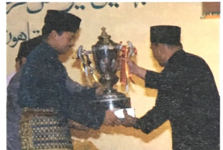
His Royal Highness presenting the trophy to the winner

His Royal Highness also consented to grace the finale of the