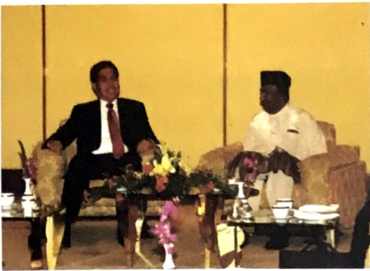
Minister of Home Affairs, Pehin Dato Paduka Haji Awang Adanan, receives Malaysia's Minister of Information, The Honourable Dato' Sri Abdul Kadir Haji Sheikh Fadzir