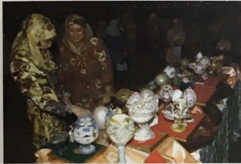
Her Majesty The Raja Isteri taking a closer look at the Domestic Science Exhibition 2005