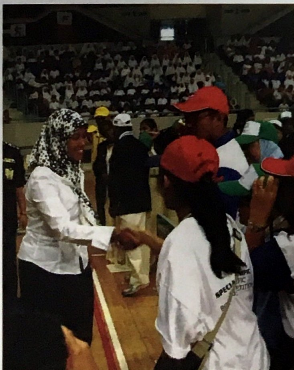
Her Royal Highness meets participants of the Special Olympics Asia Pacific Bocce Competition

The Special Olympics Bocce Competition that was held from August 12 to 14 at the Hassanal Bolkiah National Stadium was participated by five nations including Brunei Darussalam, Malaysia, the Philippines, Thailand and Bangladesh.