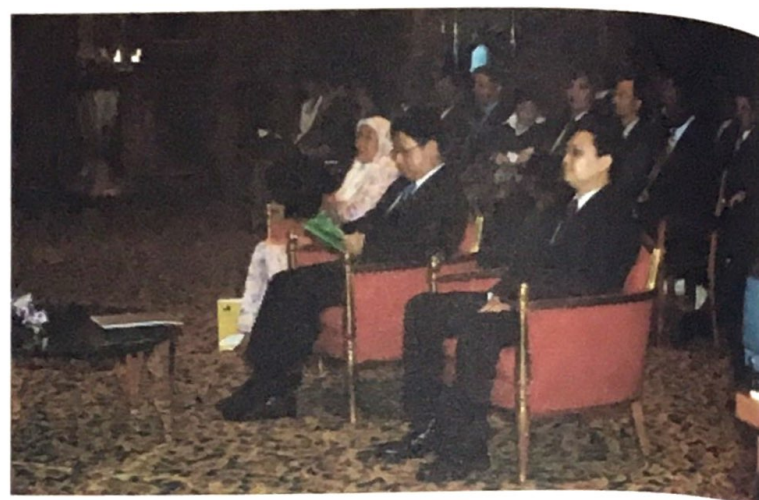
Pehin Dato Paduka Awang Haji Yahya at the launching of onshore blocks

Greater prospects such as work employment and the generating of the economy are envisaged with the launching of the onshore blocks 'L' and 'M' for oil exploration and production.