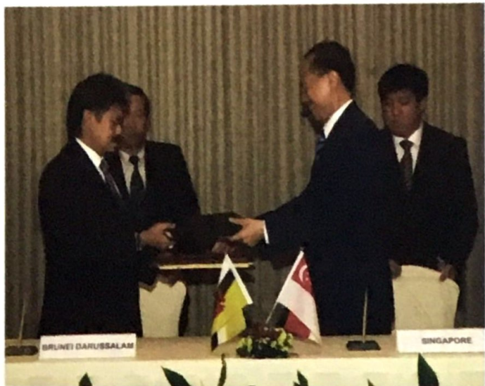
Avoidance of Double Taxation was agreed between Brunei Darussalam and Singapore

His Royal Highness Prince Mohamed Bolkiah, Minister of Foreign Affairs and Trade and Her Royal Highness Pengiran Anak Isteri Pengiran Anak Hajah Zariah were on a three-day visit to Republic of Singapore on August 17.