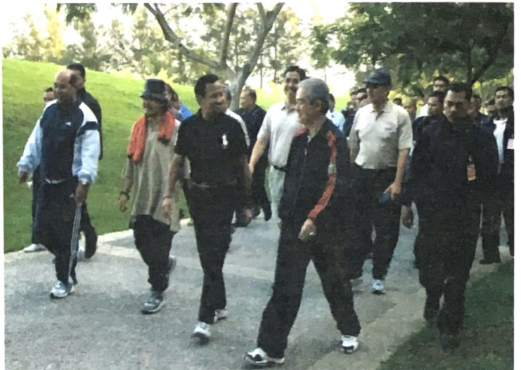
Brisk walk along the Empire Hotel & Country Club

On August 30, the Right Honourable went on a brisk walk with His Majesty and followed with a breakfast. He also held a press conference at the International Convention Centre in Berakas and met Brunei-based Malaysian community.